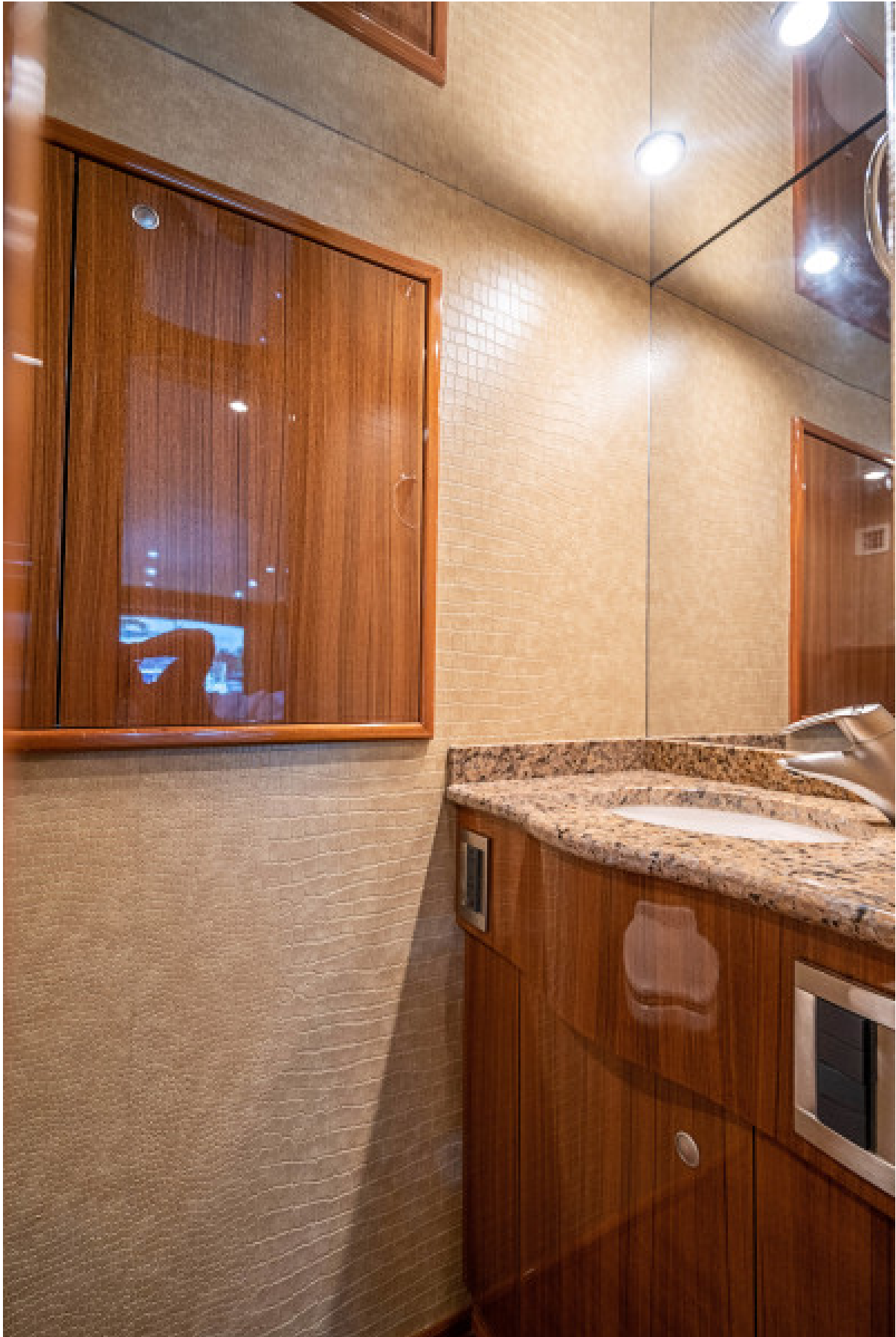
74 Viking Day Head