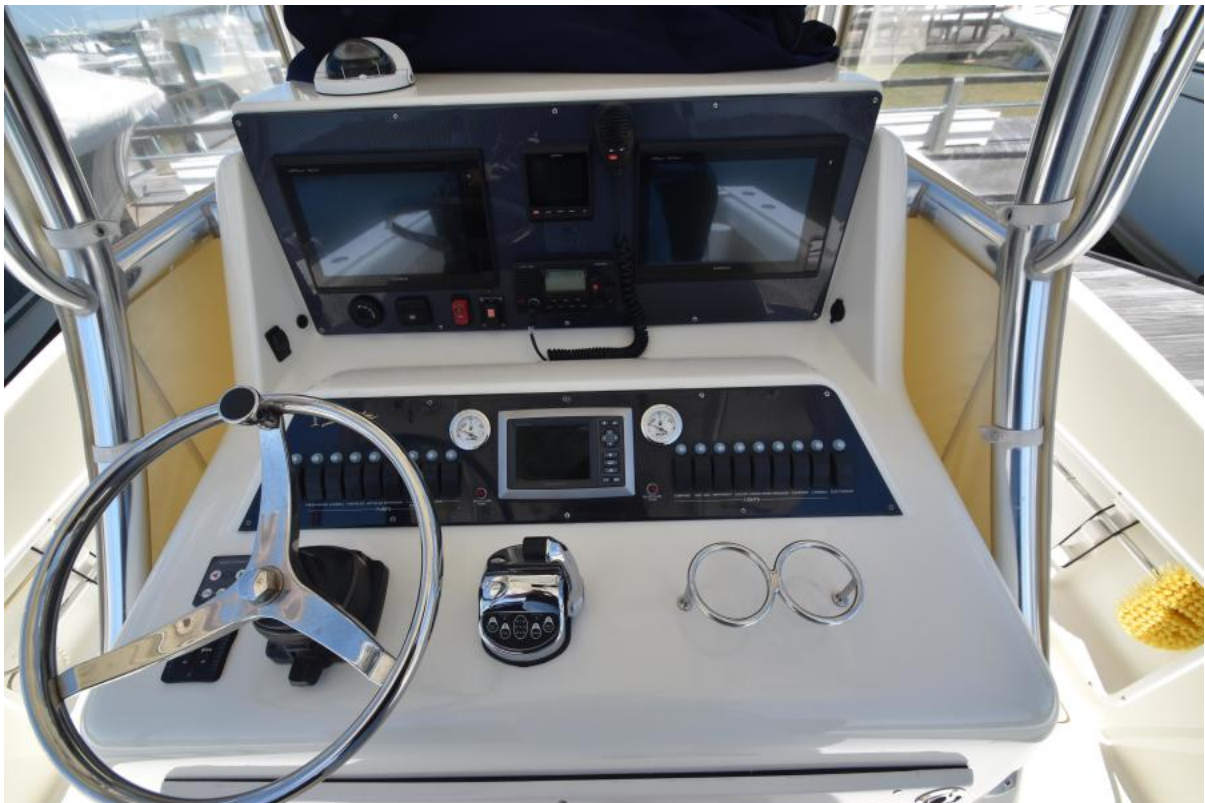
2016 Strike (5)