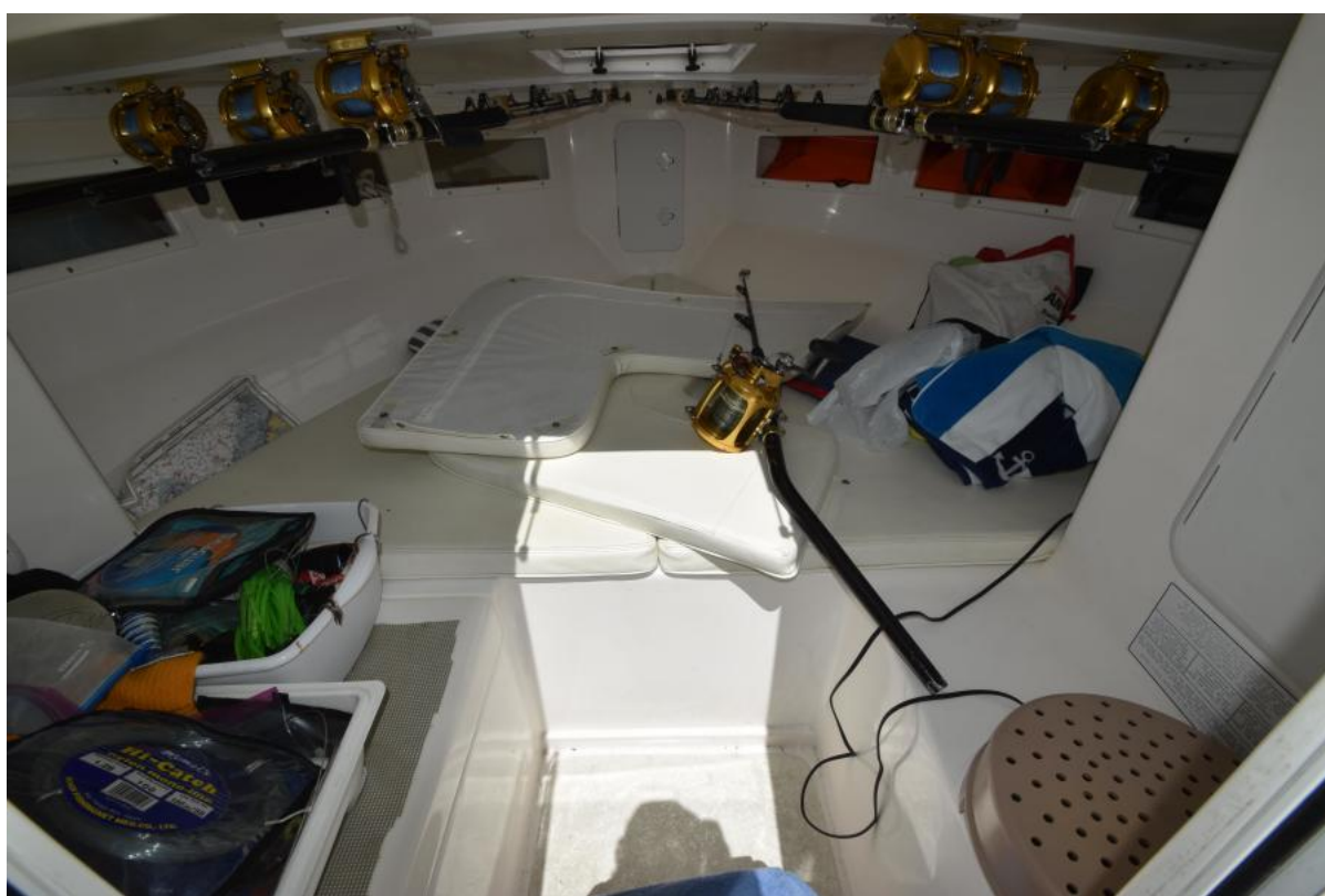
2016 Strike (15)