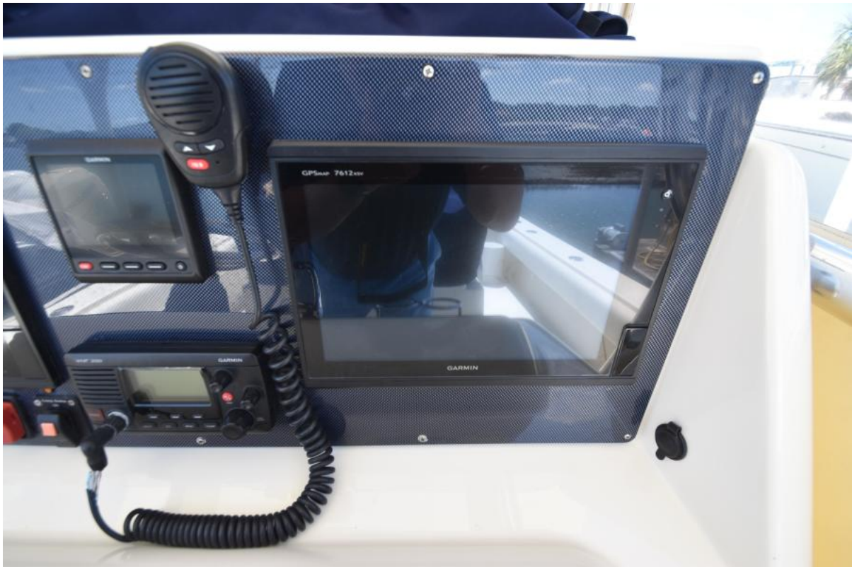
2016 Strike (8)