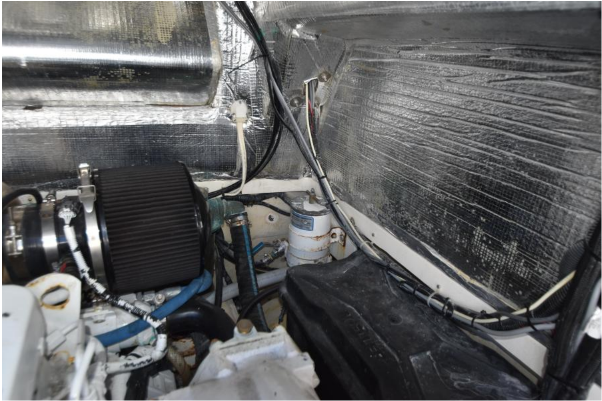
2016 Strike (18)