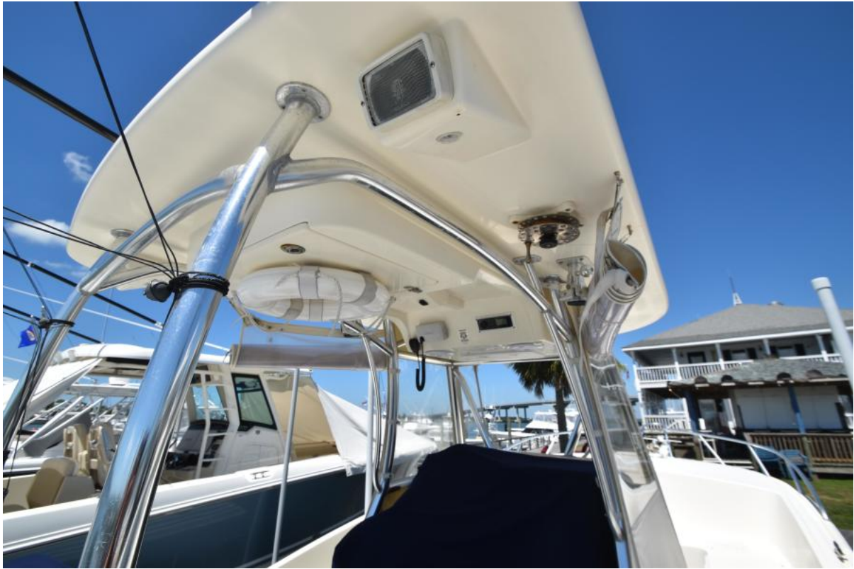
2016 Strike (30)