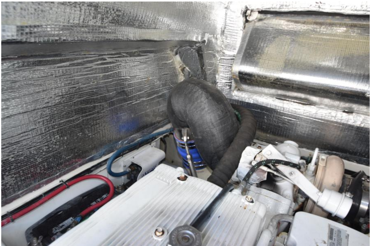
2016 Strike (19)