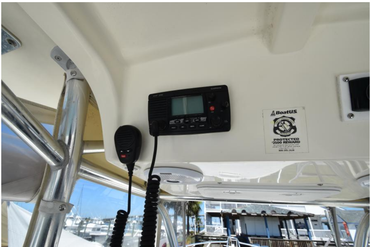
2016 Strike (7)