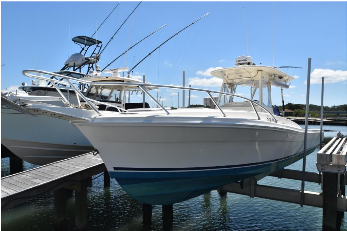
2016 Strike (1)