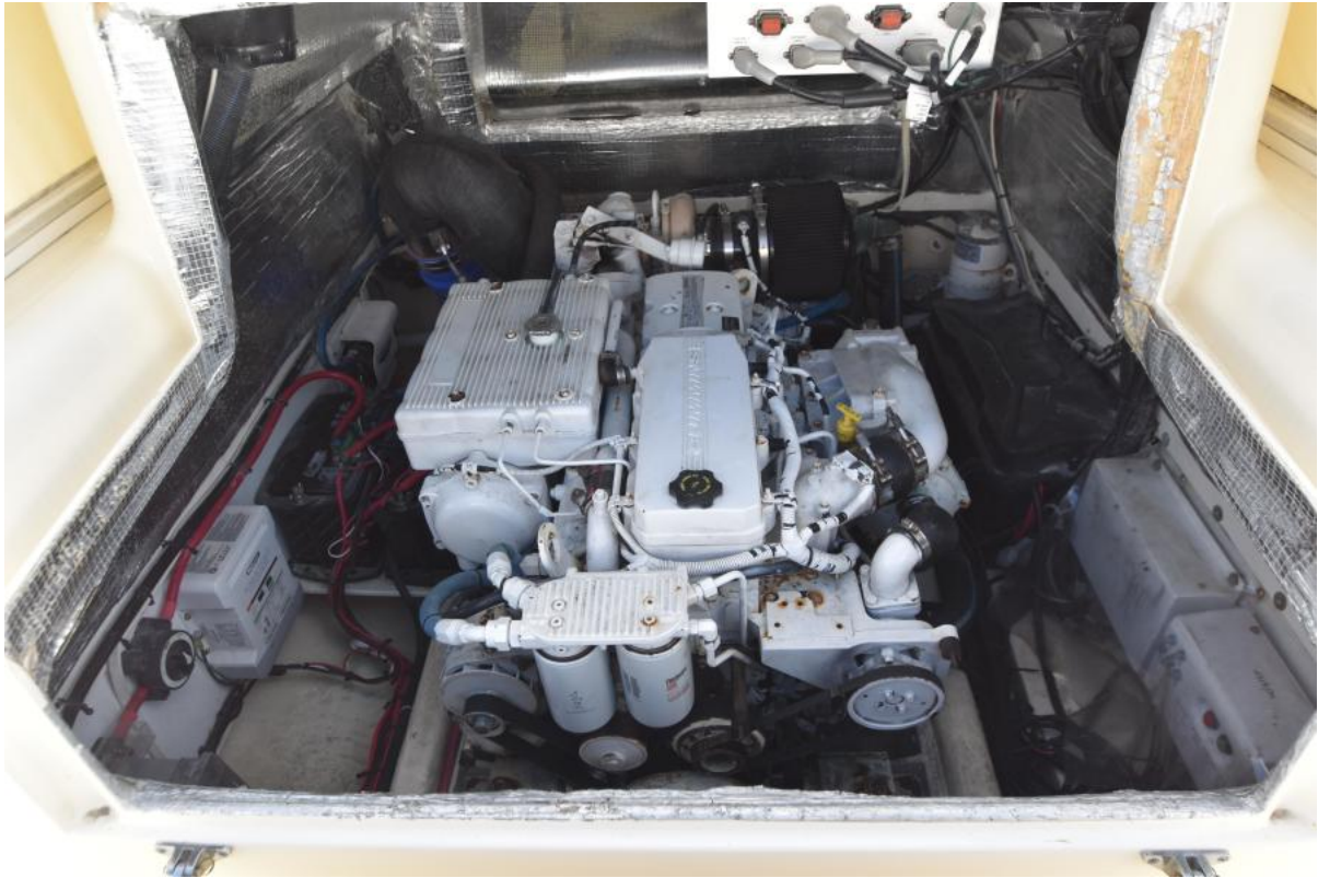
2016 Strike (16)