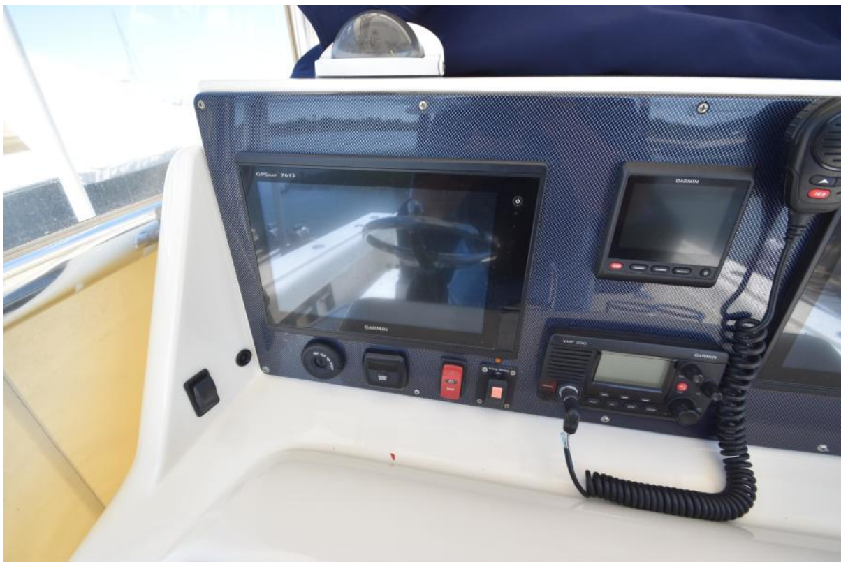
2016 Strike (9)