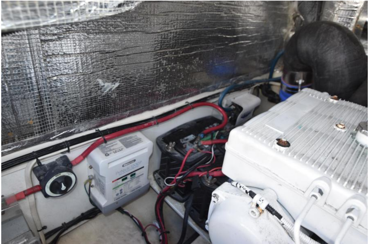
2016 Strike (20)