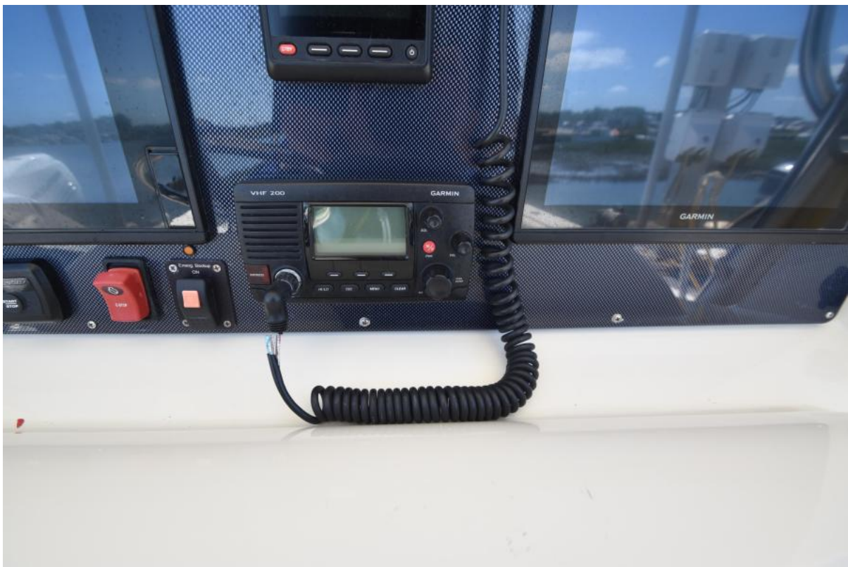
2016 Strike (11)