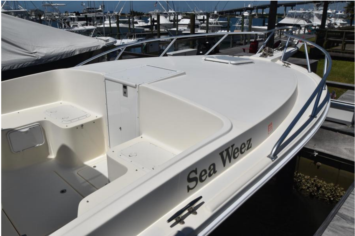
2016 Strike (2)