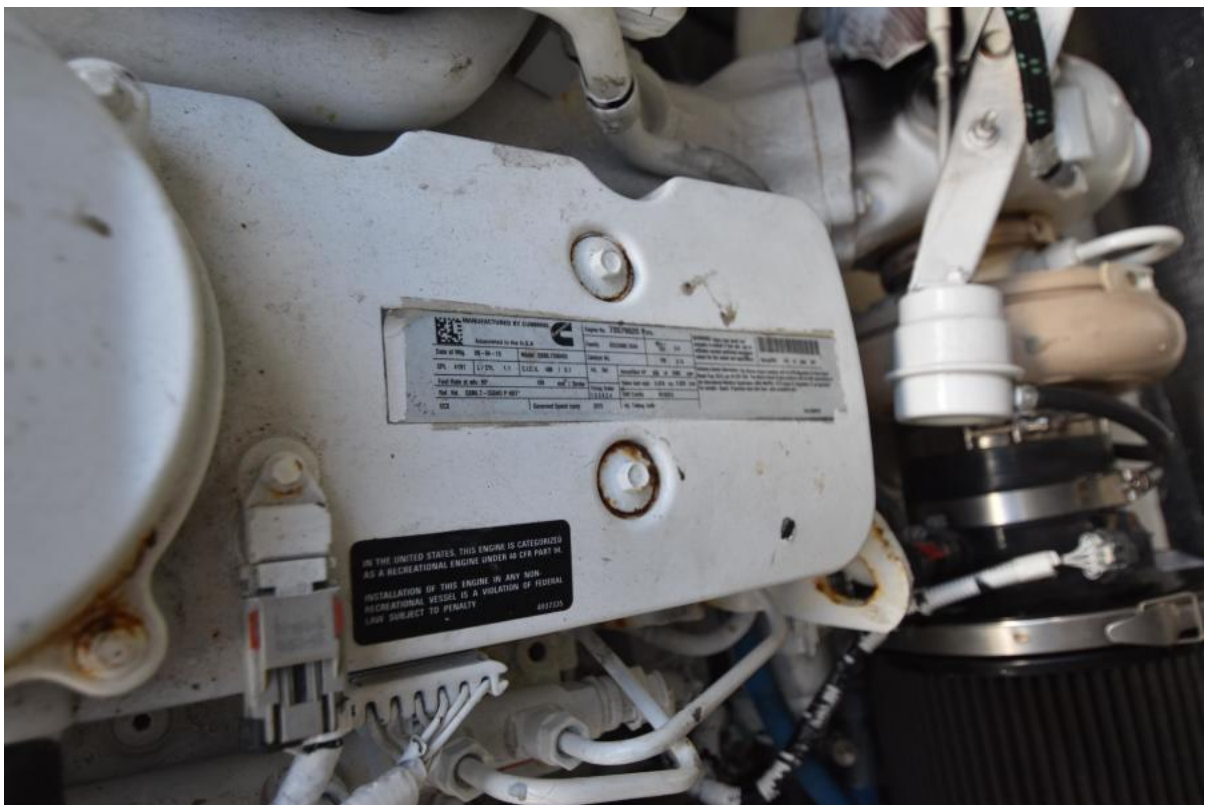
2016 Strike (21)