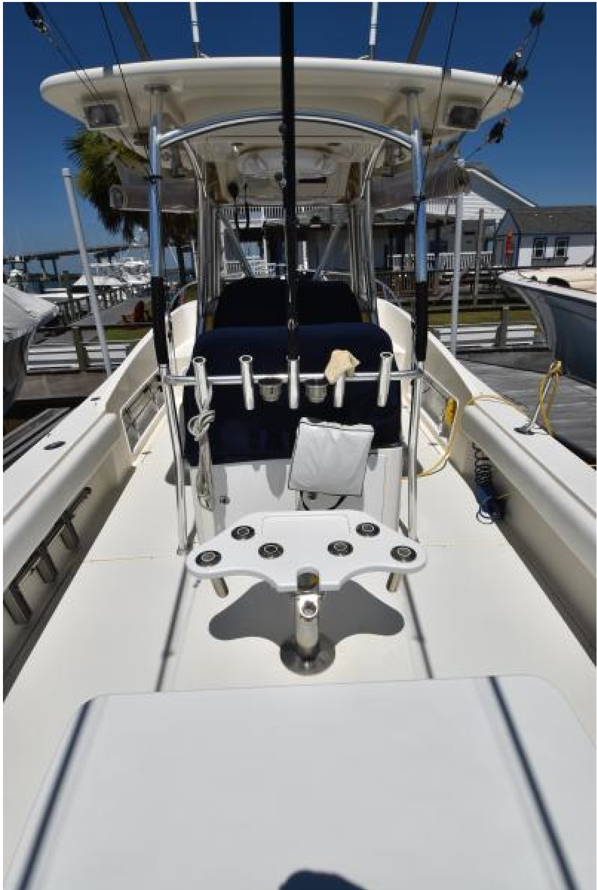
2016 Strike (27)