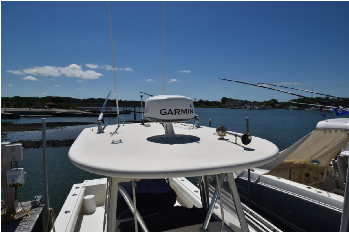
2016 Strike (25)