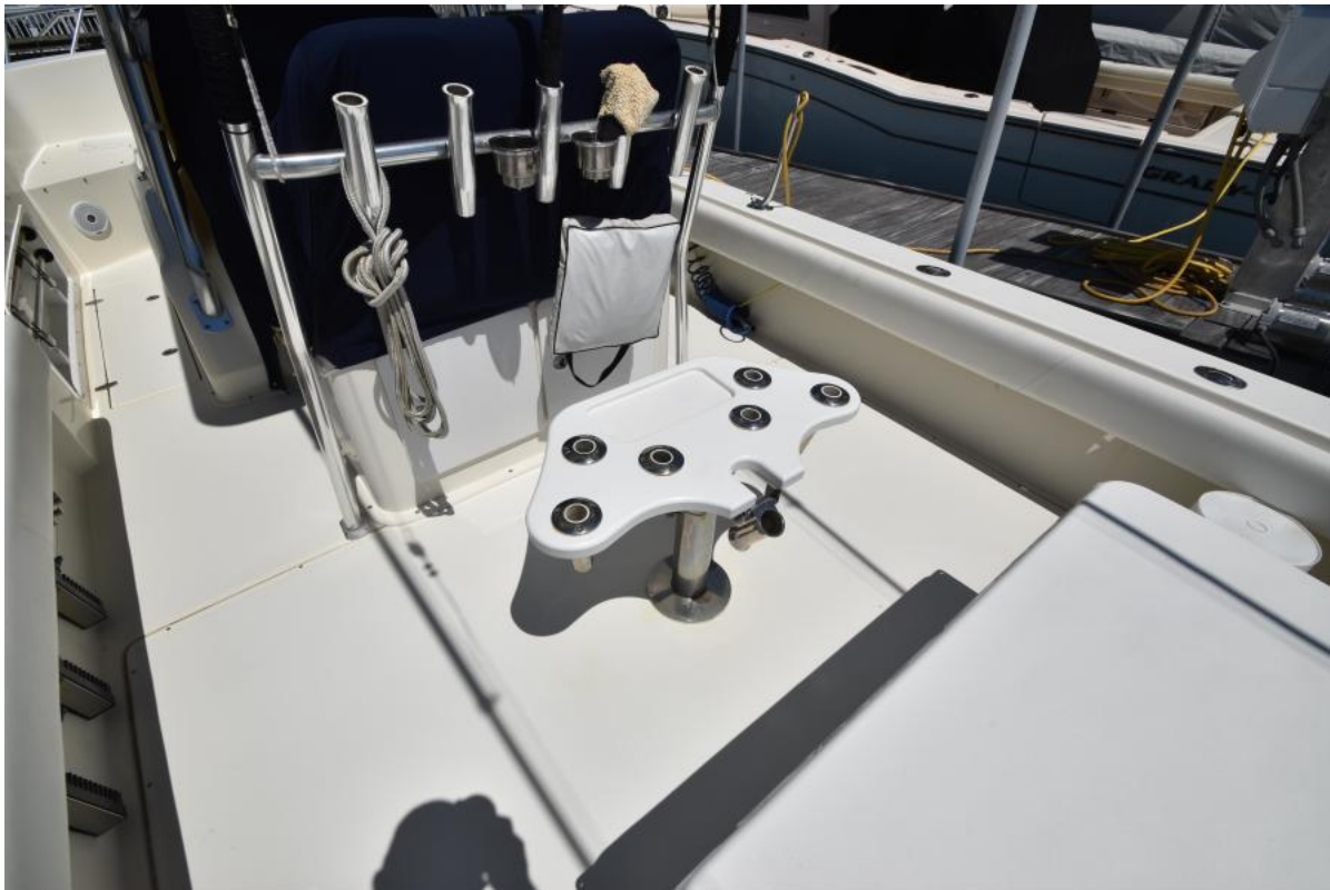
2016 Strike (28)