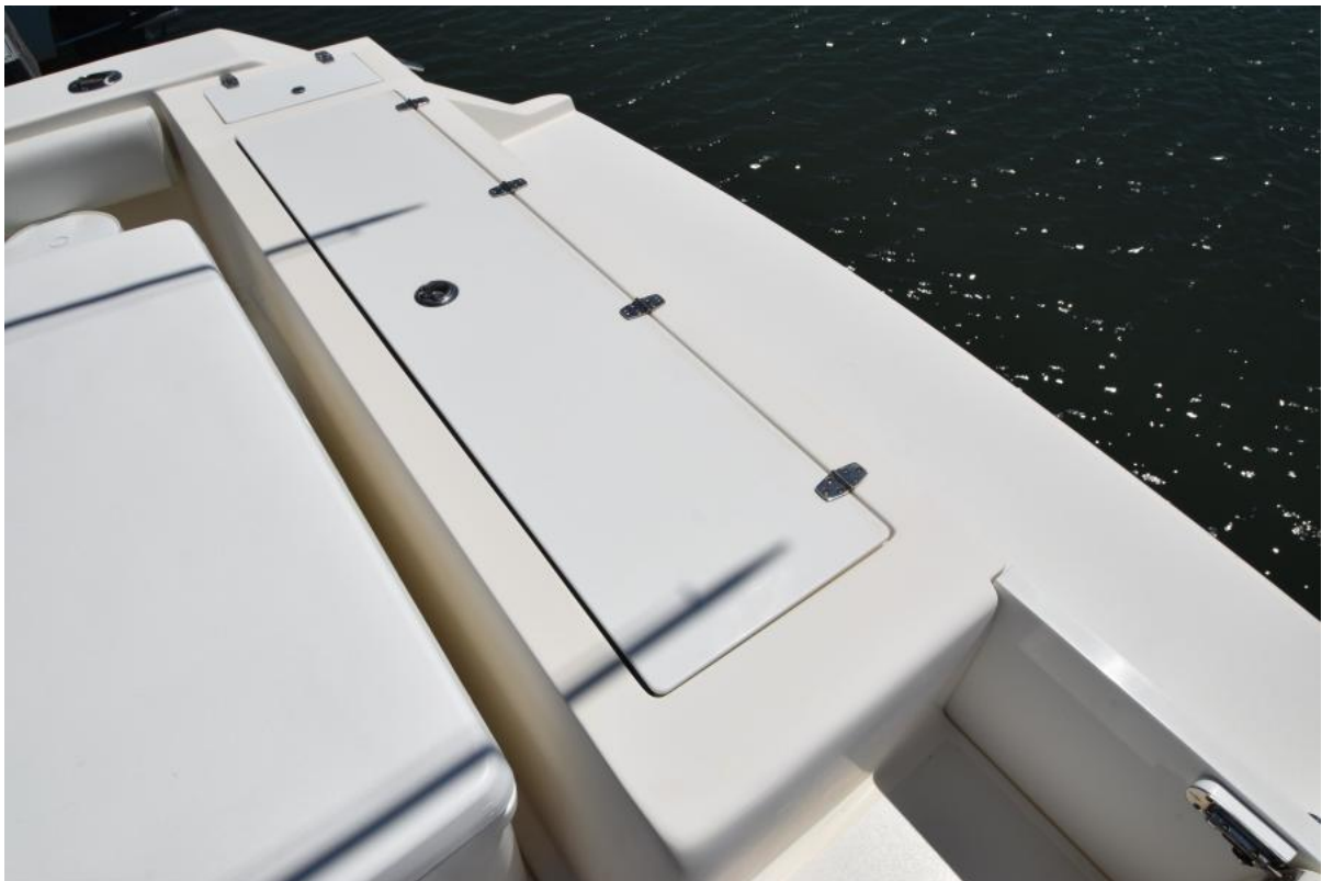
2016 Strike (26)