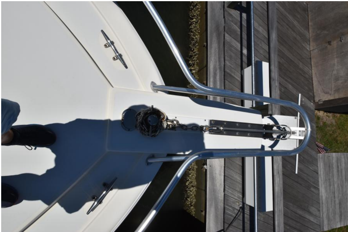
2016 Strike (23)