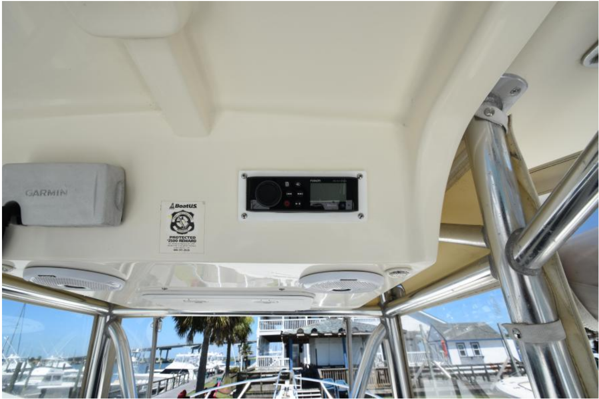
2016 Strike (6)