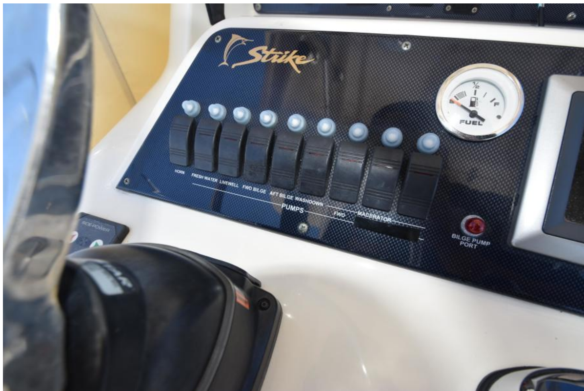
2016 Strike (14)