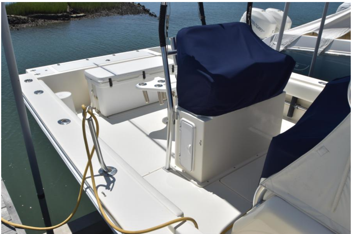
2016 Strike (3)