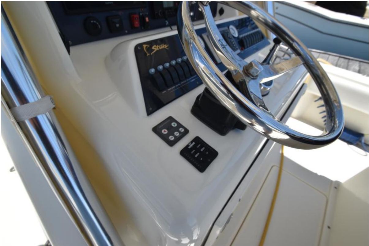
2016 Strike (12)