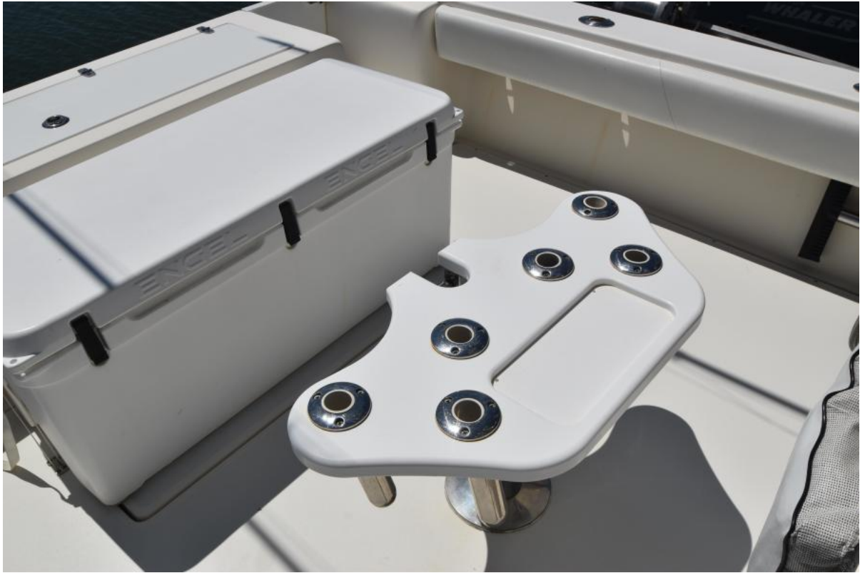
2016 Strike (4)