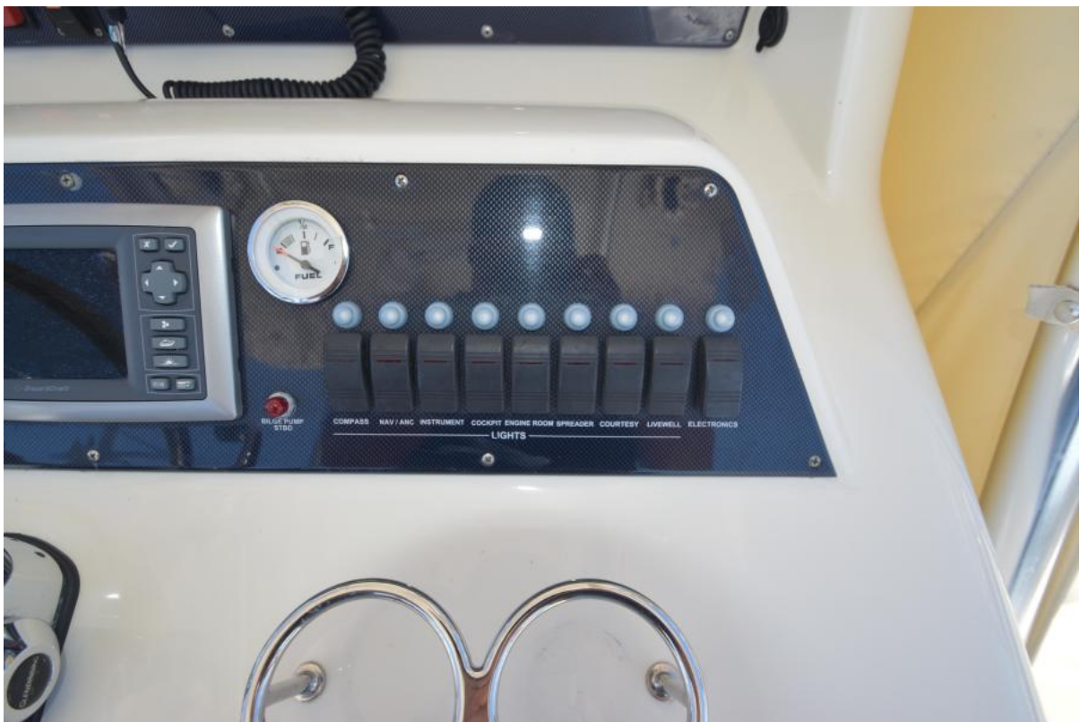
2016 Strike (13)