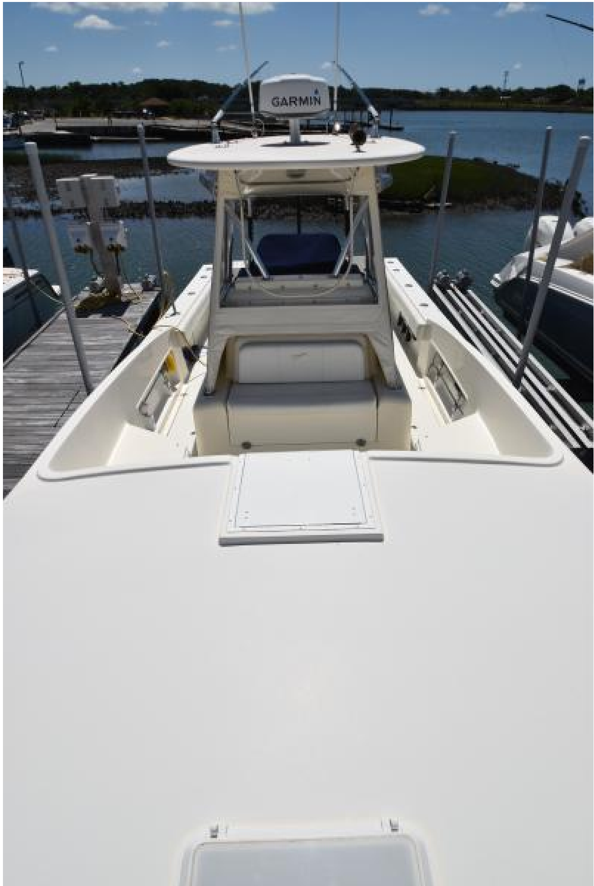
2016 Strike (24)