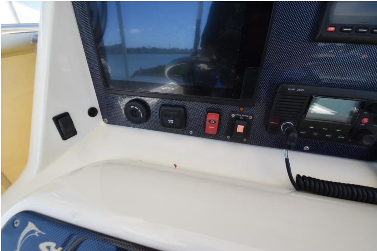
2016 Strike (10)