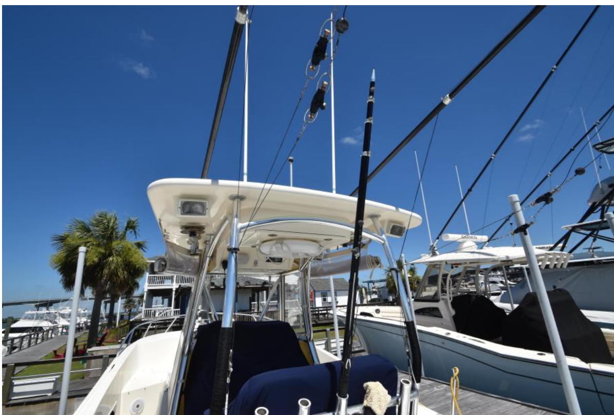
2016 Strike (29)