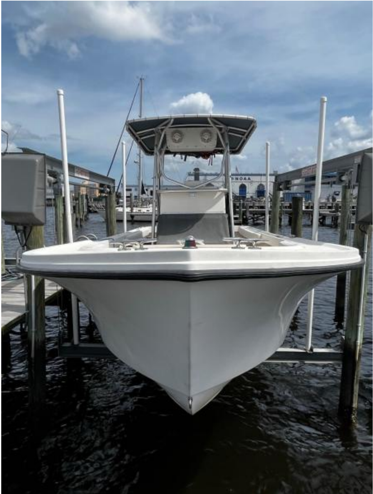
2003 Parker (2)