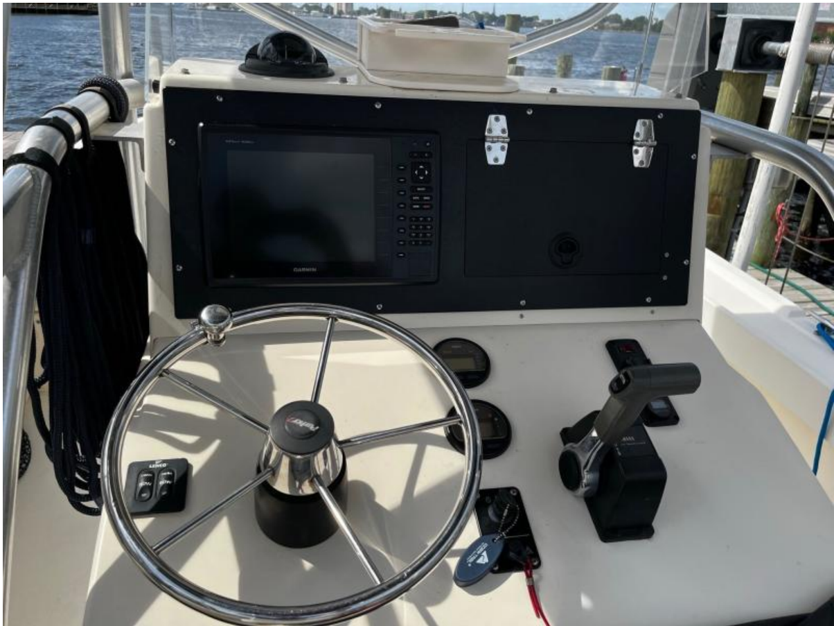
2003 Parker (7)