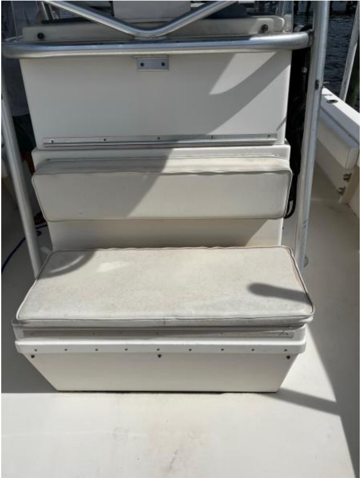
2003 Parker (9)