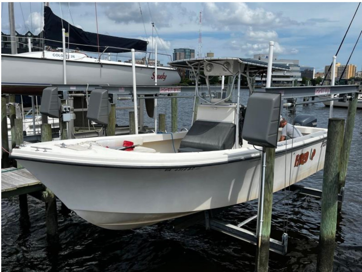
2003 Parker (1)