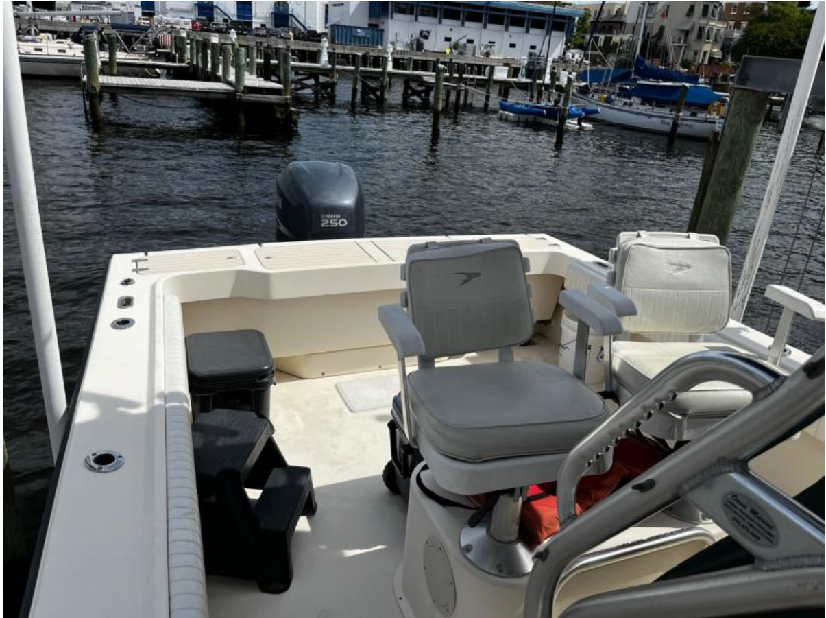
2003 Parker (10)