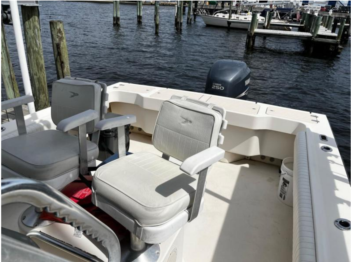
2003 Parker (5)