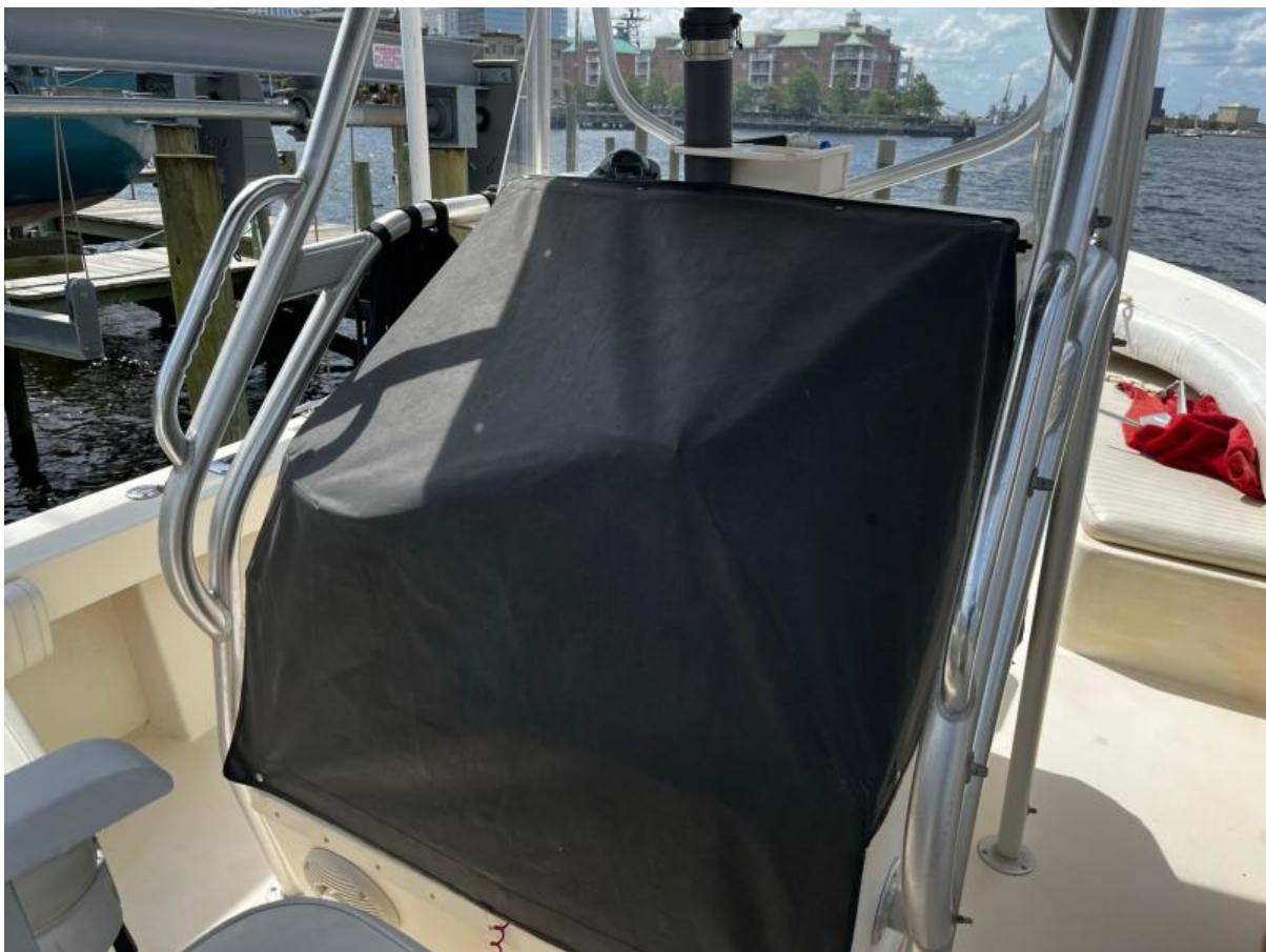
2003 Parker (8)