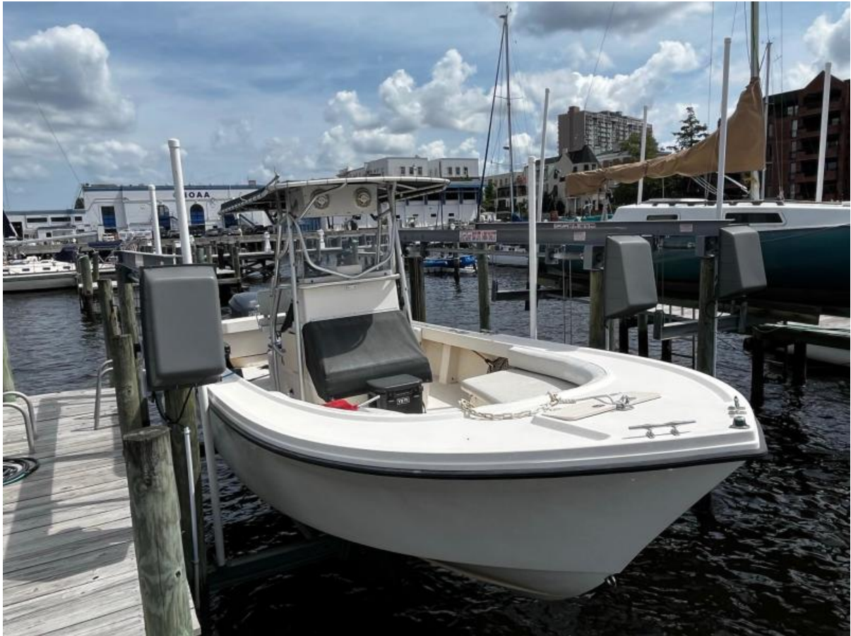
2003 Parker (3)