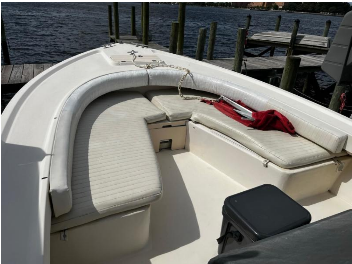
2003 Parker (4)