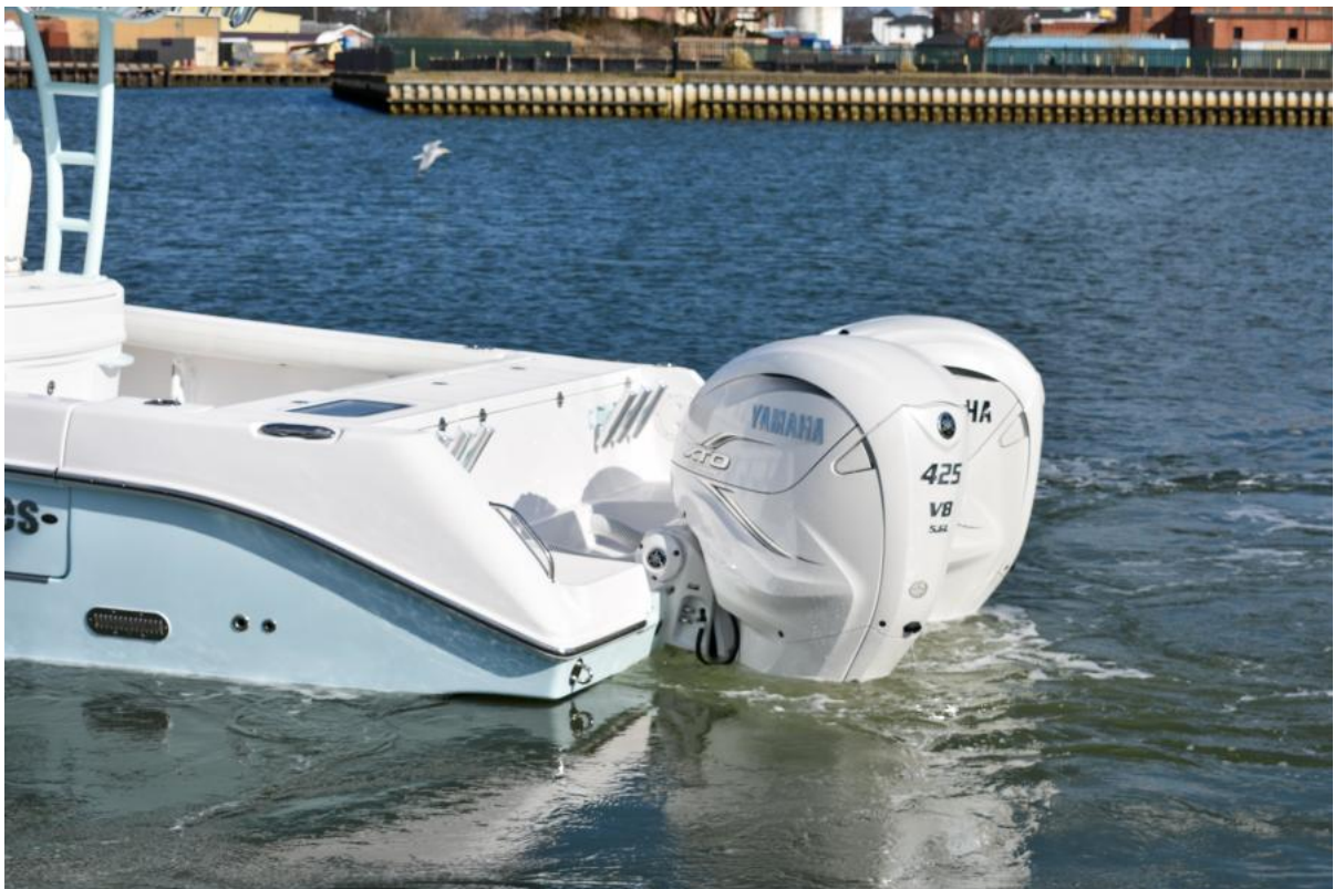
2023 Everglades 335CC 26