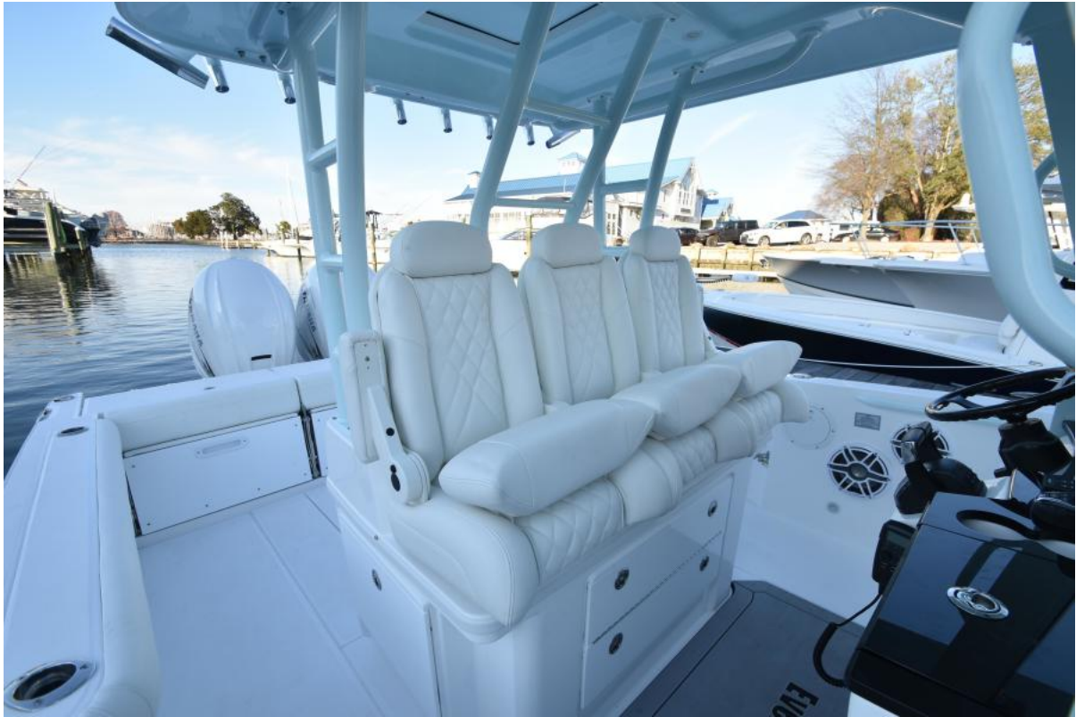
2023 Everglades 335CC 09