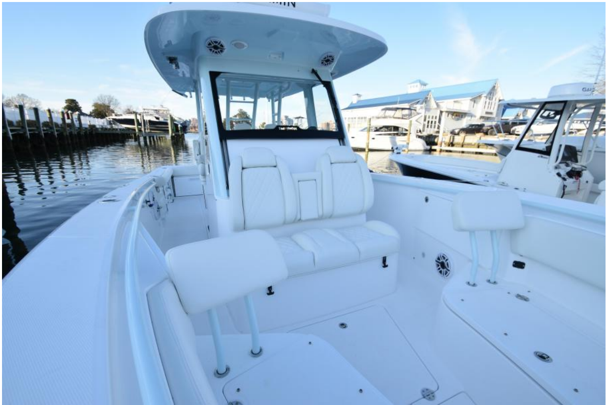
2023 Everglades 335CC 05