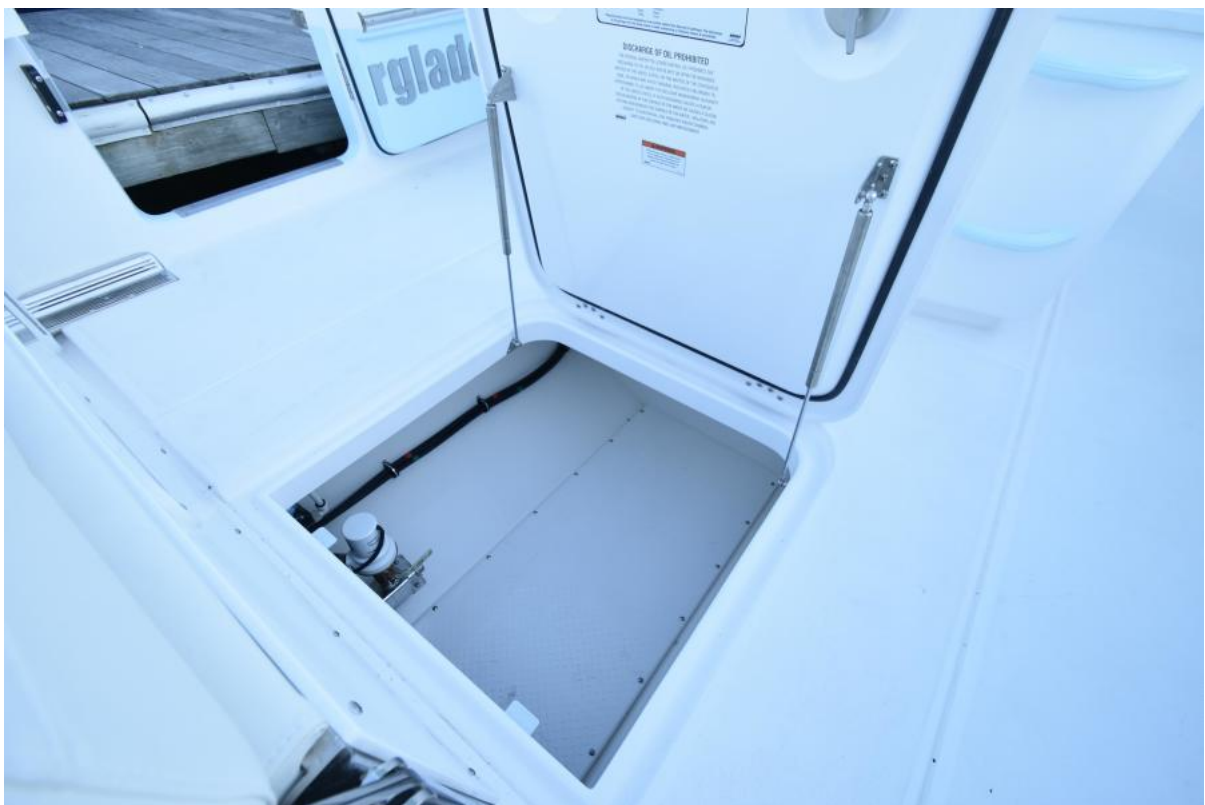
2023 Everglades 335CC 16