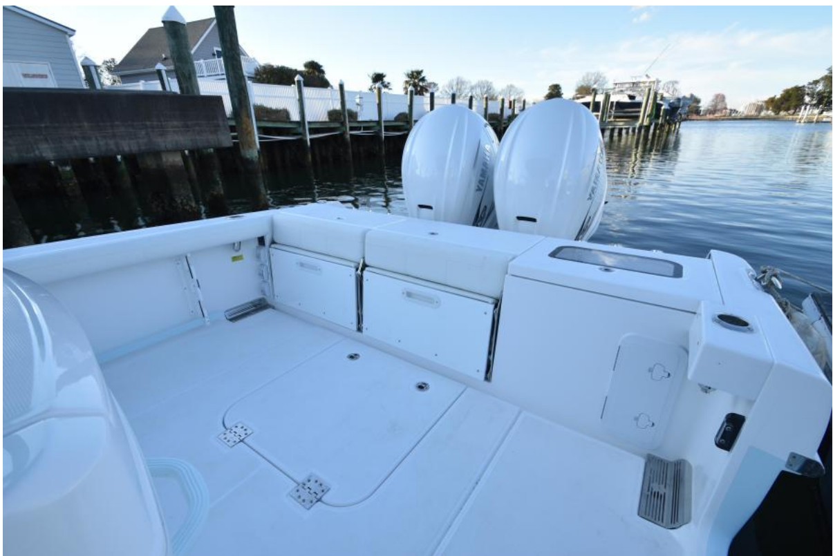
2023 Everglades 335CC 20