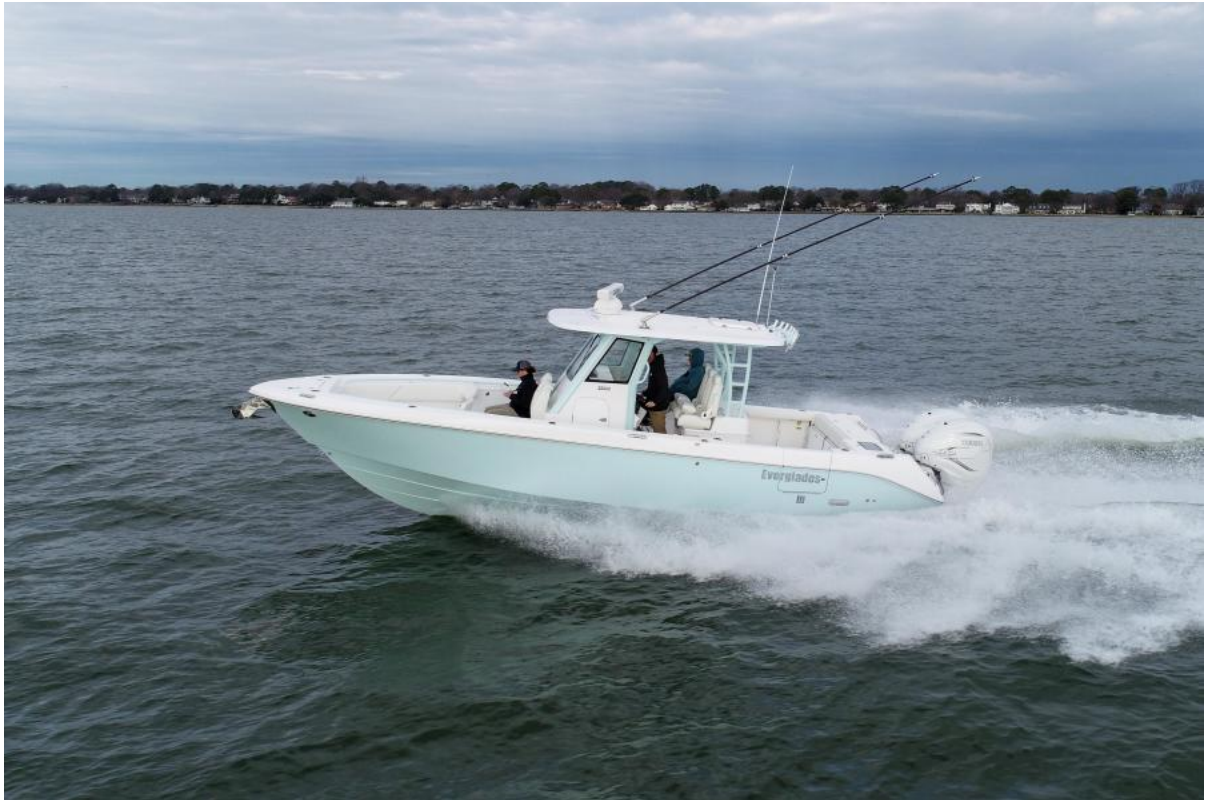
2023 Everglades 335CC 32