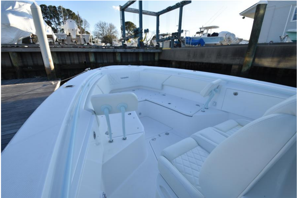
2023 Everglades 335CC 07