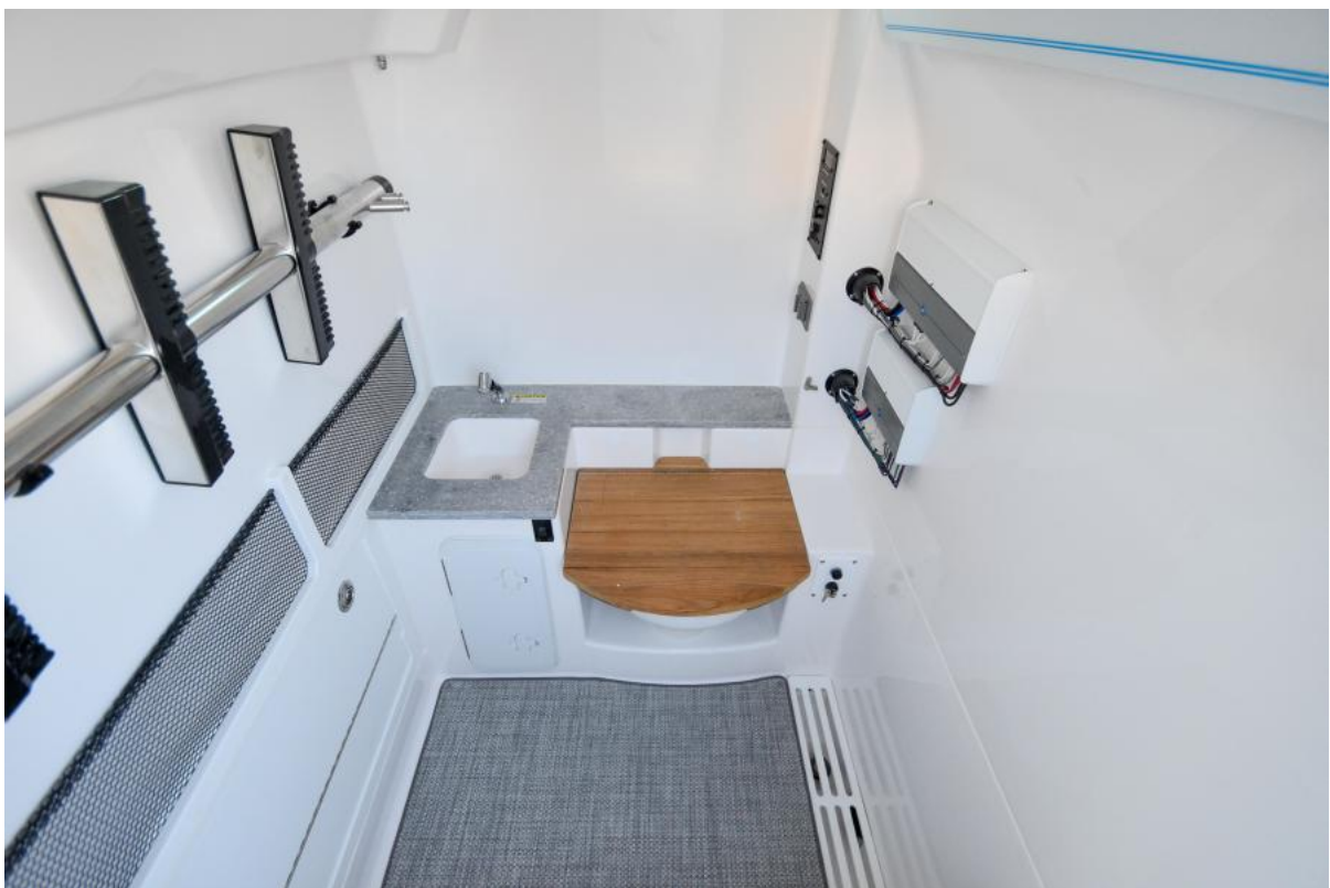
2023 Everglades 335CC 02