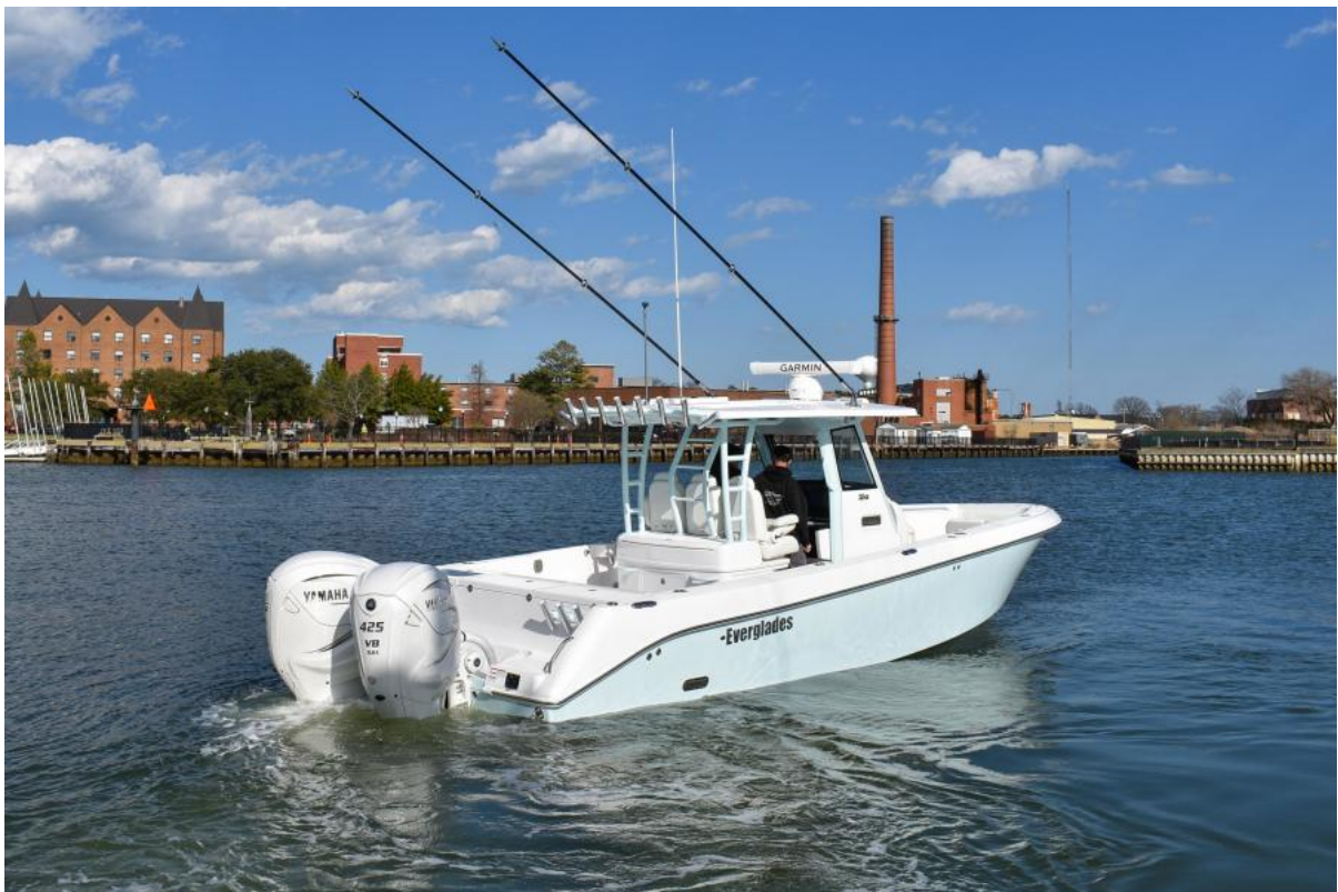
2023 Everglades 335CC 24