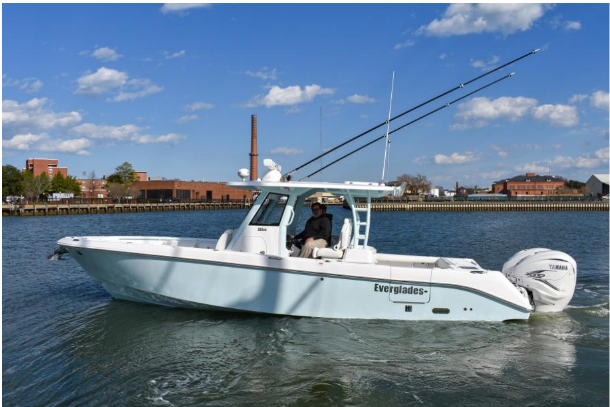
2023 Everglades 335CC 27