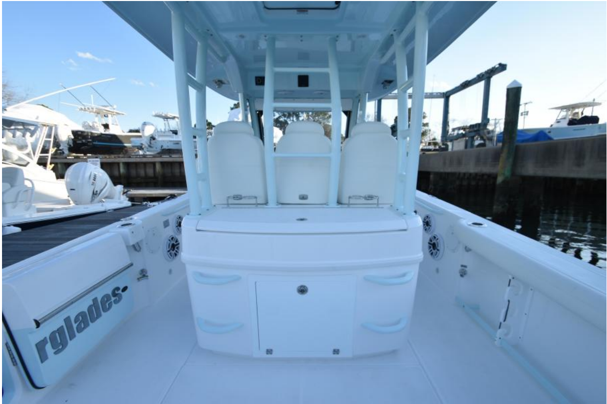
2023 Everglades 335CC 15