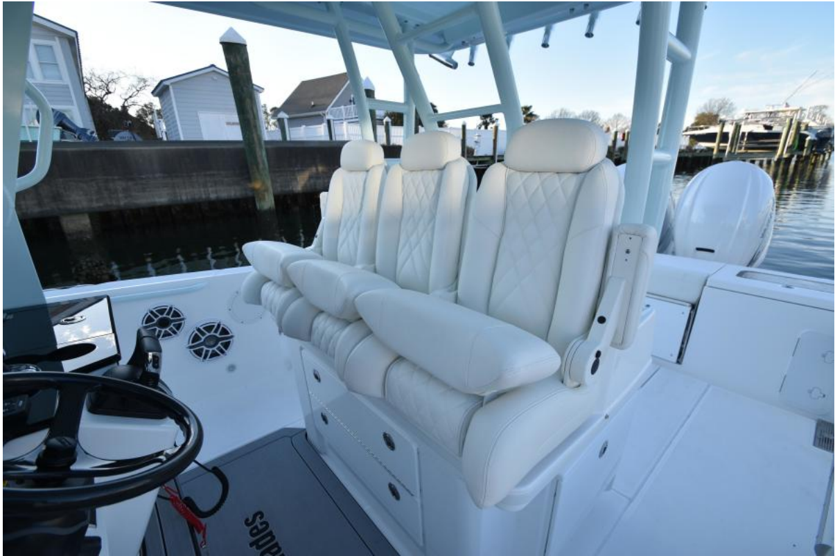
2023 Everglades 335CC 11