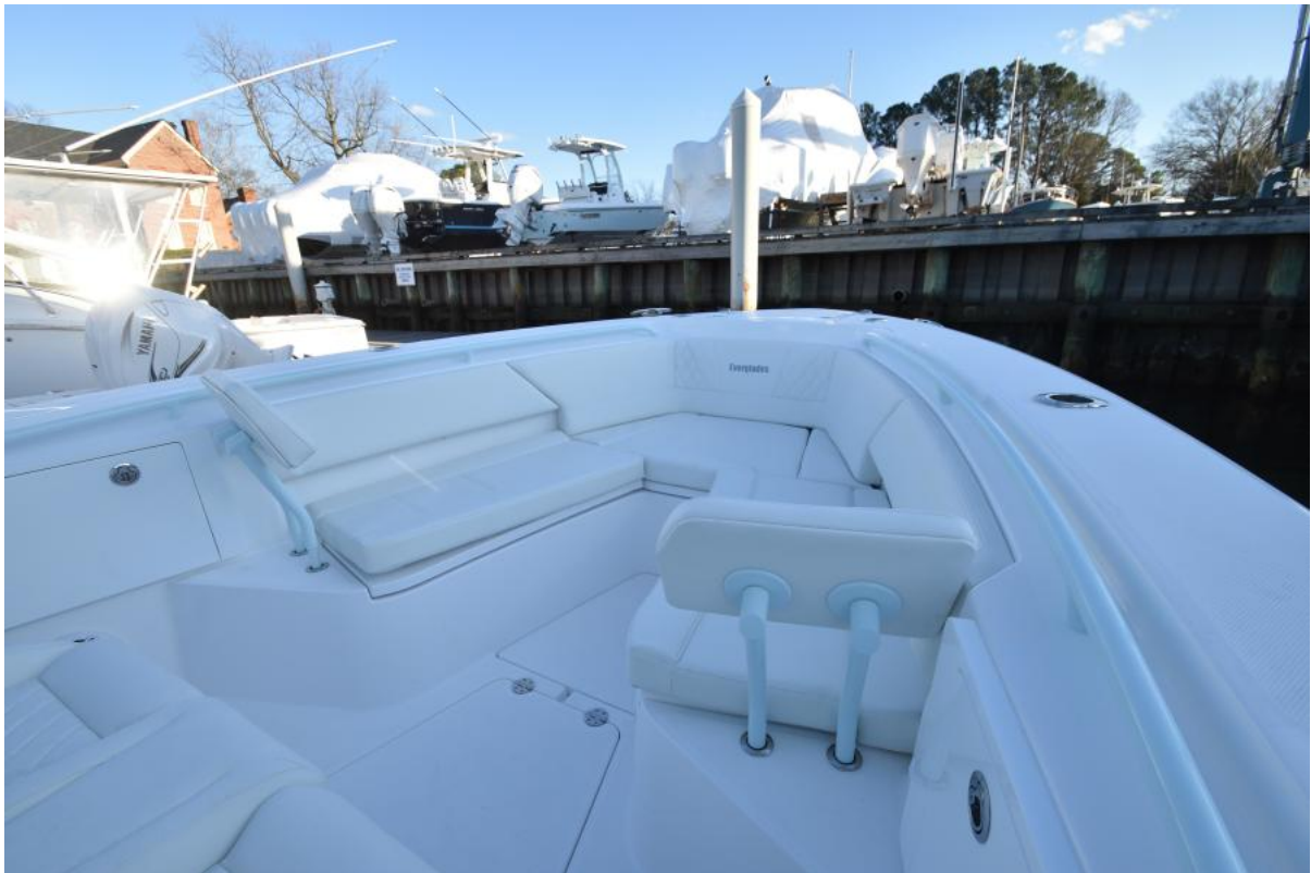
2023 Everglades 335CC 03