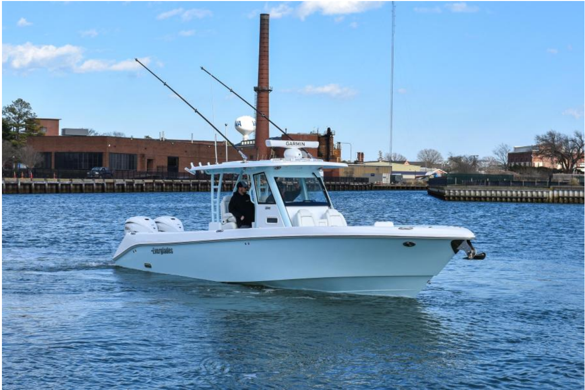
2023 Everglades 335CC 22