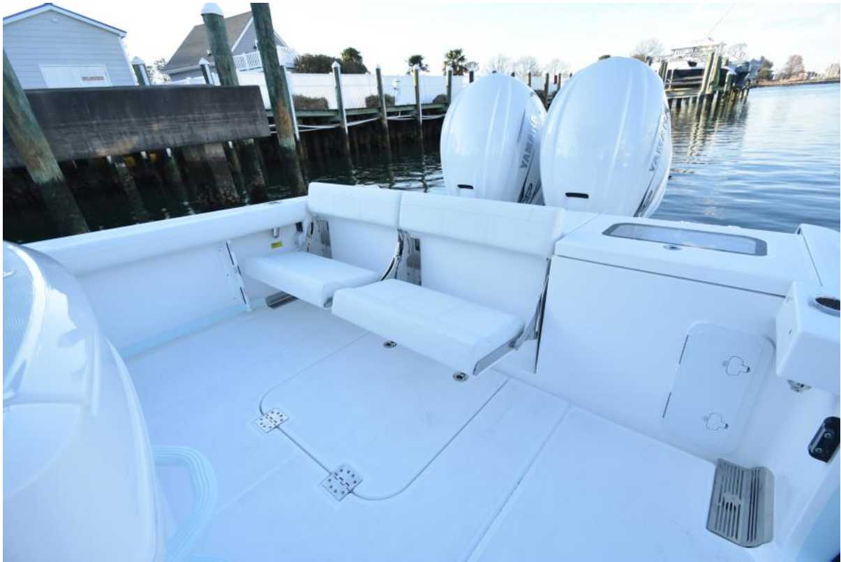
2023 Everglades 335CC 19