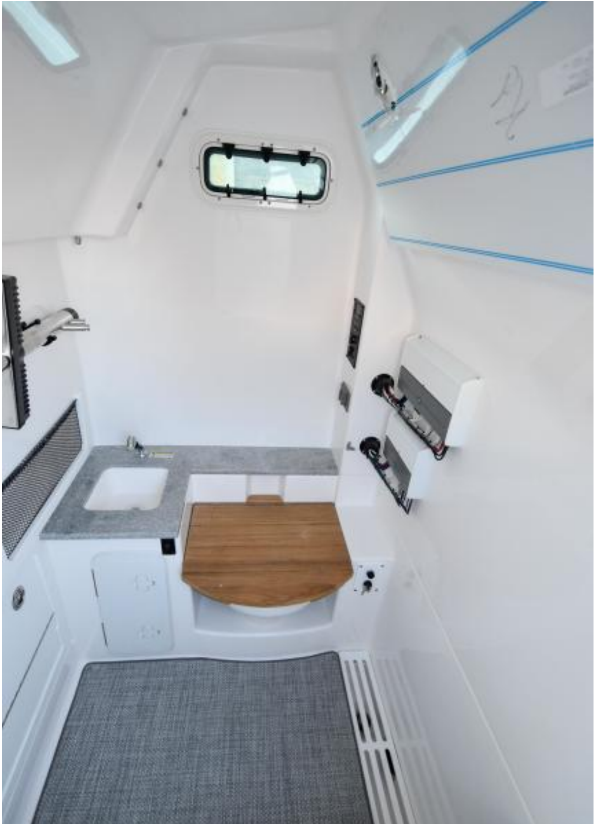
2023 Everglades 335CC 01