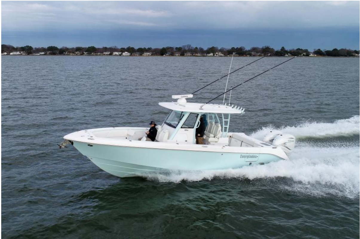
2023 Everglades 335CC 33