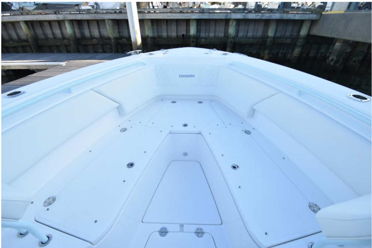
2023 Everglades 335CC 06