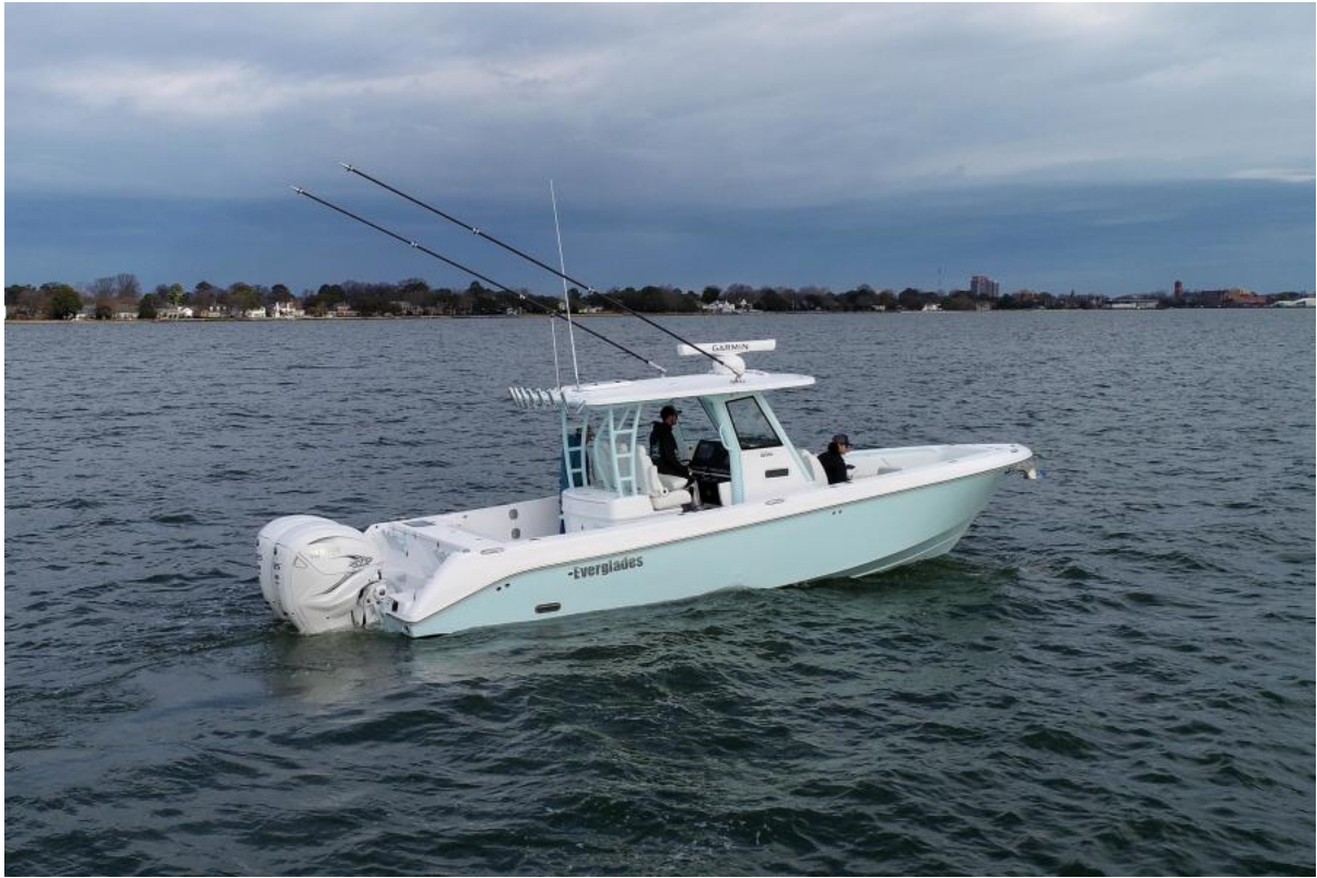
2023 Everglades 335CC 28