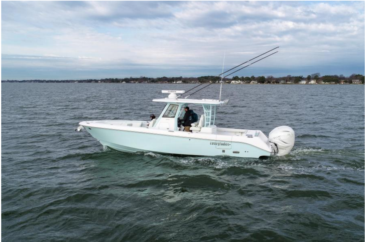
2023 Everglades 335CC 35