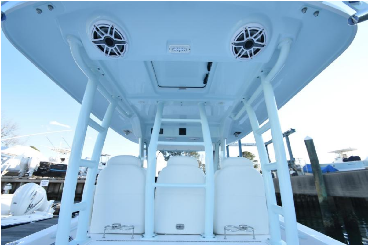
2023 Everglades 335CC 13