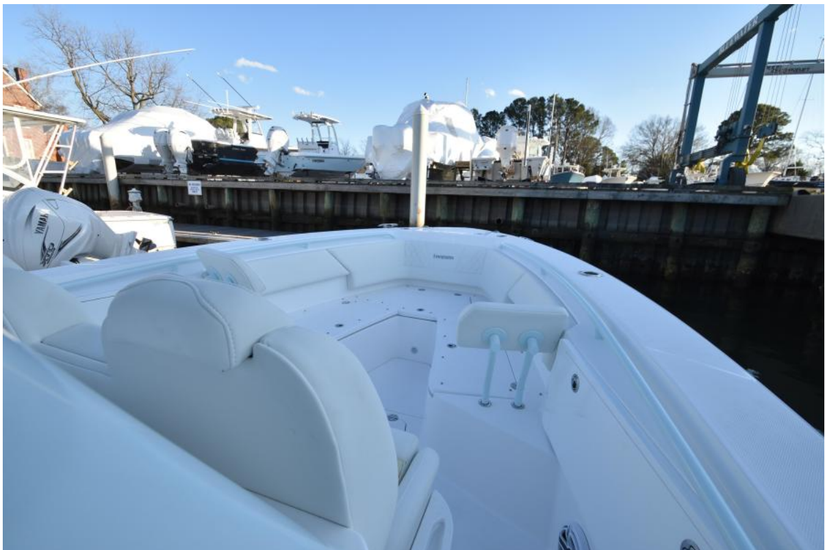
2023 Everglades 335CC 08