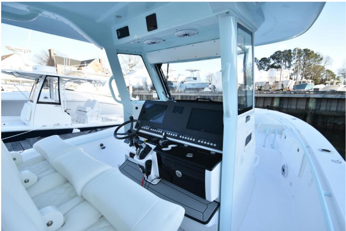
2023 Everglades 335CC 10