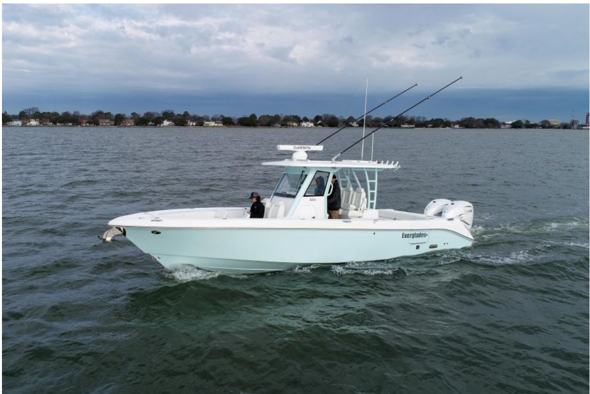
2023 Everglades 335CC 34