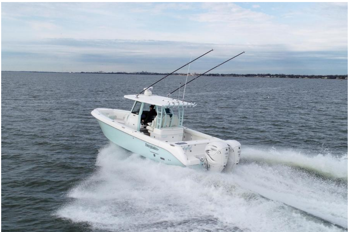
2023 Everglades 335CC 31