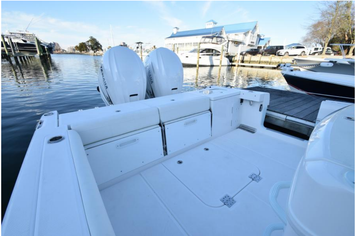
2023 Everglades 335CC 21