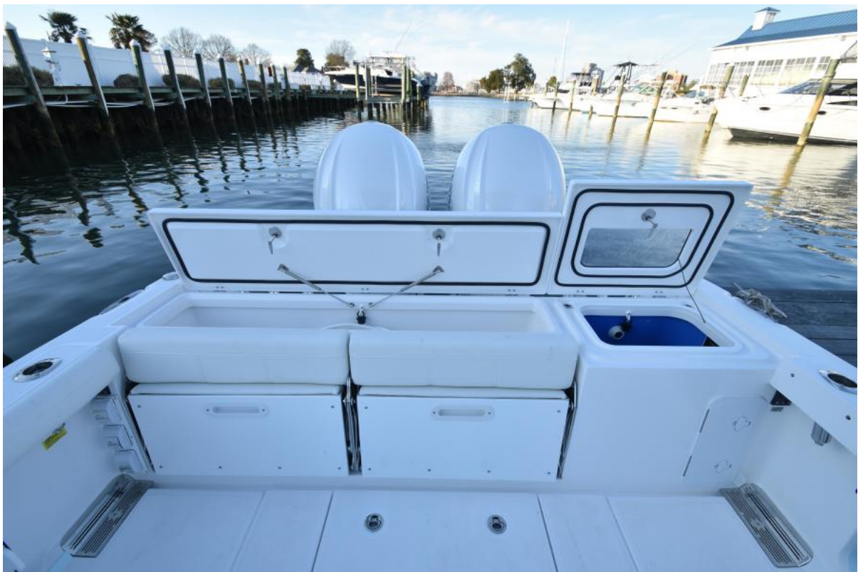
2023 Everglades 335CC 18