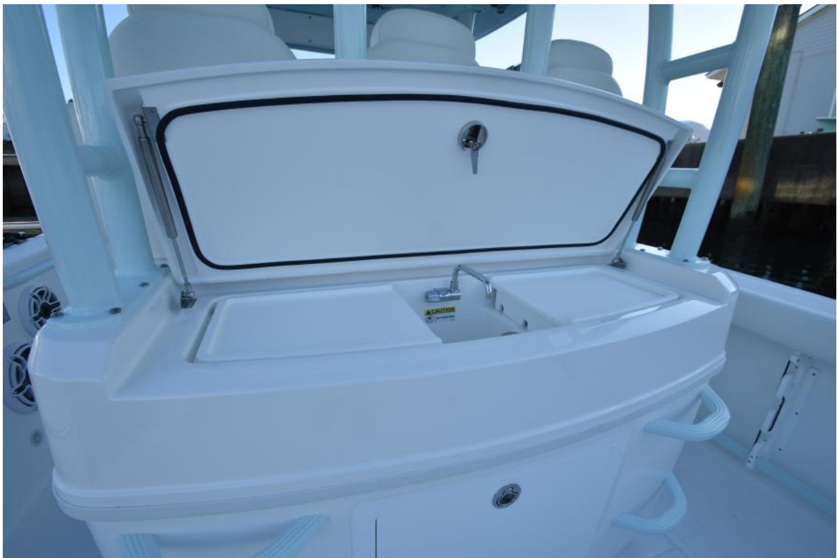
2023 Everglades 335CC 14