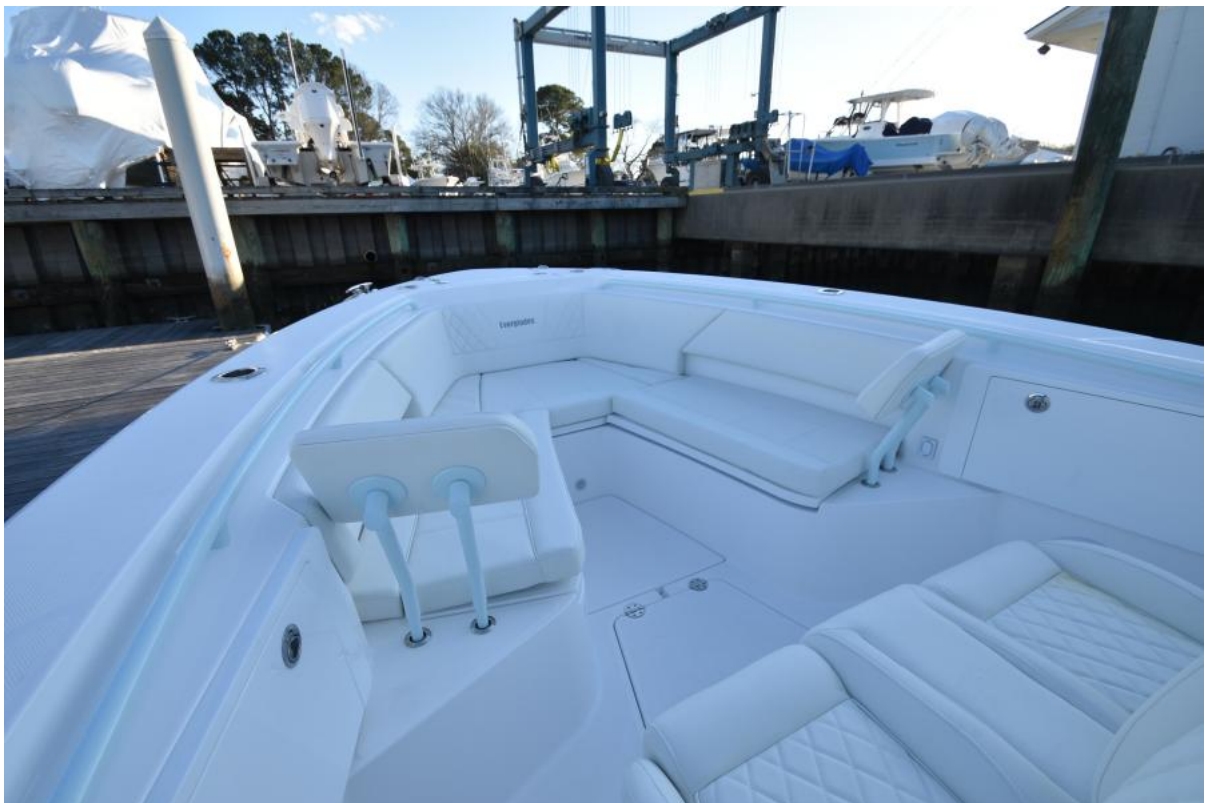
2023 Everglades 335CC 04