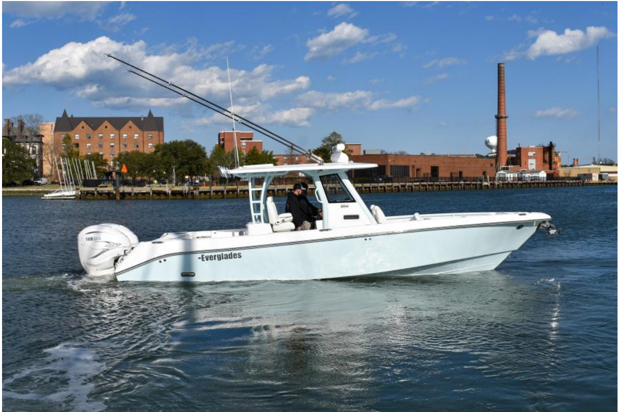
2023 Everglades 335CC 23