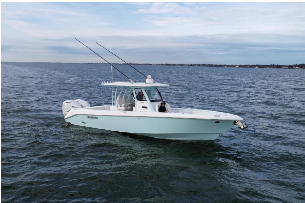
2023 Everglades 335CC 29