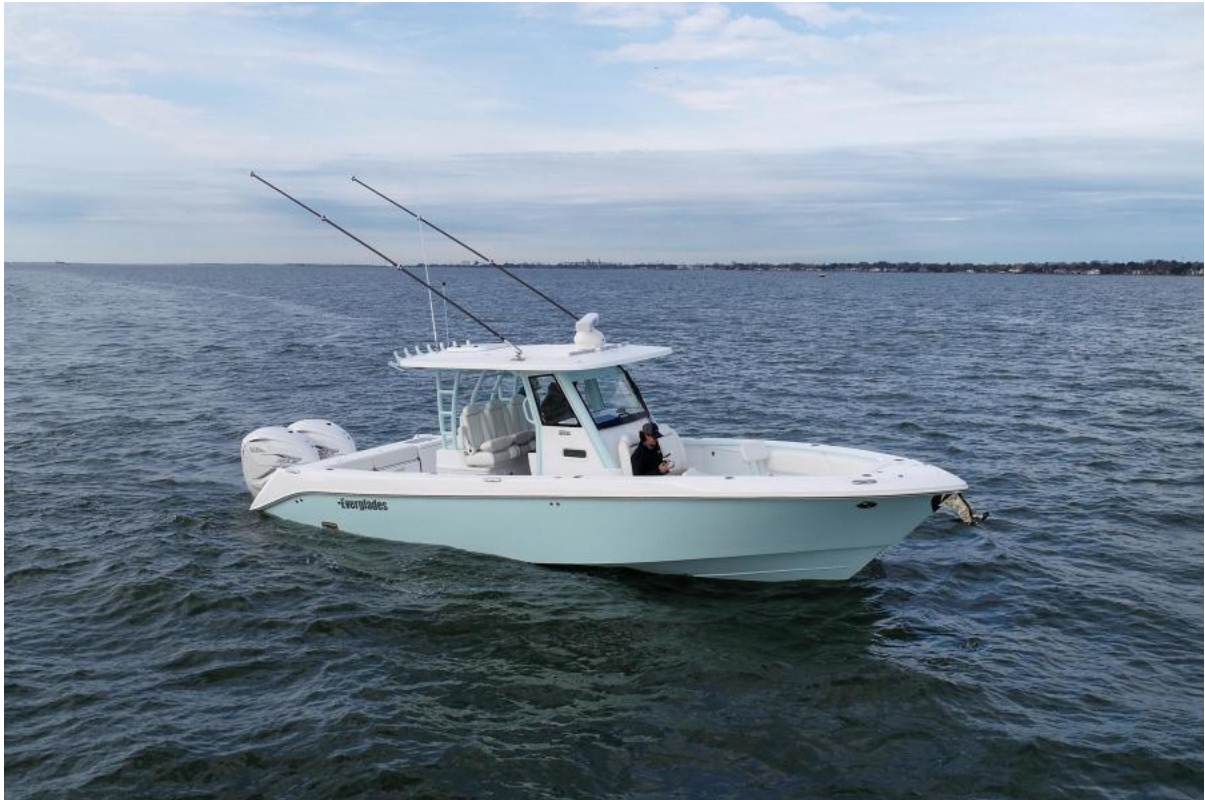
2023 Everglades 335CC 30