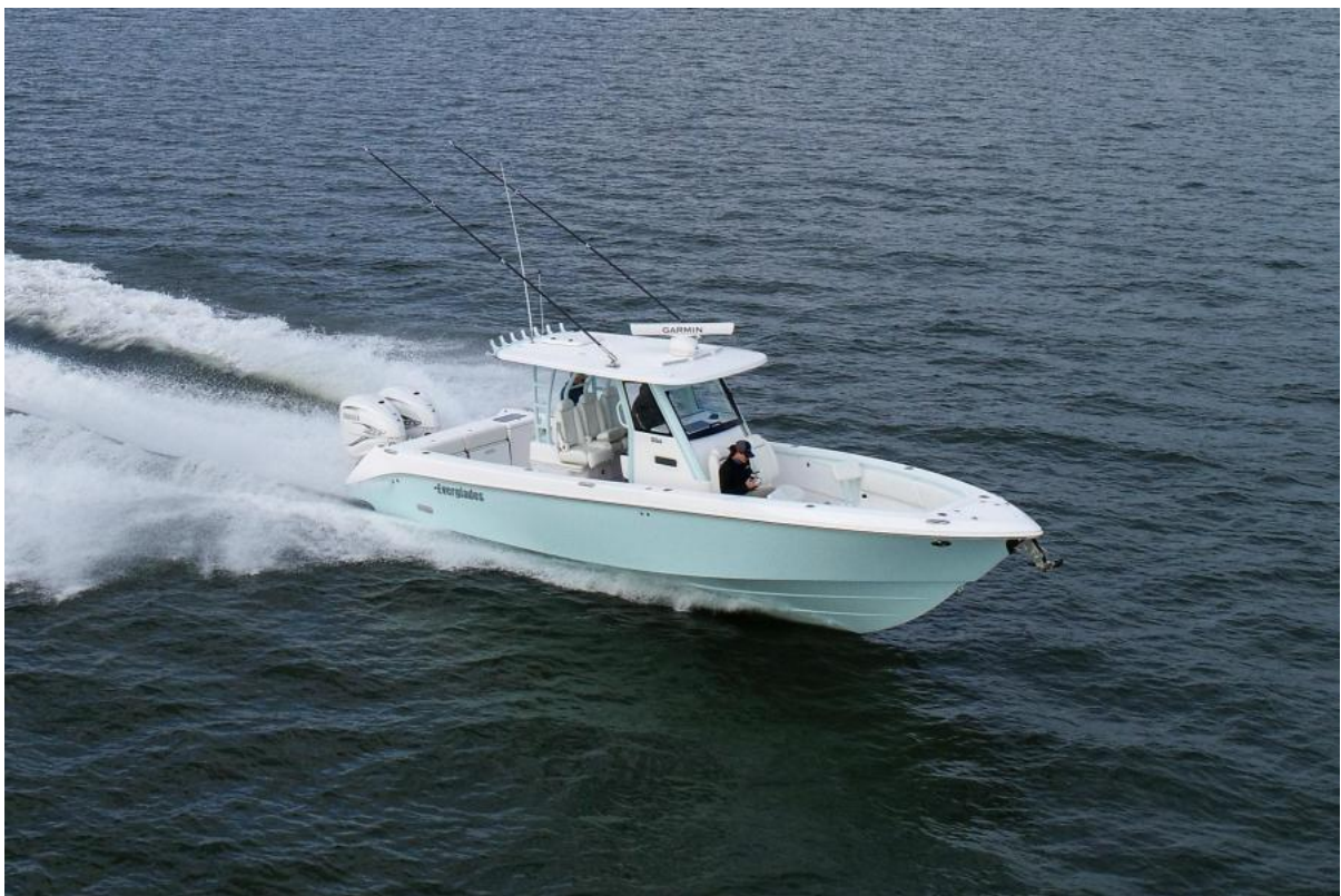
2023 Everglades 335CC 36