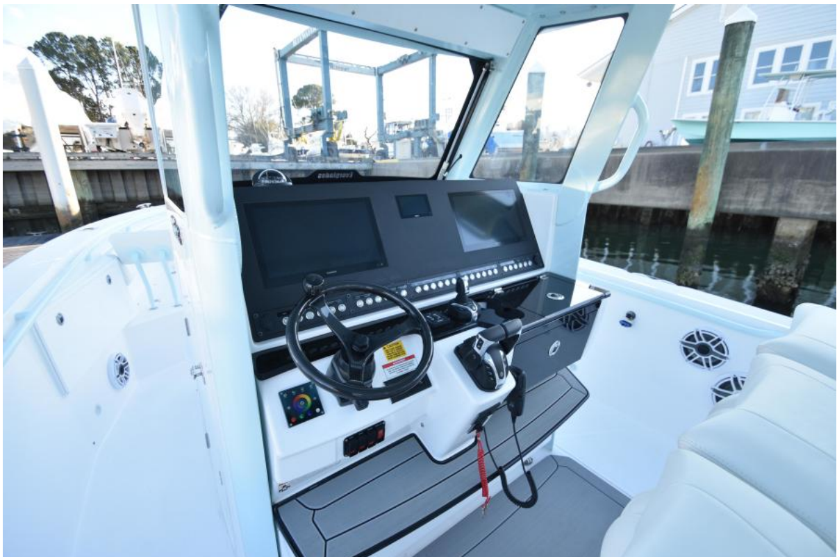
2023 Everglades 335CC 12