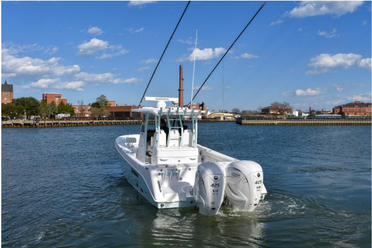
2023 Everglades 335CC 25