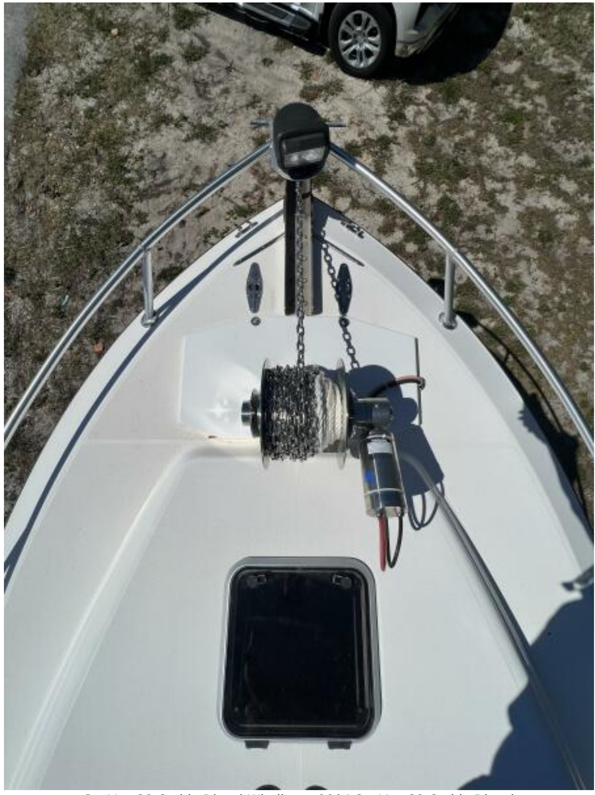
SeaVee 32 Cuddy Diesel-Windlass 2004 SeaVee 32 Cuddy Diesel