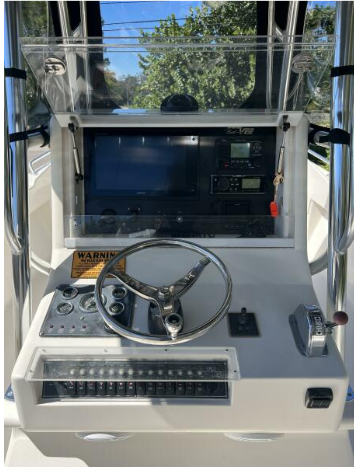
SeaVee 32 Cuddy Diesel-Helm 2004 SeaVee 32 Cuddy Diesel