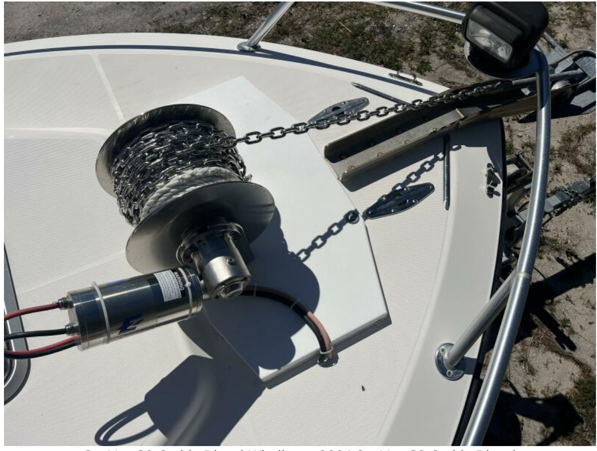
SeaVee 32 Cuddy Diesel-Windlass 2004 SeaVee 32 Cuddy Diesel