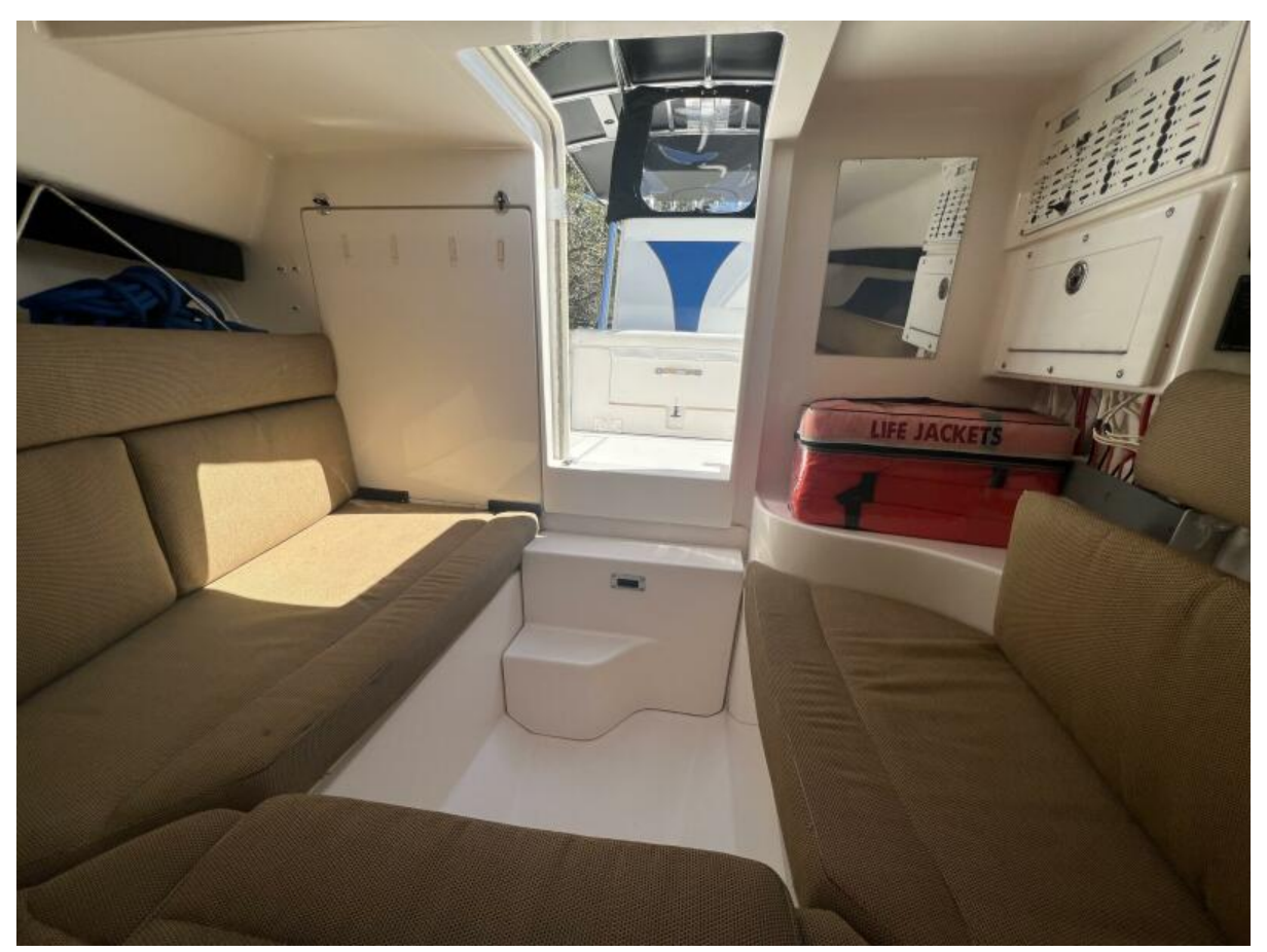
SeaVee 32 Cuddy Diesel-Cabin 2004 SeaVee 32 Cuddy Diesel