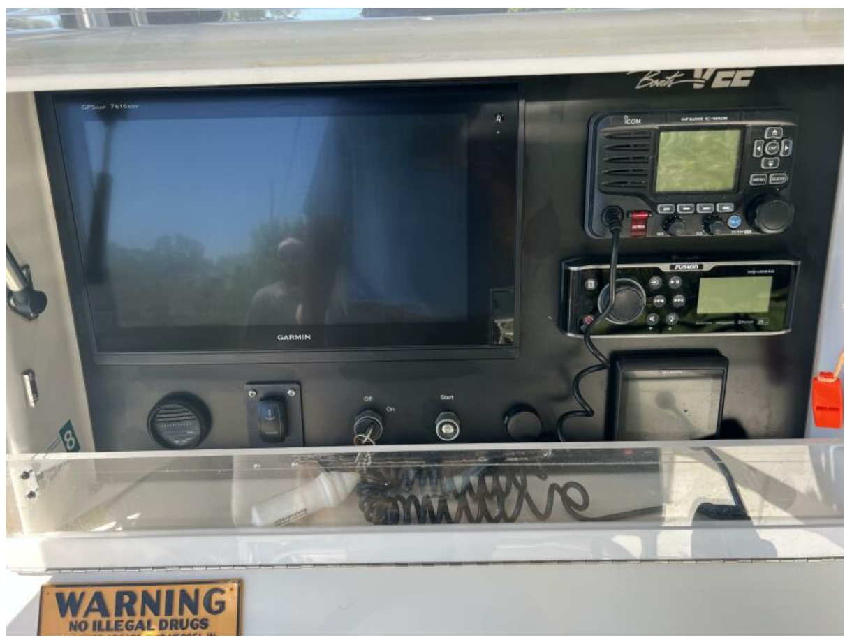
SeaVee 32 Cuddy Diesel-Helm 2004 SeaVee 32 Cuddy Diesel