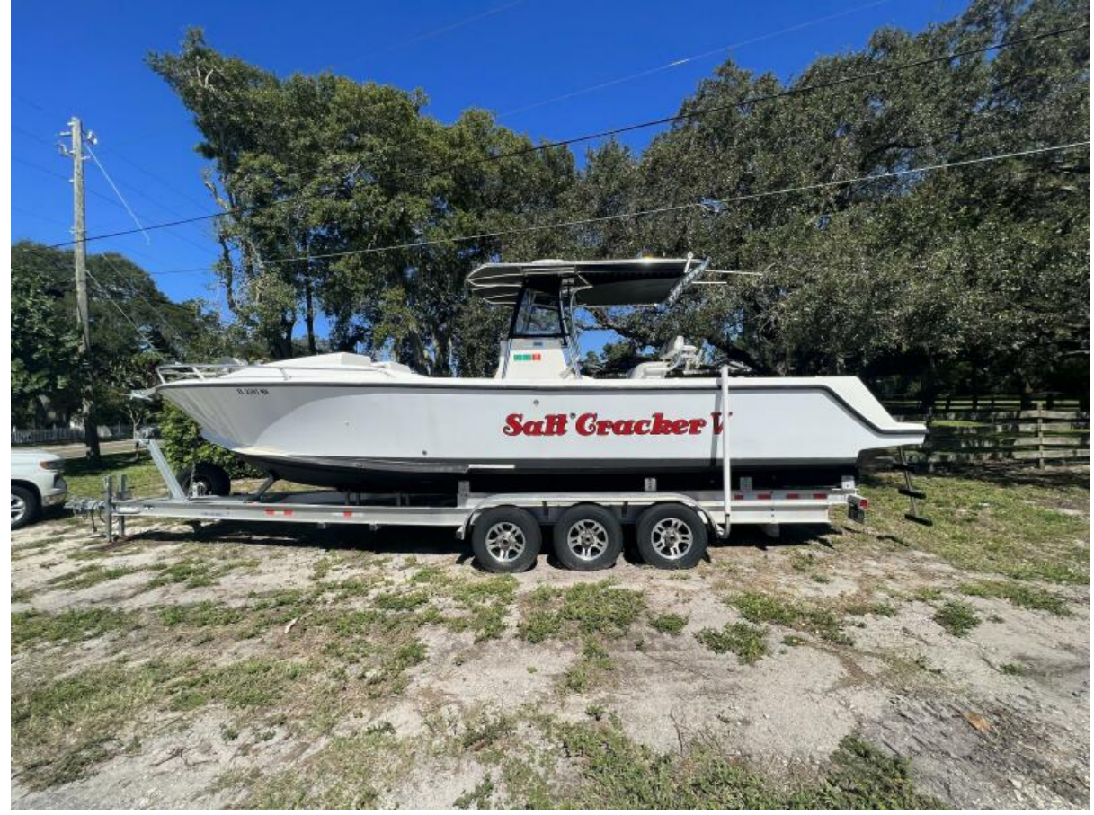
SeaVee 32 Cuddy Diesel-Profile 2004 SeaVee 32 Cuddy Diesel