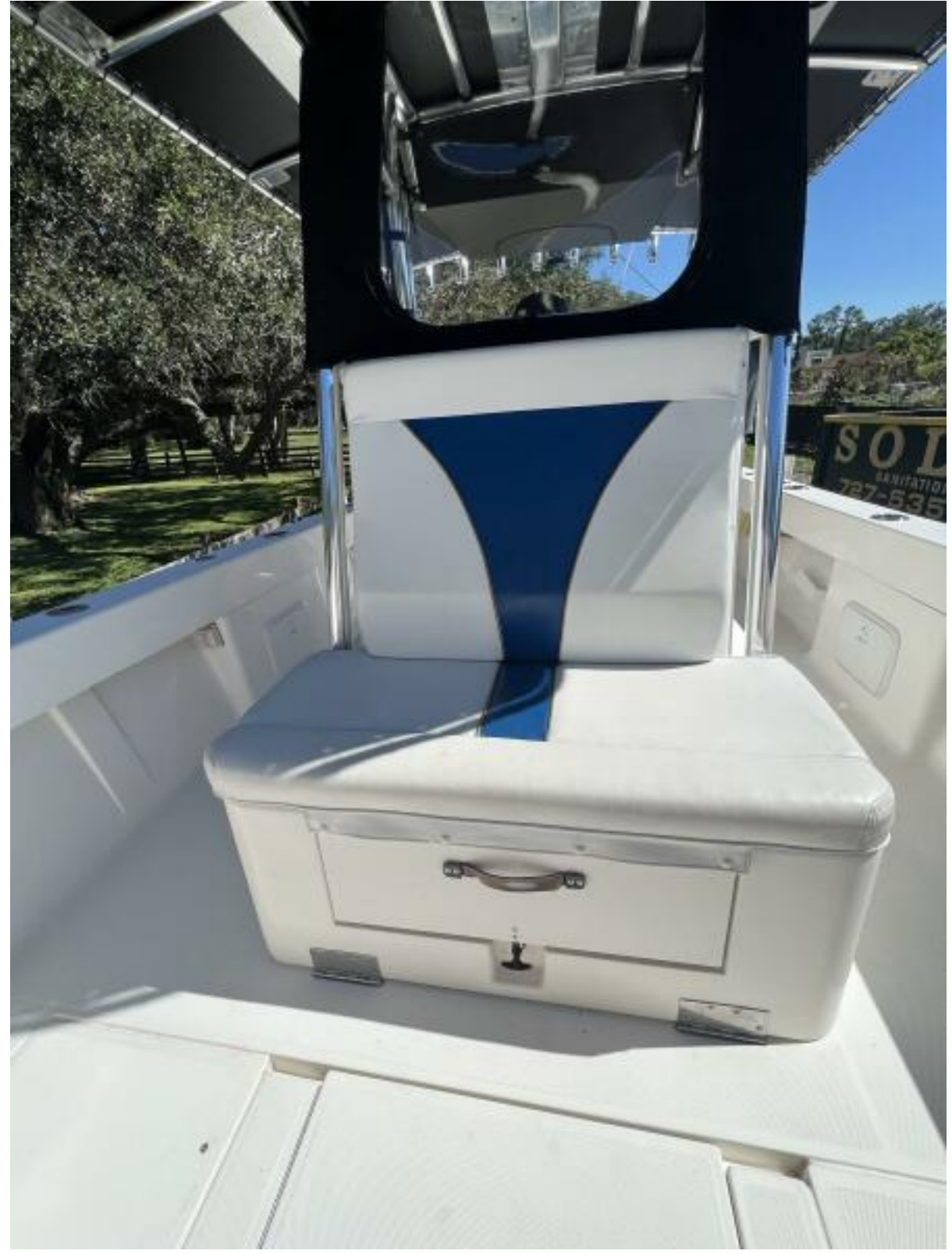
SeaVee 32 Cuddy Diesel-Console Seat 2004 SeaVee 32 Cuddy Diesel