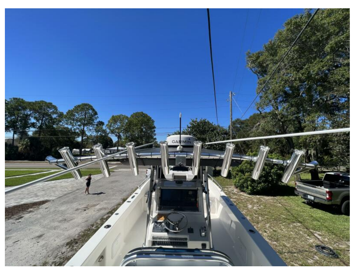
SeaVee 32 Cuddy Diesel-Rocket Launchers 2004 SeaVee 32 Cuddy Diesel