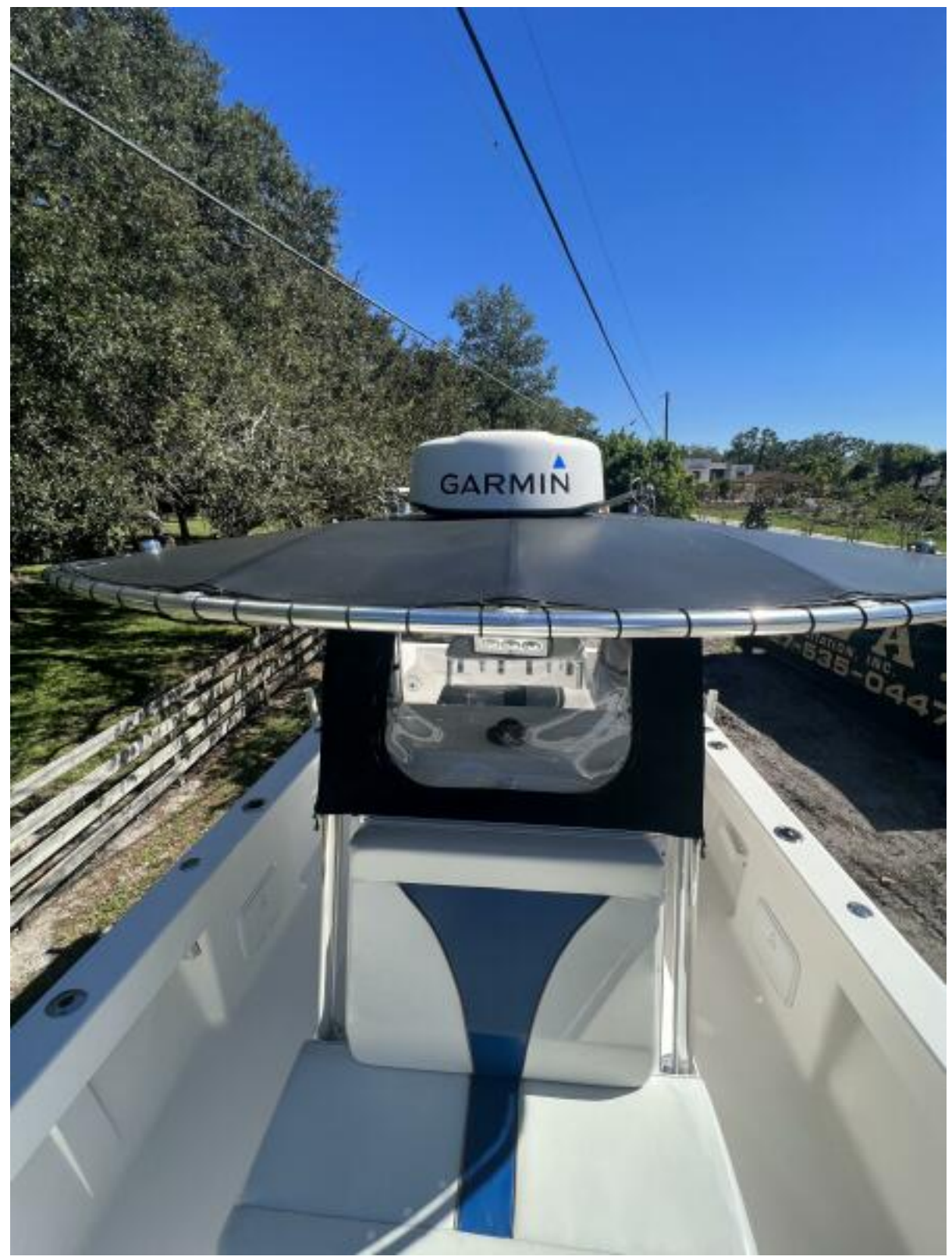
SeaVee 32 Cuddy Diesel-Radar 2004 SeaVee 32 Cuddy Diesel