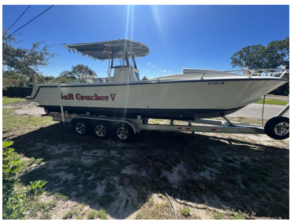
SeaVee 32 Cuddy Diesel-Profile 2004 SeaVee 32 Cuddy Diesel