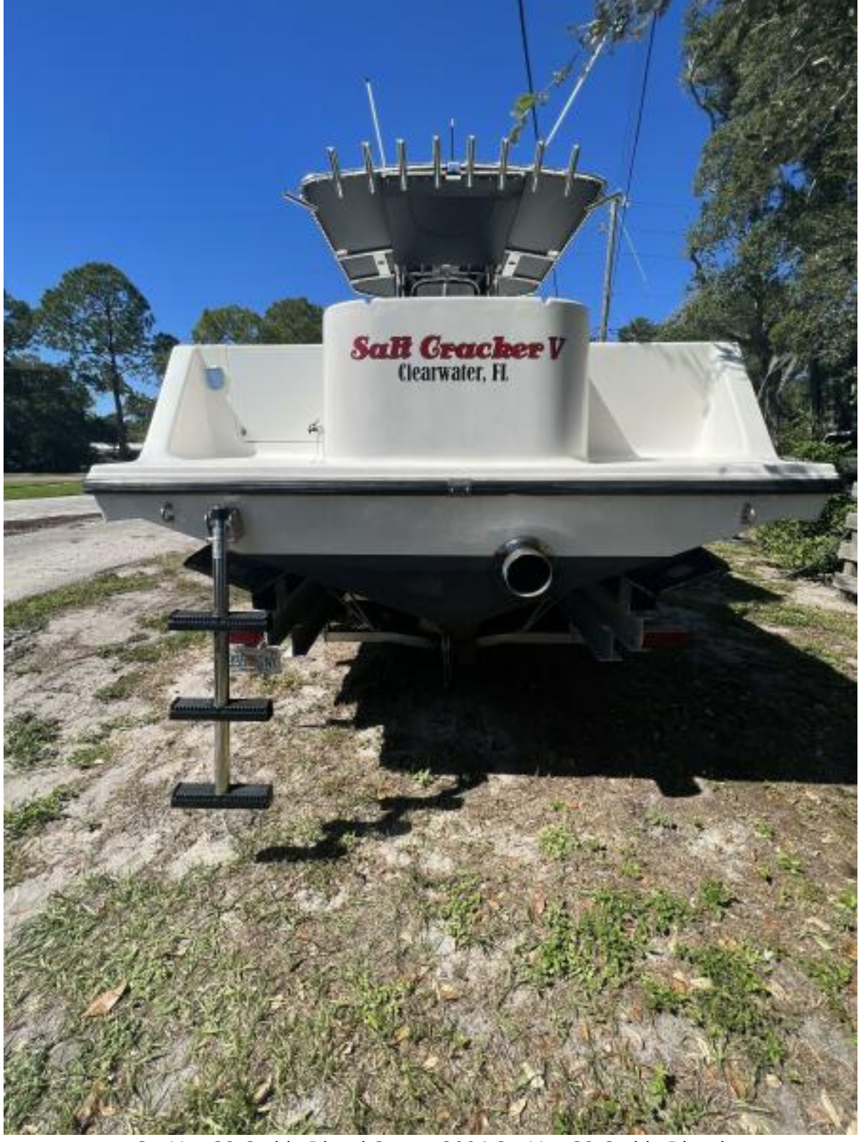
SeaVee 32 Cuddy Diesel-Stern 2004 SeaVee 32 Cuddy Diesel