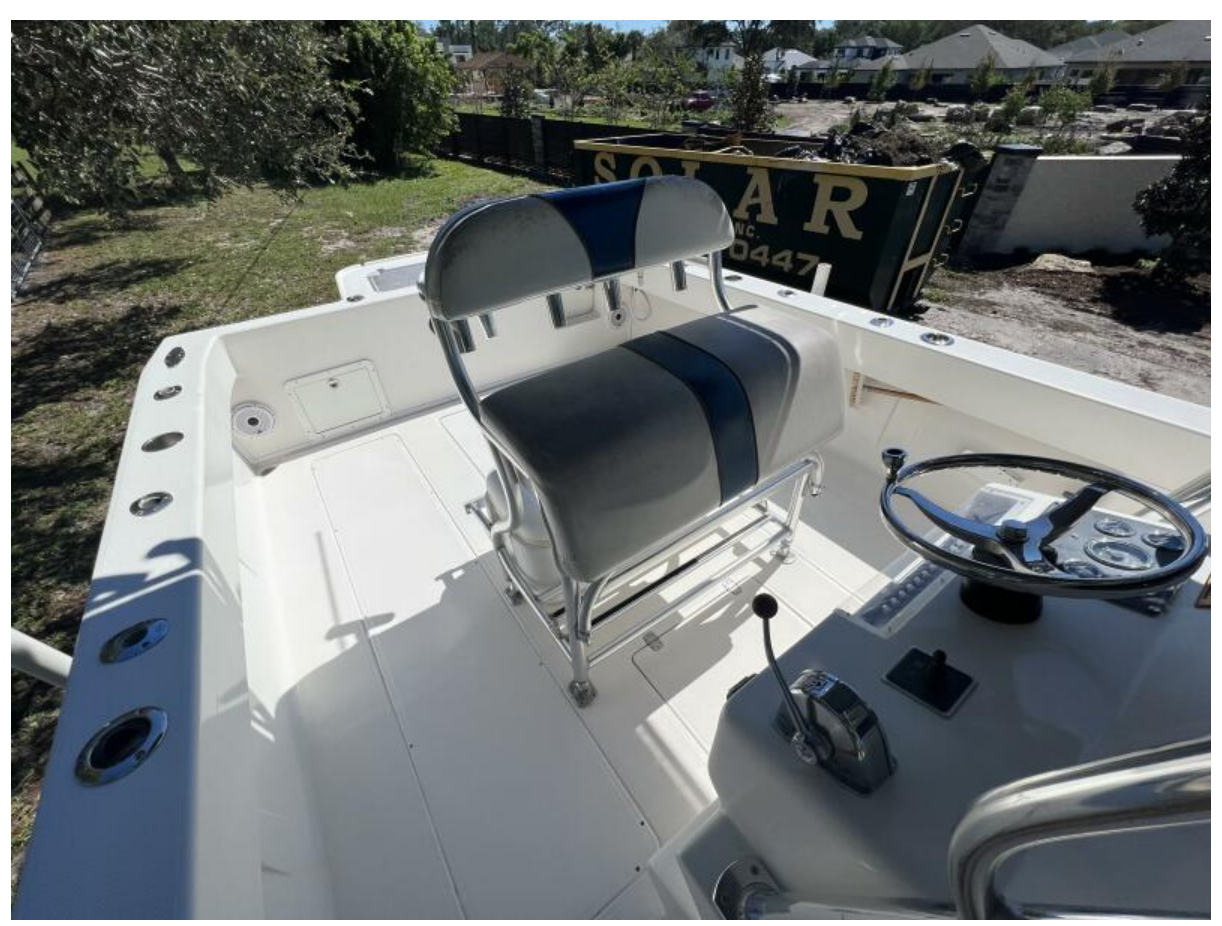
SeaVee 32 Cuddy Diesel-Helm 2004 SeaVee 32 Cuddy Diesel