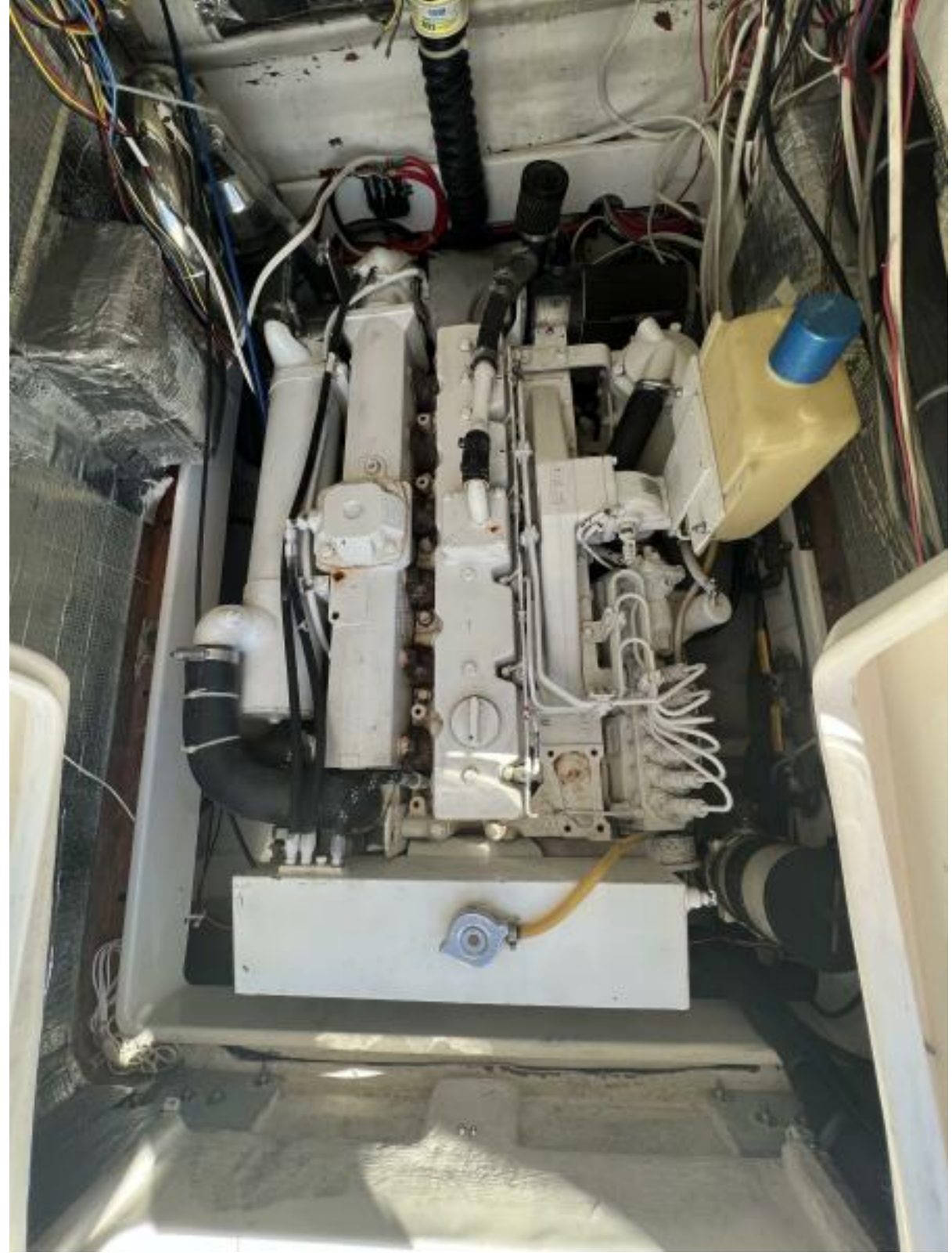
SeaVee 32 Cuddy Diesel-Engine 2004 SeaVee 32 Cuddy Diesel