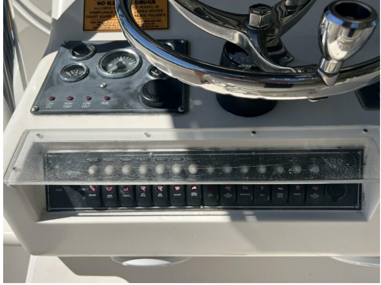
SeaVee 32 Cuddy Diesel-Helm 2004 SeaVee 32 Cuddy Diesel