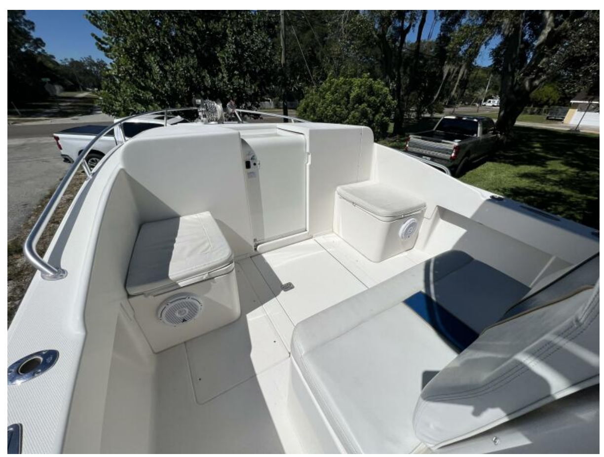
SeaVee 32 Cuddy Diesel-Foredeck 2004 SeaVee 32 Cuddy Diesel