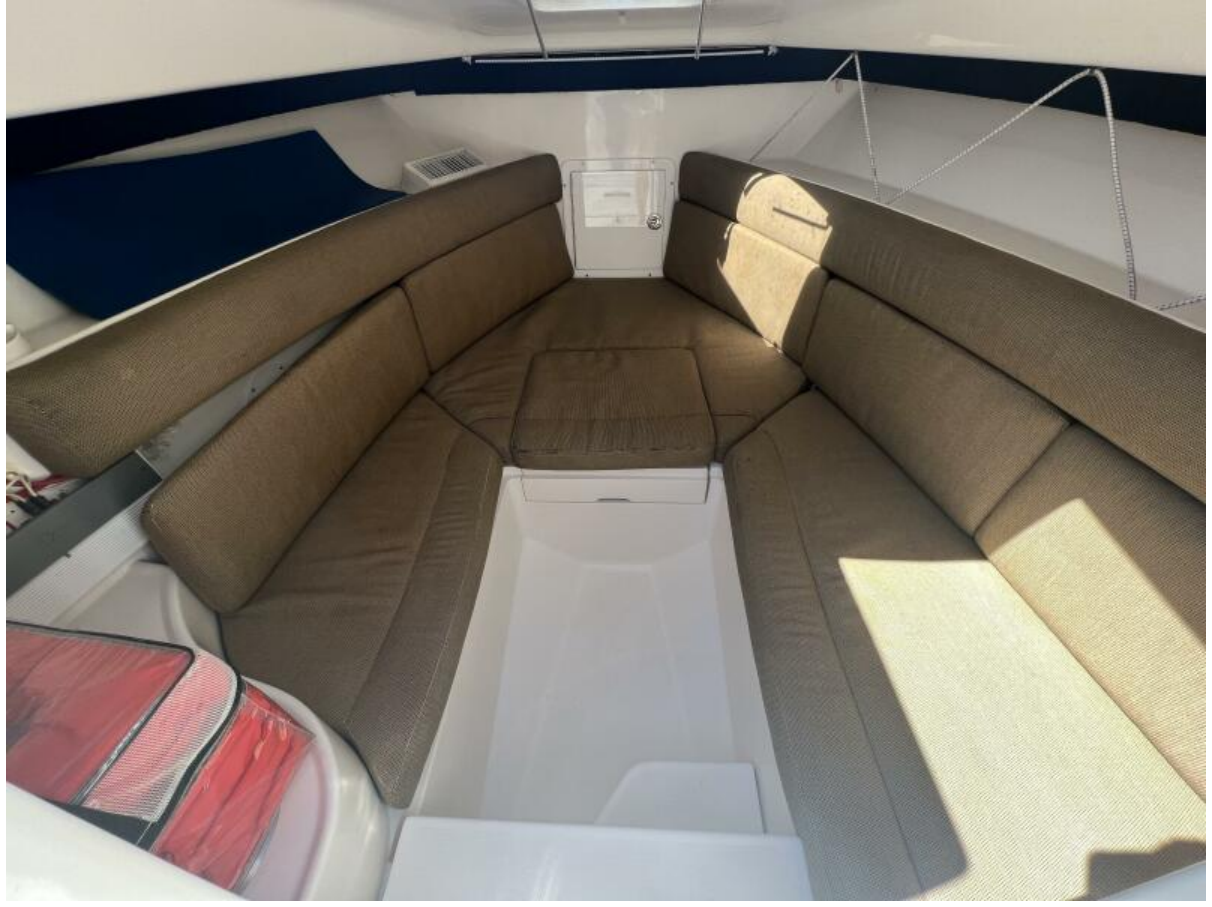
SeaVee 32 Cuddy Diesel-Cabin 2004 SeaVee 32 Cuddy Diesel