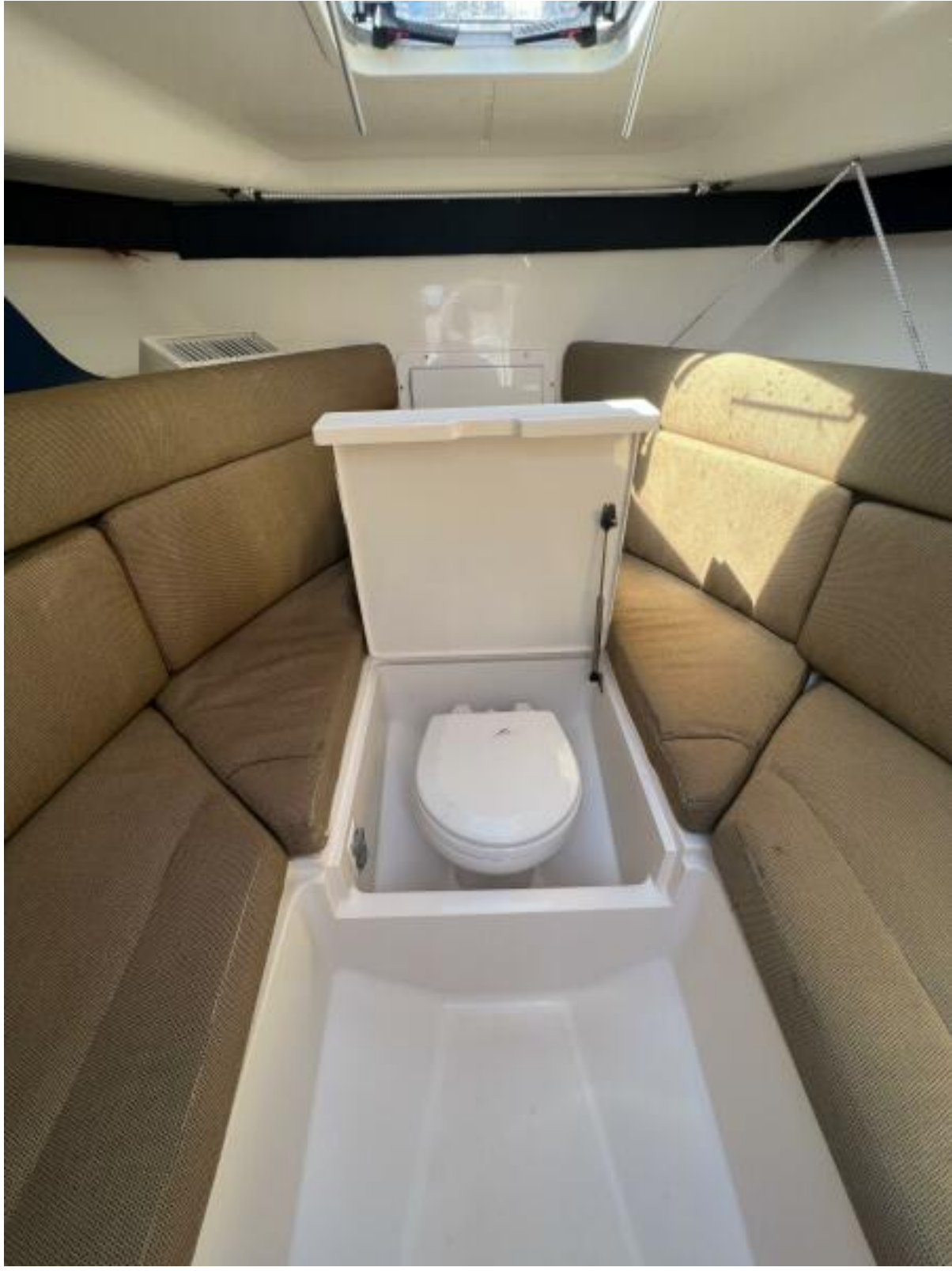
SeaVee 32 Cuddy Diesel-Cabin Head 2004 SeaVee 32 Cuddy Diesel