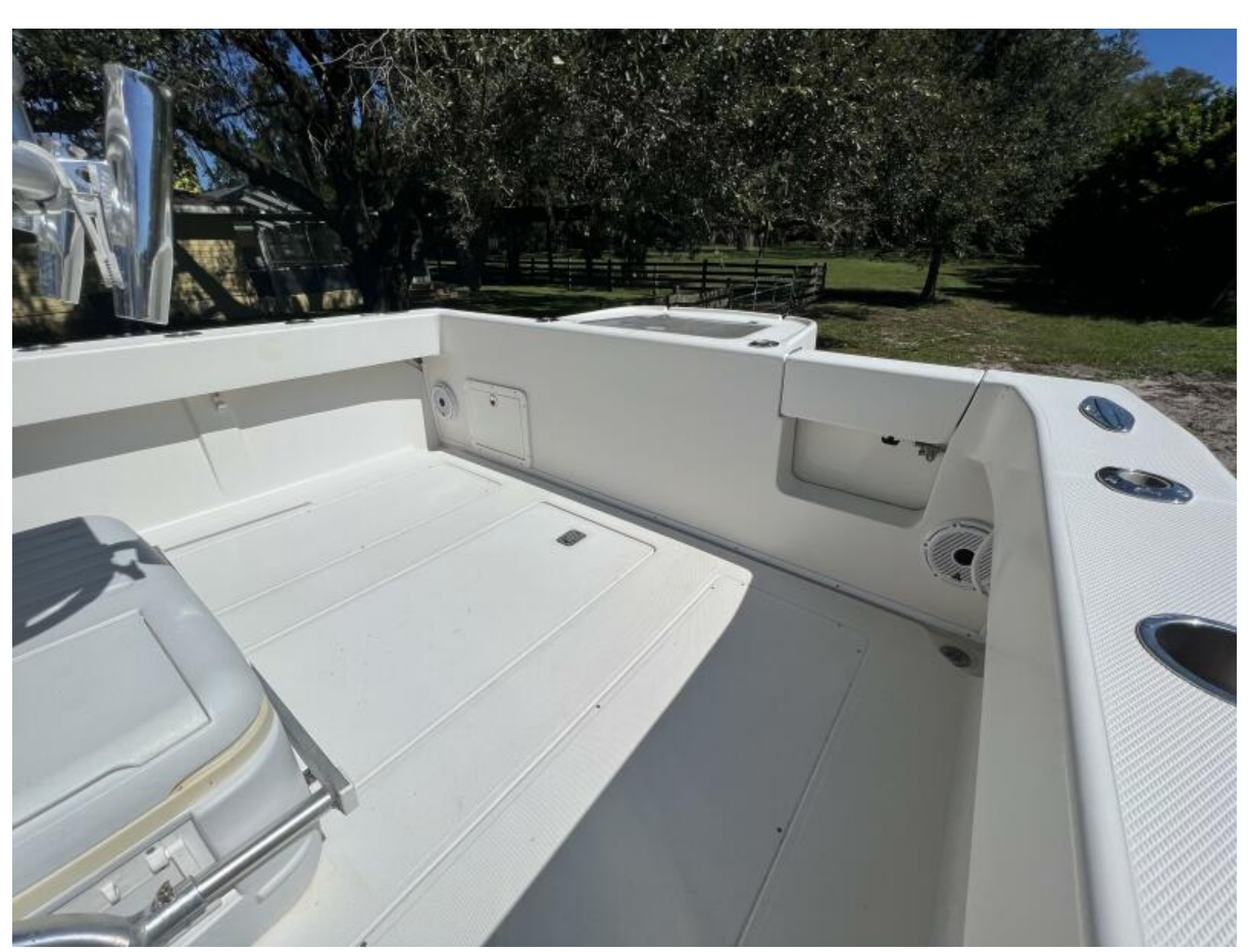
SeaVee 32 Cuddy Diesel-Cockpit 2004 SeaVee 32 Cuddy Diesel