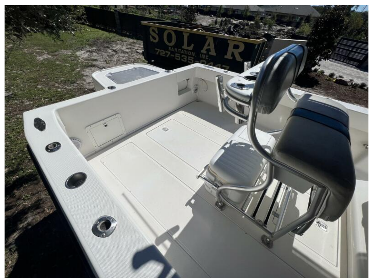
SeaVee 32 Cuddy Diesel-Cockpit 2004 SeaVee 32 Cuddy Diesel