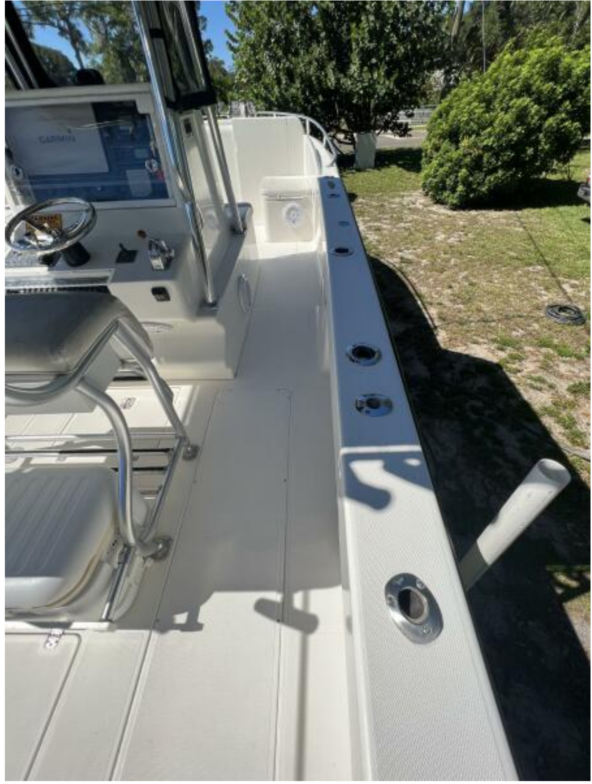
SeaVee 32 Cuddy Diesel-Sidedeck 2004 SeaVee 32 Cuddy Diesel