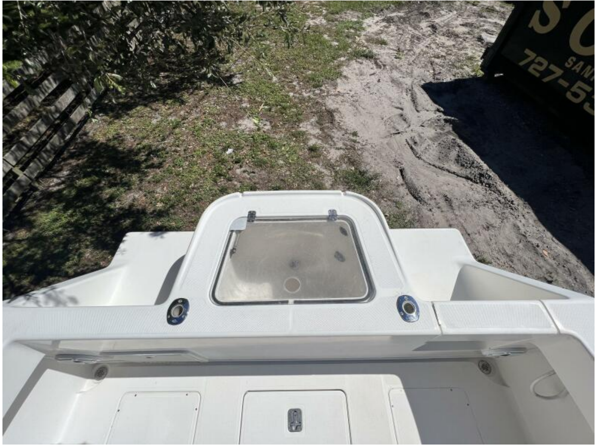
SeaVee 32 Cuddy Diesel-Livewell 2004 SeaVee 32 Cuddy Diesel