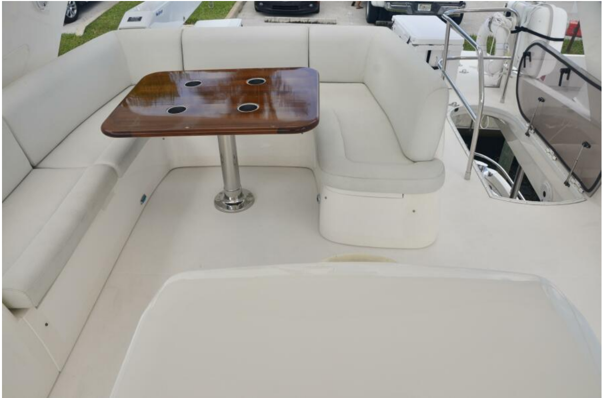
Princess 67 Flybridge Hoker-Flybridge 2006 67 Princess Flybridge Hoker