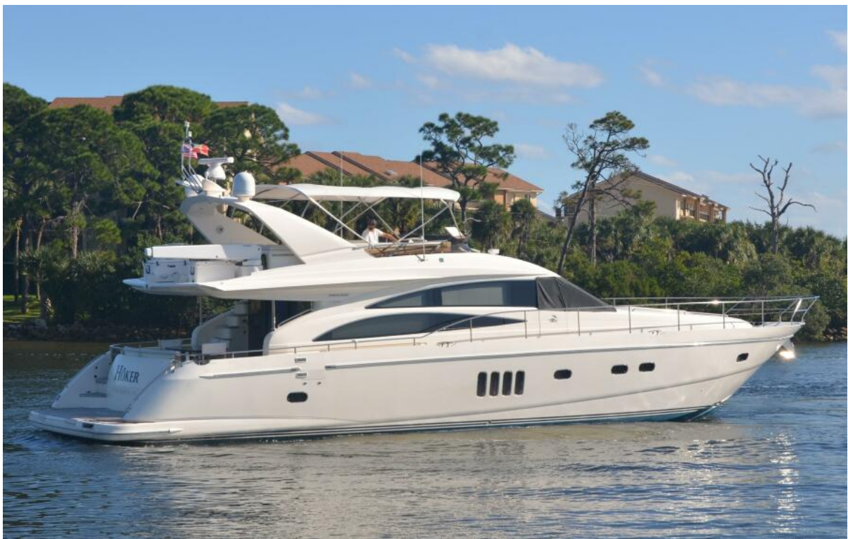
Princess 67 Flybridge Hoker- Profile 2006 67 Princess Flybridge Hoker