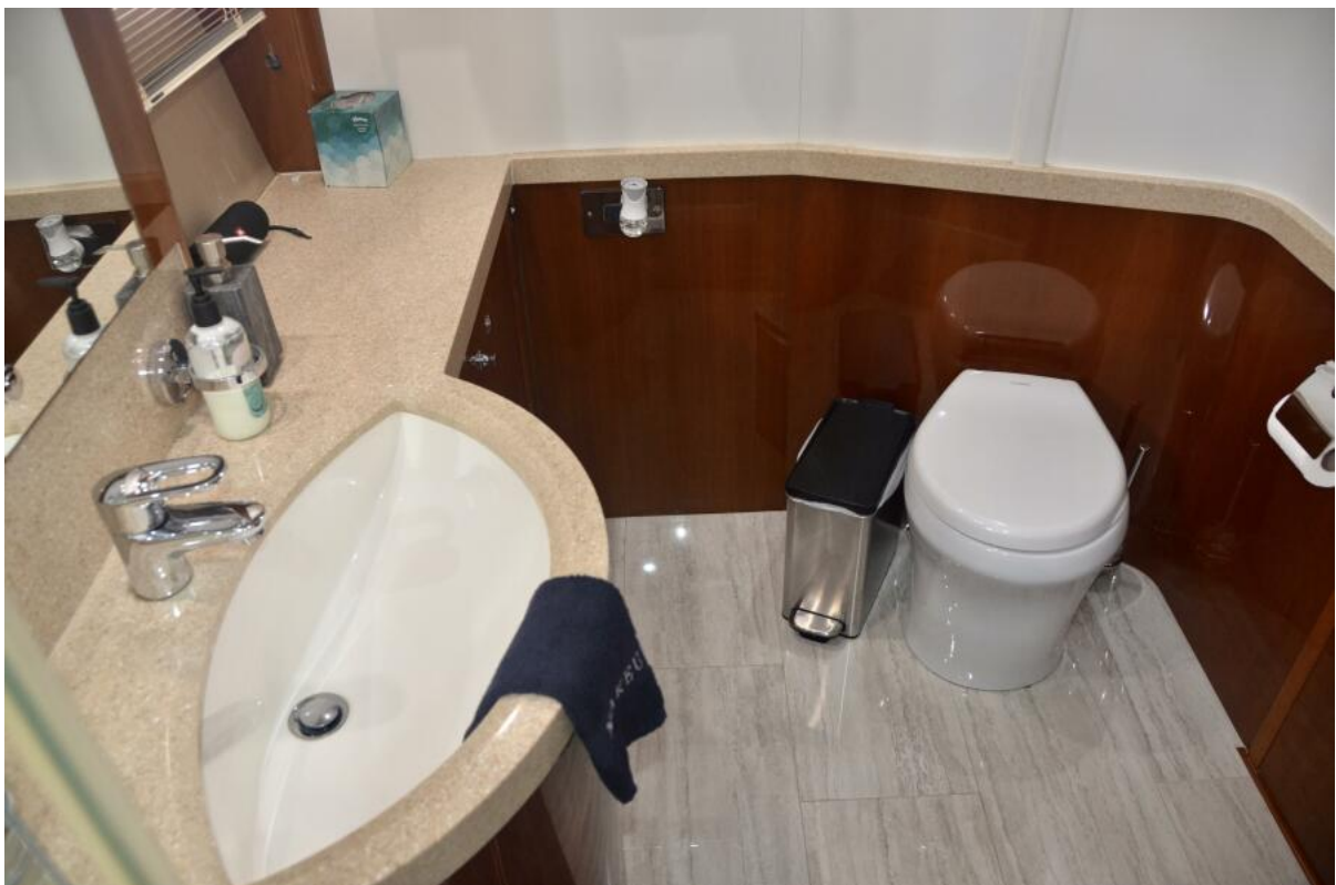
Princess 67 Flybridge Hoker- Master Stateroom Head 2006 67 Princess Flybridge Hoker