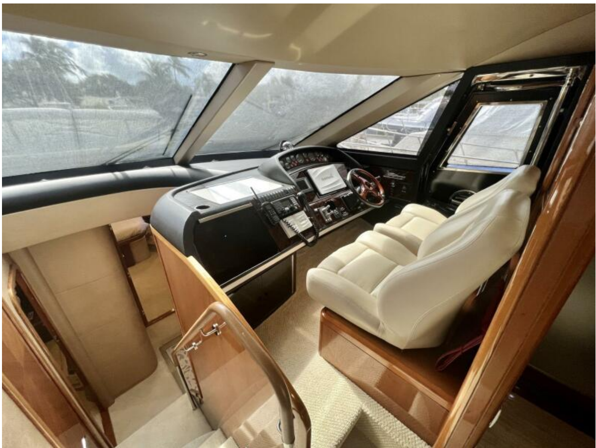
Princess 67 Flybridge Hoker-Lower Helm 2006 67 Princess Flybridge Hoker