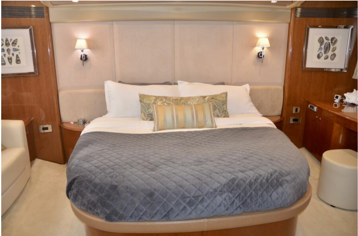
Princess 67 Flybridge Hoker-Master Stateroom 2006 67 Princess Flybridge Hoker