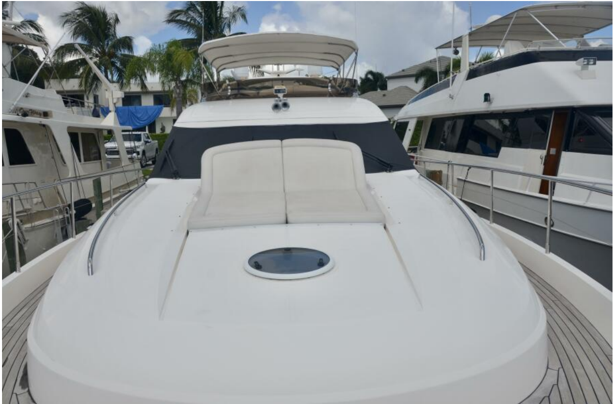
Princess 67 Flybridge Hoker-Bow 2006 67 Princess Flybridge Hoker