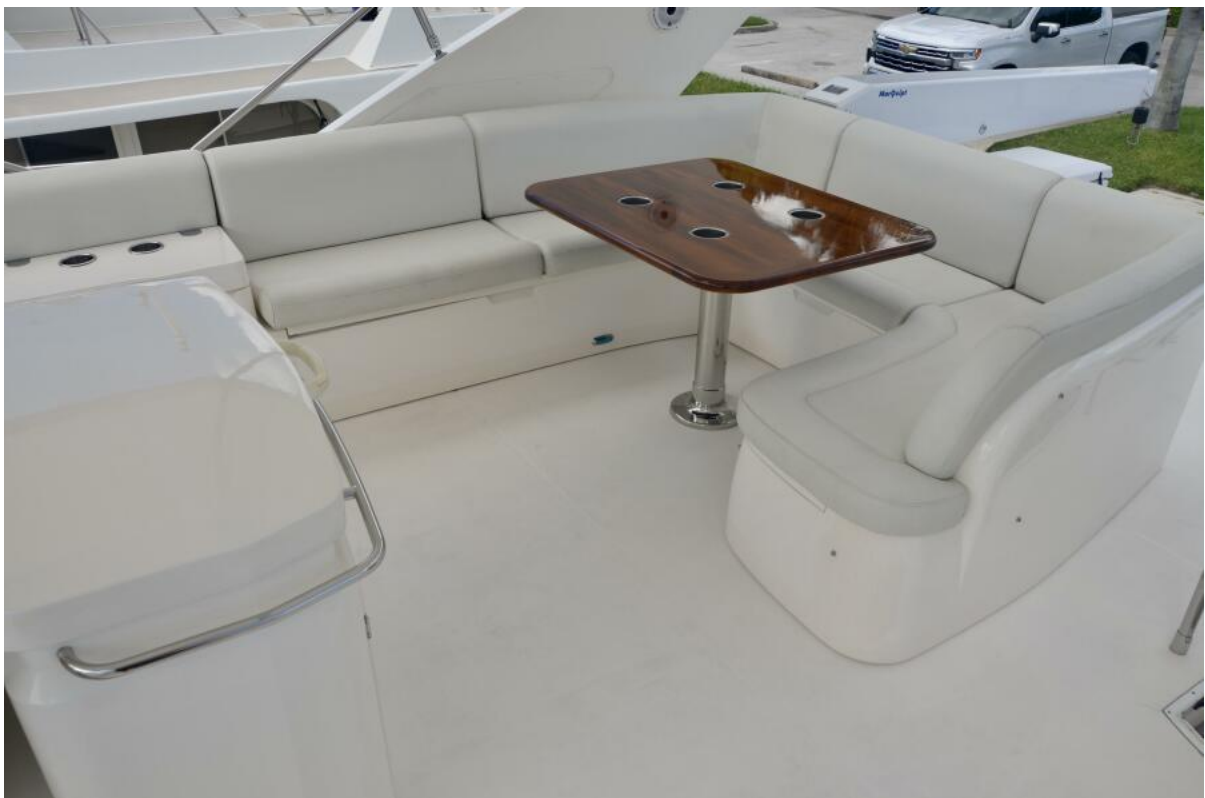
Princess 67 Flybridge Hoker-Flybridge 2006 67 Princess Flybridge Hoker