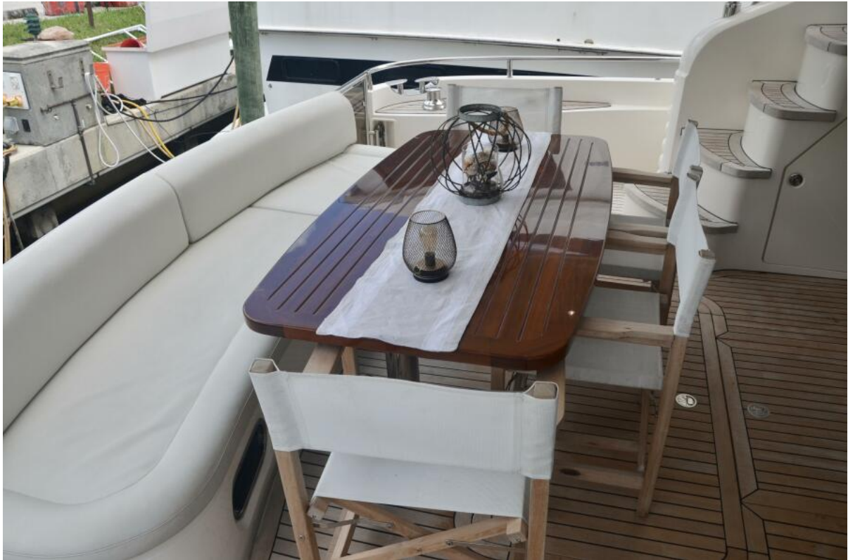
Princess 67 Flybridge Hoker-Aft Deck 2006 67 Princess Flybridge Hoker