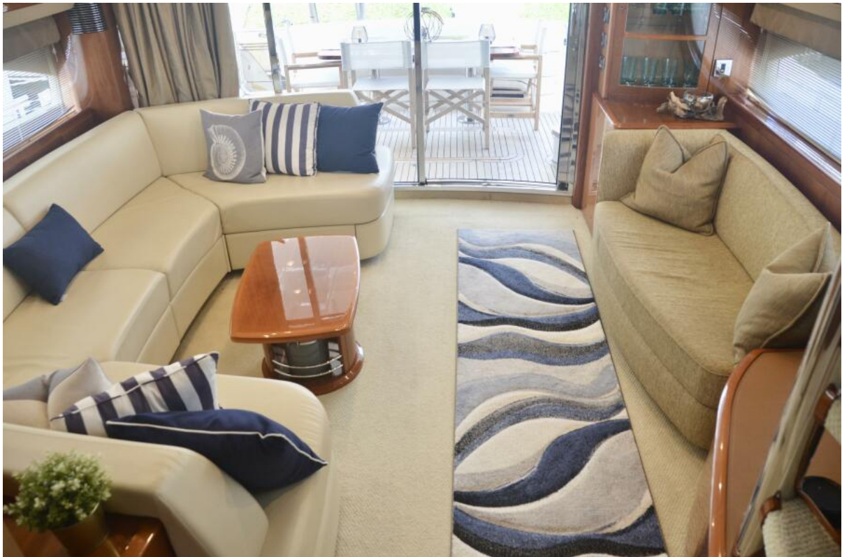
Princess 67 Flybridge Hoker-Salon 2006 67 Princess Flybridge Hoker