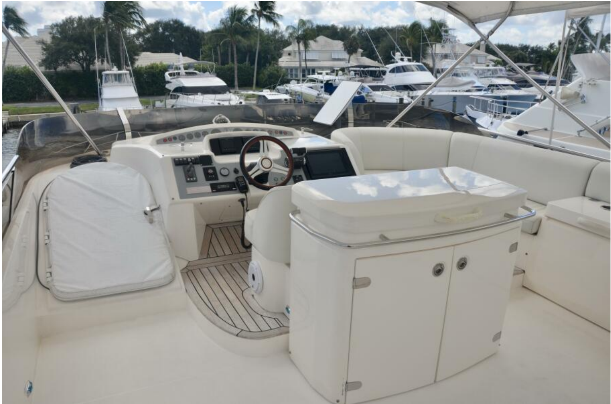
Princess 67 Flybridge Hoker-Flybridge 2006 67 Princess Flybridge Hoker