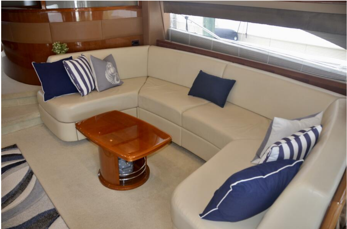
Princess 67 Flybridge Hoker-Salon 2006 67 Princess Flybridge Hoker