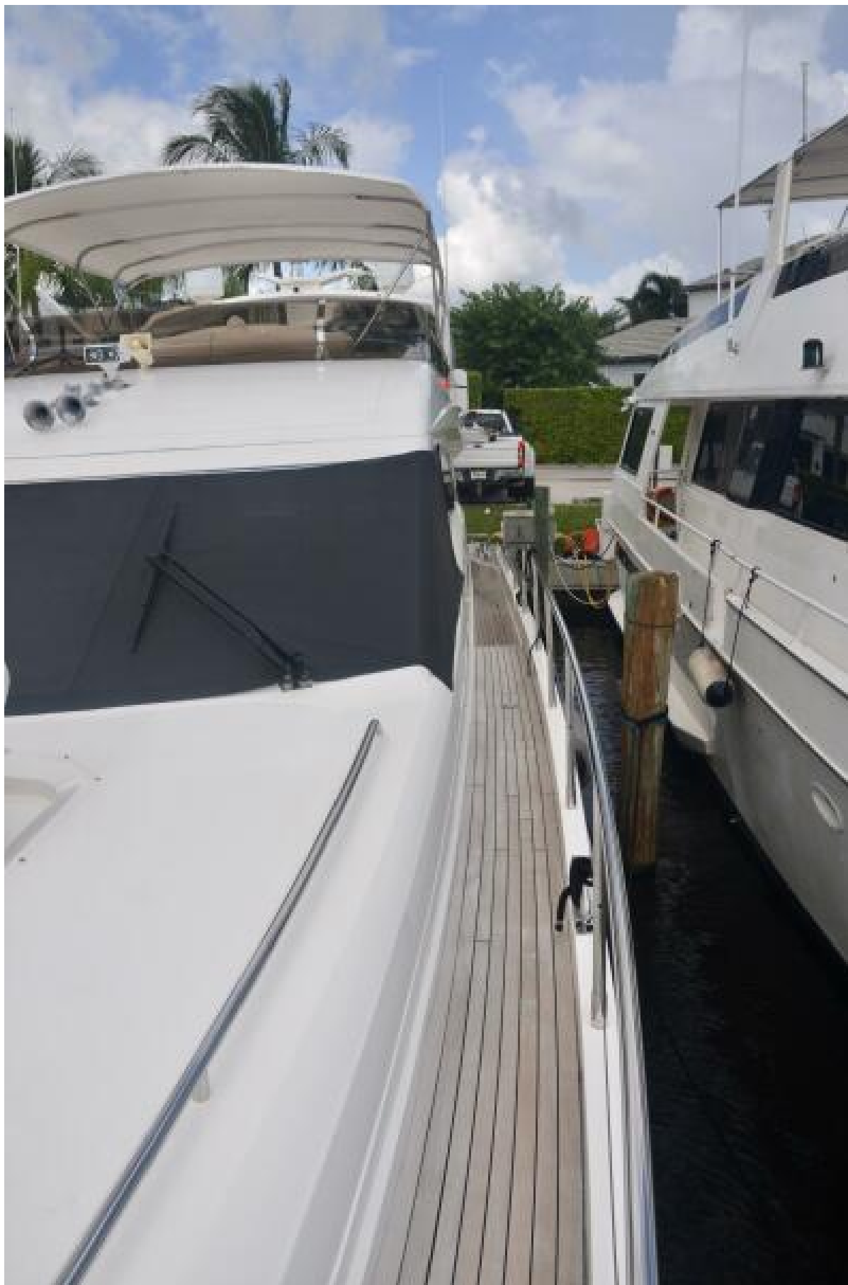
Princess 67 Flybridge Hoker-Sidedeck 2006 67 Princess Flybridge Hoker