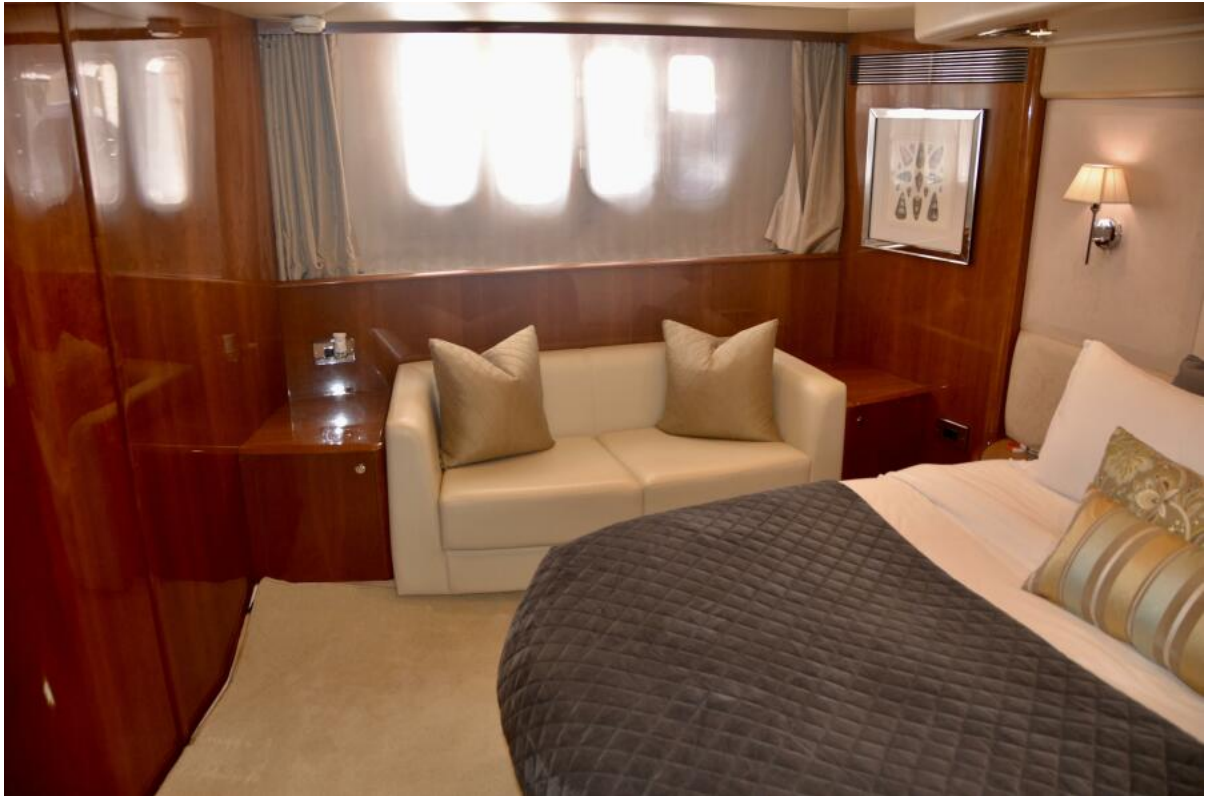
Princess 67 Flybridge Hoker-Master Stateroom 2006 67 Princess Flybridge Hoker