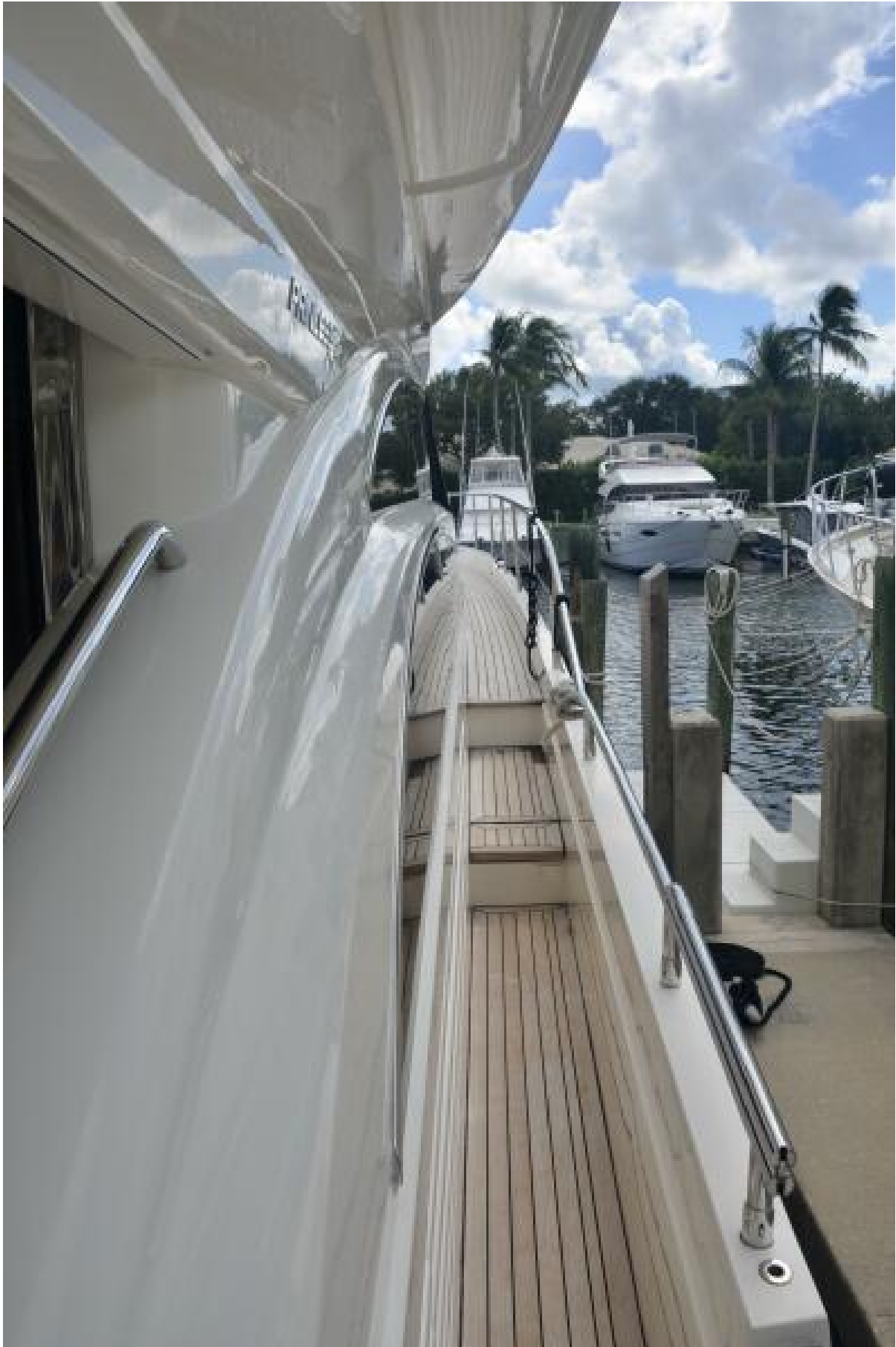
Princess 67 Flybridge Hoker-Sidedeck 2006 67 Princess Flybridge Hoker