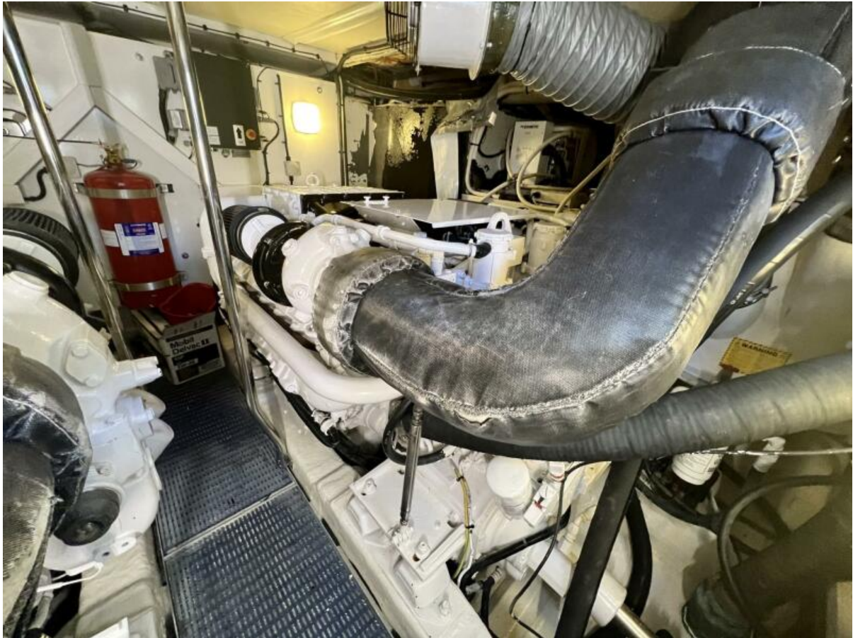
Princess 67 Flybridge Hoker-Engine Room 2006 67 Princess Flybridge Hoker