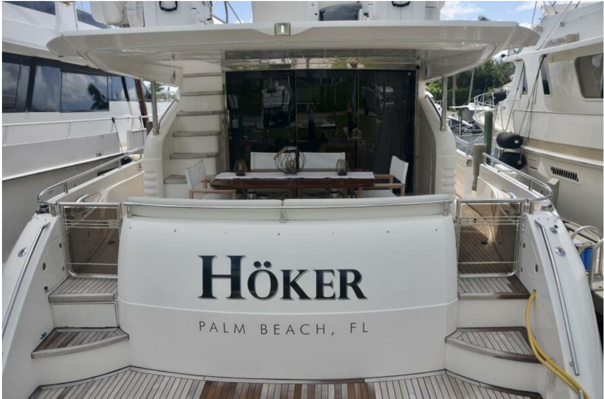
Princess 67 Flybridge Hoker- Transom 2006 67 Princess Flybridge Hoker