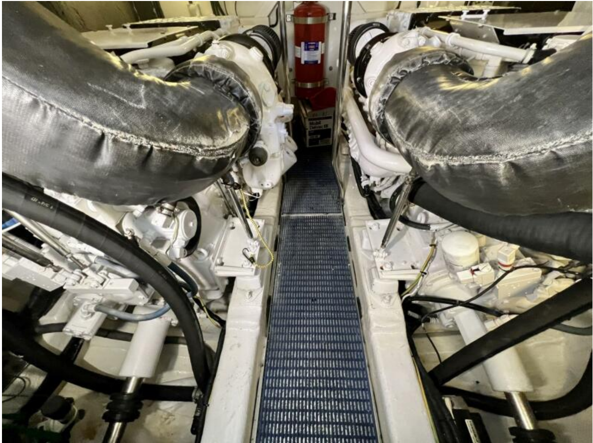
Princess 67 Flybridge Hoker-Engine Room 2006 67 Princess Flybridge Hoker