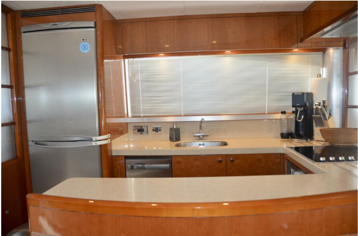
Princess 67 Flybridge Hoker-Galley 2006 67 Princess Flybridge Hoker