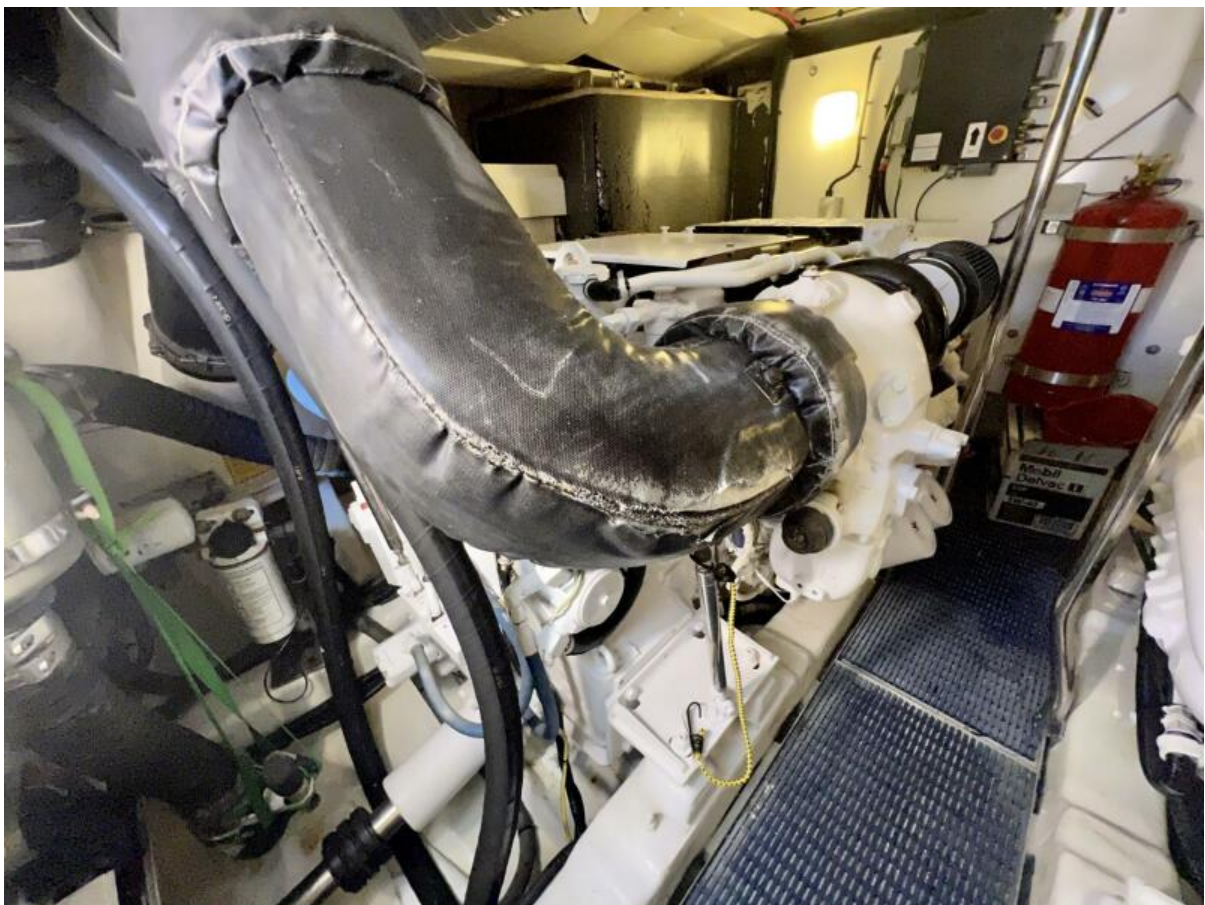
Princess 67 Flybridge Hoker-Engine Room 2006 67 Princess Flybridge Hoker