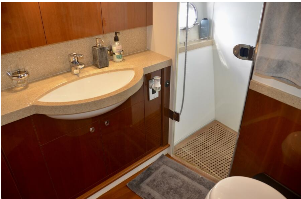
Princess 67 Flybridge Hoker-VIP Head 2006 67 Princess Flybridge Hoker