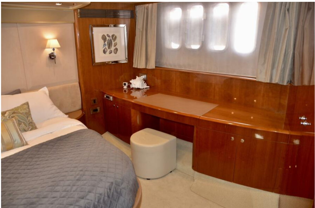
Princess 67 Flybridge Hoker-Master Stateroom 2006 67 Princess Flybridge Hoker