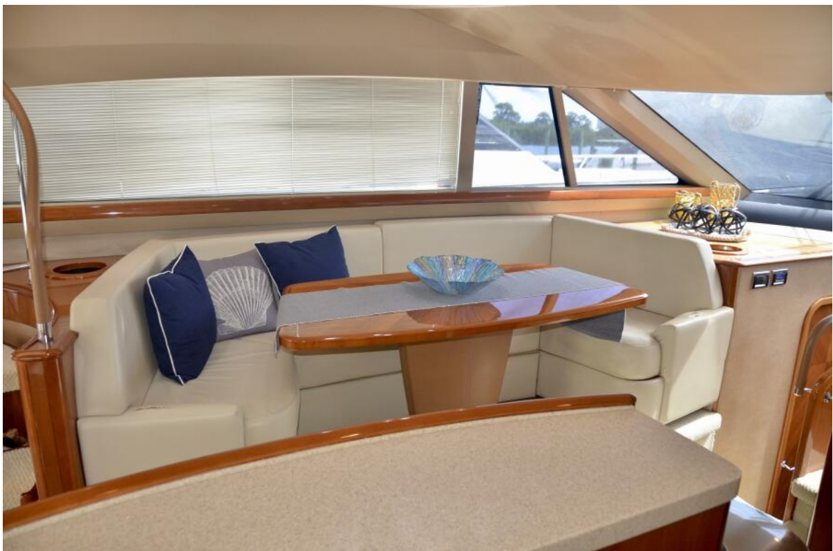
Princess 67 Flybridge Hoker-Salon 2006 67 Princess Flybridge Hoker