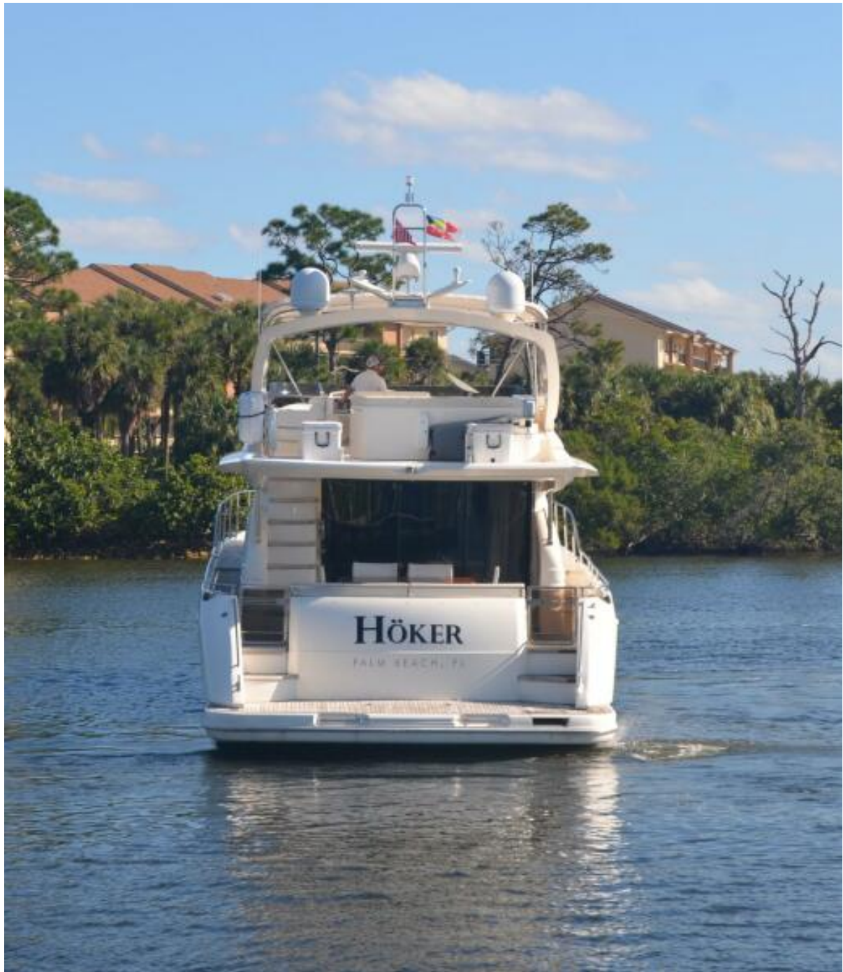
Princess 67 Flybridge Hoker- Profile 2006 67 Princess Flybridge Hoker