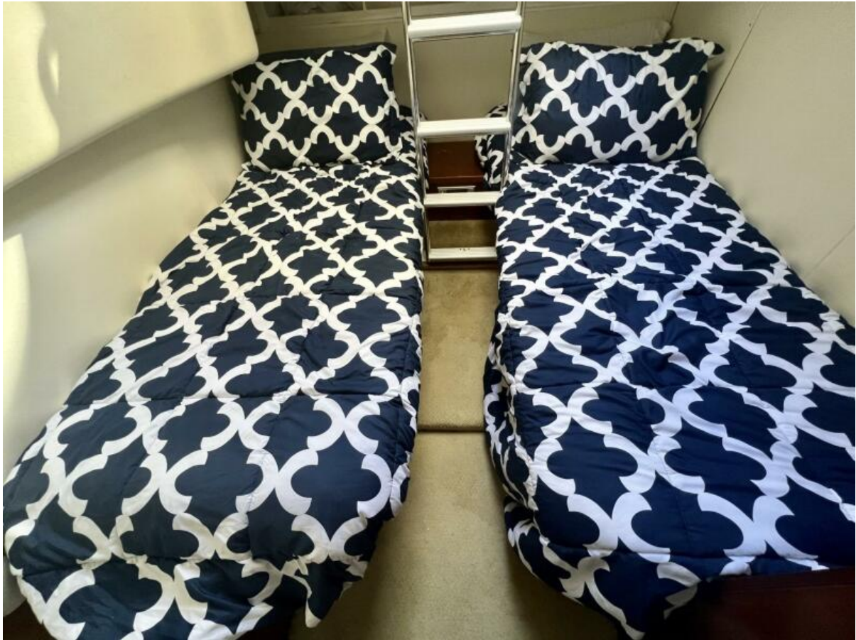
Princess 67 Flybridge Hoker-Guest Cabin 2006 67 Princess Flybridge Hoker