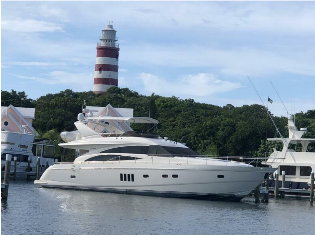
Princess 67 Flybridge Hoker- Profile 2006 67 Princess Flybridge Hoker