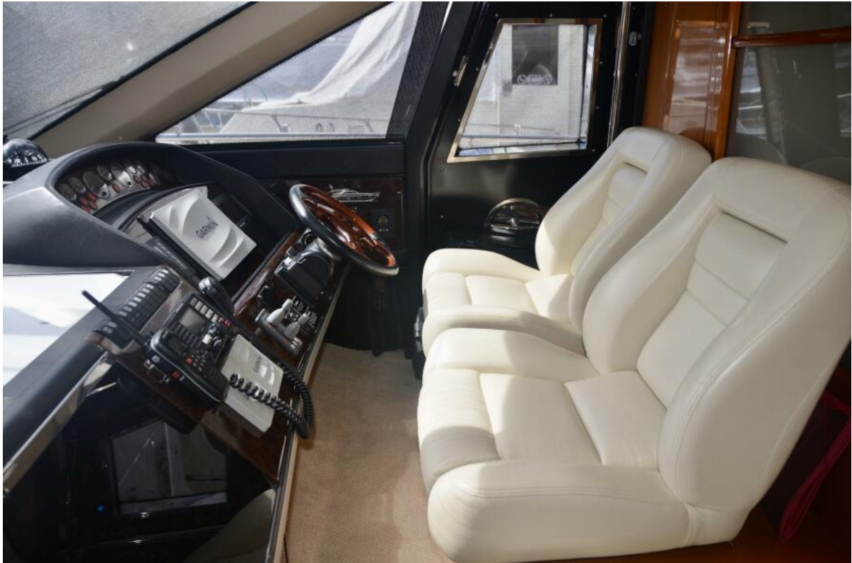
Princess 67 Flybridge Hoker-Lower Helm 2006 67 Princess Flybridge Hoker