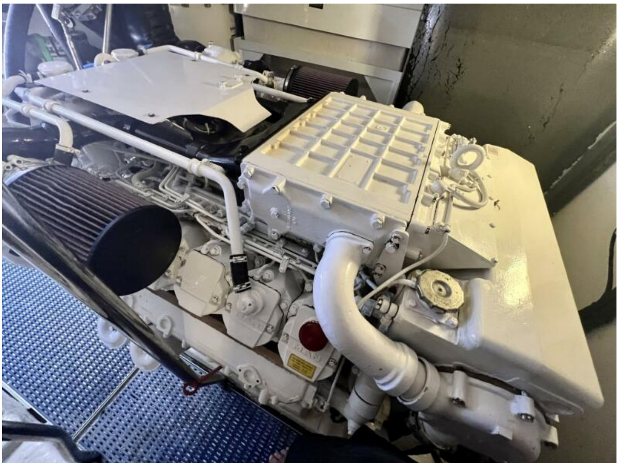
Princess 67 Flybridge Hoker-Engine Room 2006 67 Princess Flybridge Hoker