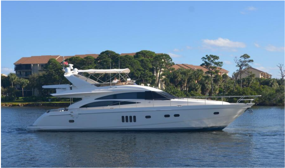
Princess 67 Flybridge Hoker- Profile 2006 67 Princess Flybridge Hoker