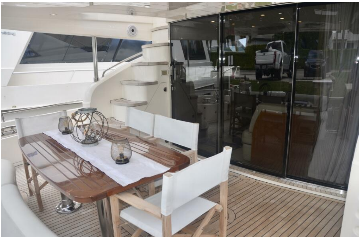
Princess 67 Flybridge Hoker-Aft Deck 2006 67 Princess Flybridge Hoker