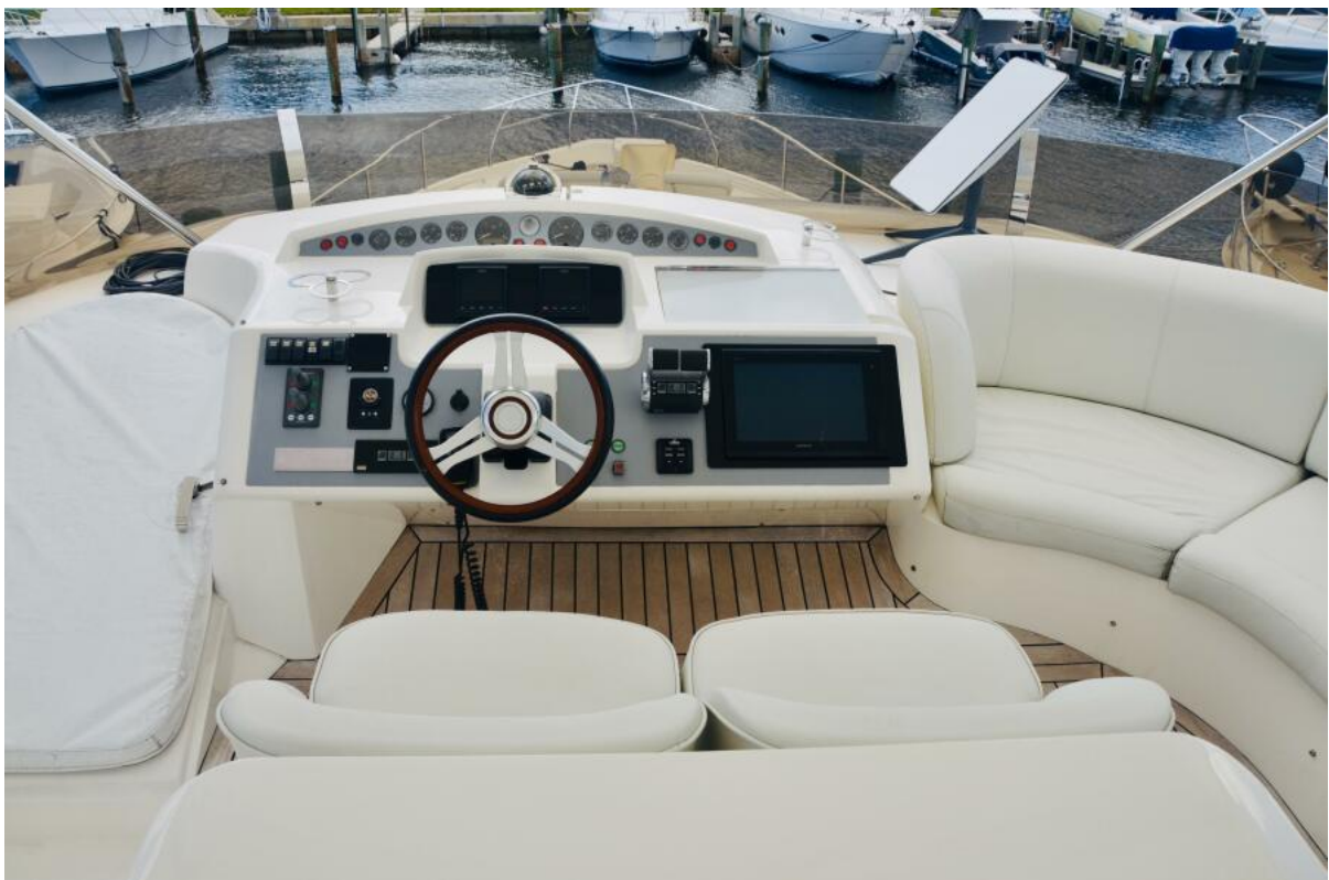
Princess 67 Flybridge Hoker-Flybridge 2006 67 Princess Flybridge Hoker