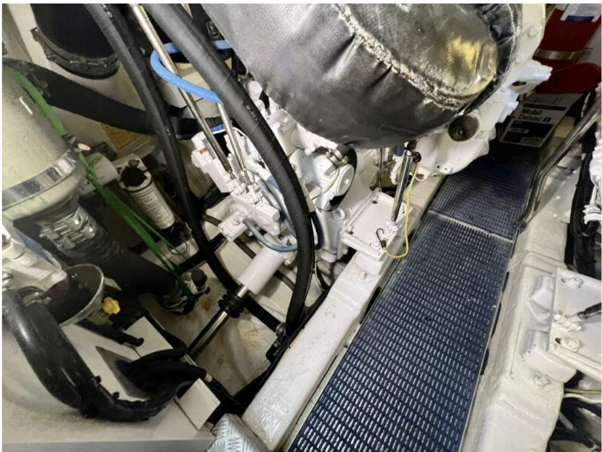
Princess 67 Flybridge Hoker-Engine Room 2006 67 Princess Flybridge Hoker