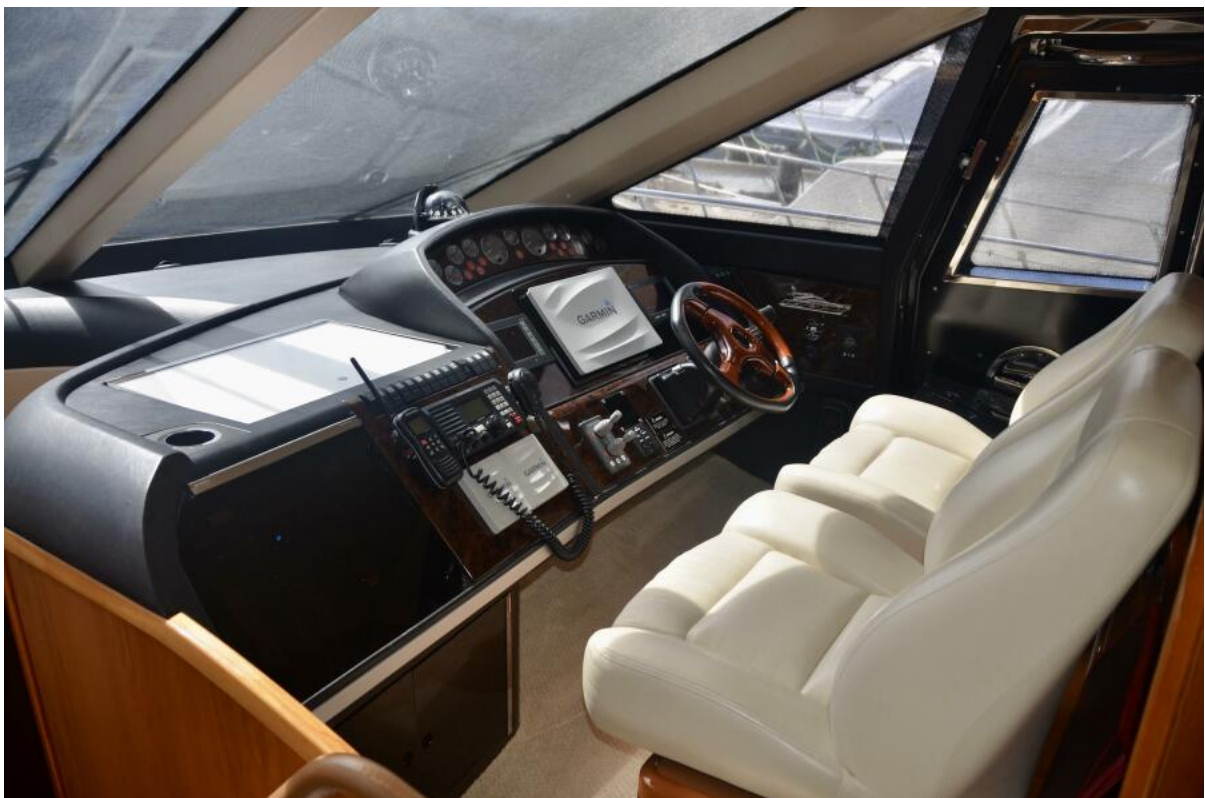
Princess 67 Flybridge Hoker-Lower Helm 2006 67 Princess Flybridge Hoker