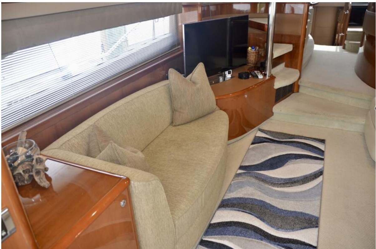
Princess 67 Flybridge Hoker-Salon 2006 67 Princess Flybridge Hoker