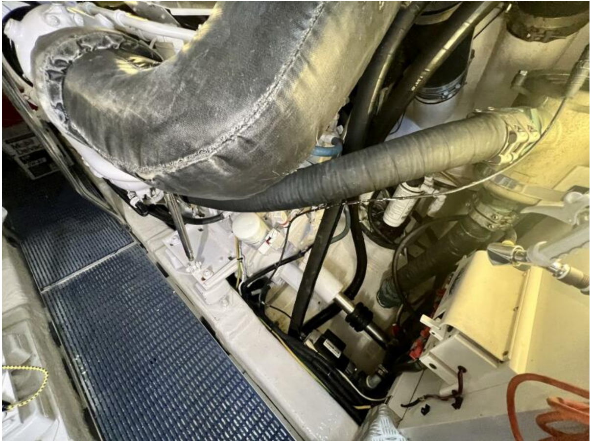
Princess 67 Flybridge Hoker-Engine Room 2006 67 Princess Flybridge Hoker