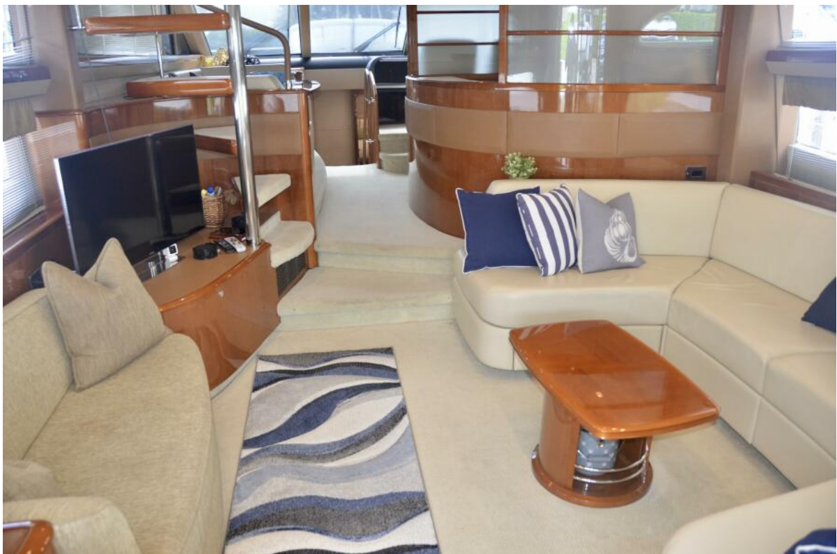
Princess 67 Flybridge Hoker-Salon 2006 67 Princess Flybridge Hoker