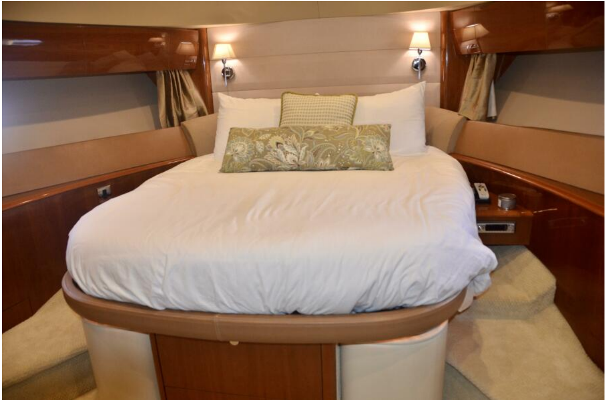
Princess 67 Flybridge Hoker-VIP Cabin 2006 67 Princess Flybridge Hoker