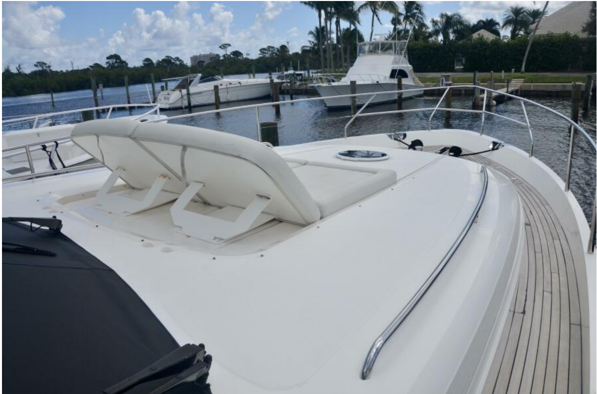
Princess 67 Flybridge Hoker-Bow 2006 67 Princess Flybridge Hoker