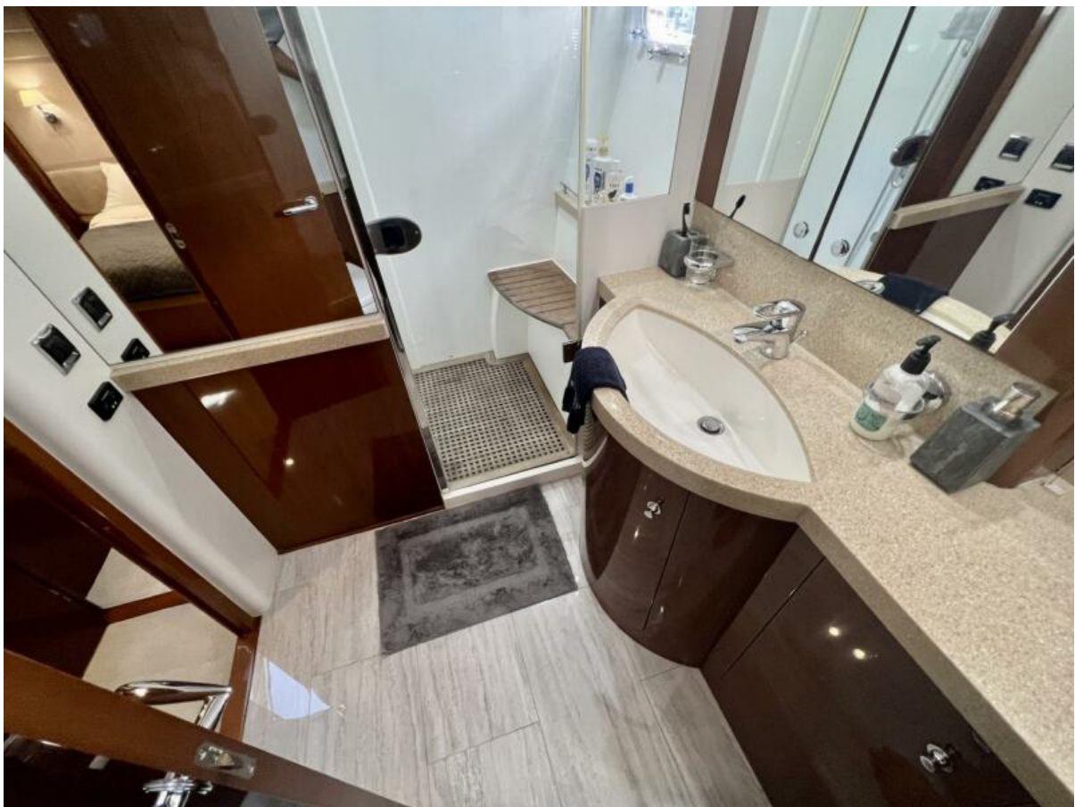
Princess 67 Flybridge Hoker-Guest Head 2006 67 Princess Flybridge Hoker