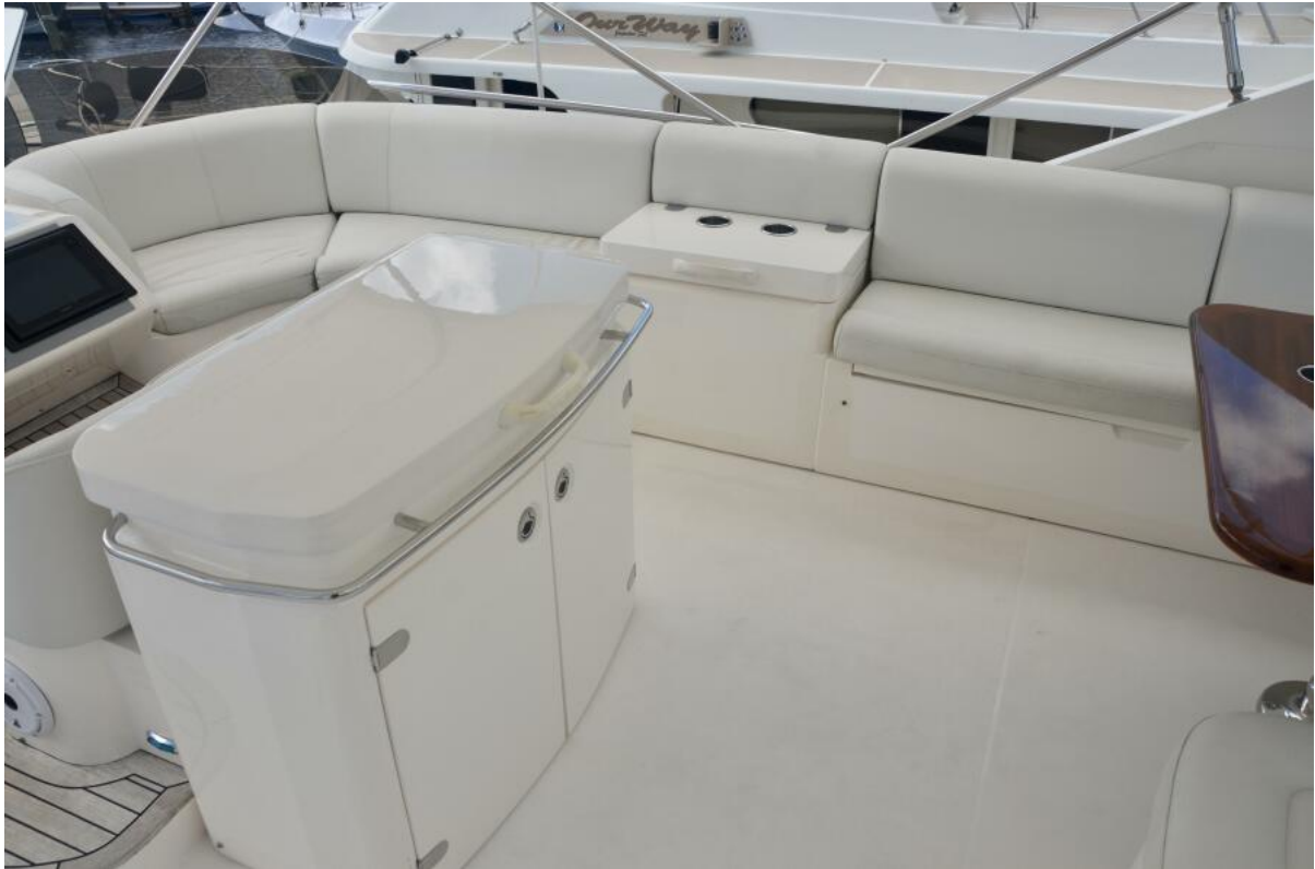
Princess 67 Flybridge Hoker-Flybridge 2006 67 Princess Flybridge Hoker