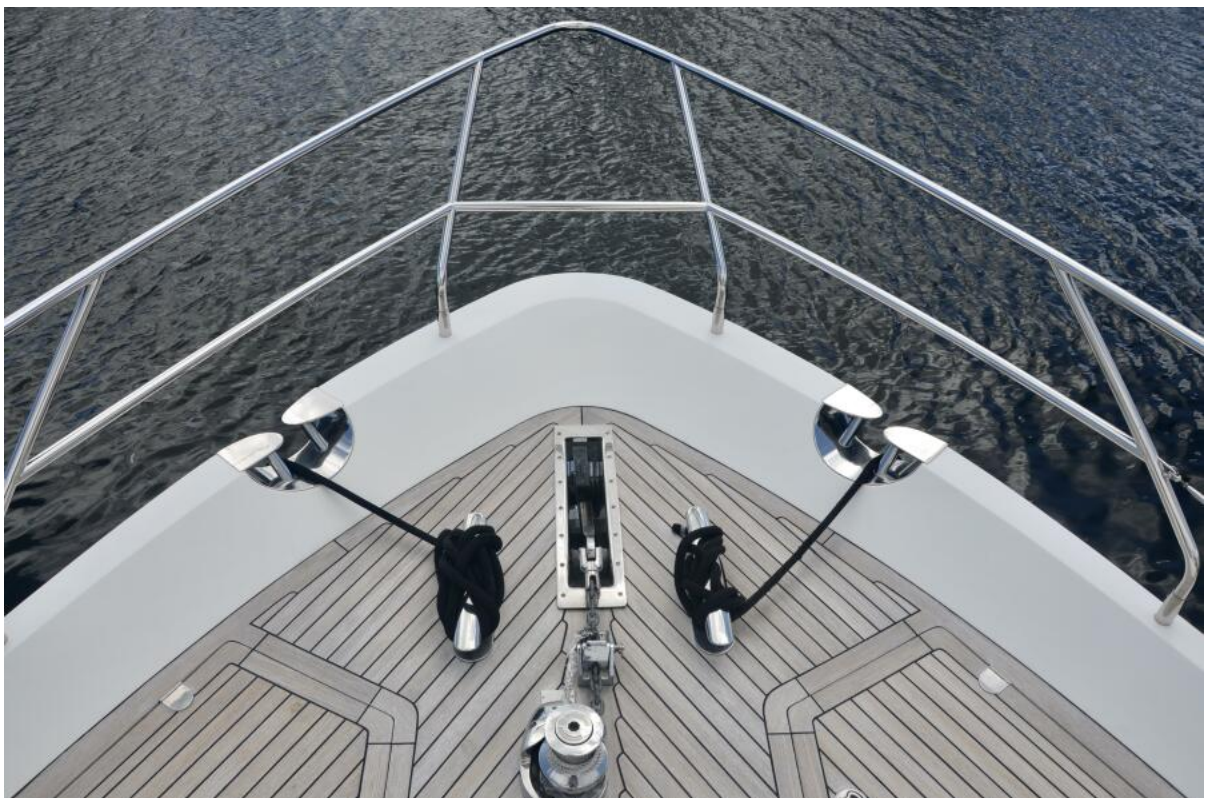
Princess 67 Flybridge Hoker-Windlass 2006 67 Princess Flybridge Hoker