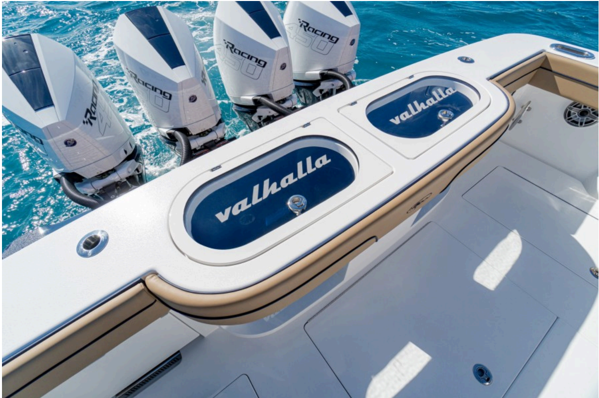
Valhalla 46 - Aft Live Well's 2022 Valhalla Boatworks V46