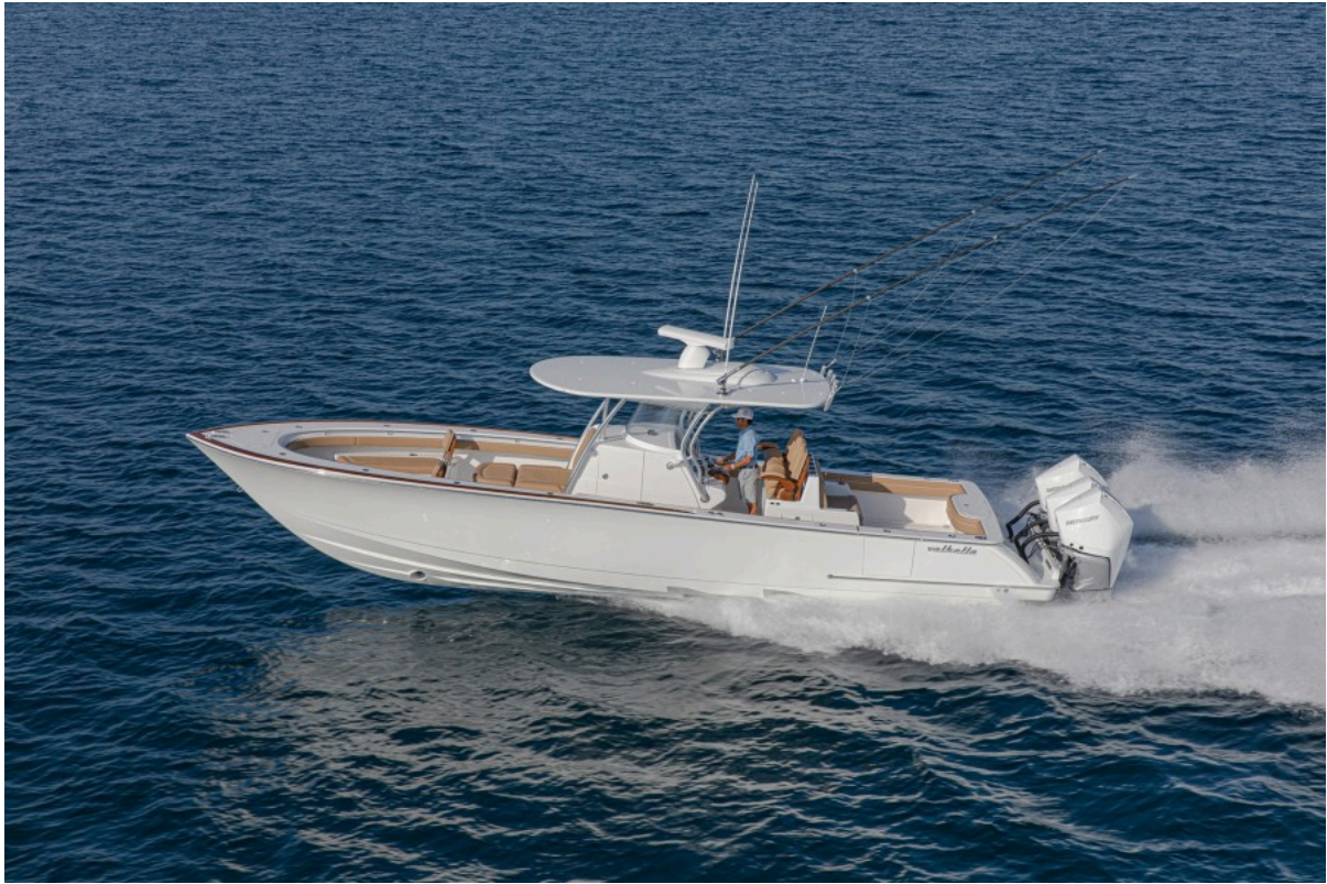
Valhalla 37 - Exterior Profile 2022 Valhalla Boatworks V37