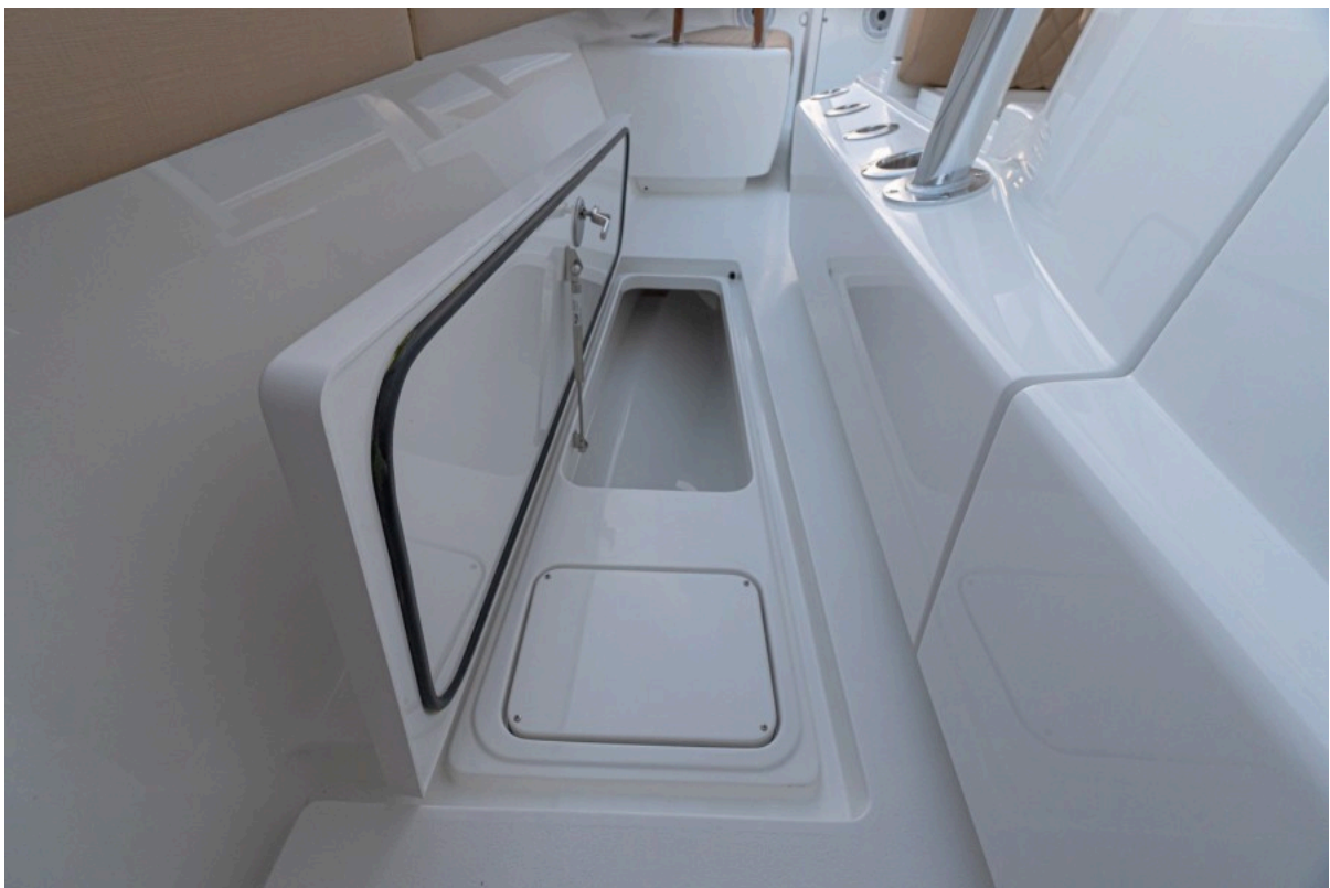
Valhalla 37 - Gunwale Storage 2022 Valhalla Boatworks V37