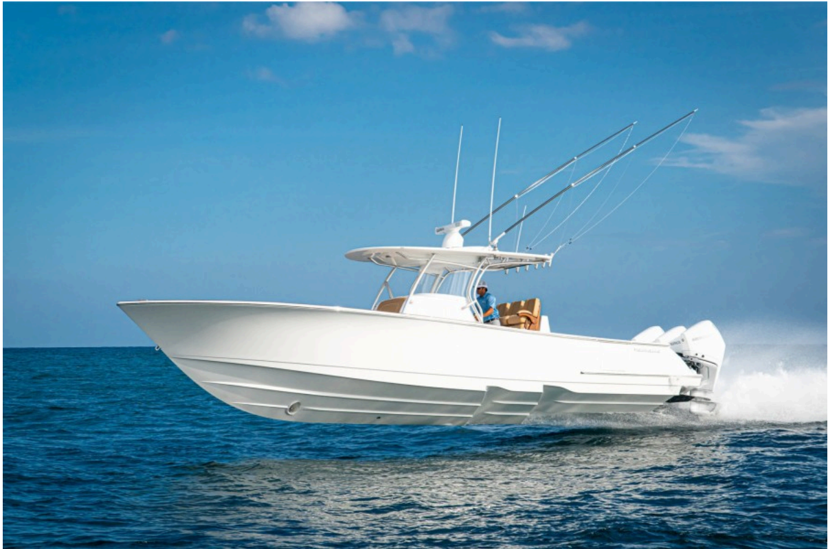
Valhalla 37 - Exterior Profile 2022 Valhalla Boatworks V37