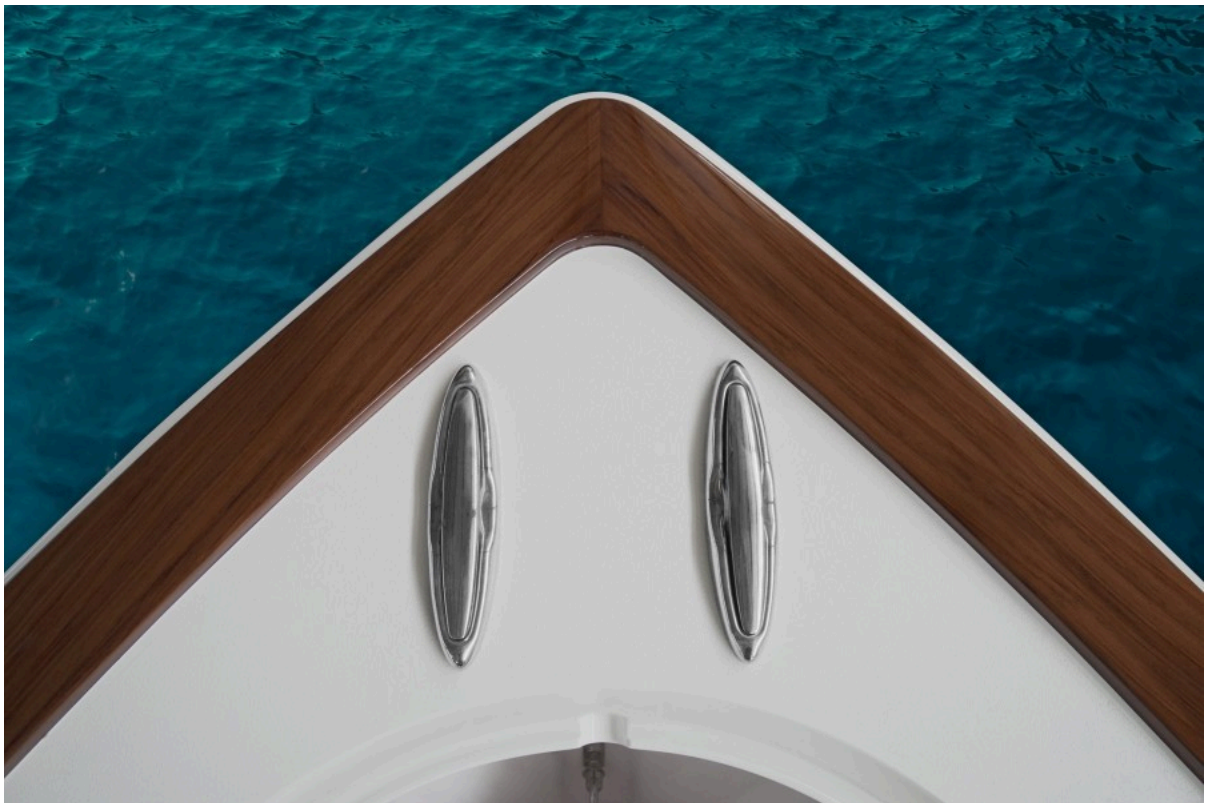
Valhalla 37 - Bow 2022 Valhalla Boatworks V37