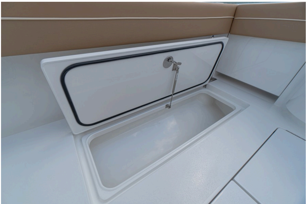
Valhalla 37 - Cockpit Storage 2022 Valhalla Boatworks V37