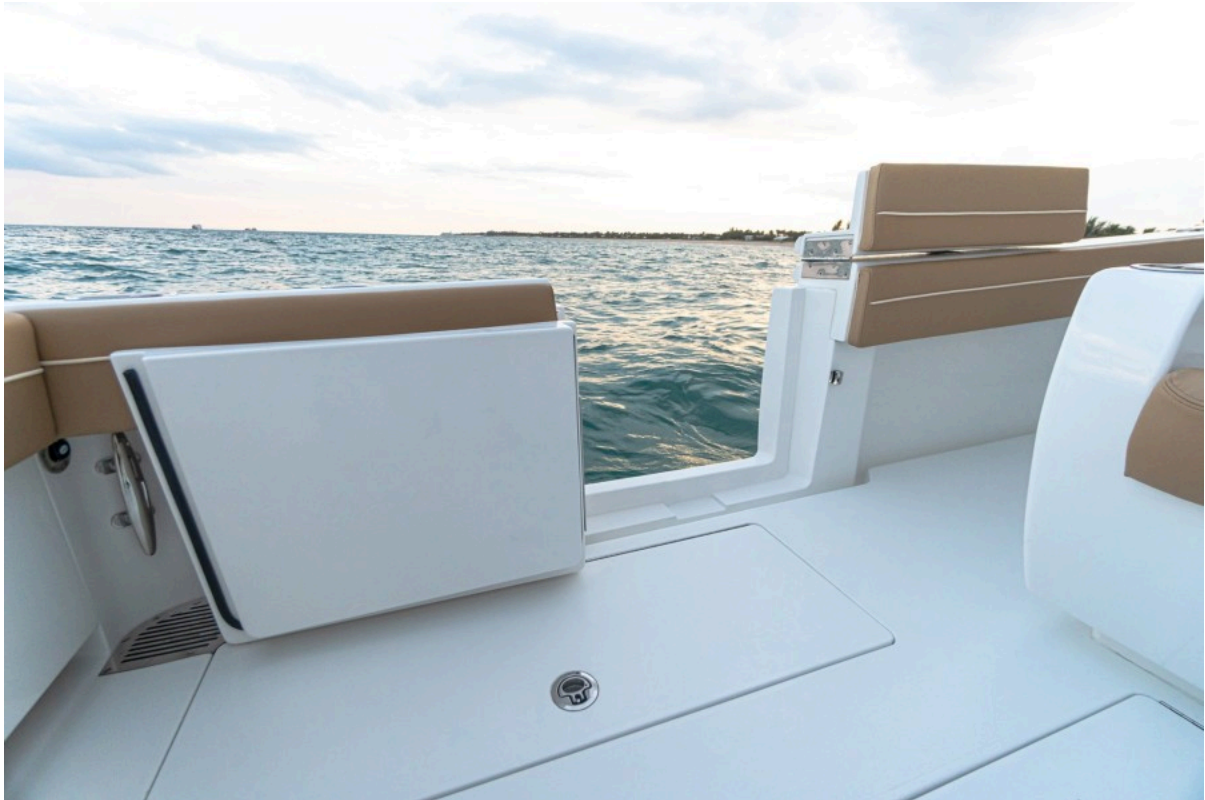
Valhalla 37 - Dive Door 2022 Valhalla Boatworks V37