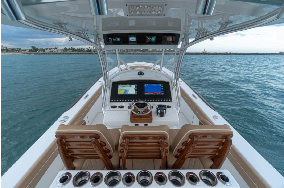
Valhalla 37 - Helm 2022 Valhalla Boatworks V37