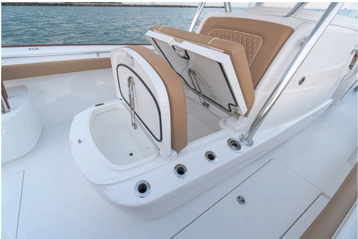
Valhalla 37 - Forward Storage 2022 Valhalla Boatworks V37