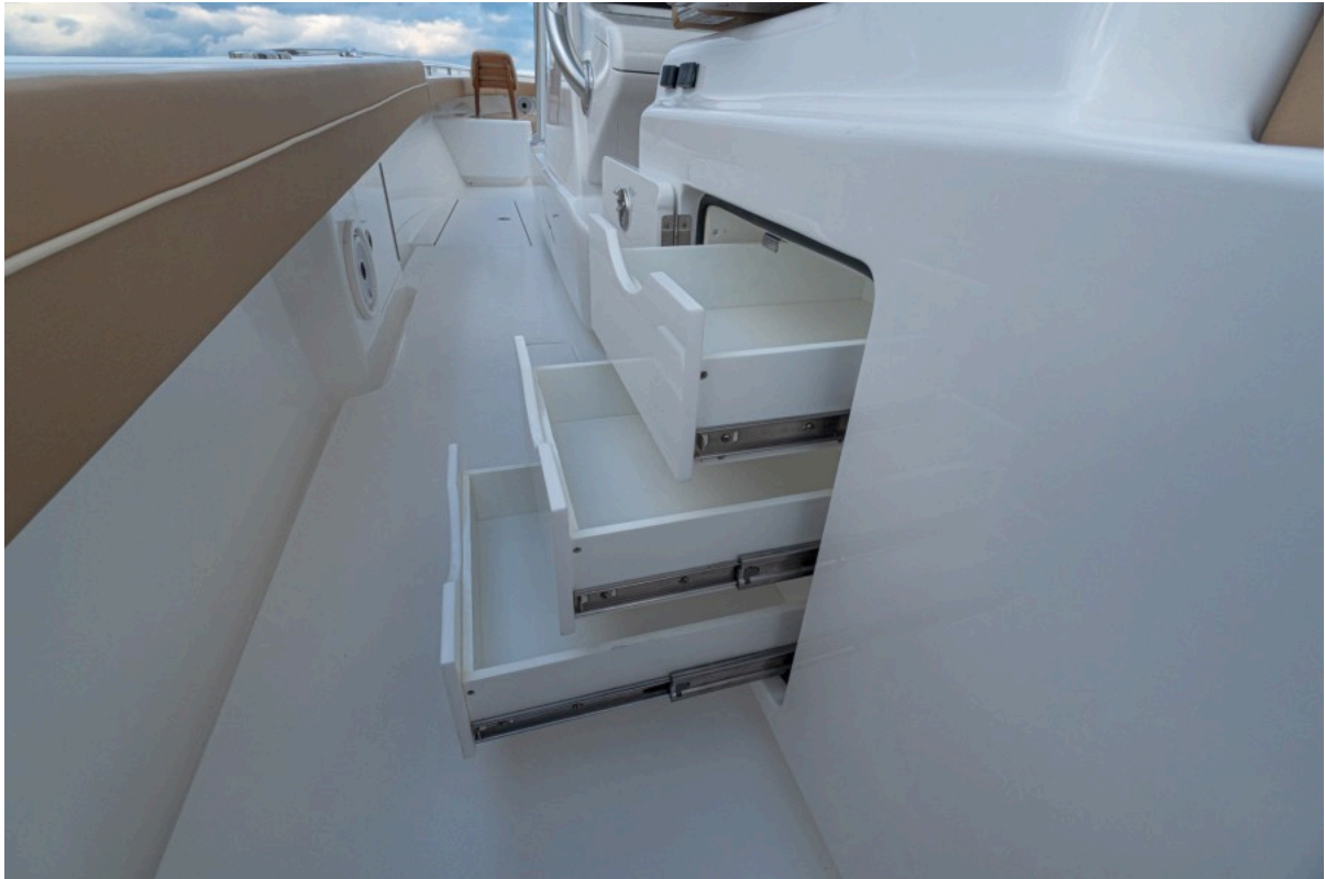
Valhalla 37 - Helm Storage 2022 Valhalla Boatworks V37