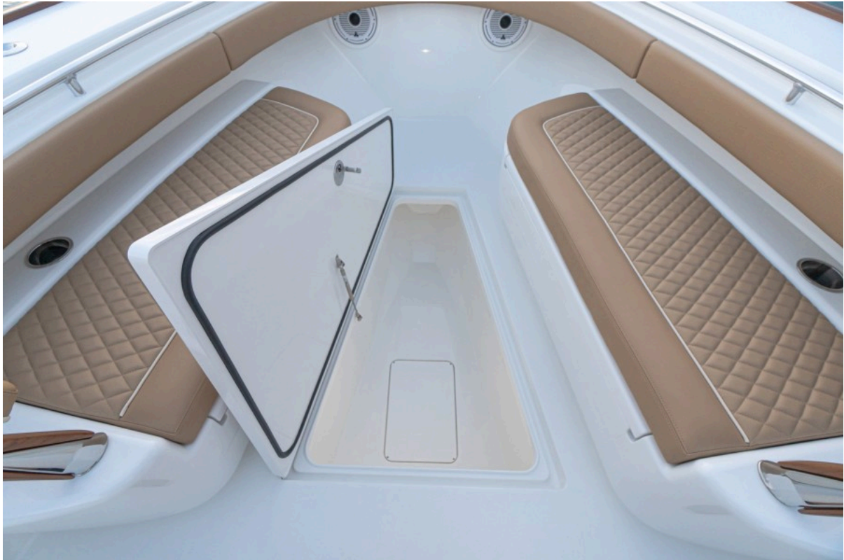
Valhalla 37 - Forward Storage 2022 Valhalla Boatworks V37