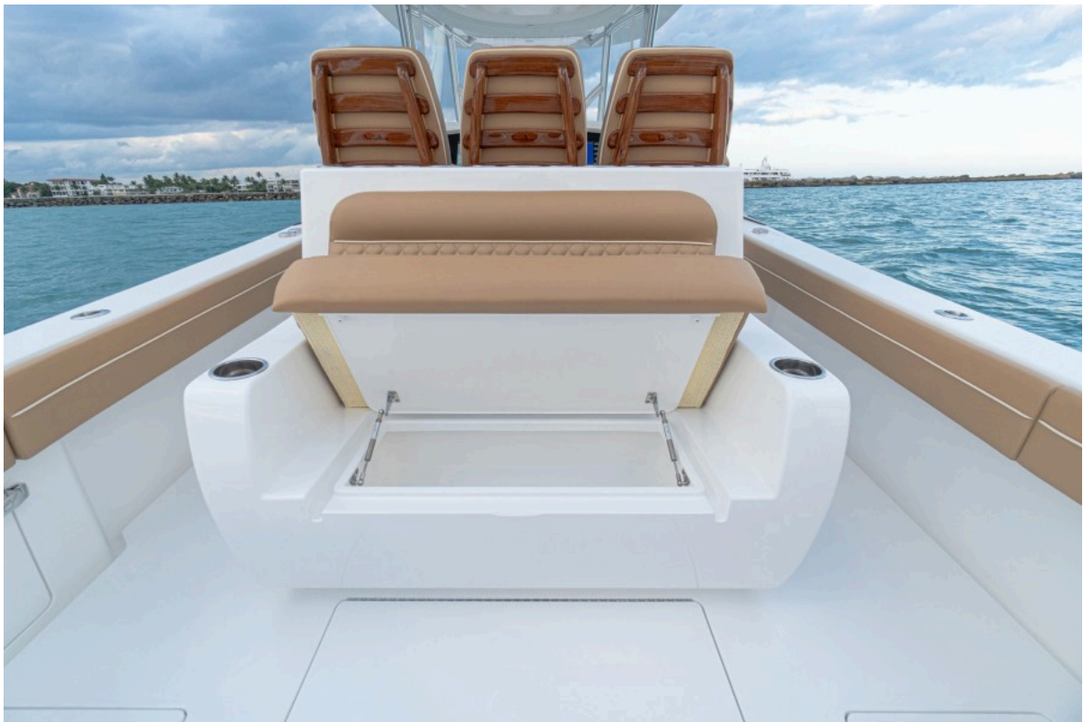
Valhalla 37 - Aft Storage 2022 Valhalla Boatworks V37