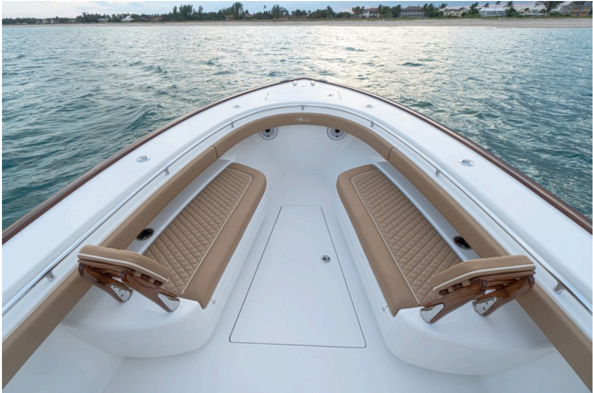
Valhalla 37 - Forward Seating 2022 Valhalla Boatworks V37