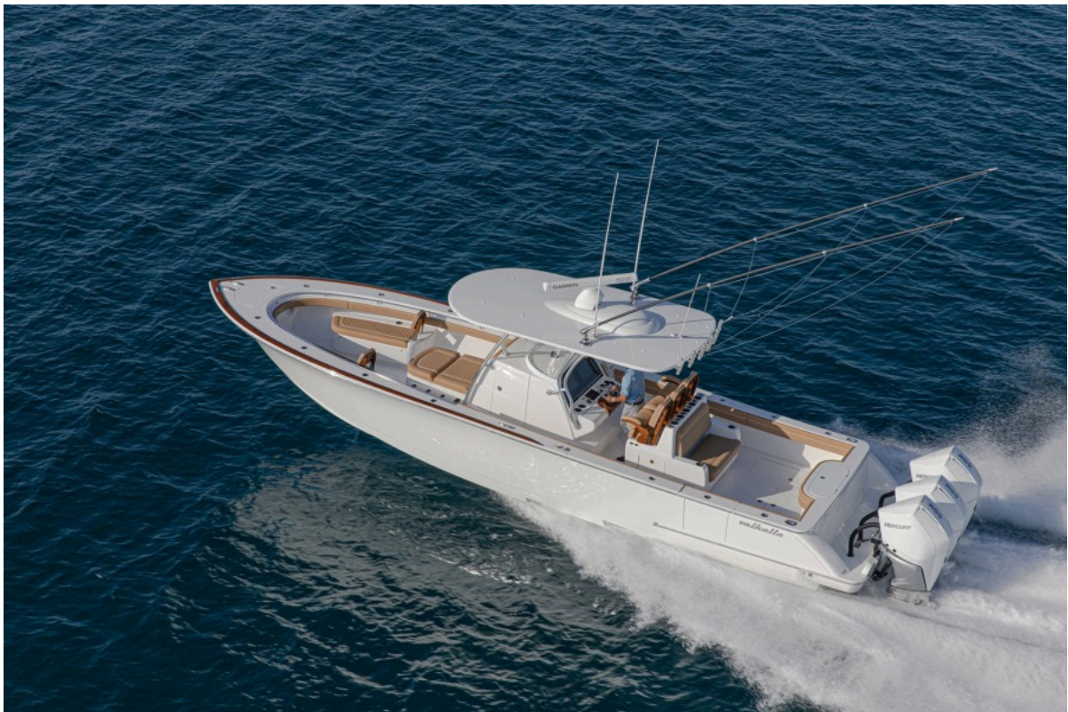
Valhalla 37 - Exterior Profile 2022 Valhalla Boatworks V37