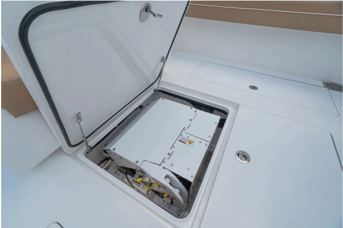
Valhalla 37 - Generator 2022 Valhalla Boatworks V37