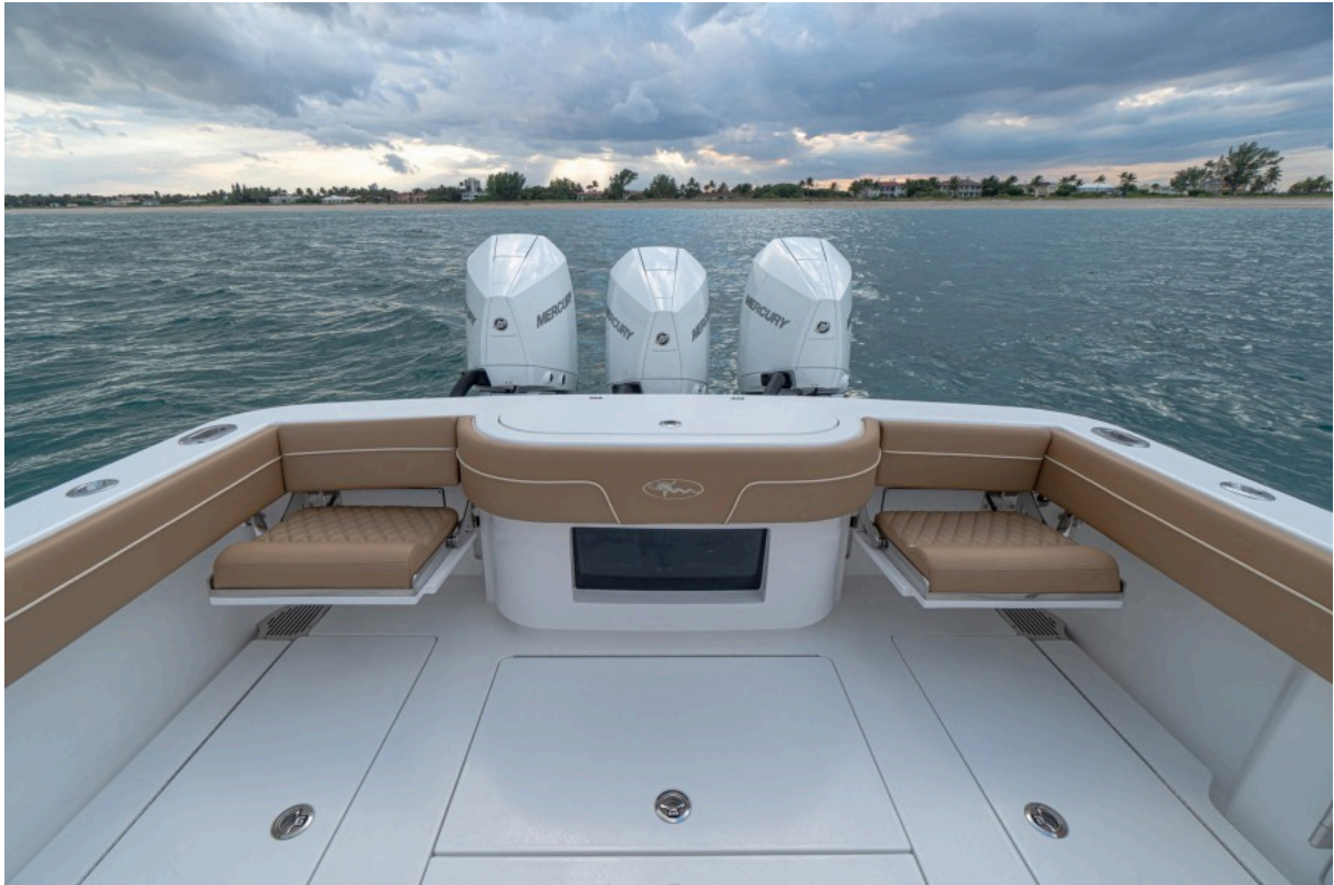
Valhalla 37 - Cockpit Seating 2022 Valhalla Boatworks V37