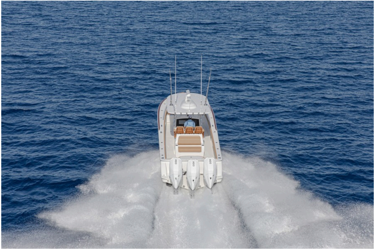
Valhalla 37 - Exterior Profile 2022 Valhalla Boatworks V37