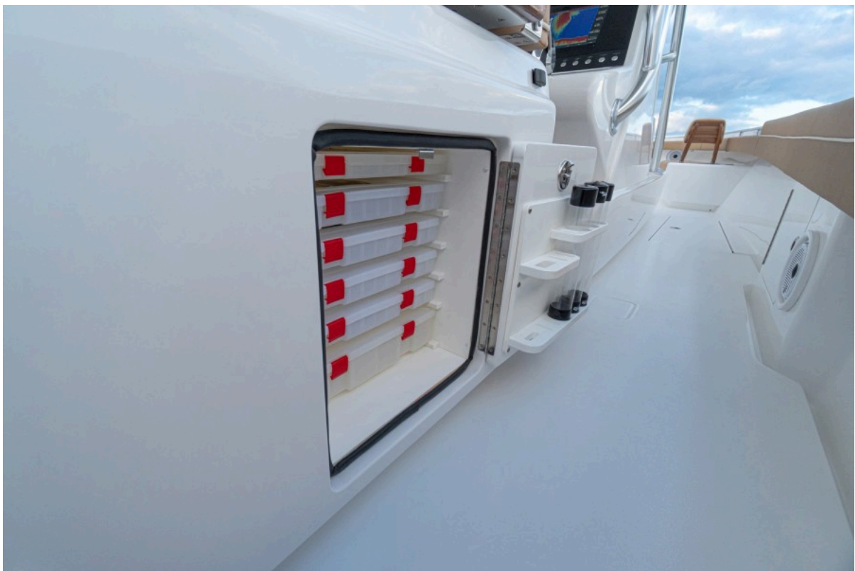
Valhalla 37 - Helm Storage 2022 Valhalla Boatworks V37