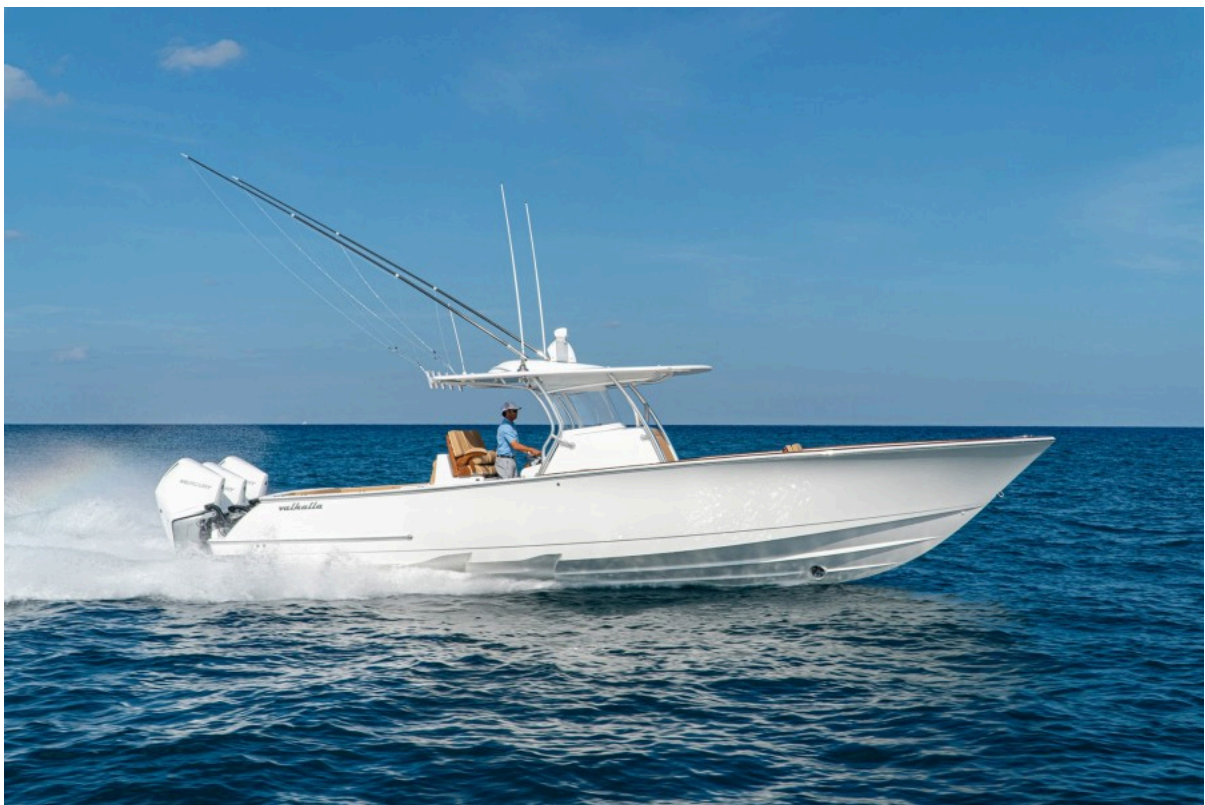
Valhalla 37 - Exterior Profile 2022 Valhalla Boatworks V37