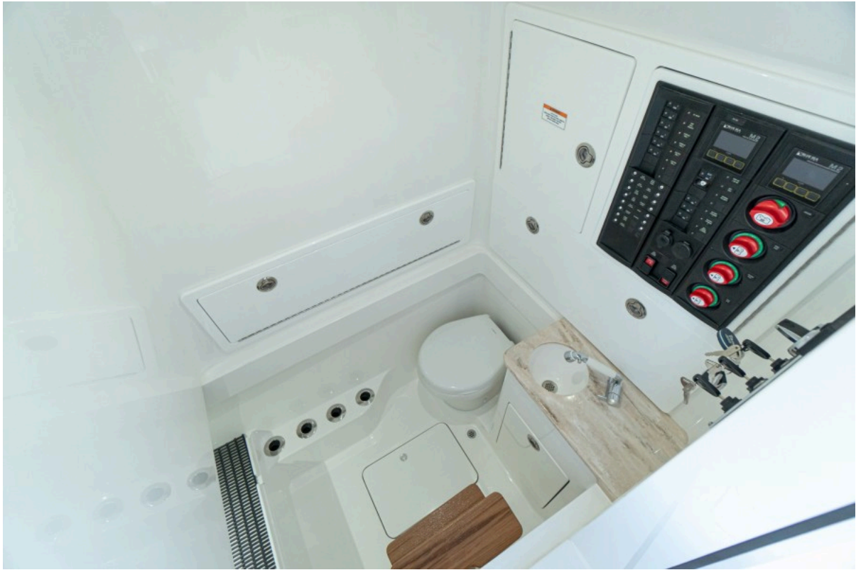
Valhalla 37 - Head 2022 Valhalla Boatworks V37