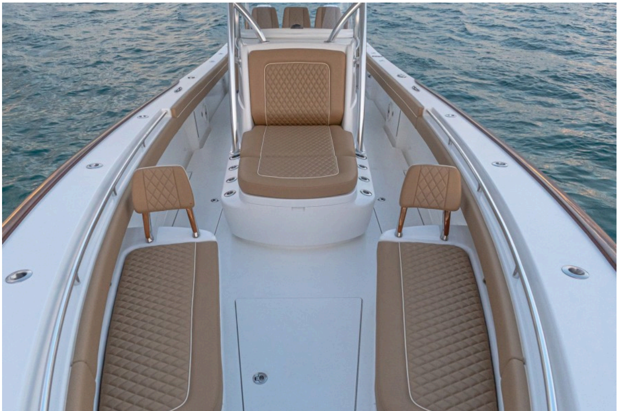
Valhalla 37 - Forward Seating 2022 Valhalla Boatworks V37