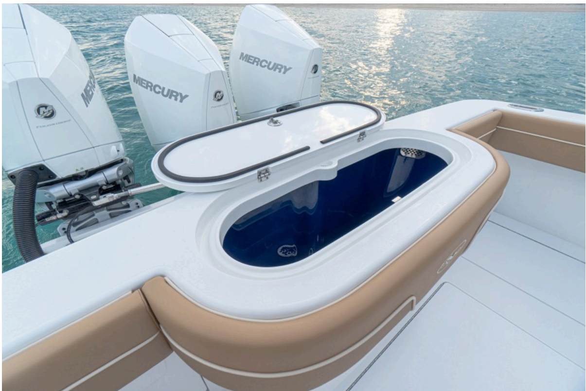
Valhalla 37 - Live Well 2022 Valhalla Boatworks V37