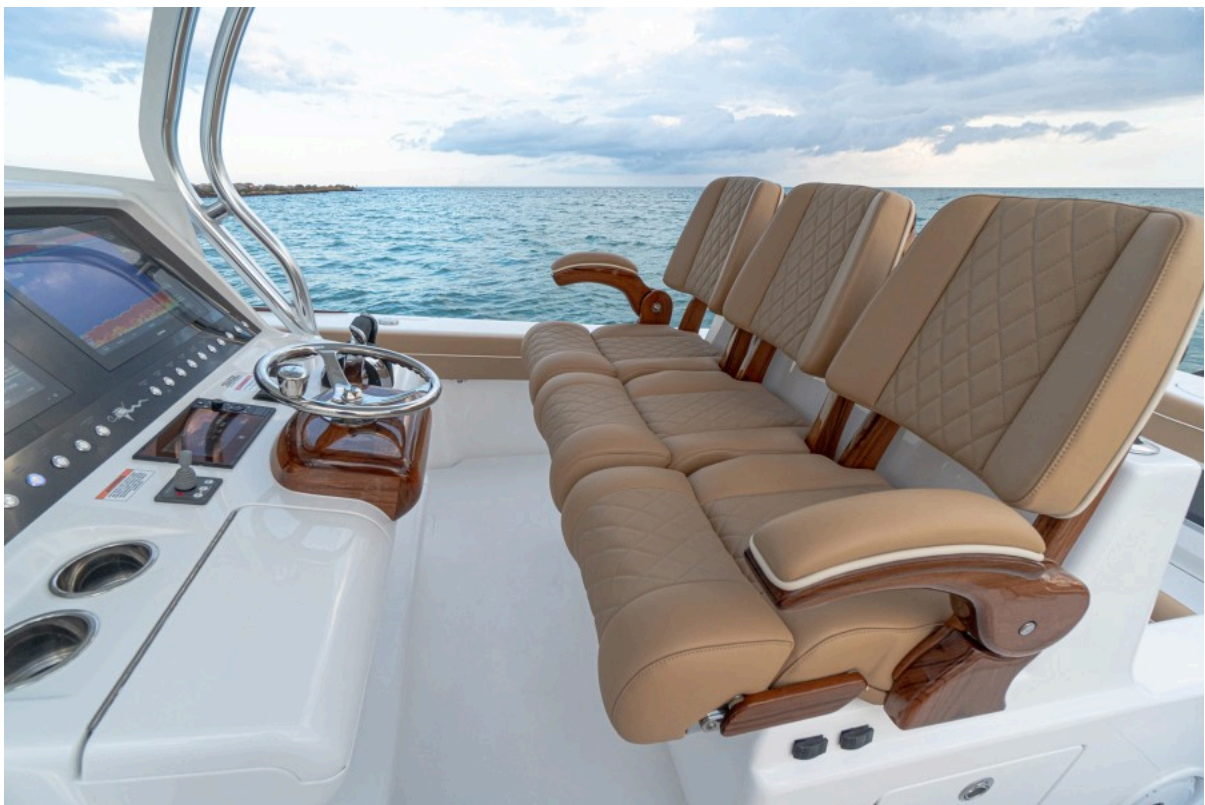
Valhalla 37 - Helm Seating 2022 Valhalla Boatworks V37