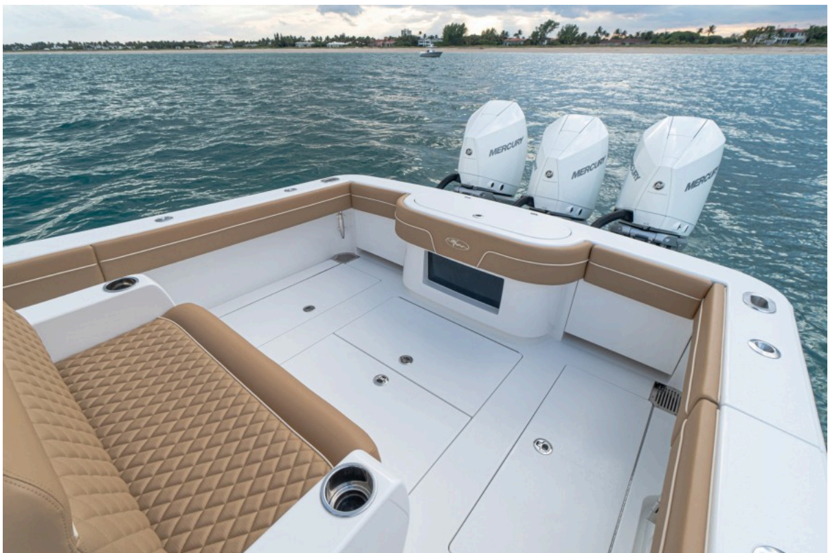
Valhalla 37 - Cockpit 2022 Valhalla Boatworks V37