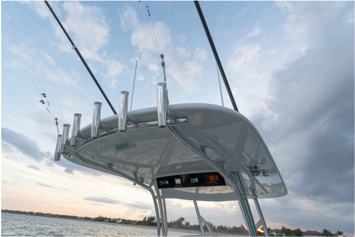
Valhalla 37 - Rod Holders 2022 Valhalla Boatworks V37