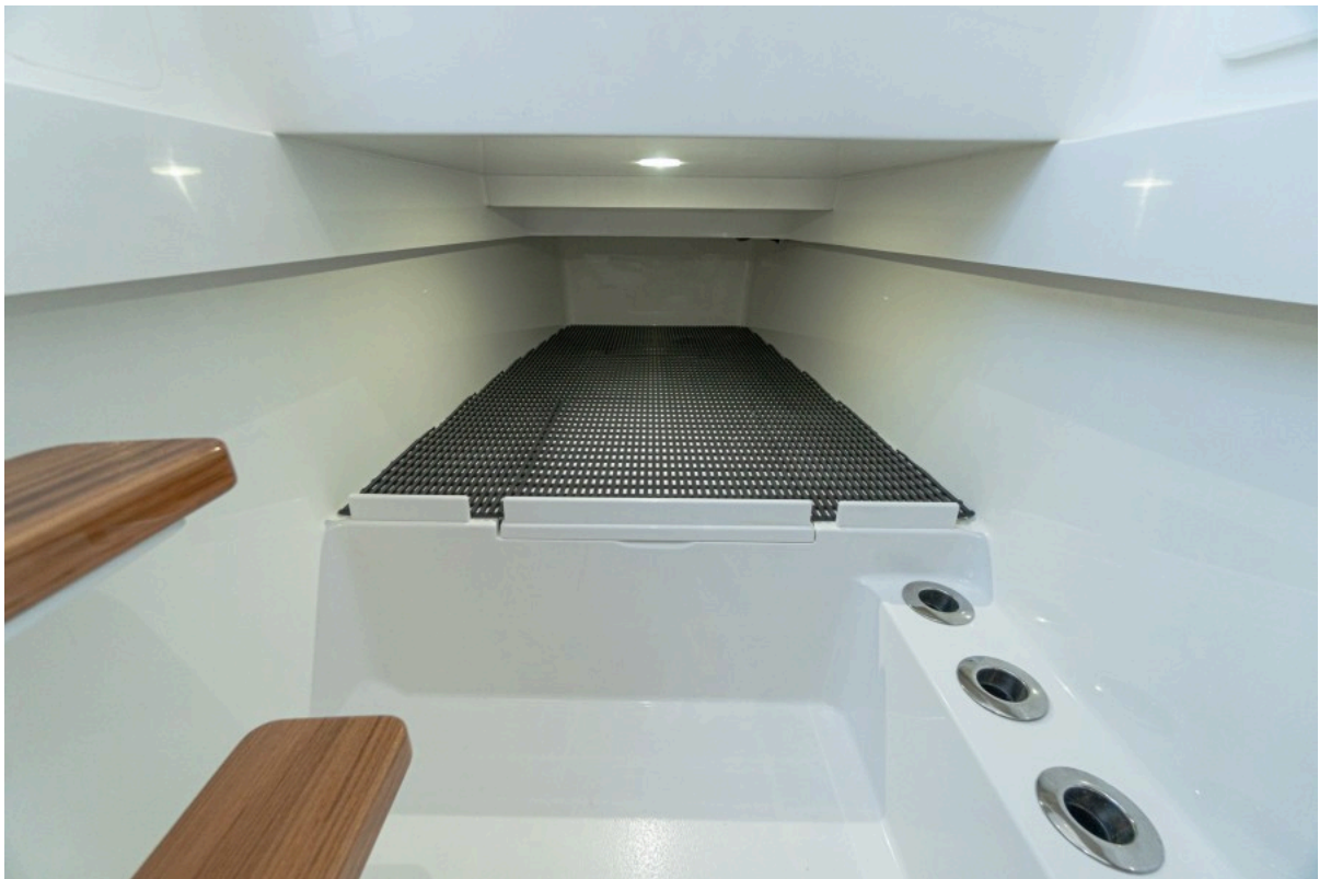
Valhalla 37 - Cabin 2022 Valhalla Boatworks V37