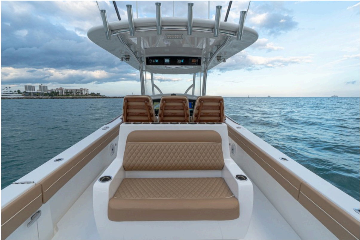
Valhalla 37 - Aft Seating 2022 Valhalla Boatworks V37