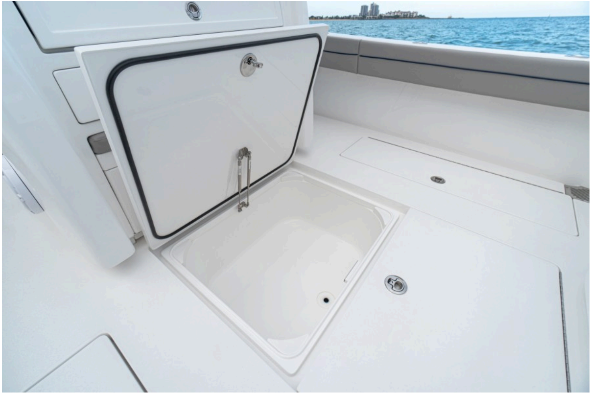
Valhalla 33 - Aft Storage 2022 Valhalla Boatworks V33