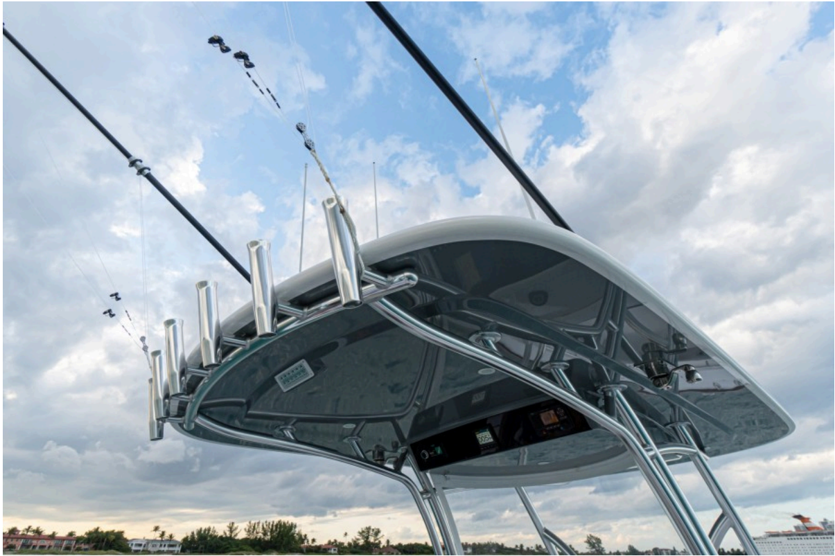
Valhalla 33 - Rod Holders 2022 Valhalla Boatworks V33