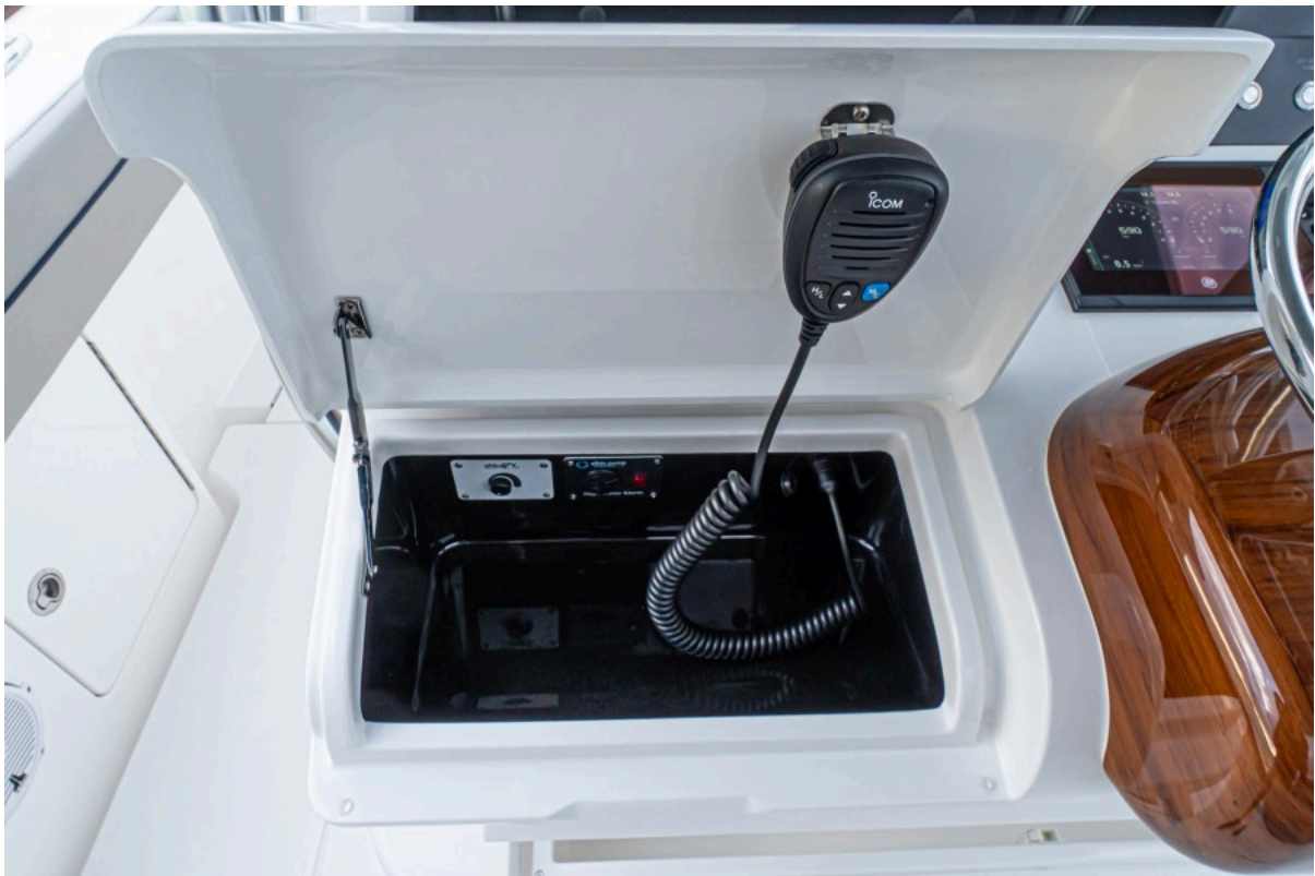
Valhalla 33 - Helm Electronics 2022 Valhalla Boatworks V33