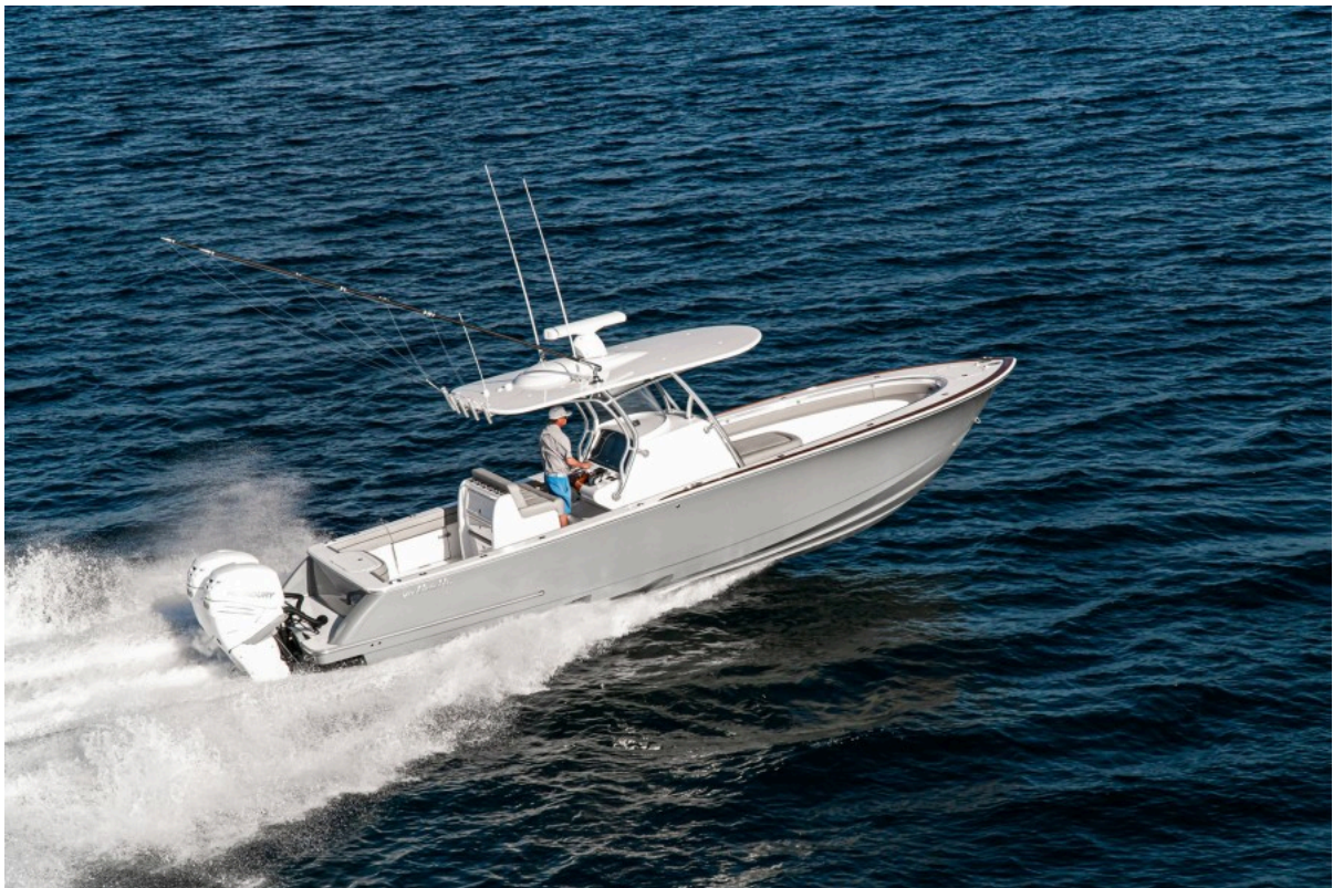
Valhalla 33 - Exterior Profile 2022 Valhalla Boatworks V33