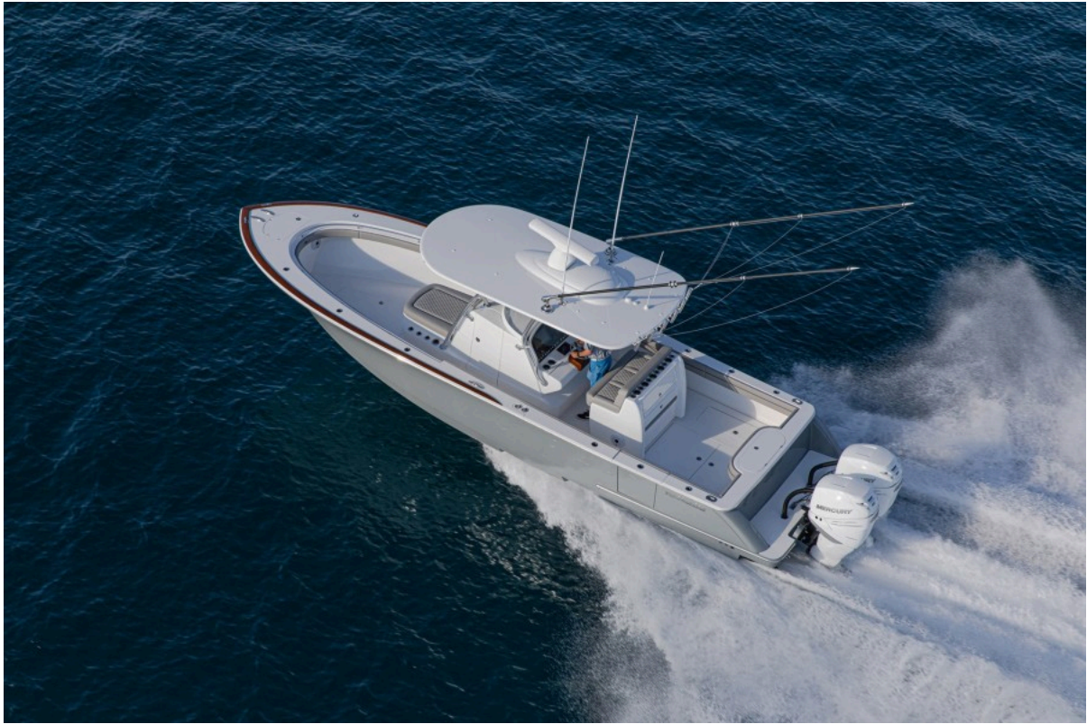
Valhalla 33 - Exterior Profile 2022 Valhalla Boatworks V33