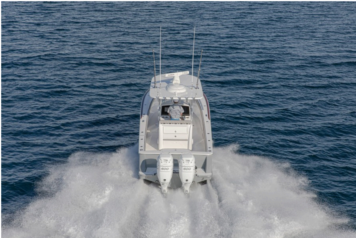
Valhalla 33 - Exterior Profile 2022 Valhalla Boatworks V33