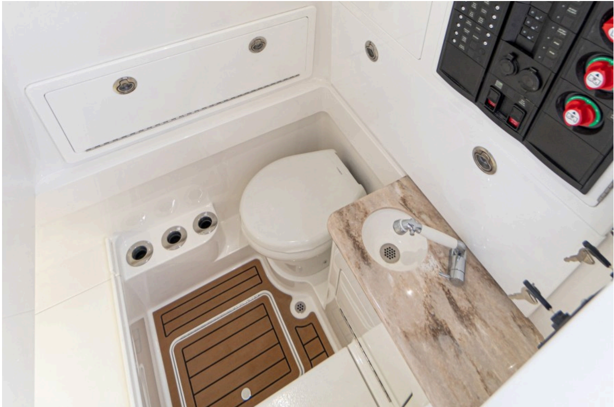
Valhalla 33 - Head 2022 Valhalla Boatworks V33