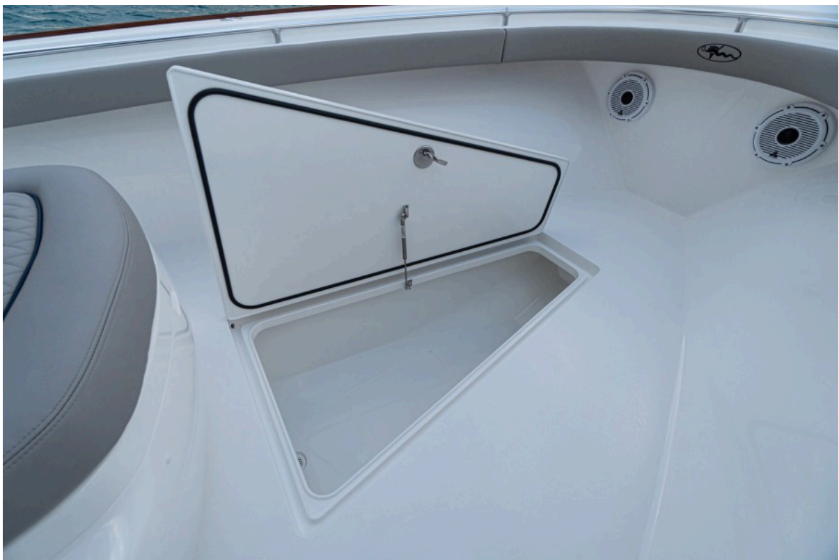
Valhalla 33 - Forward Storage 2022 Valhalla Boatworks V33