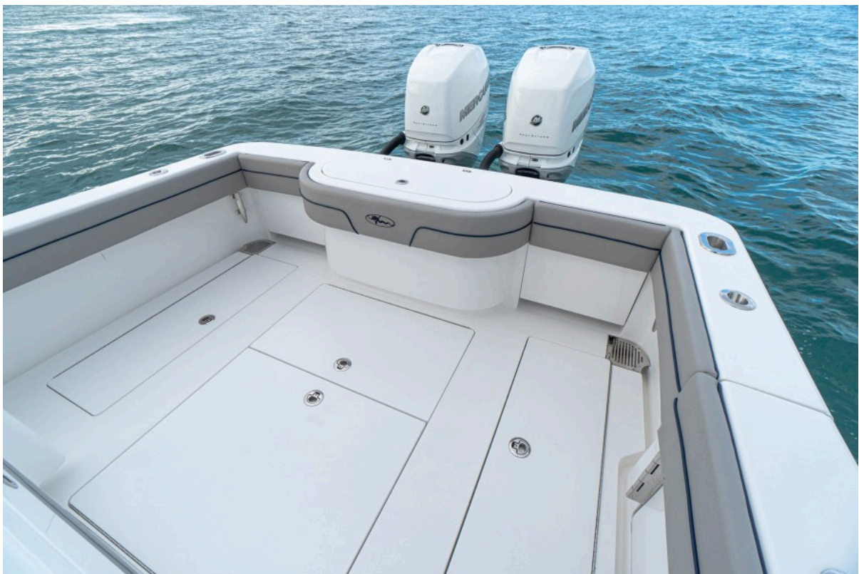
Valhalla 33 - Cockpit 2022 Valhalla Boatworks V33