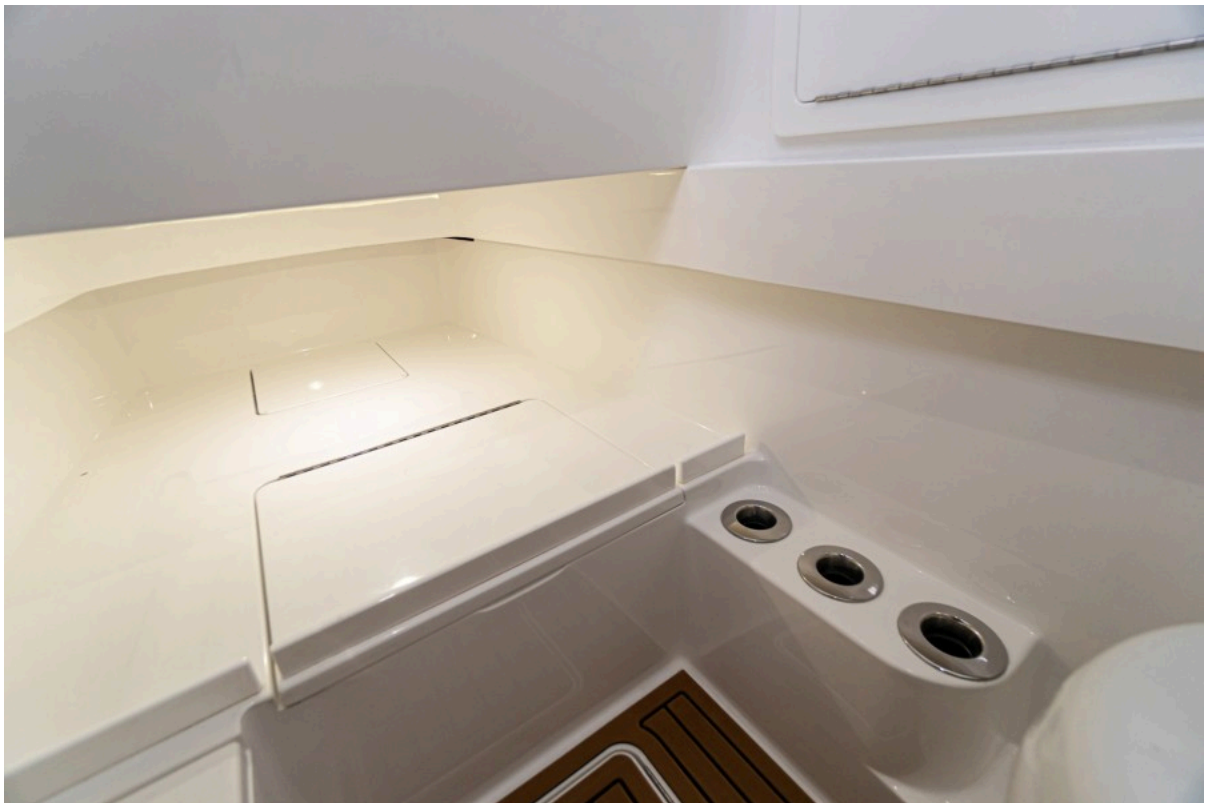
Valhalla 33 - Cabin 2022 Valhalla Boatworks V33