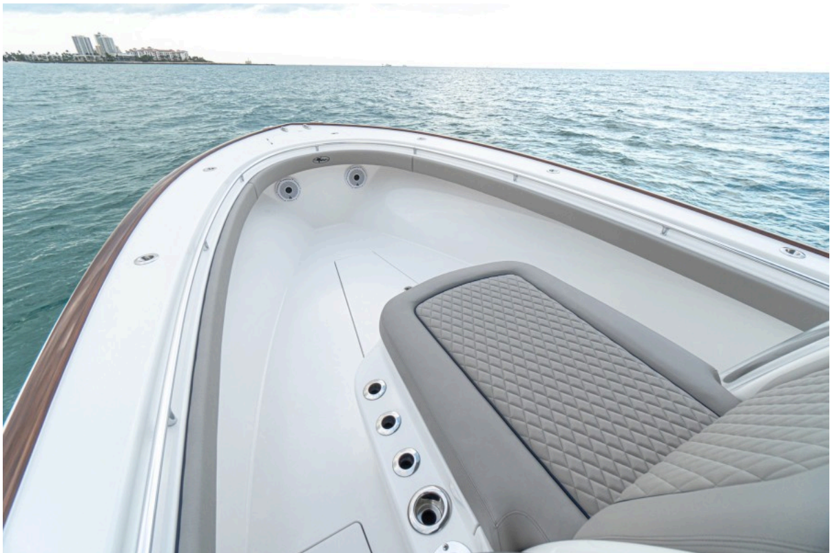
Valhalla 33 - Forward Seating 2022 Valhalla Boatworks V33