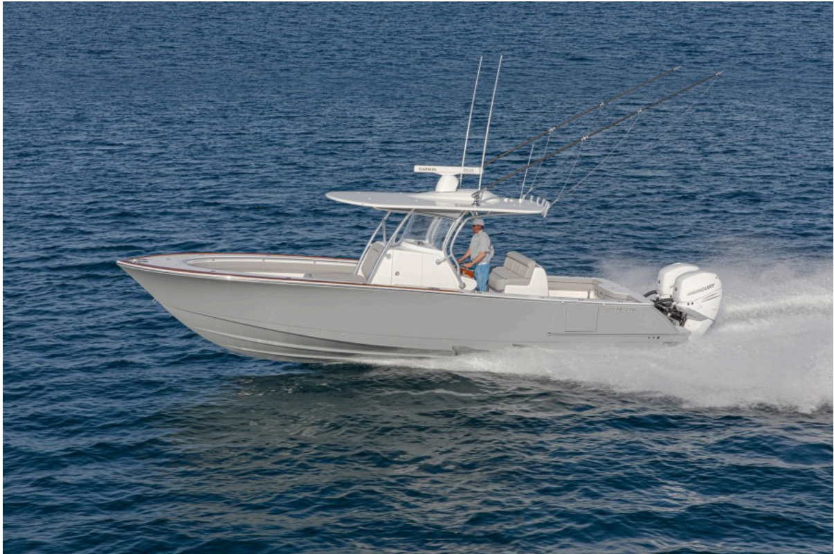
Valhalla 33 - Exterior Profile 2022 Valhalla Boatworks V33