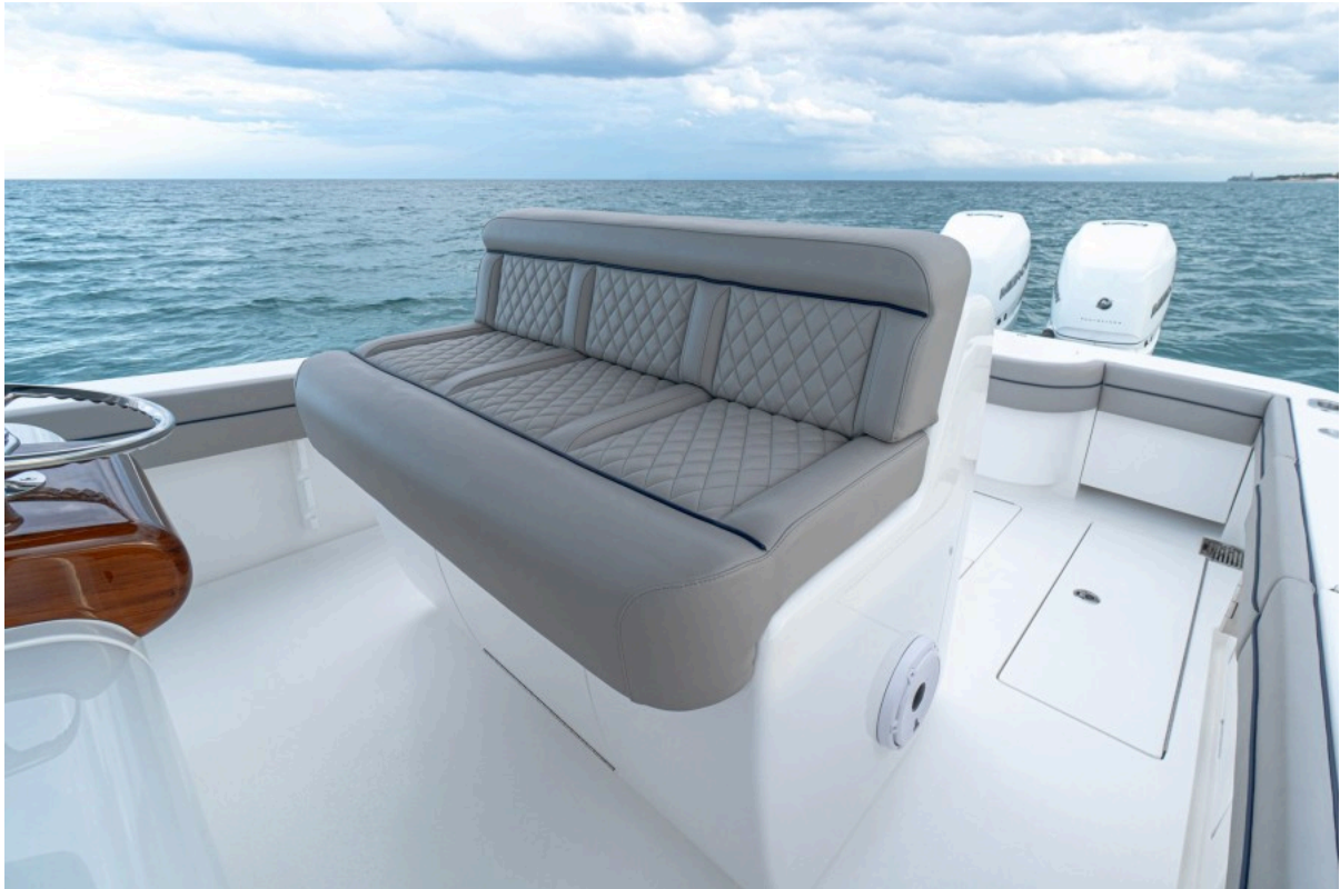
Valhalla 33 - Helm Seating 2022 Valhalla Boatworks V33