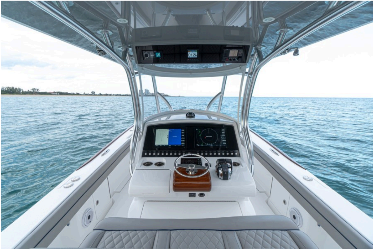
Valhalla 33 - Helm Electronics 2022 Valhalla Boatworks V33