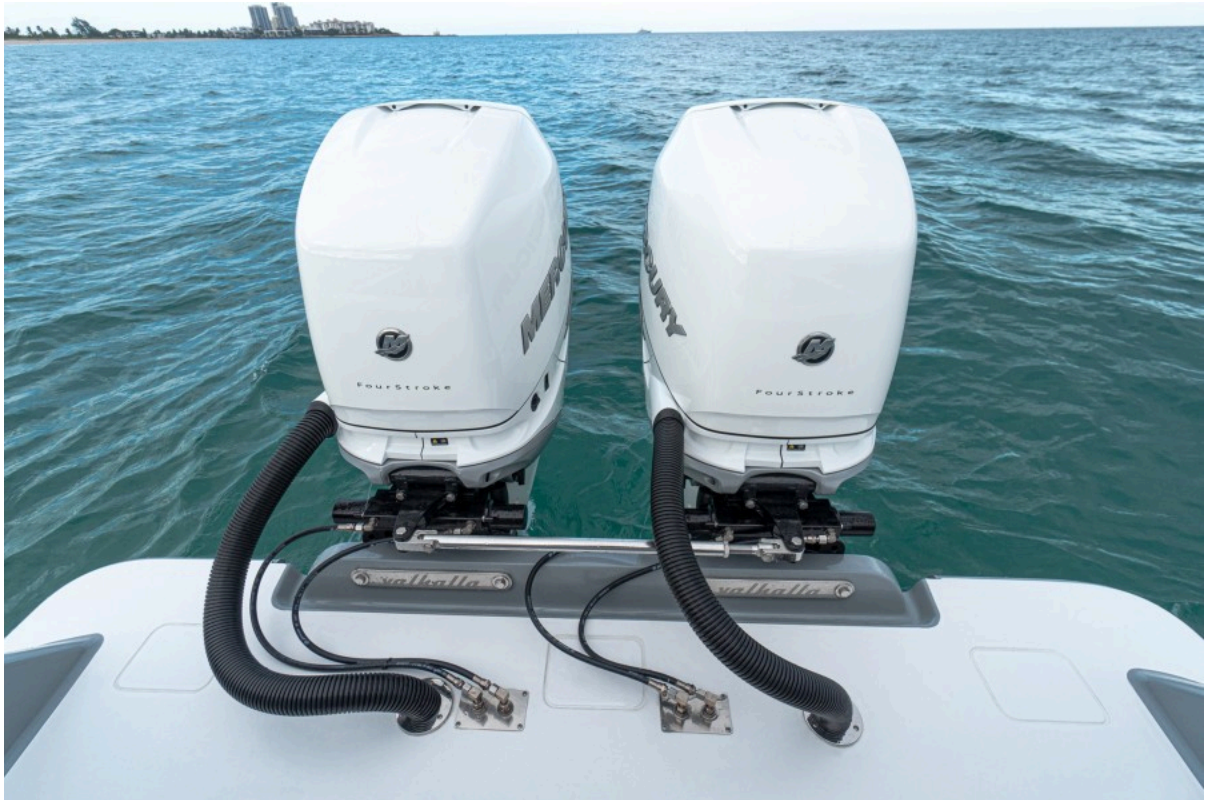
Valhalla 33 - Engines 2022 Valhalla Boatworks V33