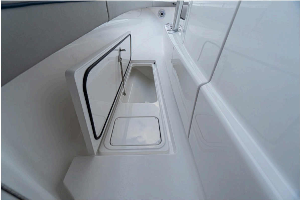
Valhalla 33 - Gunwale Storage 2022 Valhalla Boatworks V33