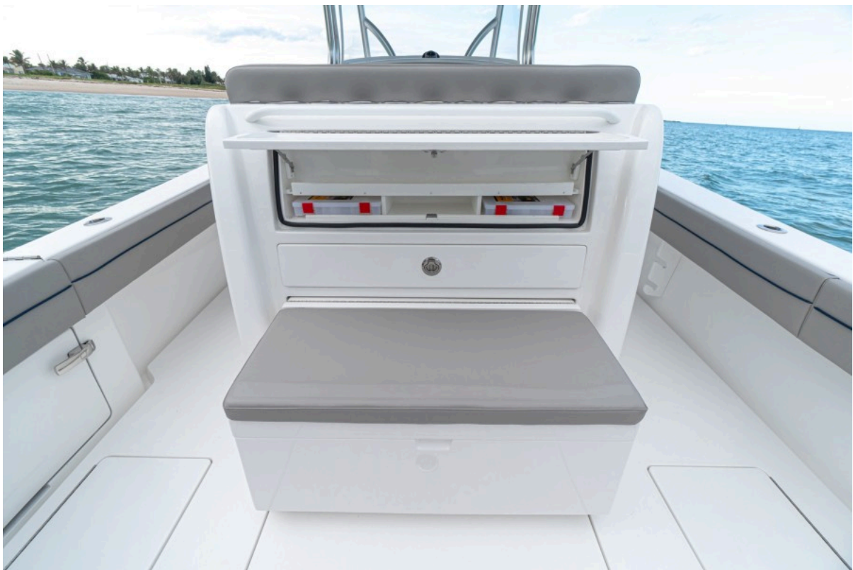
Valhalla 33 - Aft Seating 2022 Valhalla Boatworks V33