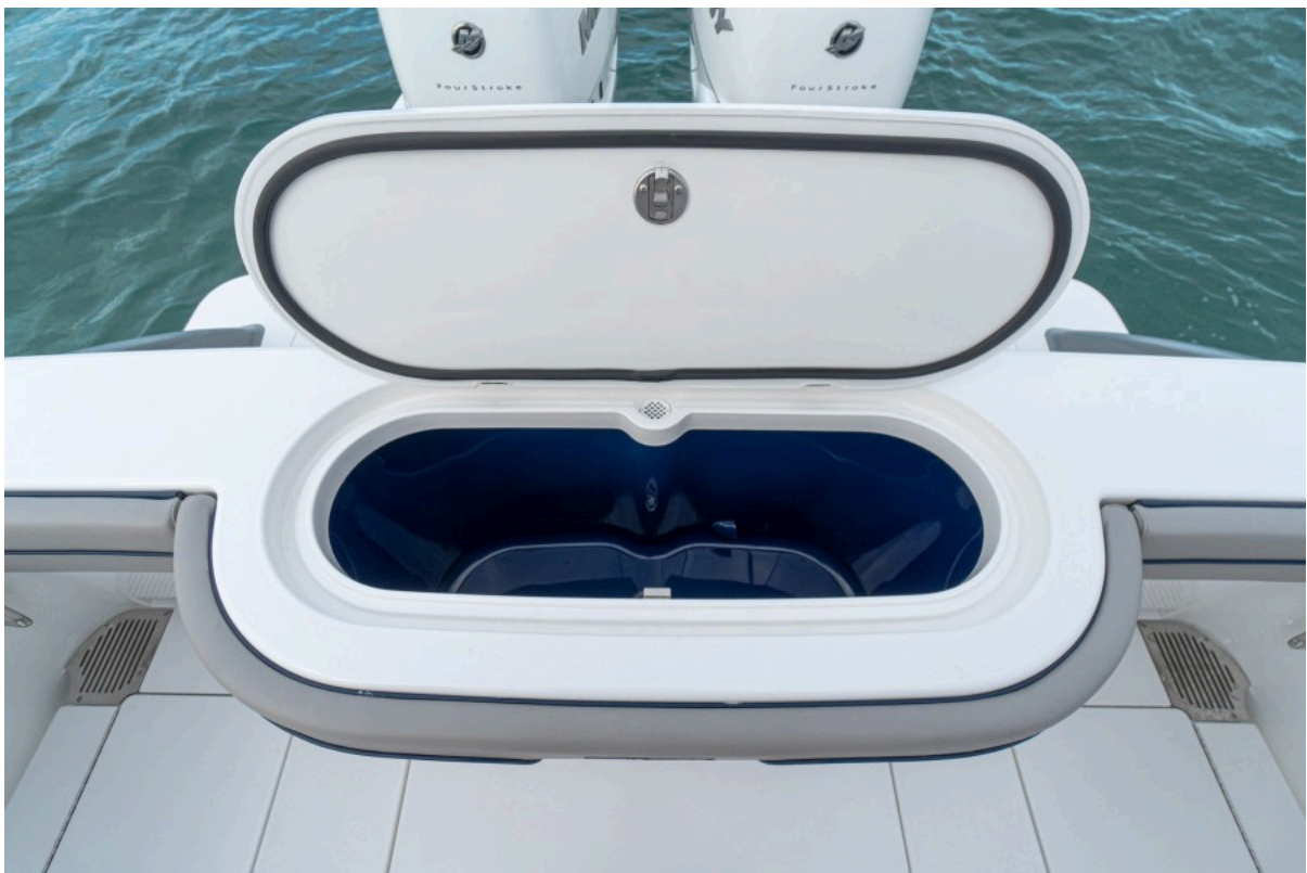
Valhalla 33 - Live Well 2022 Valhalla Boatworks V33