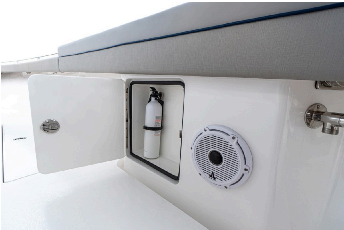
Valhalla 33 - Gunwale Speakers 2022 Valhalla Boatworks V33