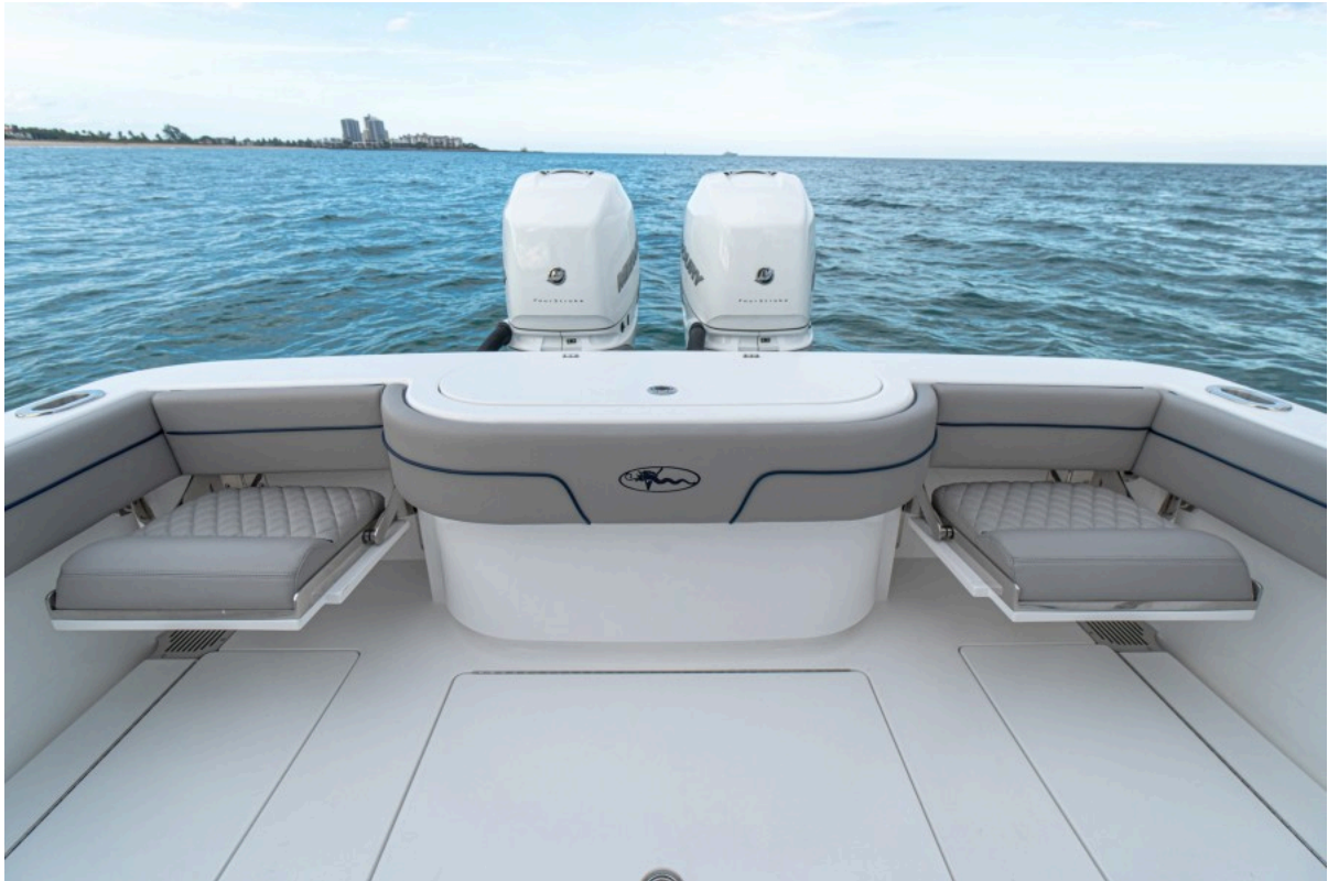
Valhalla 33 - Cockpit Seating 2022 Valhalla Boatworks V33