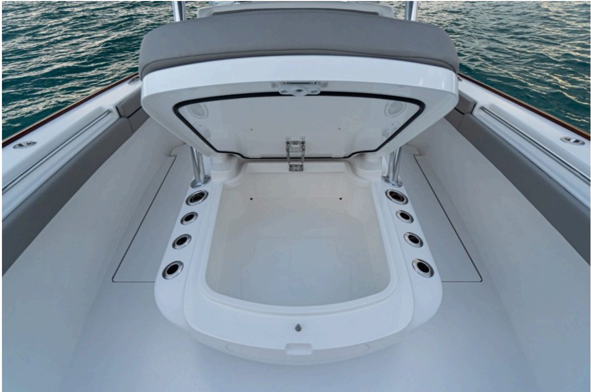
Valhalla 33 - Forward Storage 2022 Valhalla Boatworks V33