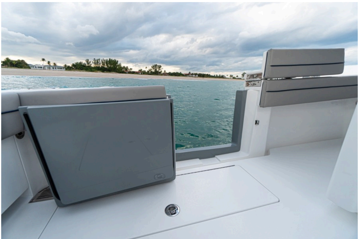
Valhalla 33 - Dive Door 2022 Valhalla Boatworks V33