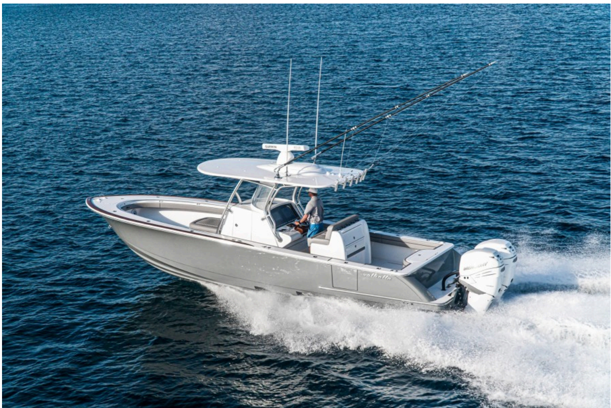
Valhalla 33 - Exterior Profile 2022 Valhalla Boatworks V33