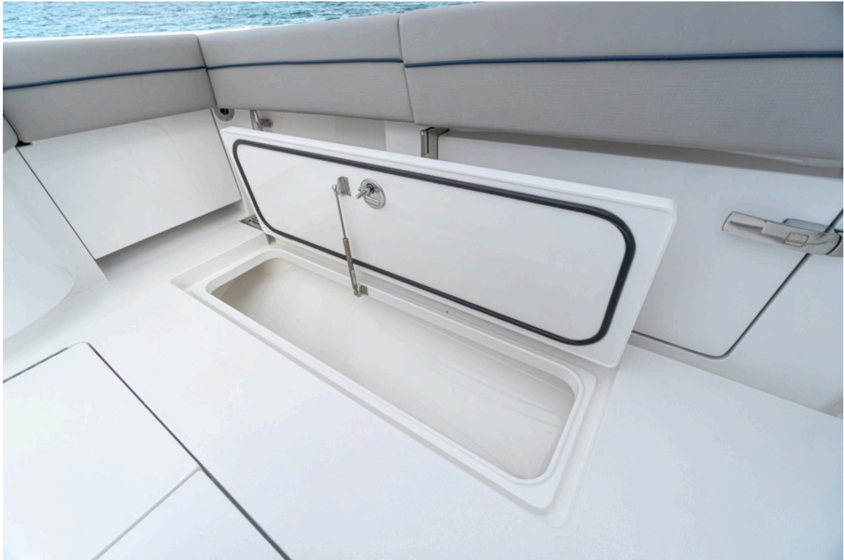
Valhalla 33 - Cockpit Storage 2022 Valhalla Boatworks V33