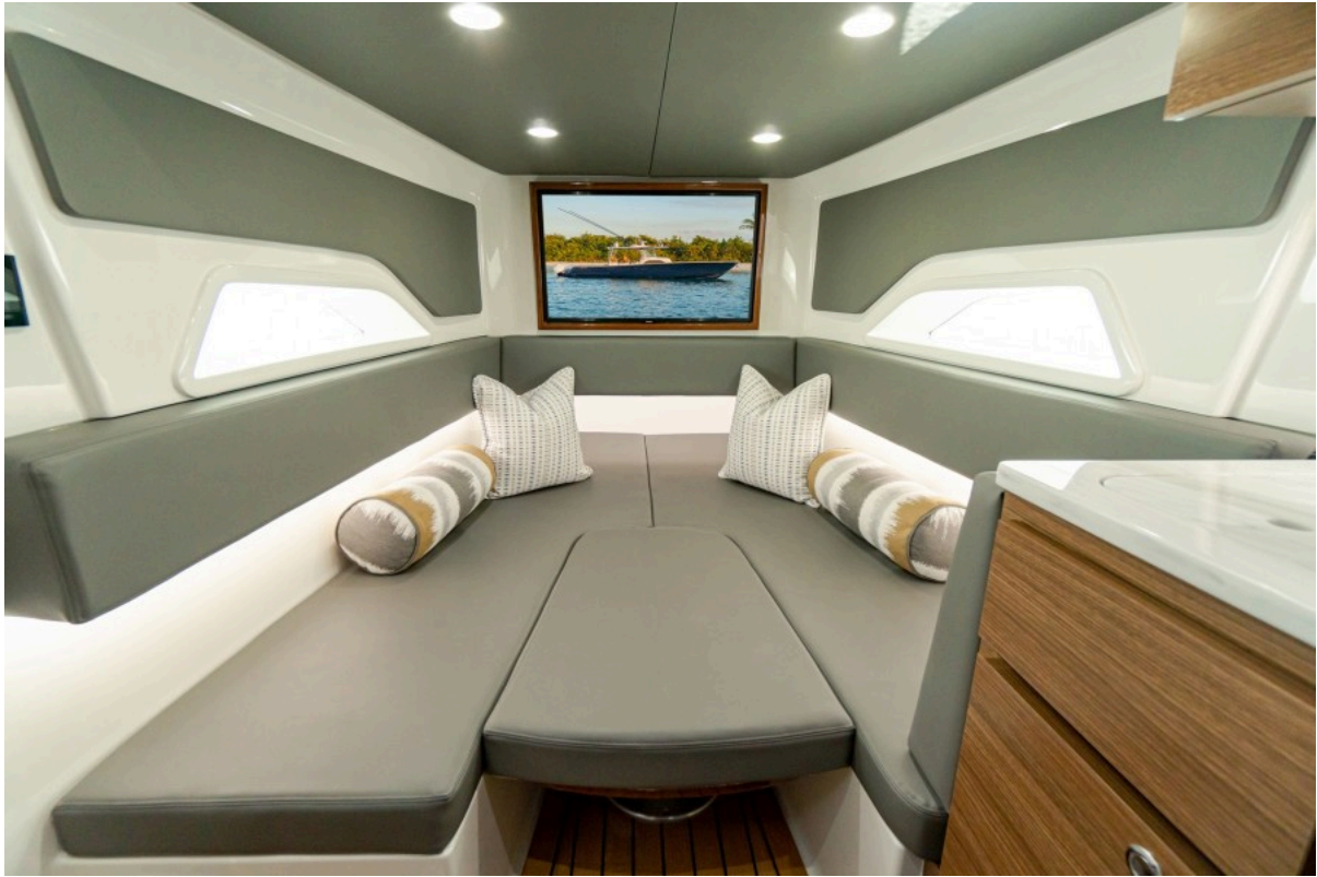
Valhalla 46 - Cabin 2022 Valhalla Boatworks V46