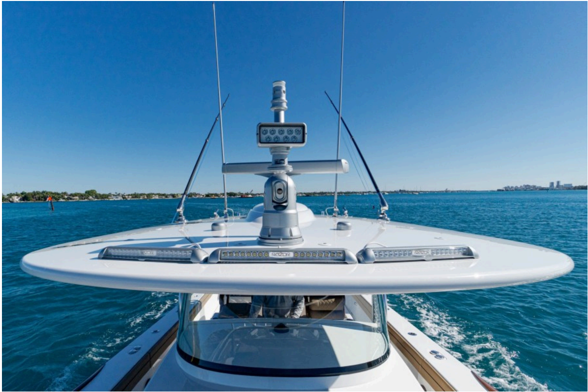
Valhalla 46 - Hard Top 2022 Valhalla Boatworks V46