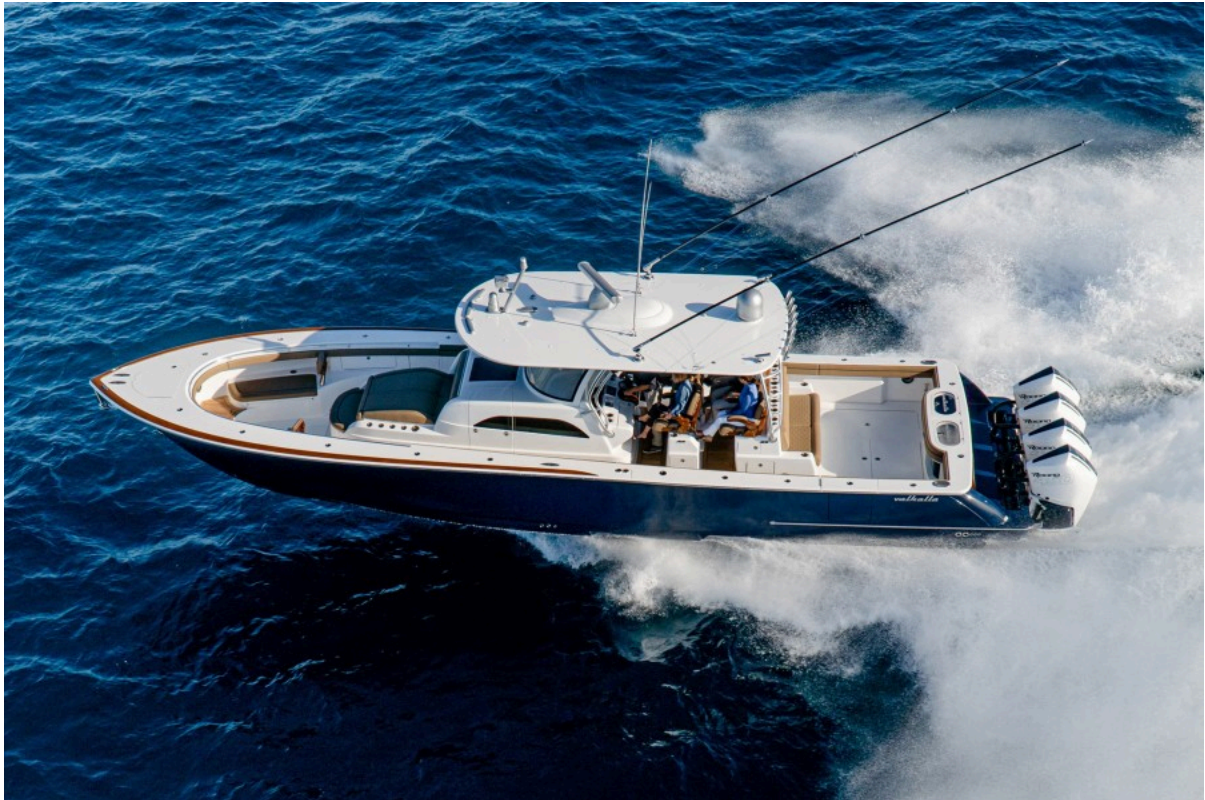
Valhalla 46 - Exterior Profile 2022 Valhalla Boatworks V46