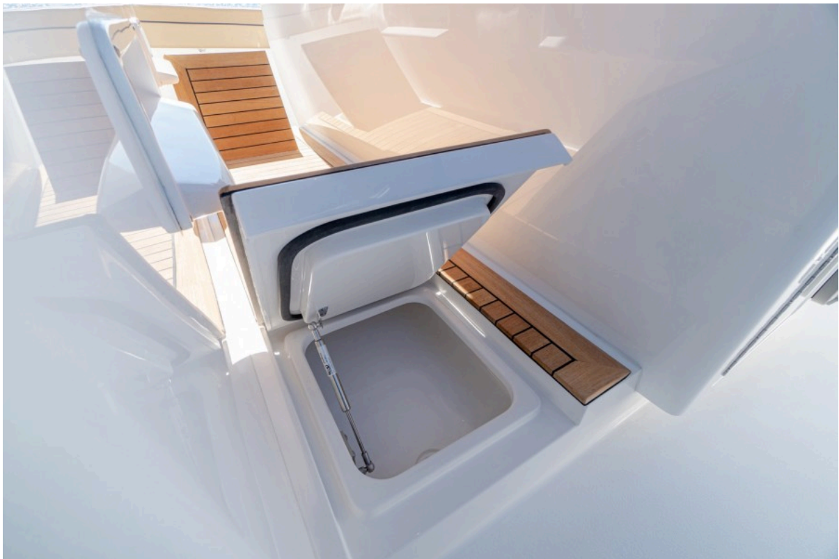
Valhalla 46 - Helm Storage 2022 Valhalla Boatworks V46