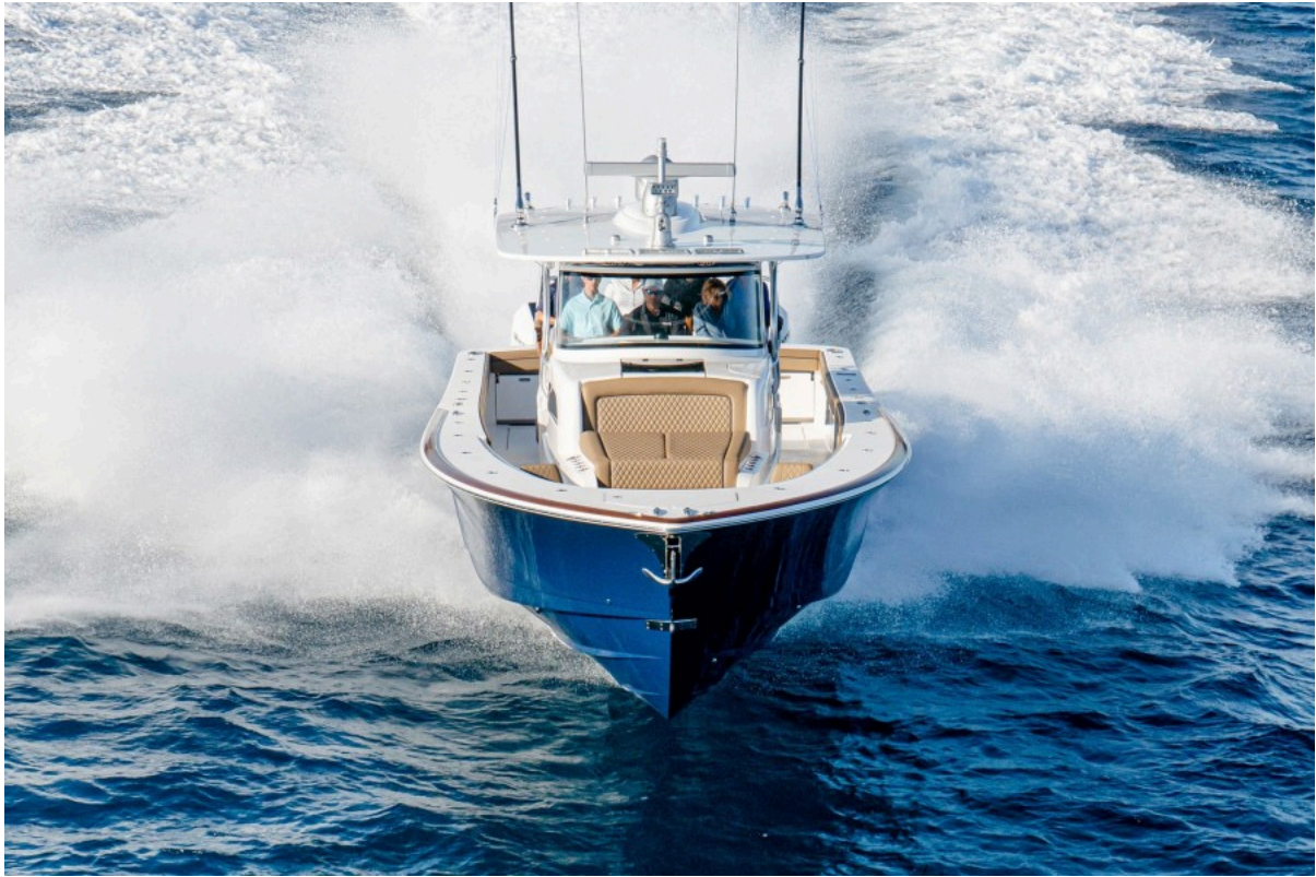
Valhalla 46 - Exterior Profile 2022 Valhalla Boatworks V46