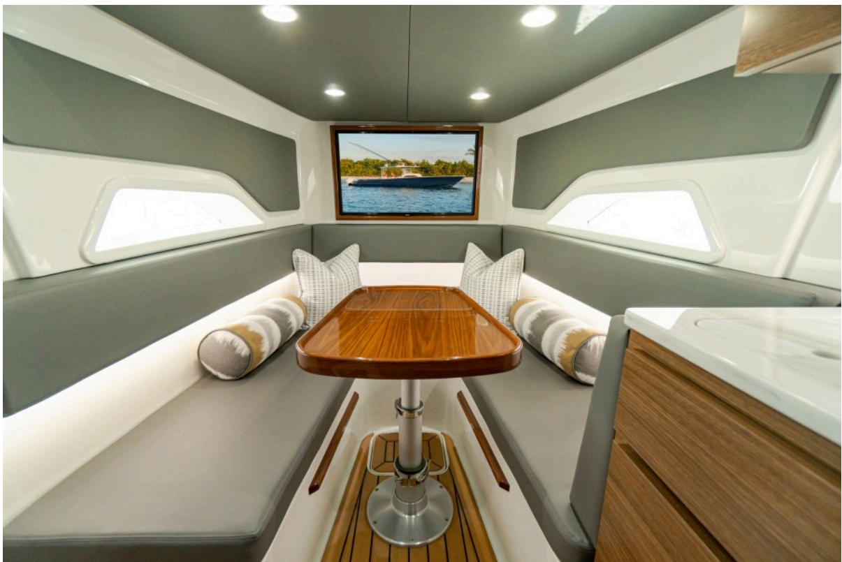
Valhalla 46 - Cabin/Dinette 2022 Valhalla Boatworks V46