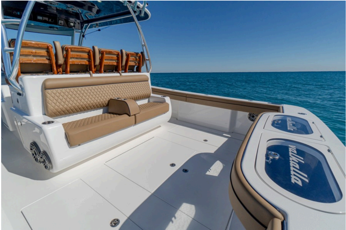
Valhalla 46 - Cockpit Seating 2022 Valhalla Boatworks V46