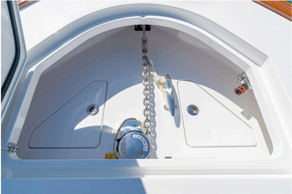
Valhalla 46 - Anchor 2022 Valhalla Boatworks V46