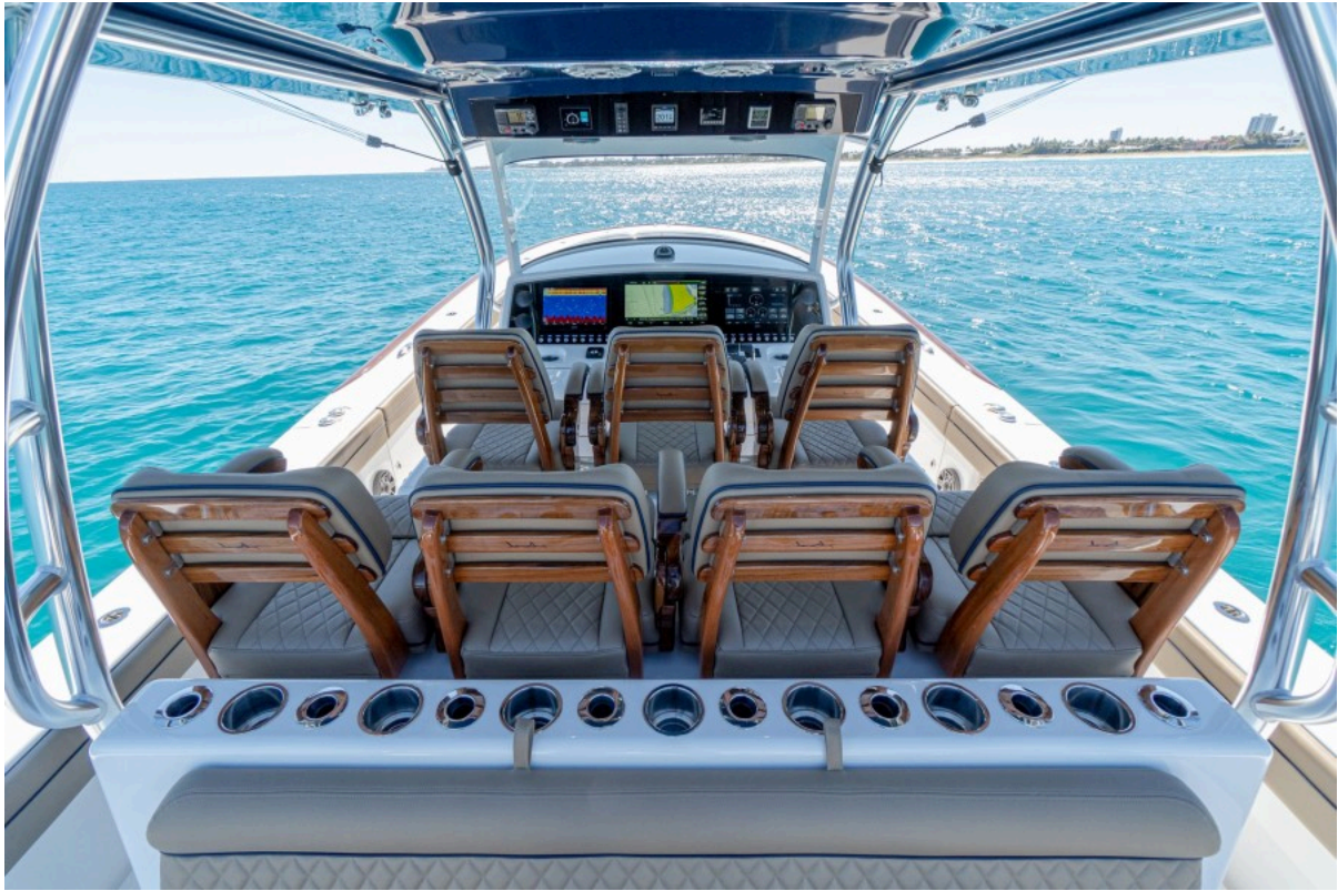
Valhalla 46 - Helm Seating 2022 Valhalla Boatworks V46