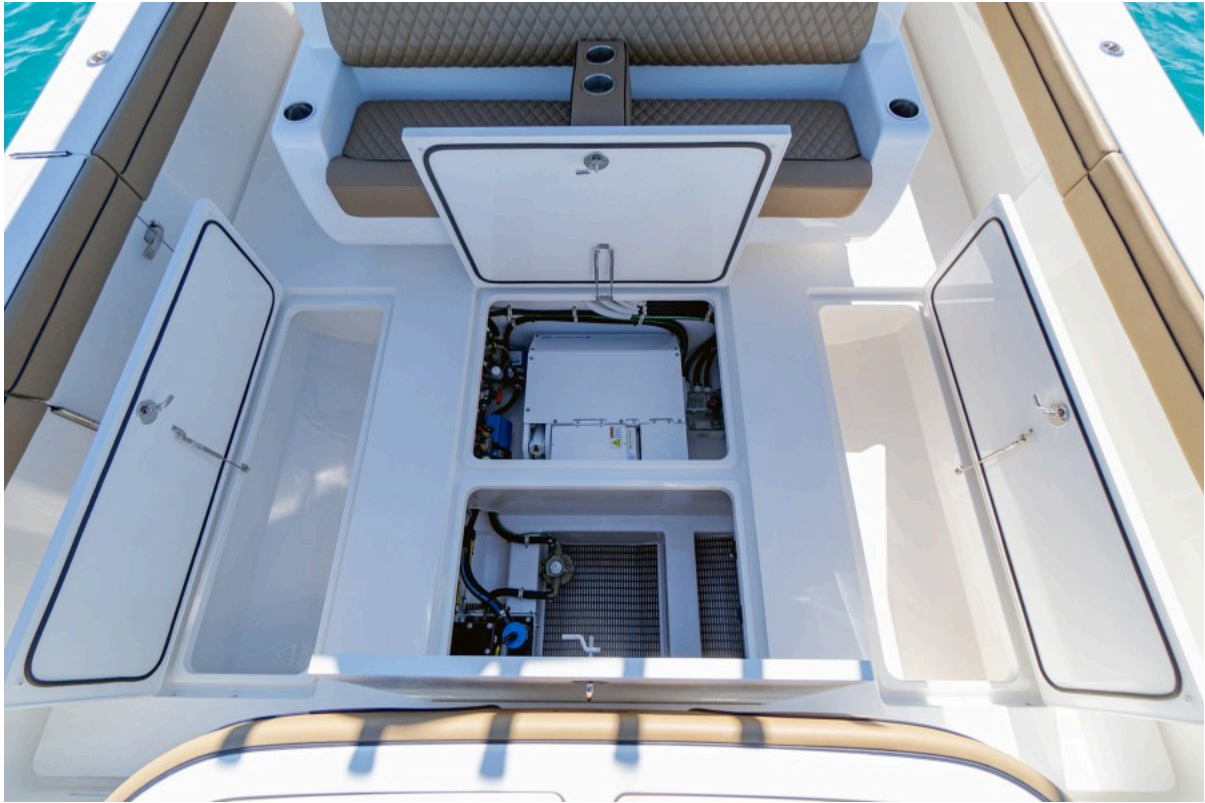
Valhalla 46 - Cockpit Storage/Generator 2022 Valhalla Boatworks V46