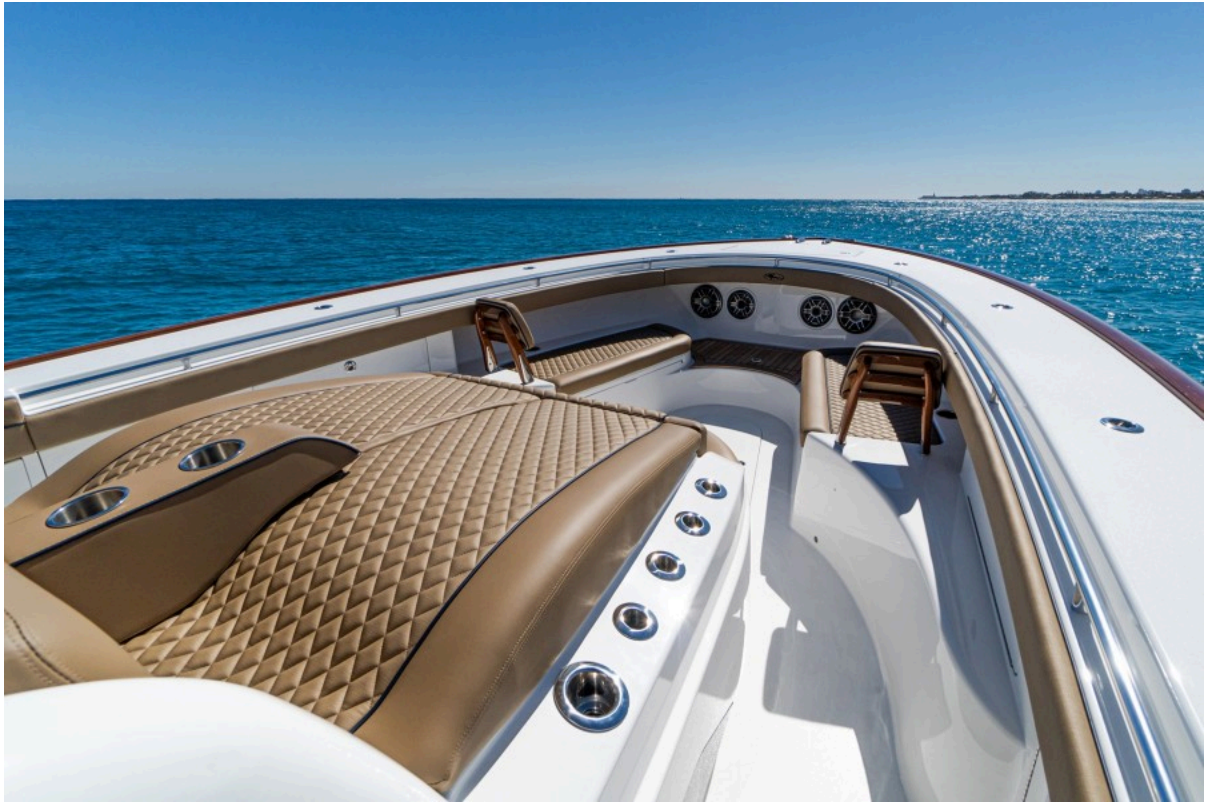
Valhalla 46 - Deck Seating 2022 Valhalla Boatworks V46