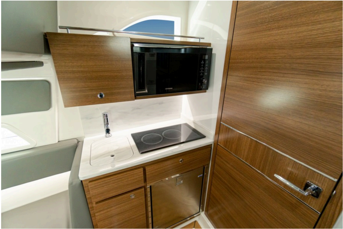
Valhalla 46 - Cabin/Galley 2022 Valhalla Boatworks V46