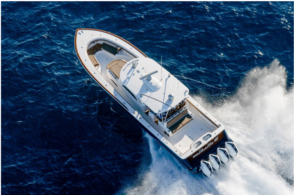
Valhalla 46 - Exterior Profile 2022 Valhalla Boatworks V46