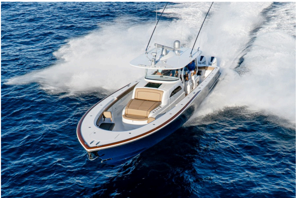
Valhalla 46 - Exterior Profile 2022 Valhalla Boatworks V46