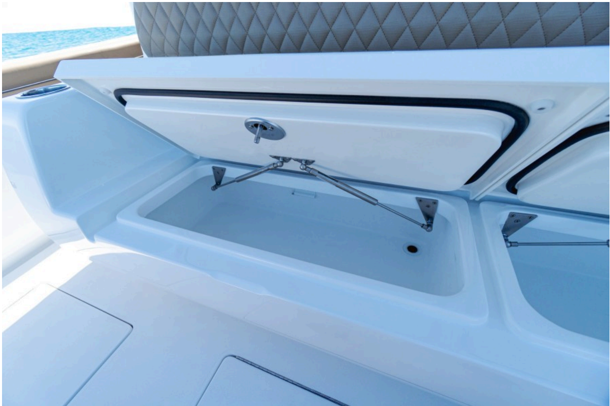
Valhalla 46 - Helm Storage 2022 Valhalla Boatworks V46