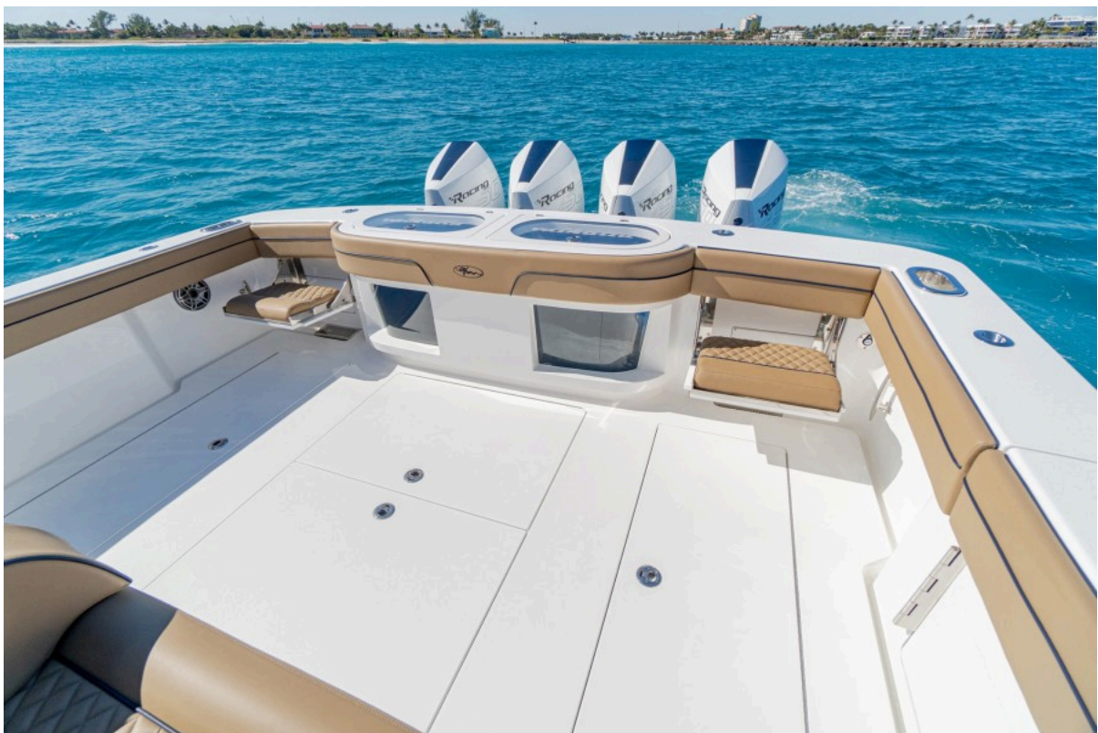
Valhalla 46 - Cockpit 2022 Valhalla Boatworks V46