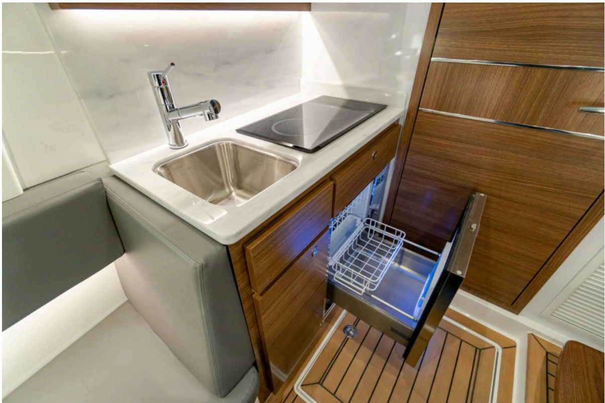
Valhalla 46 - Cabin/Galley 2022 Valhalla Boatworks V46