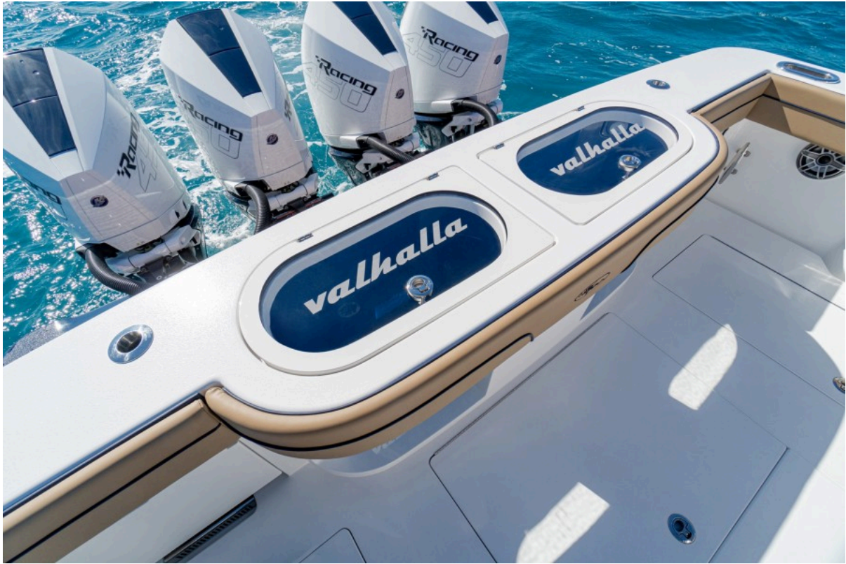
Valhalla 46 - Aft Livewells 2022 Valhalla Boatworks V46