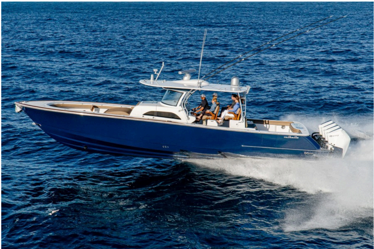
Valhalla 46 - Exterior Profile 2022 Valhalla Boatworks V46