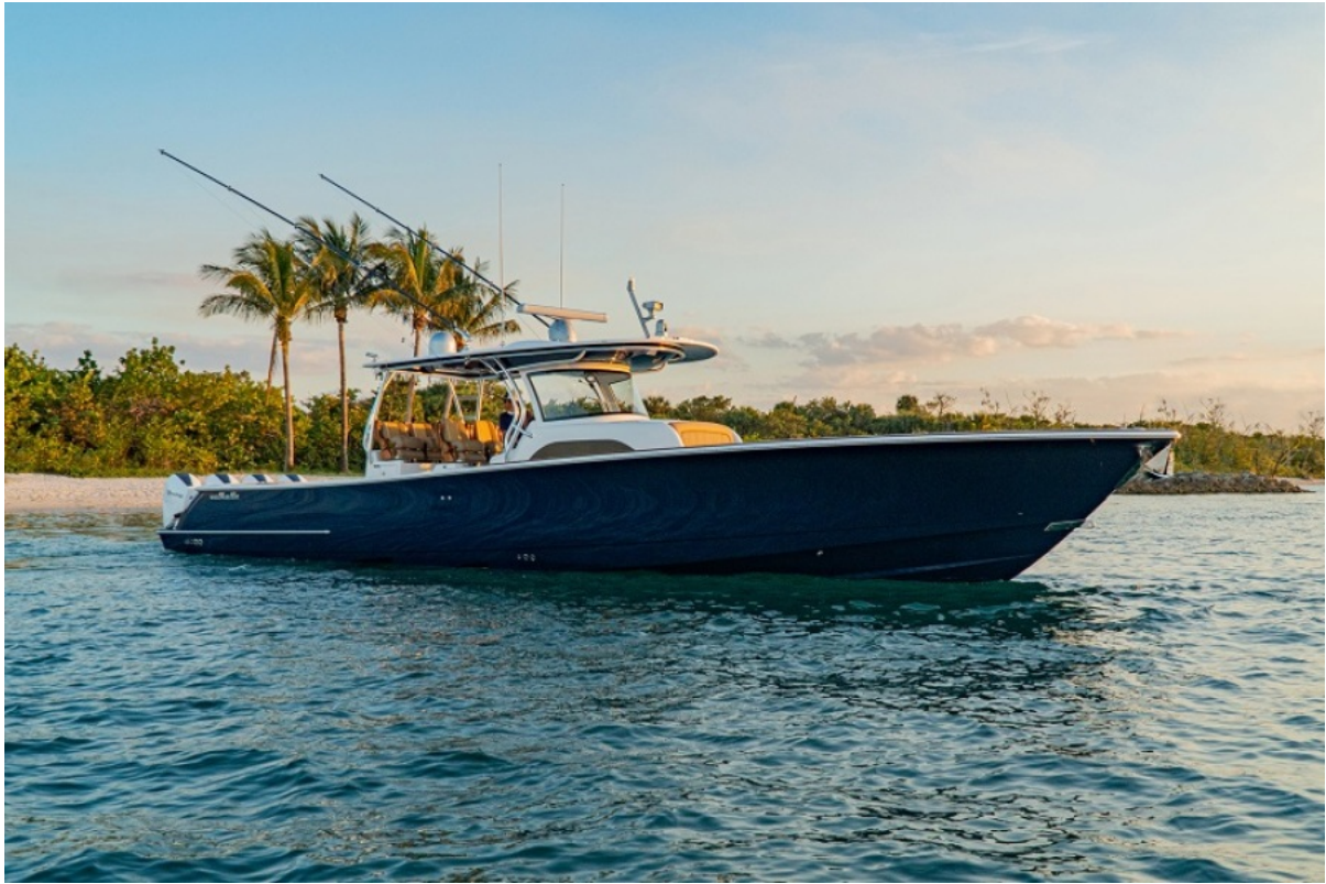
Valhalla 46 - Exterior Profile 2022 Valhalla Boatworks V46