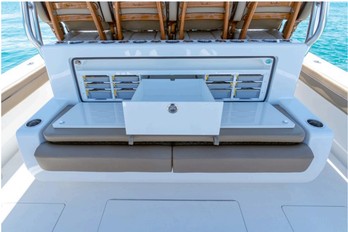
Valhalla 46 - Helm Storage 2022 Valhalla Boatworks V46