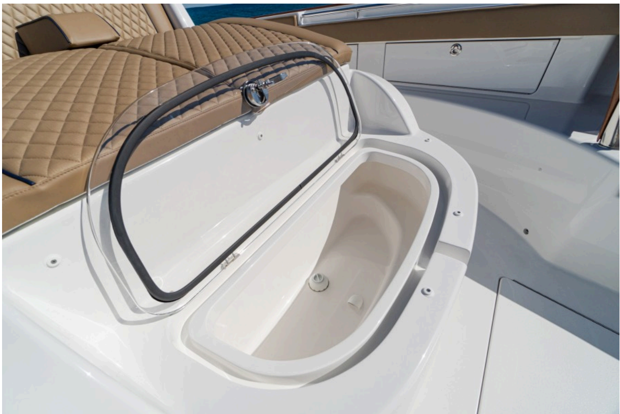
Valhalla 46 - Storage 2022 Valhalla Boatworks V46