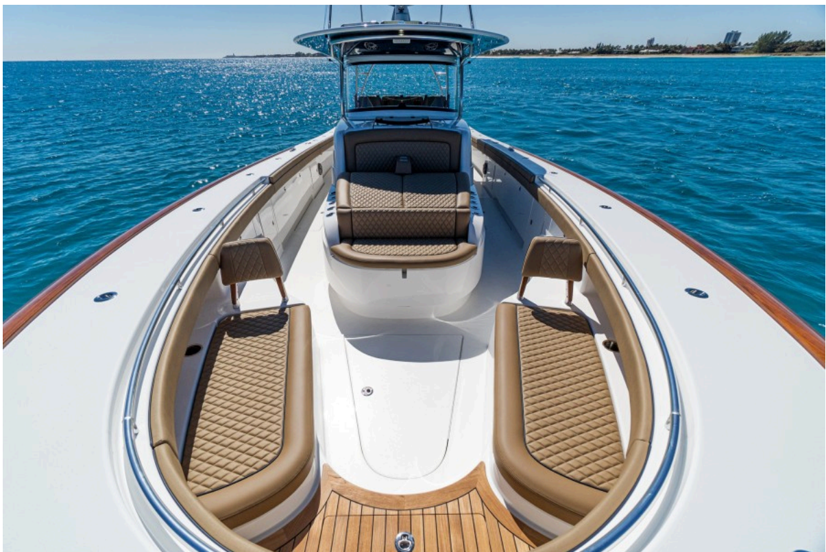
Valhalla 46 - Forward Seating 2022 Valhalla Boatworks V46