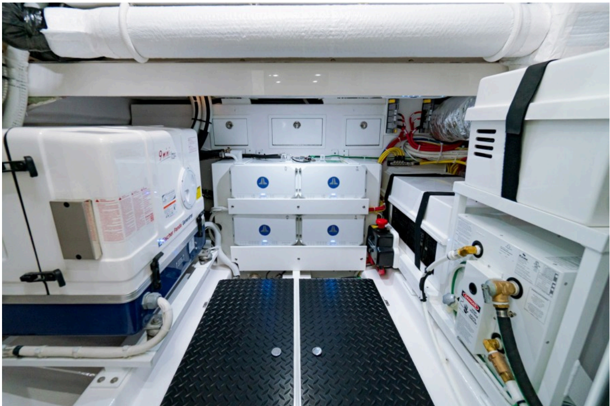
Valhalla 46 - Engine Room 2022 Valhalla Boatworks V46