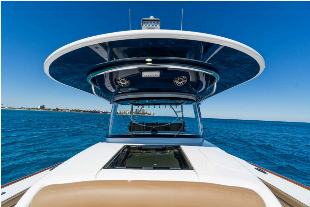
Valhalla 46 - Deck 2022 Valhalla Boatworks V46