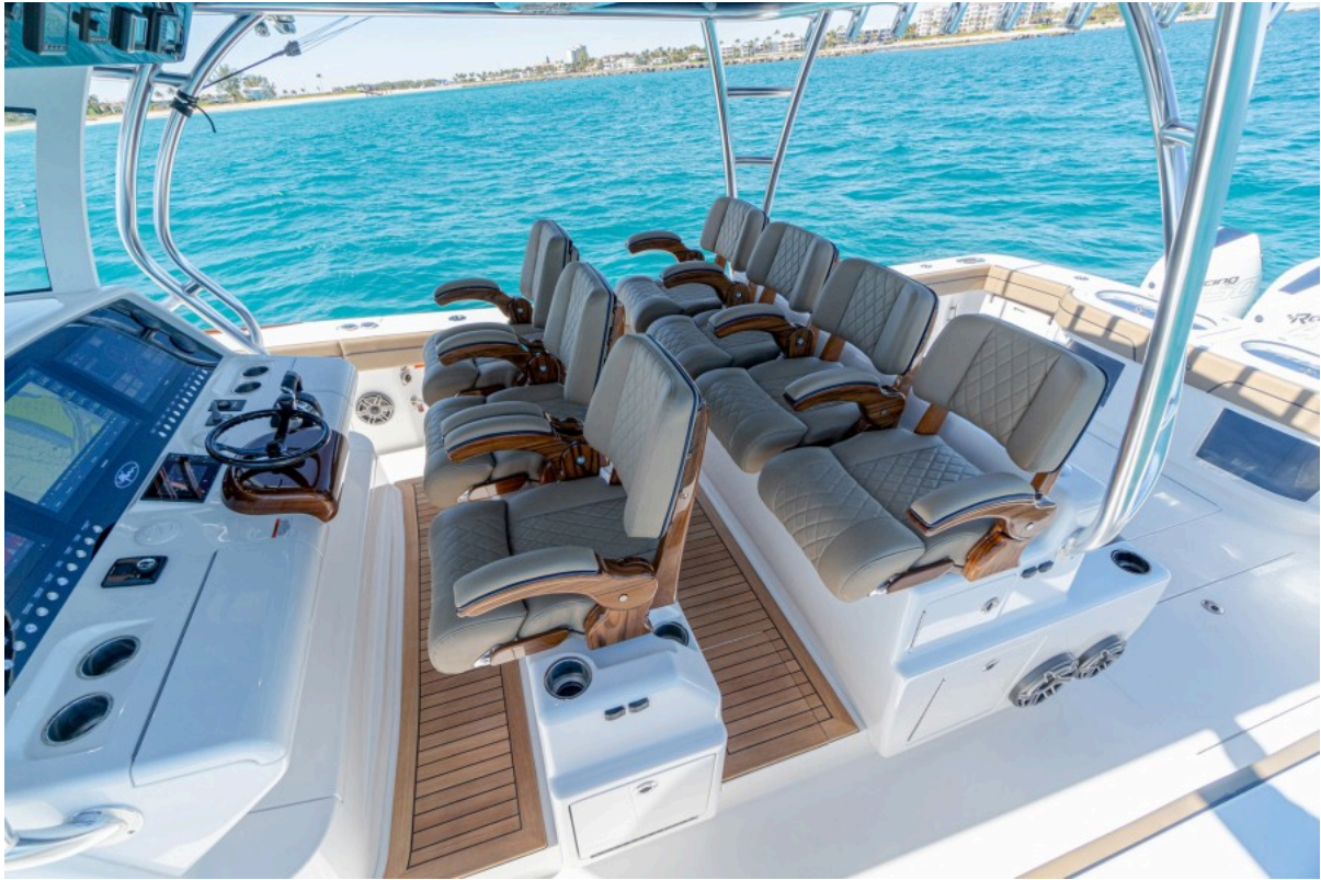
Valhalla 46 - Helm Seating 2022 Valhalla Boatworks V46