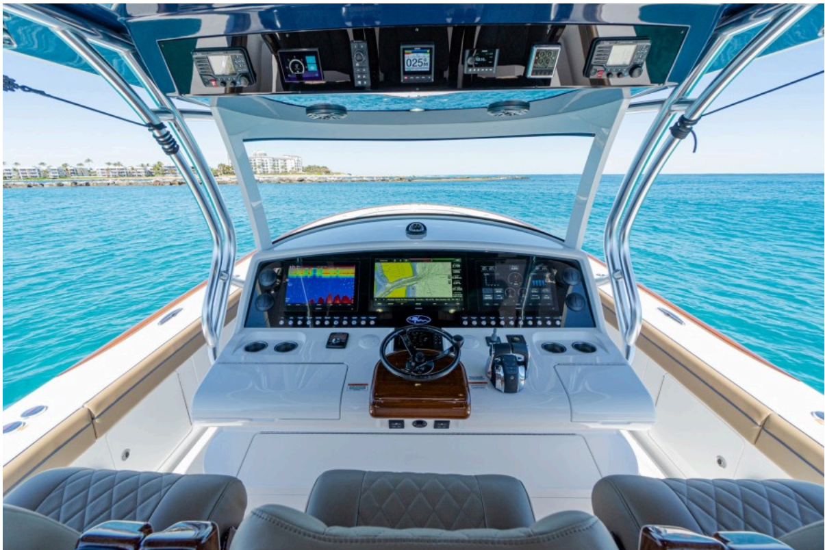
Valhalla 46 - Helm Electronics 2022 Valhalla Boatworks V46