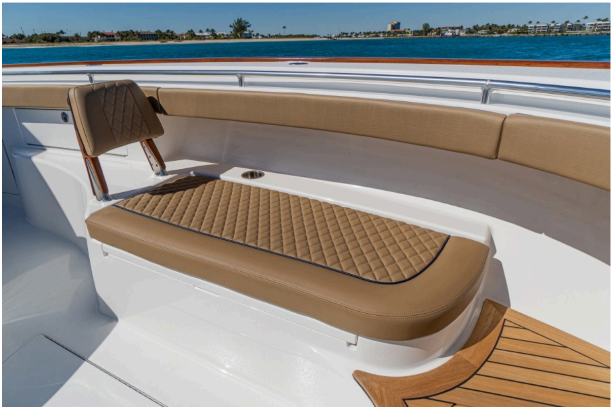
Valhalla 46 - Deck Seating 2022 Valhalla Boatworks V46