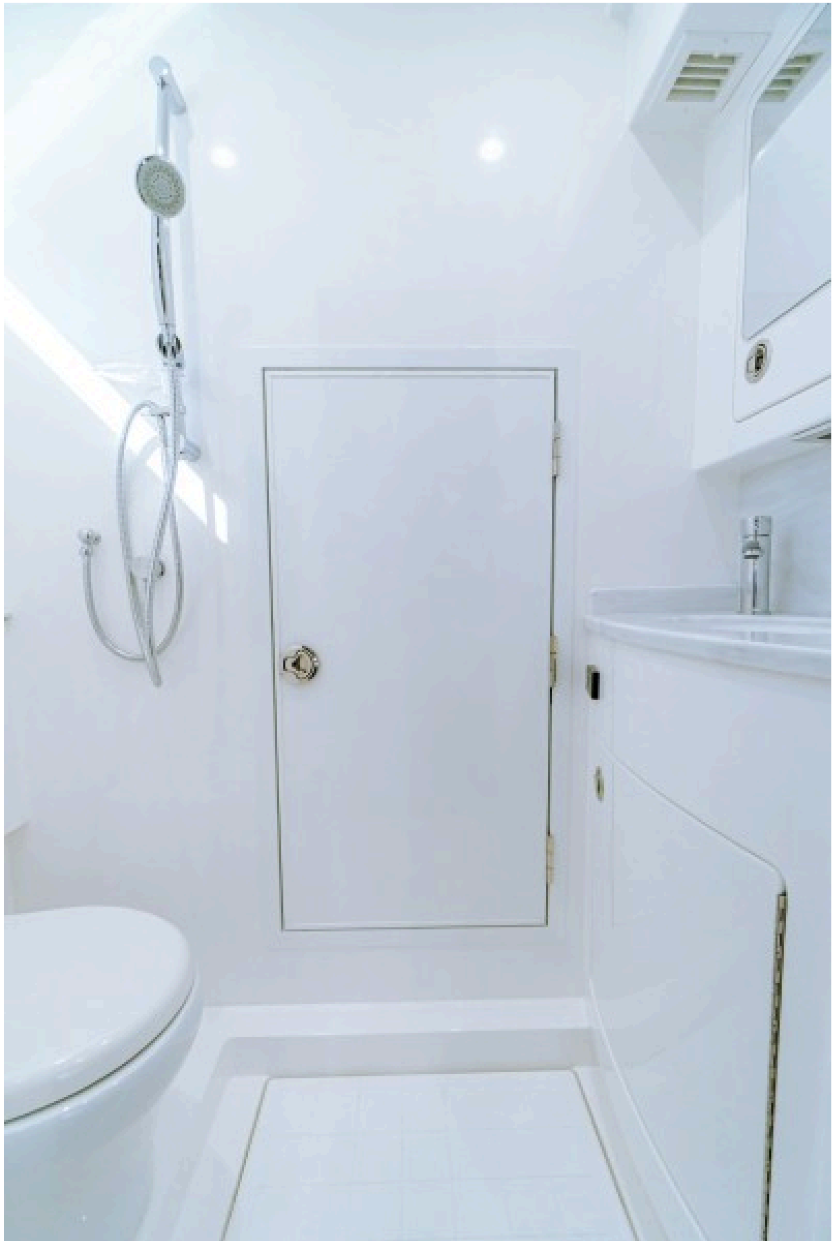
Valhalla 46 - Head 2022 Valhalla Boatworks V46