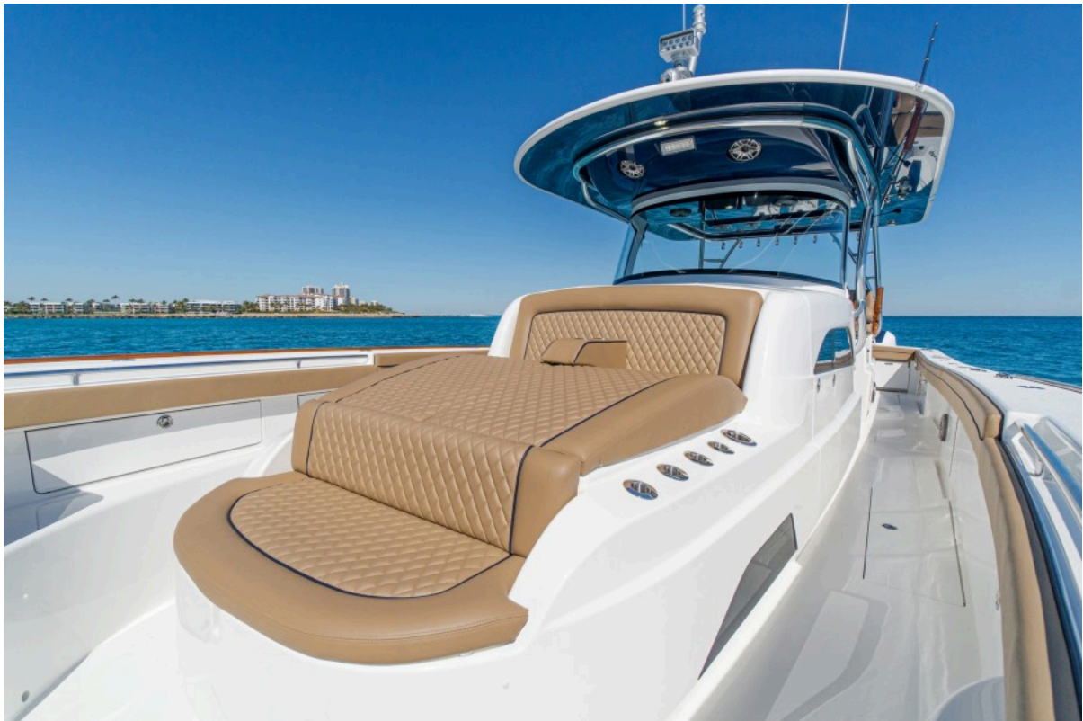
Valhalla 46 - Deck Seating 2022 Valhalla Boatworks V46