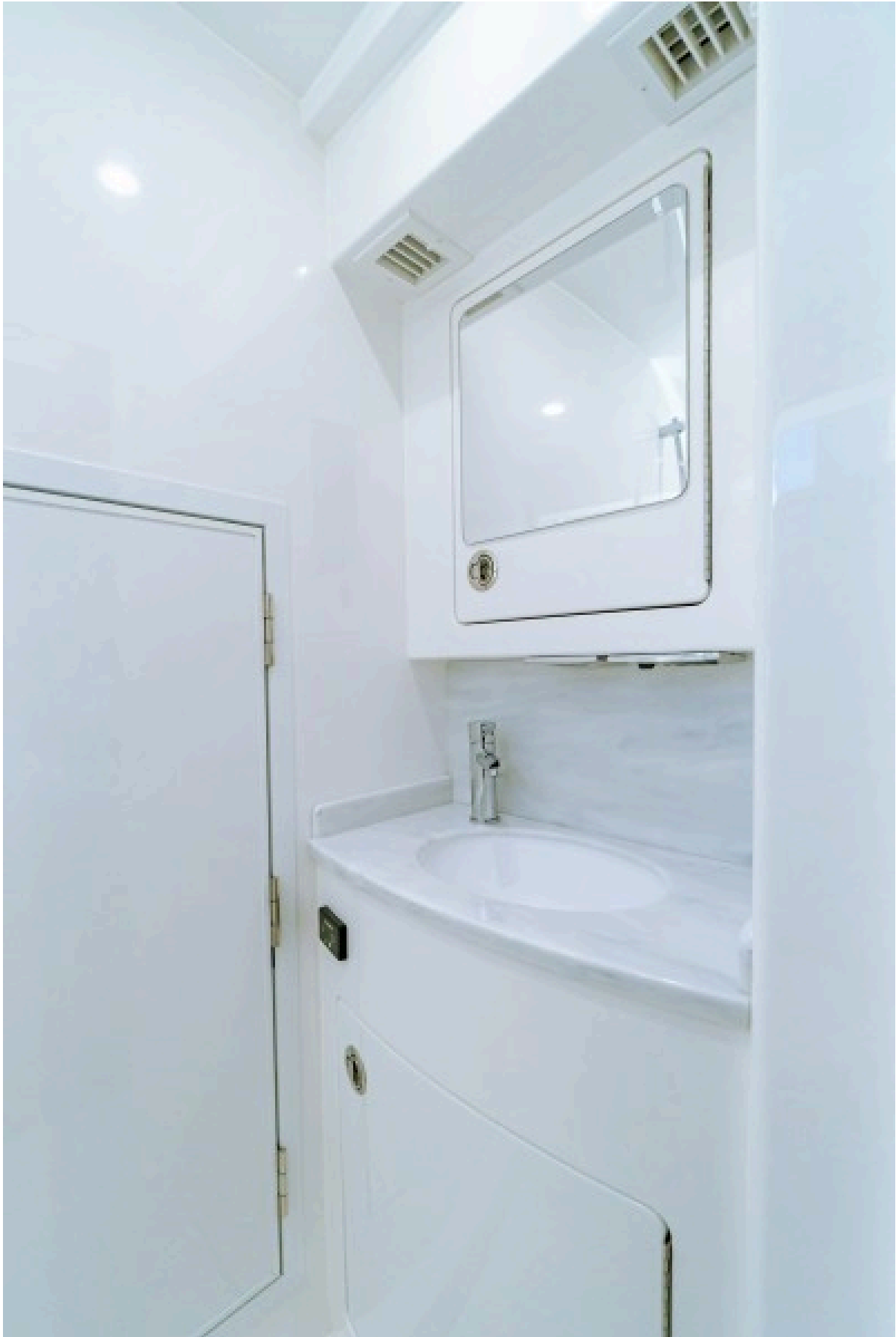
Valhalla 46 - Head 2022 Valhalla Boatworks V46