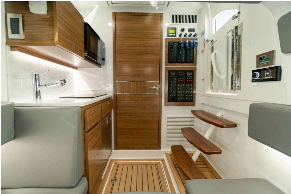
Valhalla 46 - Cabin/Galley 2022 Valhalla Boatworks V46