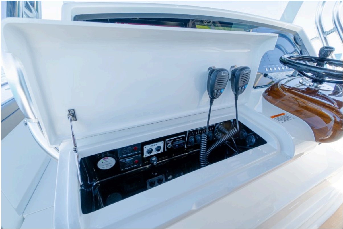
Valhalla 46 - Helm Electronics 2022 Valhalla Boatworks V46