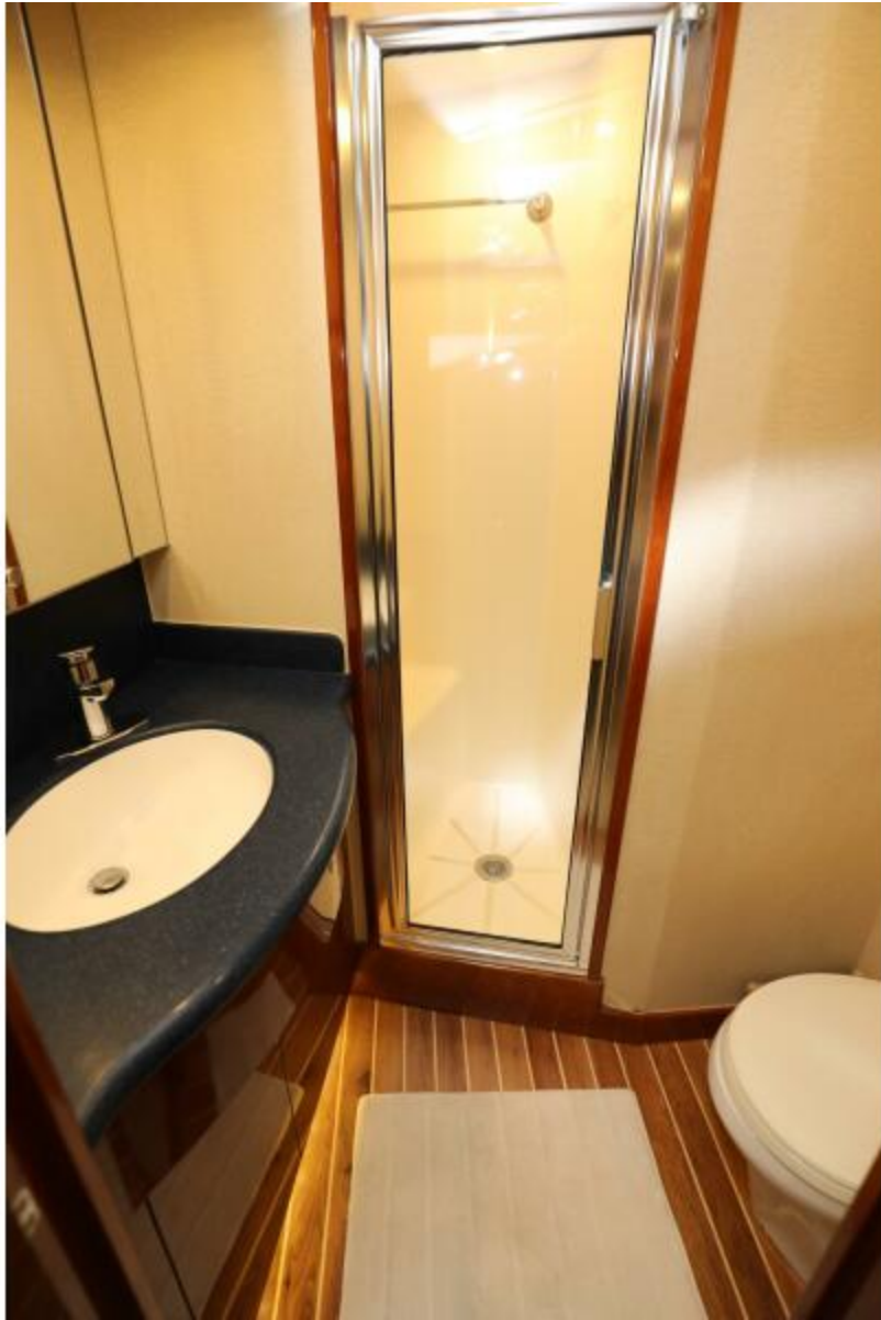
Hatteras 54 - See Legs - Head 2006 Hatteras 54 - See Legs