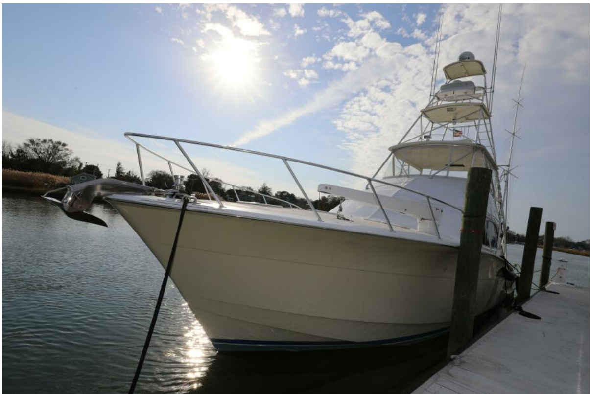
Hatteras 54 - See Legs - Profile 2006 Hatteras 54 - See Legs