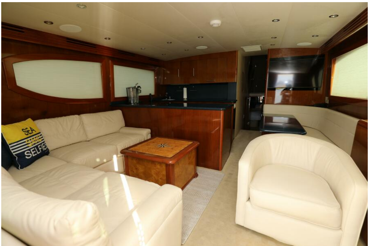
Hatteras 54 - See Legs - Salon 2006 Hatteras 54 - See Legs