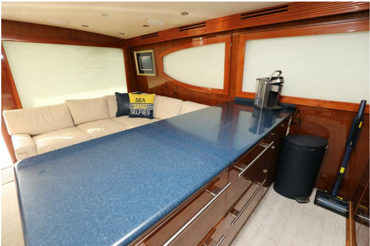
Hatteras 54 - See Legs - Salon 2006 Hatteras 54 - See Legs