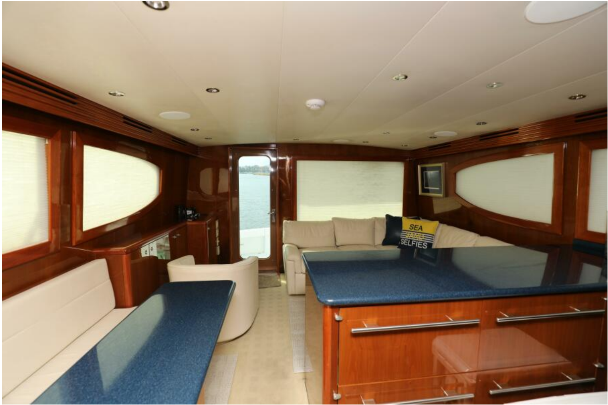
Hatteras 54 - See Legs - Salon 2006 Hatteras 54 - See Legs