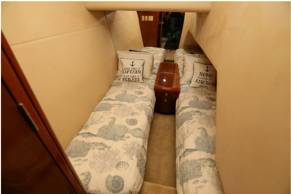
Hatteras 54 - See Legs - Starboard Stateroom 2006 Hatteras 54 - See Legs