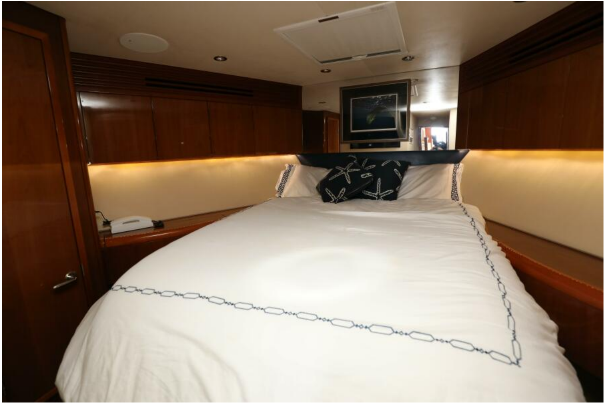
Hatteras 54 - See Legs - VIP Stateroom 2006 Hatteras 54 - See Legs