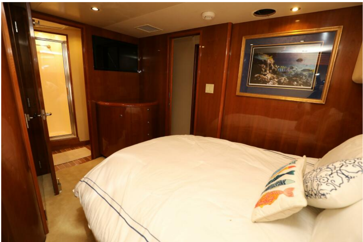
Hatteras 54 - See Legs - Master Stateroom 2006 Hatteras 54 - See Legs