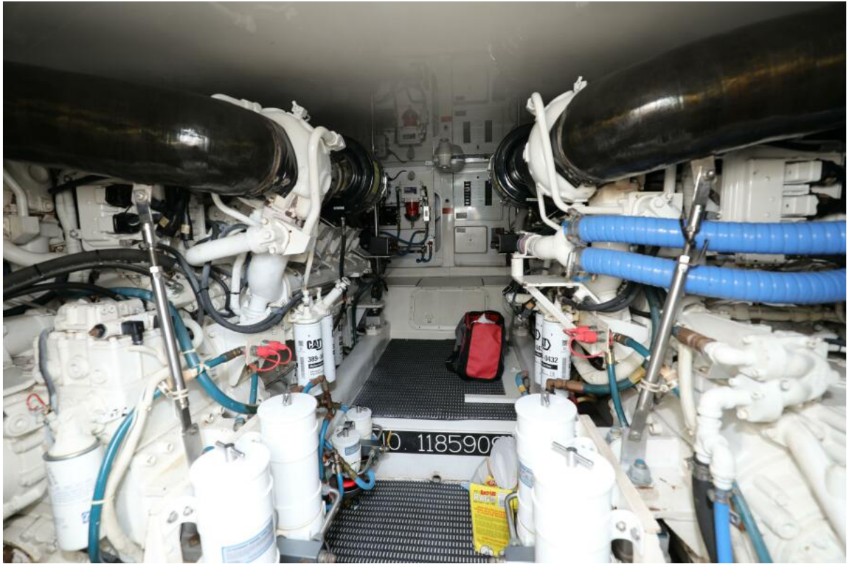
Hatteras 54 - See Legs - Engine Room 2006 Hatteras 54 - See Legs