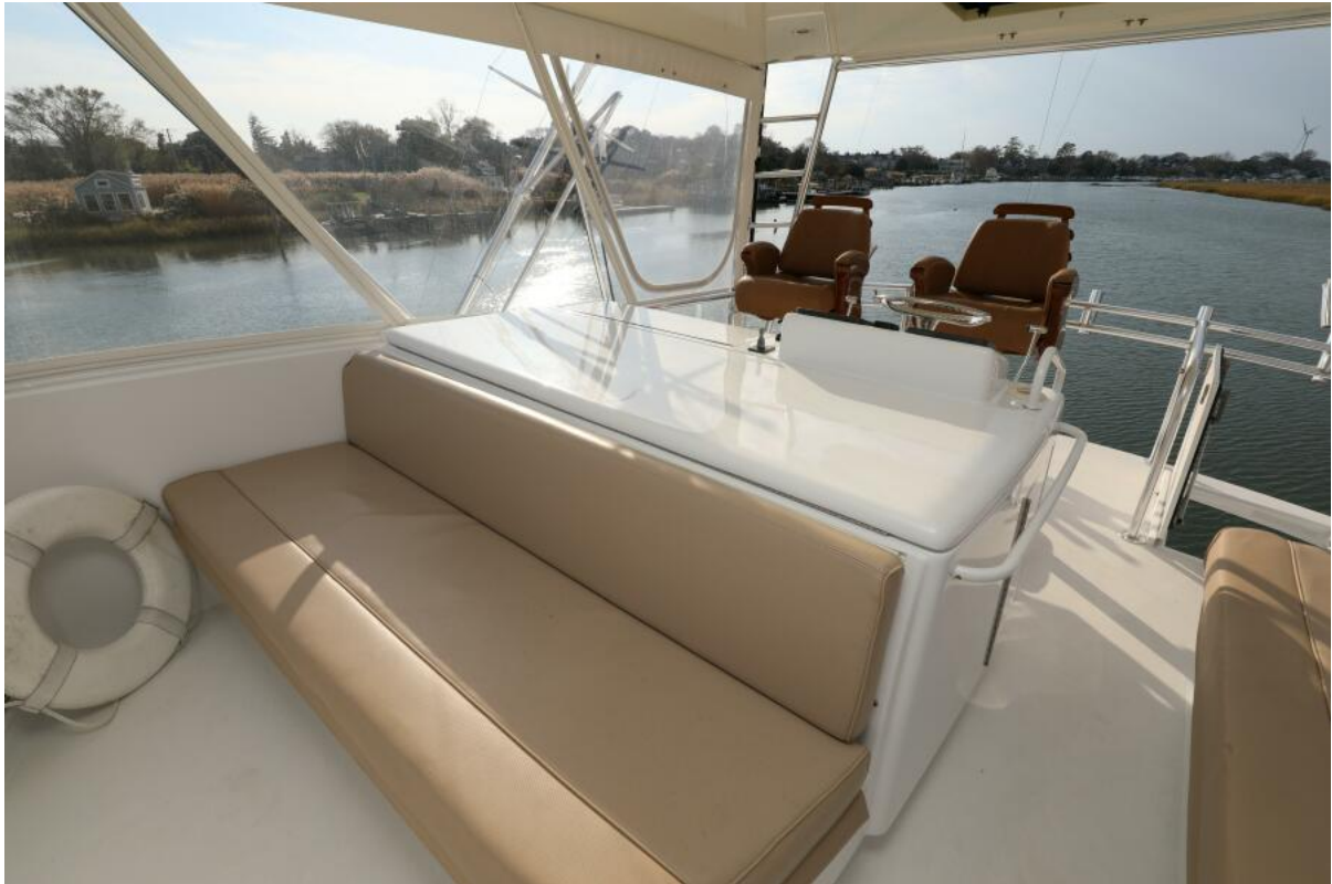
Hatteras 54 - See Legs - Flybridge 2006 Hatteras 54 - See Legs