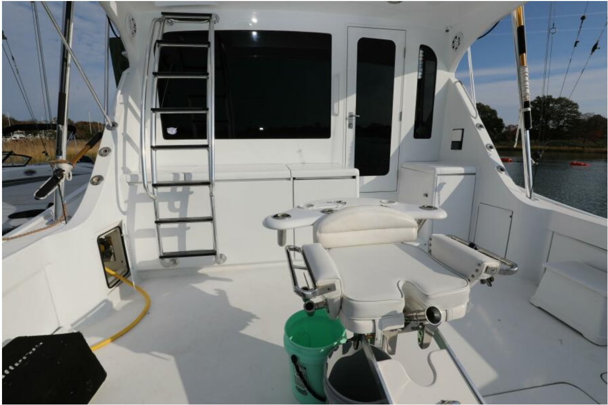
Hatteras 54 - See Legs - Cockpit 2006 Hatteras 54 - See Legs