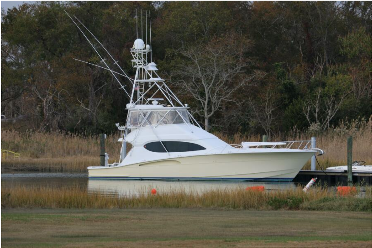
Hatteras 54 - See Legs - Profile 2006 Hatteras 54 - See Legs