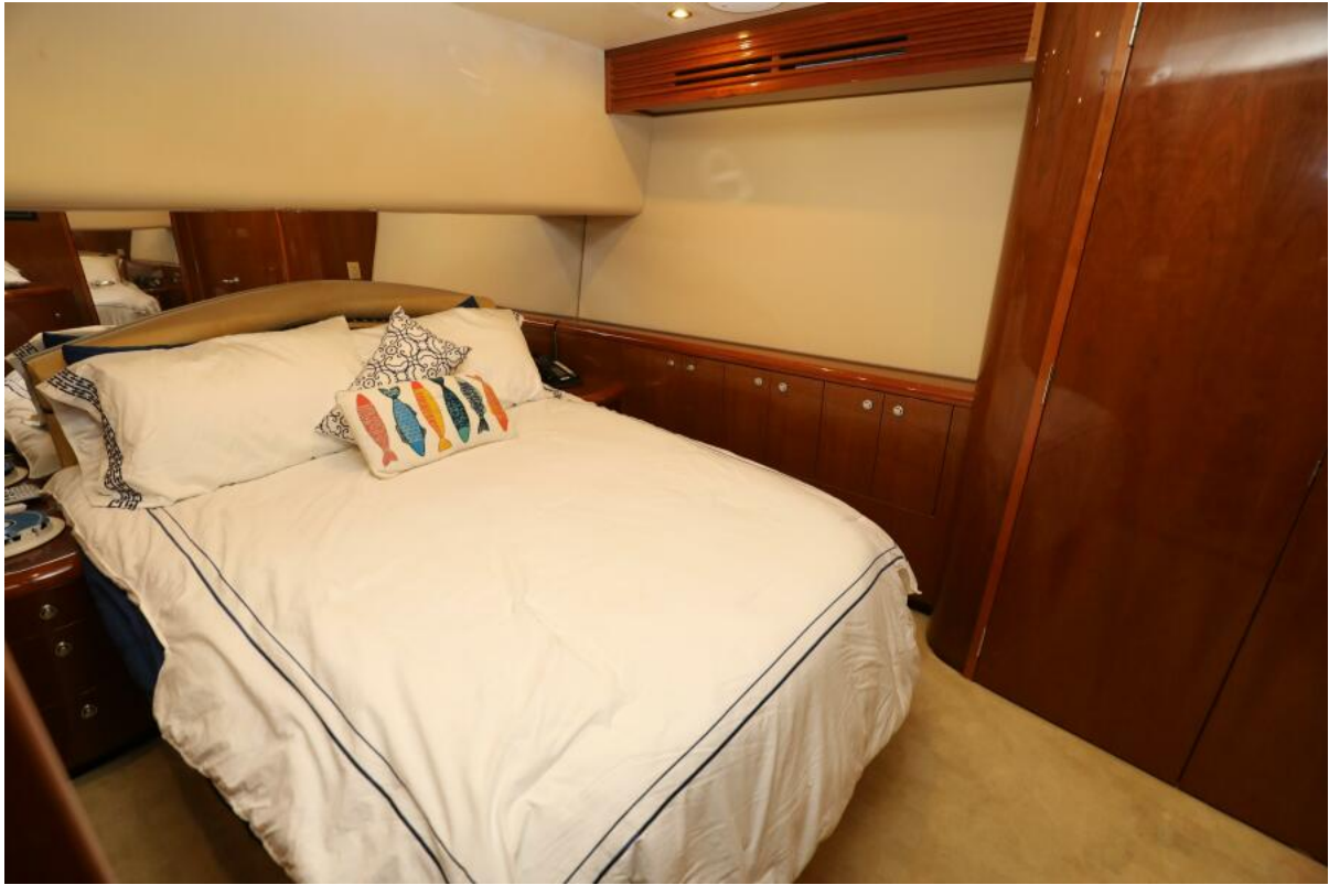
Hatteras 54 - See Legs - Master Stateroom 2006 Hatteras 54 - See Legs