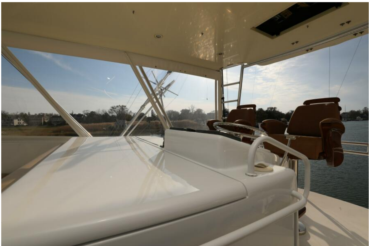
Hatteras 54 - See Legs - Flybridge 2006 Hatteras 54 - See Legs