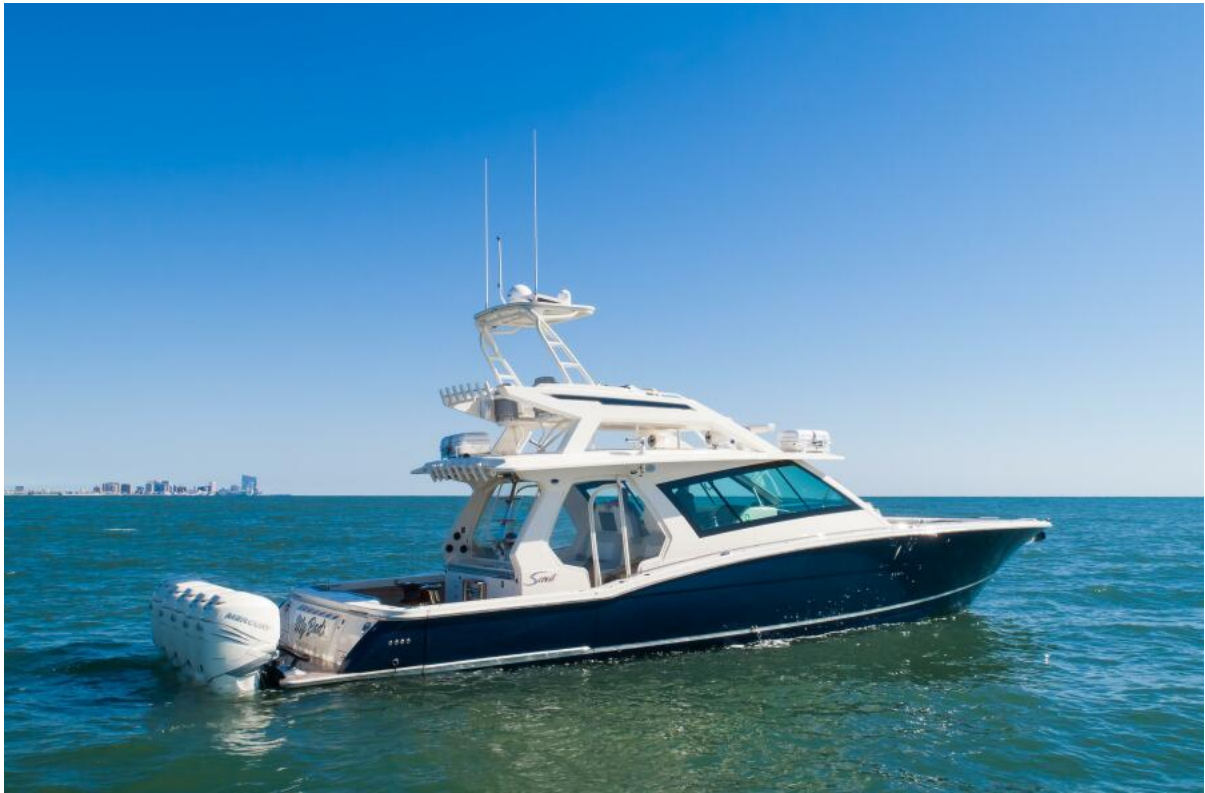
Scout 53 My Bad - Profile on water 2021 Scout 530 LXF My Bad