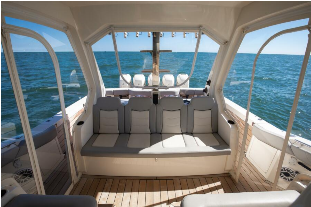
Scout 53 My Bad - Aft seating 2021 Scout 530 LXF My Bad