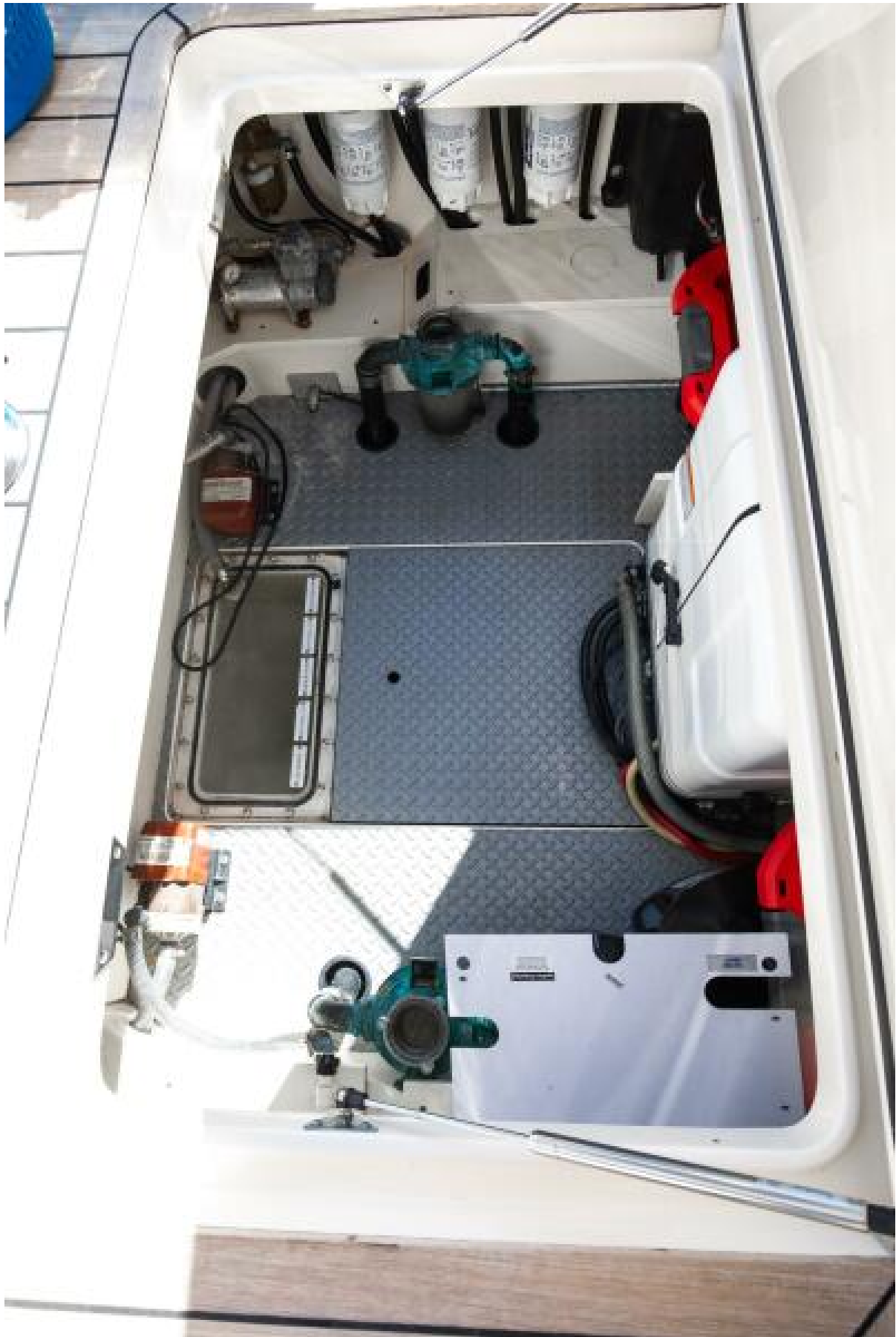
Scout 53 My Bad - Engine room 2021 Scout 530 LXF My Bad