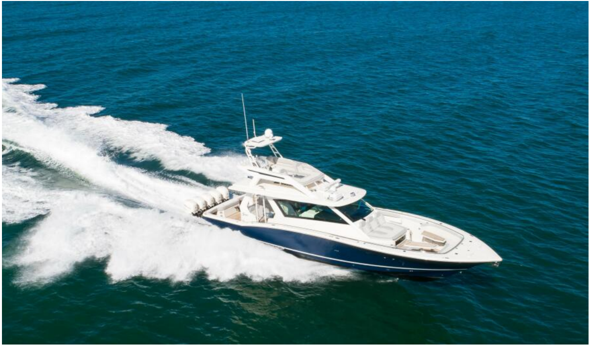
Scout 53 My Bad - Running profile 2021 Scout 530 LXF My Bad