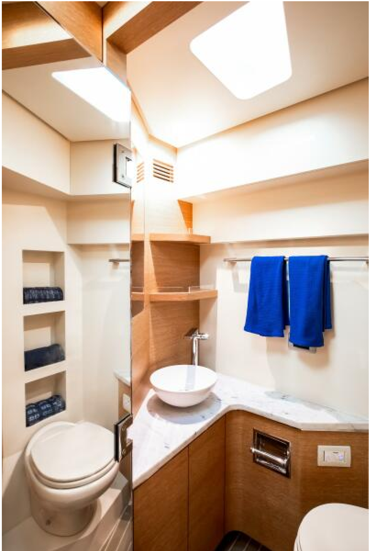
Scout 53 My Bad - Head 2021 Scout 530 LXF My Bad