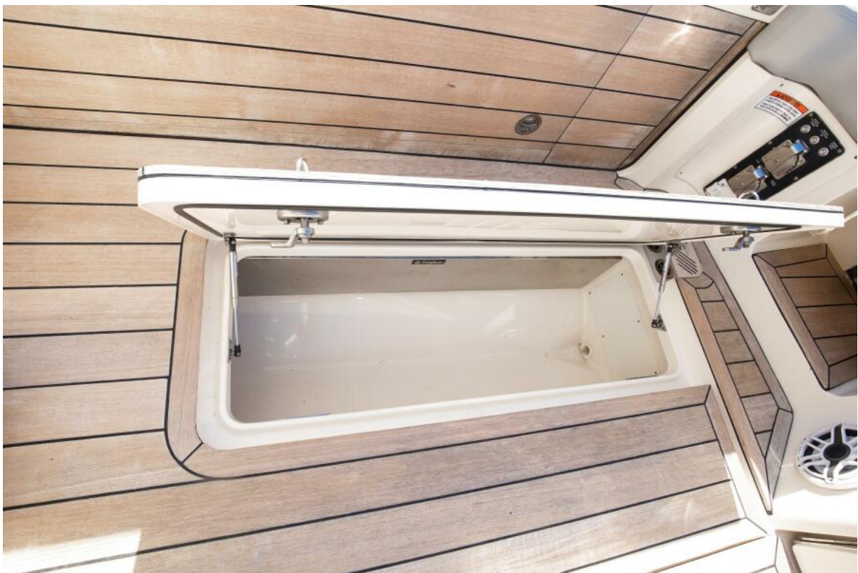
Scout 53 My Bad - Storage 2021 Scout 530 LXF My Bad