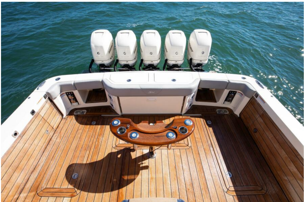
Scout 53 My Bad - Cockpit 2021 Scout 530 LXF My Bad