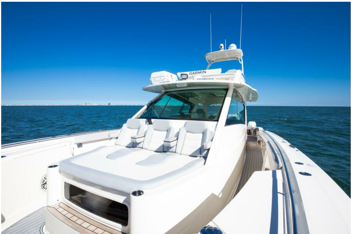
Scout 53 My Bad - Bow 2021 Scout 530 LXF My Bad