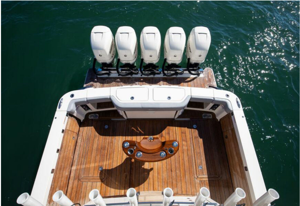
Scout 53 My Bad - Cockpit 2021 Scout 530 LXF My Bad