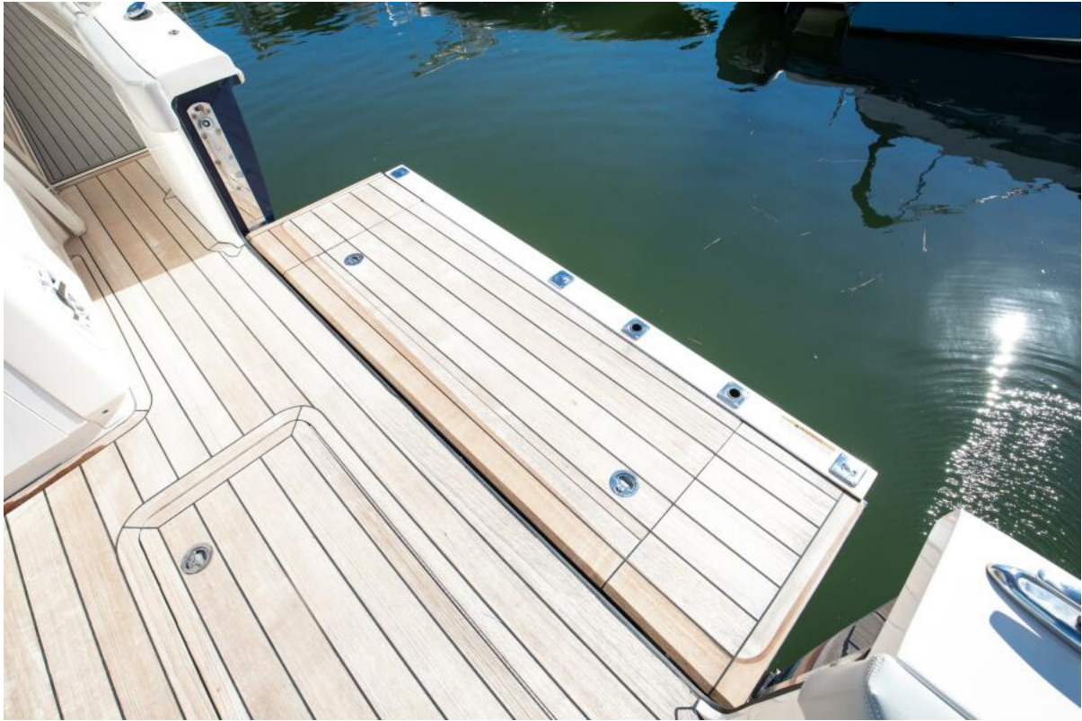
Scout 53 My Bad - 2021 Scout 530 LXF My Bad