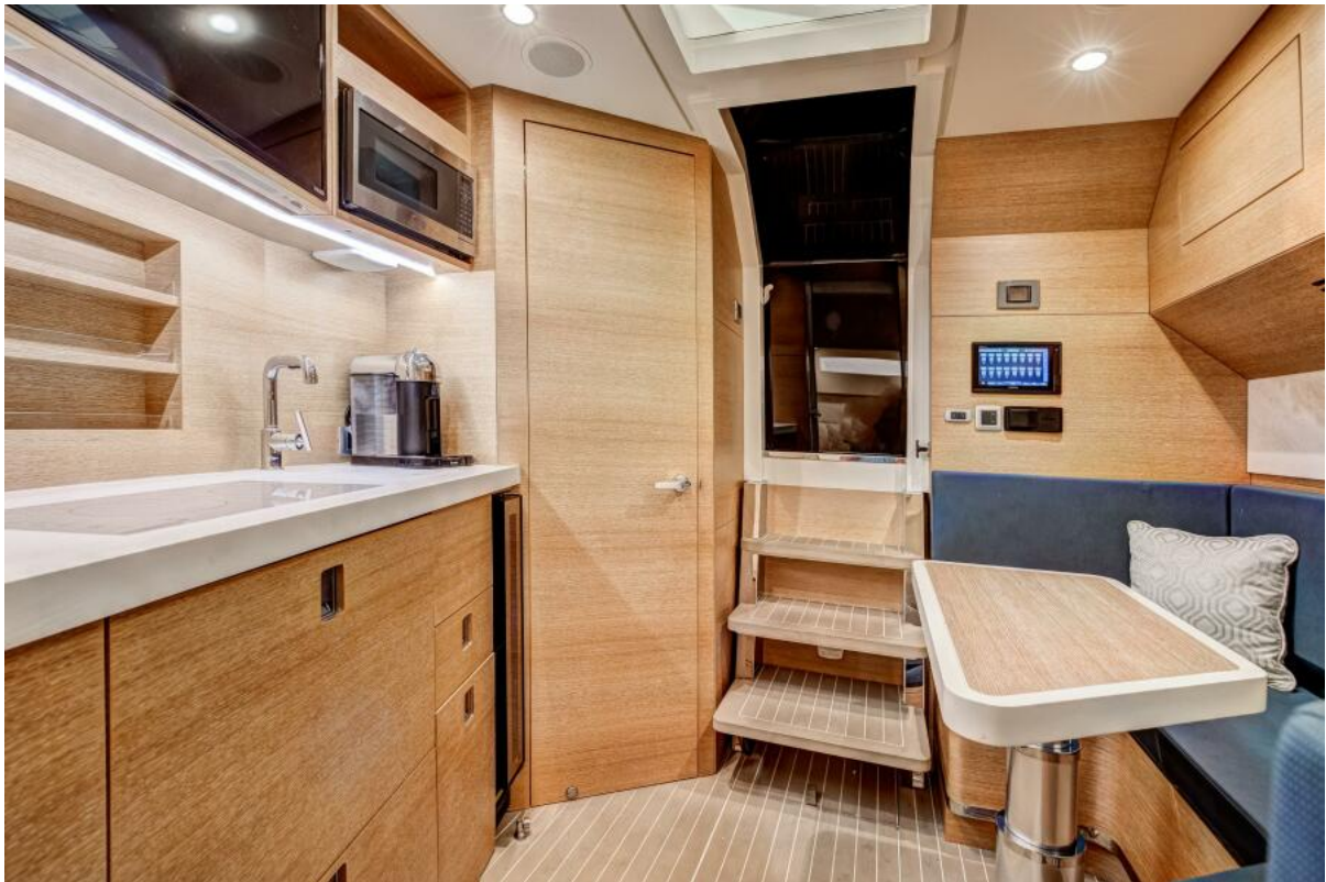
Scout 53 My Bad - Interior Cabin 2021 Scout 530 LXF My Bad