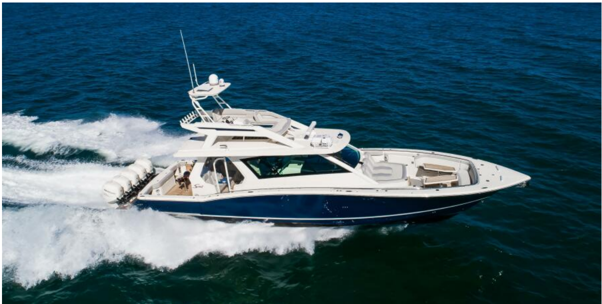
Scout 53 My Bad - Running profile 2021 Scout 530 LXF My Bad