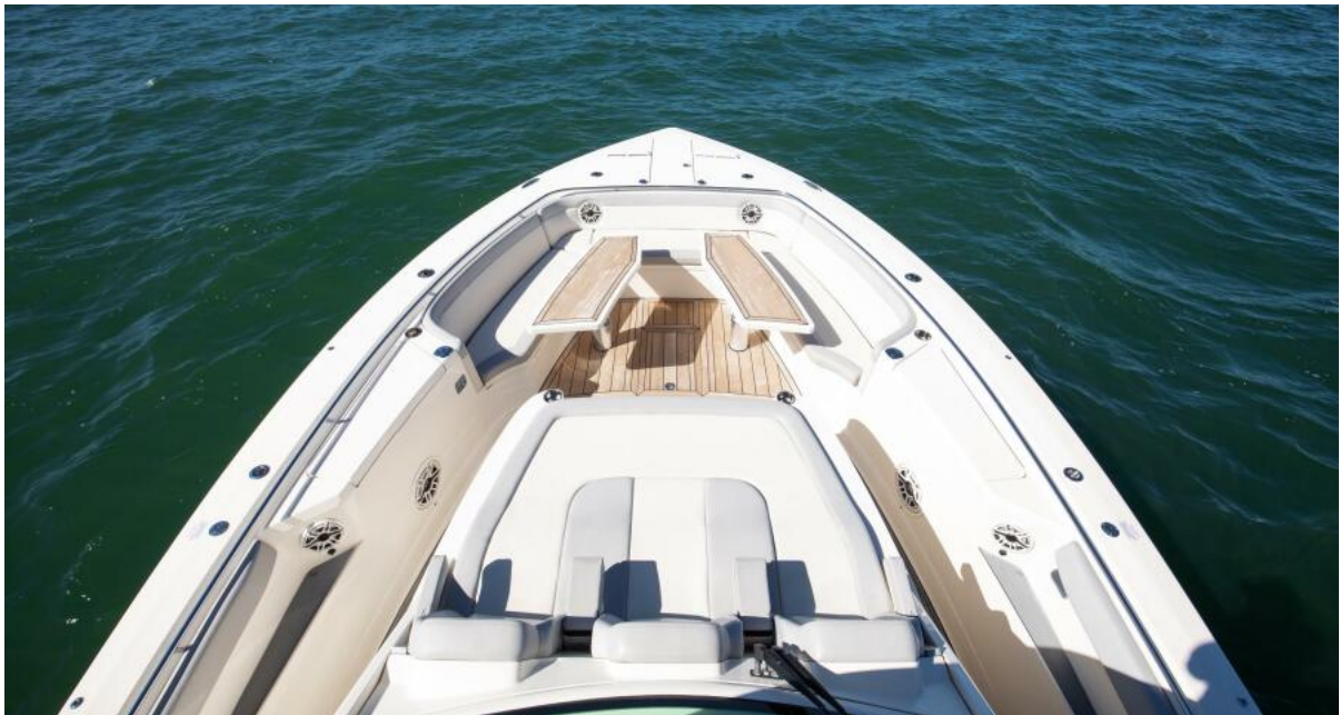
Scout 53 My Bad - Bow 2021 Scout 530 LXF My Bad