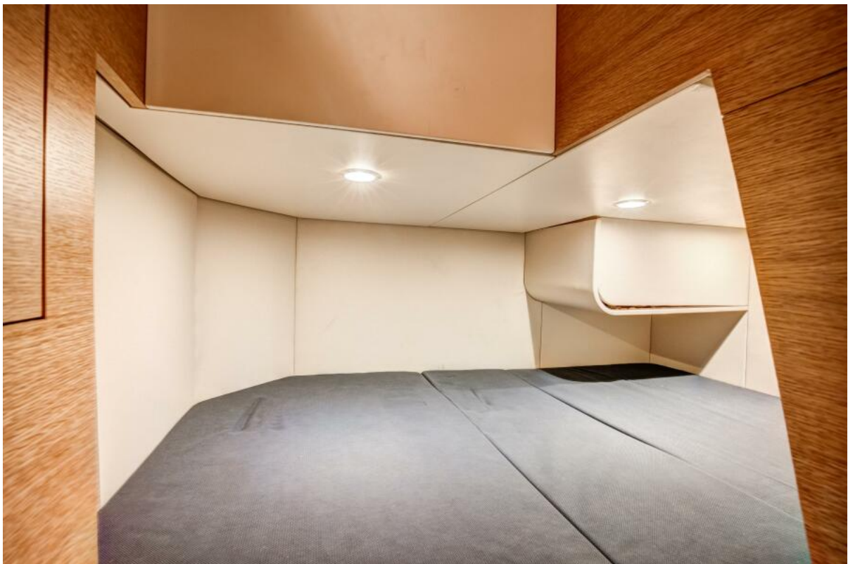
Scout 53 My Bad - Berth 2021 Scout 530 LXF My Bad