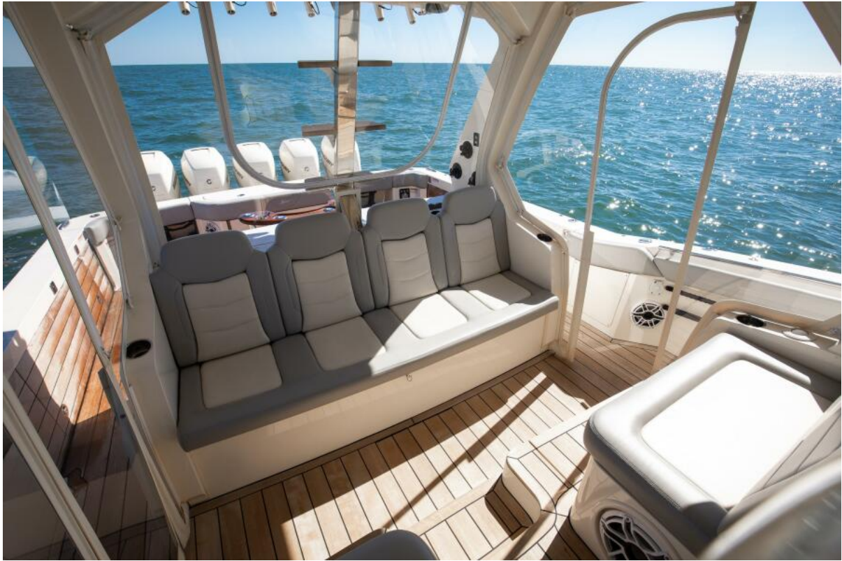
Scout 53 My Bad - Aft seating 2021 Scout 530 LXF My Bad