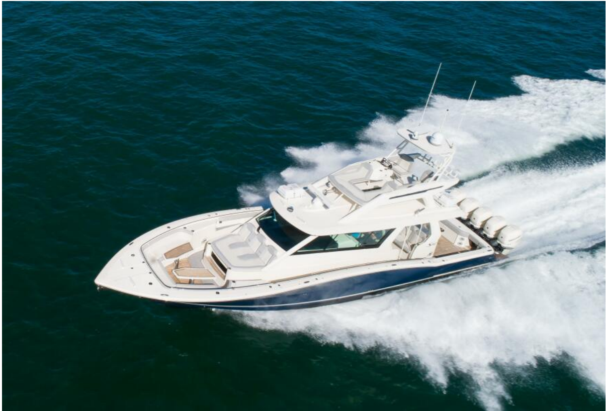
Scout 53 My Bad - Running Profile 2021 Scout 530 LXF My Bad