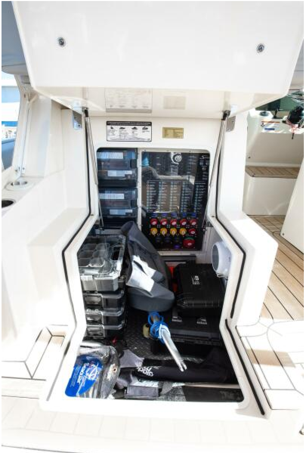
Scout 53 My Bad 2021 Scout 530 LXF My Bad