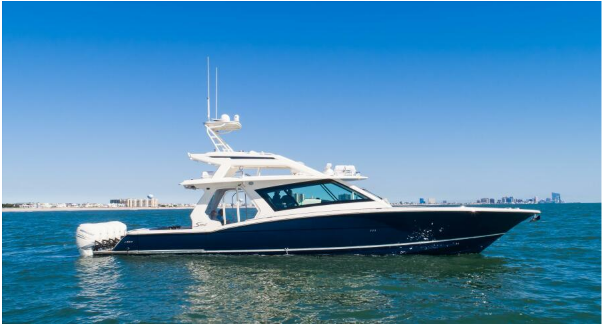
Scout 53 My Bad - Main profile on water 2021 Scout 530 LXF My Bad