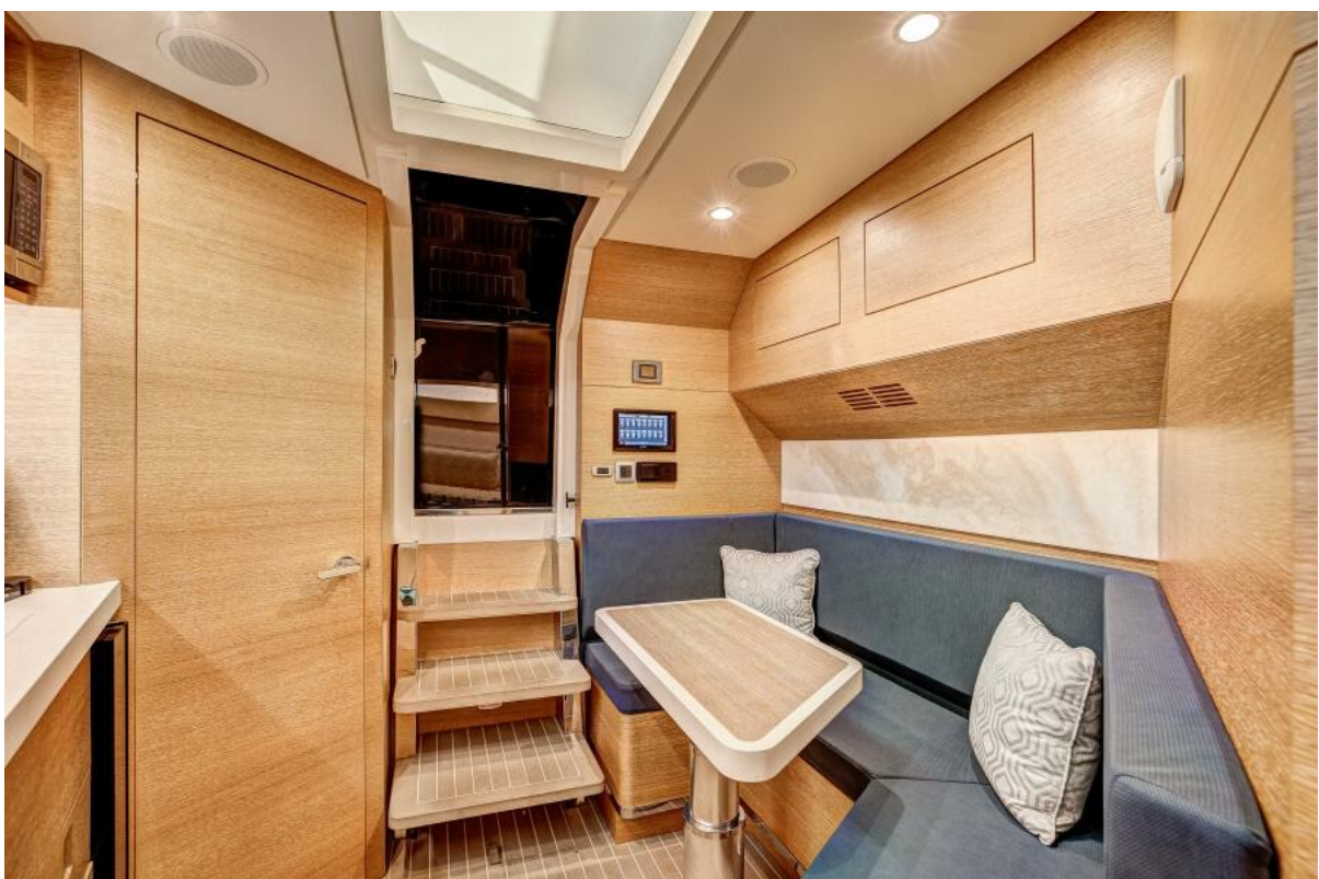
Scout 53 My Bad - Interior Cabin 2021 Scout 530 LXF My Bad