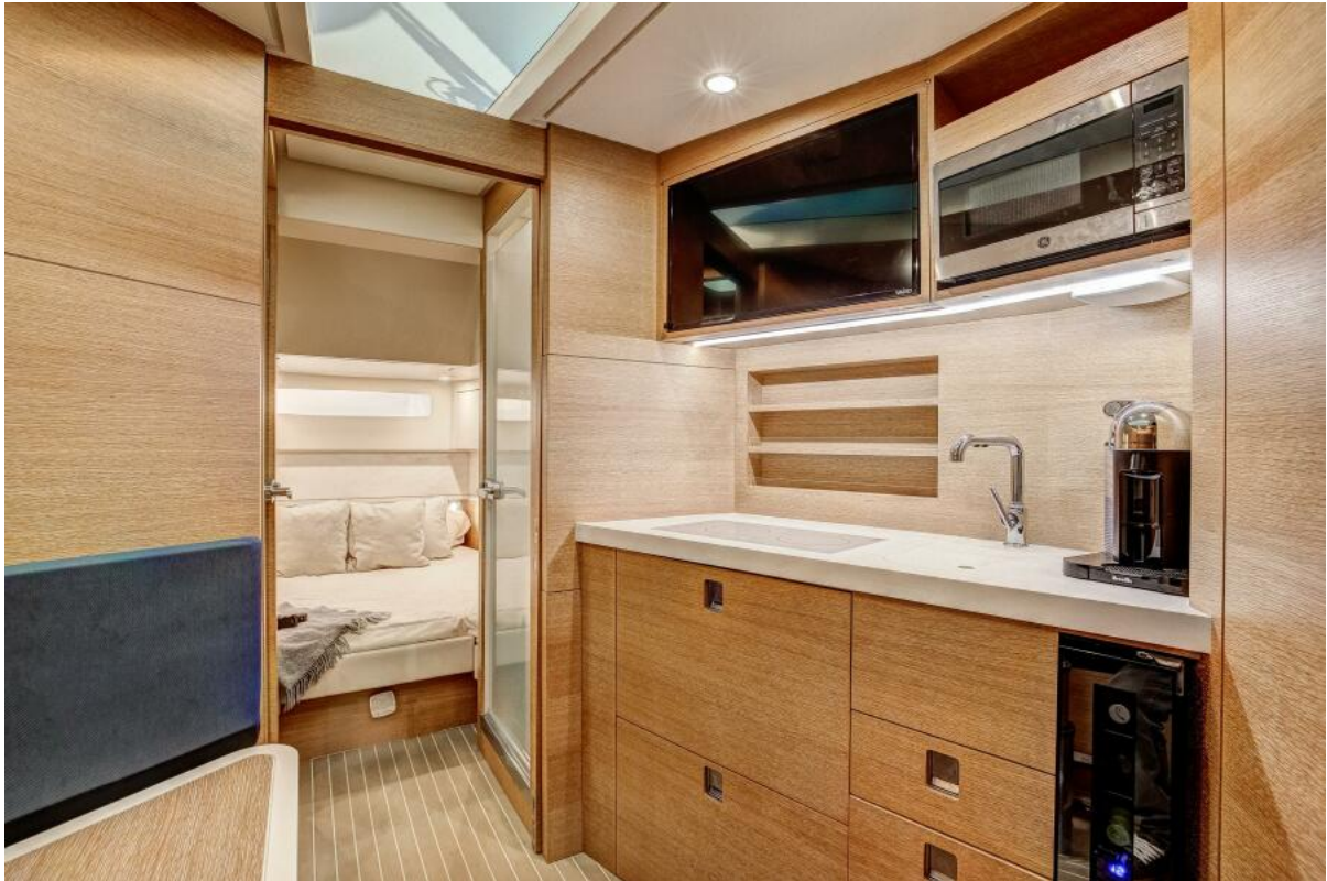
Scout 53 My Bad - Galley 2021 Scout 530 LXF My Bad