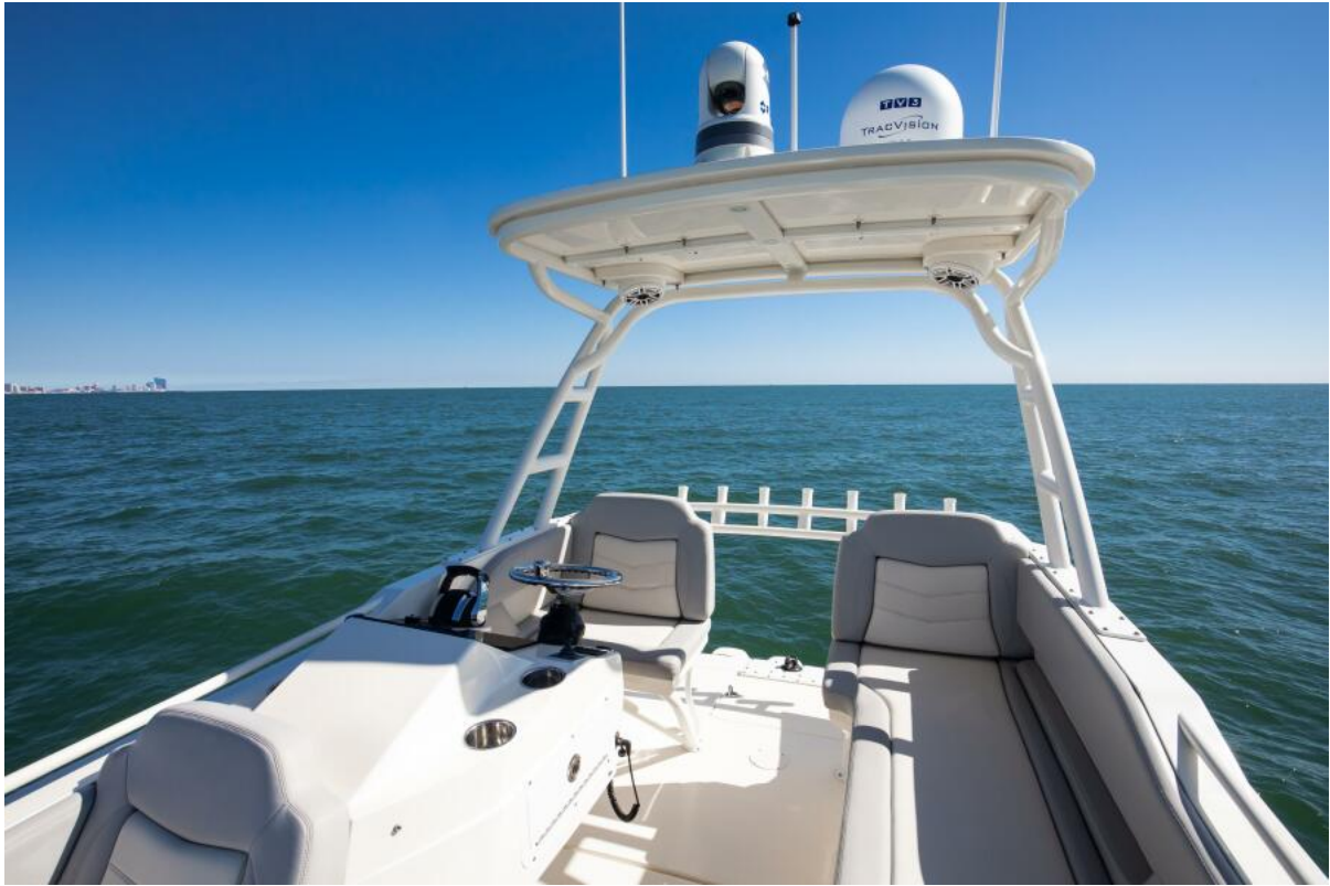
Scout 53 My Bad - Tower 2021 Scout 530 LXF My Bad