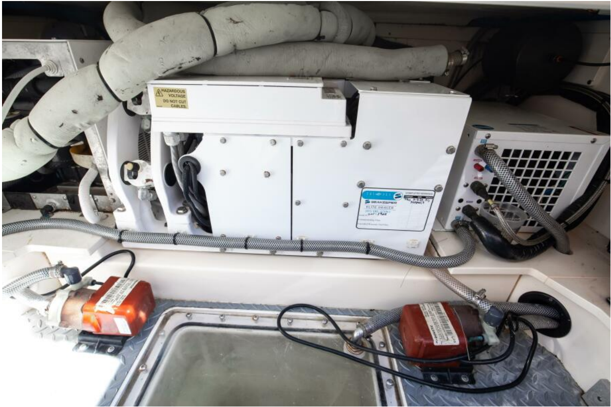
Scout 53 My Bad - Engine room 2021 Scout 530 LXF My Bad