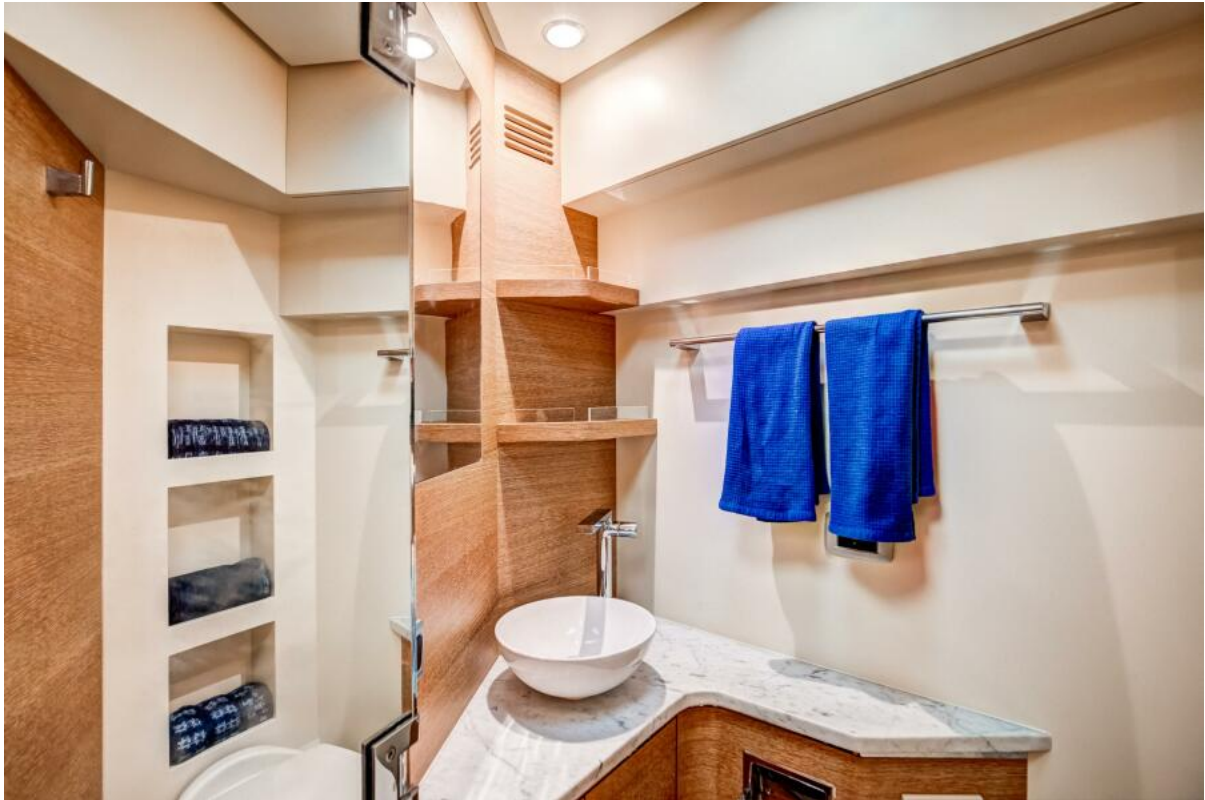
Scout 53 My Bad - Head 2021 Scout 530 LXF My Bad