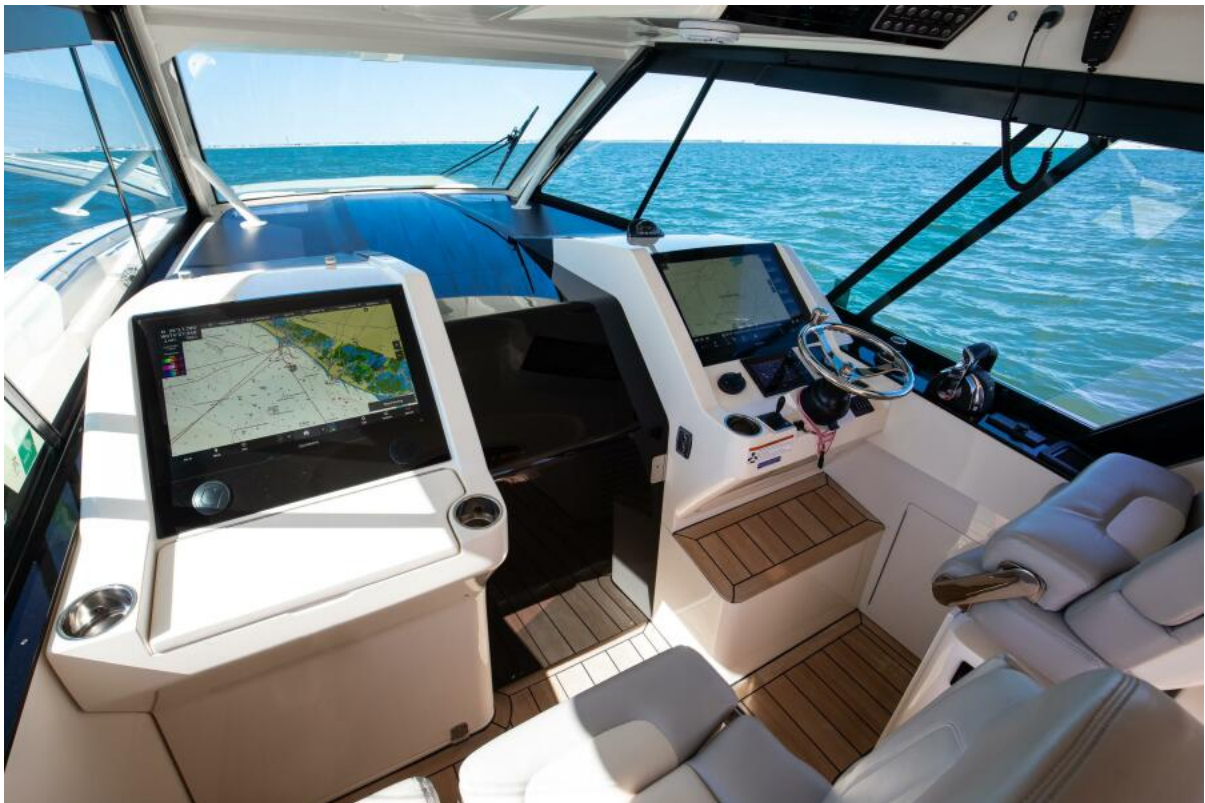
Scout 53 My Bad - Helm electronics 2021 Scout 530 LXF My Bad