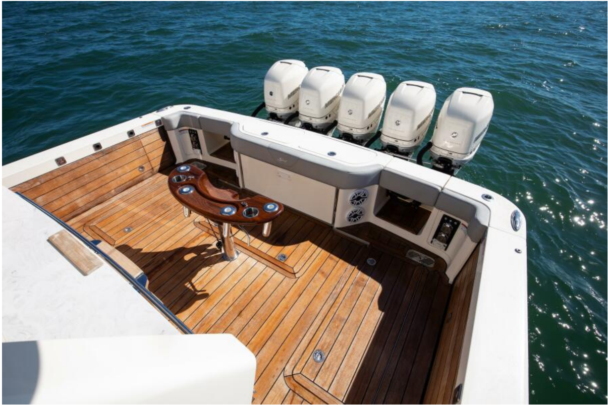
Scout 53 My Bad - Cockpit 2021 Scout 530 LXF My Bad