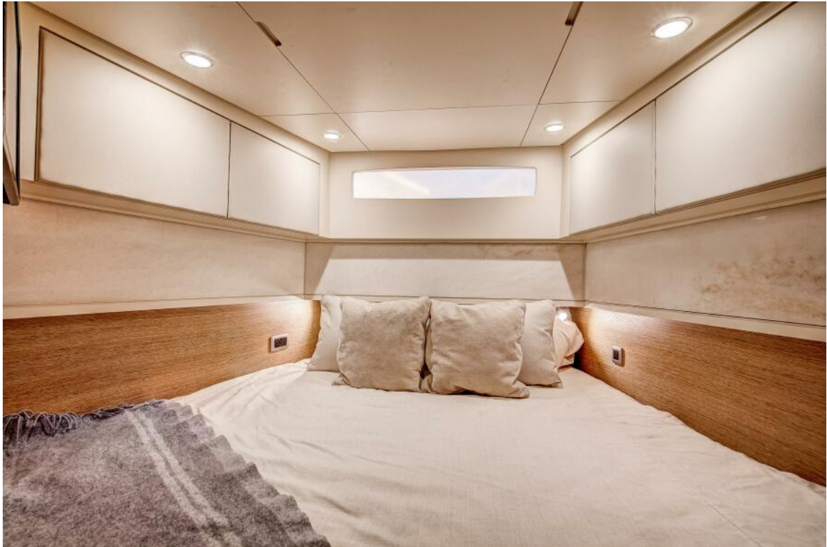
Scout 53 My Bad - Private berth 2021 Scout 530 LXF My Bad