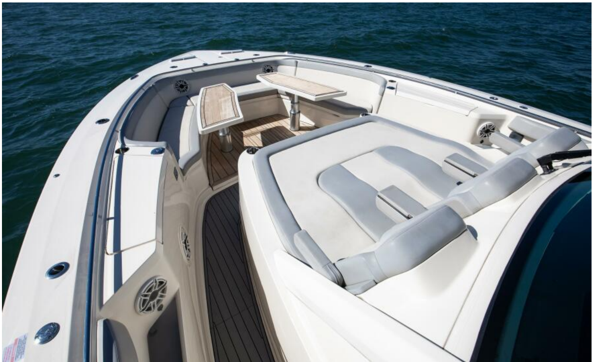
Scout 53 My Bad - Bow lounge seating 2021 Scout 530 LXF My Bad