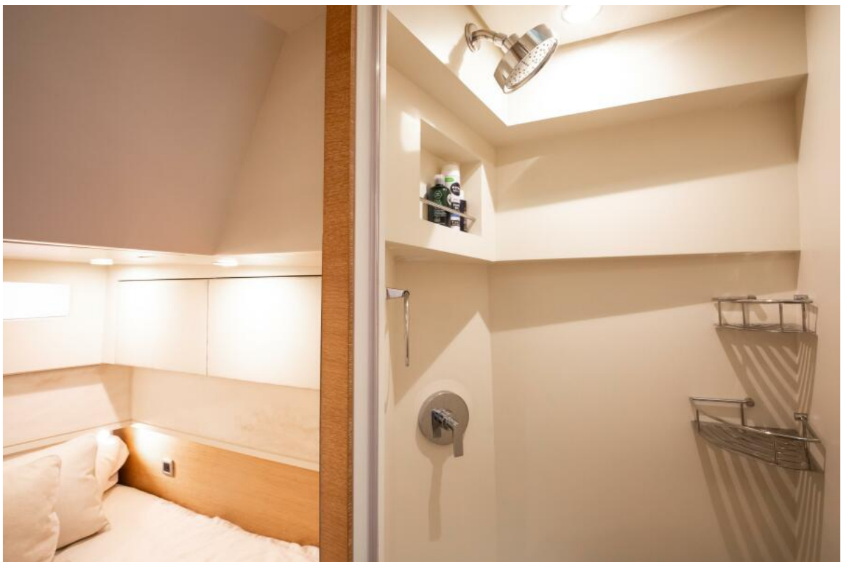
Scout 53 My Bad - Head/Shower 2021 Scout 530 LXF My Bad