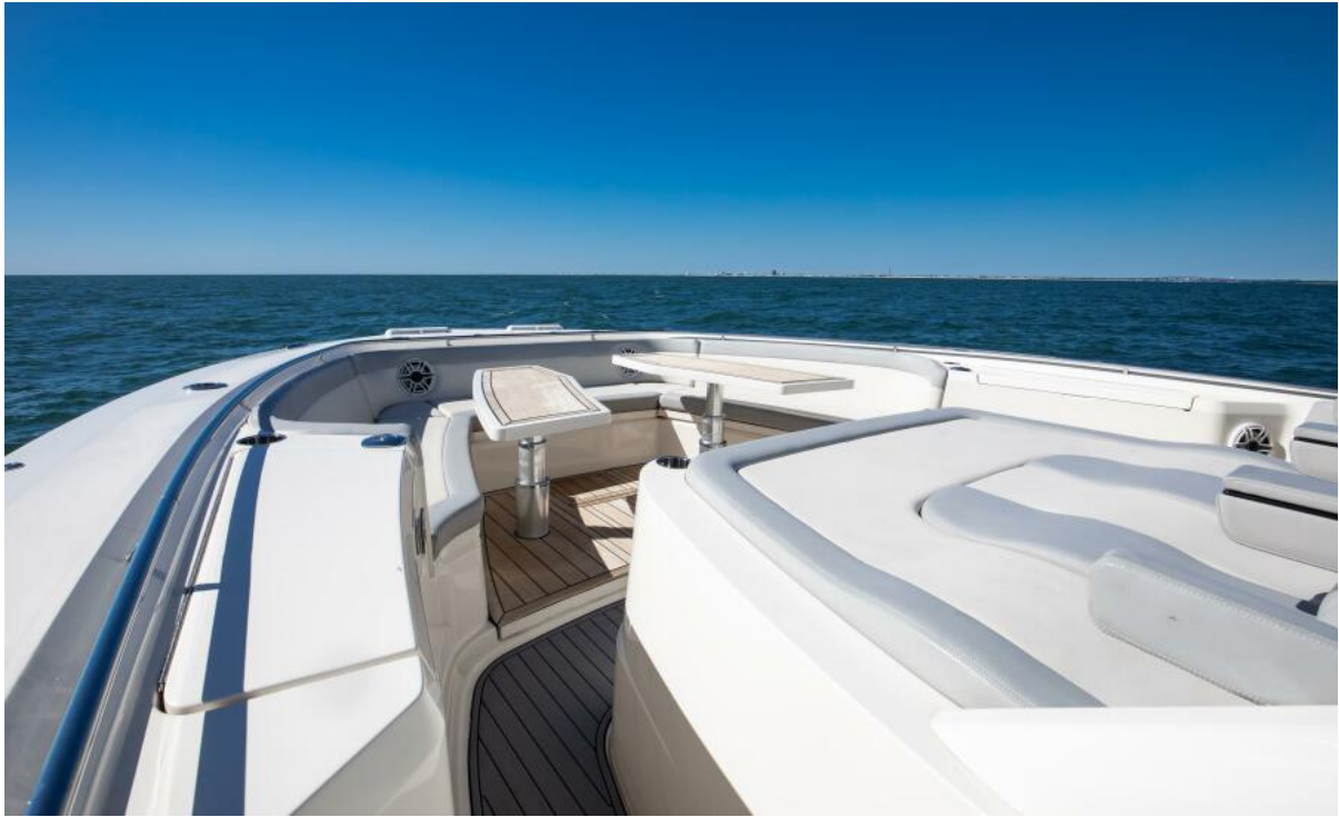
Scout 53 My Bad - Bow lounge seating 2021 Scout 530 LXF My Bad