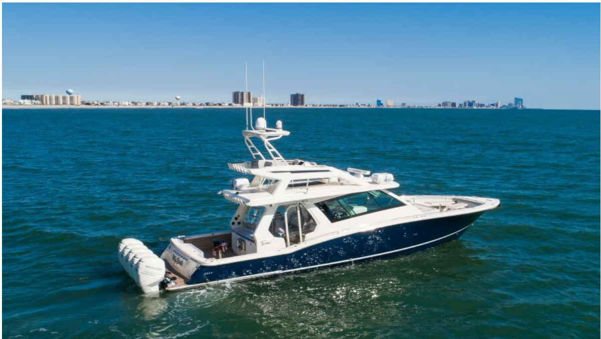
Scout 53 My Bad - Profile 2021 Scout 530 LXF My Bad