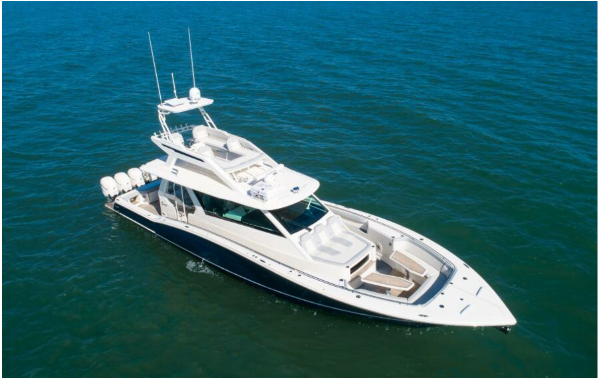
Scout 53 My Bad - Profile 2021 Scout 530 LXF My Bad