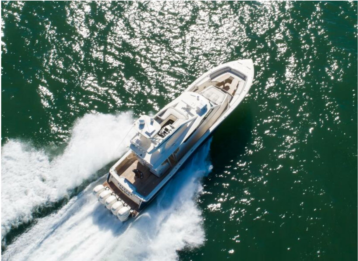
Scout 53 My Bad - Aerial profile 2021 Scout 530 LXF My Bad