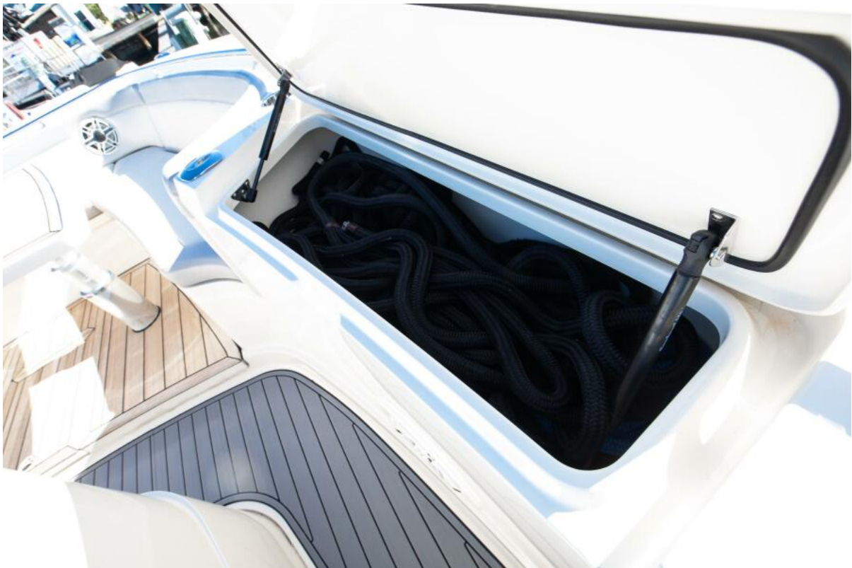
Scout 53 My Bad - Storage 2021 Scout 530 LXF My Bad