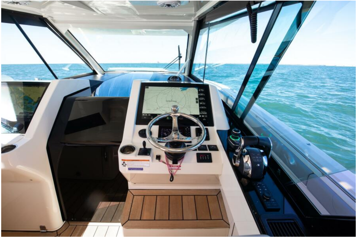
Scout 53 My Bad - Helm 2021 Scout 530 LXF My Bad