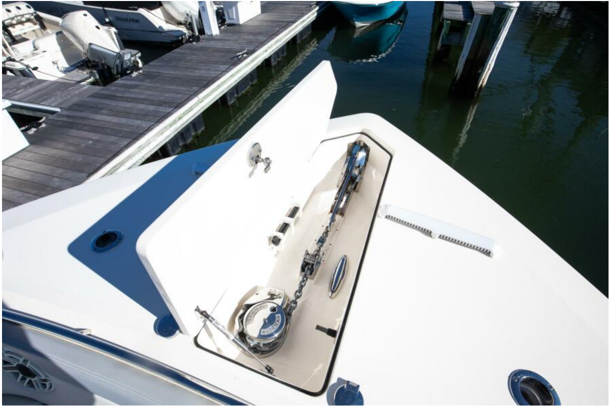
Scout 53 My Bad - Anchor 2021 Scout 530 LXF My Bad