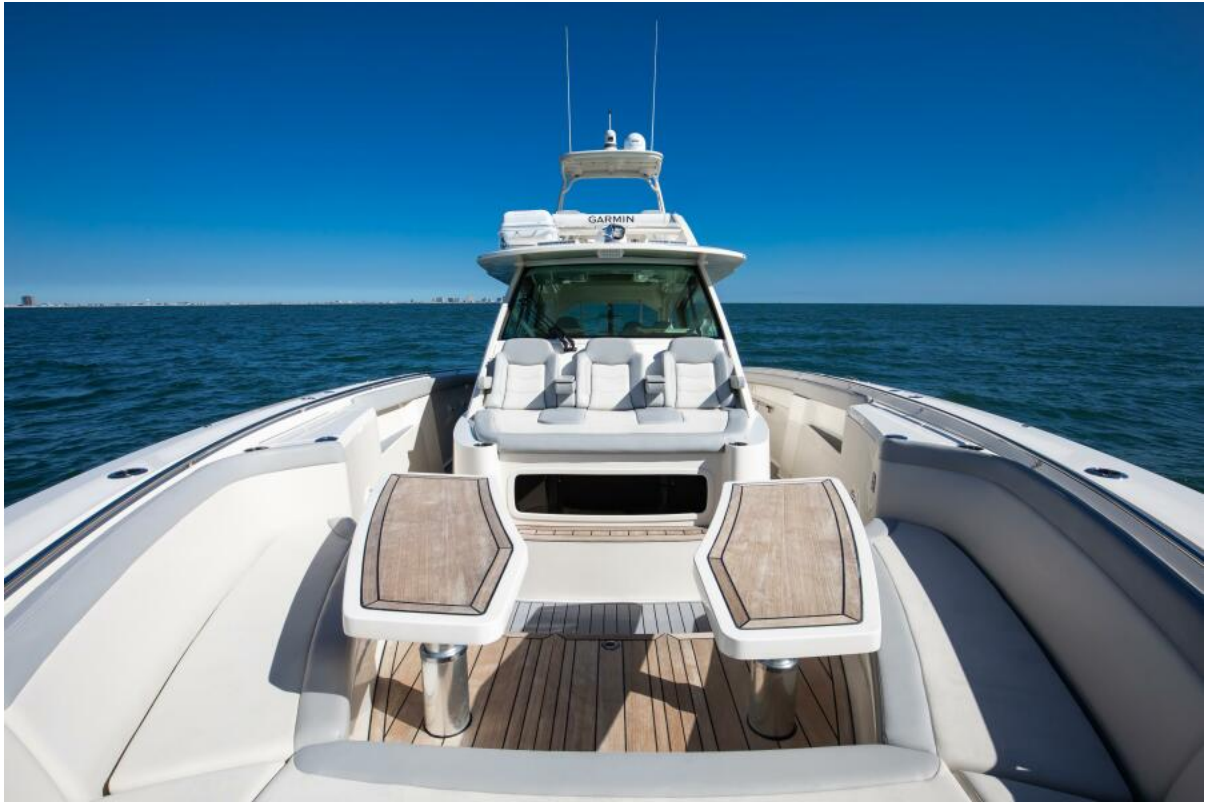
Scout 53 My Bad - Bow 2021 Scout 530 LXF My Bad