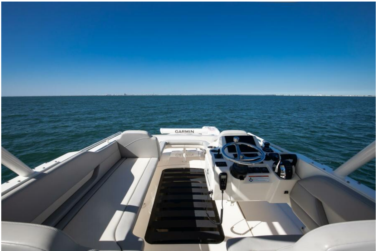
Scout 53 My Bad - Tower electronics 2021 Scout 530 LXF My Bad