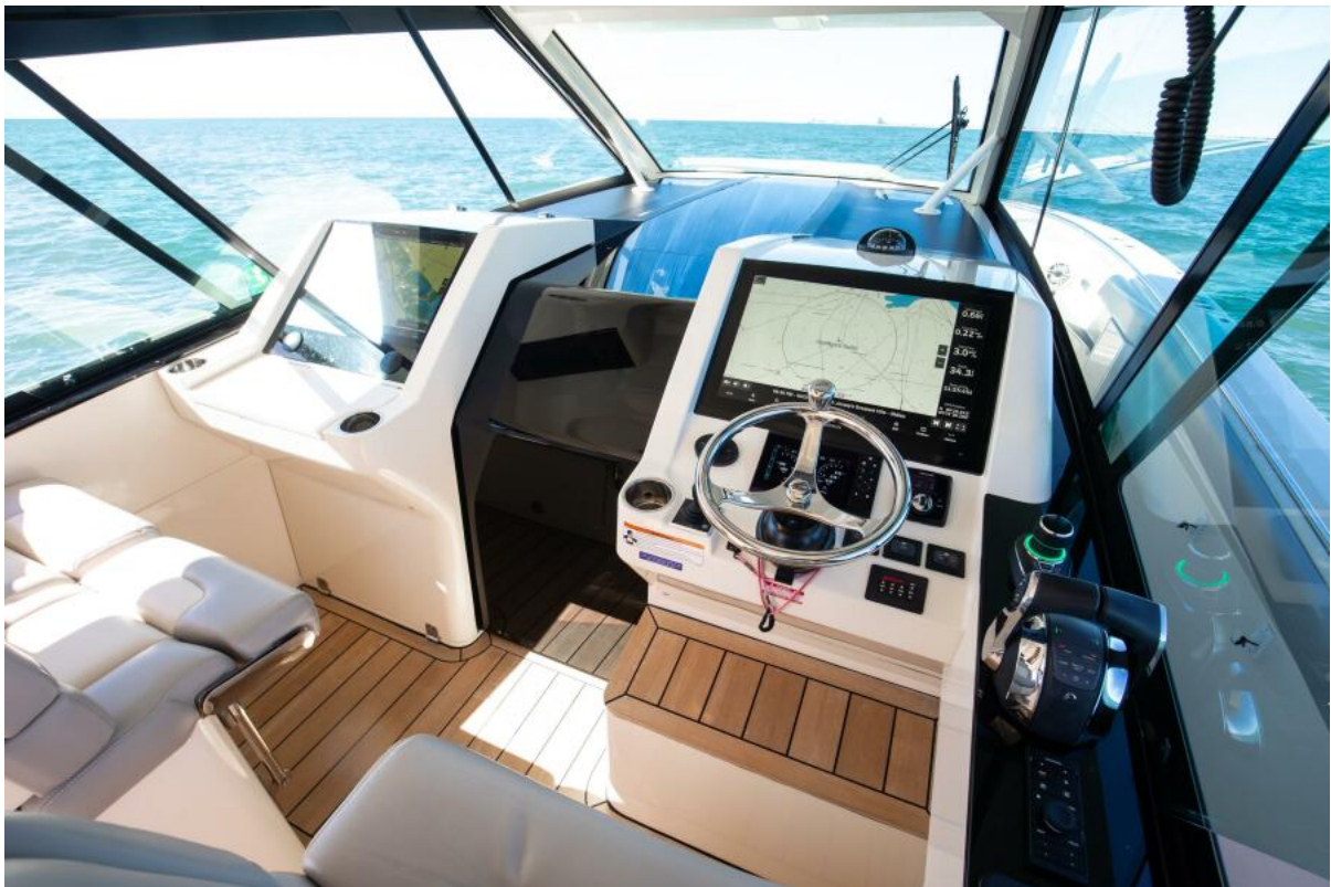
Scout 53 My Bad - Helm 2021 Scout 530 LXF My Bad