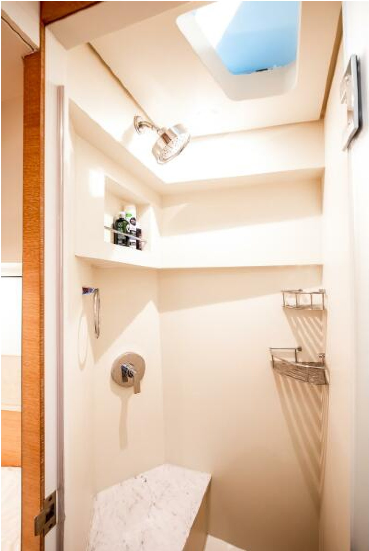
Scout 53 My Bad - Head/Shower 2021 Scout 530 LXF My Bad