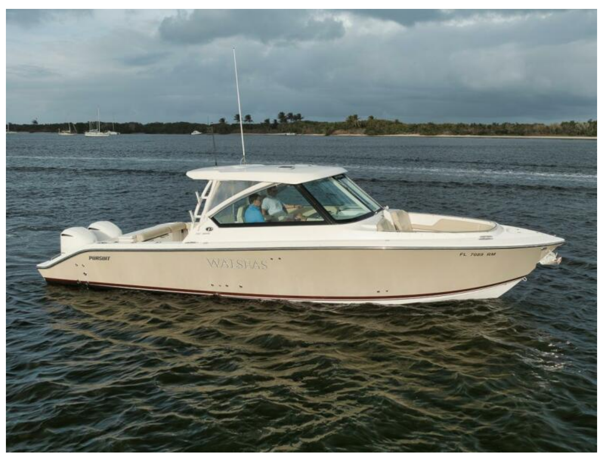
32 Pursuit 2017