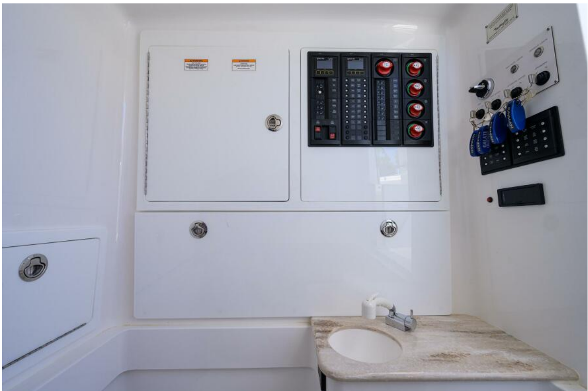
Valhalla 41 Reel Time - Head, Electrical Panel 2021 Valhalla 41 Center Console Reel Time