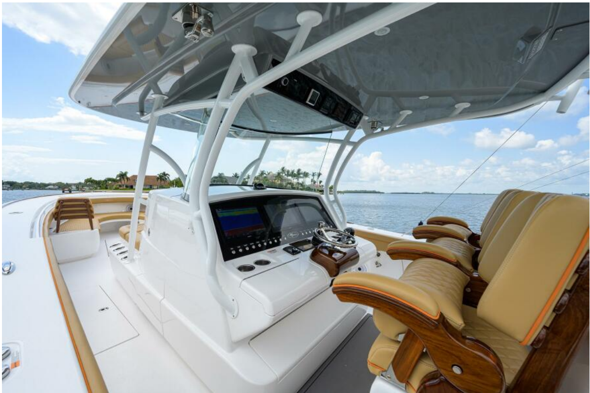
Valhalla 41 Reel Time - Console Electronics 2021 Valhalla 41 Center Console Reel Time