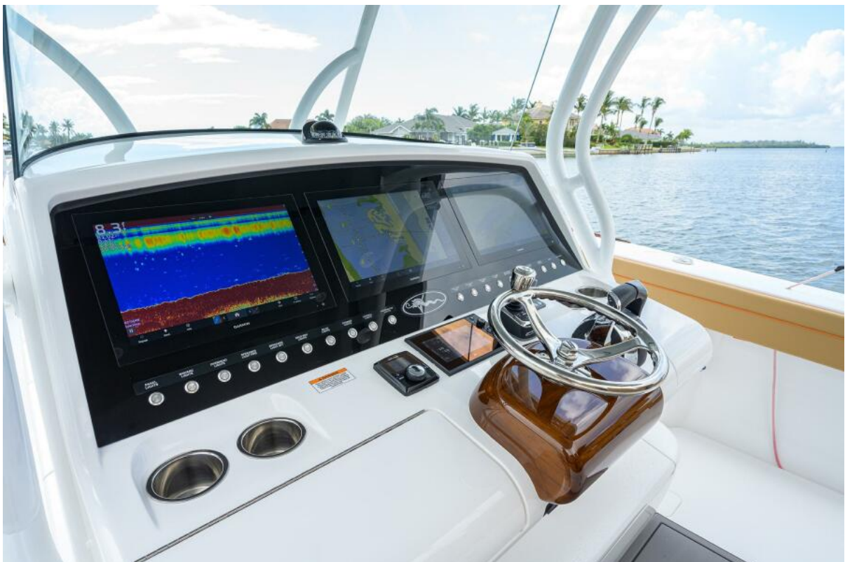
Valhalla 41 Reel Time - Console Electronics 2021 Valhalla 41 Center Console Reel Time