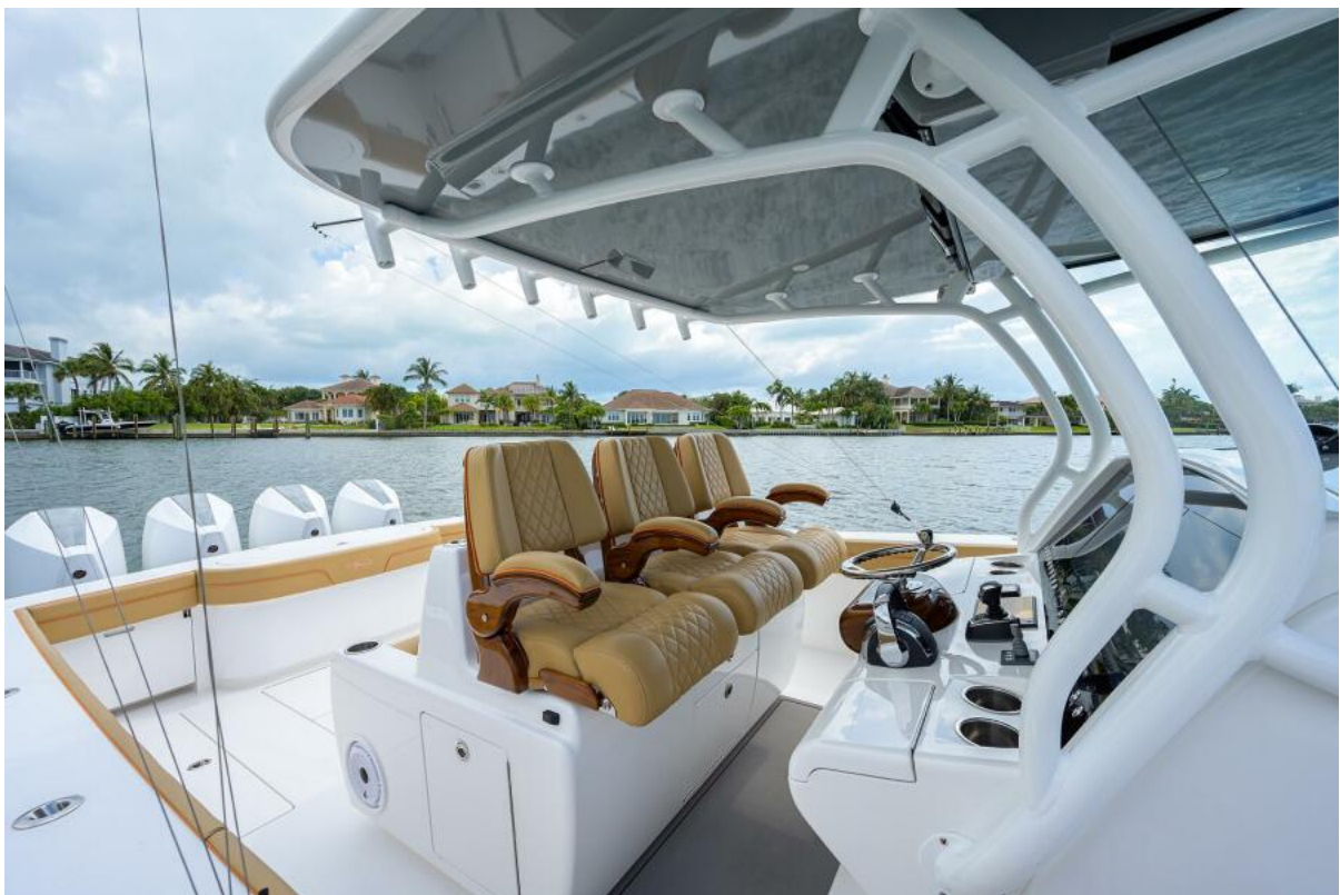
Valhalla 41 Reel Time - Console Seating 2021 Valhalla 41 Center Console Reel Time