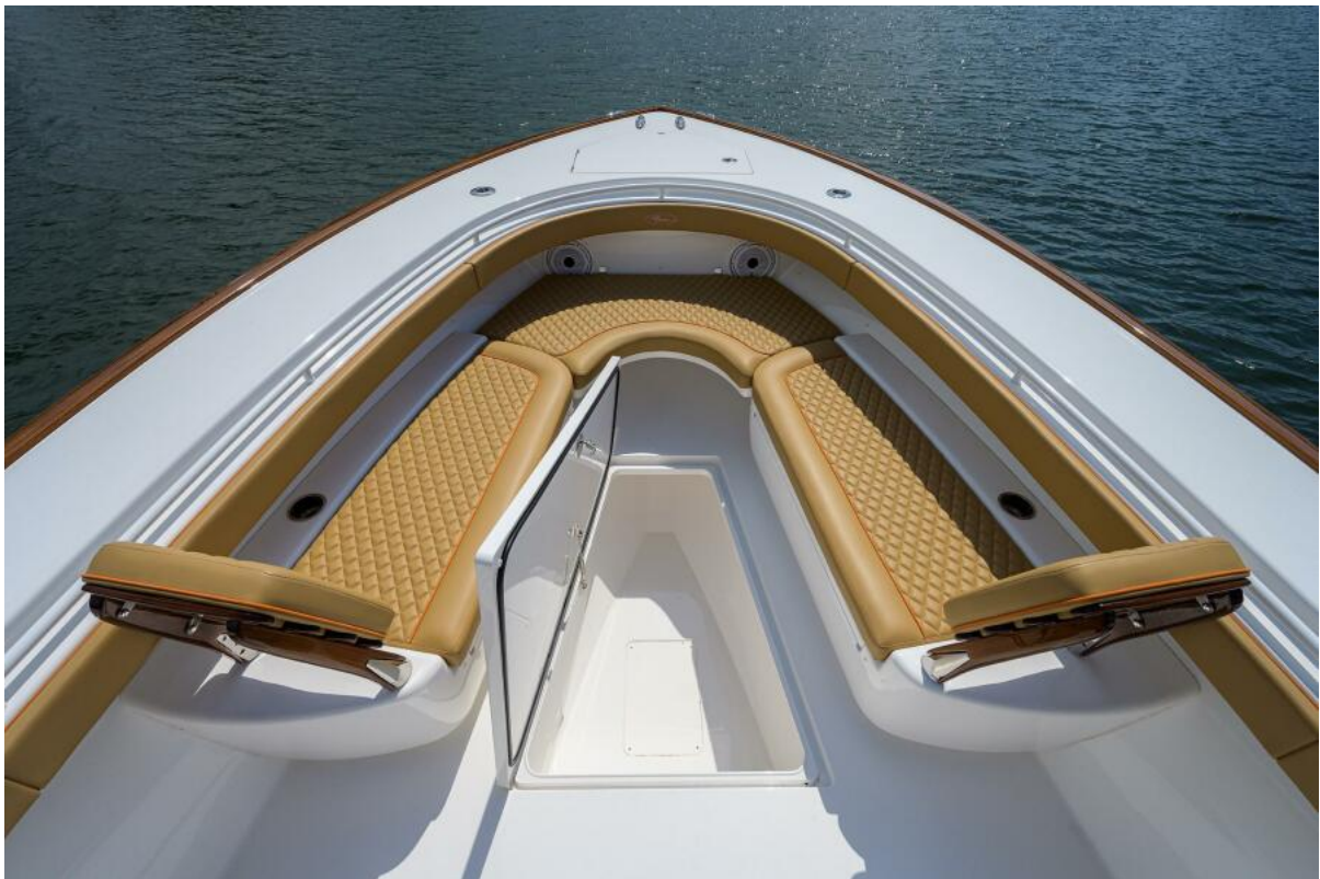
Valhalla 41 Reel Time - Forward Bow Seating, Sun Shade 2021 Valhalla 41 Center Console Reel Time