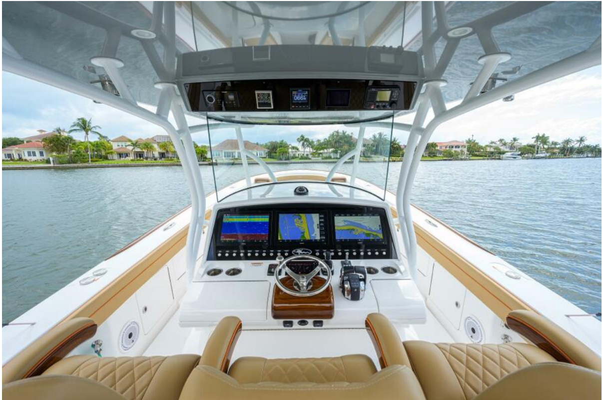
Valhalla 41 Reel Time - Console Electronics 2021 Valhalla 41 Center Console Reel Time