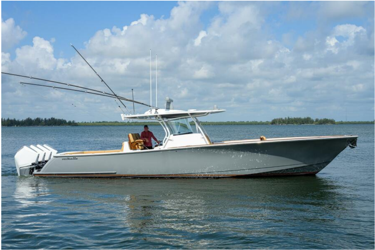
Valhalla 41 Reel Time - Profile 2021 Valhalla 41 Center Console Reel Time