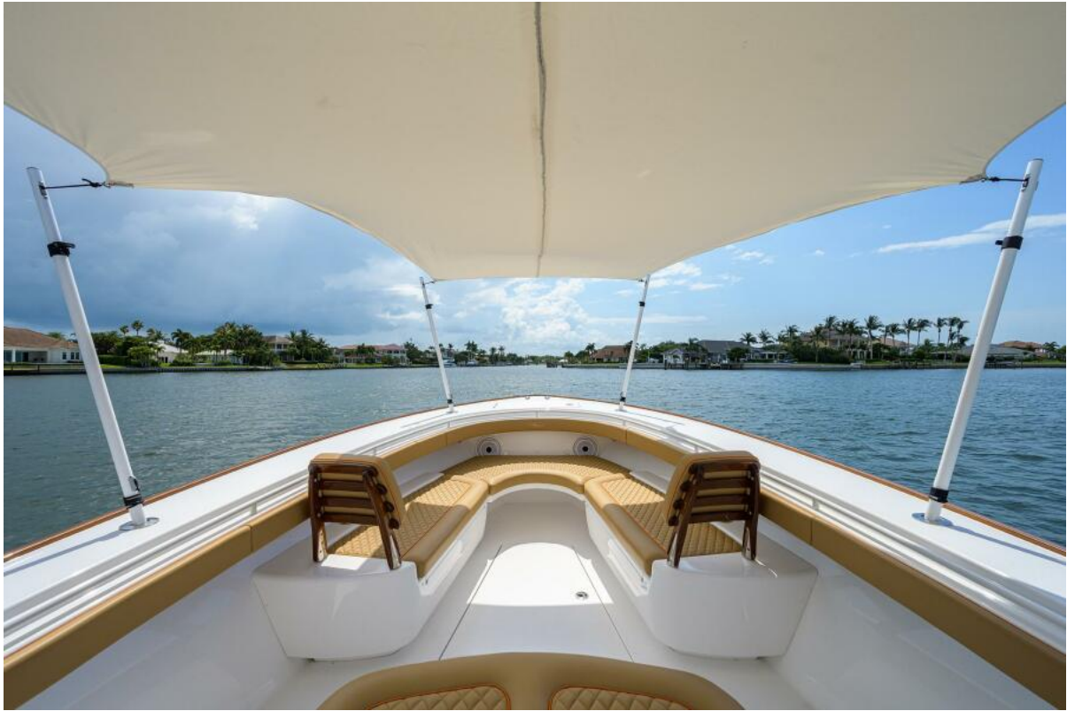
Valhalla 41 Reel Time - Forward Bow Seating, Sun Shade 2021 Valhalla 41 Center Console Reel Time