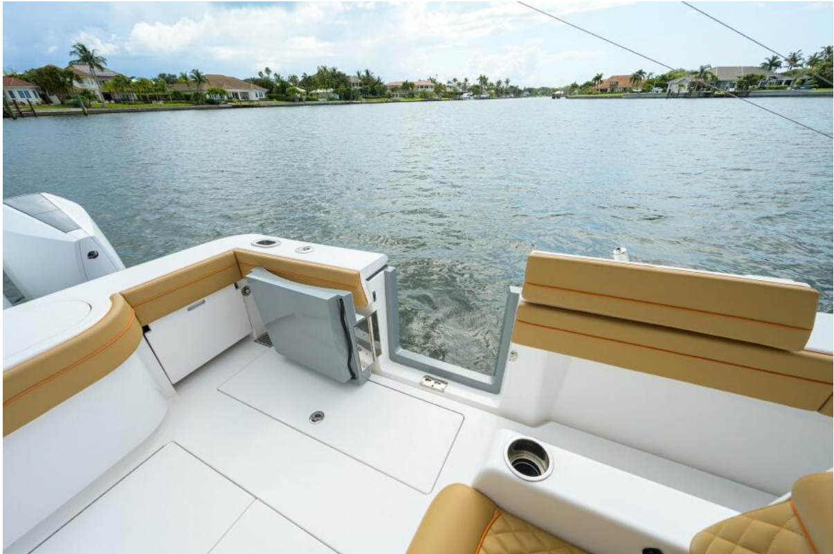
Valhalla 41 Reel Time - Transom Door 2021 Valhalla 41 Center Console Reel Time