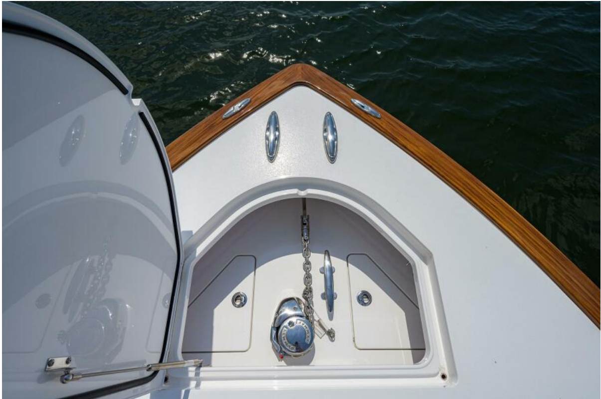
Valhalla 41 Reel Time - Forward Anchor Locker 2021 Valhalla 41 Center Console Reel Time