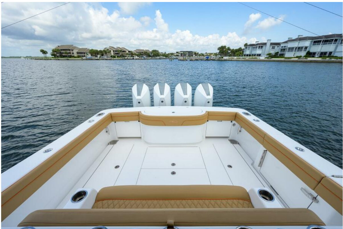
Valhalla 41 Reel Time - Cockpit 2021 Valhalla 41 Center Console Reel Time