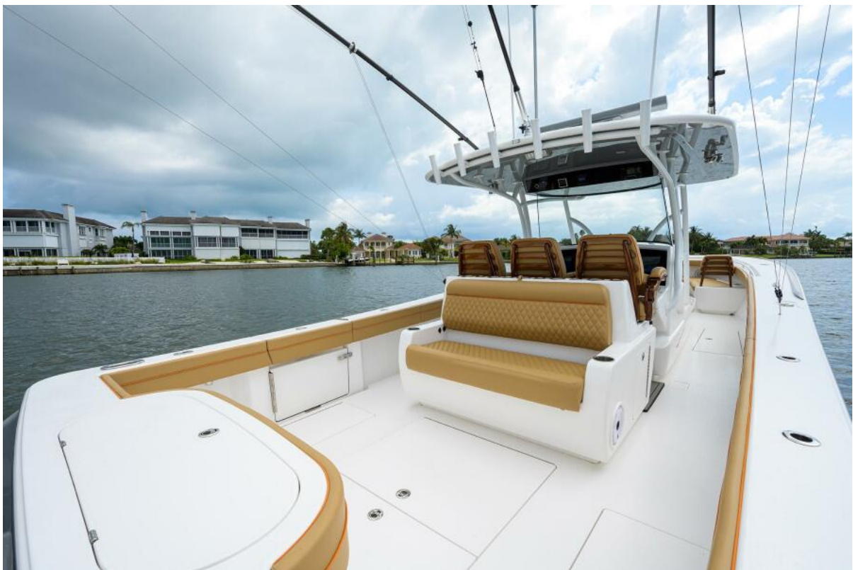
Valhalla 41 Reel Time - Aft Facing Console Seat 2021 Valhalla 41 Center Console Reel Time