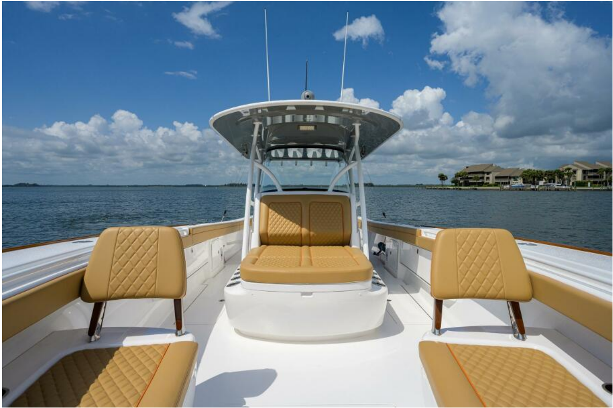
Valhalla 41 Reel Time - Forward Facing Console Seat 2021 Valhalla 41 Center Console Reel Time