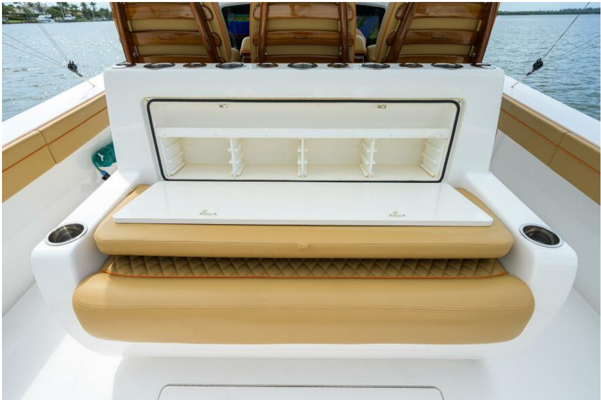
Valhalla 41 Reel Time - Aft Facing Seating 2021 Valhalla 41 Center Console Reel Time