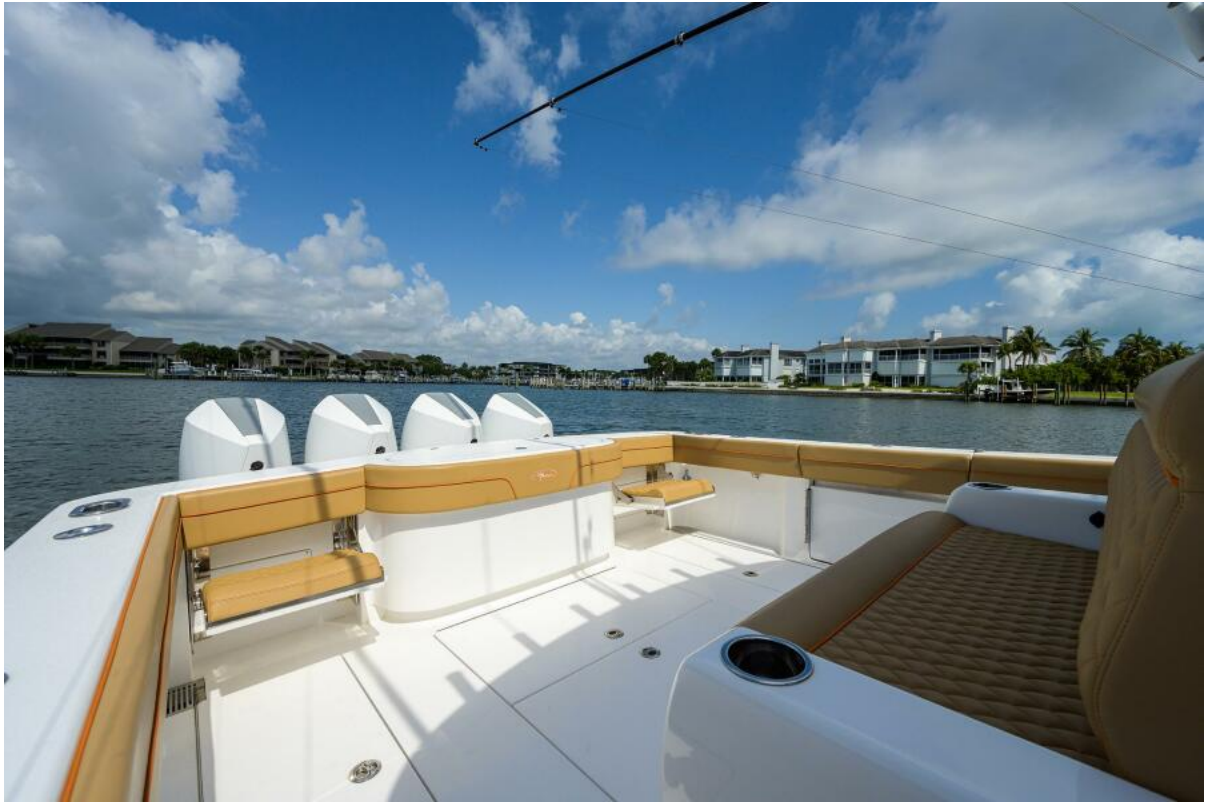
Valhalla 41 Reel Time - Aft Seating 2021 Valhalla 41 Center Console Reel Time