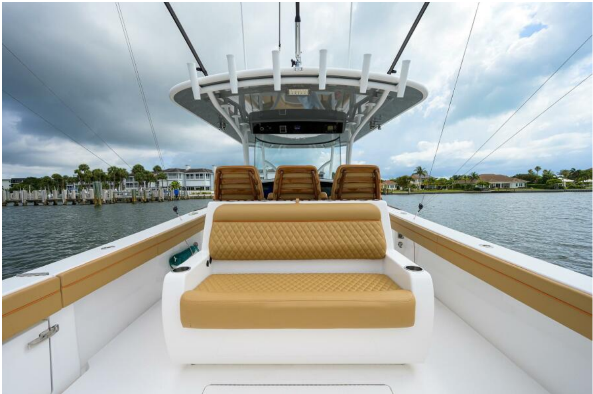
Valhalla 41 Reel Time - Aft Facing Seating 2021 Valhalla 41 Center Console Reel Time