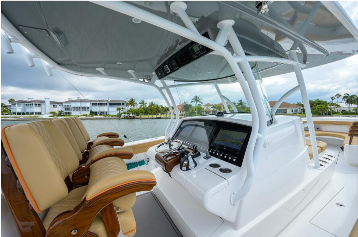
Valhalla 41 Reel Time - Console Electronics 2021 Valhalla 41 Center Console Reel Time