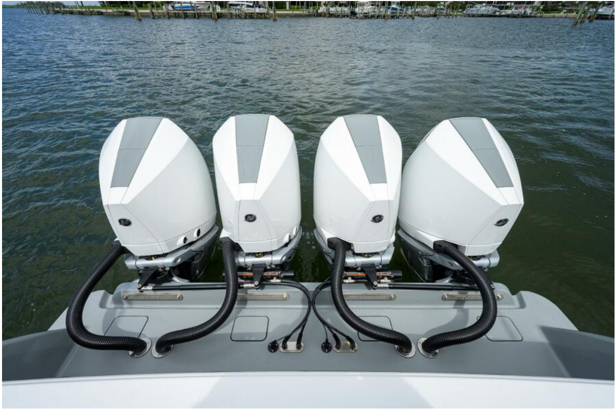
Valhalla 41 Reel Time - Quad Mercury Verado Engines 2021 Valhalla 41 Center Console Reel Time