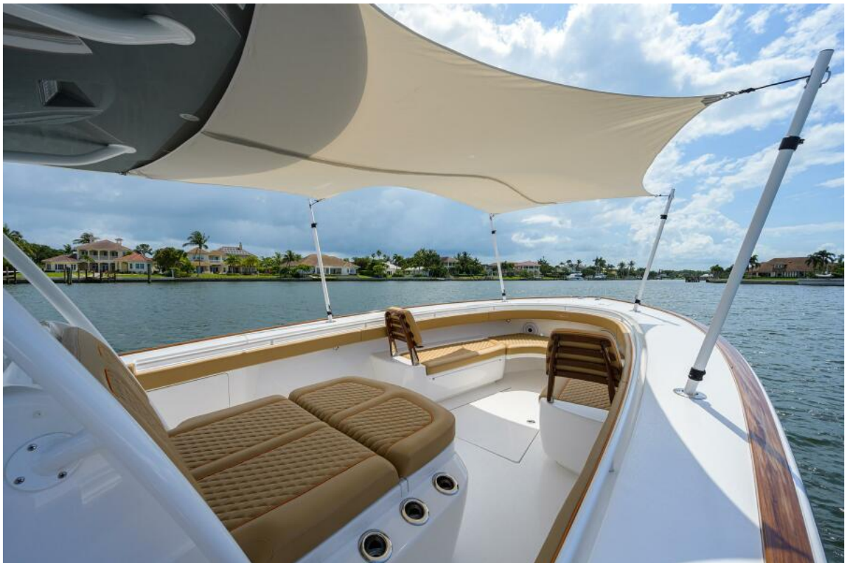
Valhalla 41 Reel Time - Forward Bow Seating, Sun Shade 2021 Valhalla 41 Center Console Reel Time