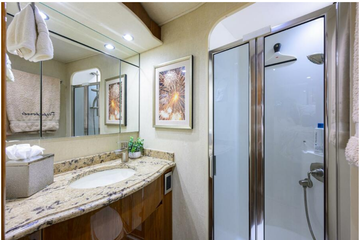
Forward Guest Head