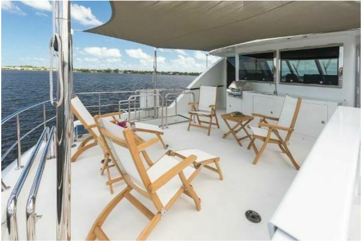
Enclosed Bridge Aft Deck