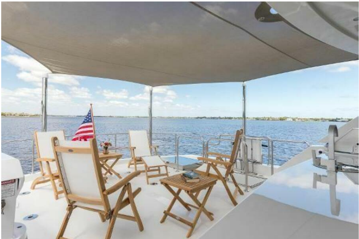
Enclosed Bridge Aft Deck