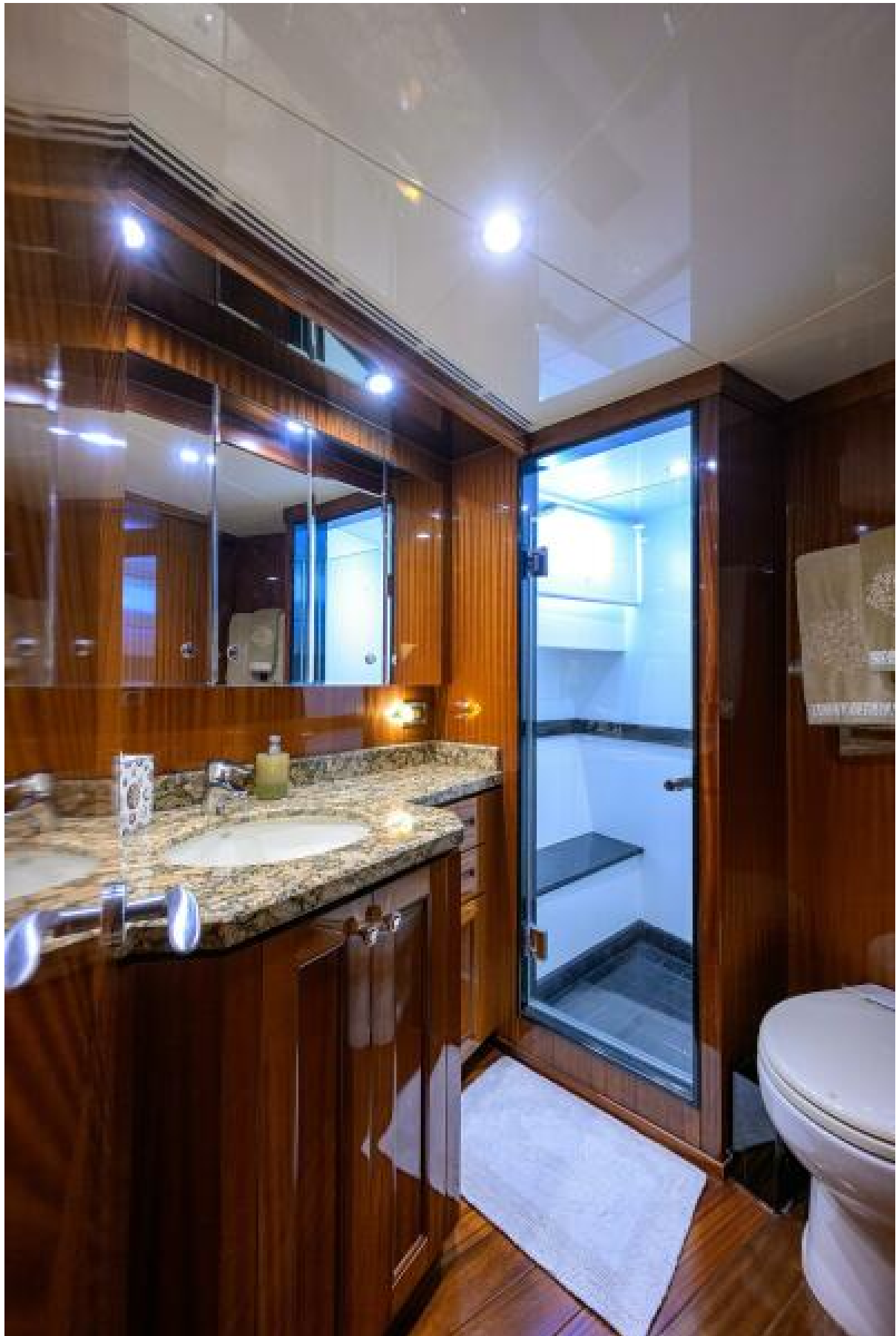
VIP Forward Head