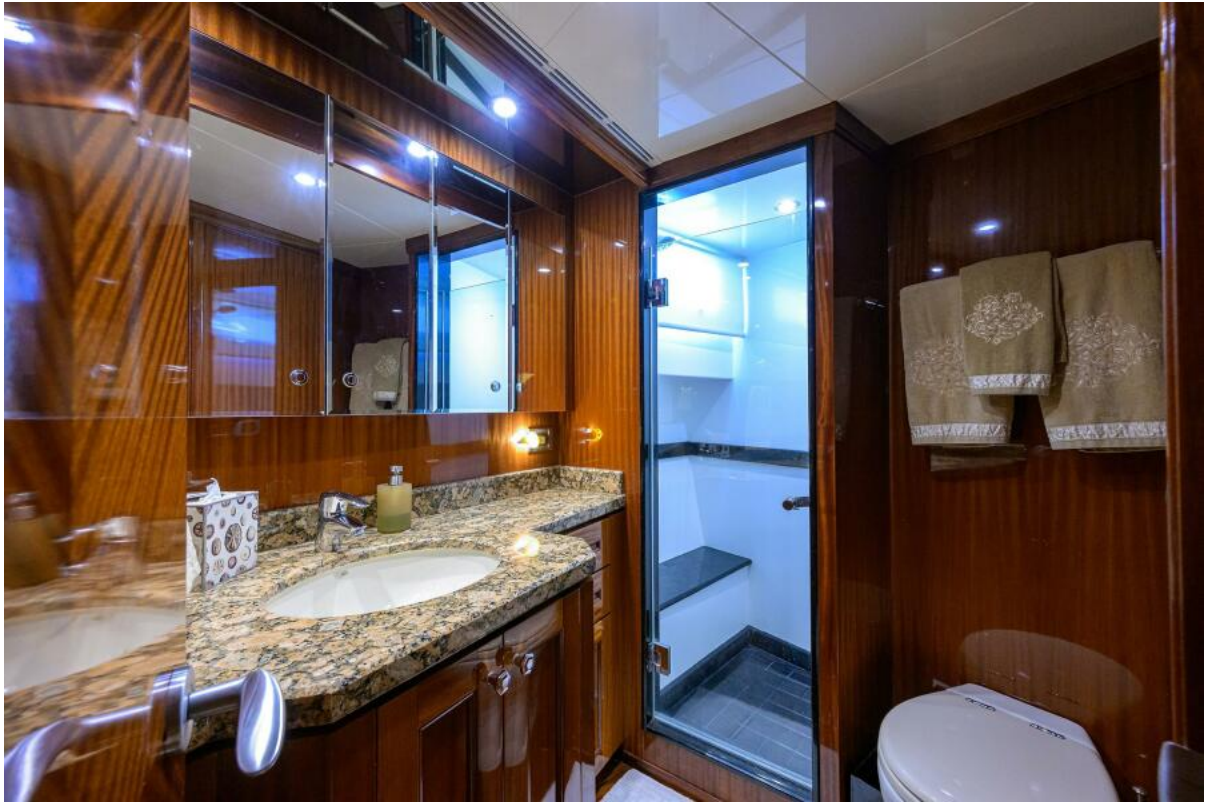
VIP Forward Head