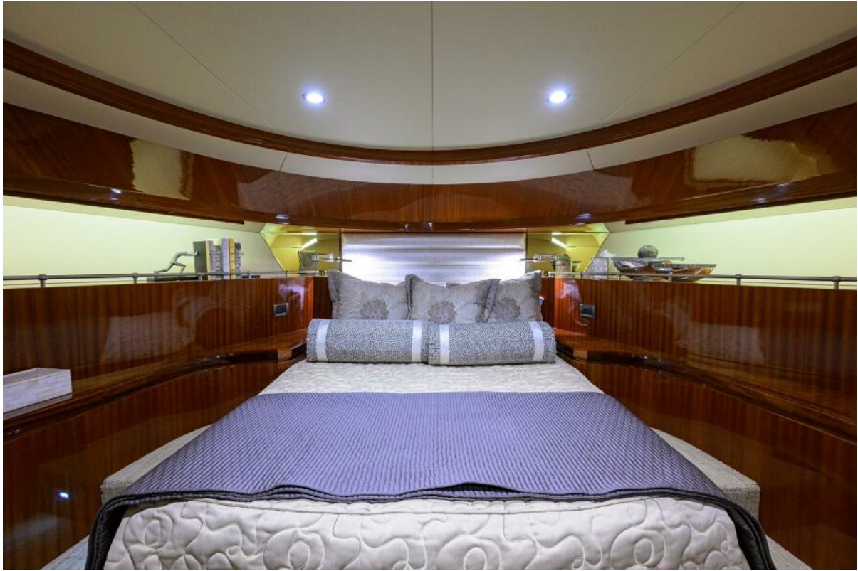
VIP Forward Stateroom