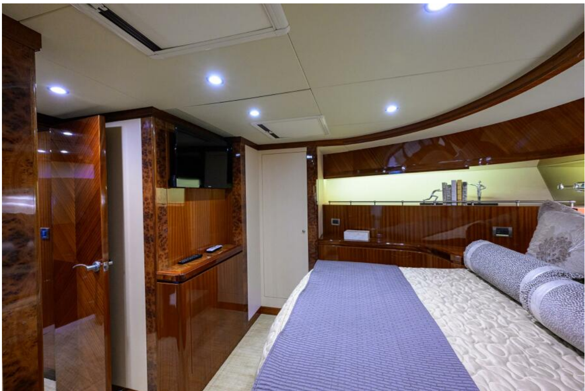
VIP Forward Stateroom