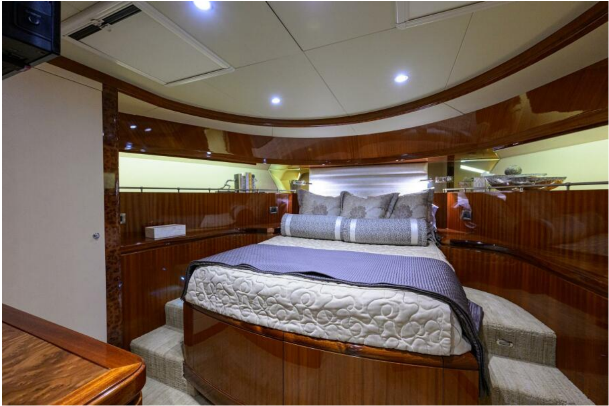
VIP Forward Stateroom