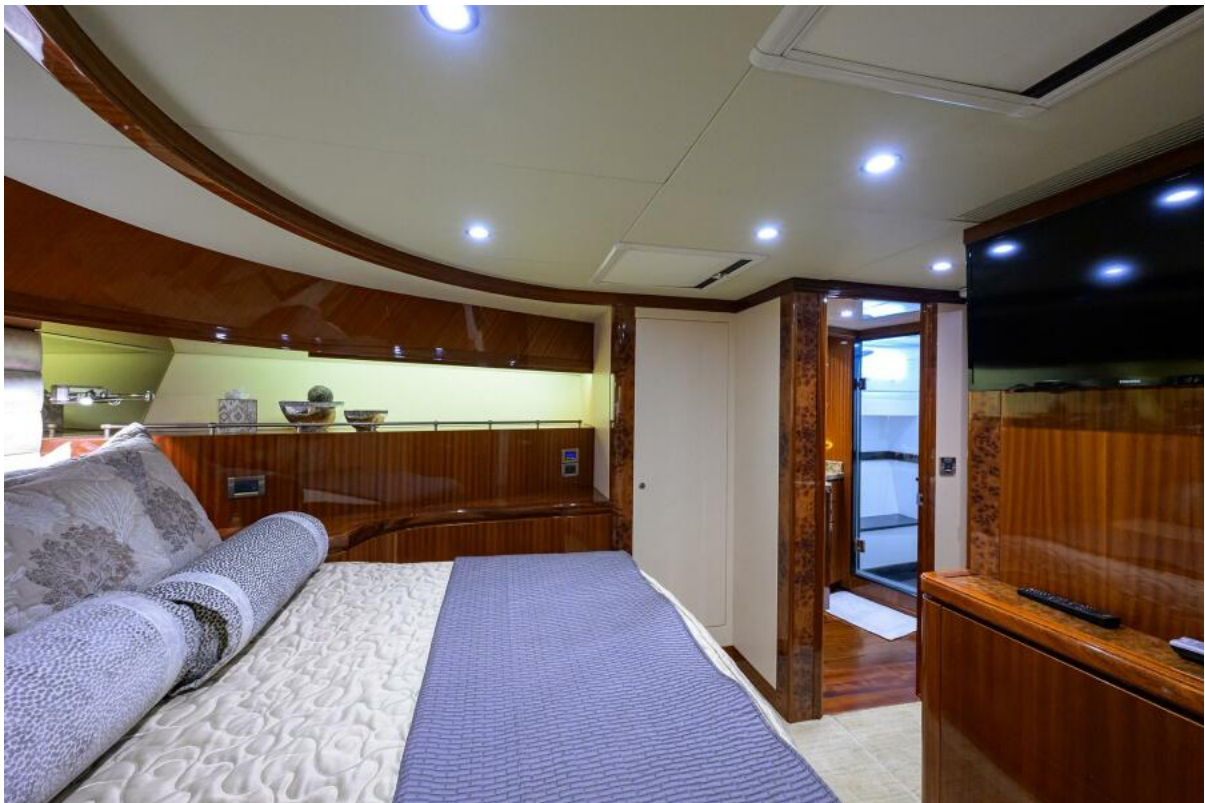
VIP Forward Stateroom