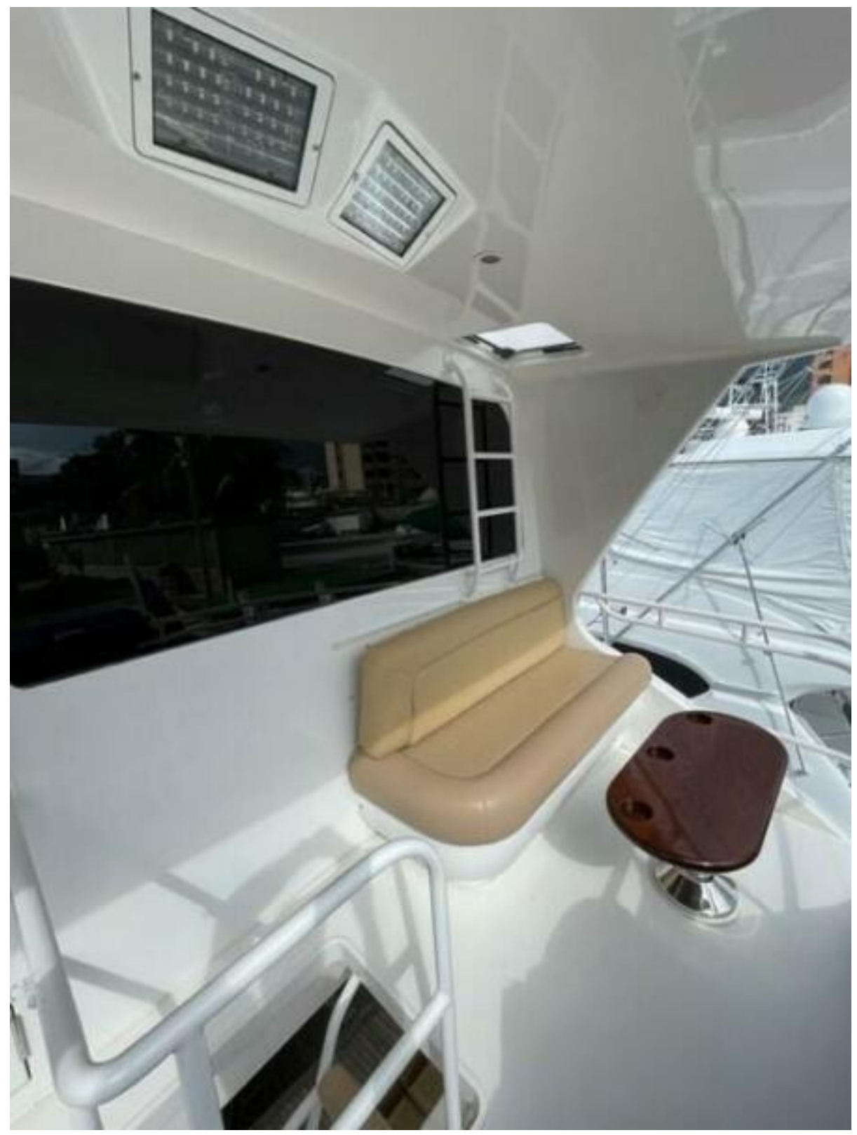
Enclosed Flybridge Aft Deck