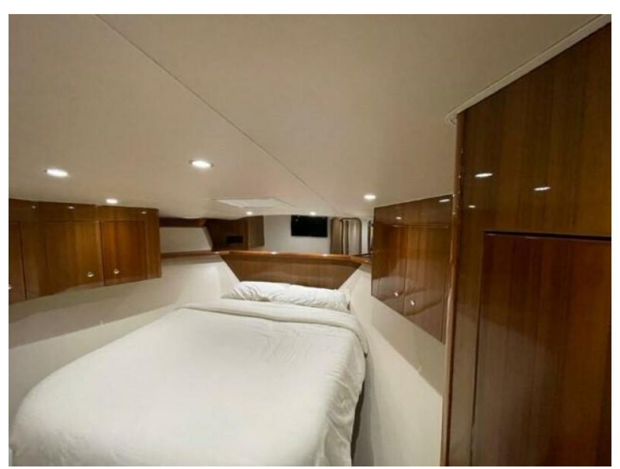
Forward VIP Stateroom