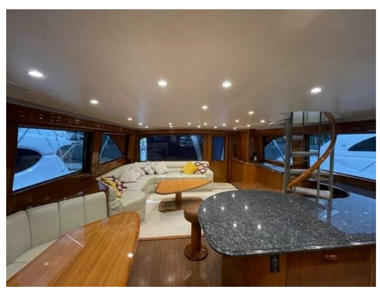
Galley & Dinette