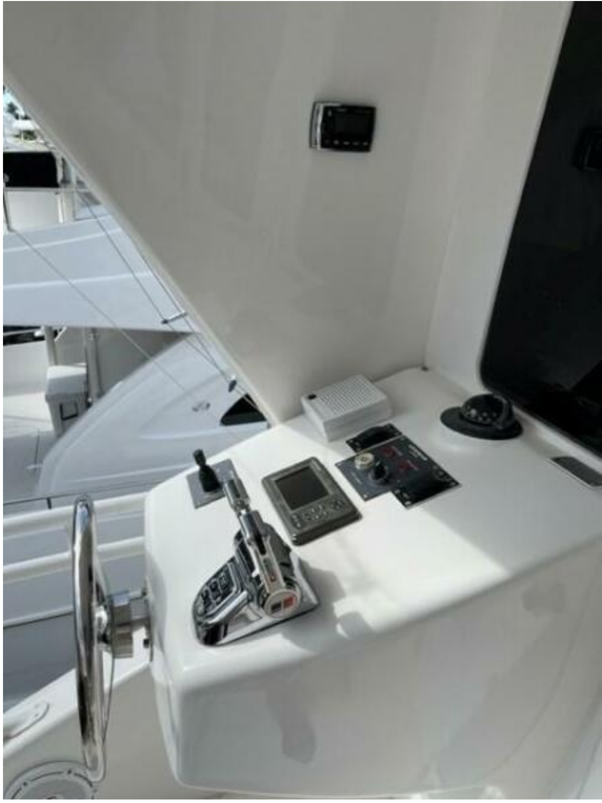
Enclosed Flybridge Aft Deck