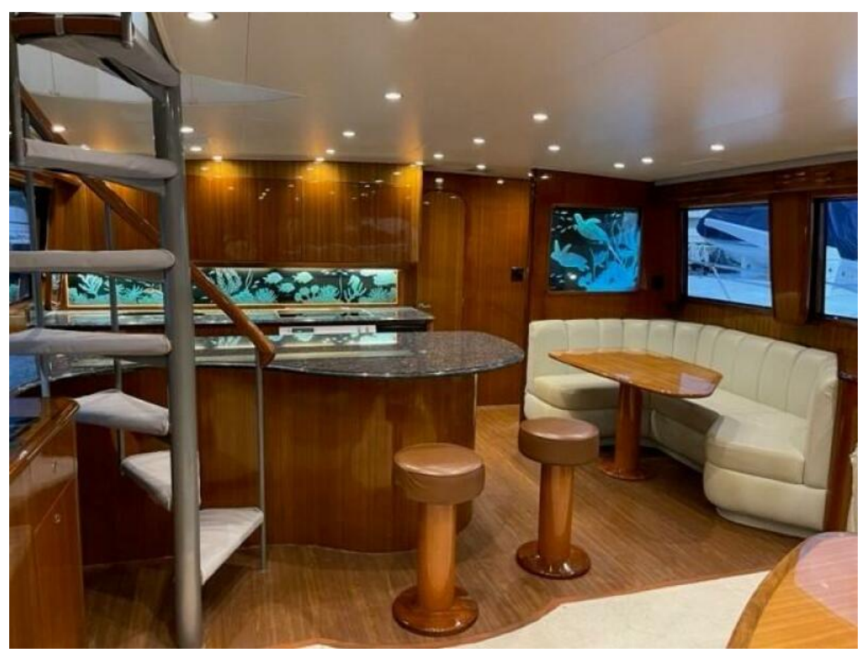
Galley & Dinette