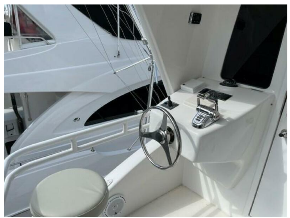
Enclosed Flybridge Aft Deck