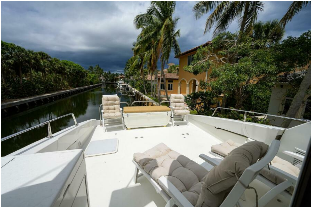
Skylounge Aft Deck