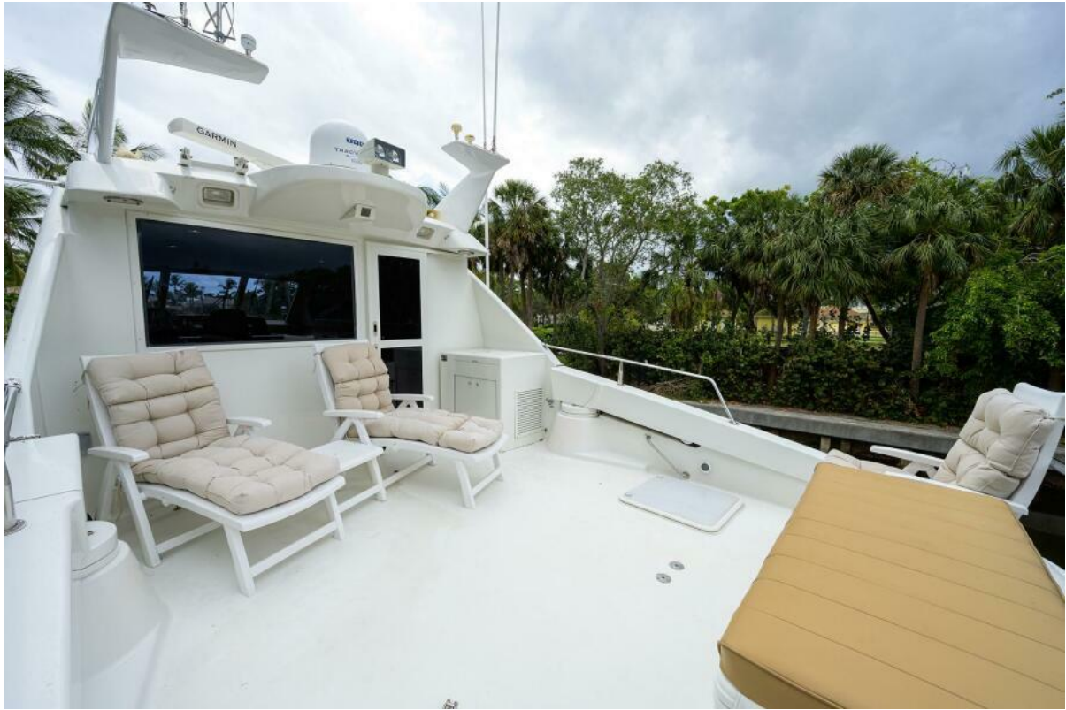
Skylounge Aft Deck