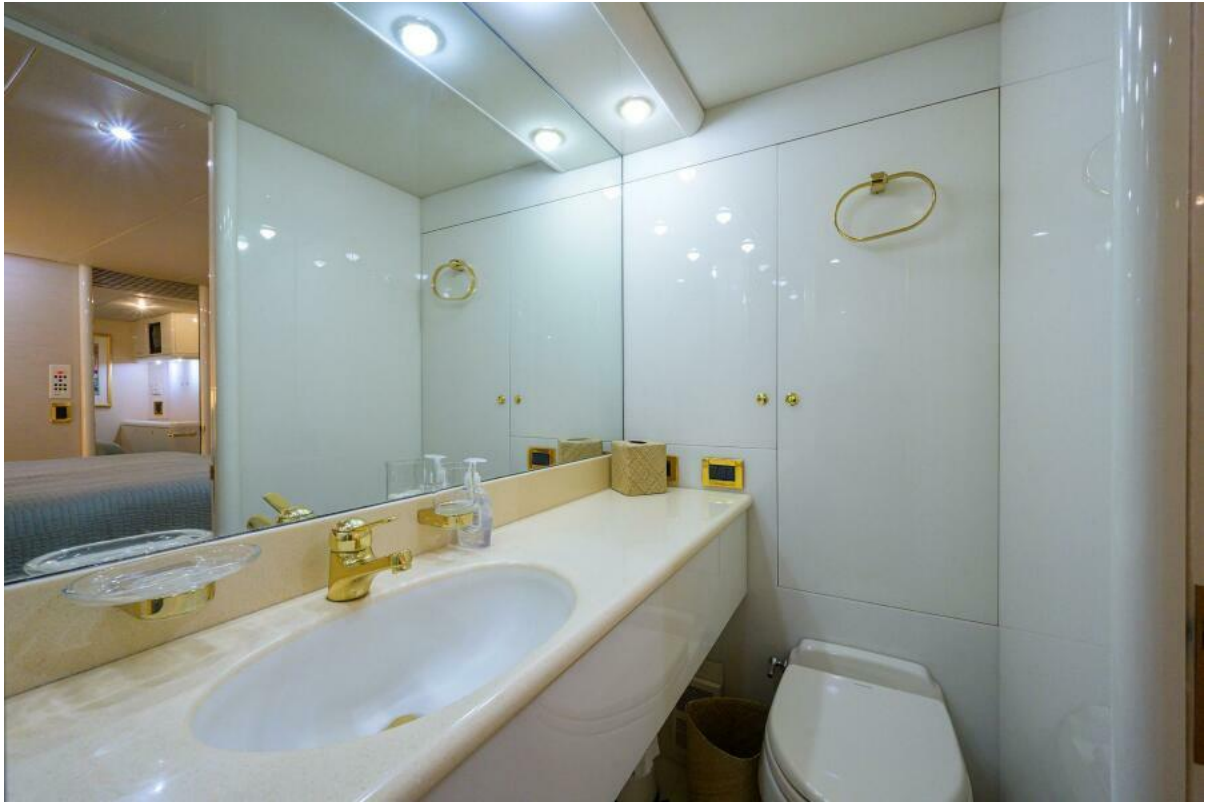
Port Guest Head