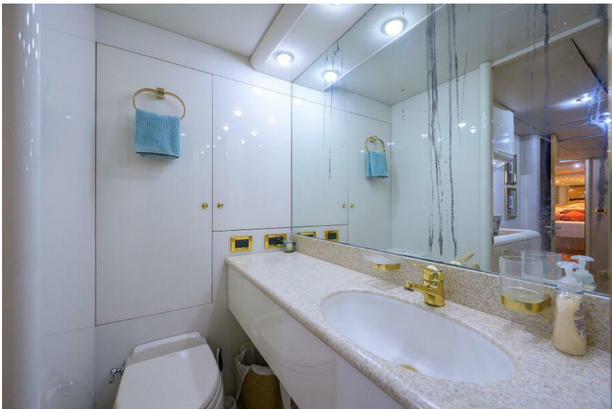
Starboard Guest Head