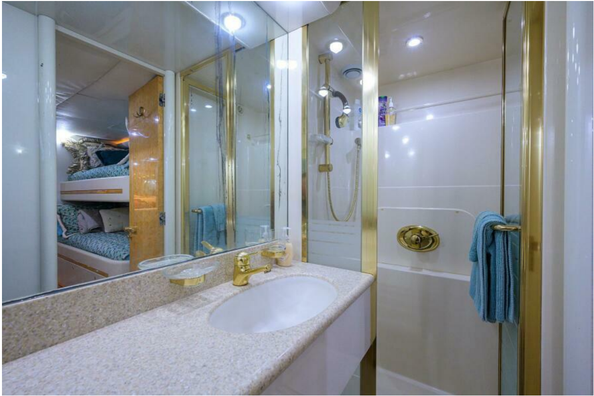
Starboard Guest Head