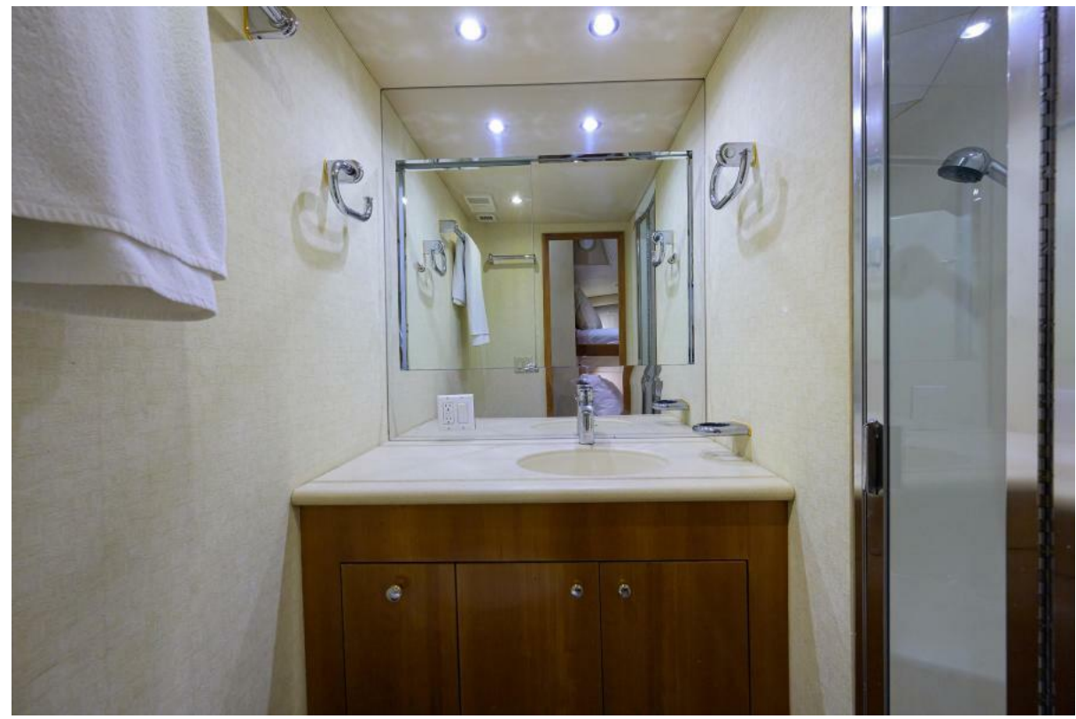
Hatteras 75 BELLAGIO - Forward Stateroom Head & Vanity 2000 Hatteras 75 Motoryacht BELLAGIO