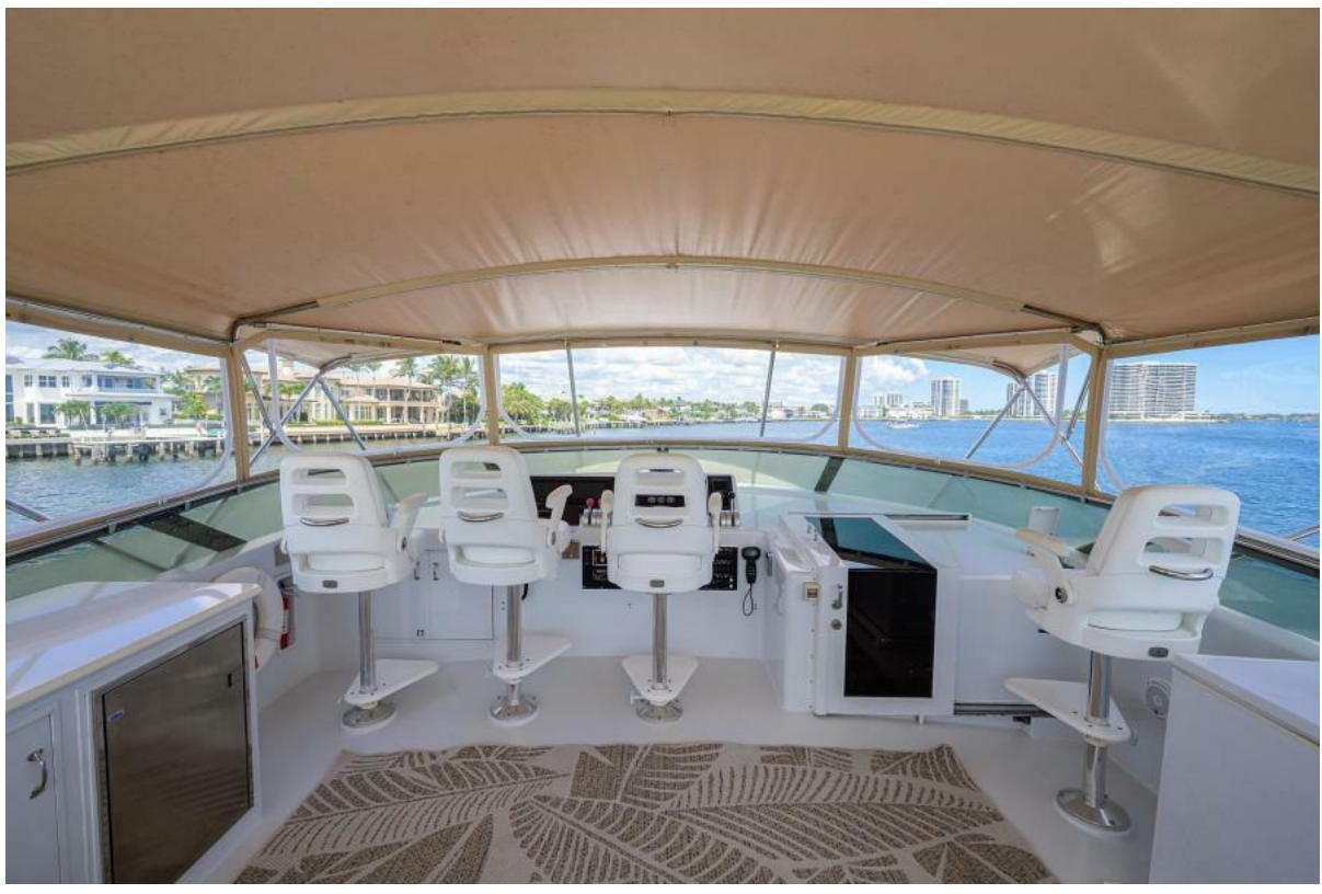
Hatteras 75 BELLAGIO - Flybridge Helm Seating 2000 Hatteras 75 Motoryacht BELLAGIO