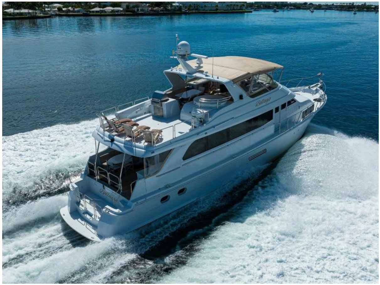
Hatteras 75 BELLAGIO - Starboard Aft Aerial View 2000 Hatteras 75 Motoryacht BELLAGIO