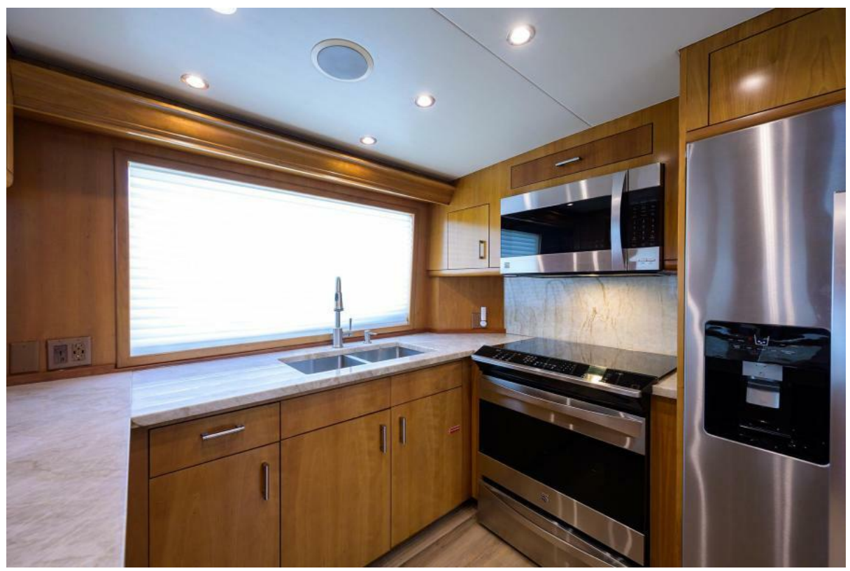
Hatteras 75 BELLAGIO - Galley Appliances 2000 Hatteras 75 Motoryacht BELLAGIO