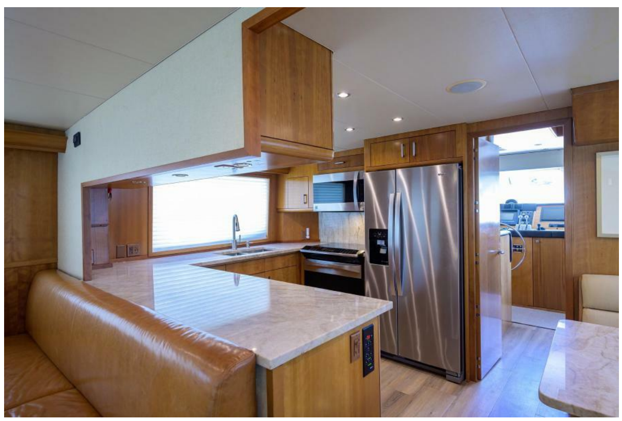
Hatteras 75 BELLAGIO - Galley 2000 Hatteras 75 Motoryacht BELLAGIO