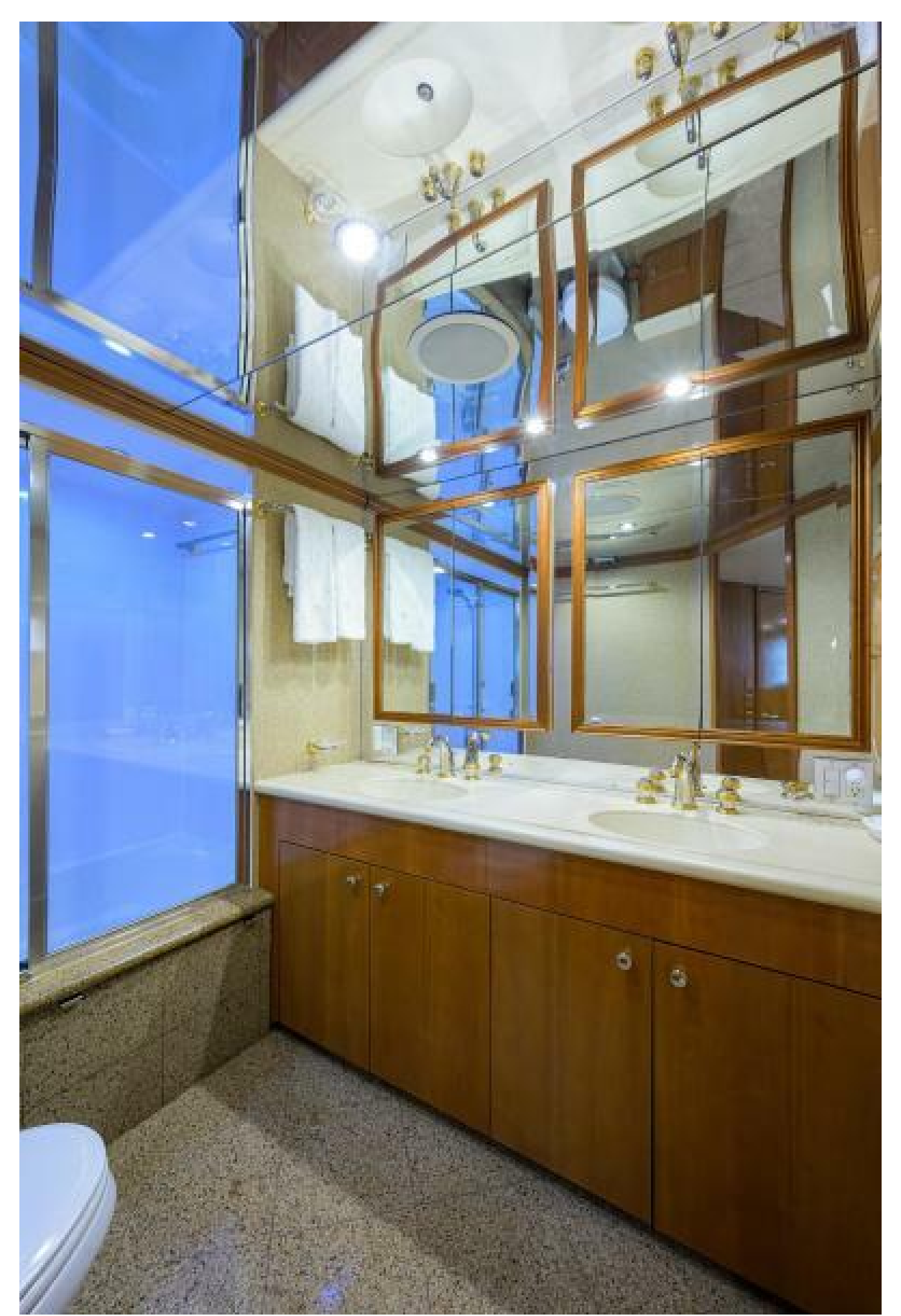
Hatteras 75 BELLAGIO - Master Head Shower & Vanity 2000 Hatteras 75 Motoryacht BELLAGIO