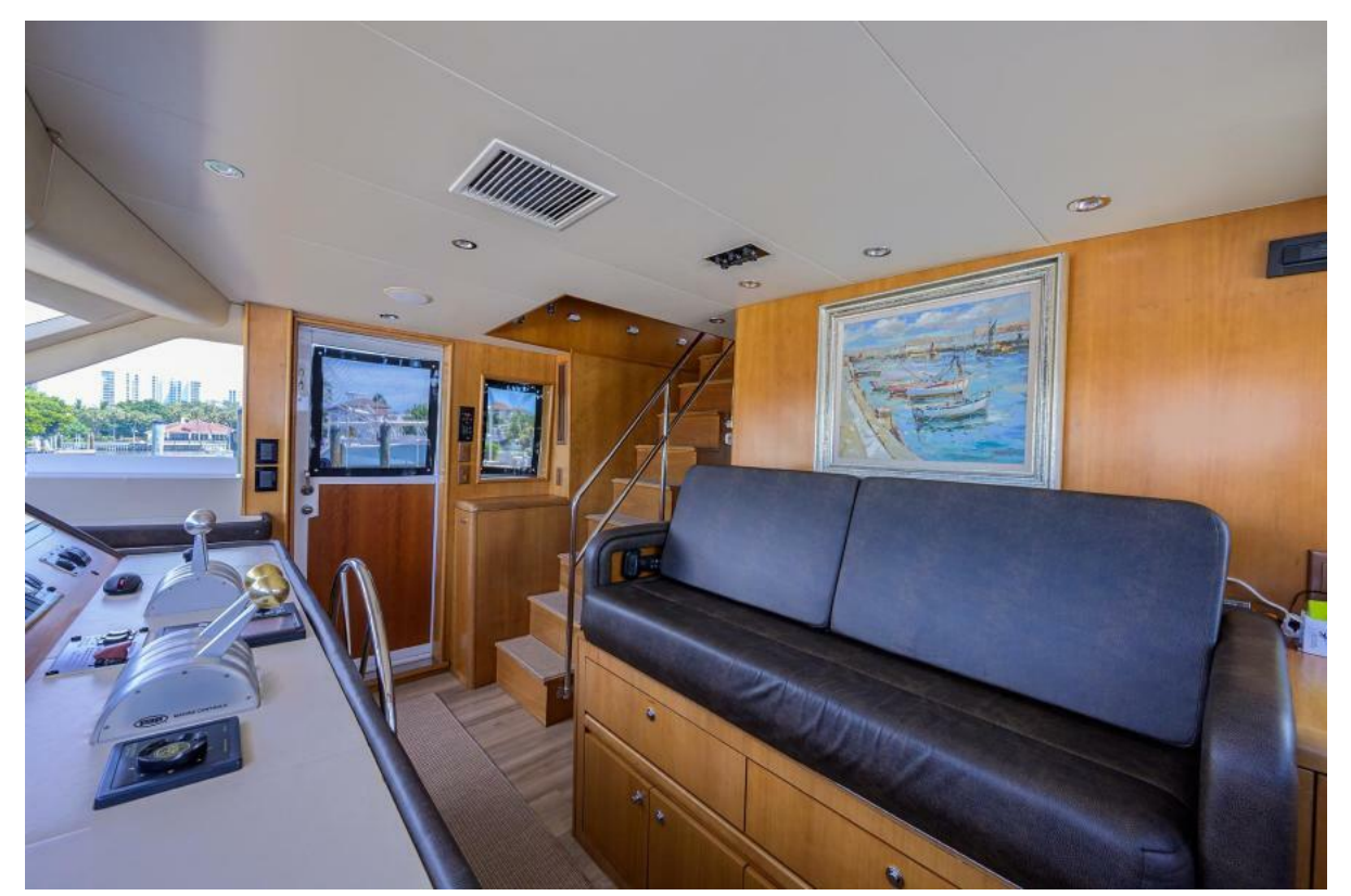
Hatteras 75 BELLAGIO - Pilothouse Seating & Staircase 2000 Hatteras 75 Motoryacht BELLAGIO