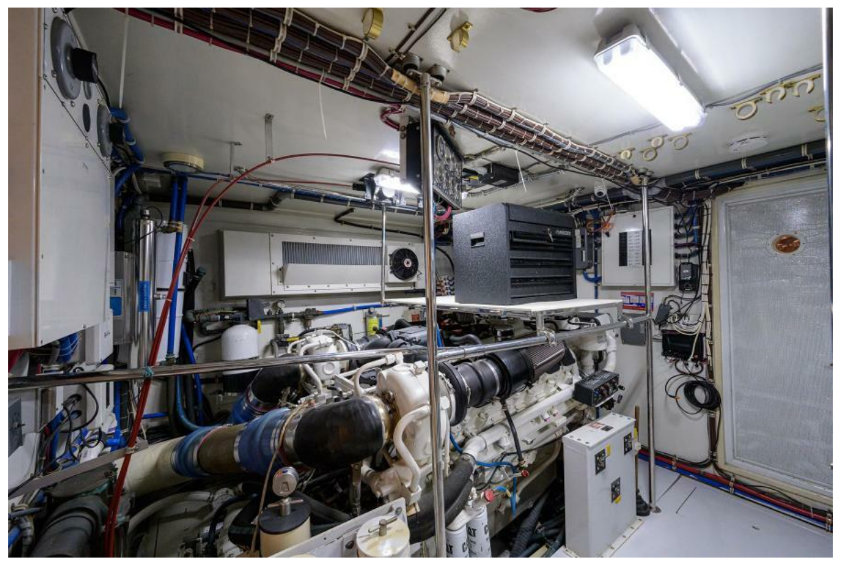
Hatteras 75 BELLAGIO - Engine Room 2000 Hatteras 75 Motoryacht BELLAGIO