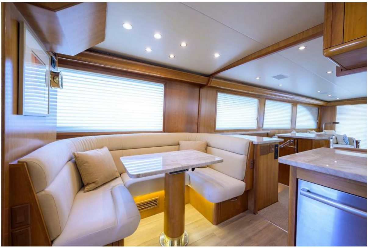
Hatteras 75 BELLAGIO - Dinette in Galley 2000 Hatteras 75 Motoryacht BELLAGIO