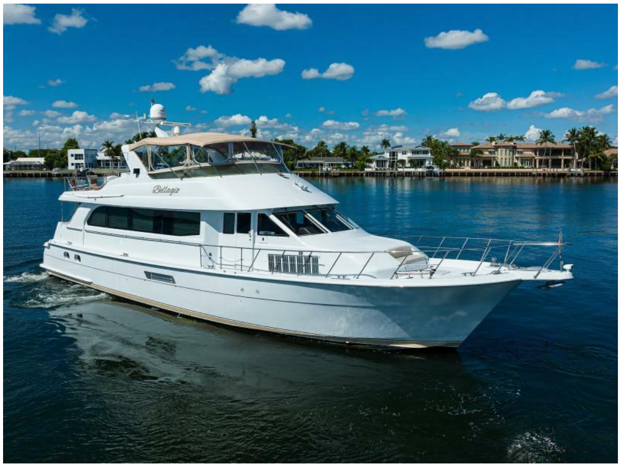
Hatteras 75 BELLAGIO - Starboard Bow View 2000 Hatteras 75 Motoryacht BELLAGIO