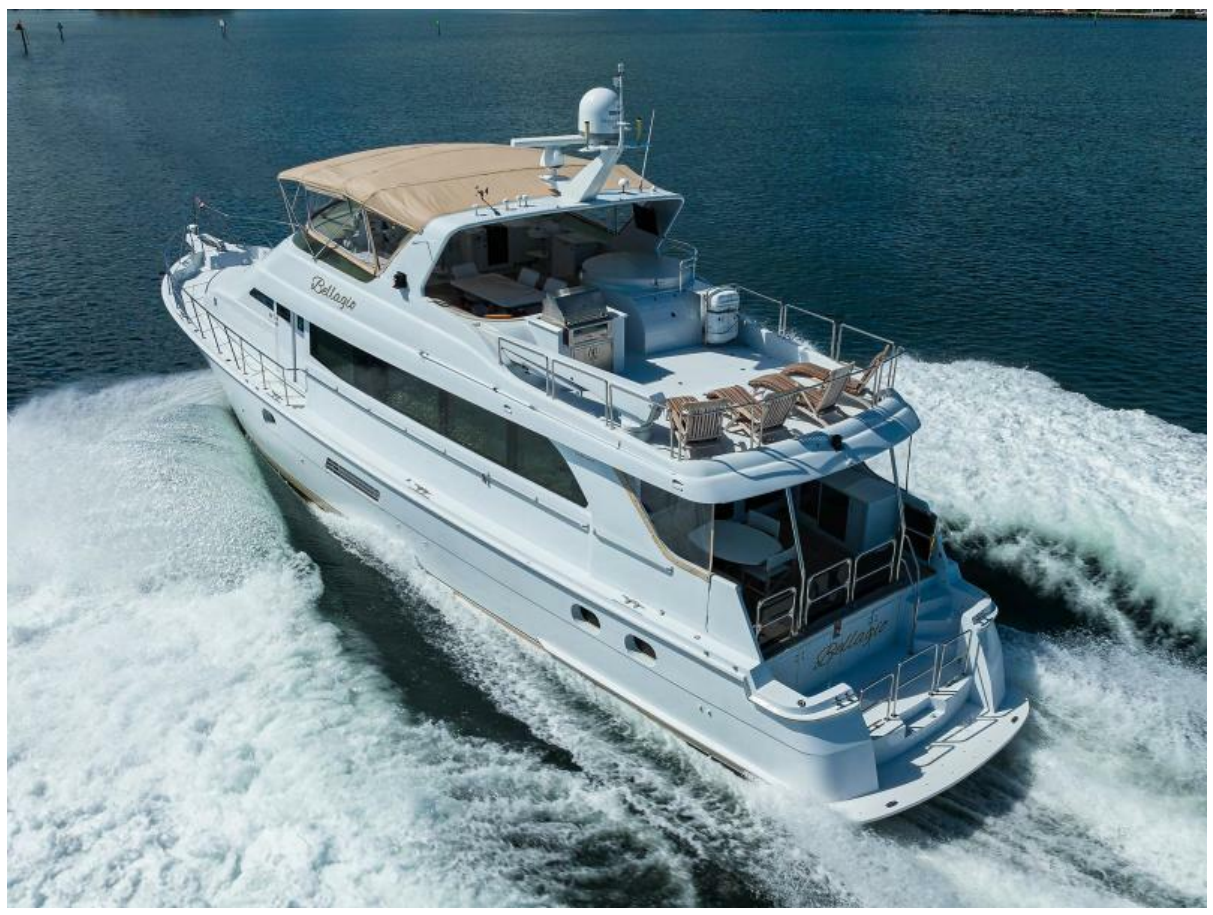
Hatteras 75 BELLAGIO - Port Aft Aerial View 2000 Hatteras 75 Motoryacht BELLAGIO