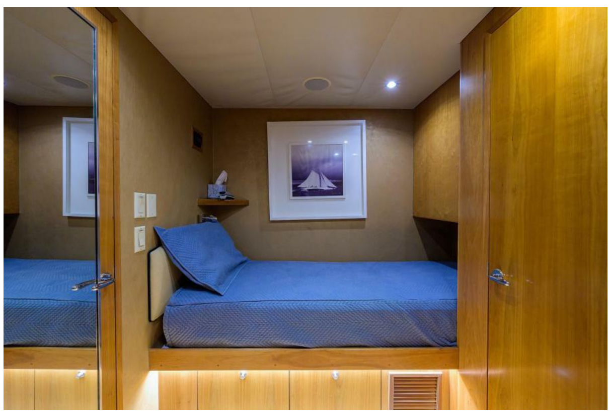
Hatteras 75 BELLAGIO - Forward Starboard Stateroom Side By Side Berths 2000 Hatteras 75 Motoryacht BELLAGIO