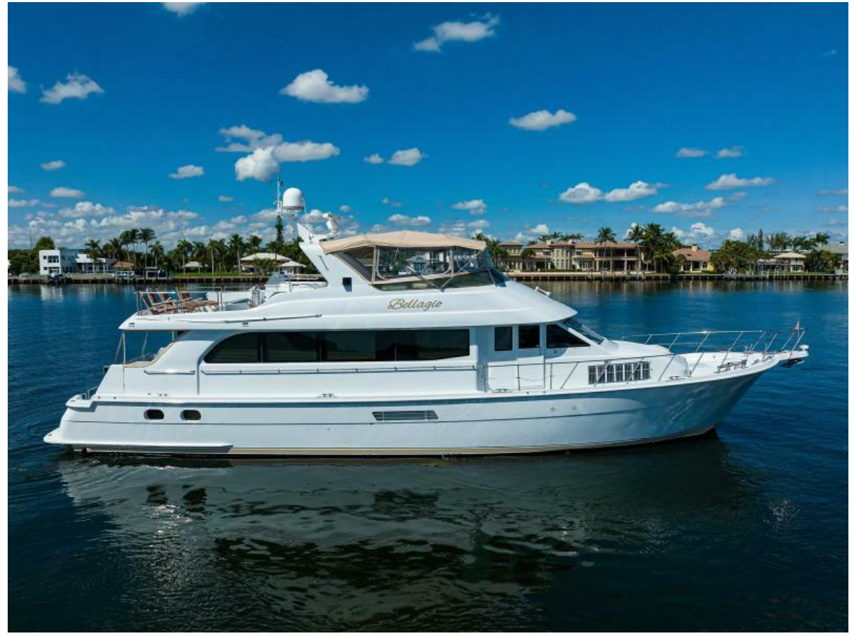
Hatteras 75 BELLAGIO - Starboard Profile On Water 2000 Hatteras 75 Motoryacht BELLAGIO