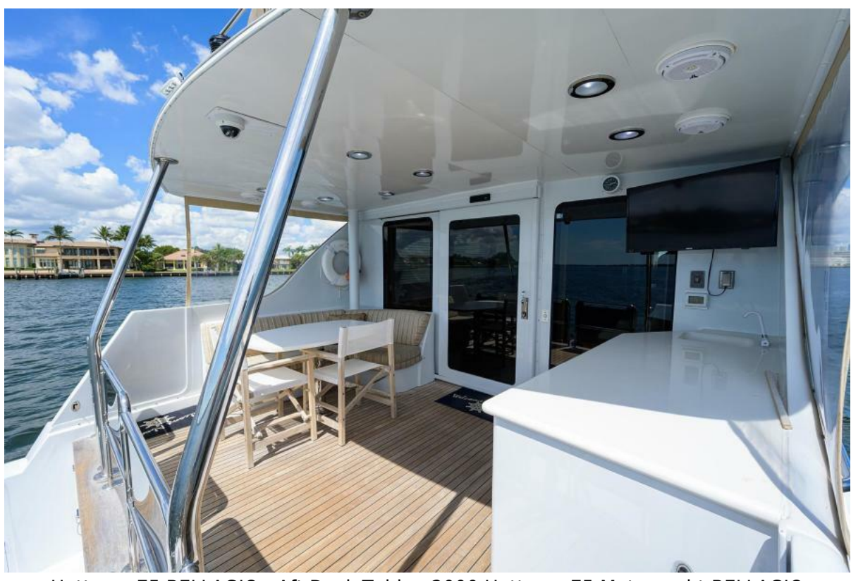
Hatteras 75 BELLAGIO - Aft Deck Table 2000 Hatteras 75 Motoryacht BELLAGIO