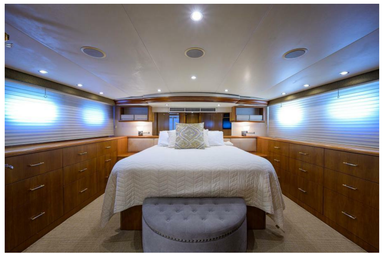
Hatteras 75 BELLAGIO - Master Stateroom Bed & Storage 2000 Hatteras 75 Motoryacht BELLAGIO