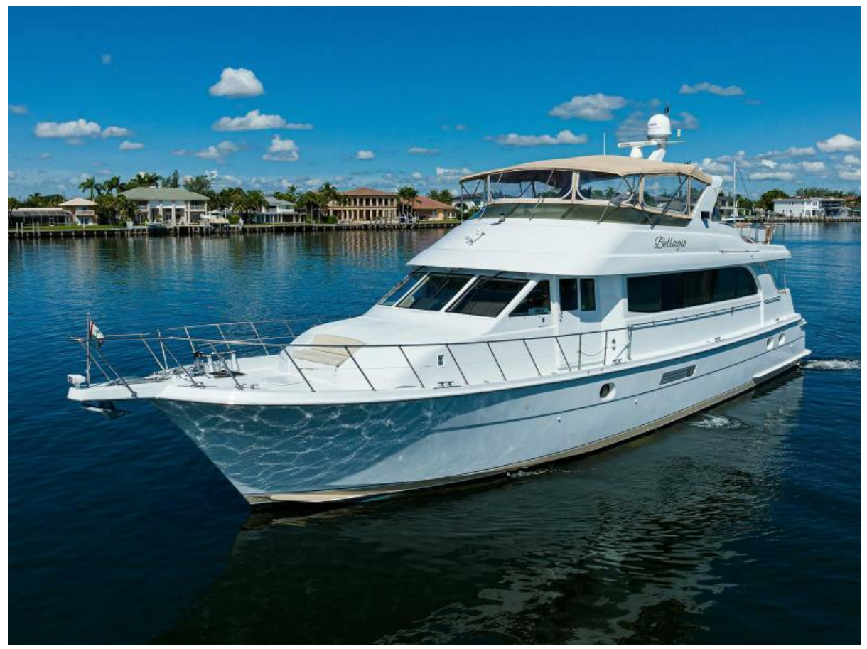
Hatteras 75 BELLAGIO - Port Bow View 2000 Hatteras 75 Motoryacht BELLAGIO