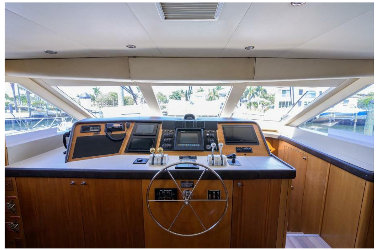
Hatteras 75 BELLAGIO - Pilothouse Helm Electronics 2000 Hatteras 75 Motoryacht BELLAGIO