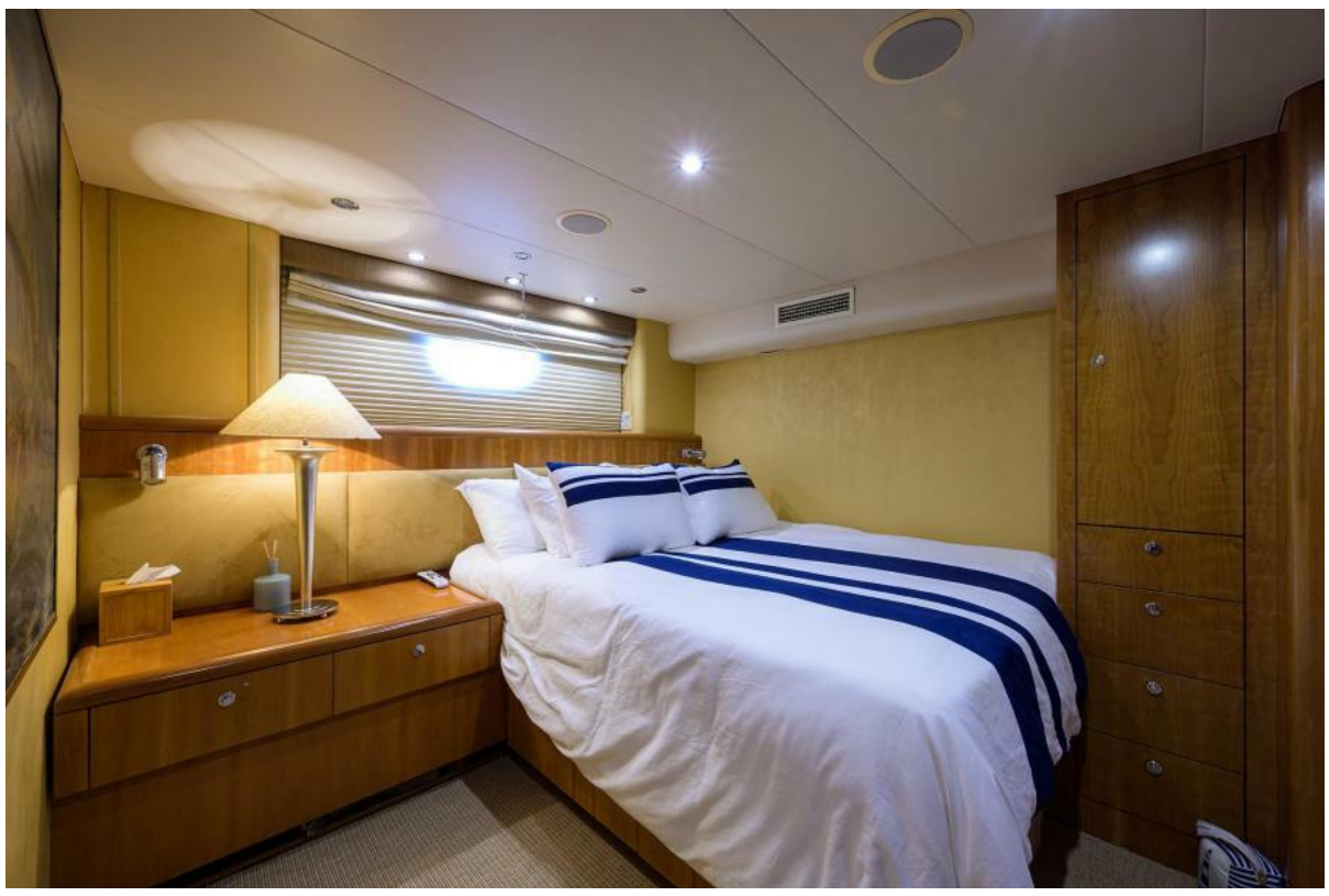
Hatteras 75 BELLAGIO - VIP Stateroom Bed 2000 Hatteras 75 Motoryacht BELLAGIO