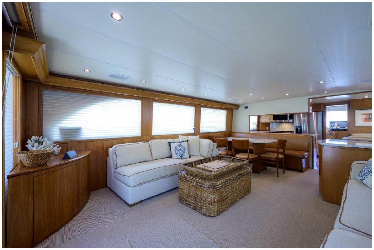
Hatteras 75 BELLAGIO - Salon Seating & Dining 2000 Hatteras 75 Motoryacht BELLAGIO