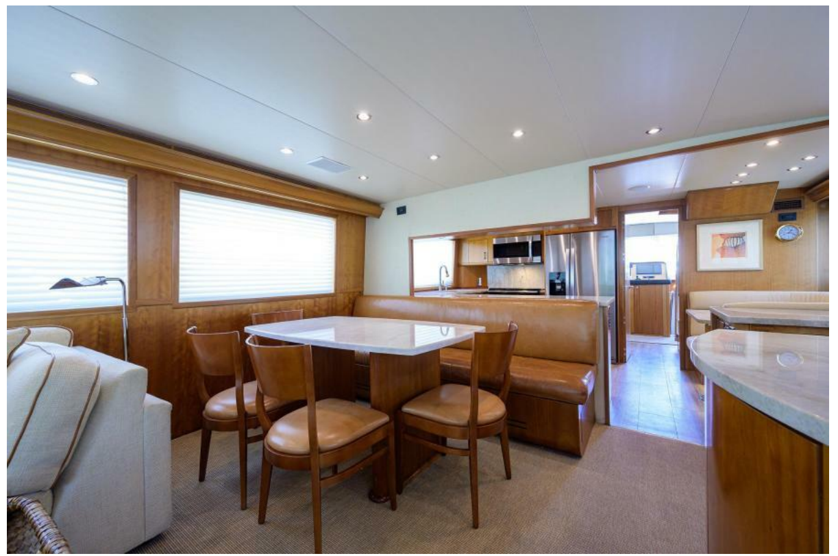
Hatteras 75 BELLAGIO - Dining Area 2000 Hatteras 75 Motoryacht BELLAGIO