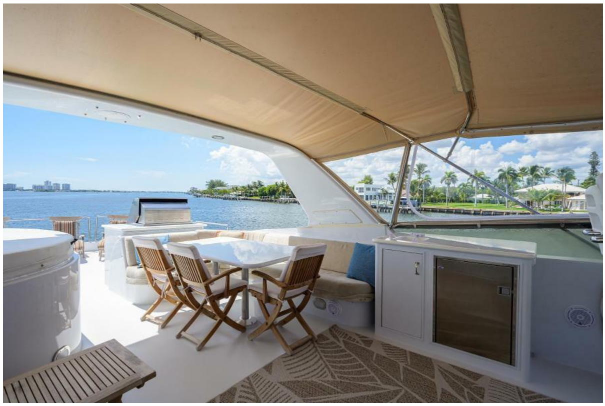
Hatteras 75 BELLAGIO - Flybridge Aft Deck Table 2000 Hatteras 75 Motoryacht BELLAGIO