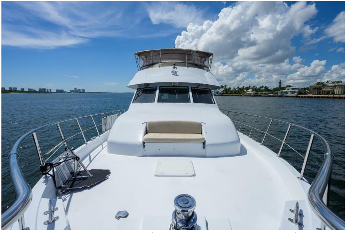
Hatteras 75 BELLAGIO - Bow & Forward Lounge 2000 Hatteras 75 Motoryacht BELLAGIO