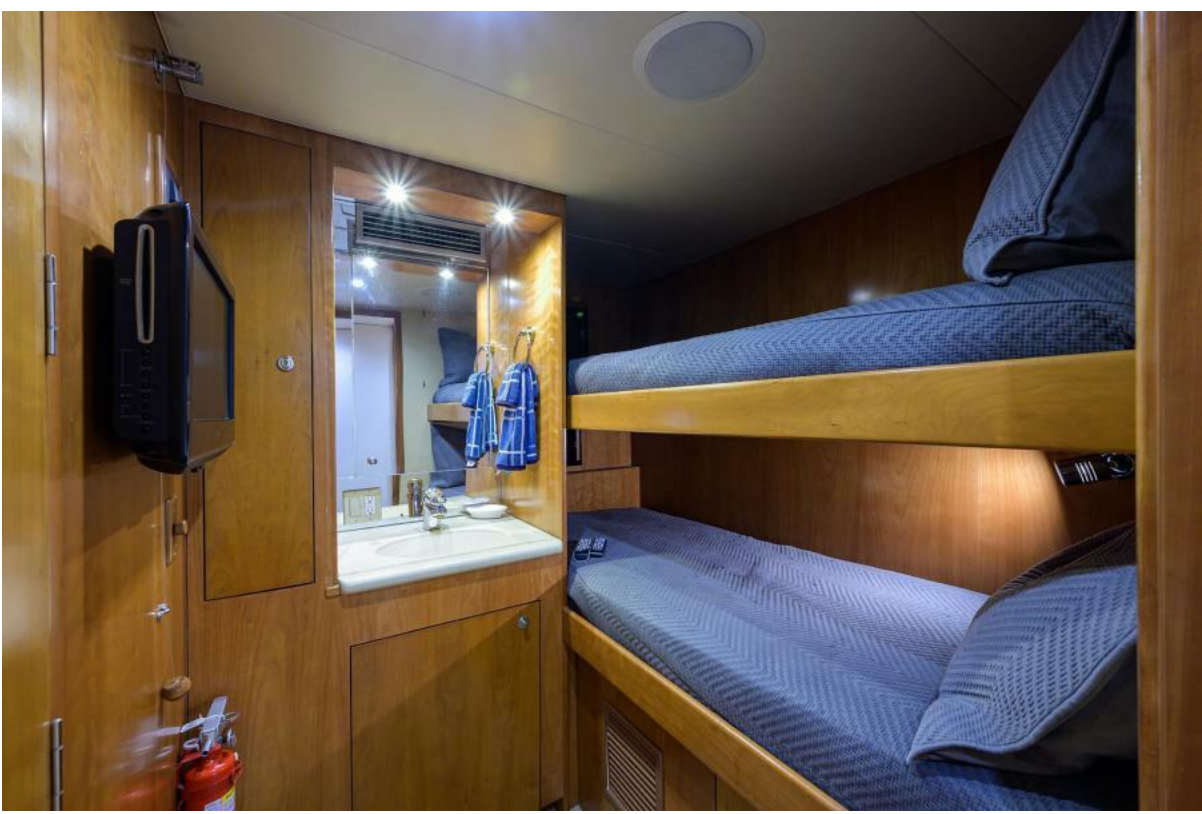
Hatteras 75 BELLAGIO - Mid Starboard Stateroom Over/Under Bunks 2000 Hatteras 75 Motoryacht BELLAGIO