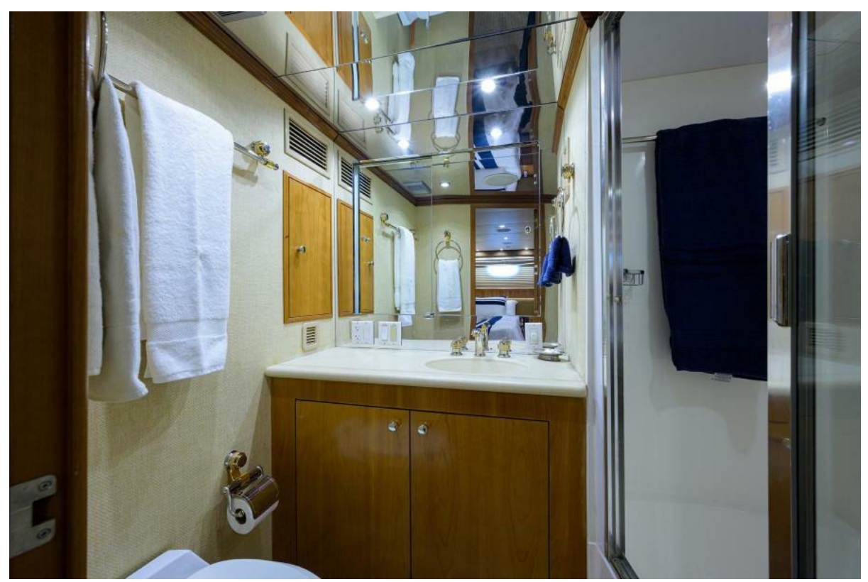
Hatteras 75 BELLAGIO - VIP Head & Shower 2000 Hatteras 75 Motoryacht BELLAGIO