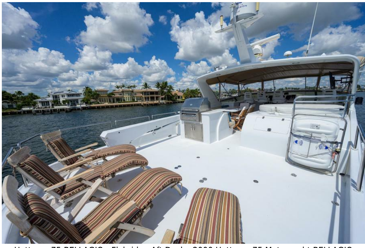
Hatteras 75 BELLAGIO - Flybridge Aft Deck 2000 Hatteras 75 Motoryacht BELLAGIO