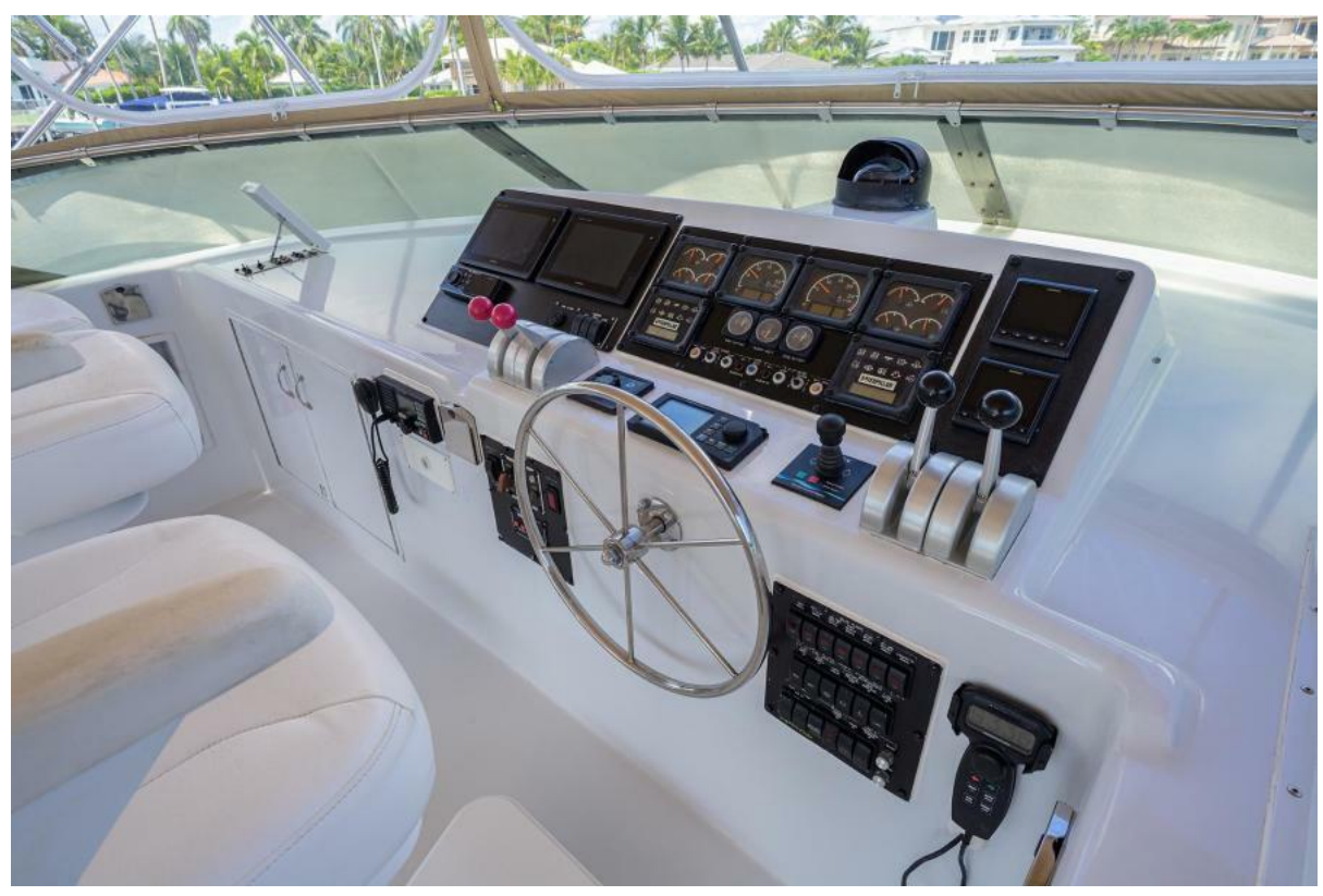
Hatteras 75 BELLAGIO - Flybridge Helm Electronics 2000 Hatteras 75 Motoryacht BELLAGIO