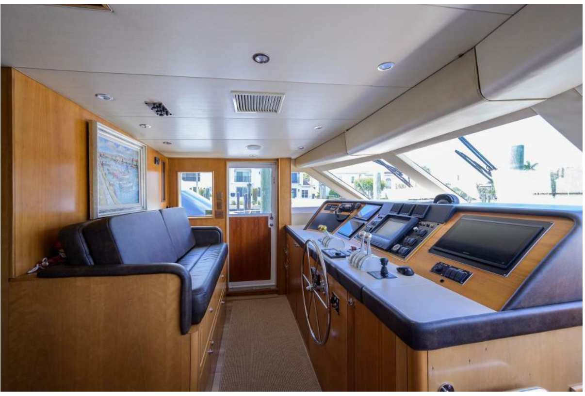
Hatteras 75 BELLAGIO - Pilothouse Helm Station 2000 Hatteras 75 Motoryacht BELLAGIO