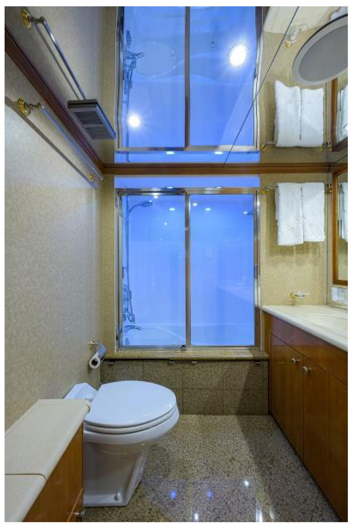
Hatteras 75 BELLAGIO - Master Head & Shower 2000 Hatteras 75 Motoryacht BELLAGIO