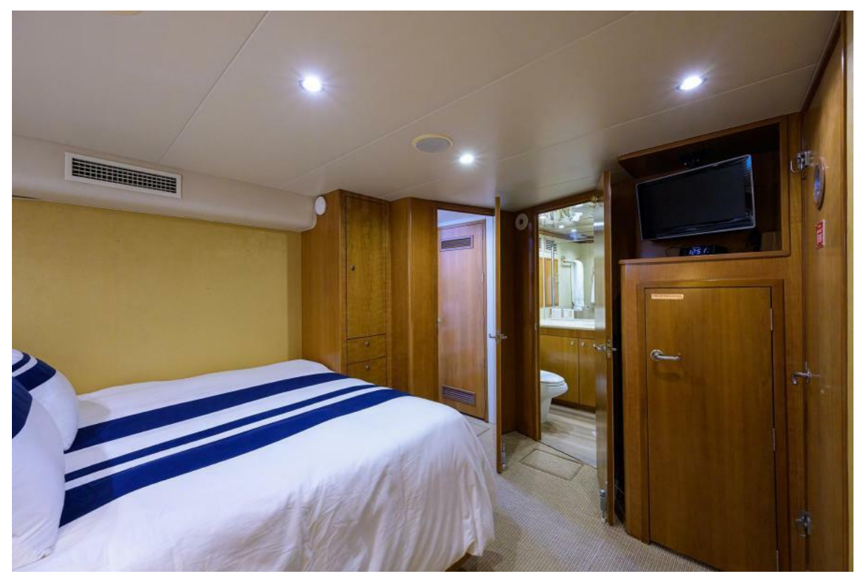
VIP Stateroom TV & Head Access 2000 Hatteras 75 Motoryacht BELLAGIO