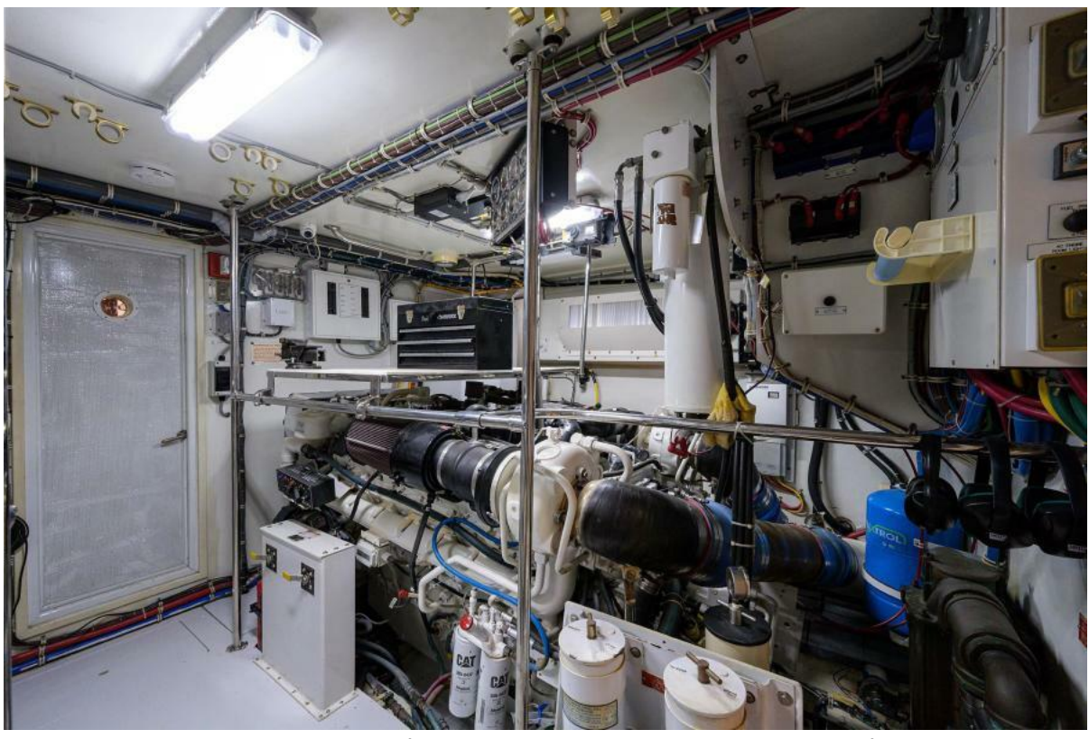
Hatteras 75 BELLAGIO - Engine Room 2000 Hatteras 75 Motoryacht BELLAGIO