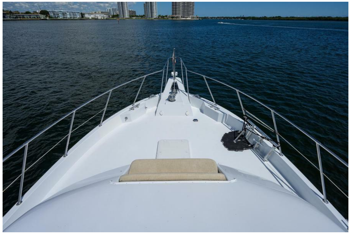
Hatteras 75 BELLAGIO - Bow 2000 Hatteras 75 Motoryacht BELLAGIO