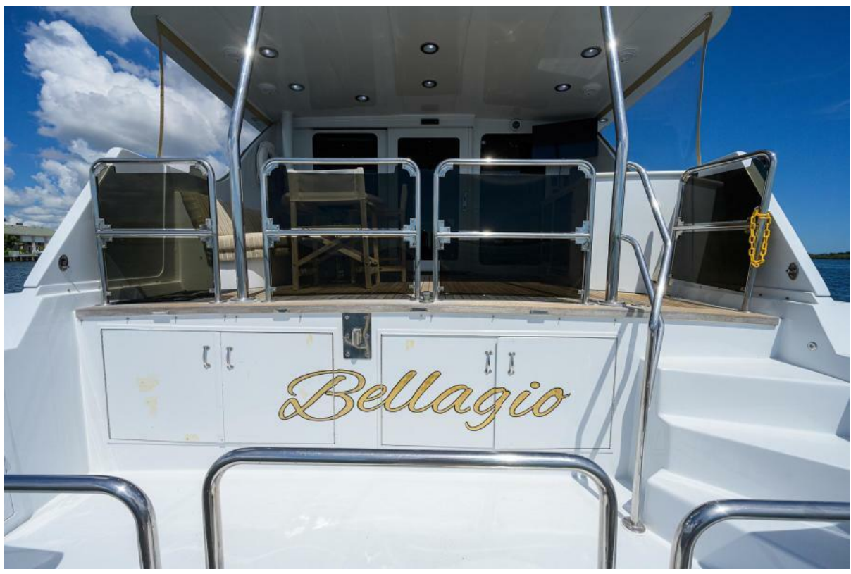
Hatteras 75 BELLAGIO - Transom & Aft Deck 2000 Hatteras 75 Motoryacht BELLAGIO