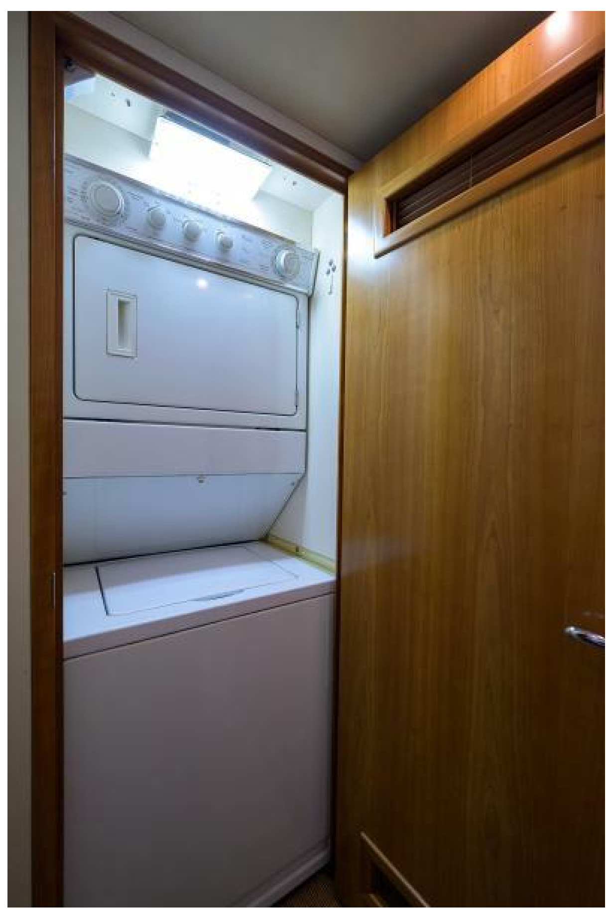
Hatteras 75 BELLAGIO - Stackable Washer & Dryer 2000 Hatteras 75 Motoryacht BELLAGIO