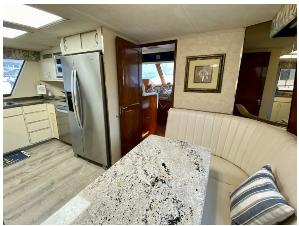
Galley/Dinette 1988 70 Hatteras CPMY Conundrum