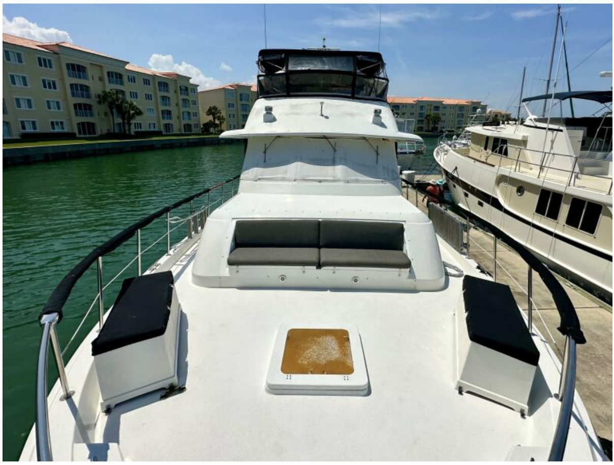
Bow 1988 70 Hatteras CPMY Conundrum