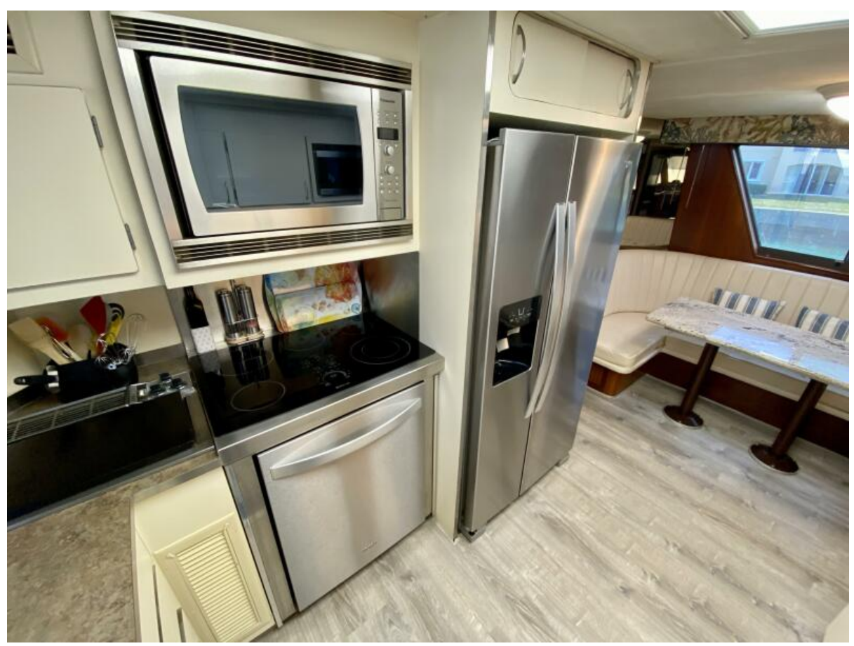
Galley 1988 70 Hatteras CPMY Conundrum