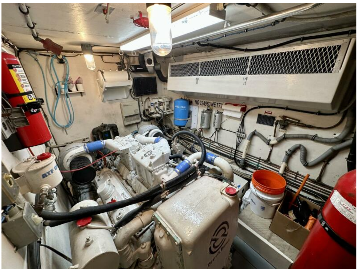
Engine Room 1988 70 Hatteras CPMY Conundrum