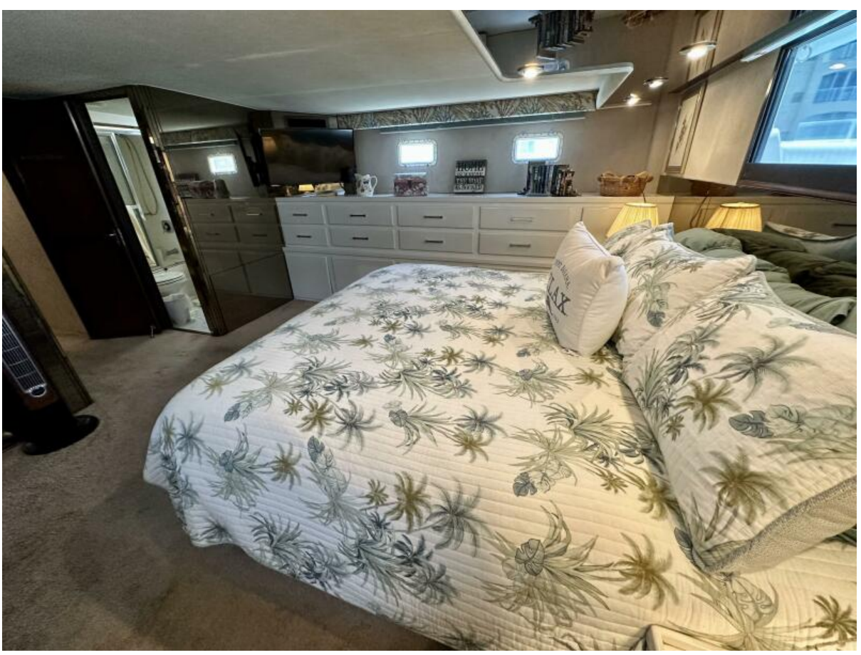
Master Stateroom 1988 70 Hatteras CPMY Conundrum