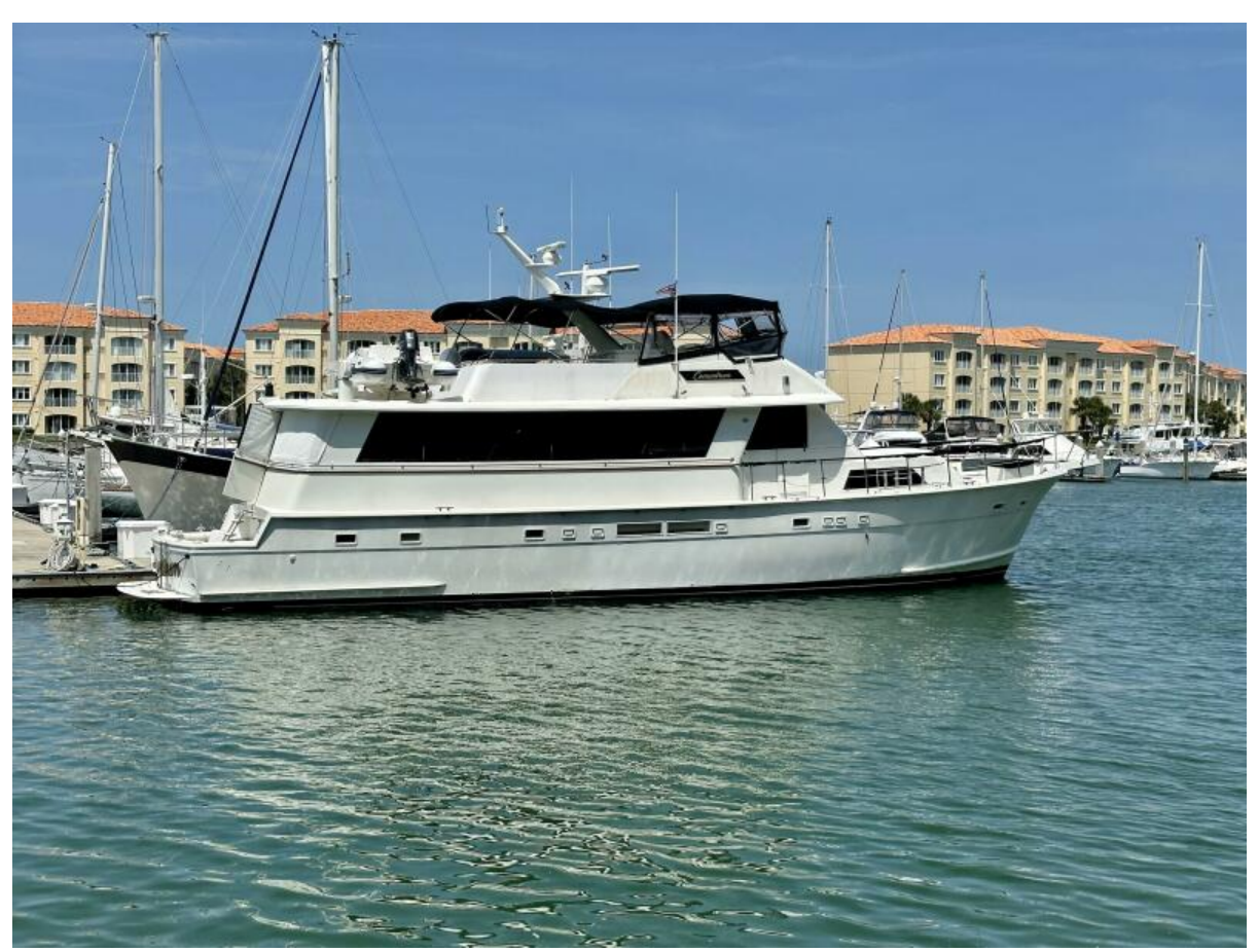
Conundrum 1988 70 Hatteras CPMY Conundrum