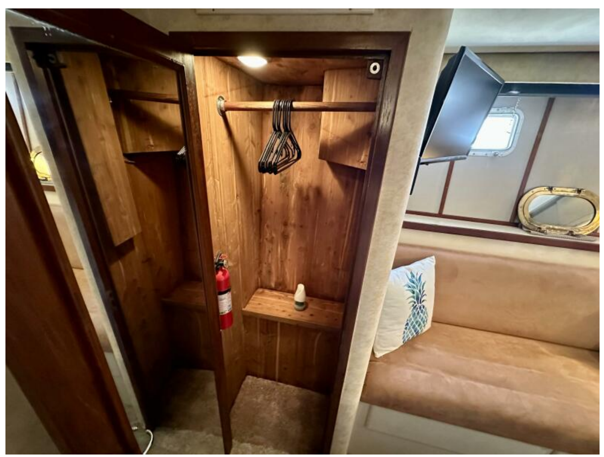
VIP Stateroom 1988 70 Hatteras CPMY Conundrum