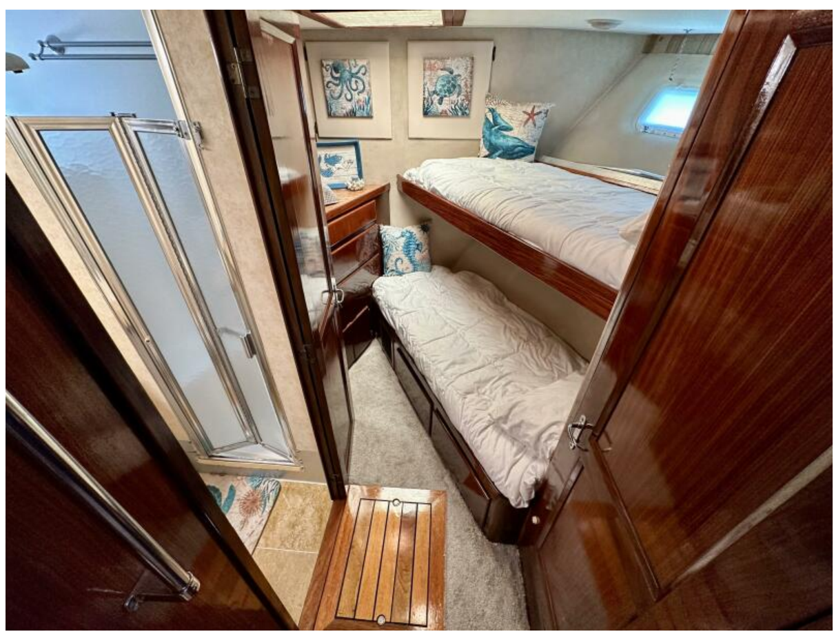
Crew Stateroom 1988 70 Hatteras CPMY Conundrum