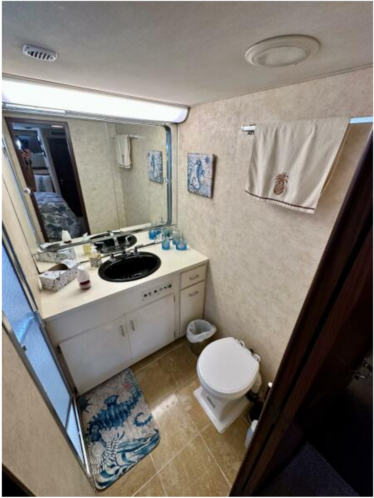
Head 1988 70 Hatteras CPMY Conundrum