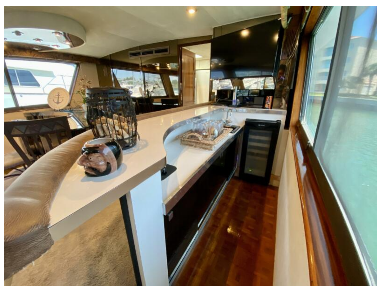
Wet Bar 1988 70 Hatteras CPMY Conundrum