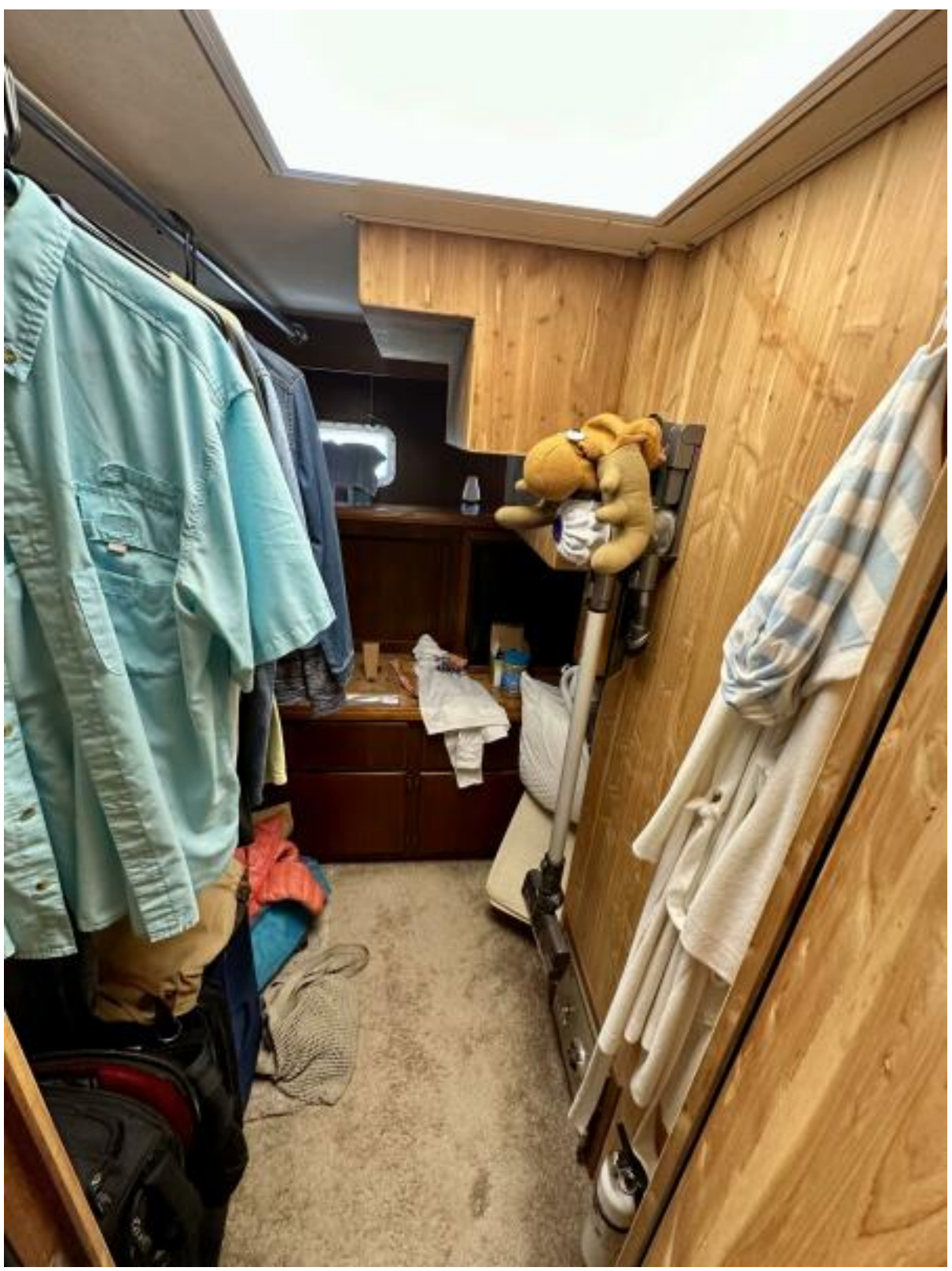
Master Closet 1988 70 Hatteras CPMY Conundrum