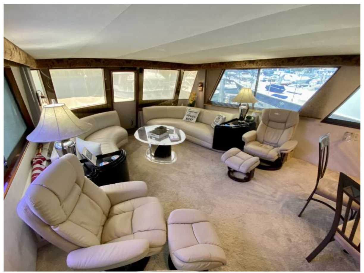
Salon 1988 70 Hatteras CPMY Conundrum