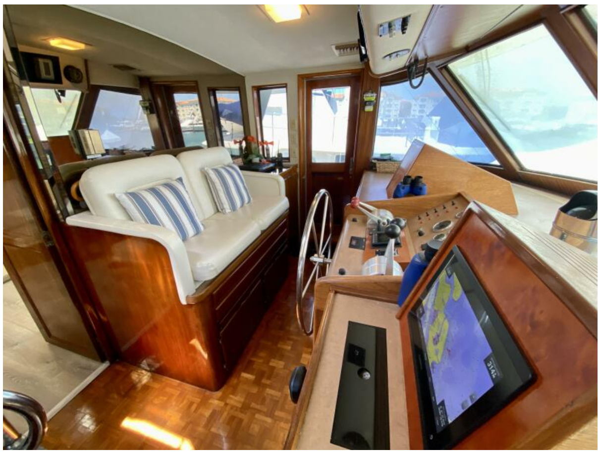
Pilothouse 1988 70 Hatteras CPMY Conundrum