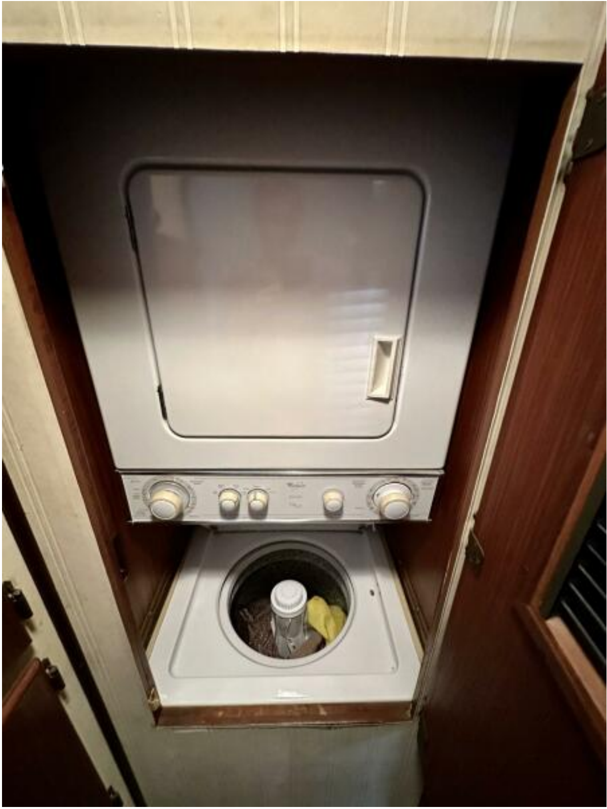
Stacked, Washer and Dryer 1988 70 Hatteras CPMY Conundrum