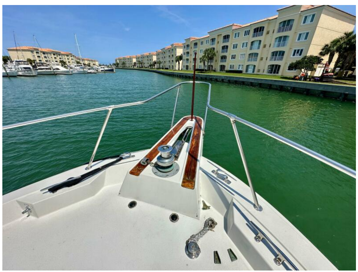
Bow 1988 70 Hatteras CPMY Conundrum