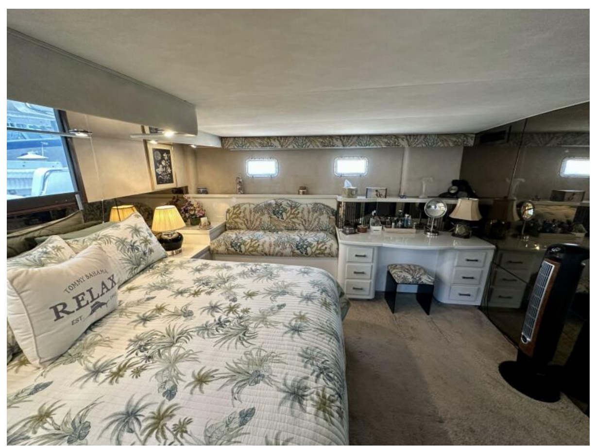
Master Stateroom 1988 70 Hatteras CPMY Conundrum