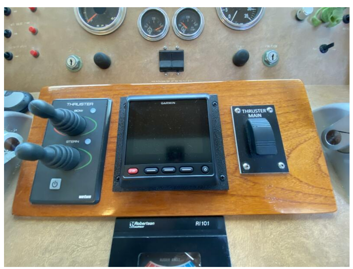
Pilothouse Electronics 1988 70 Hatteras CPMY Conundrum