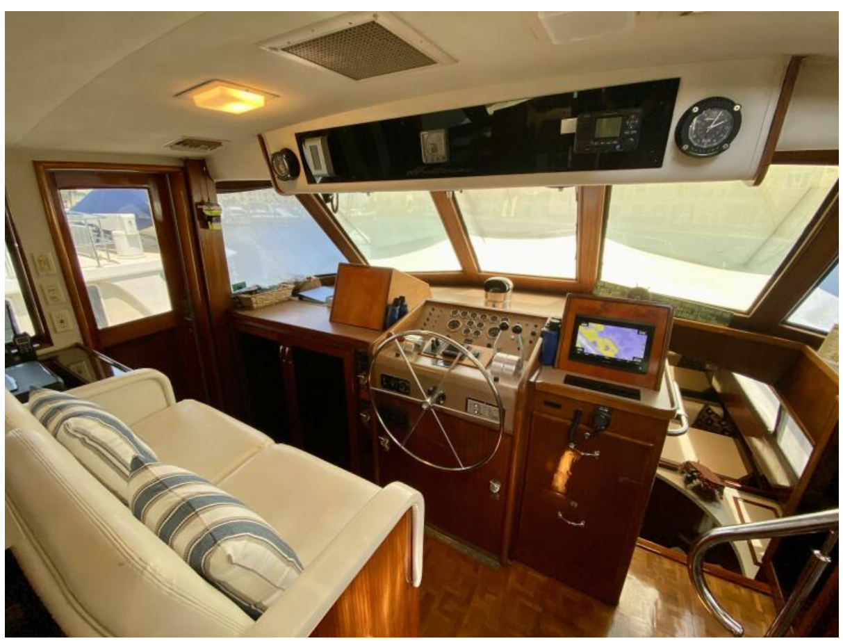
Pilothouse 1988 70 Hatteras CPMY Conundrum