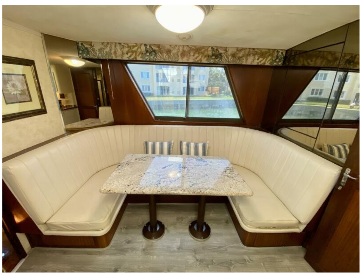
Dinette 1988 70 Hatteras CPMY Conundrum