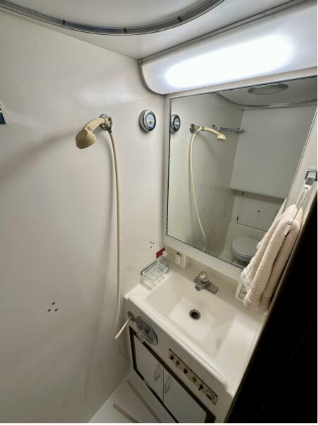
Head 1988 70 Hatteras CPMY Conundrum