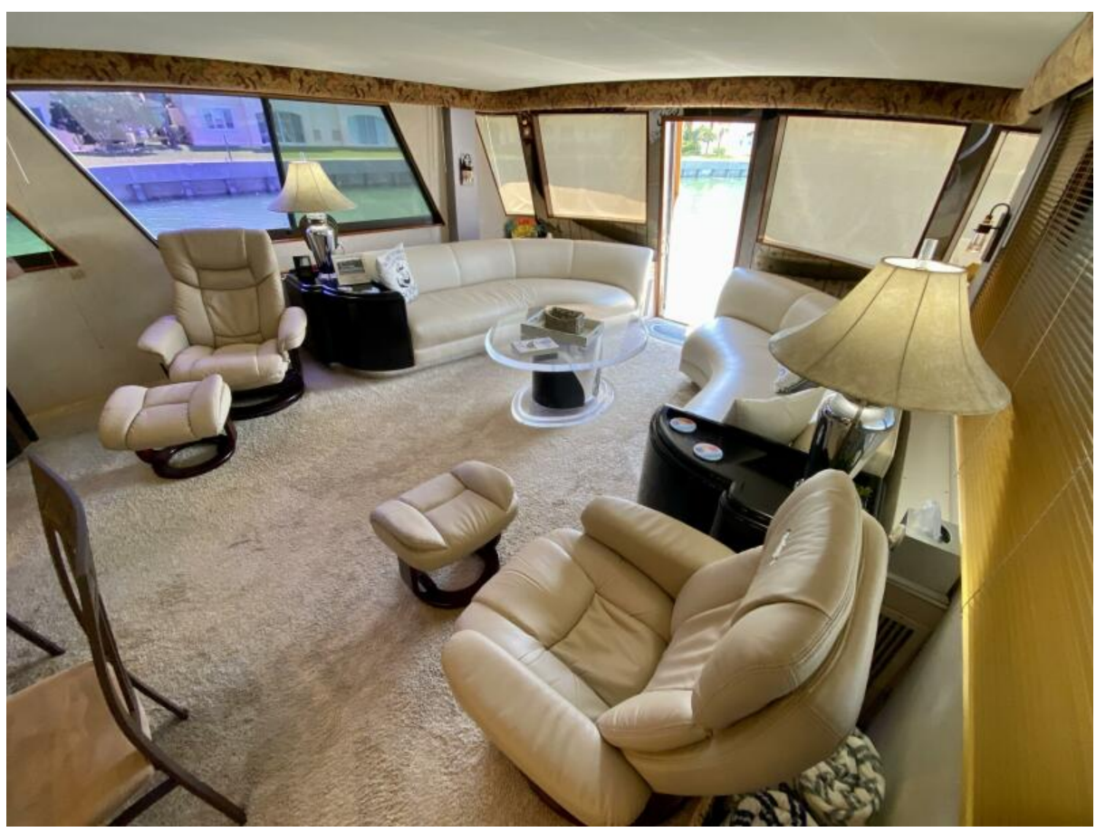
Salon 1988 70 Hatteras CPMY Conundrum