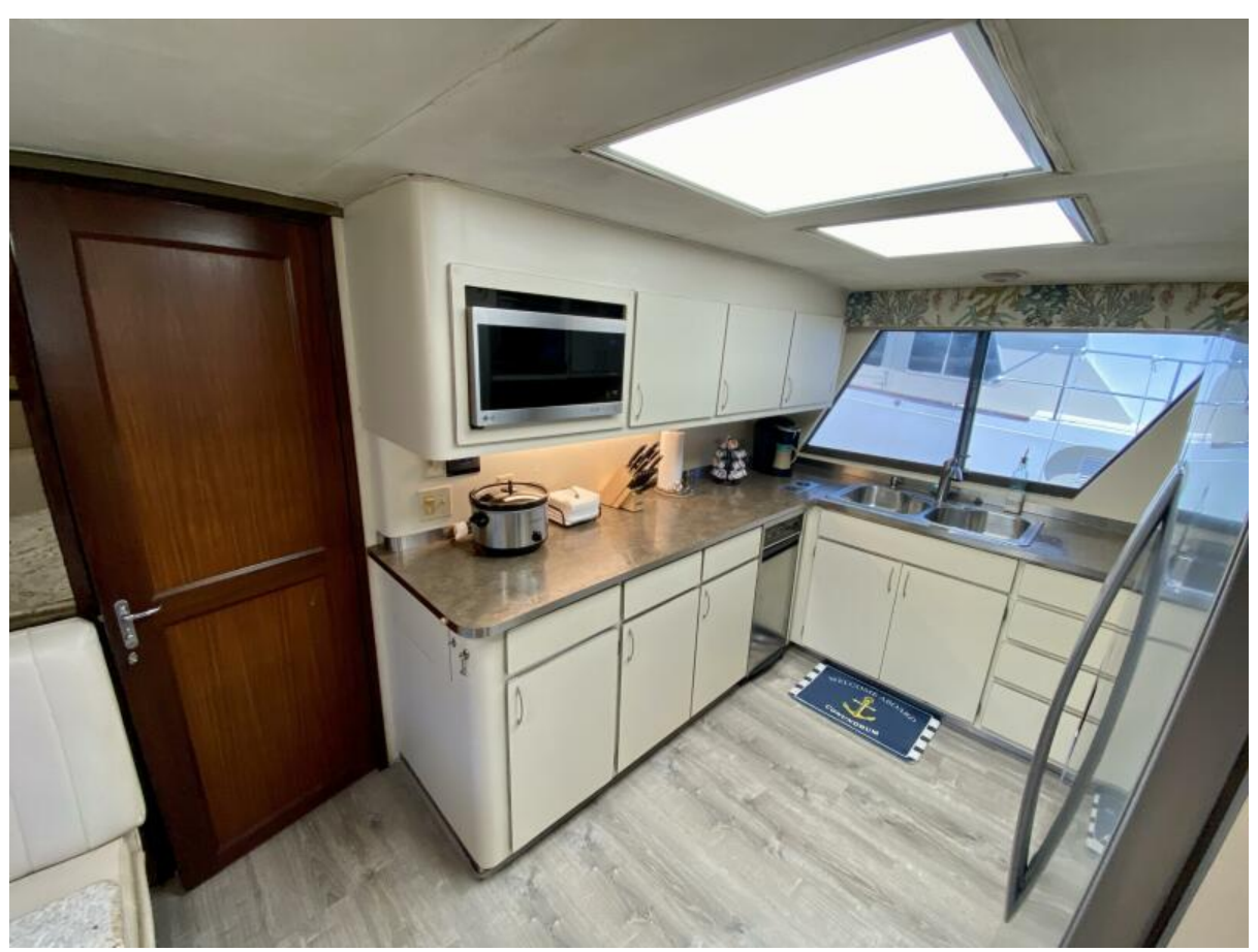
Galley 1988 70 Hatteras CPMY Conundrum