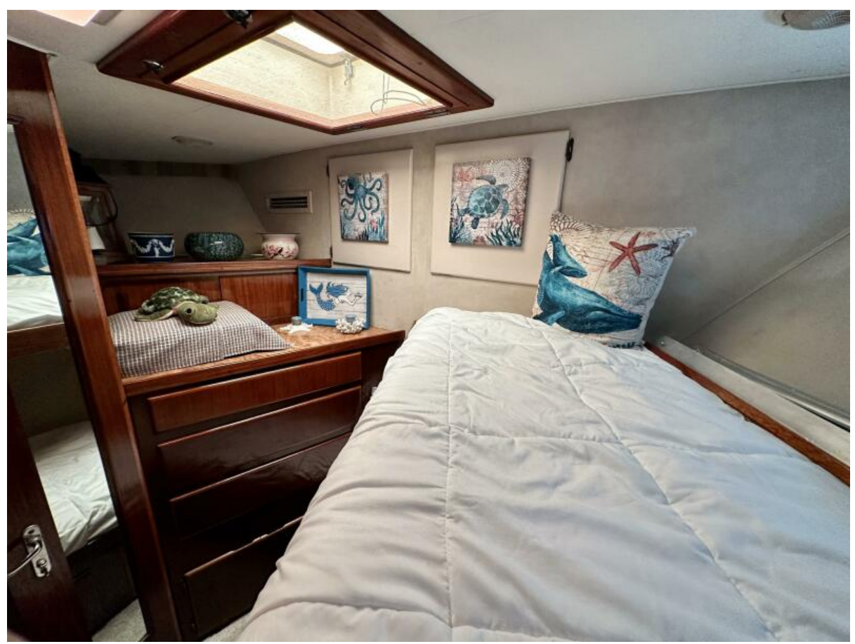
Forward Guest Stateroom 1988 70 Hatteras CPMY Conundrum