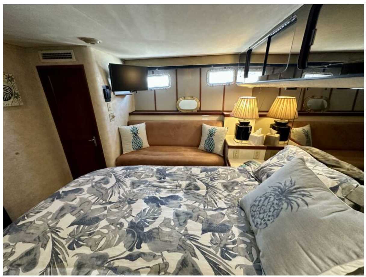
VIP Stateroom 1988 70 Hatteras CPMY Conundrum