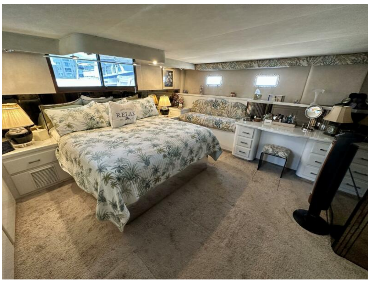
Master Stateroom 1988 70 Hatteras CPMY Conundrum