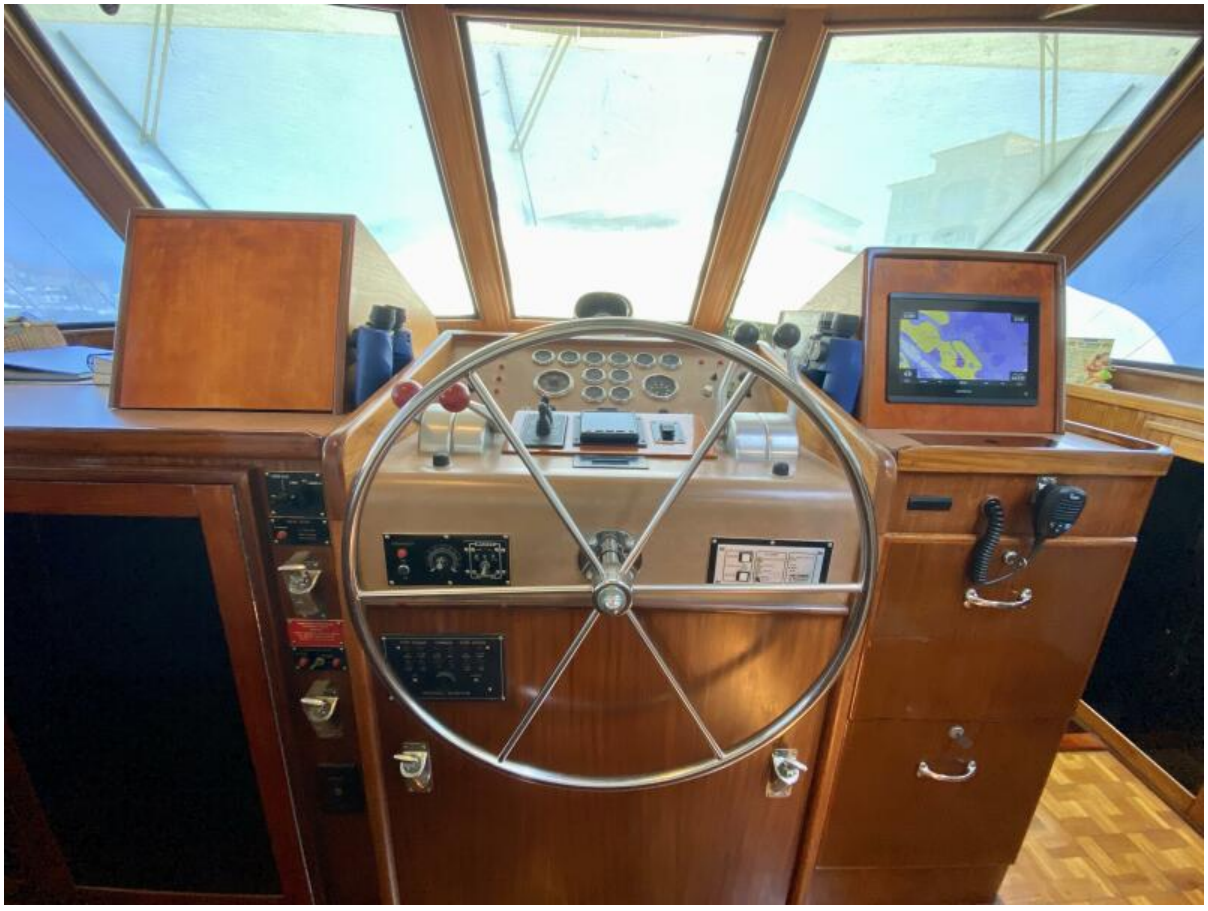
Pilothouse 1988 70 Hatteras CPMY Conundrum