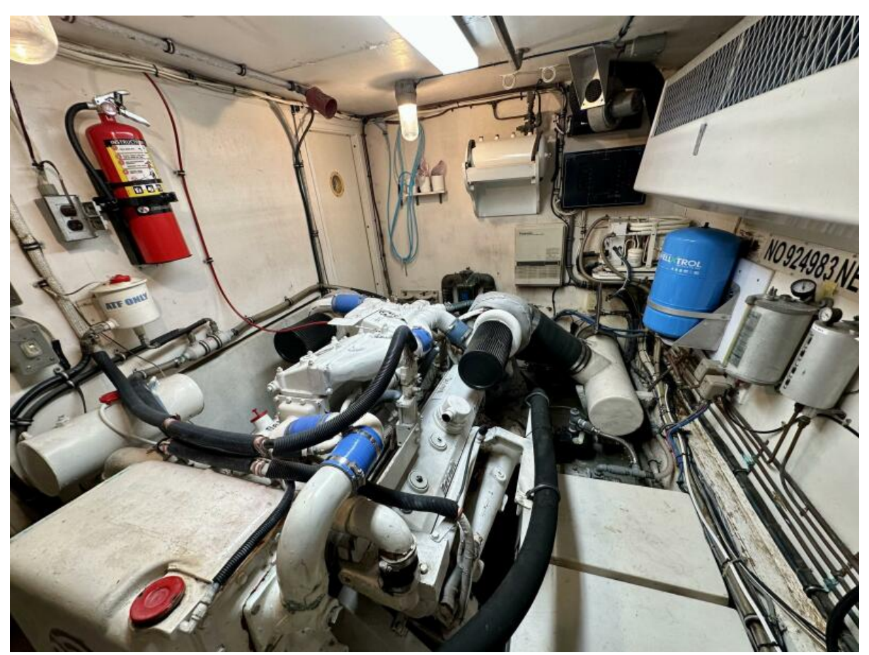
Engine Room 1988 70 Hatteras CPMY Conundrum