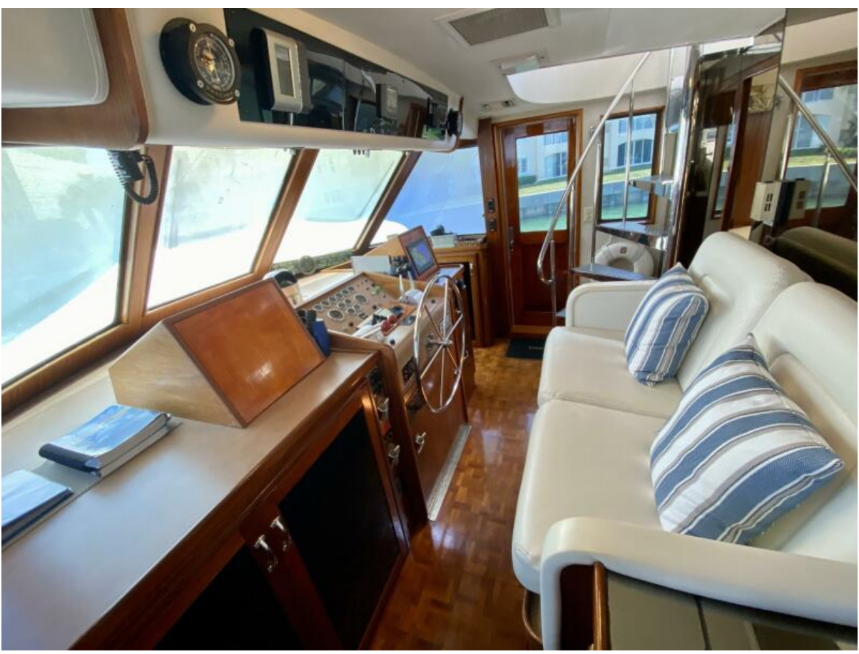
Pilothouse 1988 70 Hatteras CPMY Conundrum