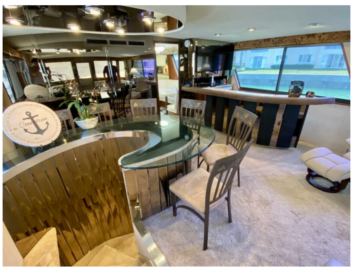
Wet Bar 1988 70 Hatteras CPMY Conundrum