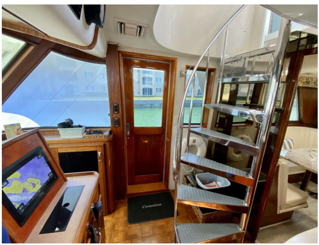
Pilothouse Electronics 1988 70 Hatteras CPMY Conundrum