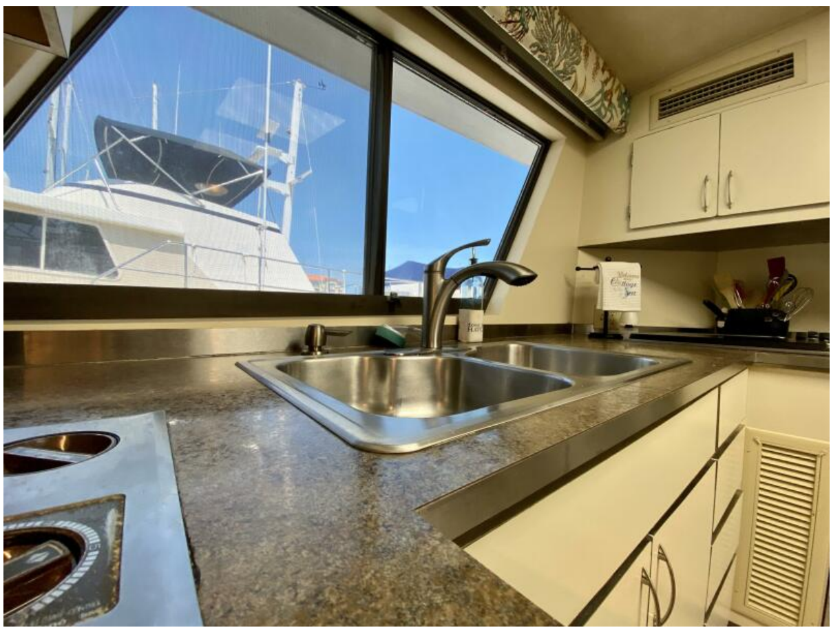
Galley 1988 70 Hatteras CPMY Conundrum