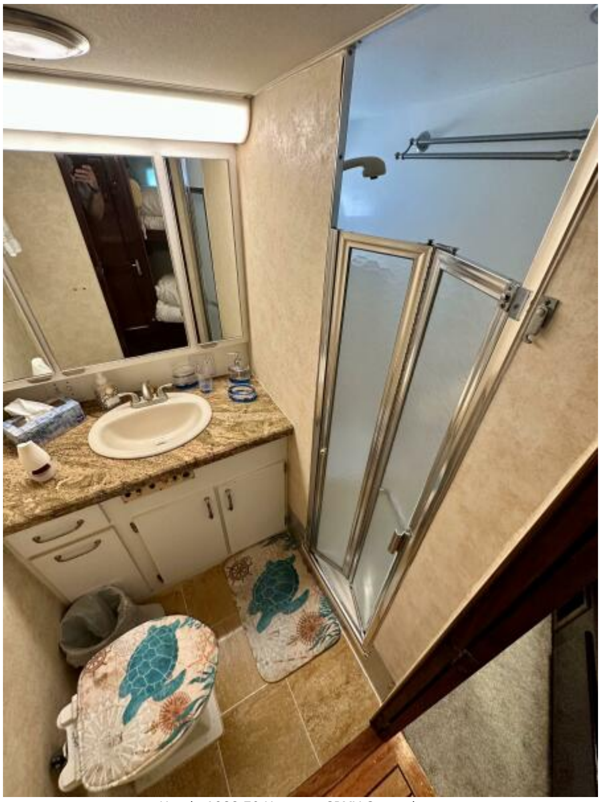
Head 1988 70 Hatteras CPMY Conundrum