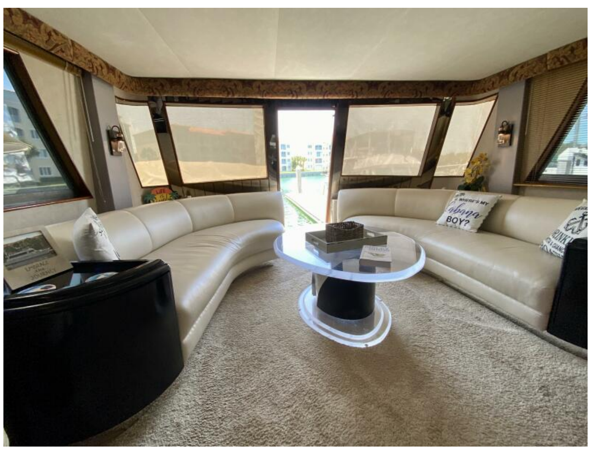
Salon 1988 70 Hatteras CPMY Conundrum