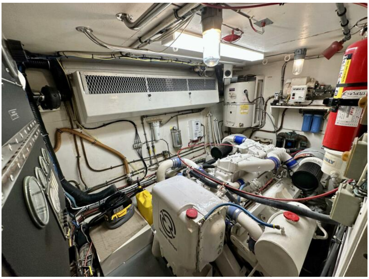
Engine Room 1988 70 Hatteras CPMY Conundrum