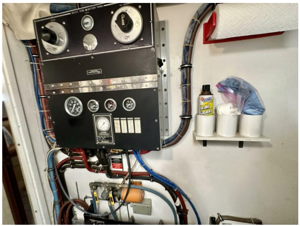
Engine Room 1988 70 Hatteras CPMY Conundrum