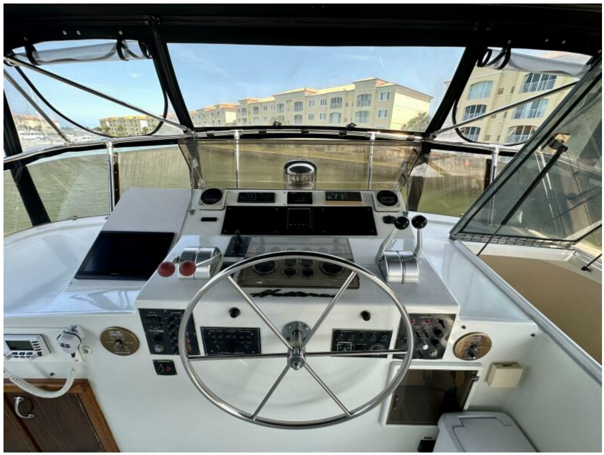
Bridge Helm 1988 70 Hatteras CPMY Conundrum