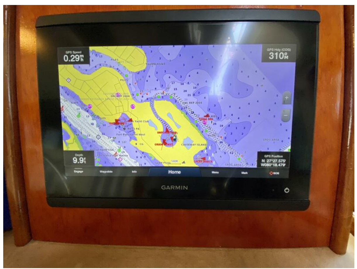
Pilothouse Electronics 1988 70 Hatteras CPMY Conundrum