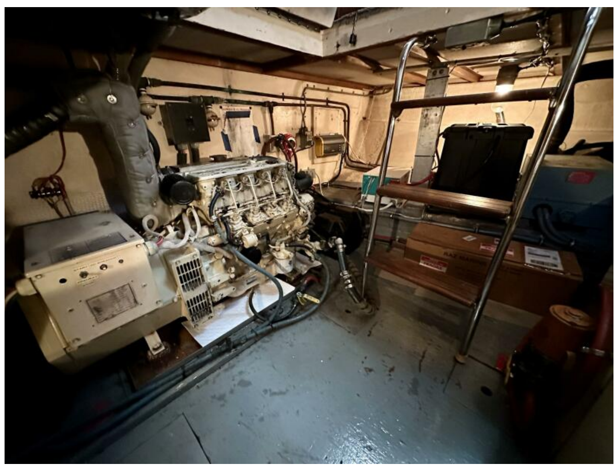
Engine Room 1988 70 Hatteras CPMY Conundrum