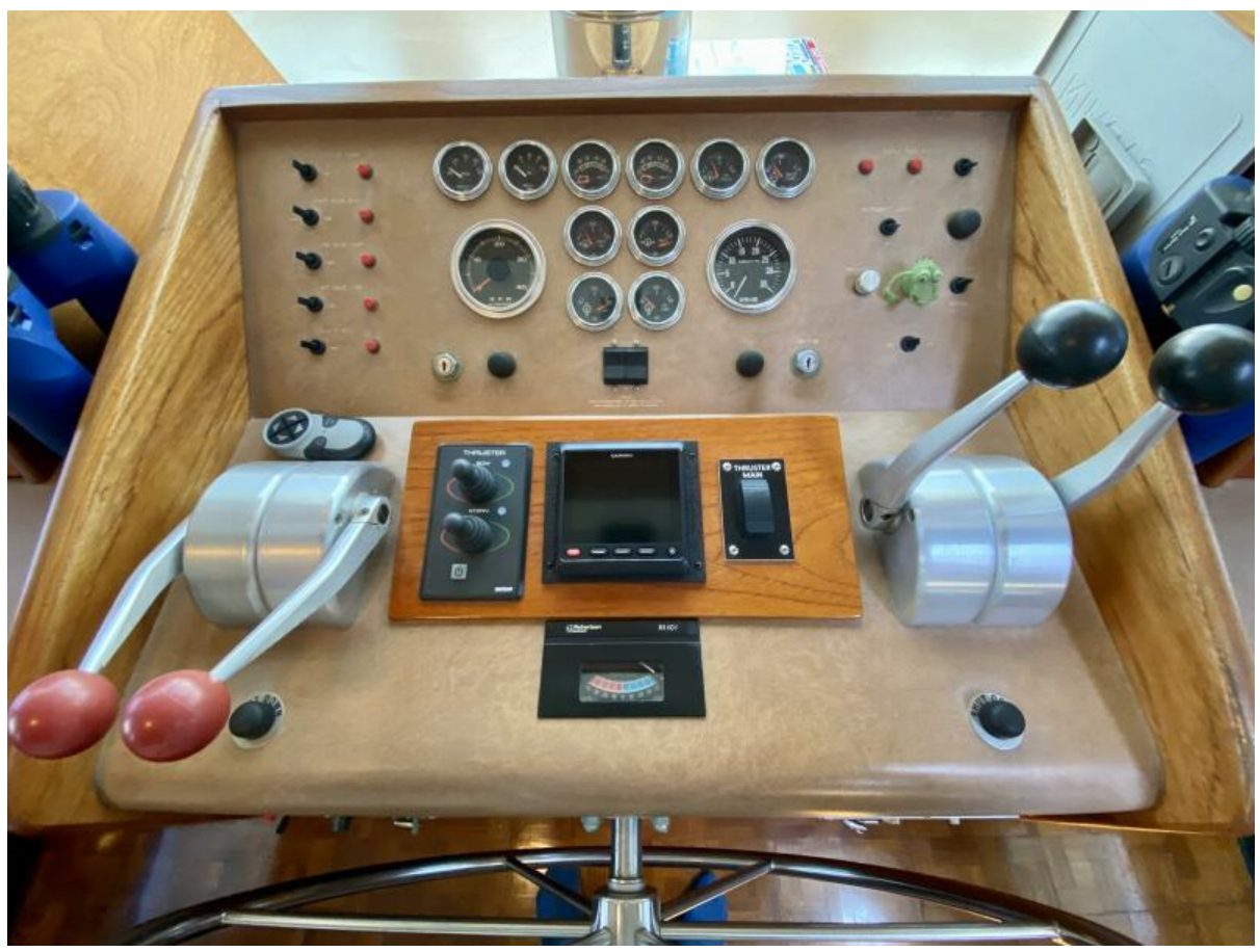
Pilothouse Electronics 1988 70 Hatteras CPMY Conundrum