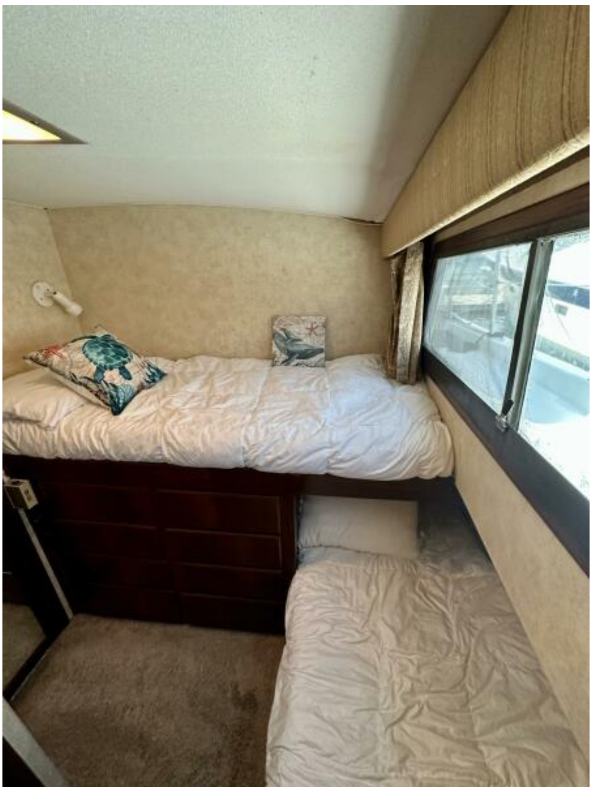
Forward Guest Stateroom 1988 70 Hatteras CPMY Conundrum