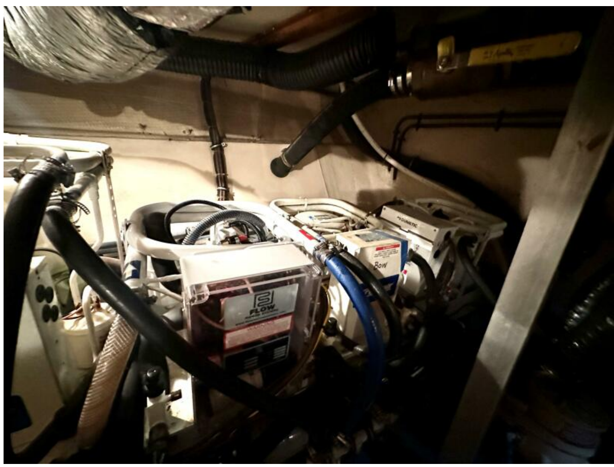
Engine Room 1988 70 Hatteras CPMY Conundrum