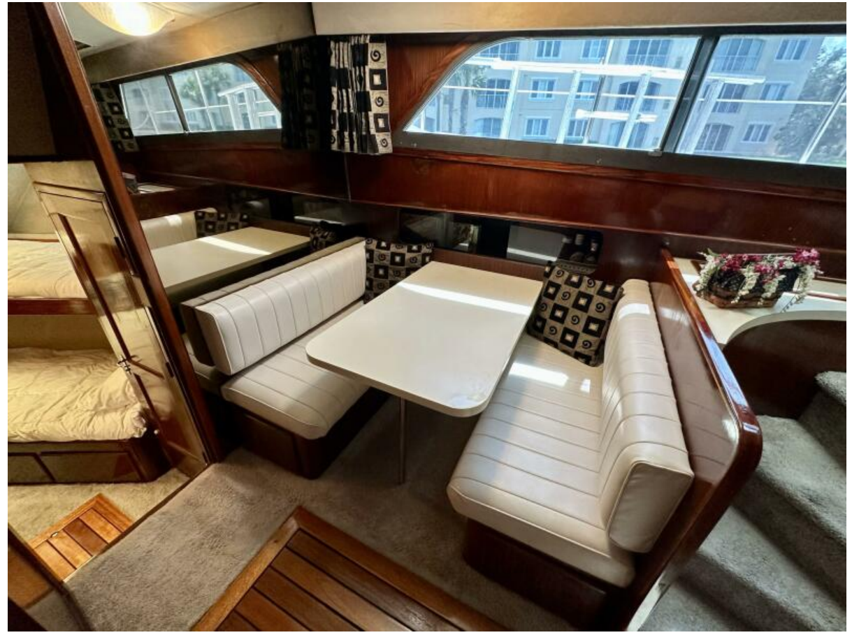
Dinette 1988 70 Hatteras CPMY Conundrum