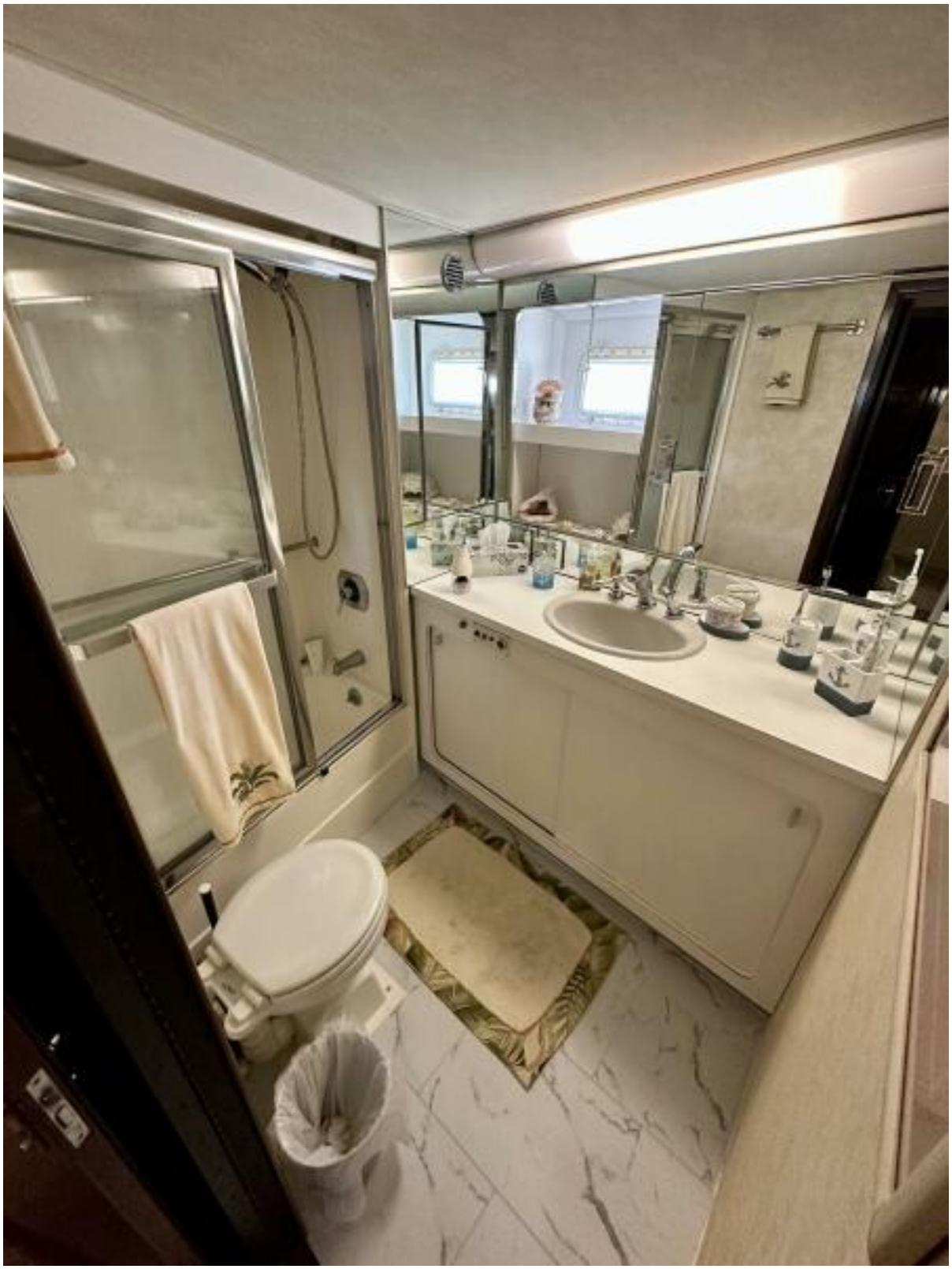
Head 1988 70 Hatteras CPMY Conundrum