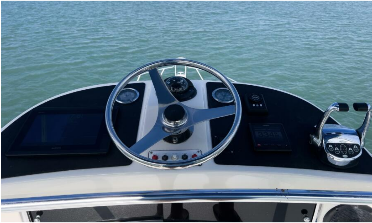
Tower 2003 40' Cabo Express - Fishstix