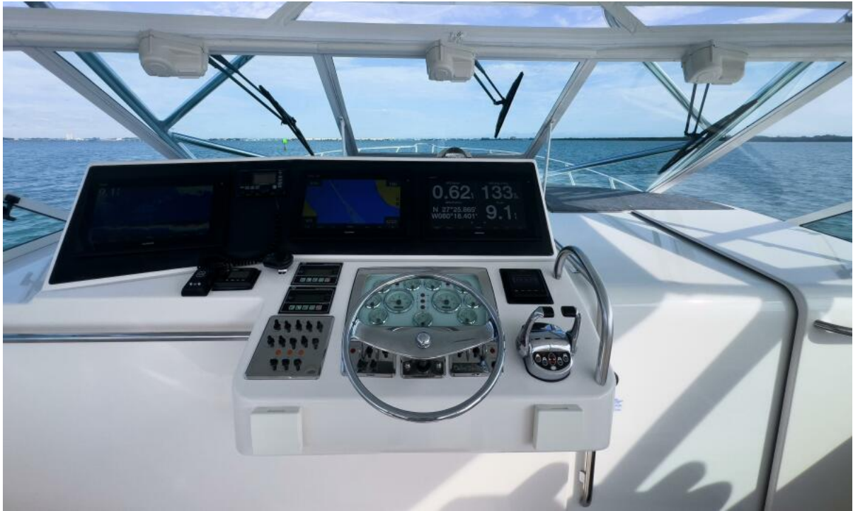
Helm 2003 40' Cabo Express - Fishstix