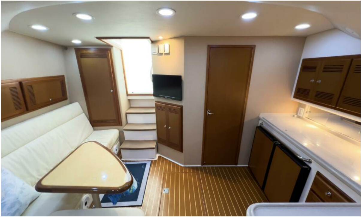
Cabin 2003 40' Cabo Express - Fishstix