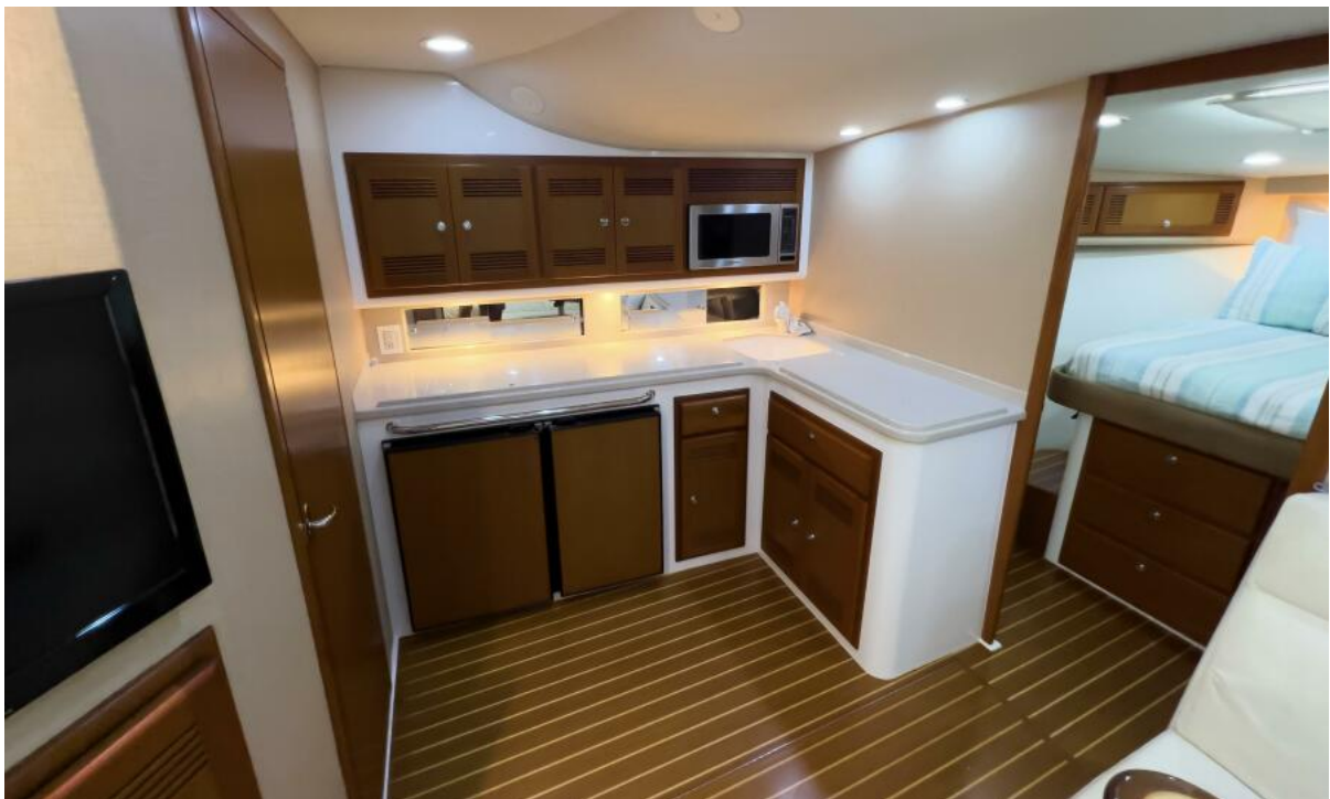
Cabin - Galley 2003 40' Cabo Express - Fishstix