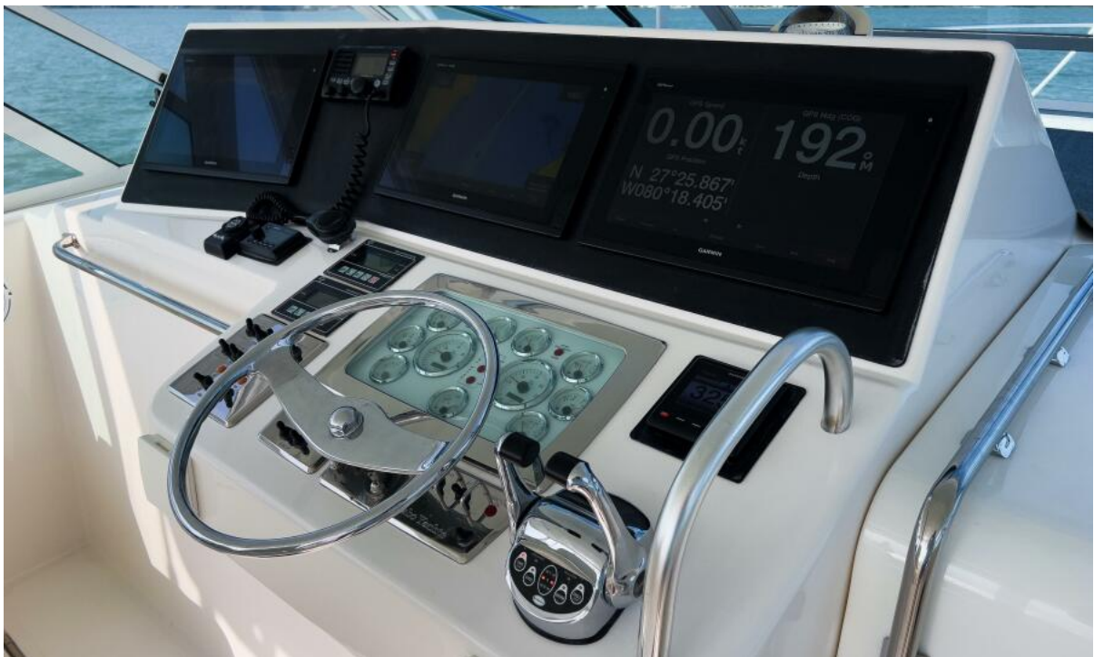
Helm 2003 40' Cabo Express - Fishstix