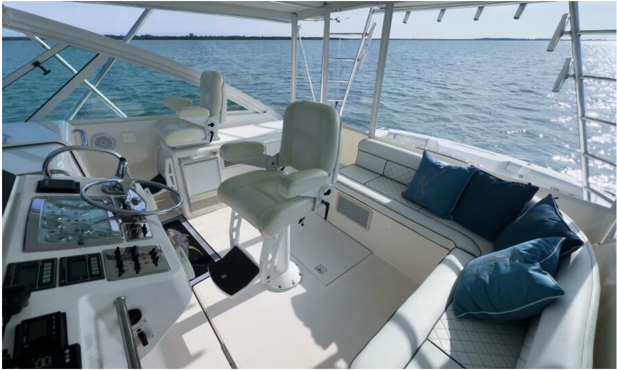
Helm Seating 2003 40' Cabo Express - Fishstix