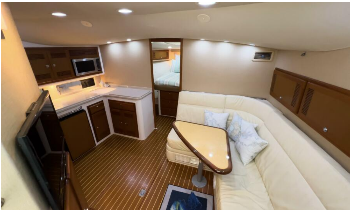
Cabin 2003 40' Cabo Express - Fishstix