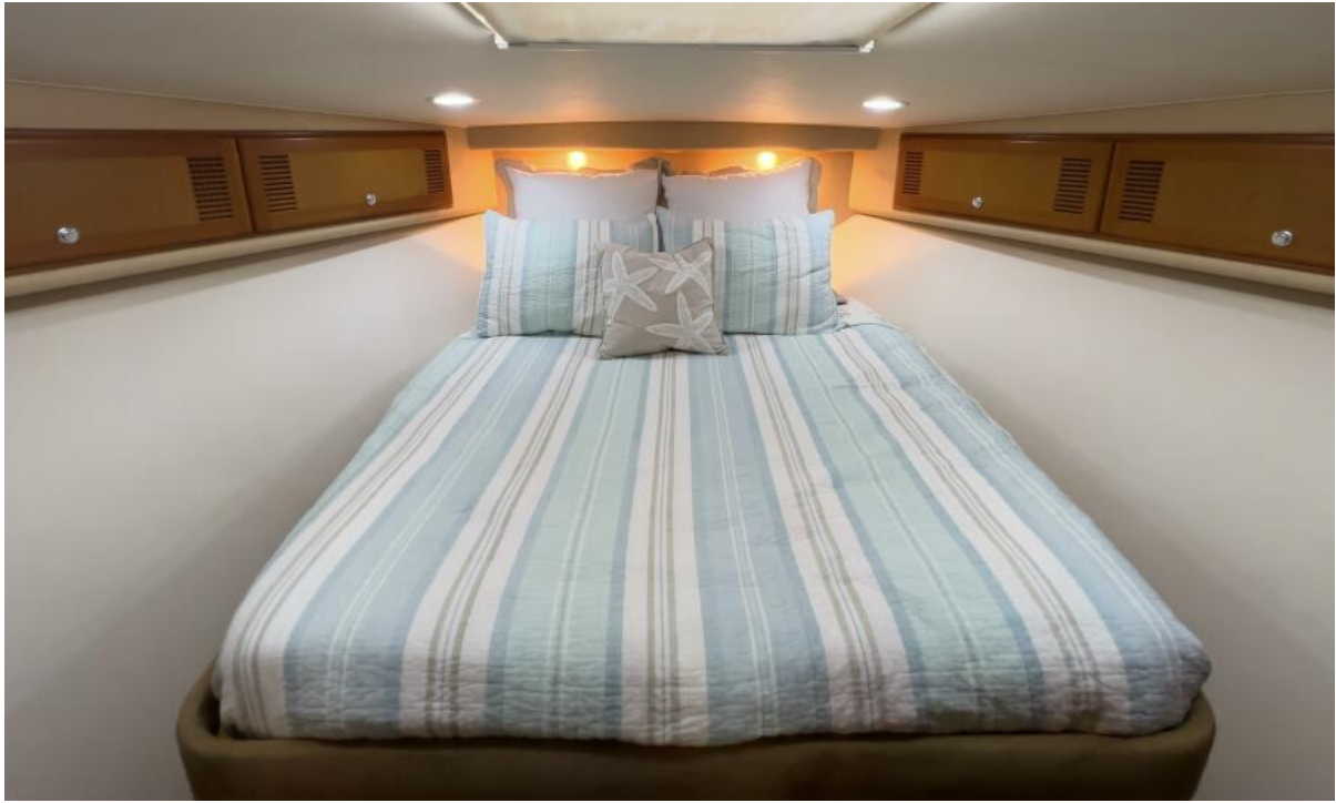
Cabin 2003 40' Cabo Express - Fishstix