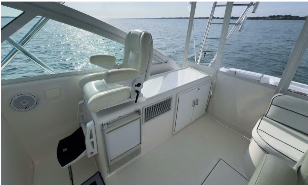
Helm 2003 40' Cabo Express - Fishstix