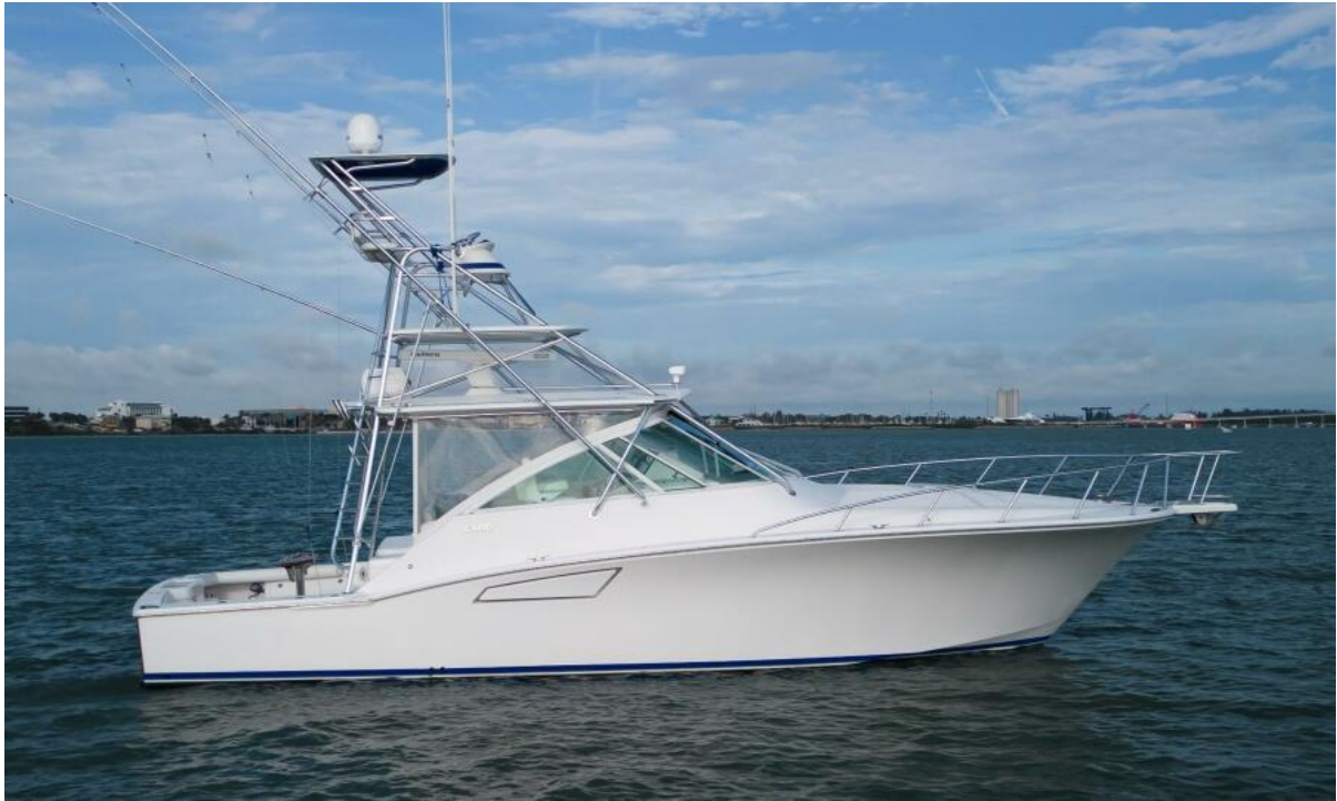
Fishstix - Profile 2003 40' Cabo Express - Fishstix