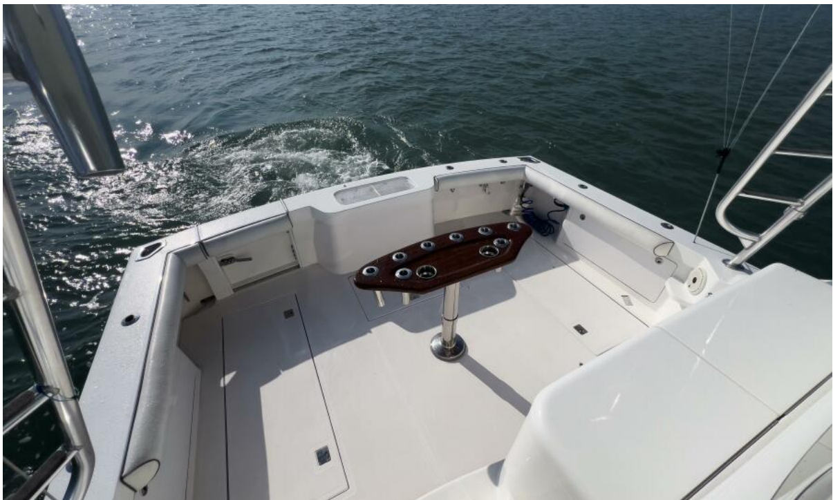
Cockpit 2003 40' Cabo Express - Fishstix