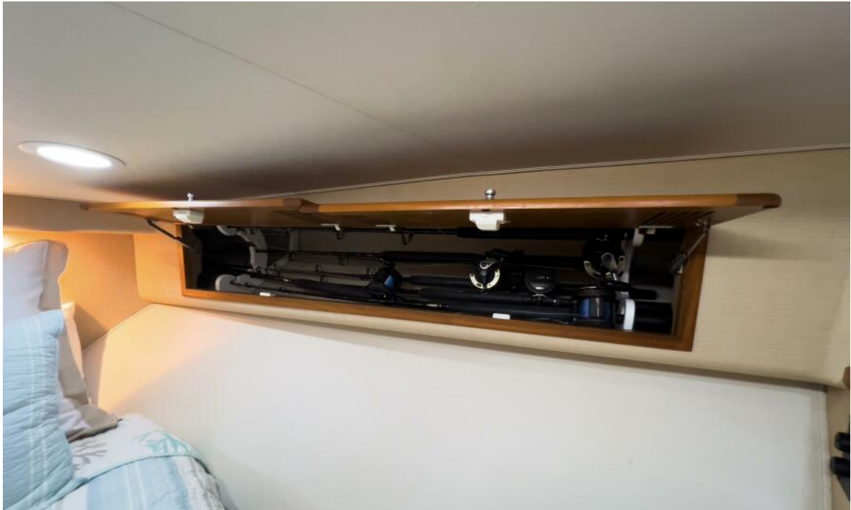
Cabin 2003 40' Cabo Express - Fishstix