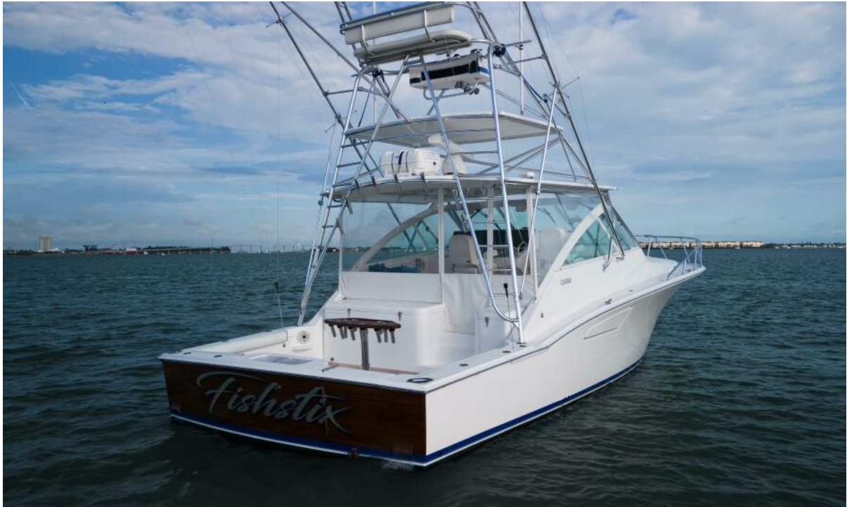
Fishstix 2003 40' Cabo Express - Fishstix