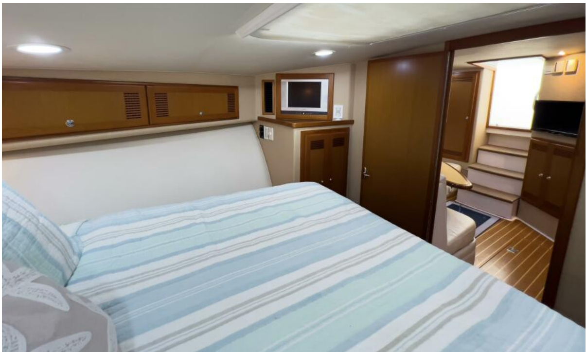
Cabin 2003 40' Cabo Express - Fishstix