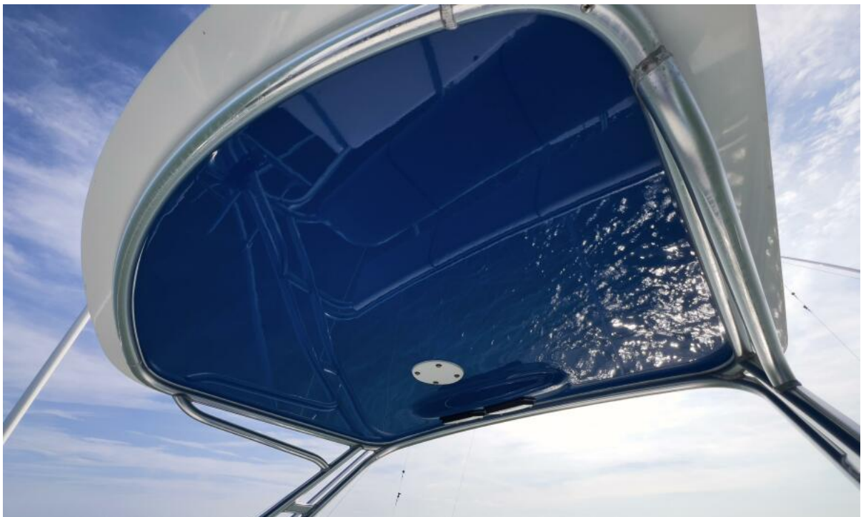
Tower 2003 40' Cabo Express - Fishstix