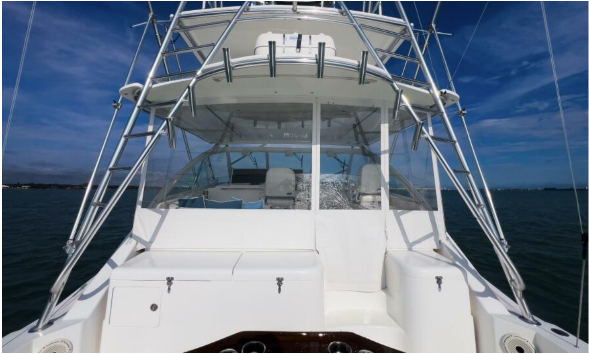
Cockpit 2003 40' Cabo Express - Fishstix