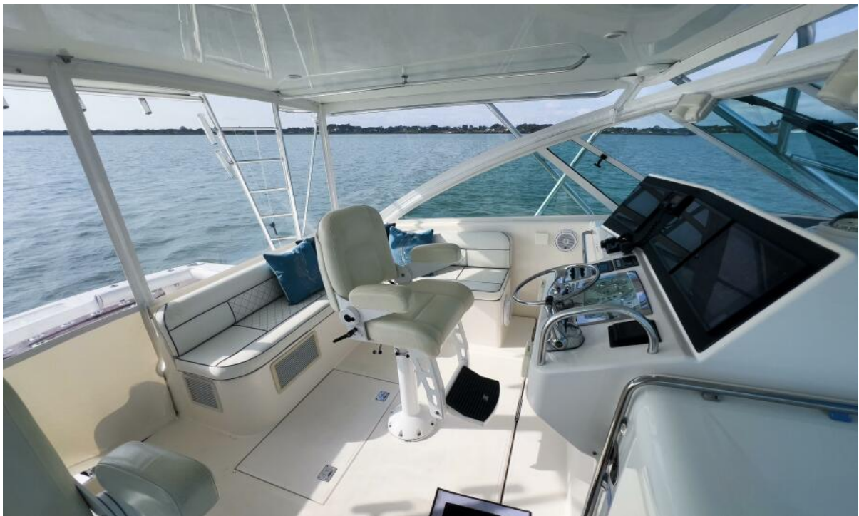
Helm Seating 2003 40' Cabo Express - Fishstix