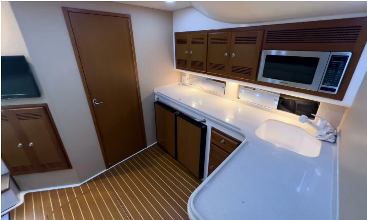
Cabin - Galley 2003 40' Cabo Express - Fishstix