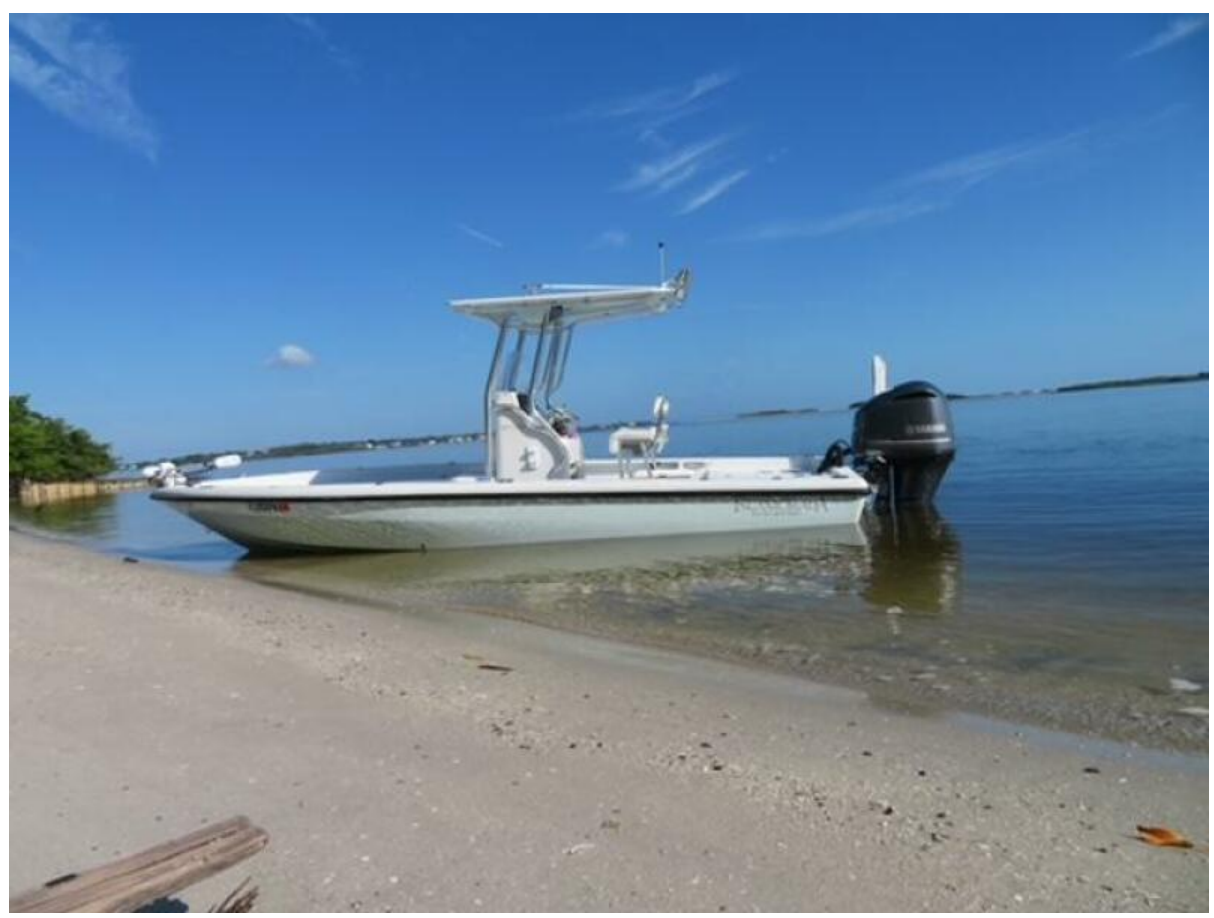
Islamorada Boatworks 24 - Profile 2015 Islamorada Boatworks 24 Bay Boat