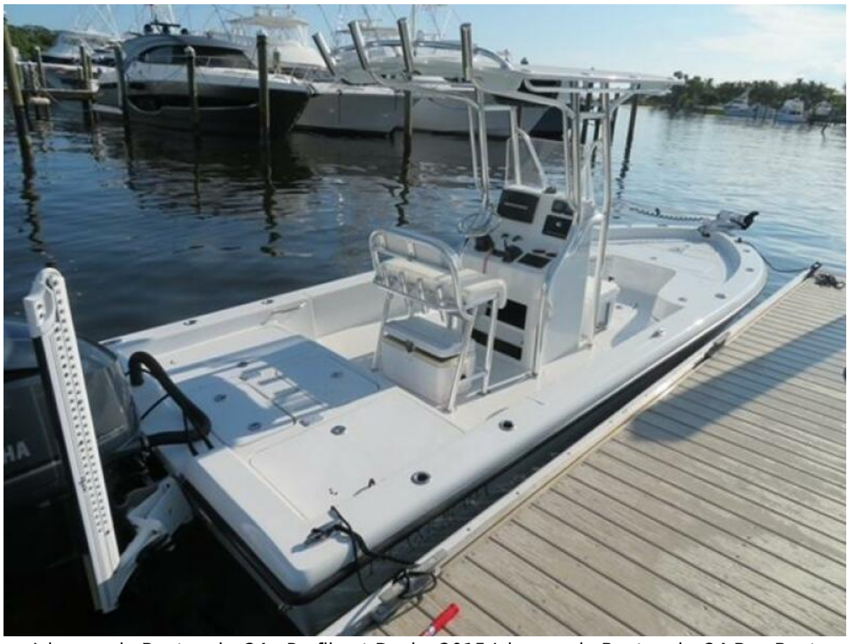
Islamorada Boatworks 24 - Profile at Dock 2015 Islamorada Boatworks 24 Bay Boat