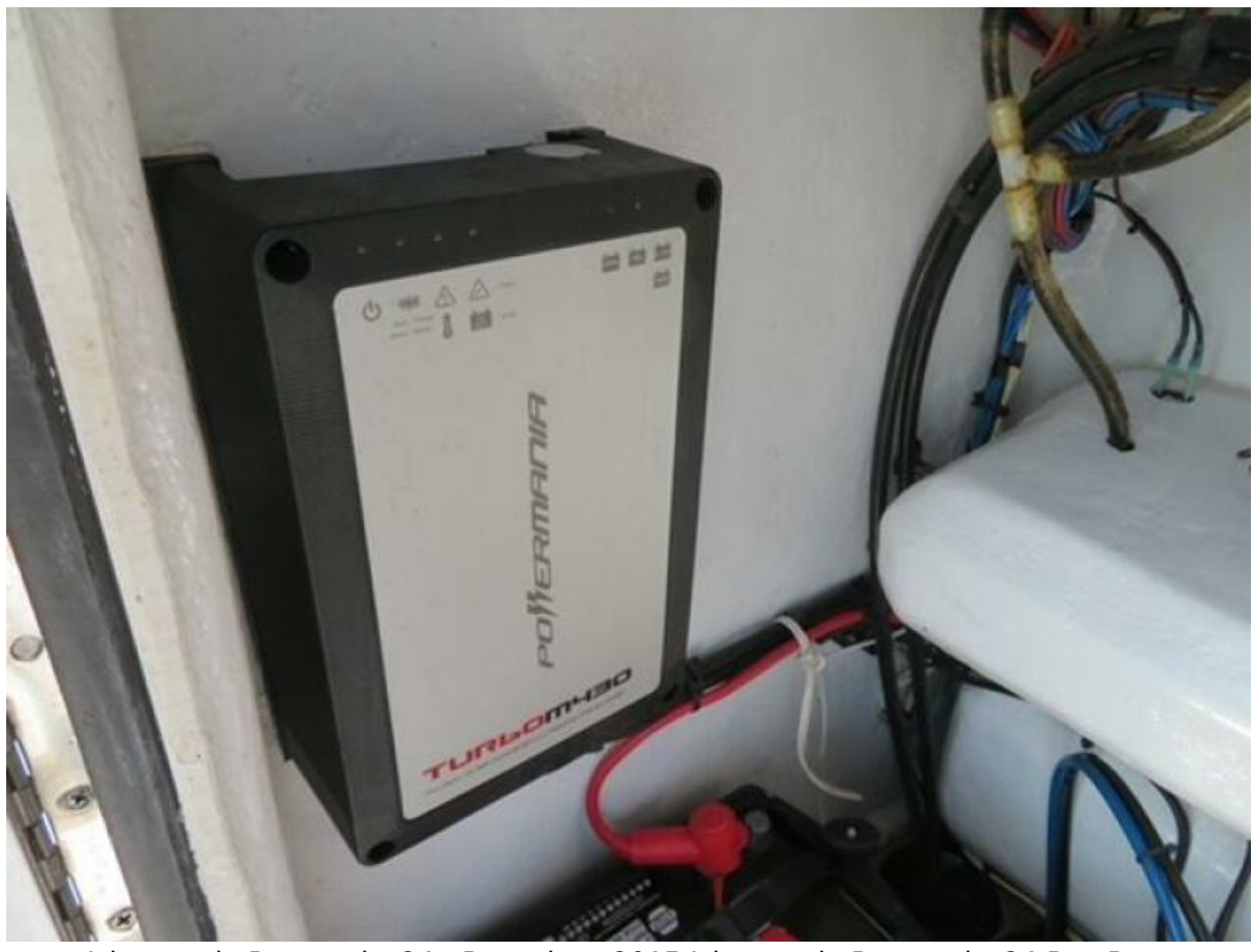
Islamorada Boatworks 24 - Batteries 2015 Islamorada Boatworks 24 Bay Boat