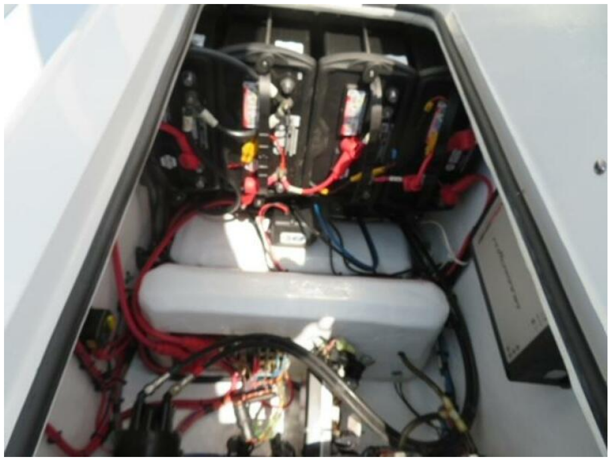
Islamorada Boatworks 24 - Batteries 2015 Islamorada Boatworks 24 Bay Boat