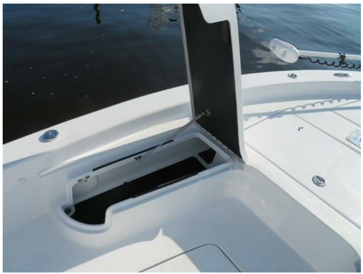
Islamorada Boatworks 24 - Storage 2015 Islamorada Boatworks 24 Bay Boat