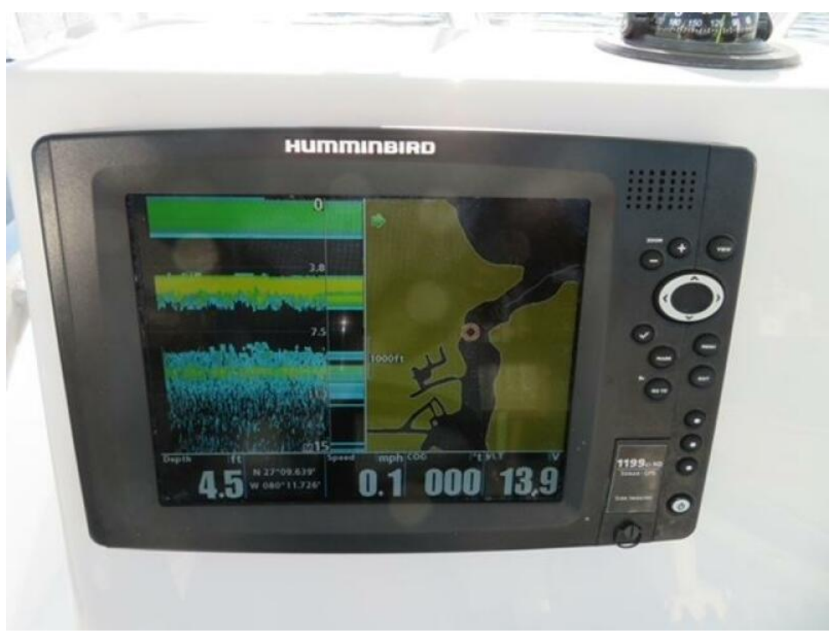
Islamorada Boatworks 24 - Electronics 2015 Islamorada Boatworks 24 Bay Boat