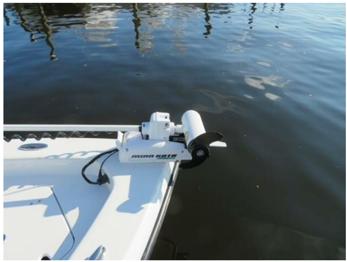
Islamorada Boatworks 24 - Trolling Motor 2015 Islamorada Boatworks 24 Bay Boat