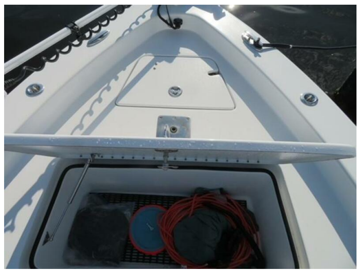
Islamorada Boatworks 24 - Storage 2015 Islamorada Boatworks 24 Bay Boat