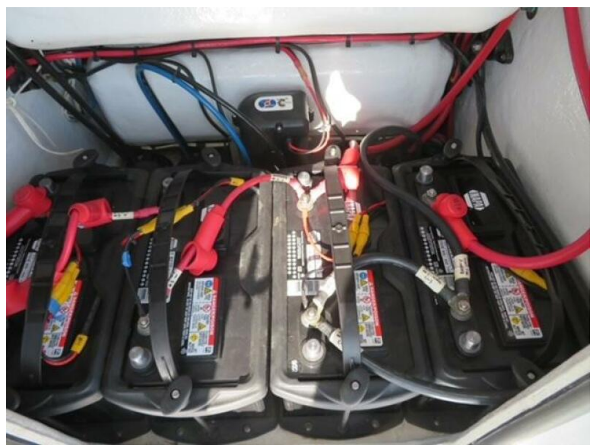
Islamorada Boatworks 24 - Batteries 2015 Islamorada Boatworks 24 Bay Boat