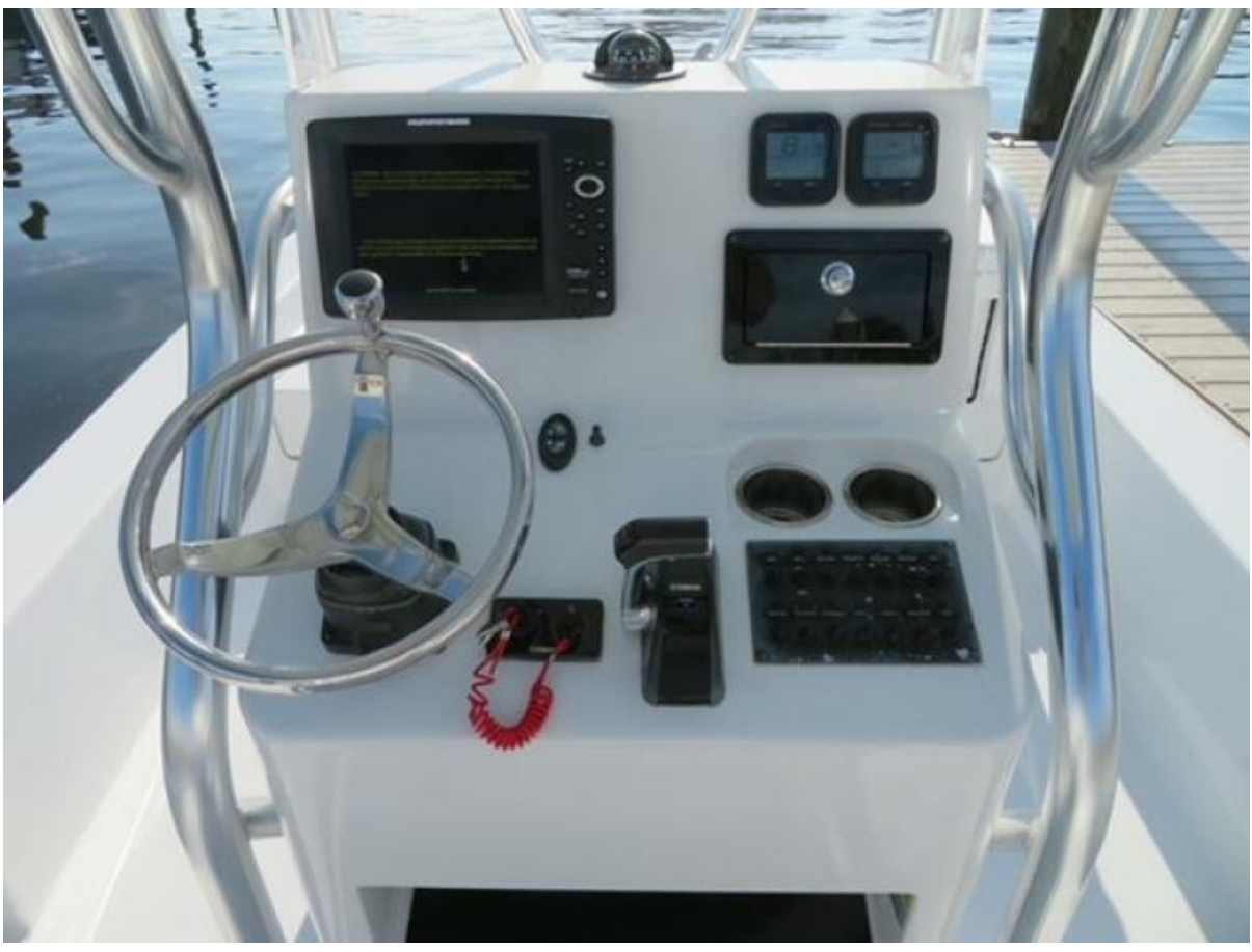
Islamorada Boatworks 24 - Helm 2015 Islamorada Boatworks 24 Bay Boat