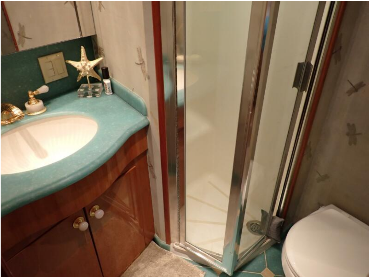
Forward Stateroom Head