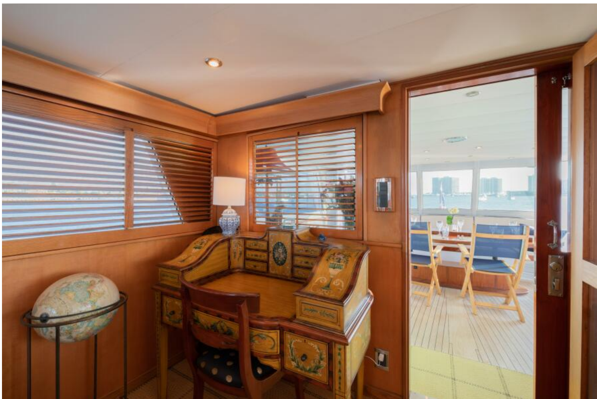
Desk at Forward Salon