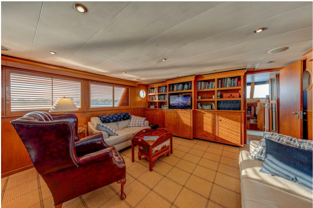
Forward Salon Seating