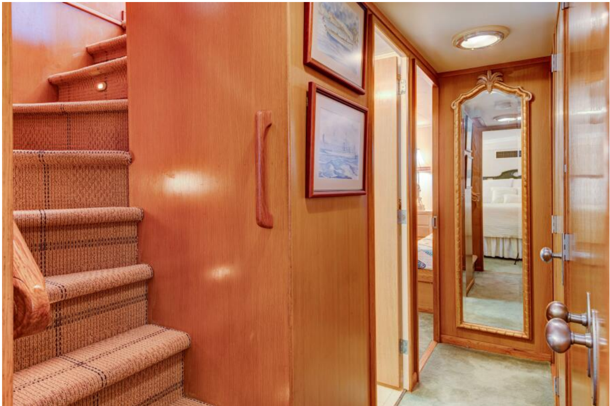
Companionway to Staterooms