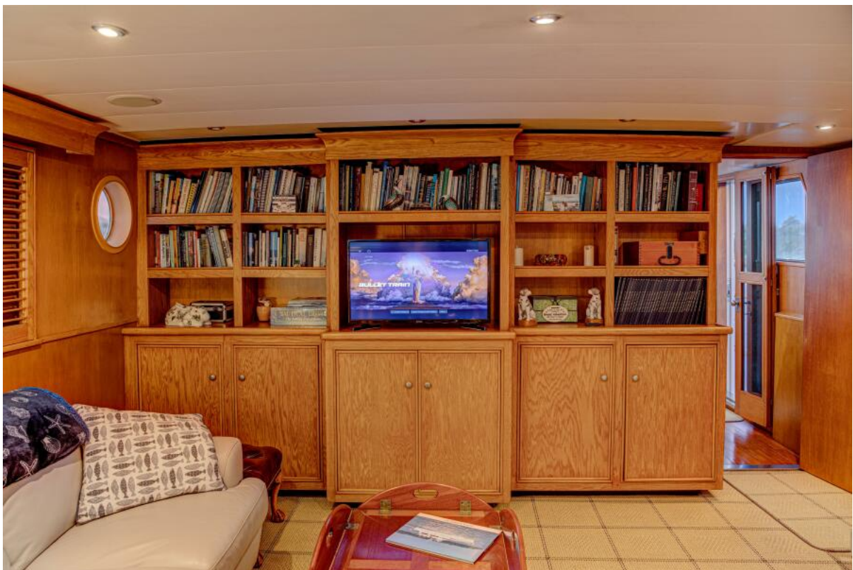
Forward Salon TV & Bookshelves