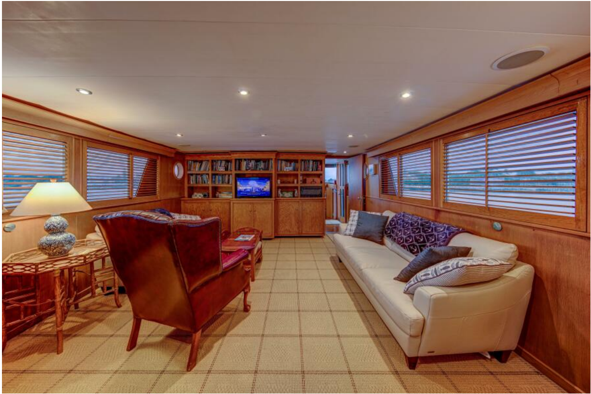
Forward Salon Seating