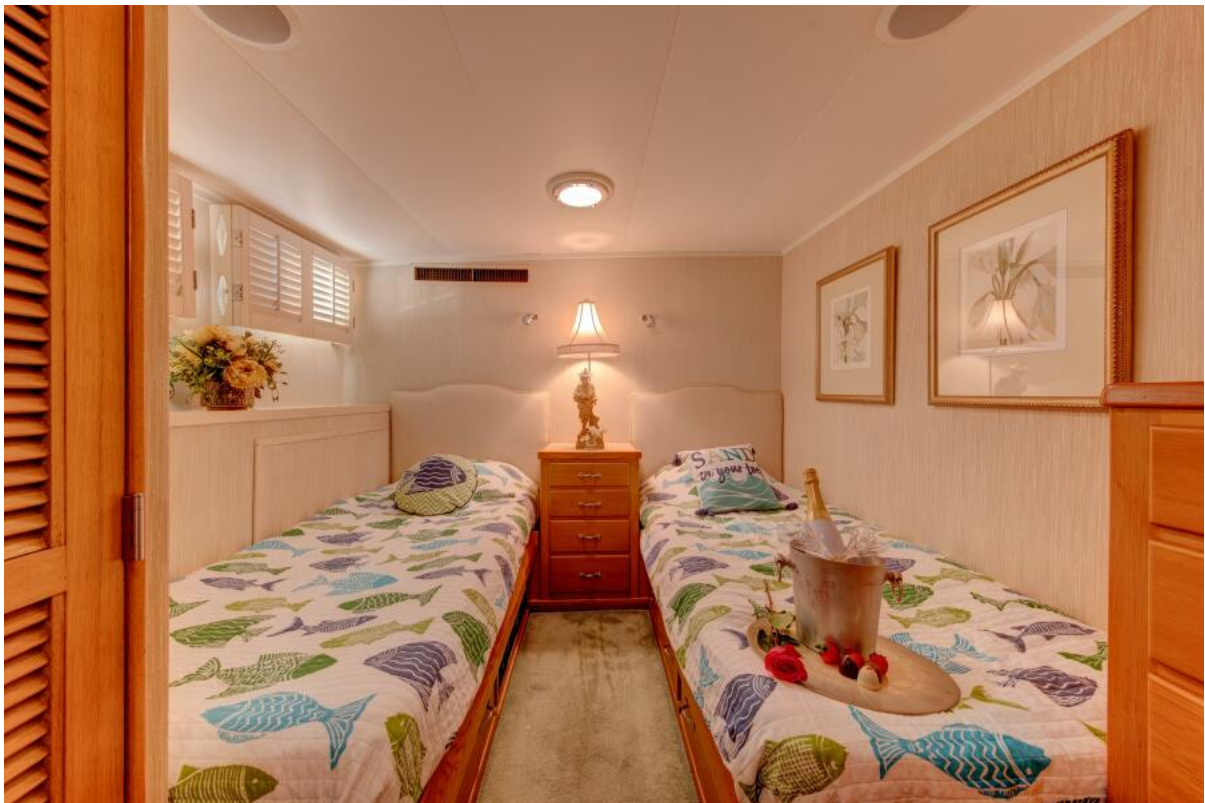
Guest Stateroom Twin Berths