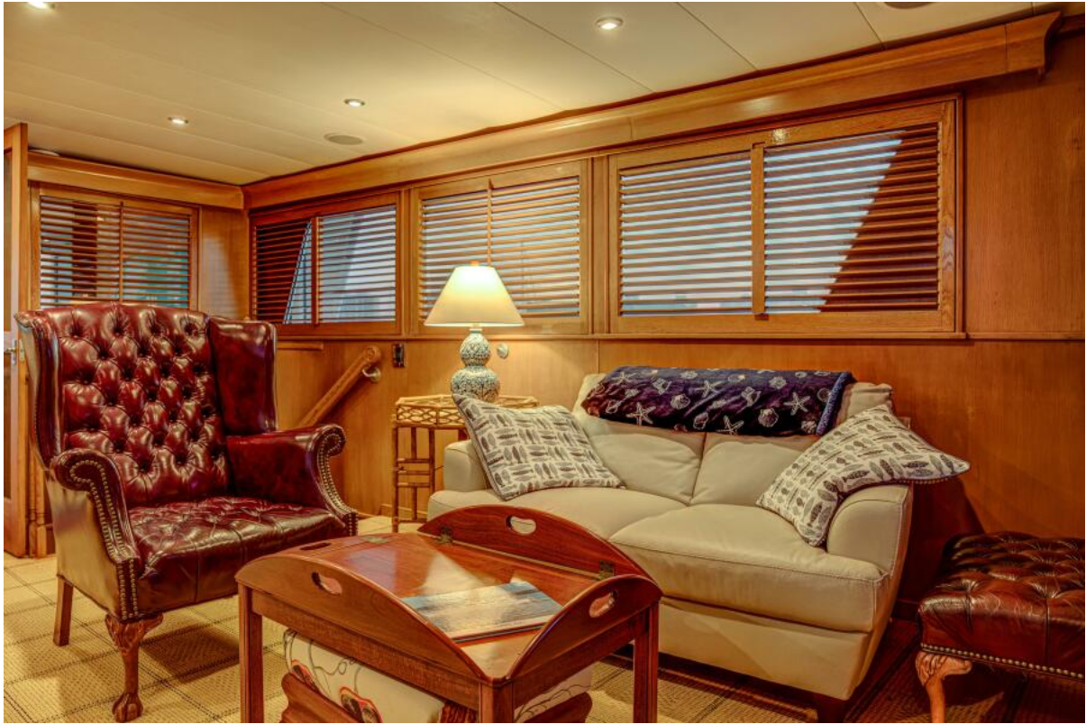
Forward Salon Seating