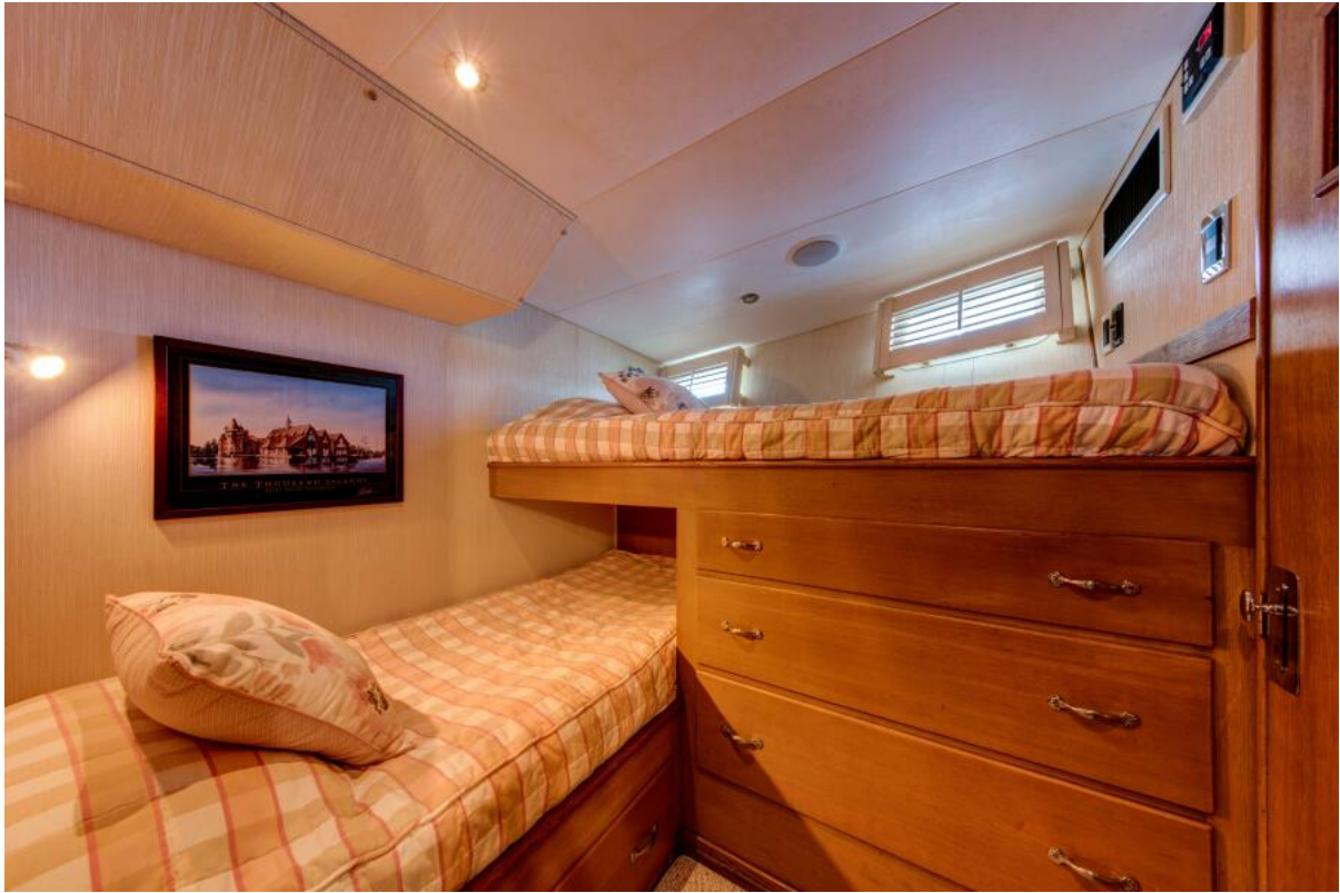
Crew Cabin Criss Cross Berths