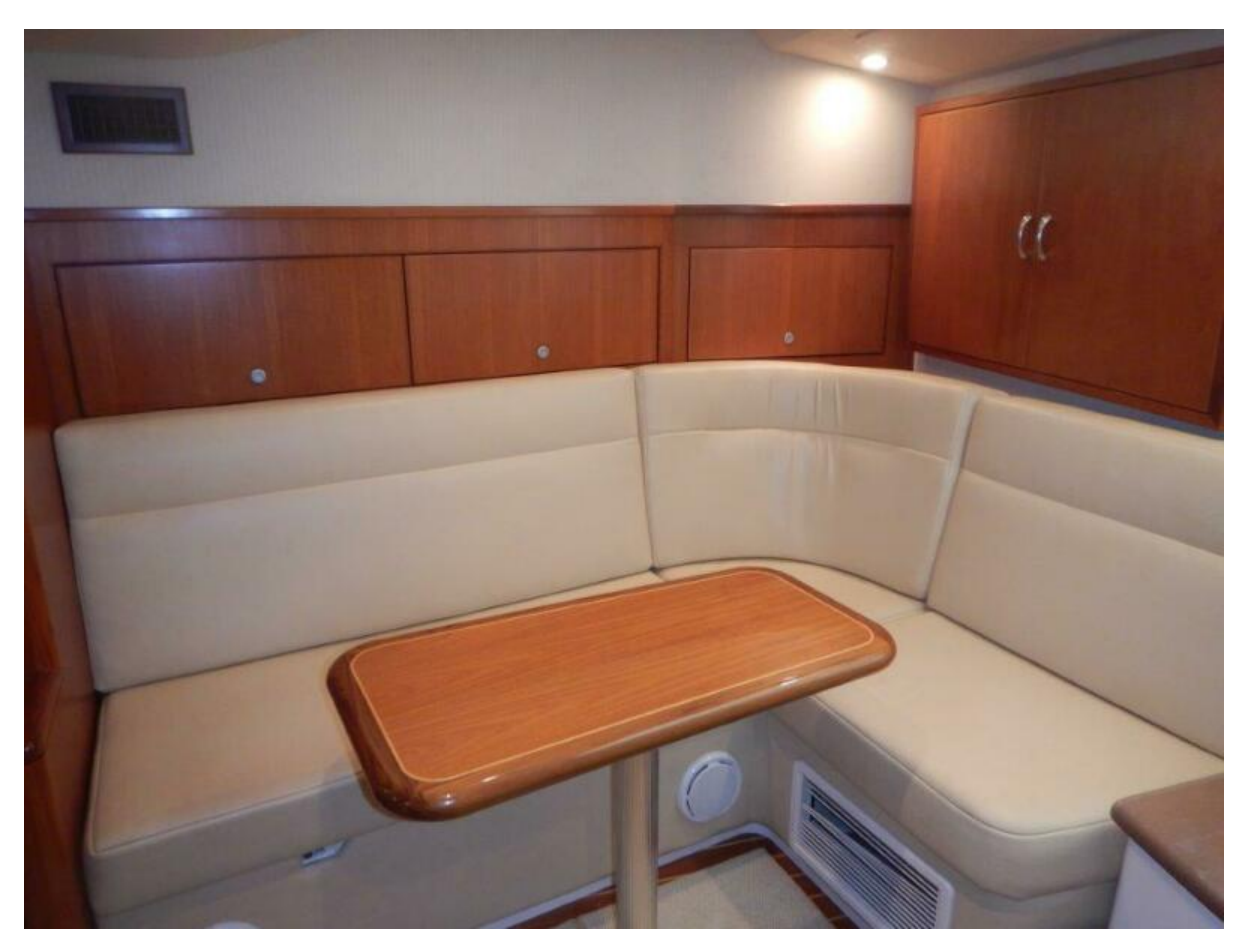
Seating & Table