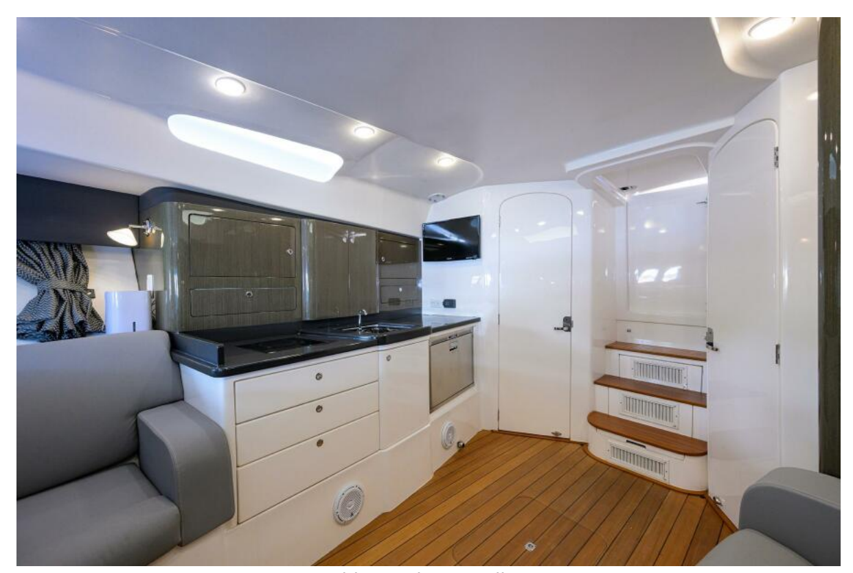
Cabin Seating & Galley