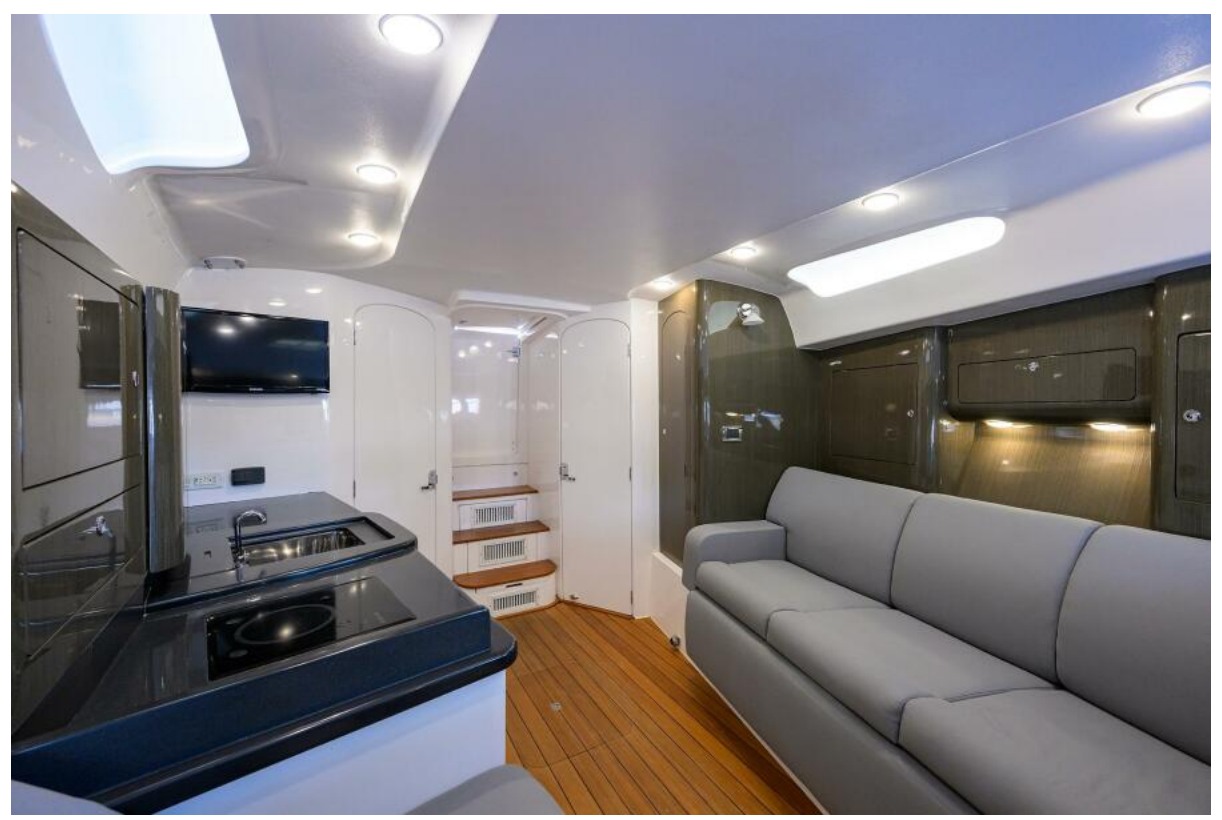
Cabin Seating & Galley