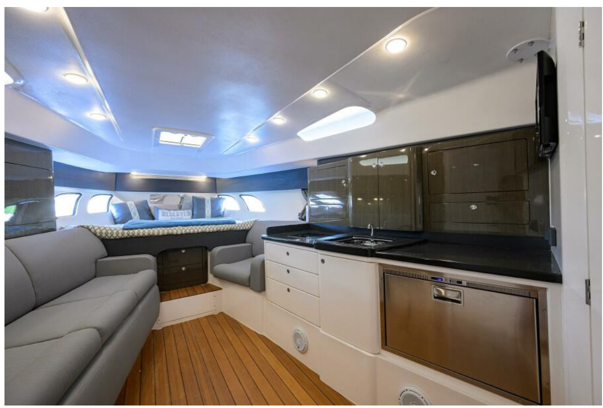
Cabin Seating & Galley