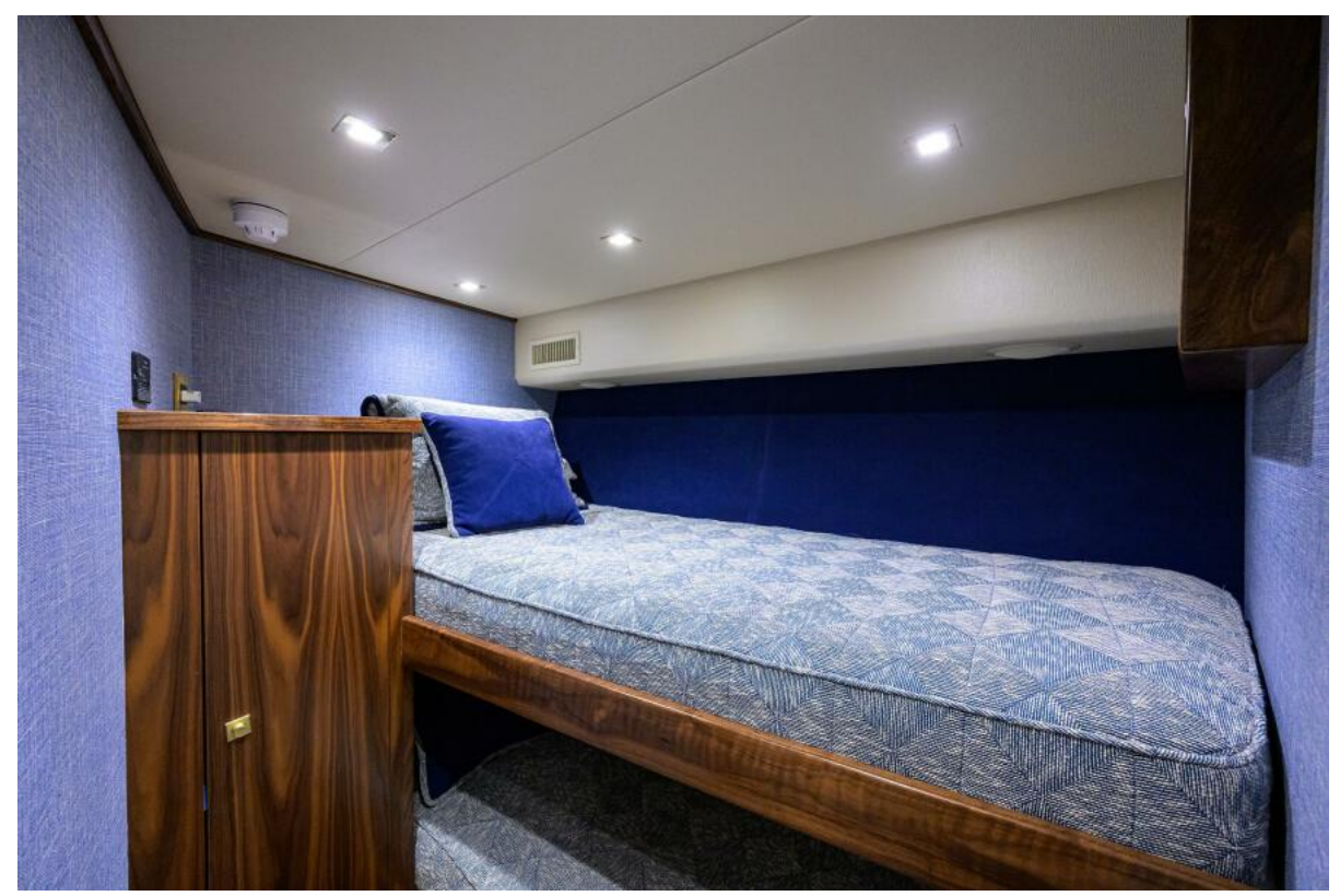
Forward Starboard Stateroom