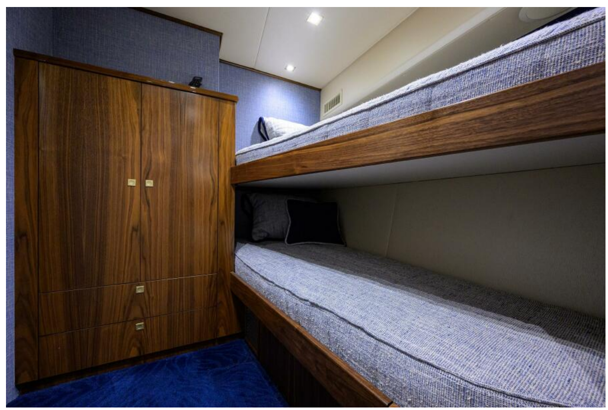
Mid Starboard Stateroom