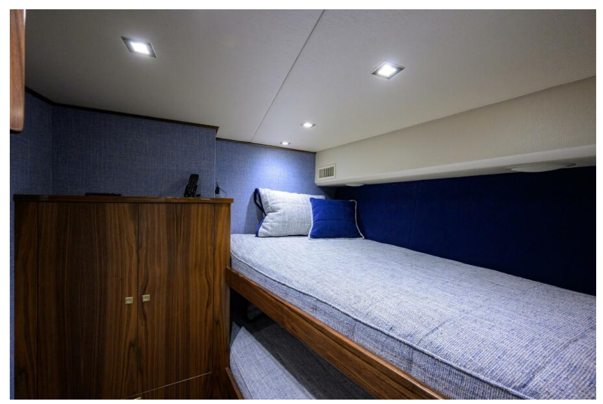
Mid Starboard Stateroom