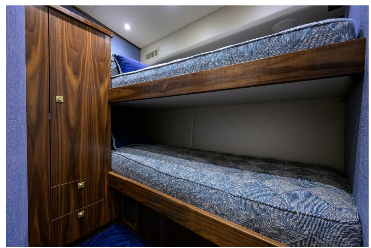
Forward Starboard Stateroom