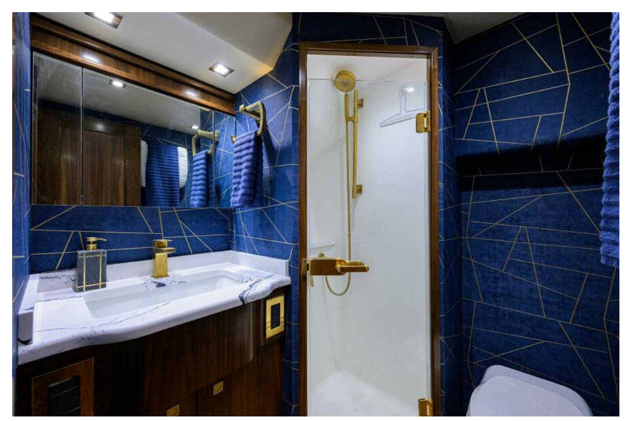
Mid Starboard Head