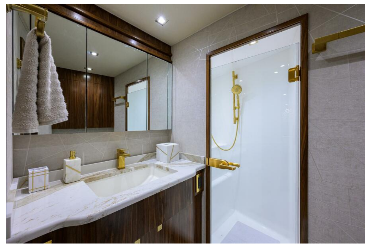
Port Guest Head