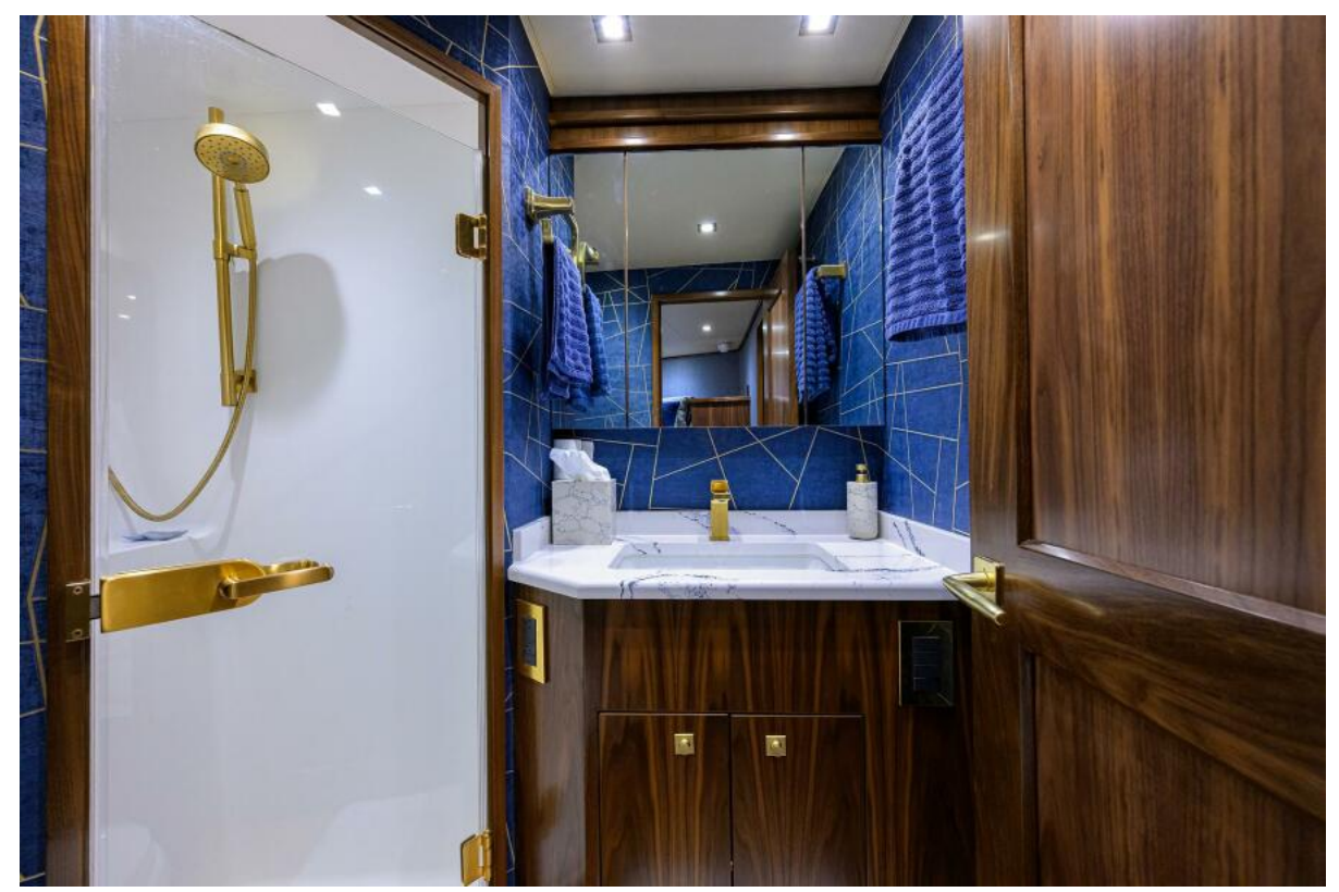
Forward Starboard Head