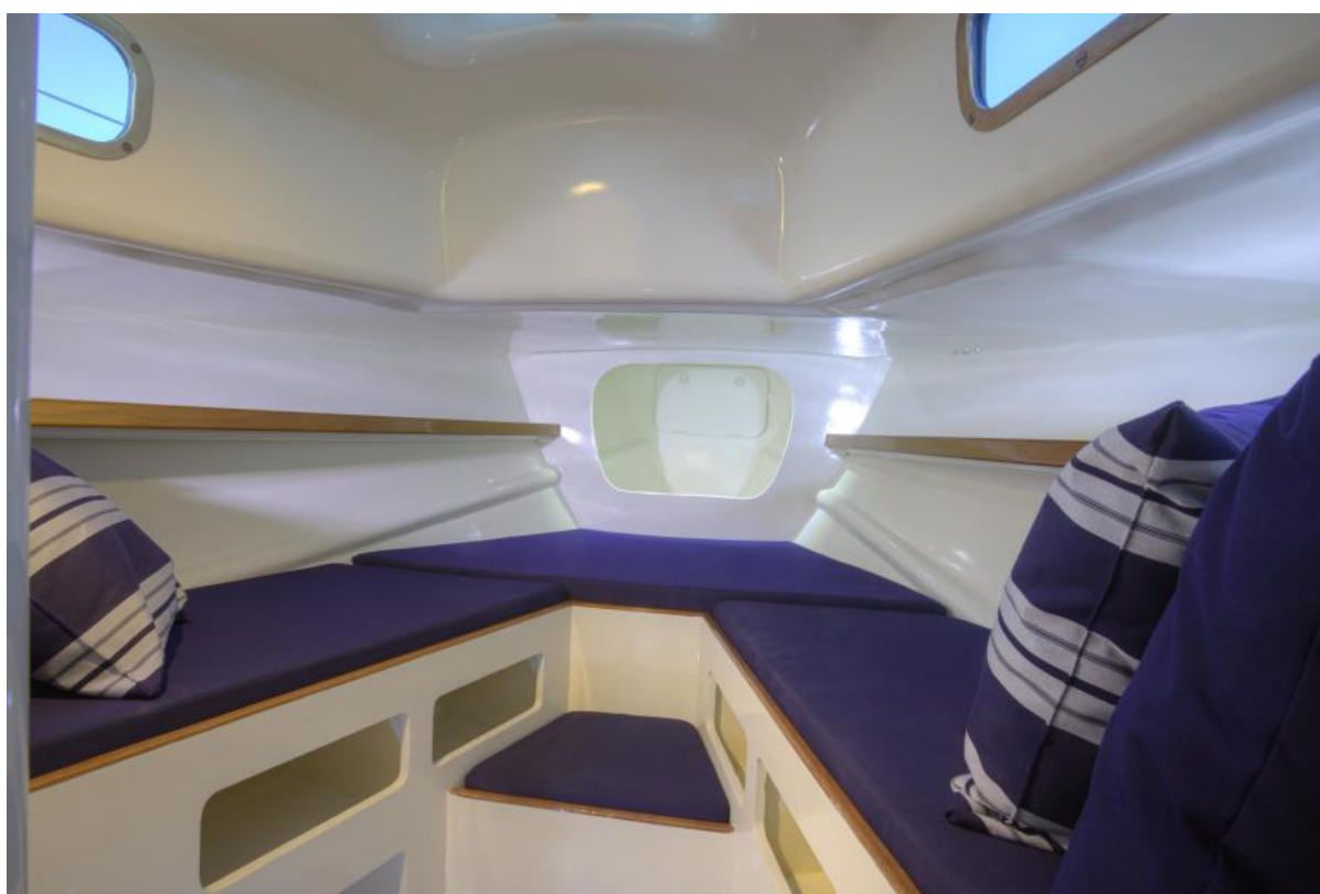
V-Berth 1960 Rhodes Bounty II Sloop "RANGER"