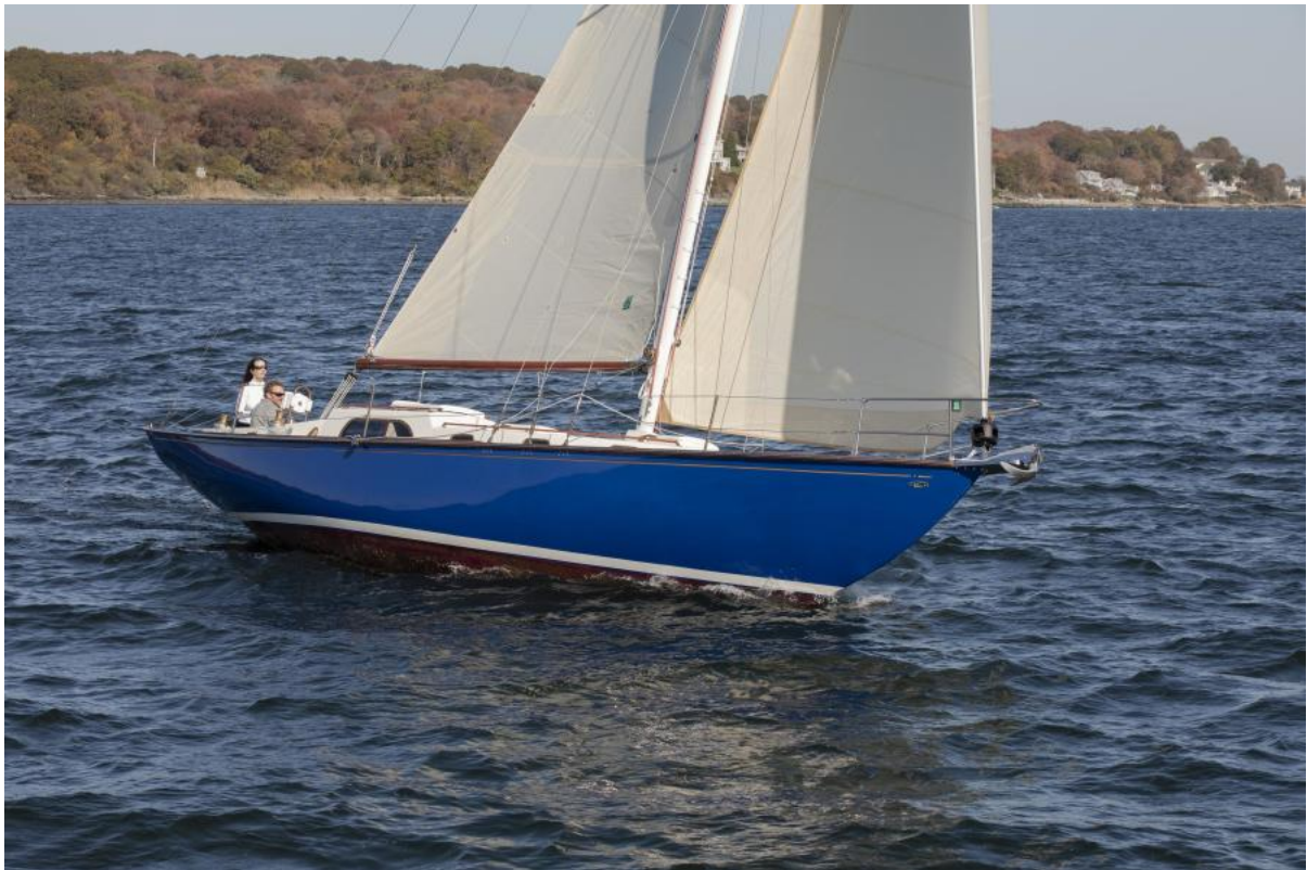
Starboardside 1960 Rhodes Bounty II Sloop "RANGER"