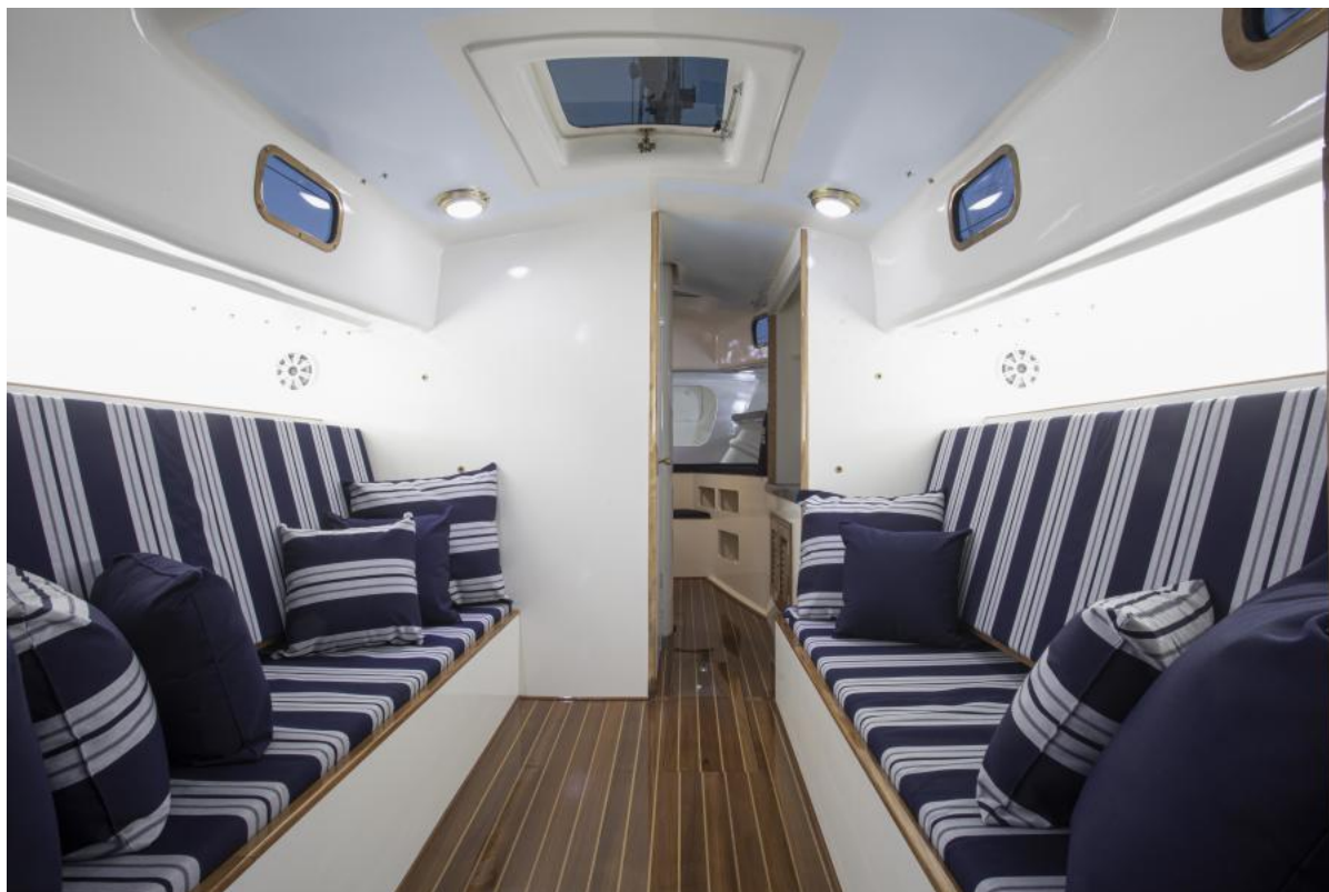
Sette's 1960 Rhodes Bounty II Sloop "RANGER"