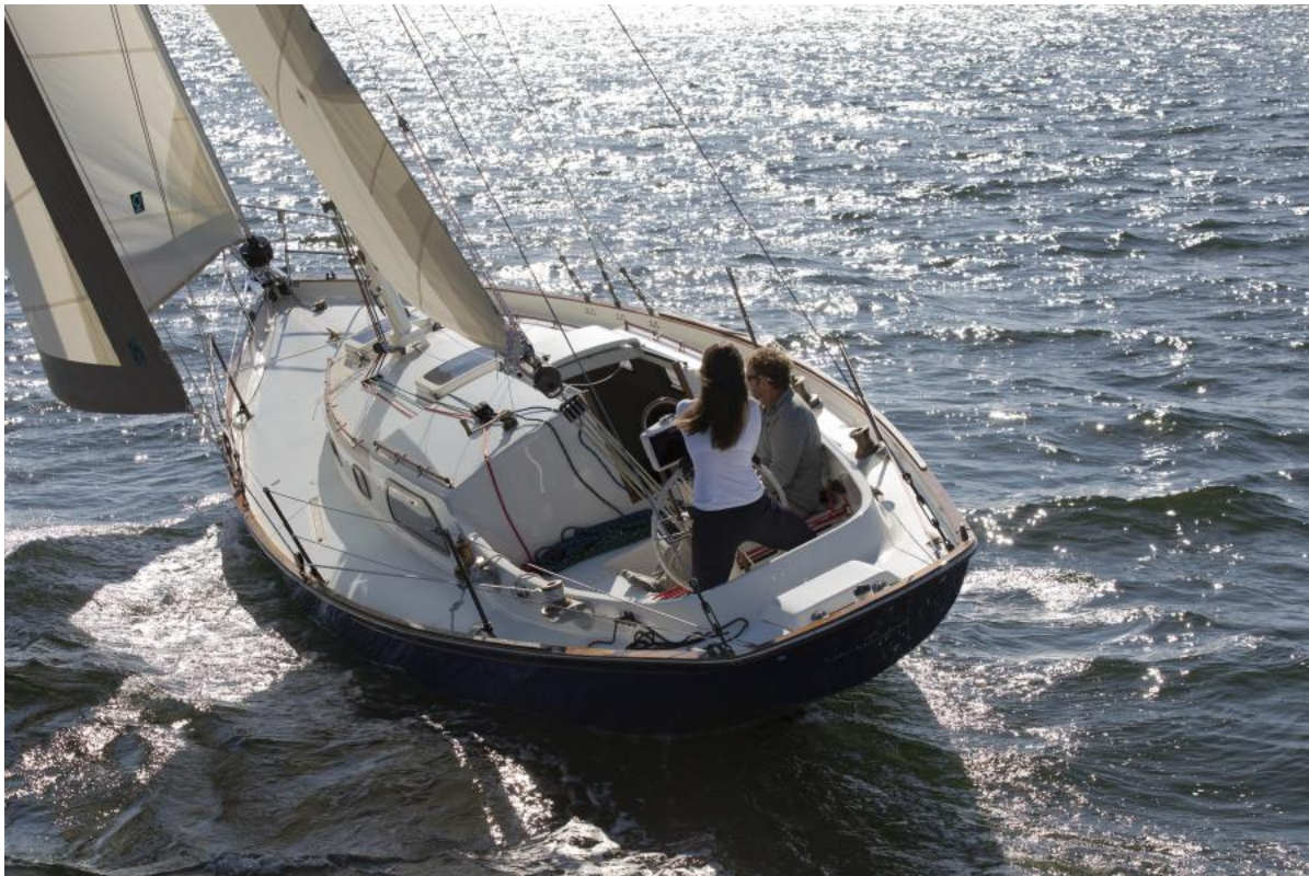
Transom Overview - Sailing 1960 Rhodes Bounty II Sloop "RANGER"