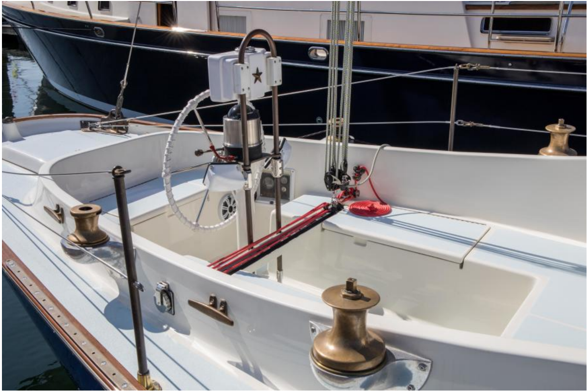
Cockpit view - At Dock 1960 Rhodes Bounty II Sloop "RANGER"