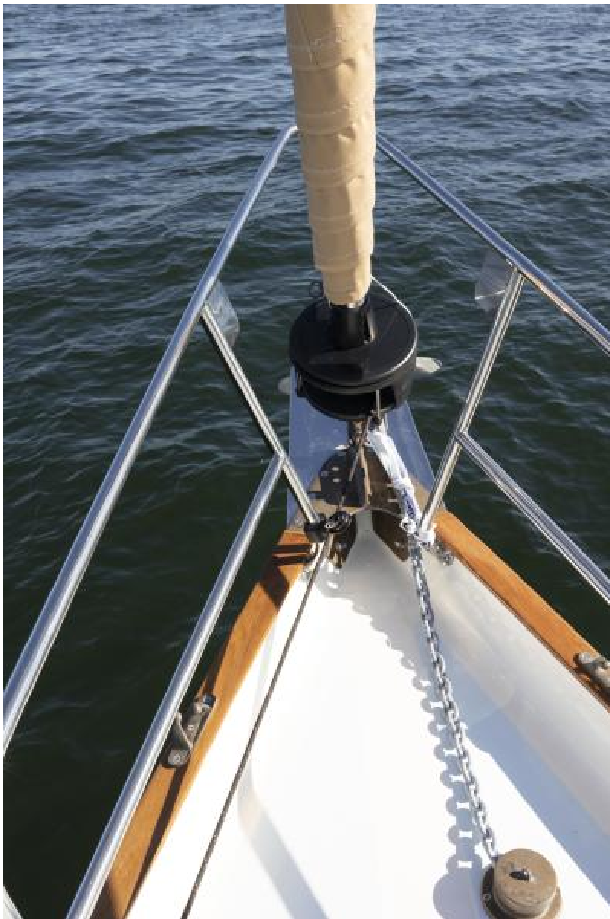
Bow 1960 Rhodes Bounty II Sloop "RANGER"