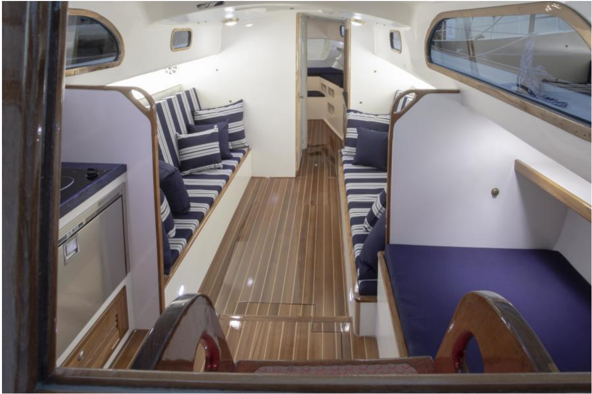
Cabin 1960 Rhodes Bounty II Sloop "RANGER"