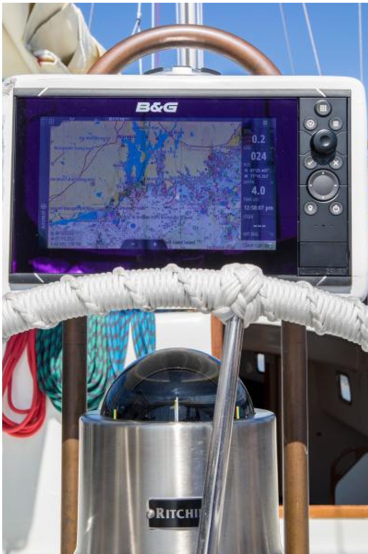
Helm - Close Up 1960 Rhodes Bounty II Sloop "RANGER"