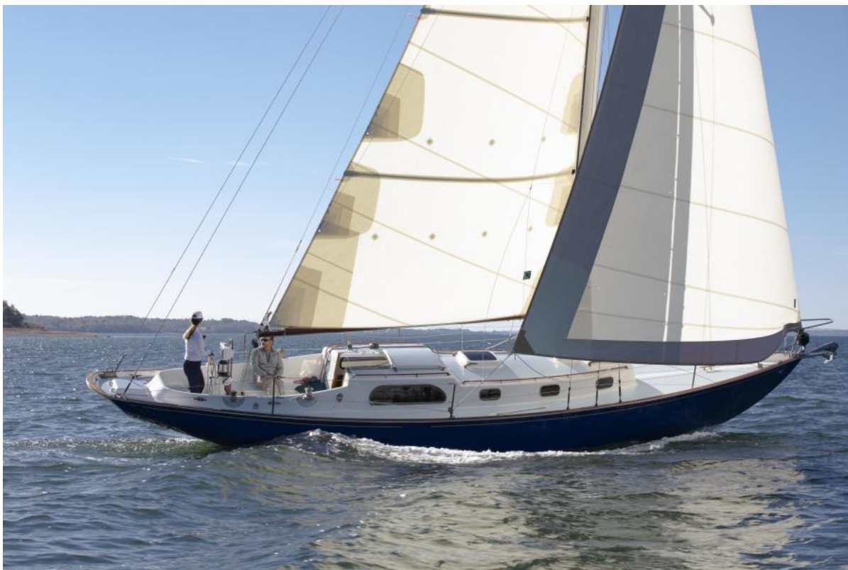
Starboard side - Alternate 1960 Rhodes Bounty II Sloop "RANGER"