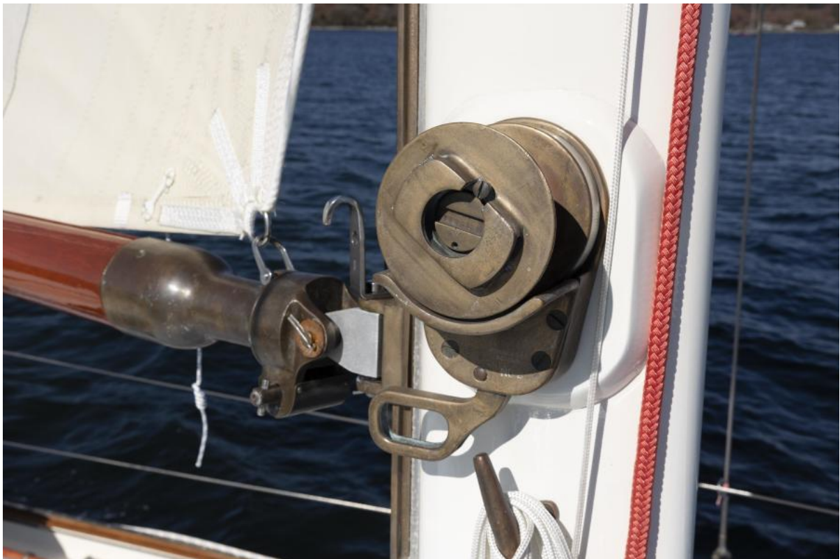
Mast Detail 1960 Rhodes Bounty II Sloop "RANGER"