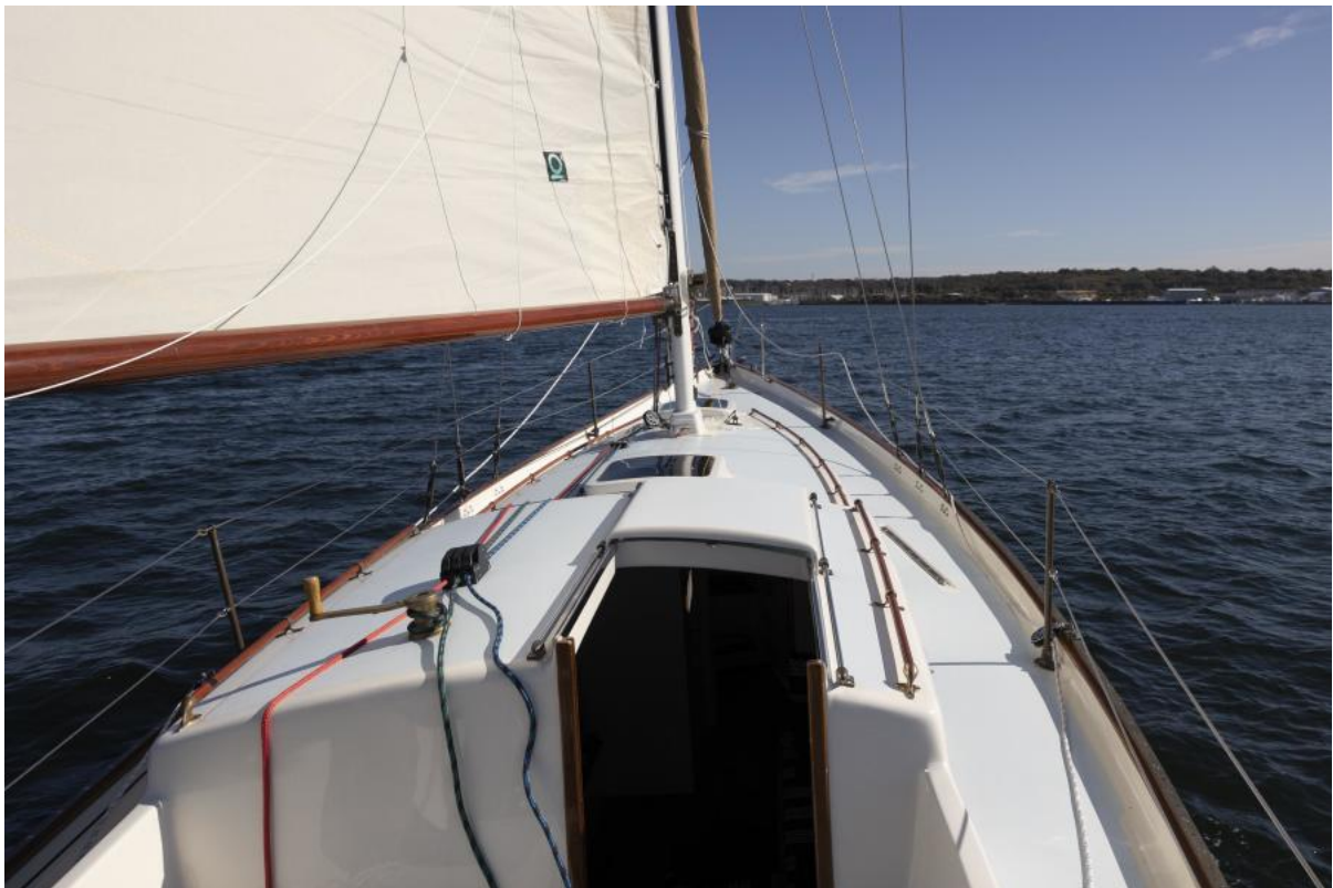
Cockpit view - Functioning 1960 Rhodes Bounty II Sloop "RANGER"