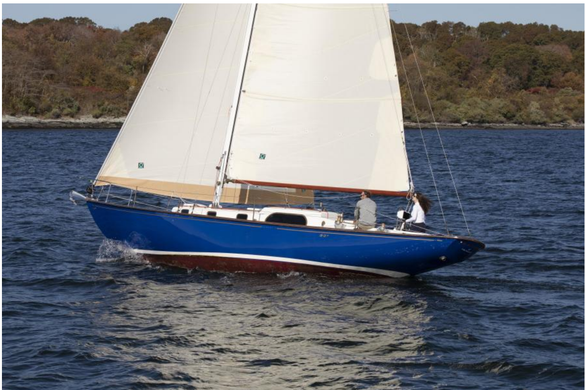
Portside 1960 Rhodes Bounty II Sloop "RANGER"