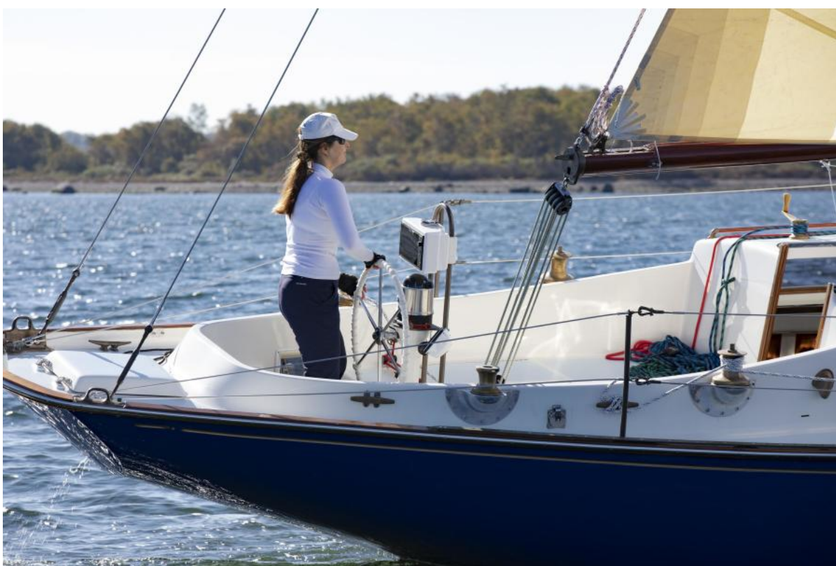
Starboard Aft Quarter - Sailing 1960 Rhodes Bounty II Sloop "RANGER"