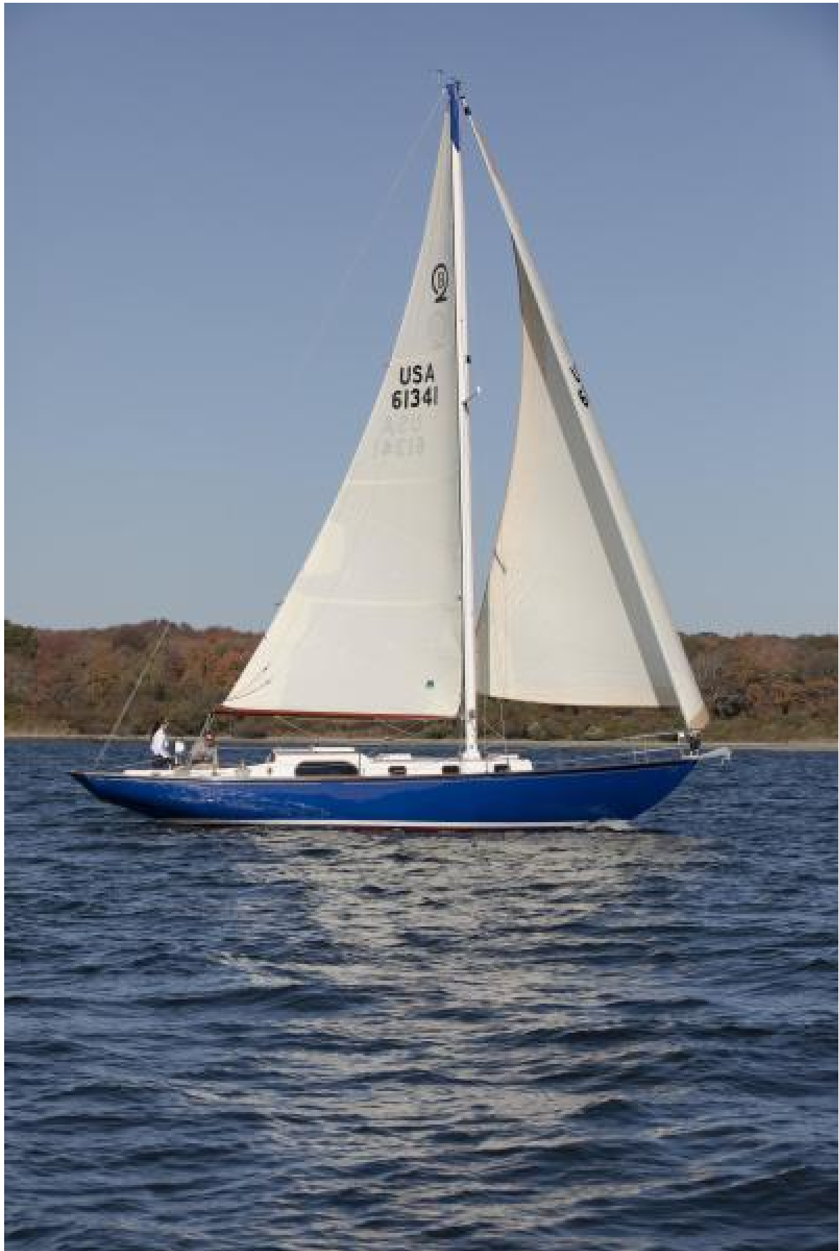
Profile 1960 Rhodes Bounty II Sloop "RANGER"