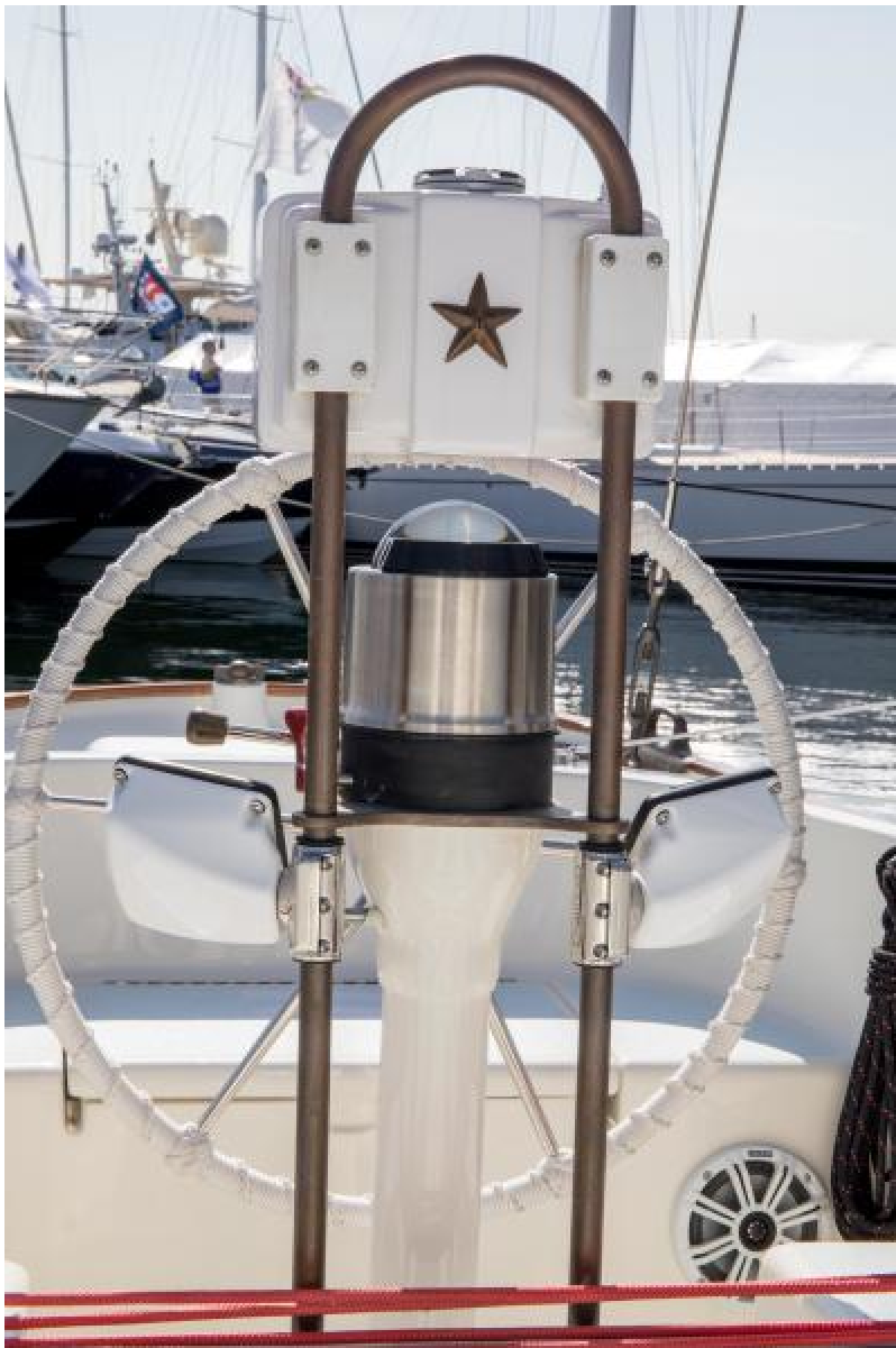
Steering Pedestal 1960 Rhodes Bounty II Sloop "RANGER"