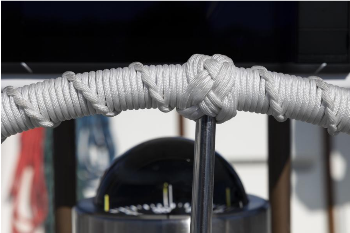
Wheel Detail 1960 Rhodes Bounty II Sloop "RANGER"