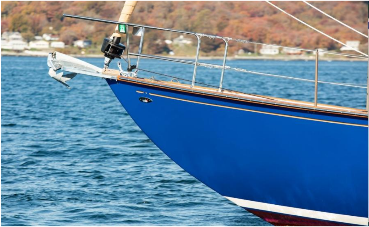
Bow - Close Up 1960 Rhodes Bounty II Sloop "RANGER"