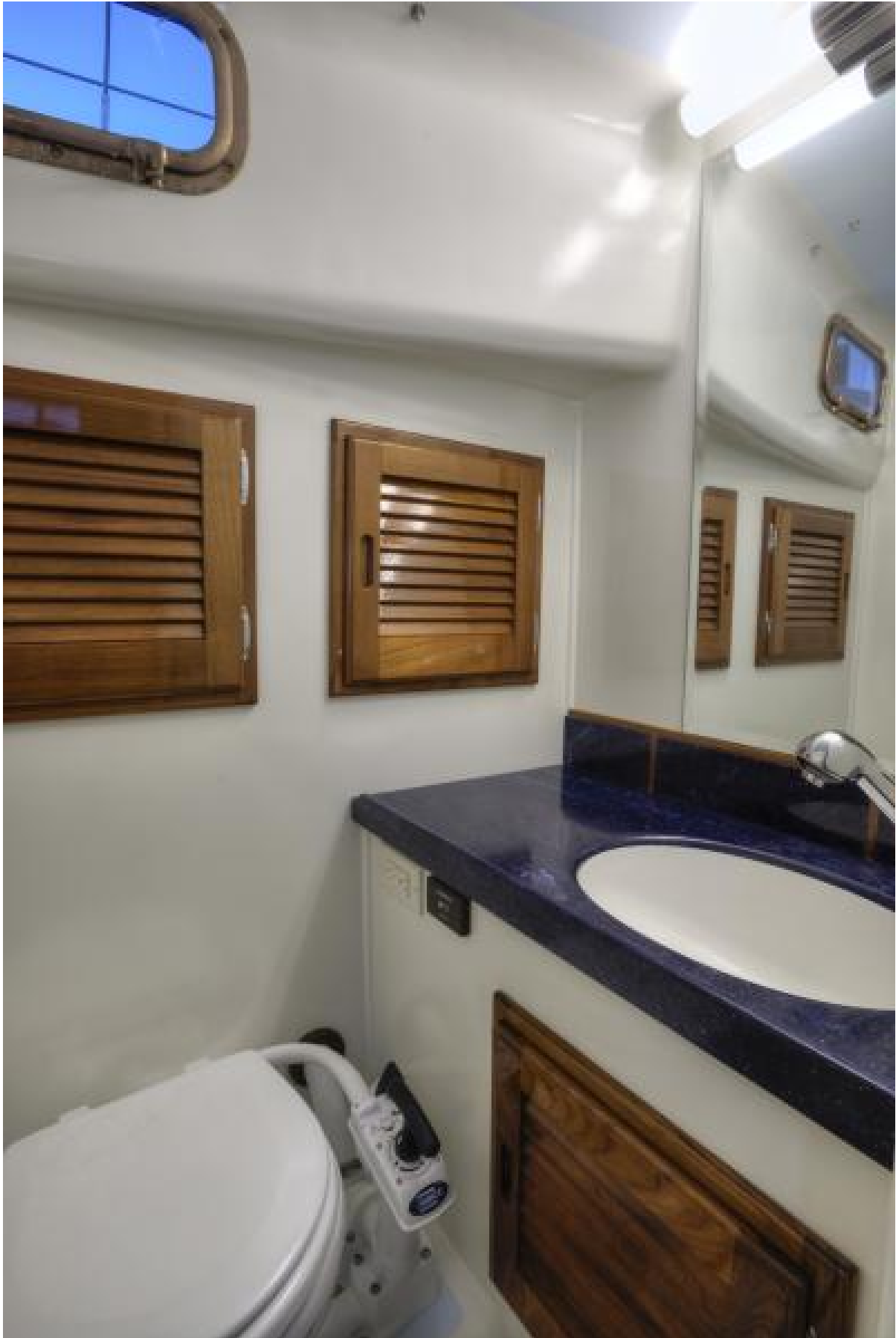
Head 1960 Rhodes Bounty II Sloop "RANGER"