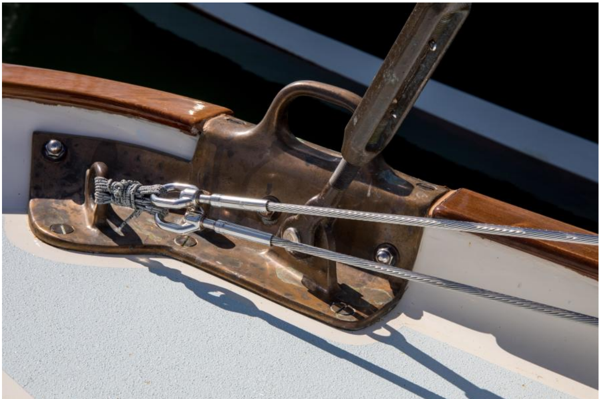
Lifeline Detail 1960 Rhodes Bounty II Sloop "RANGER"