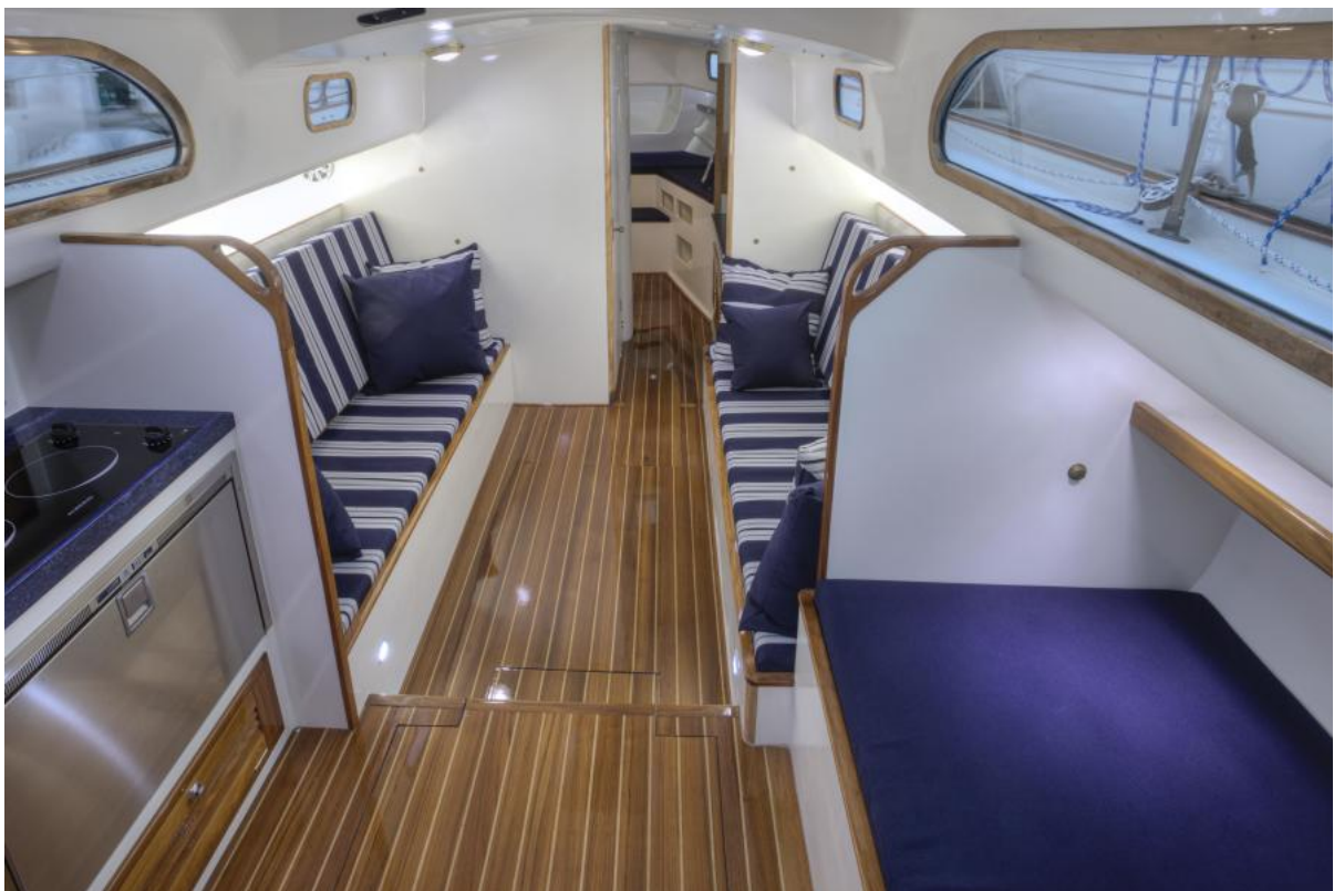
Cabin - Alternate 1960 Rhodes Bounty II Sloop "RANGER"