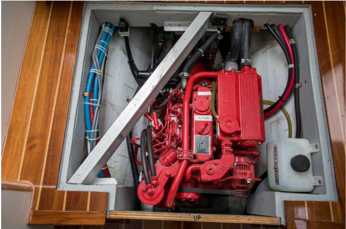
25HP Beta Diesel Engine 1960 Rhodes Bounty II Sloop "RANGER"