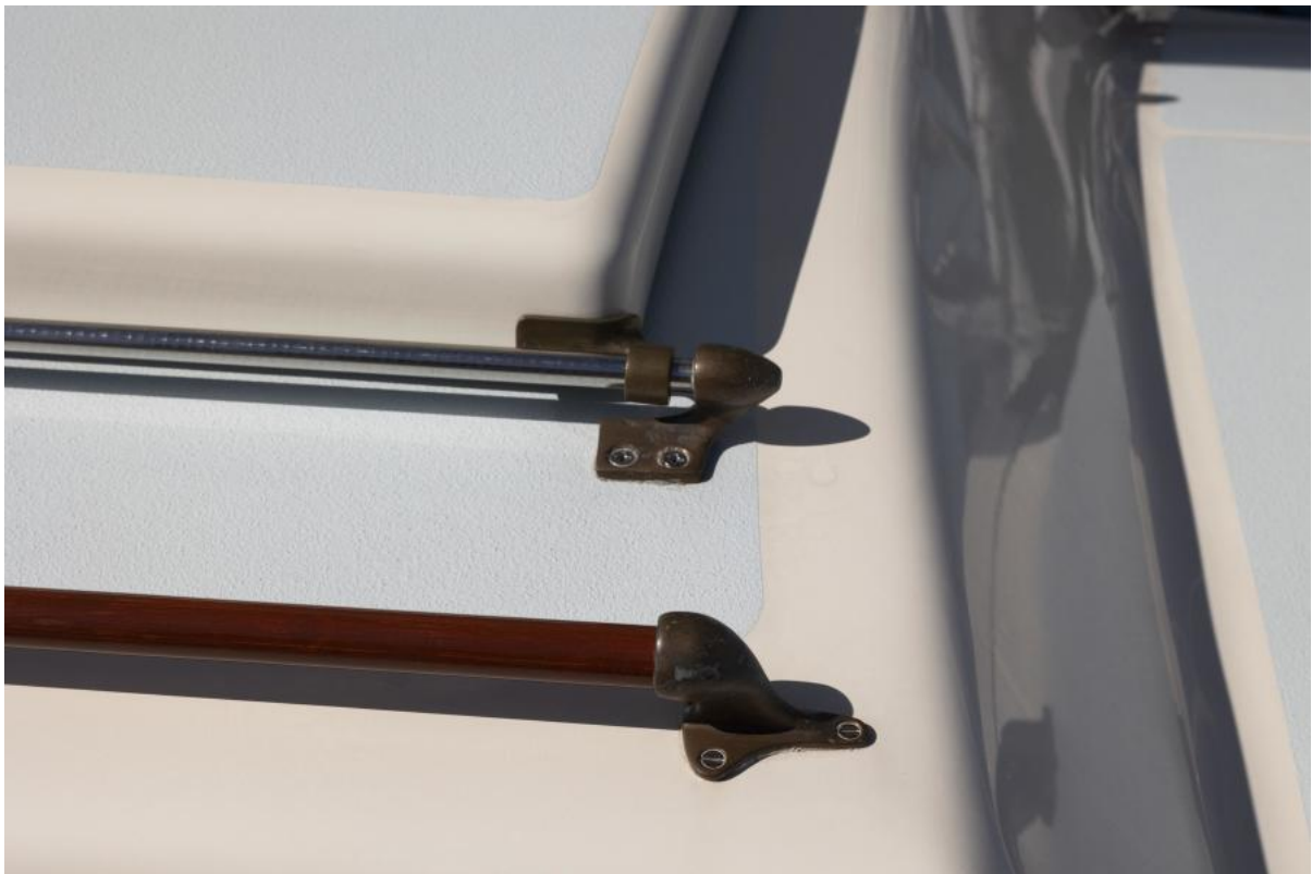
Deck Detail 1960 Rhodes Bounty II Sloop "RANGER"