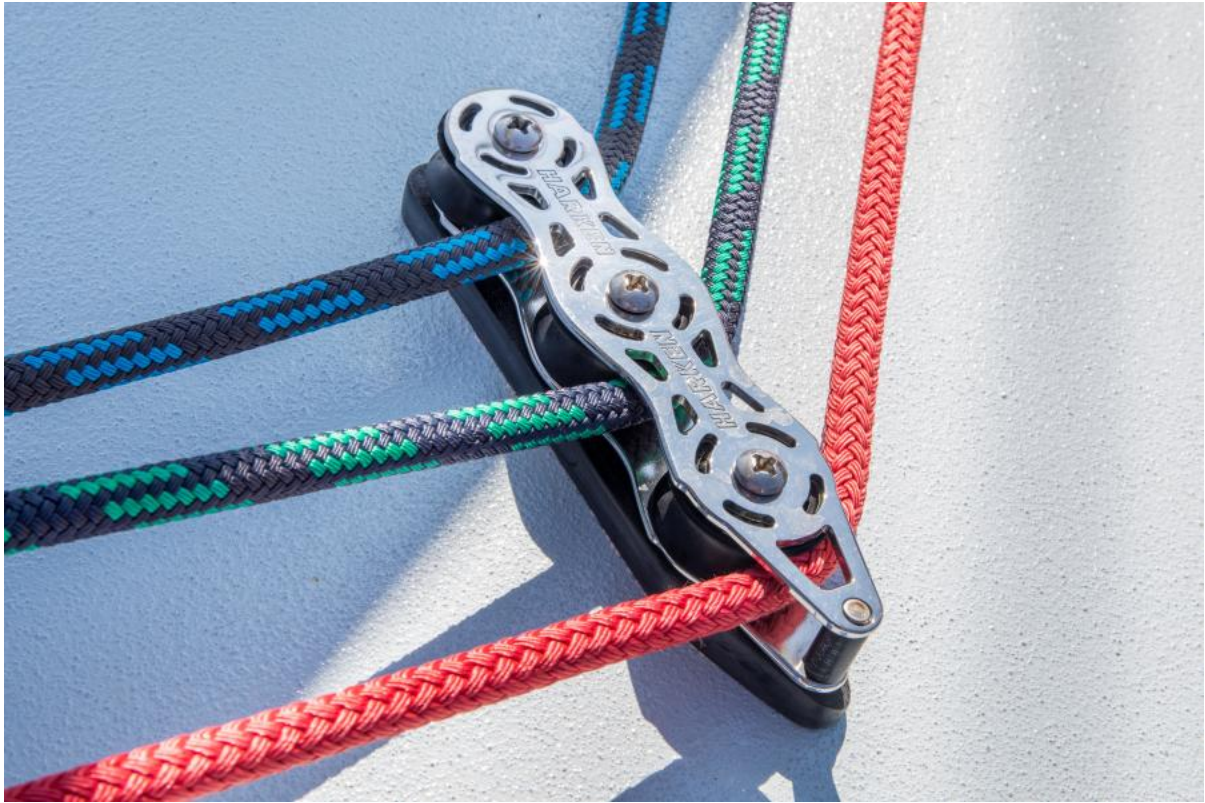
Fairleads 1960 Rhodes Bounty II Sloop "RANGER"