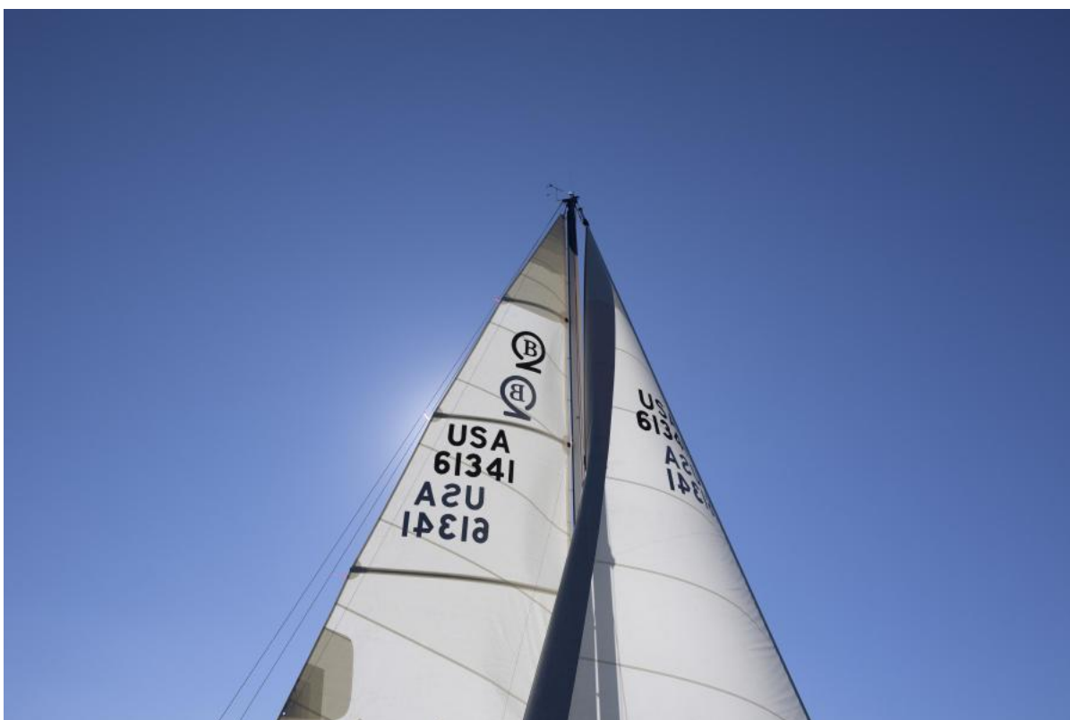
Masthead 1960 Rhodes Bounty II Sloop "RANGER"