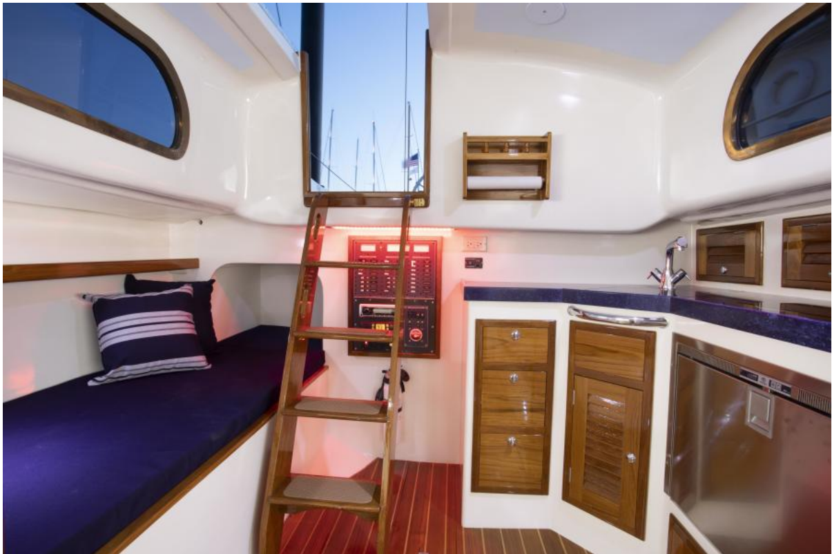
Galley - Alternate 1960 Rhodes Bounty II Sloop "RANGER"