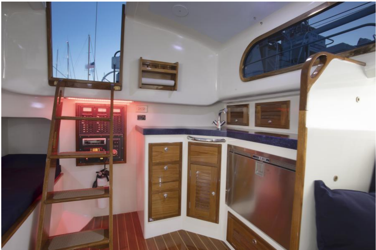
Galley 1960 Rhodes Bounty II Sloop "RANGER"