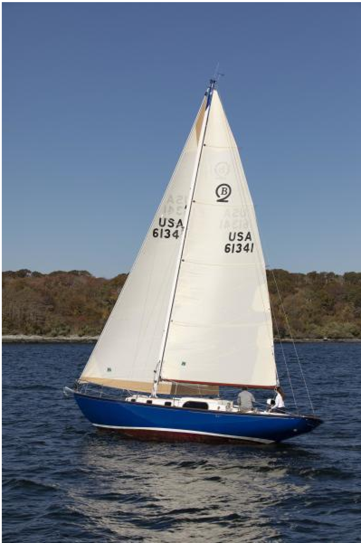
Full Rig 1960 Rhodes Bounty II Sloop "RANGER"