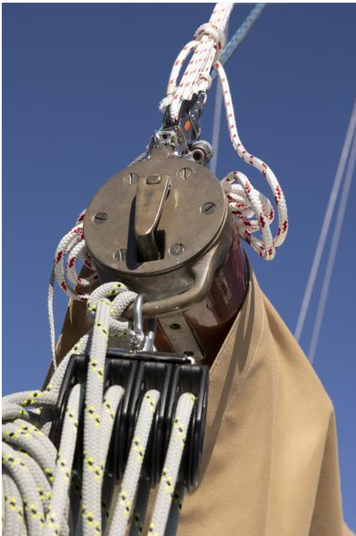
Boom Detail 1960 Rhodes Bounty II Sloop "RANGER"