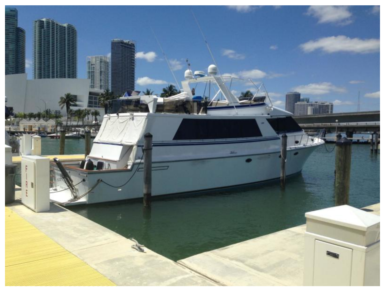
Blue Nova Blue Nova