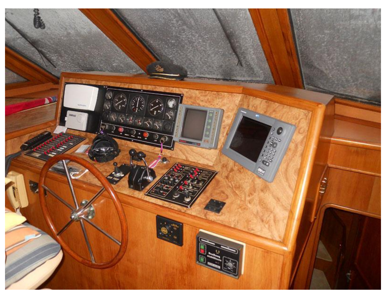
Pilothouse Helm Pilothouse Helm