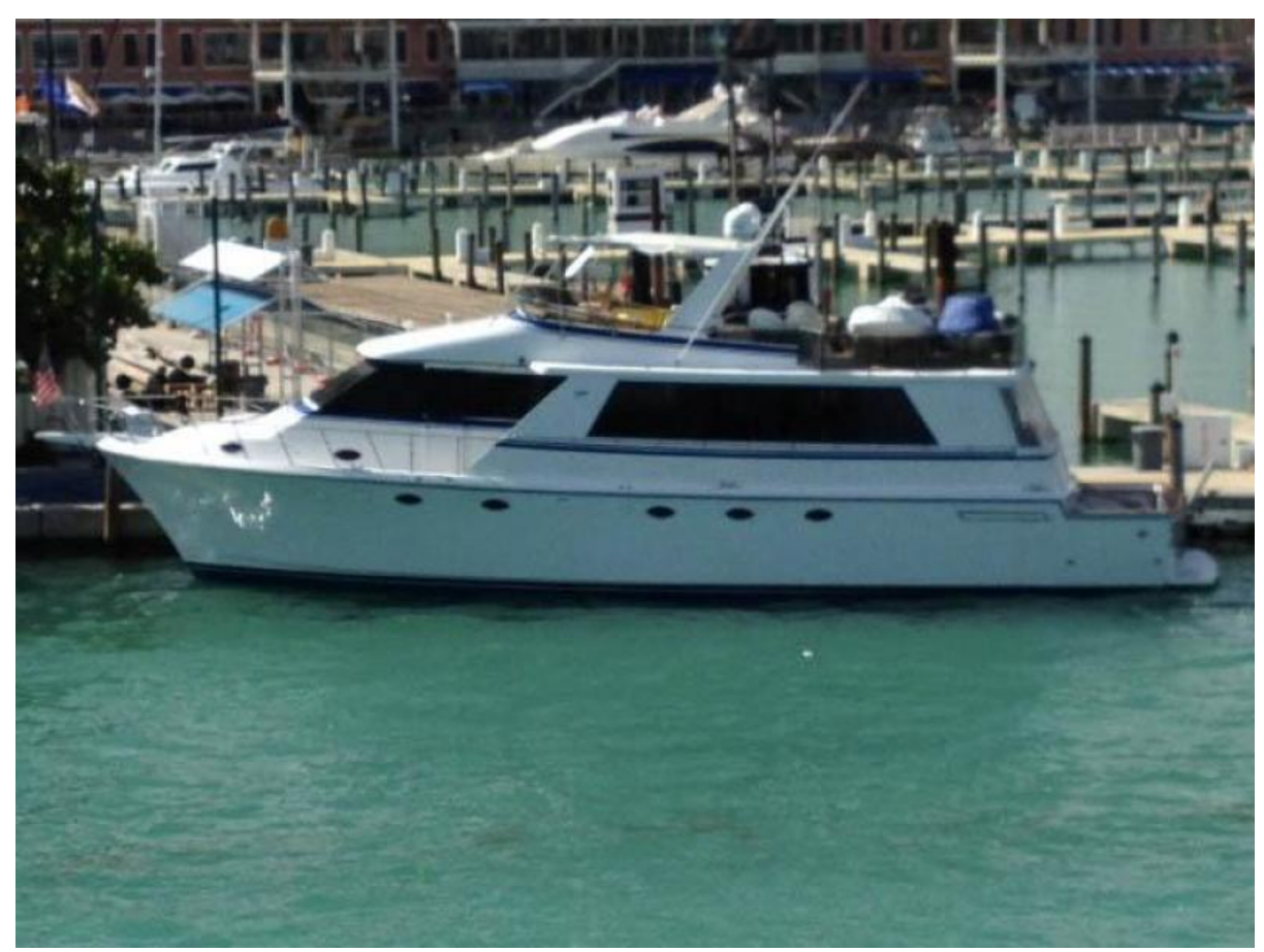
BLUE NOVA BLUE NOVA