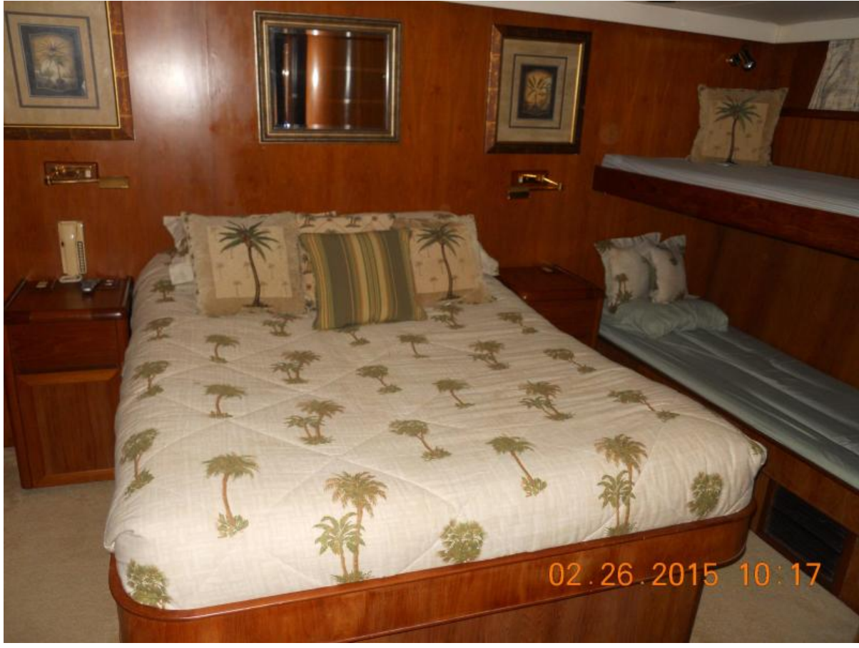
Master Stateroom Master Stateroom