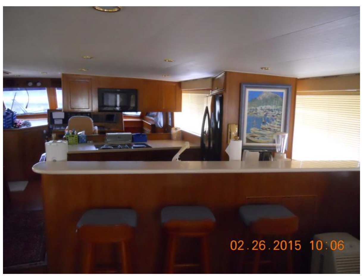
Breakfast Stools Breakfast Stools