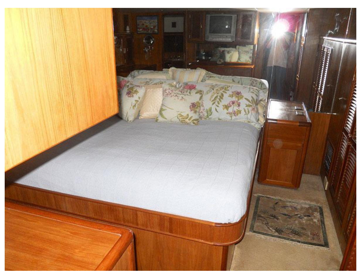
VIP Stateroom VIP Stateroom