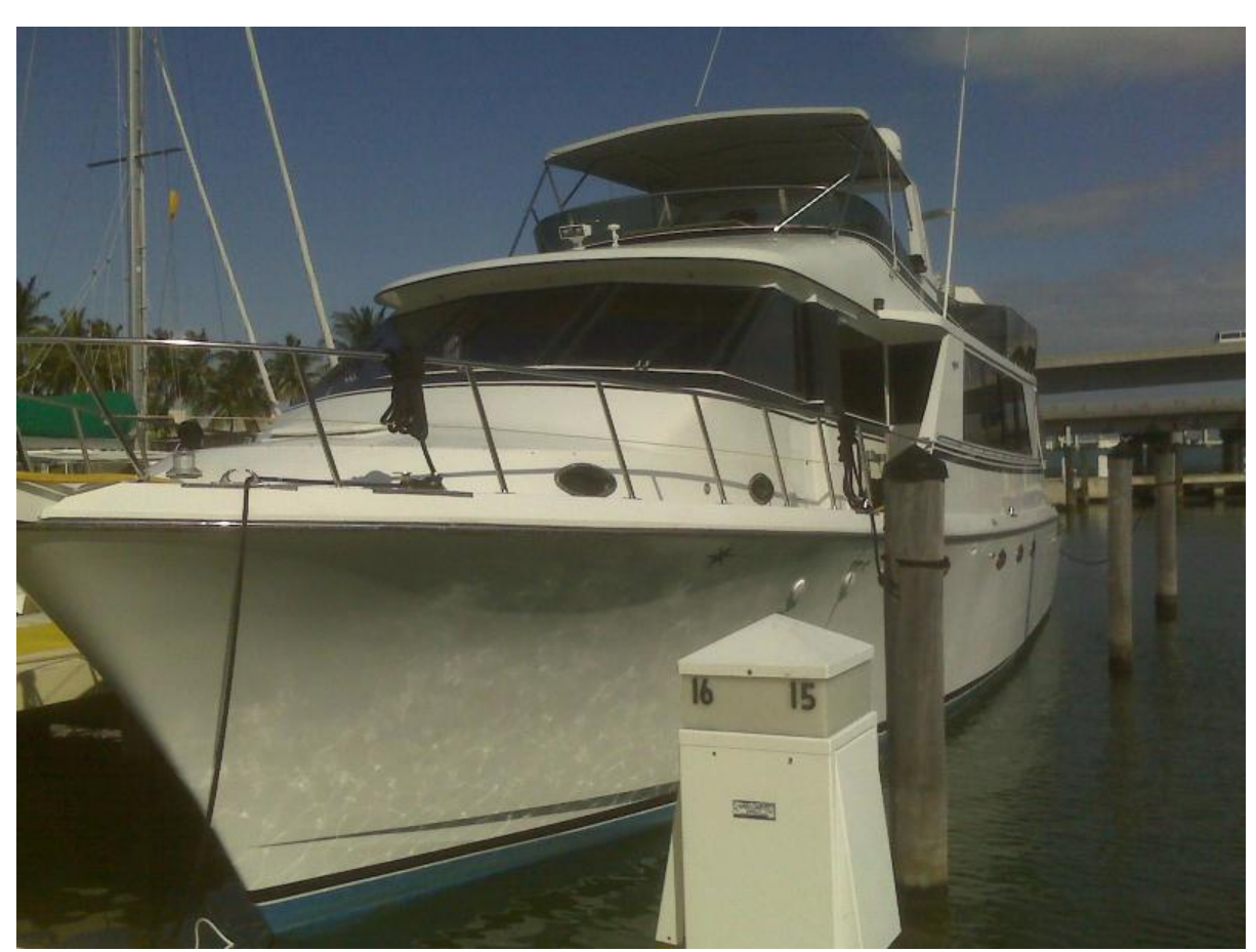
Blue Nova Blue Nova