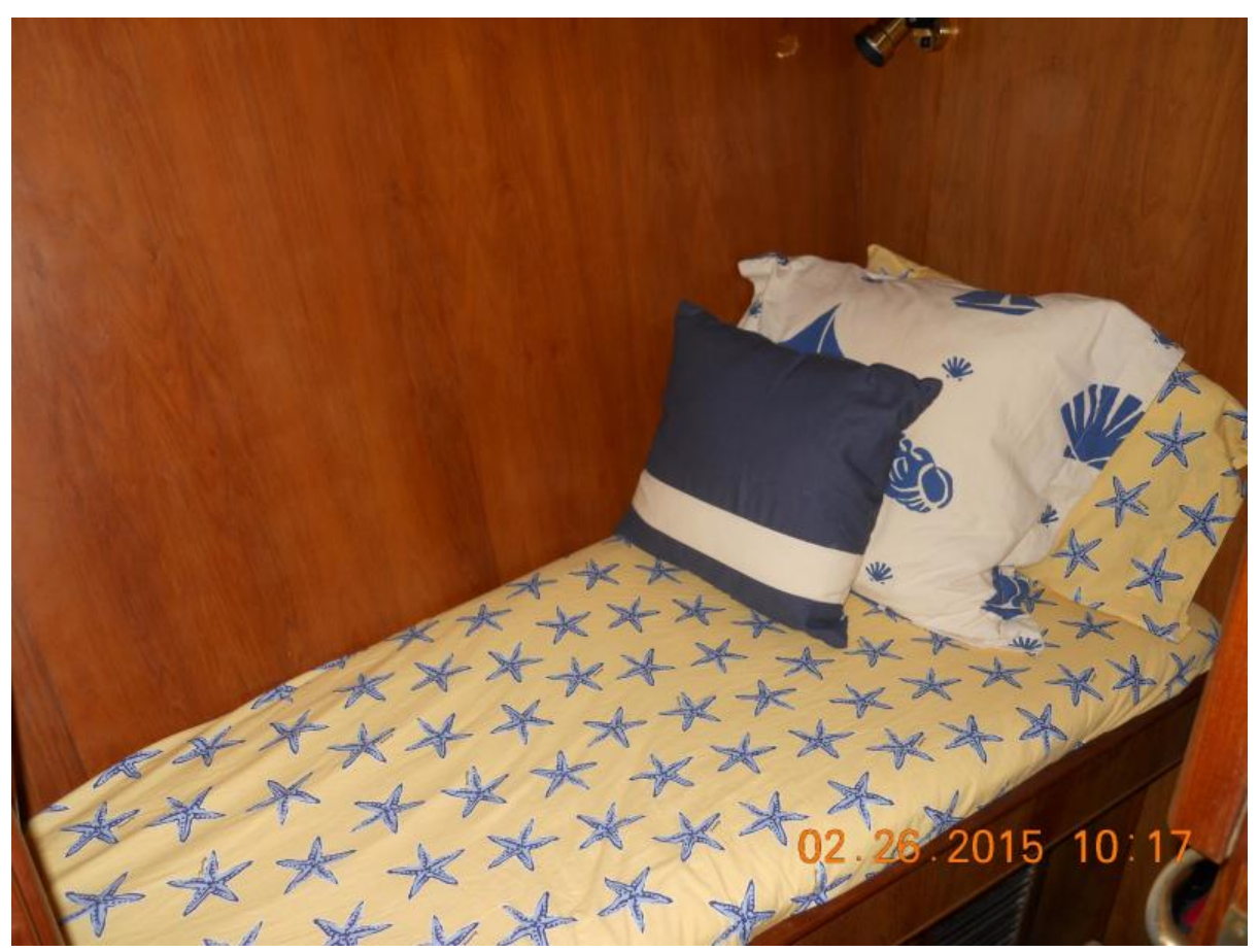
Crew Quarters Crew Quarters