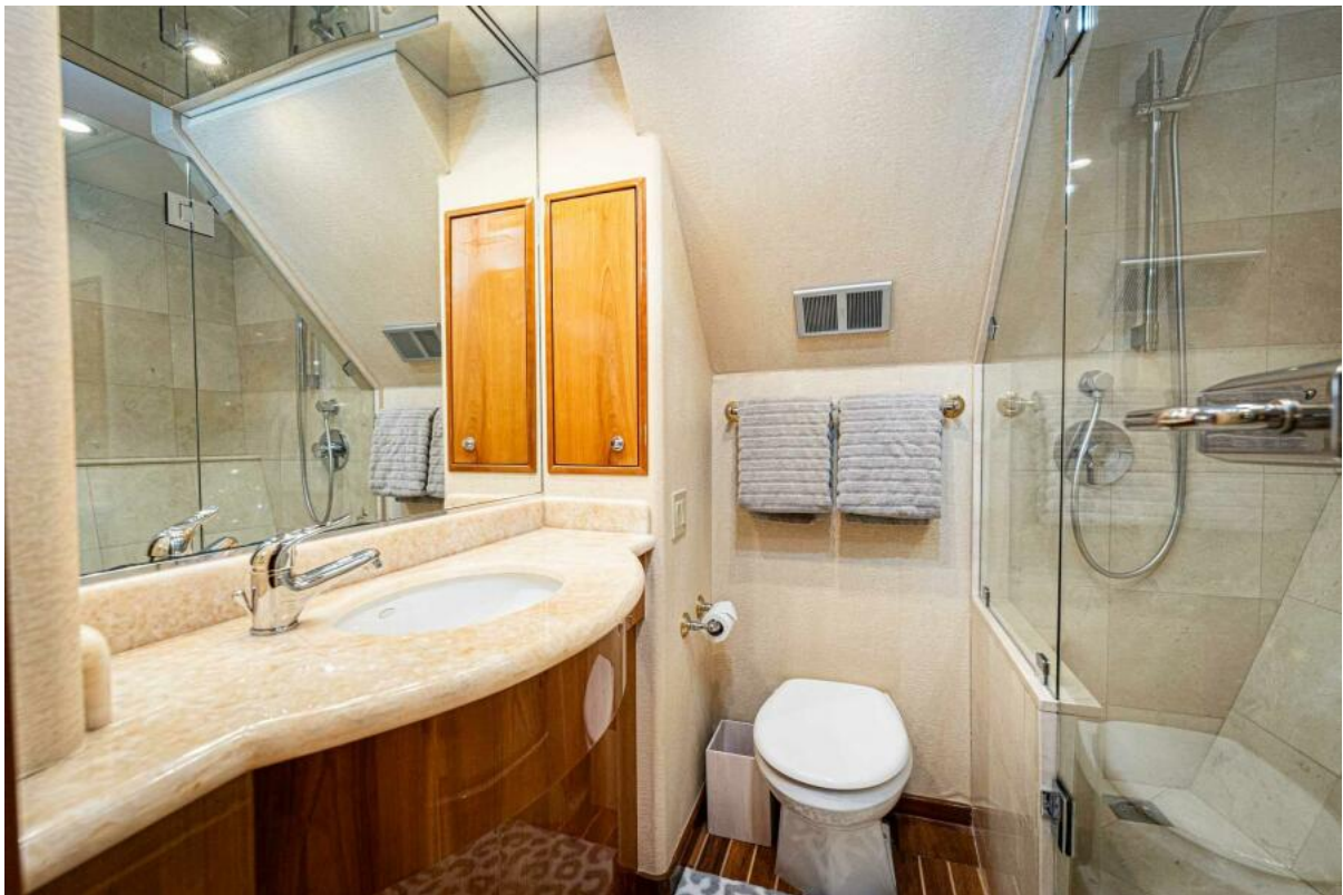
Owner's Ensuite Head