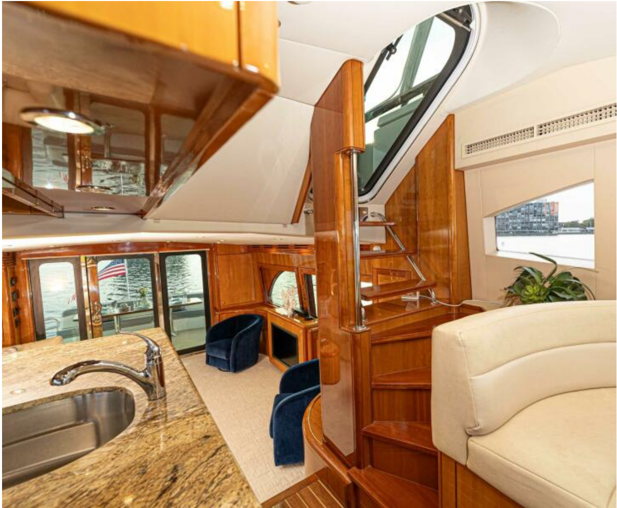
Galley and Dinette