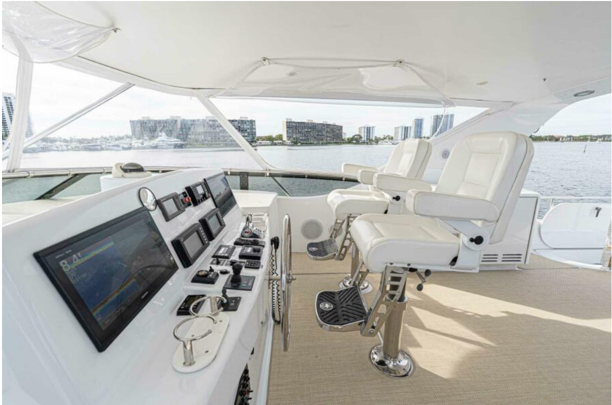
Flybridge Helm Station