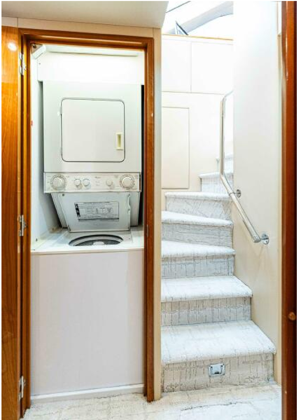
Washer and Dryer