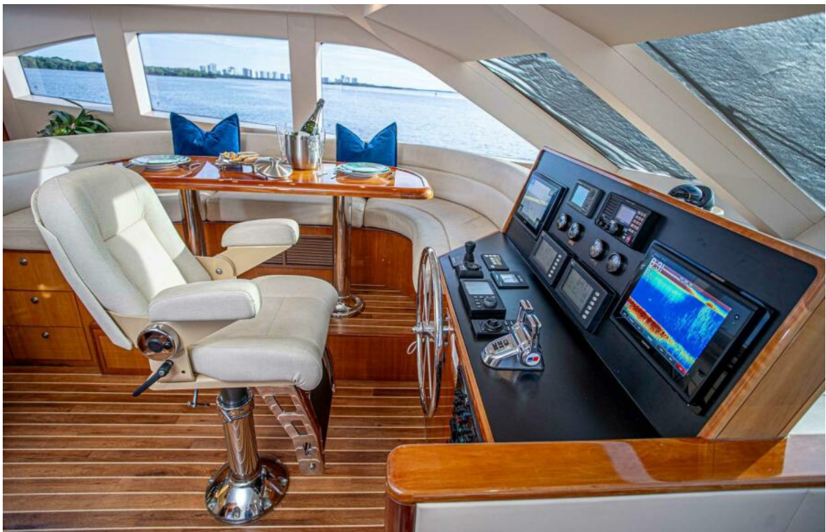
Lower Helm and Dinette