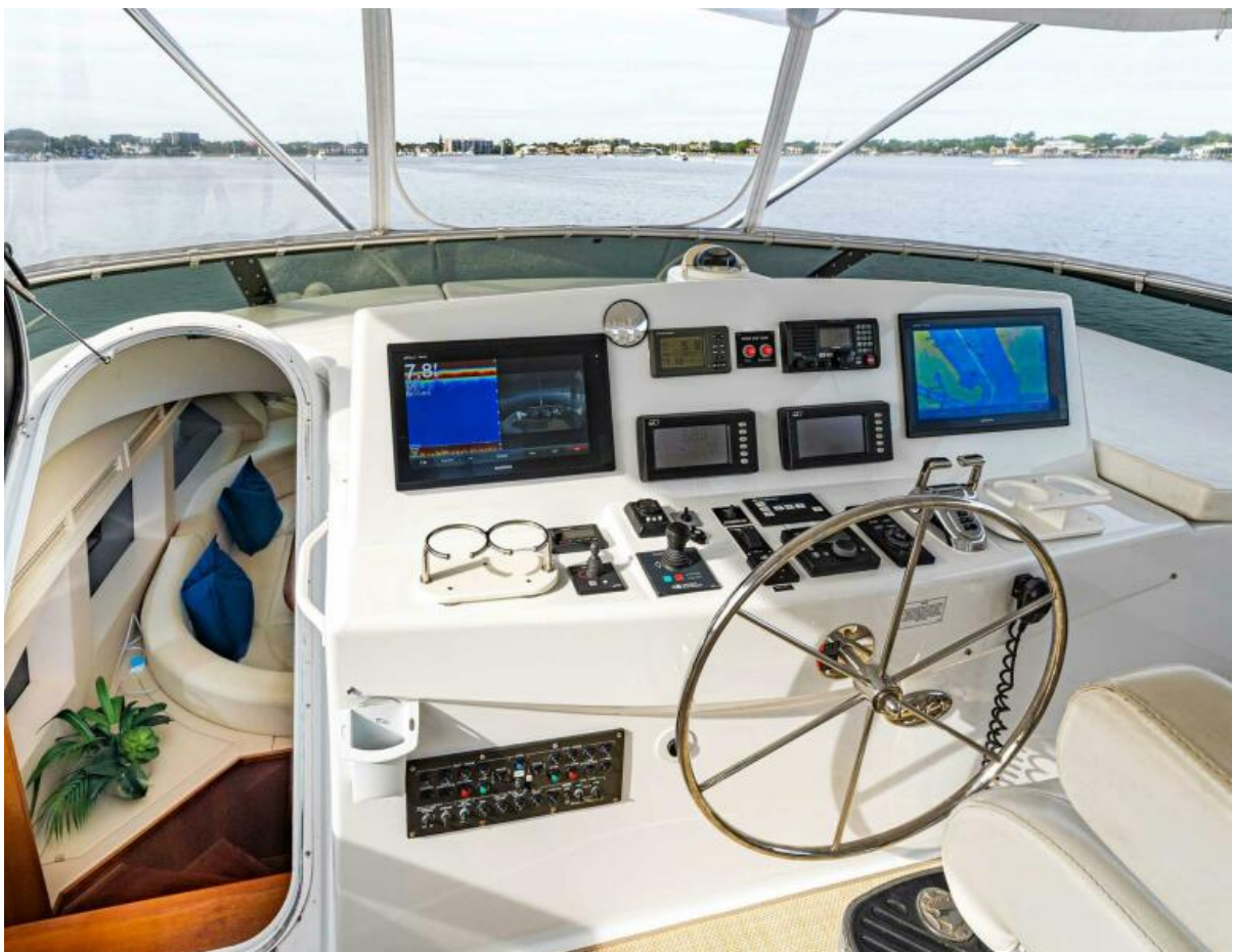
Flybridge Helm Station