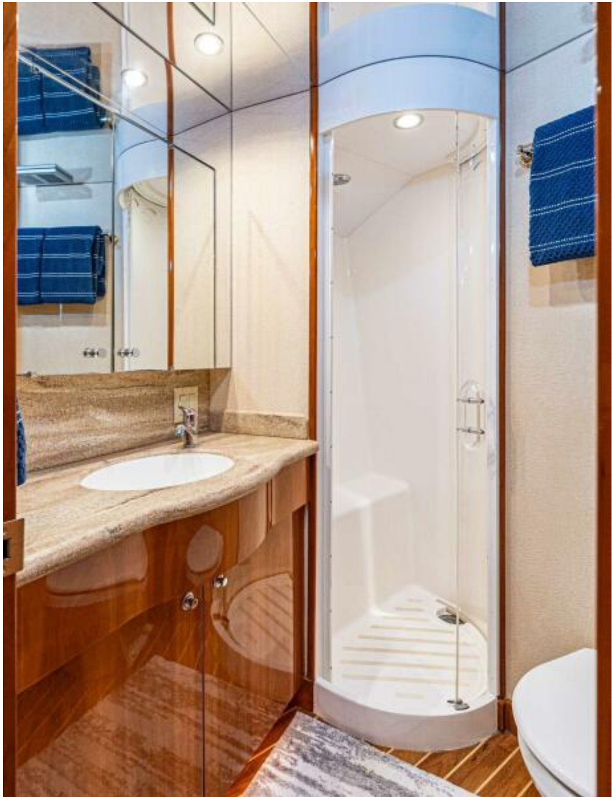
VIP Ensuite Head