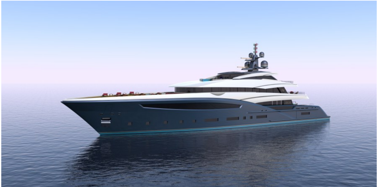
Port Bow Profile