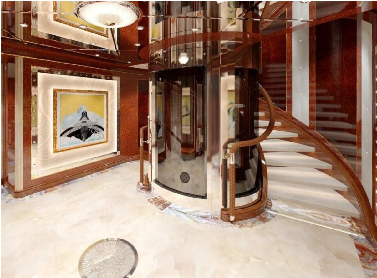
Main Deck Hall