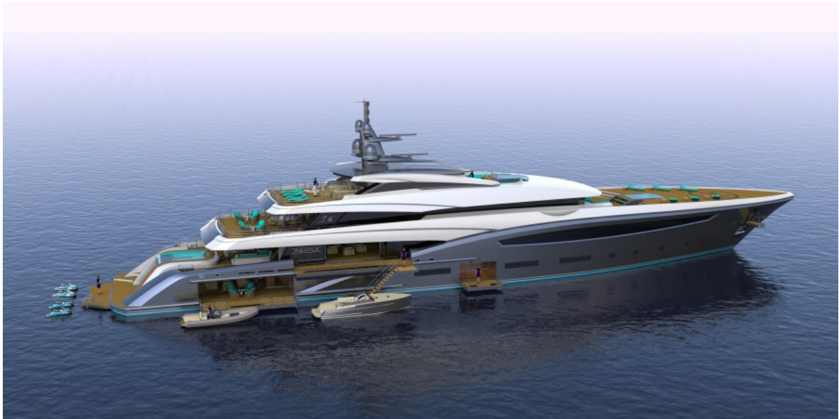
Starboard Profile - Beach Club