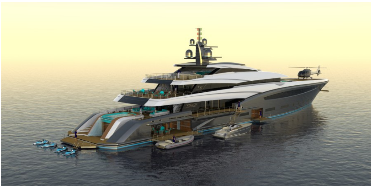
Starboard Profile - Tender and Toys