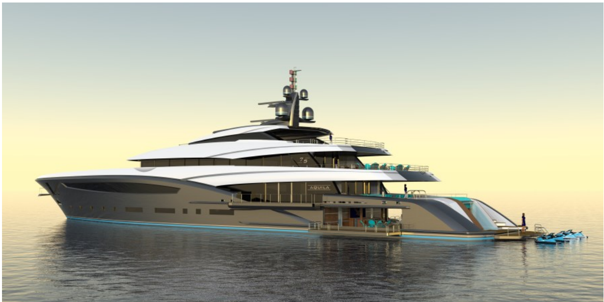
Port Profile - Beach Club