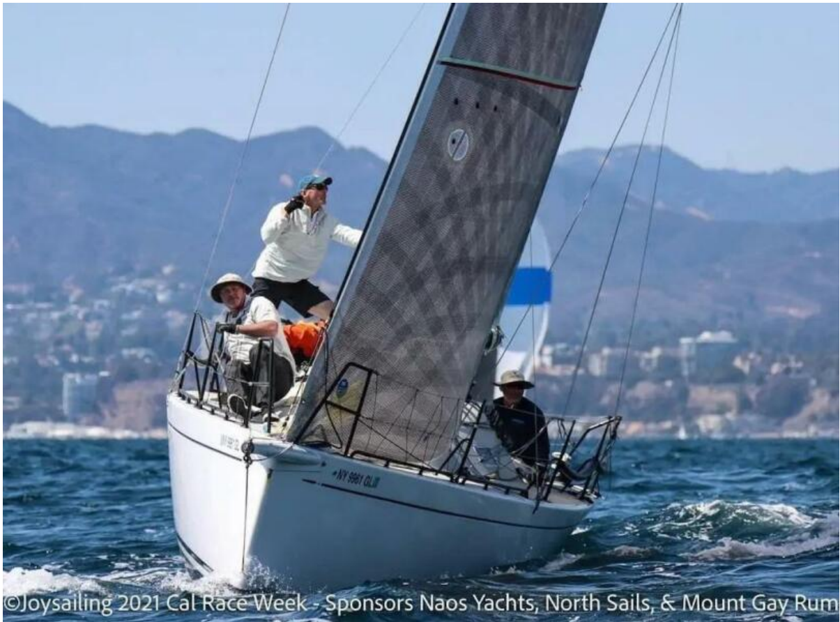
©Joysailing 2021 Cal Race Week - Sponsors Naos Yachts, North Sails, & Mount Gay Rum