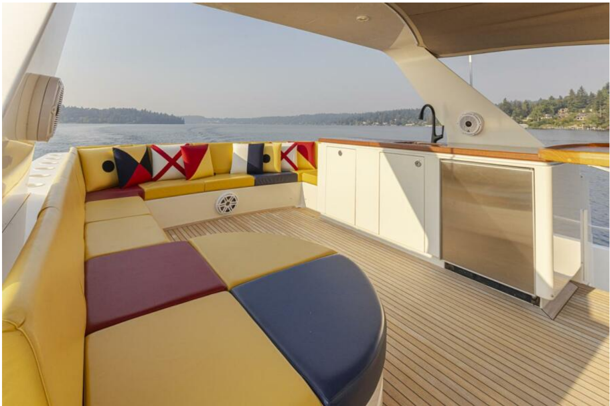
Aft Deck Aft Deck