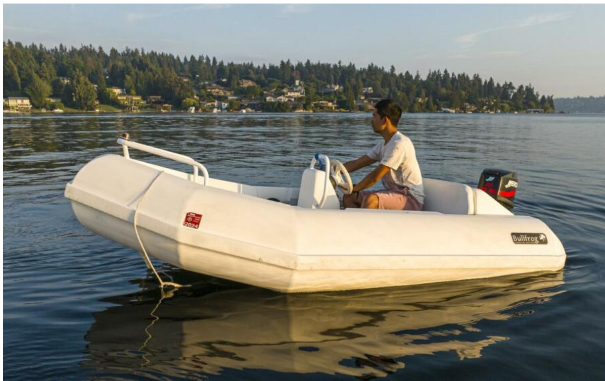
Tender Bullfrog Tender