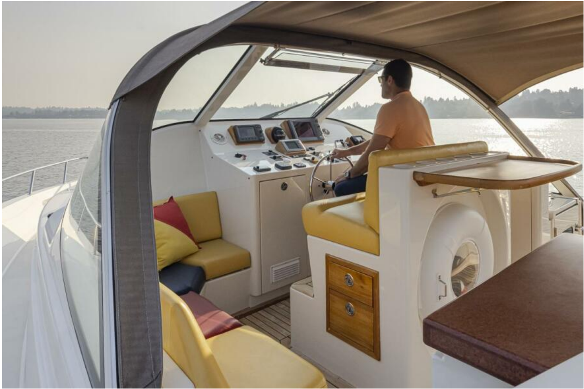
Helm Station Helm Station