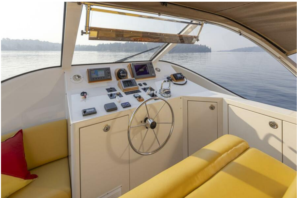
Helm Station Helm Station