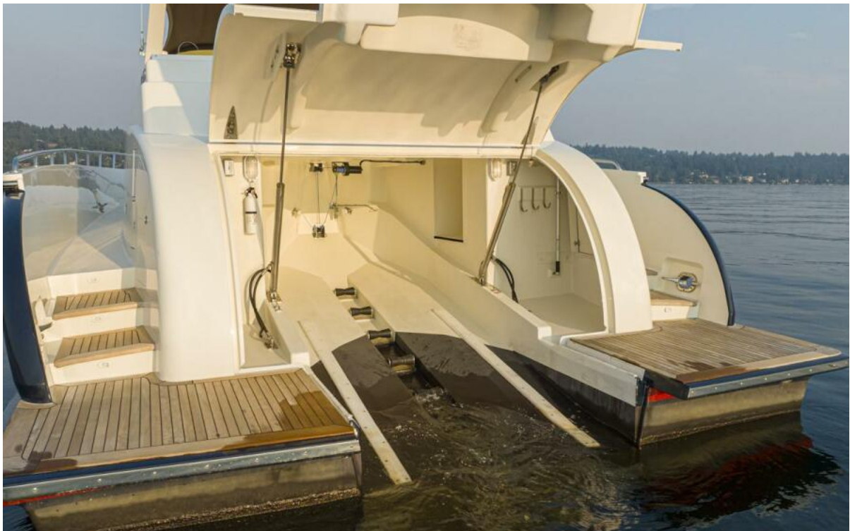
Profile Stern Tender Garage