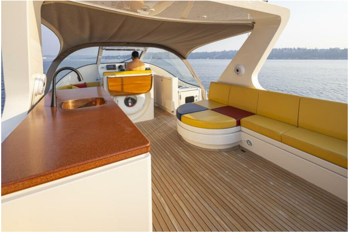
Aft Deck Aft Deck