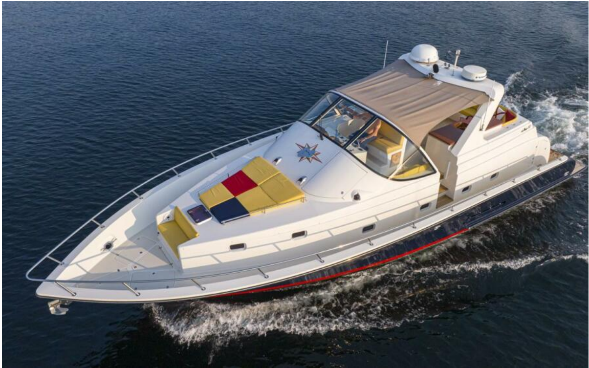
Profile Profile Bow Sunbed and Seating area