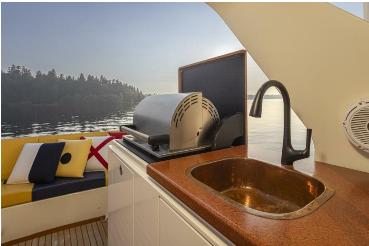
Aft Deck Wet Bar Aft Deck Wet Bar with BBQ Grill on Push Button High-Low Lift