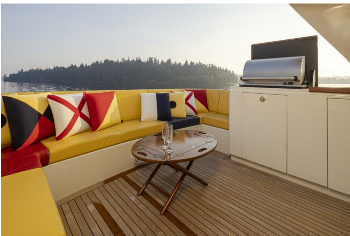
Aft Deck Aft Deck Seating with foldable table