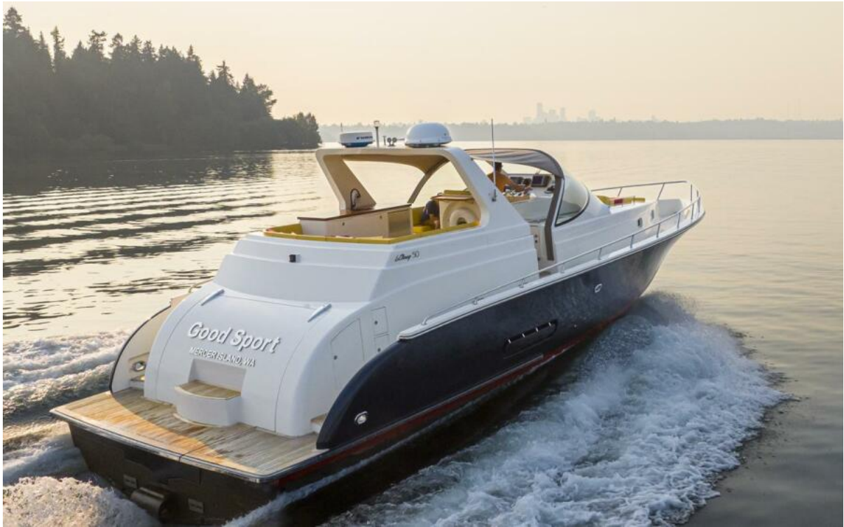
Profile Profile Stern