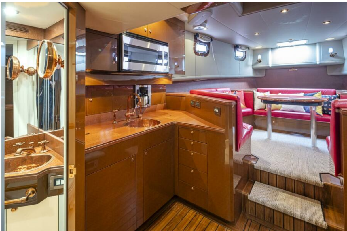
Lower Deck Lower Deck