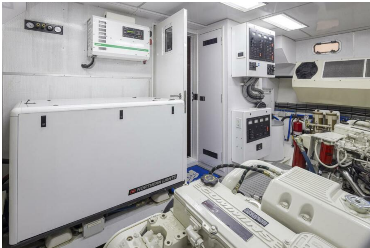
Engine Room Engine Room