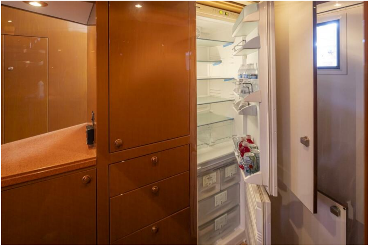
Galley Storage, refrigerator and freezer