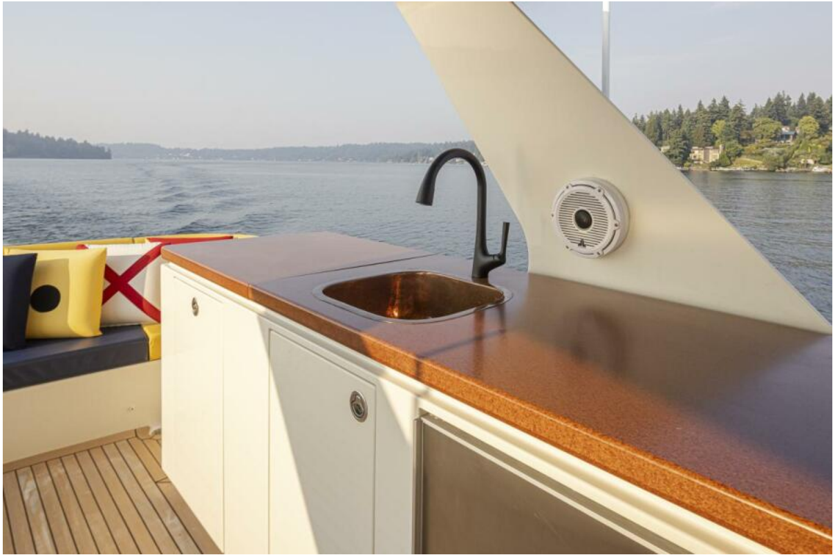
Aft Deck Wet Bar Aft Deck Wet Bar