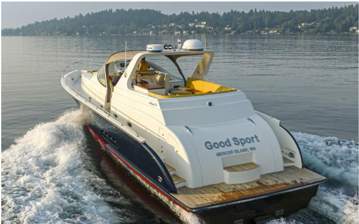
Profile Profile Stern