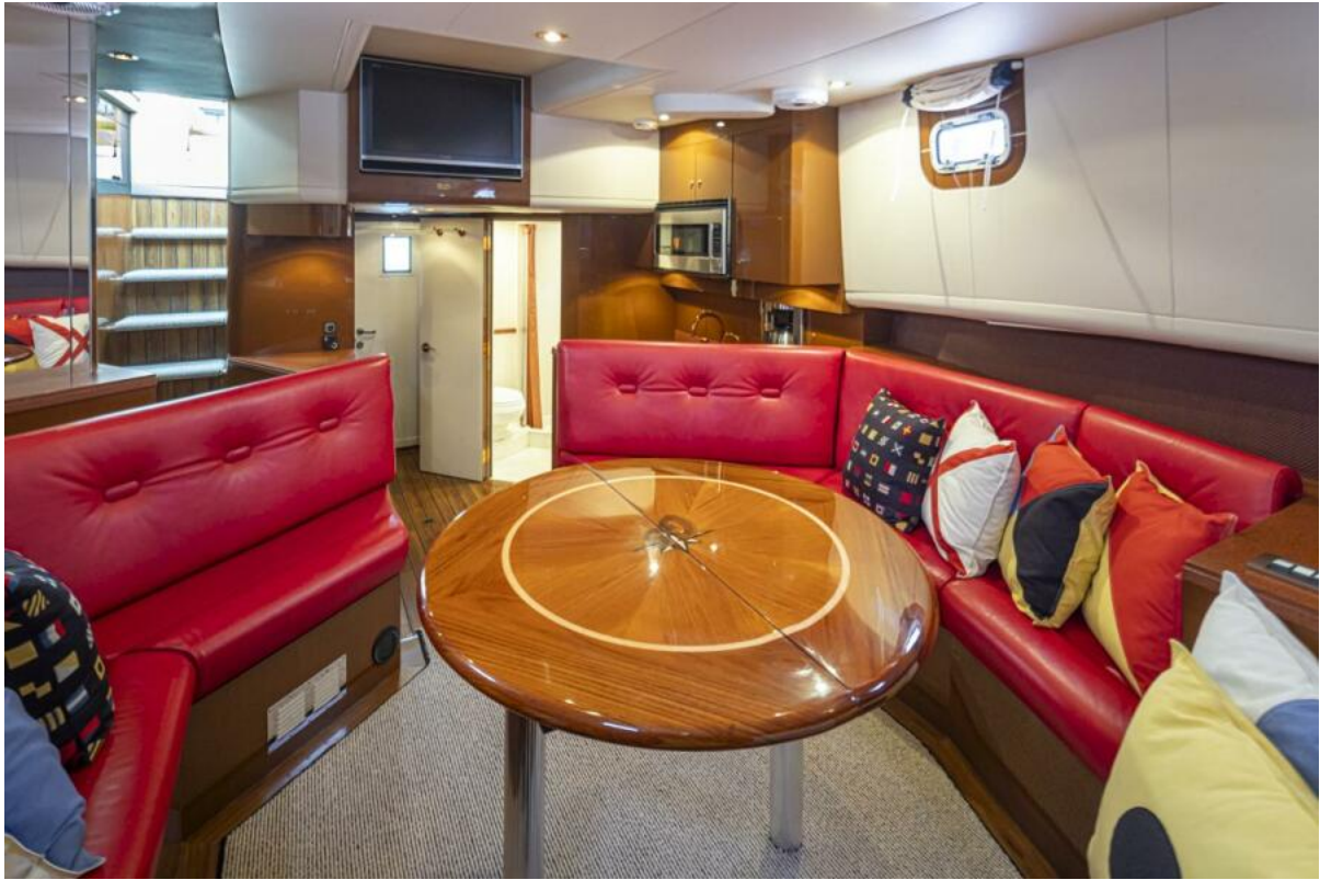
Lower Deck Lower Deck Seating with expandable round teak table