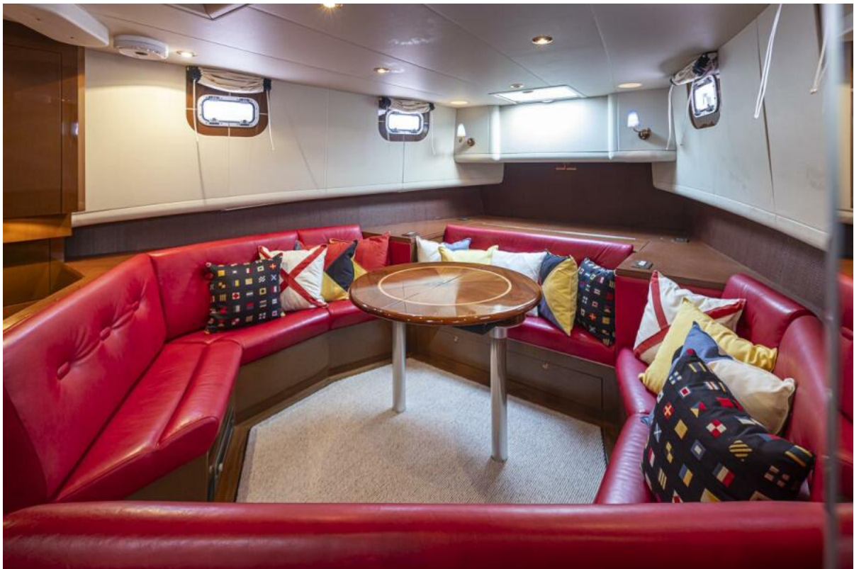
Lower Deck Lower Deck Seating with expandable round teak table