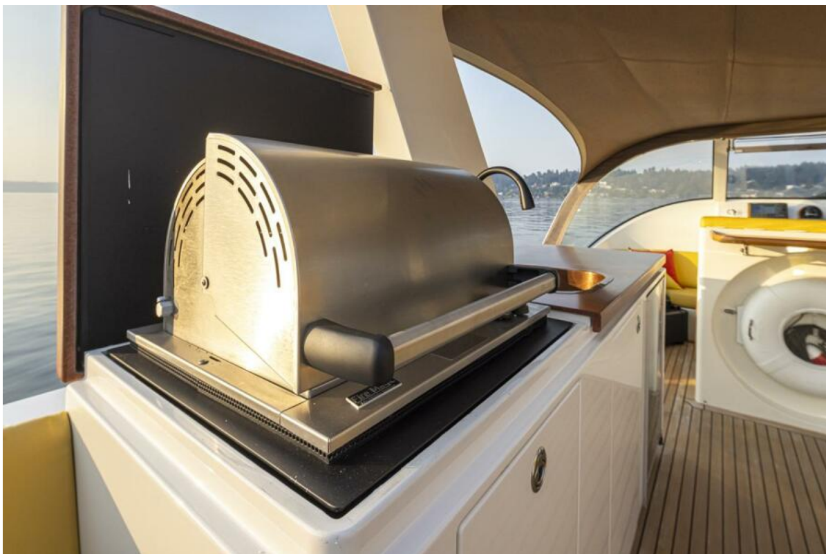
BBQ Aft Deck Wet Bar with BBQ Grill on Push Button High-Low Lift