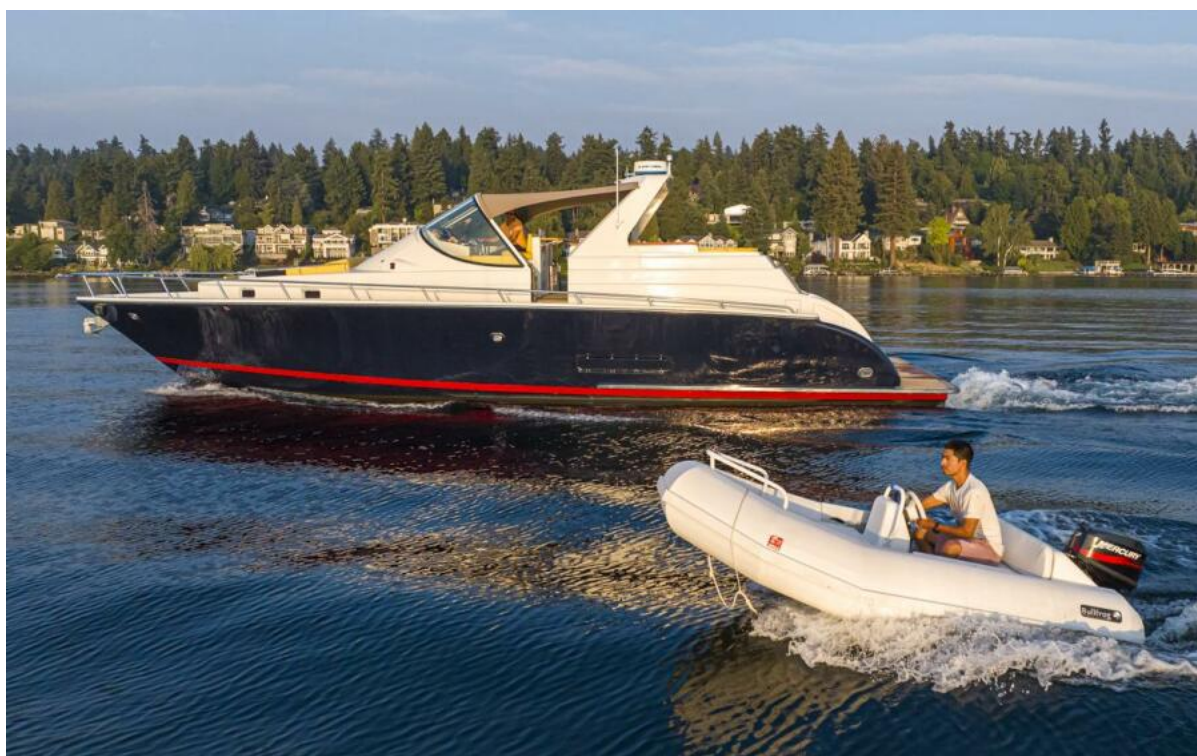
Profile Profile with Tender