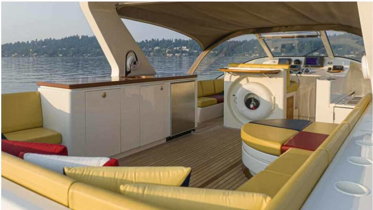
Aft Deck Aft Deck with huge entertaining and seating space