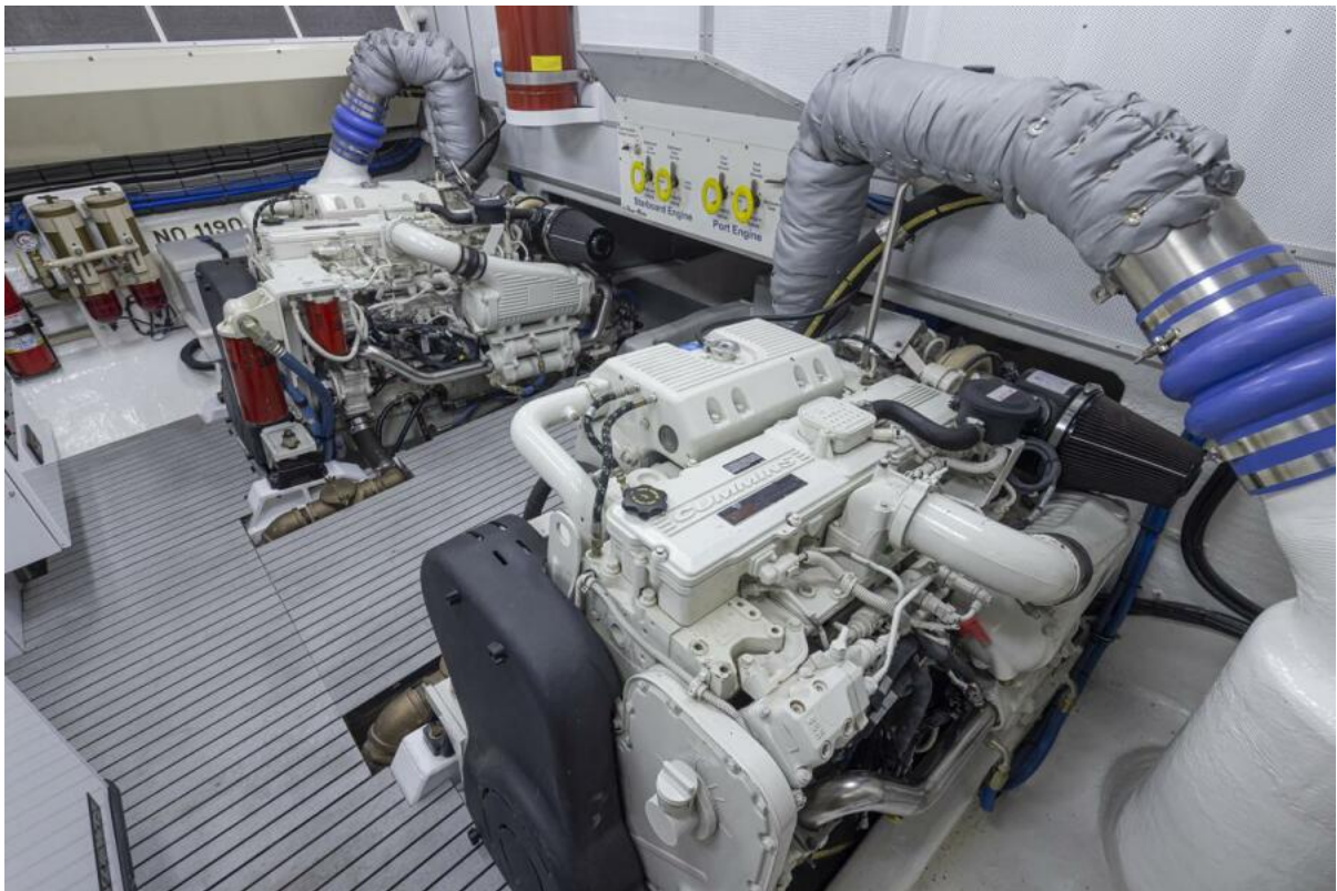
Engine Room Engine Room