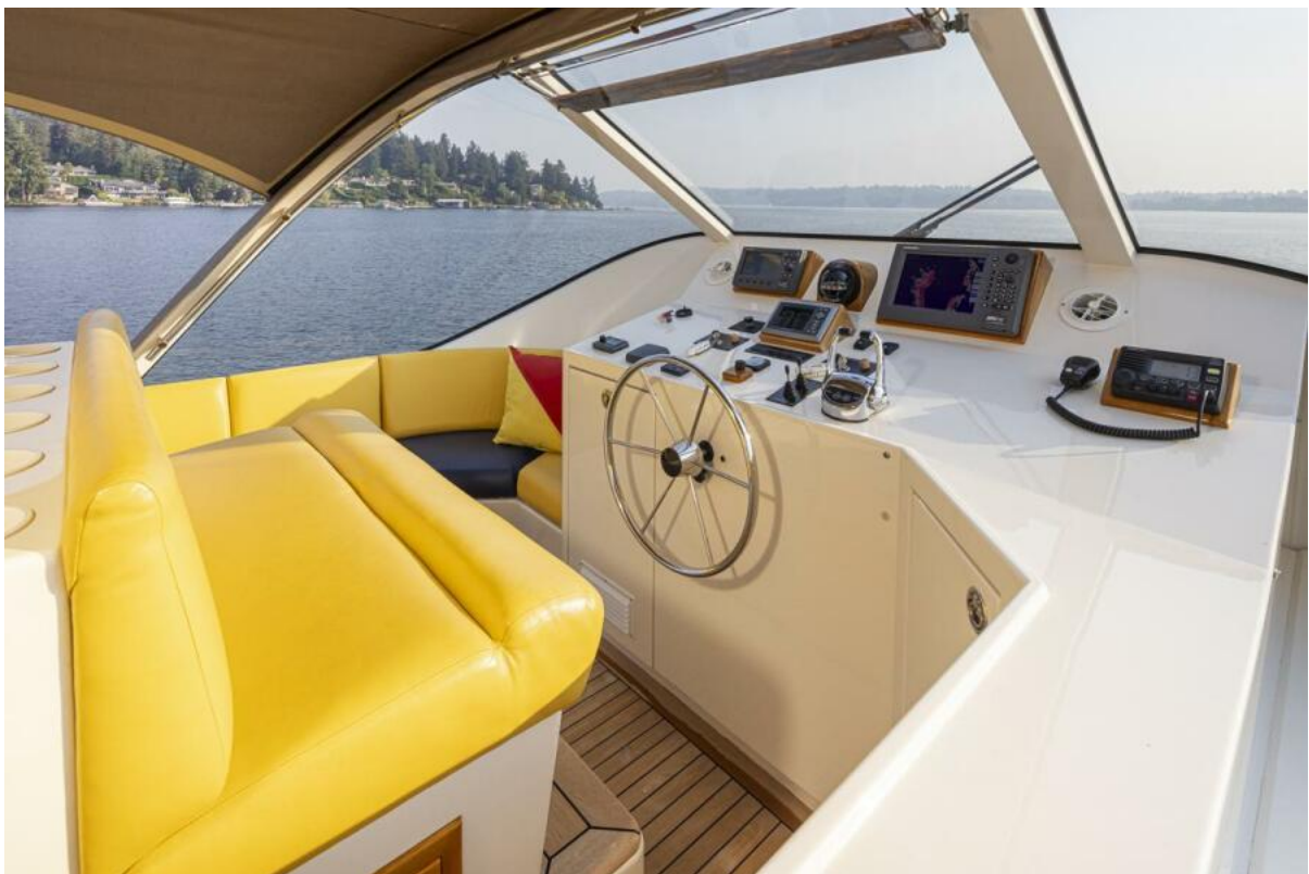
Helm Station Helm Station