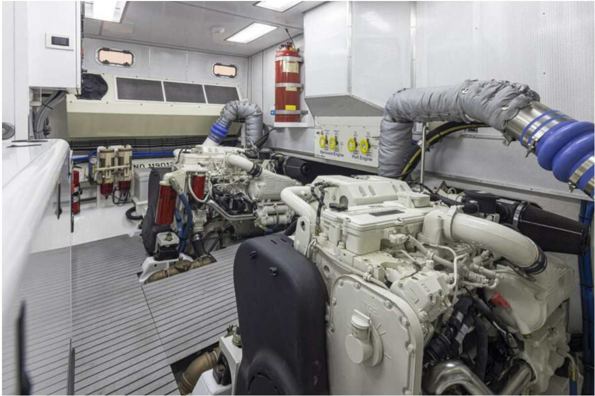
Engine Room Engine Room