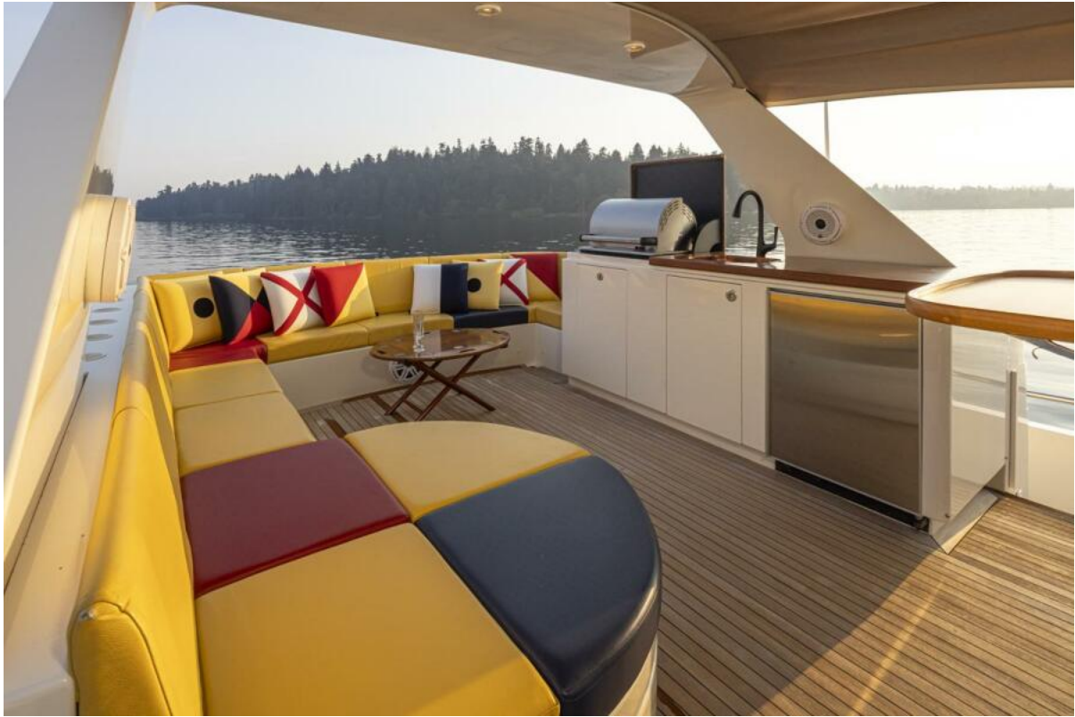
Aft Deck Aft Deck with huge entertaining and seating space