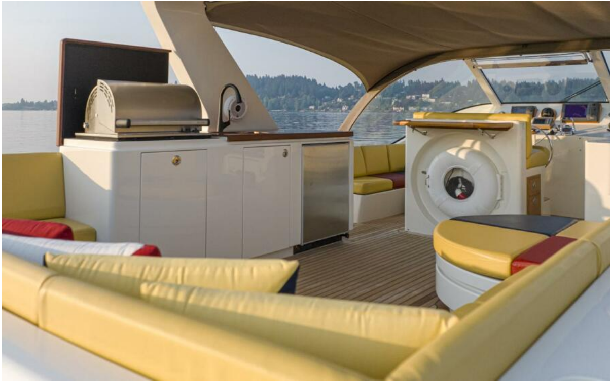
Aft Deck Aft Deck