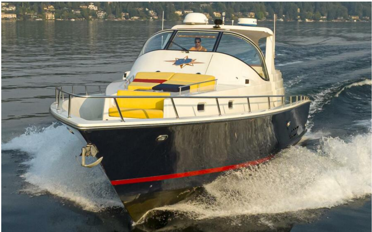
Profile Profile Bow