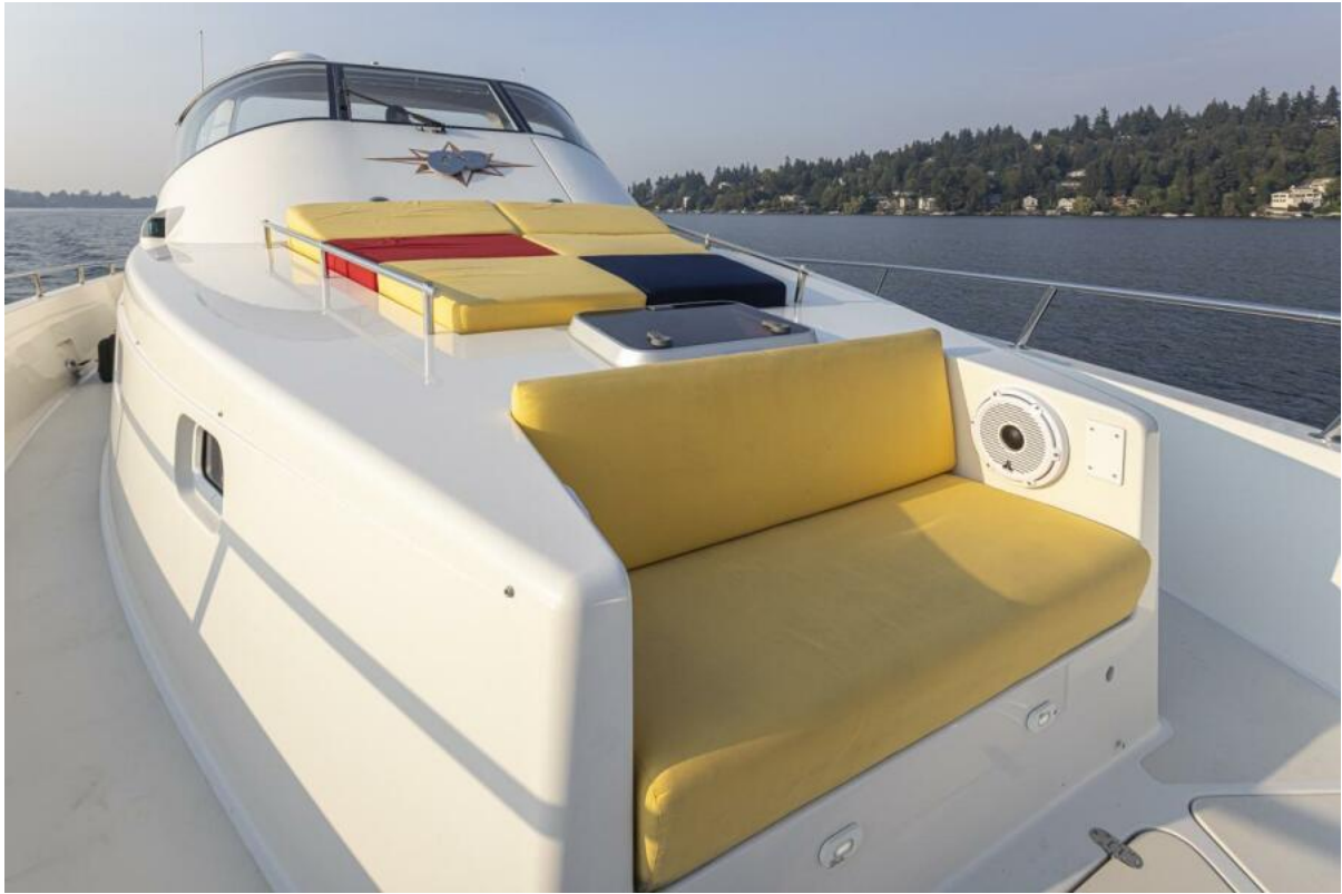
Foredeck Foredeck sun-pad and bench seat