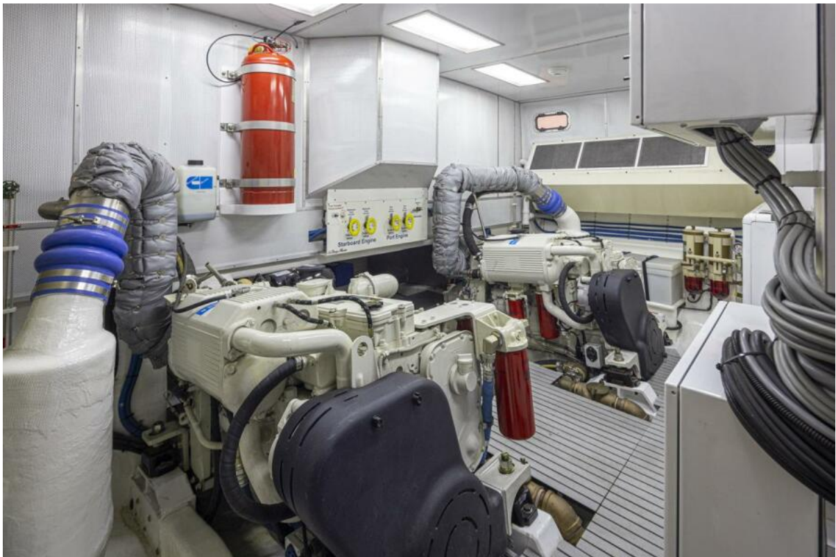
Engine Room Engine Room