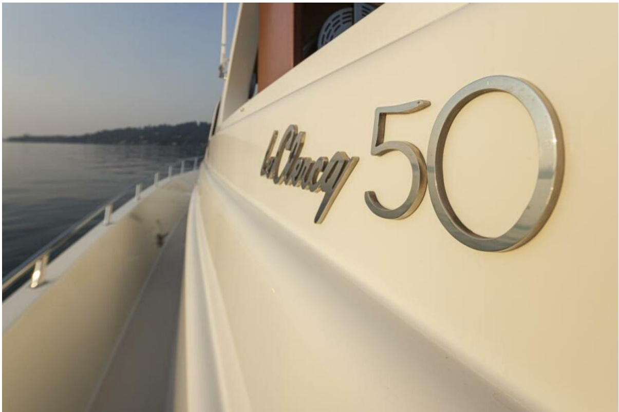
Side Deck Side Deck