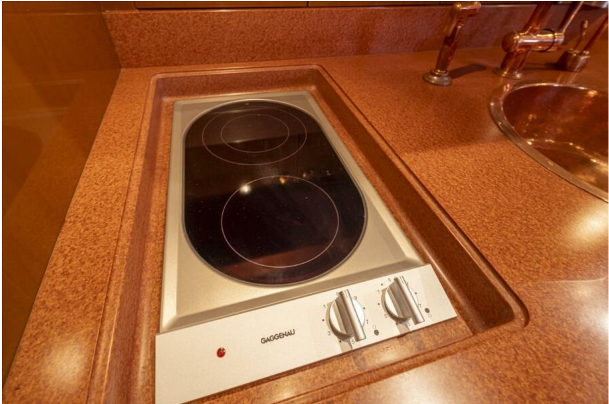
Galley Gaggenau Vario Electric Two Burner Stove Top