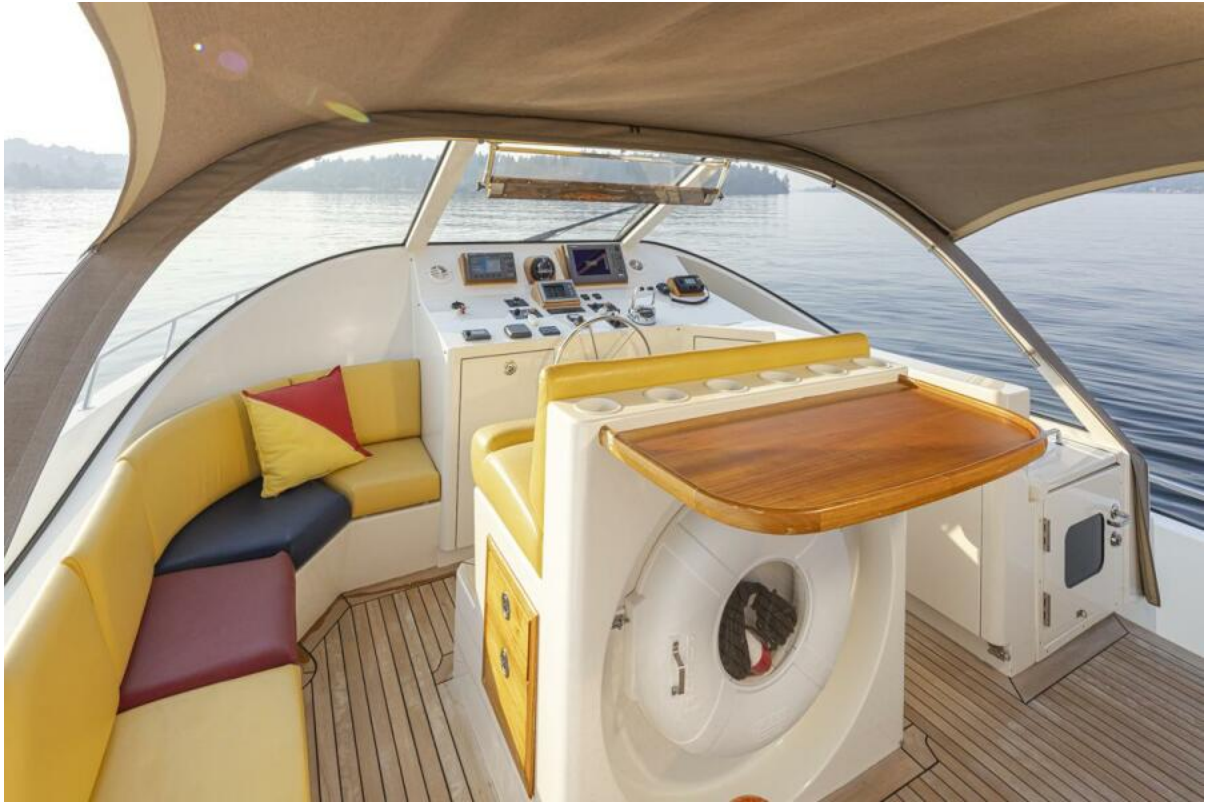
Helm Station Helm Station with Fold out table aft and seating to port