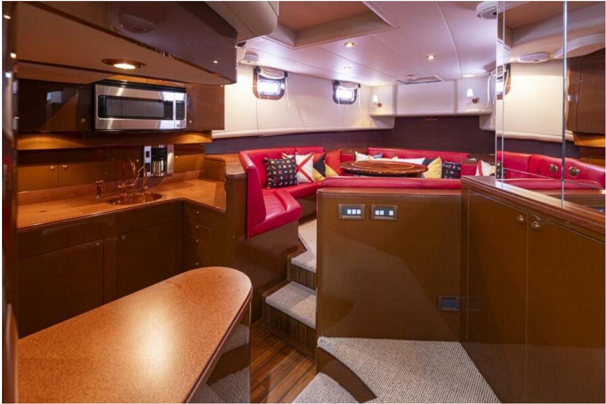
Lower Deck Lower Deck