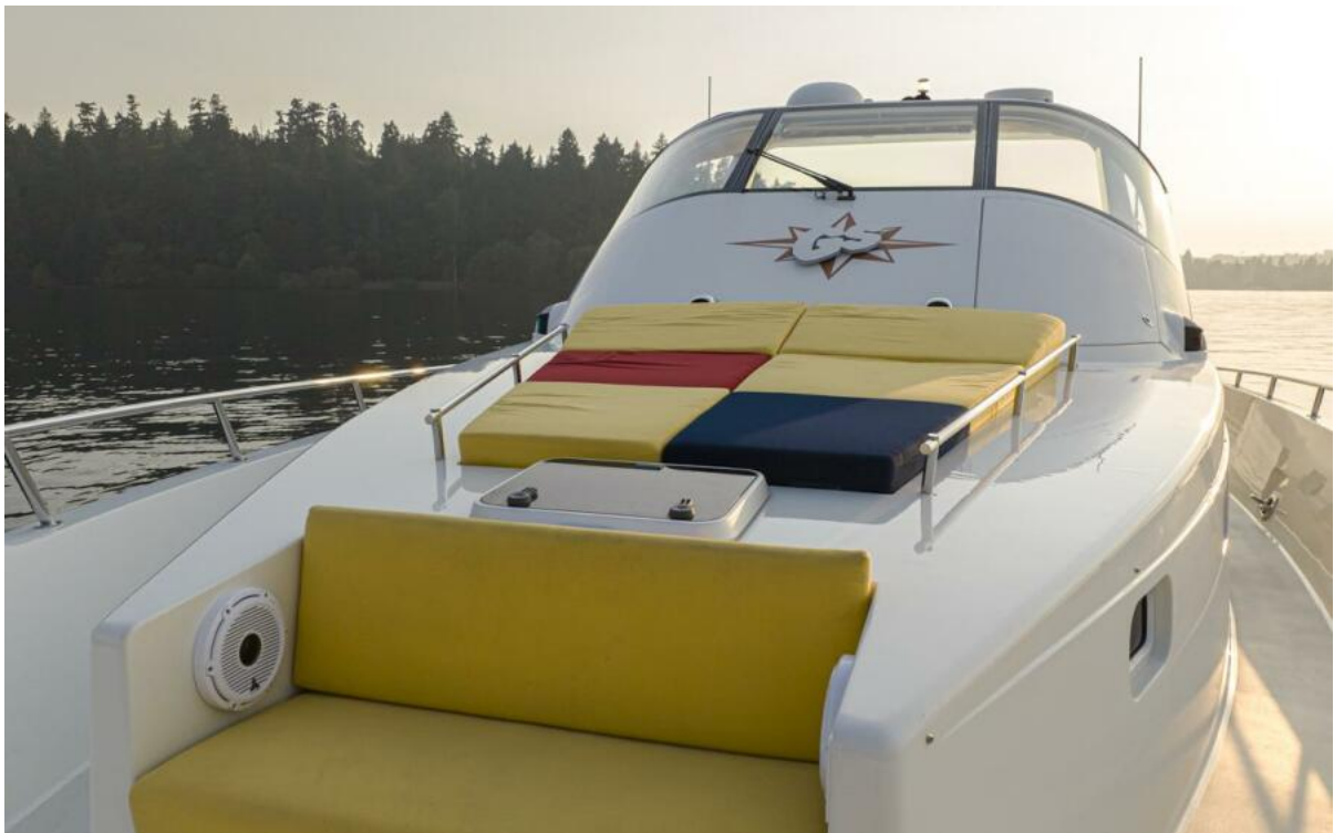
Foredeck Foredeck sun-pad and bench seat