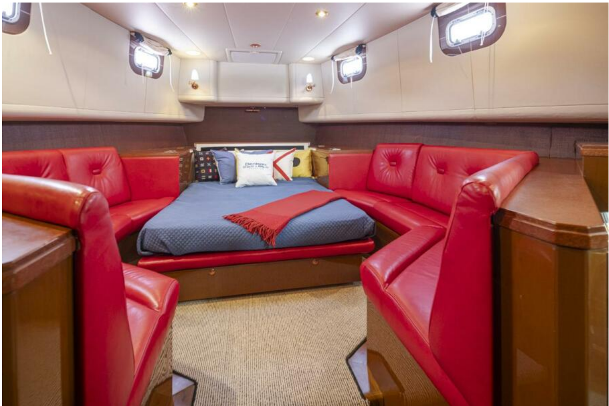
Lower Deck Lower Deck Full Size Berth