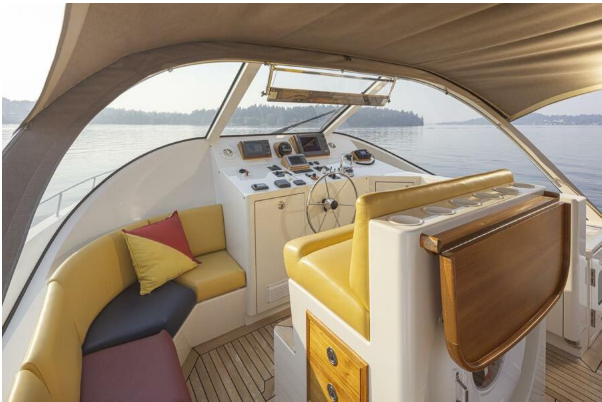
Helm Station Helm Station with L-Shaped seating to port