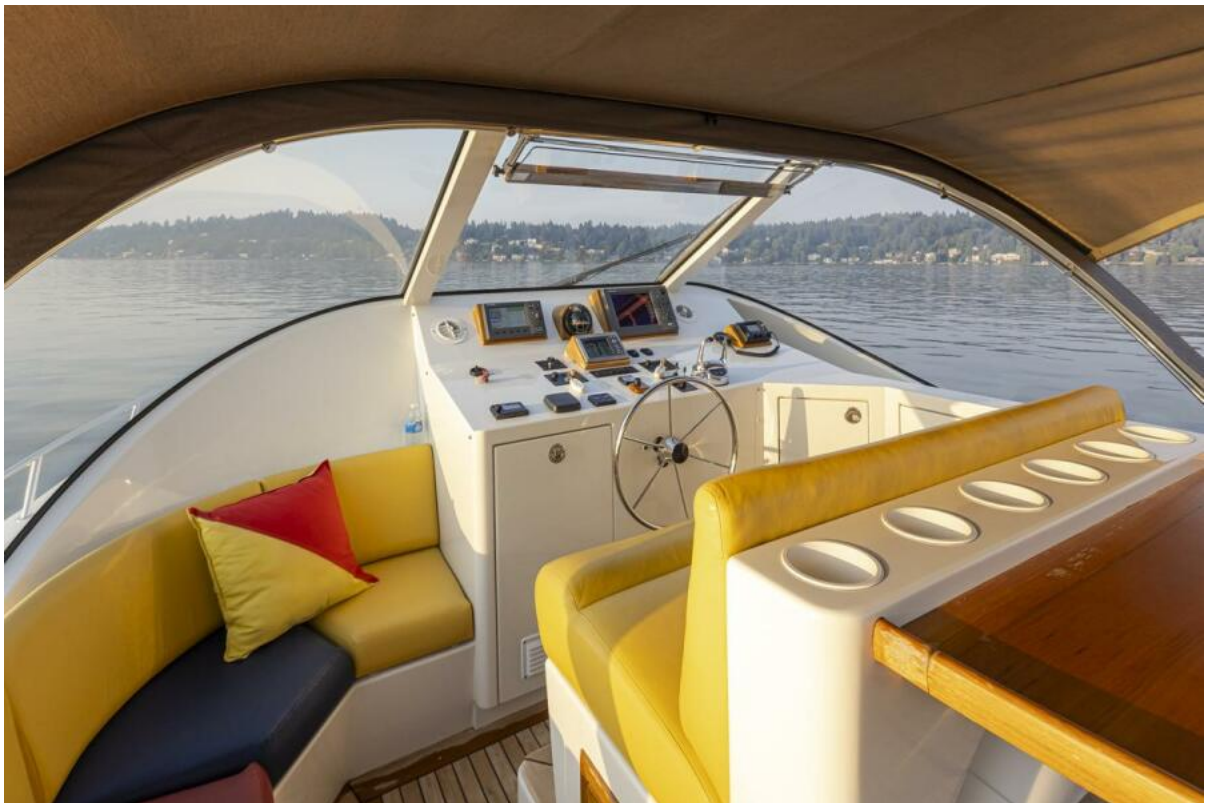
Helm Station Helm Station with Fold out table aft and seating to port