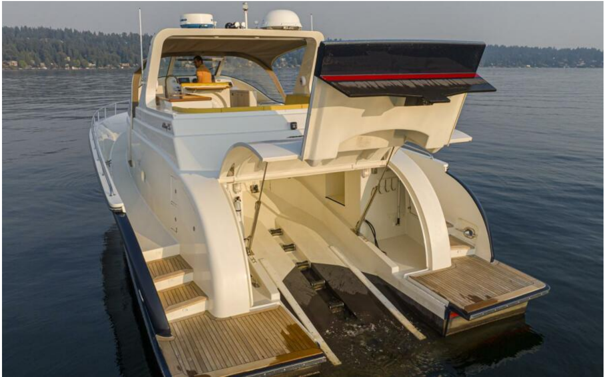
Profile Stern Tender Garage