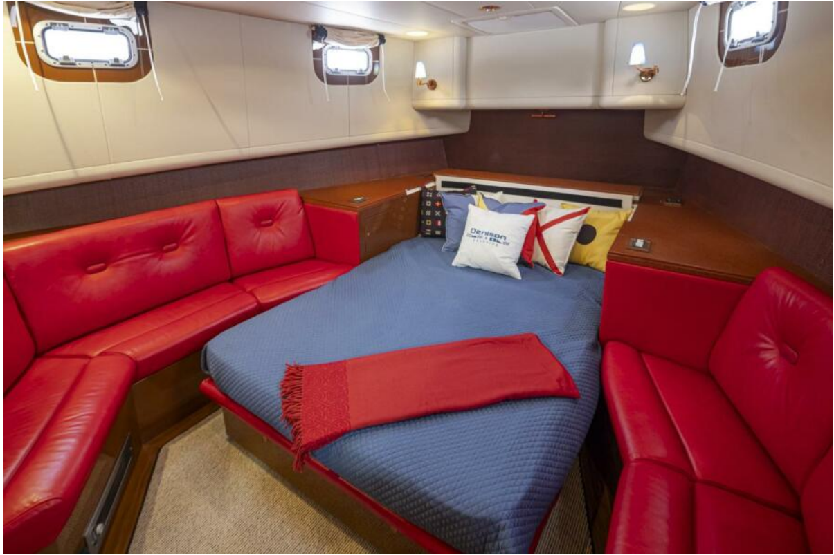
Lower Deck Lower Deck Full Size Berth