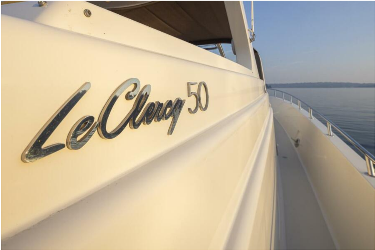
Side Deck Side Deck