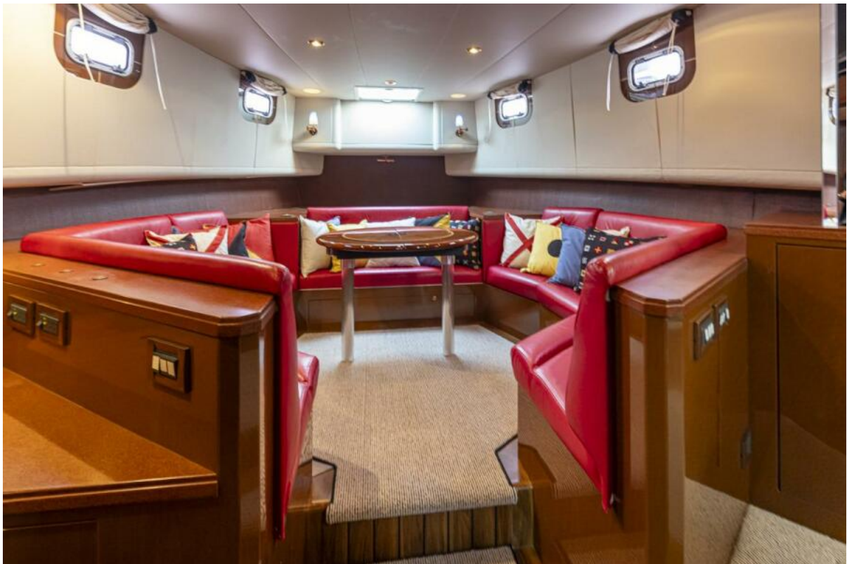
Lower Deck Lower Deck Seating