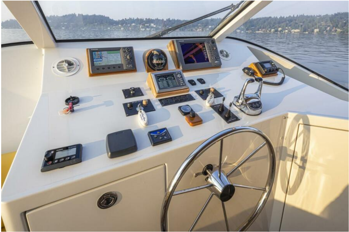
Helm Station Helm Station