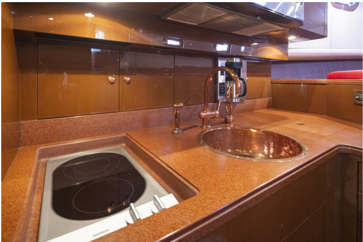
Galley Gaggenau Stove with high end copper sink and faucet