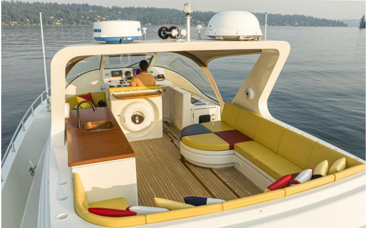
Aft Deck Aft Deck with huge entertaining and seating space