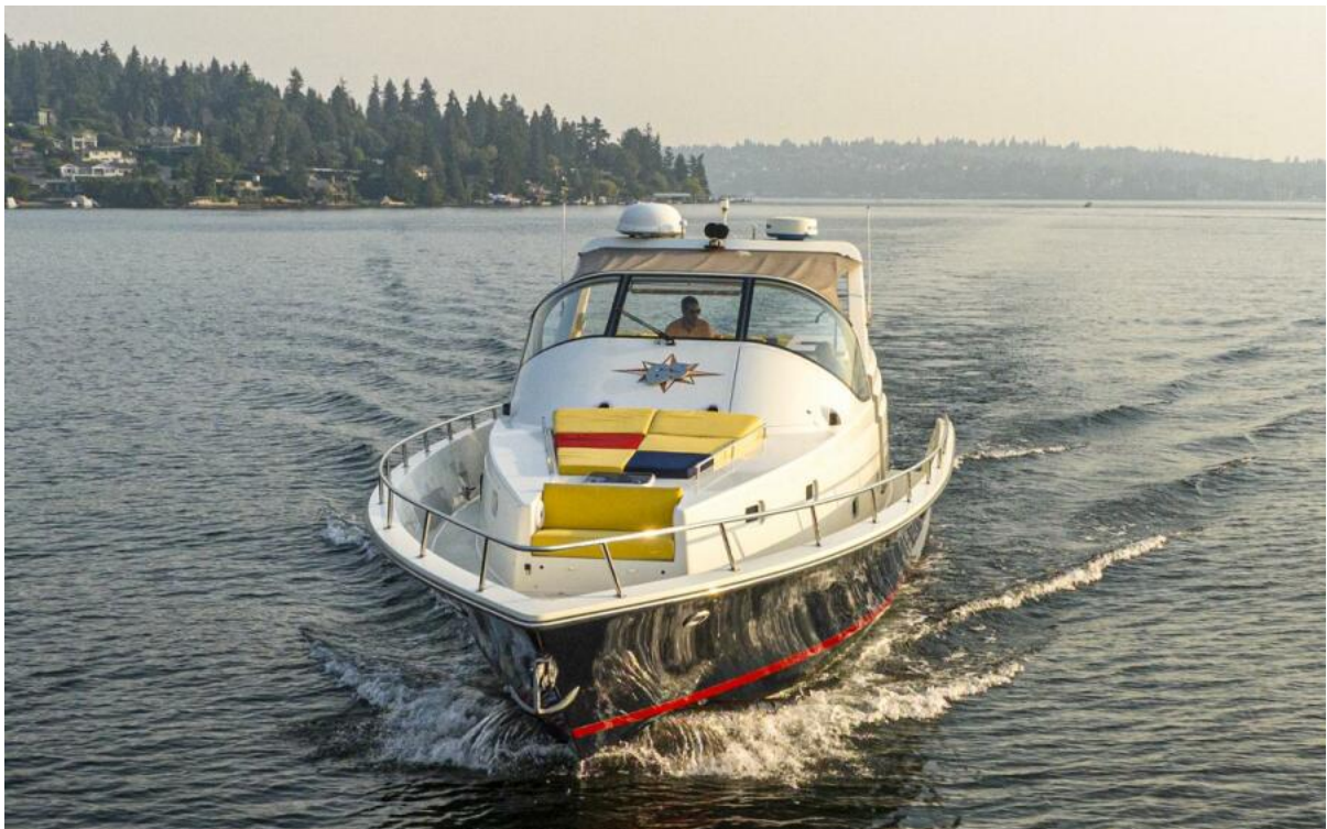
Profile Profile Bow