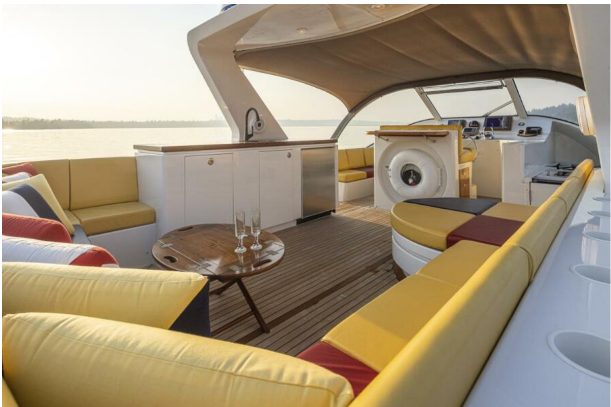
Aft Deck Aft Deck with huge entertaining and seating space