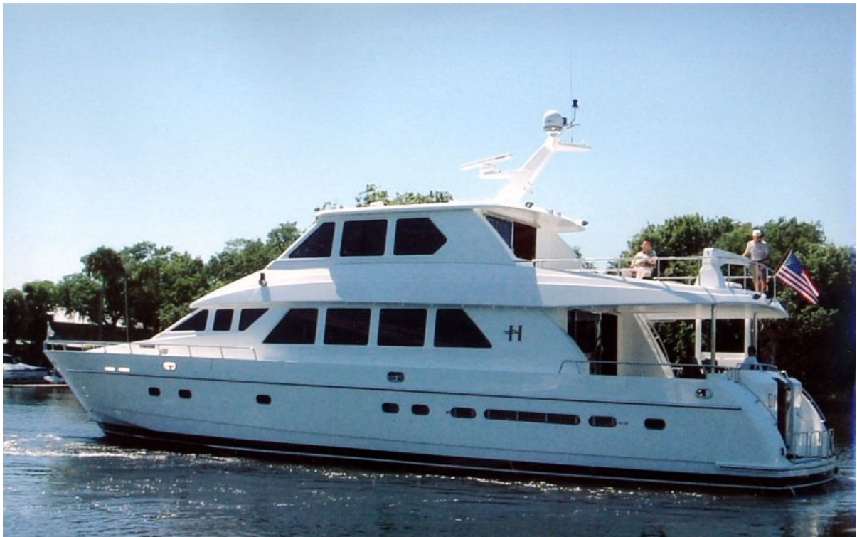
Pretty Lady Pretty Lady