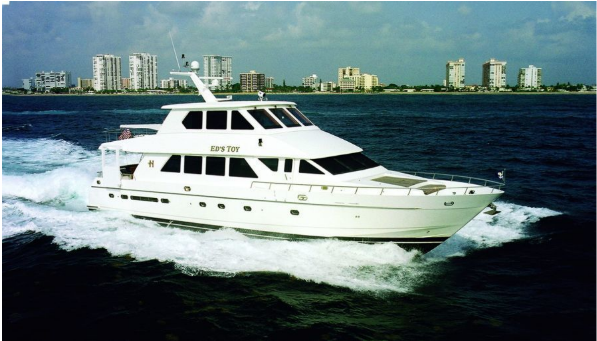
Pretty Lady Pretty Lady