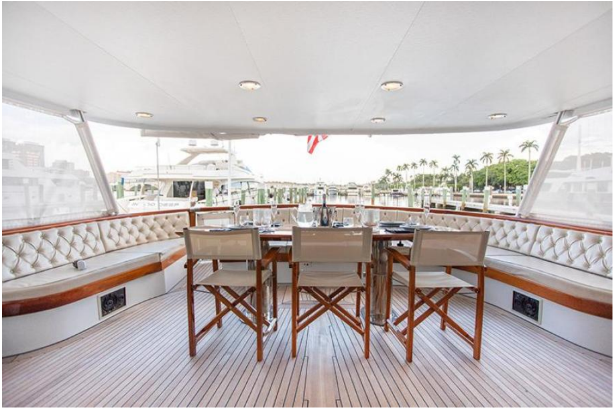
Aft Deck Dining