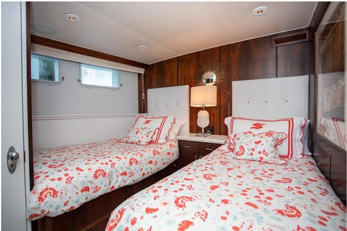
Starboard Guest Stateroommm