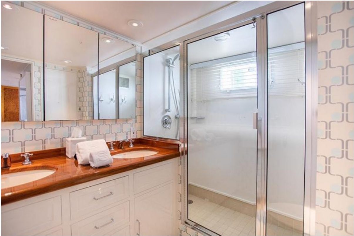
Owner Ensuite Head