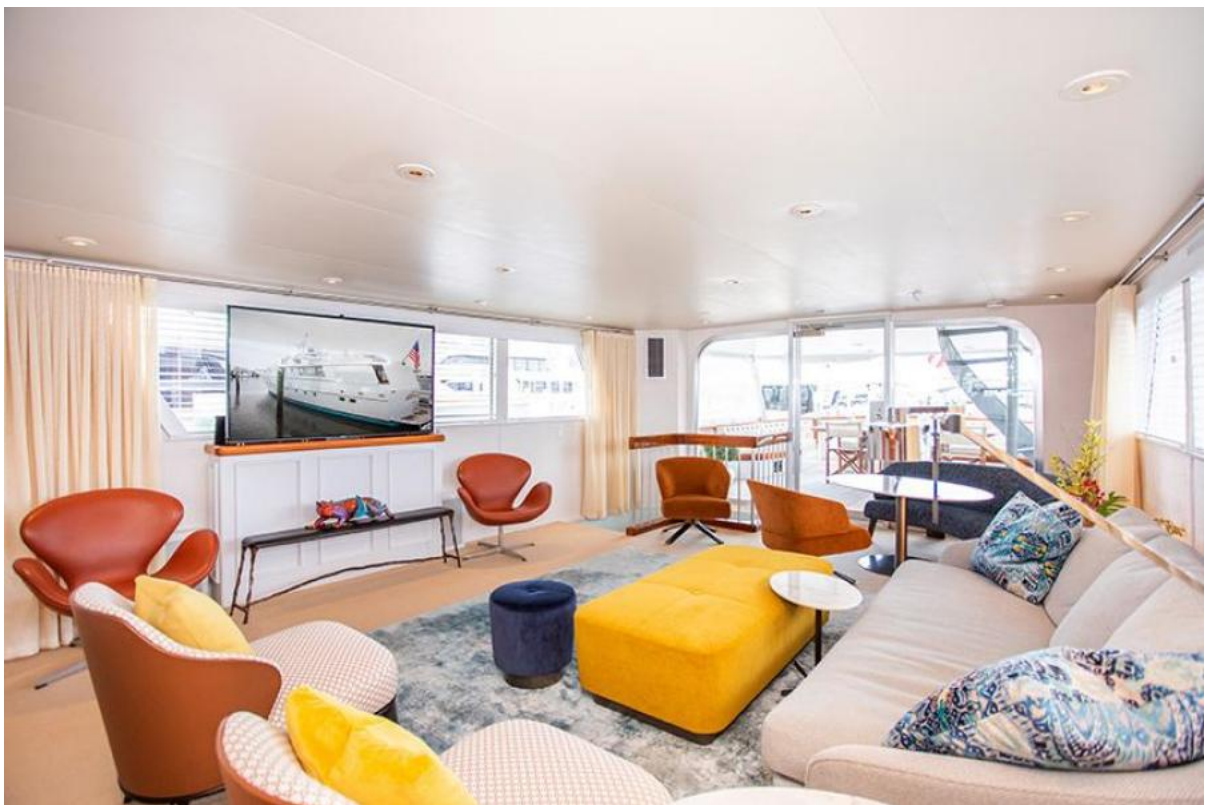
Salon Facing Aft