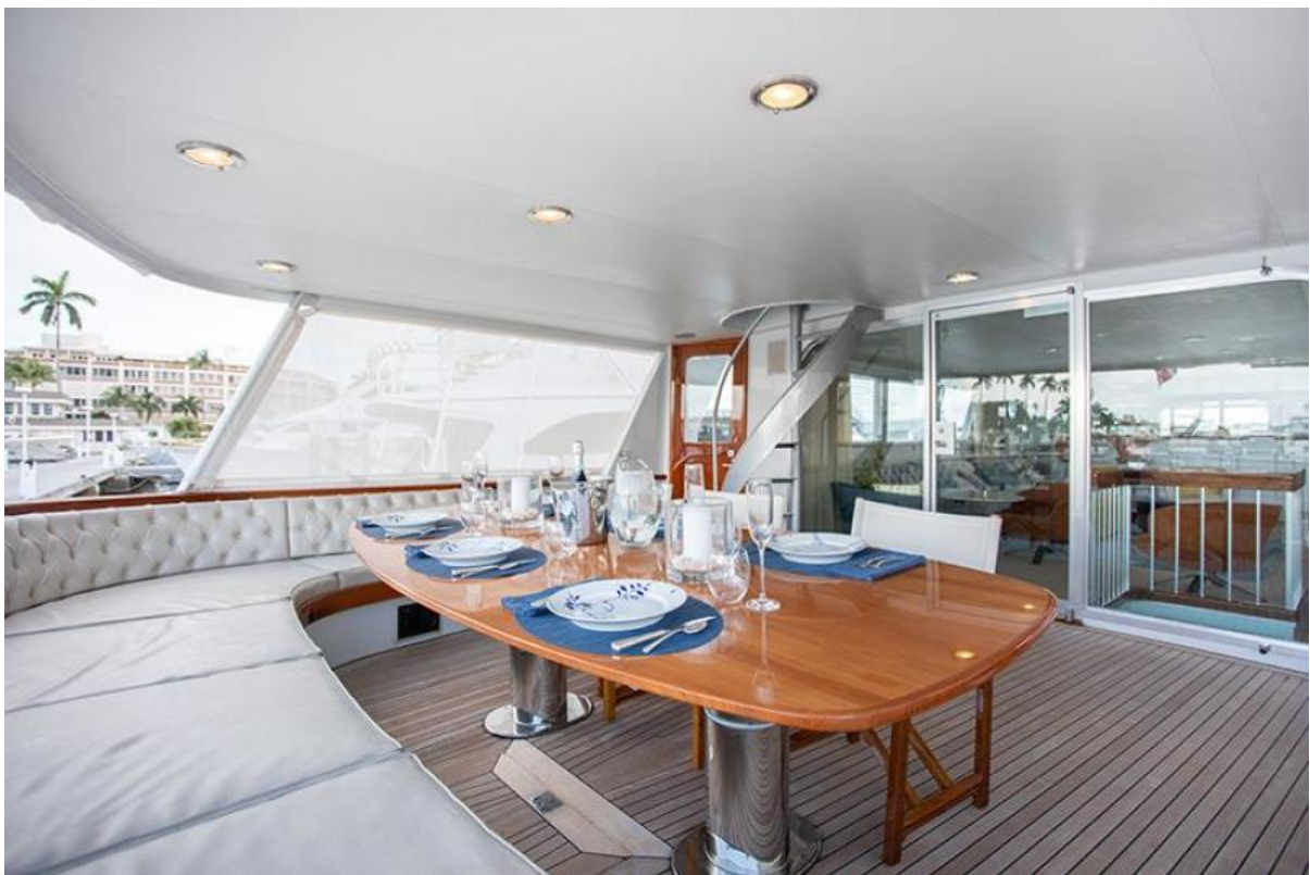
Aft Deck Dining