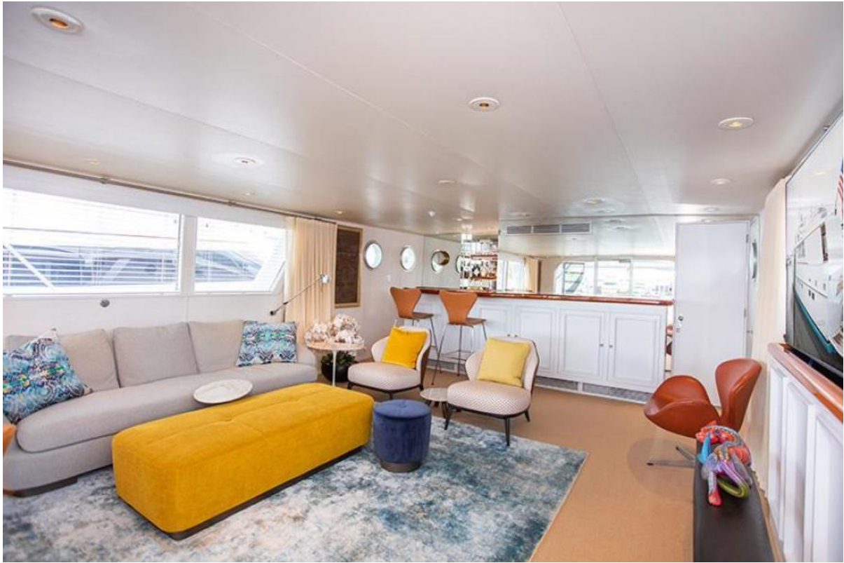
Salon Facing Forward