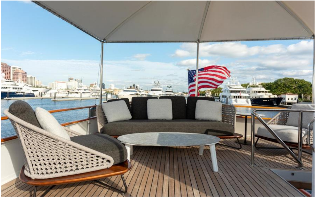
Aft Sundeck Seating