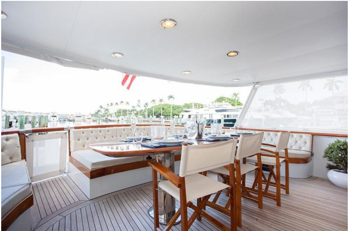
Aft Deck Dining