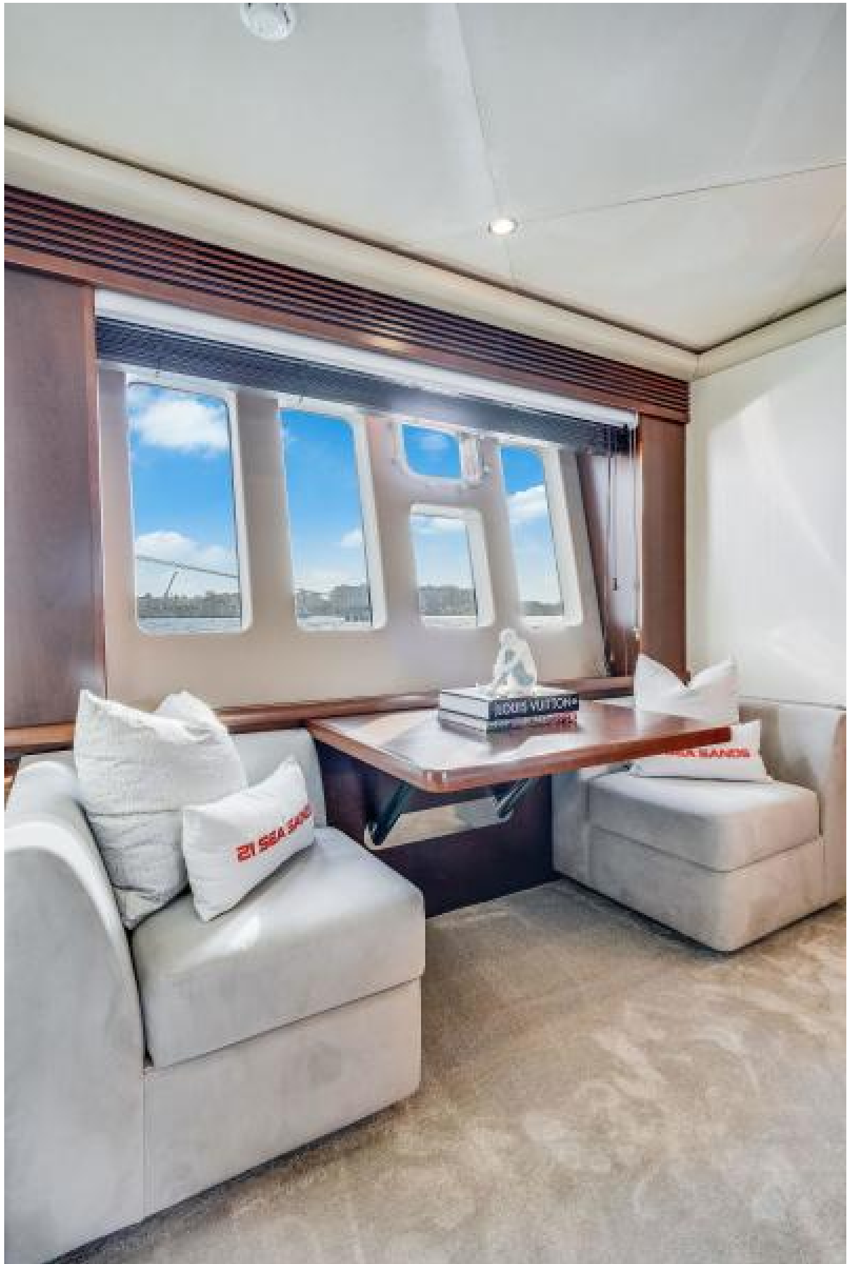
Owner Stateroom Lounge Seating