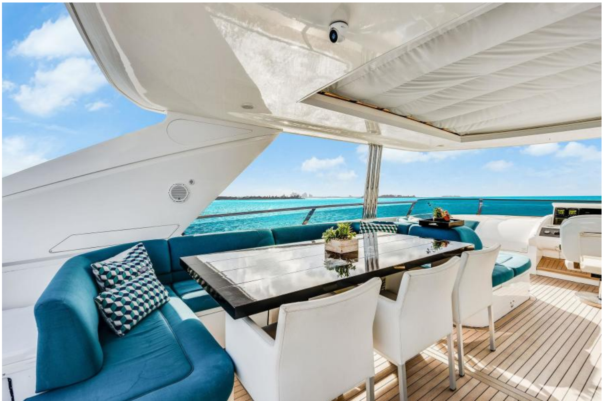
Flybridge Dining Area