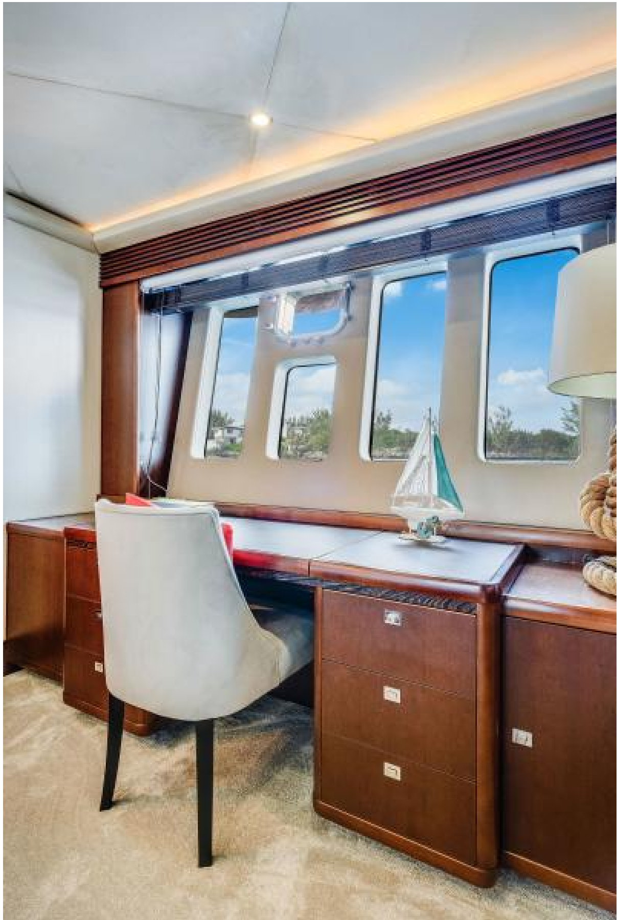
Owner Stateroom Desk