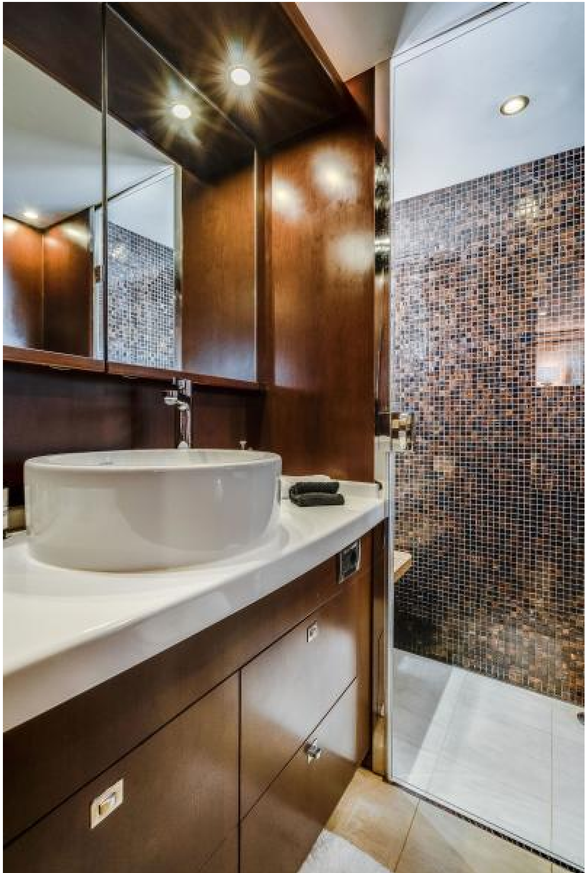
Starboard Guest En Suite