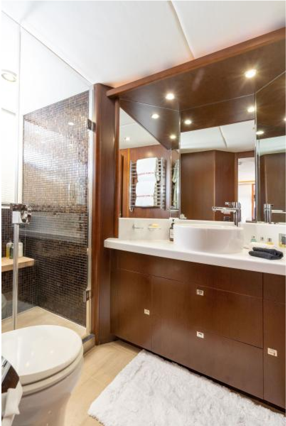
Port Guest En-Suite