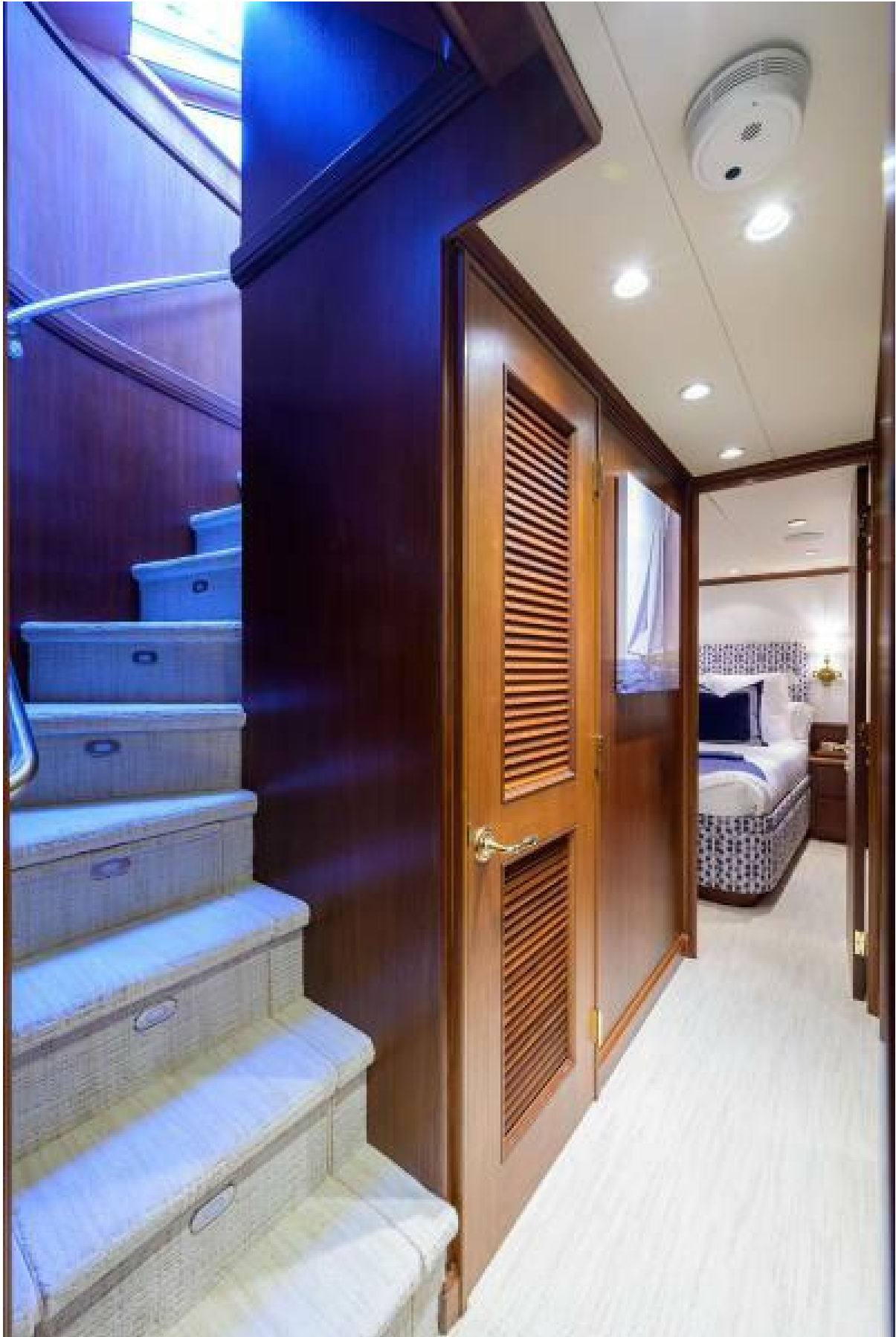
Lower Deck Foyer