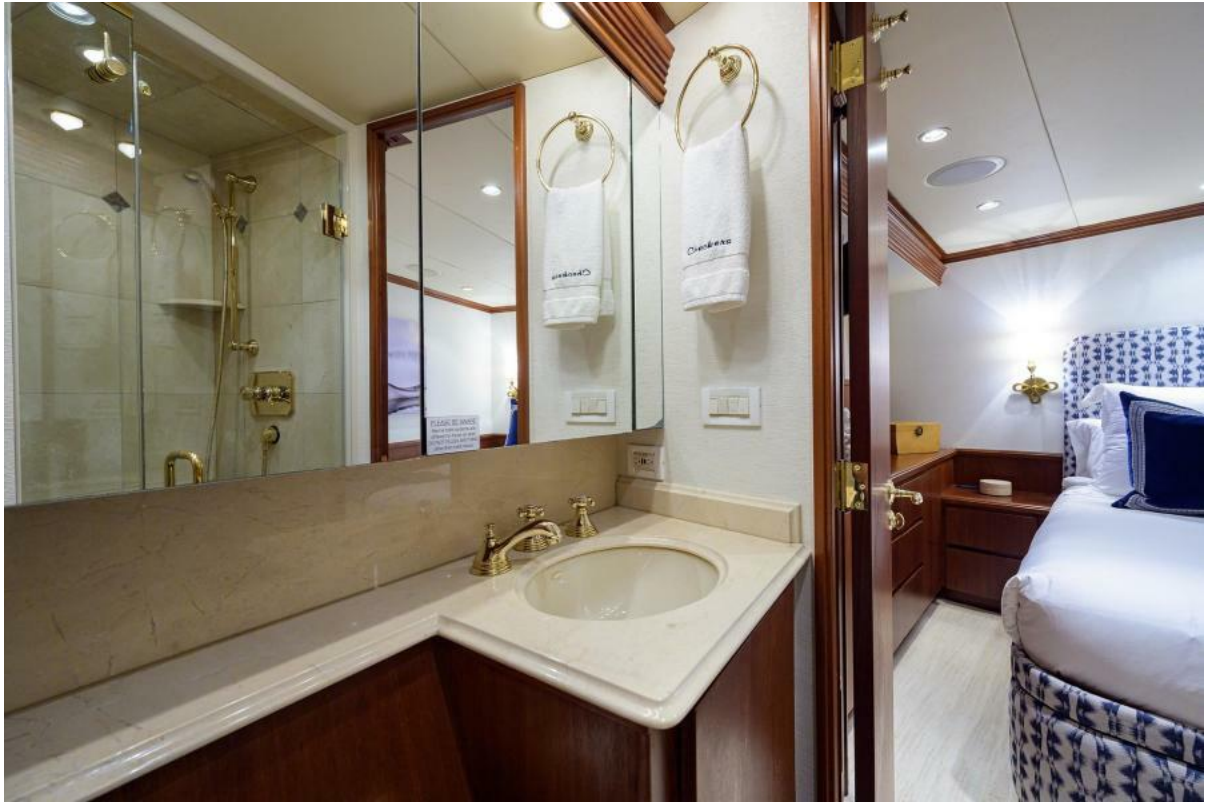
Starboard Guest Ensuite