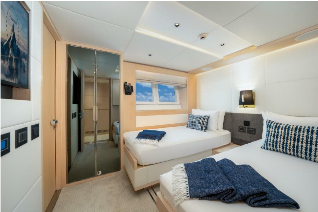
Twin Guest Stateroom