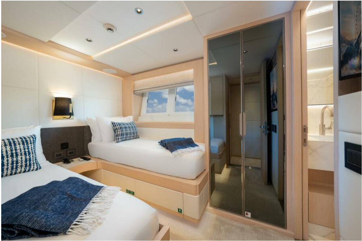
Twin Guest Stateroom