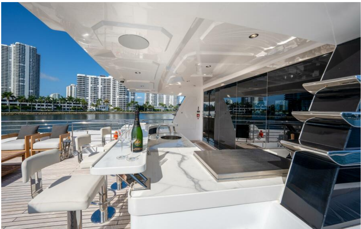
Bridge Deck Bar