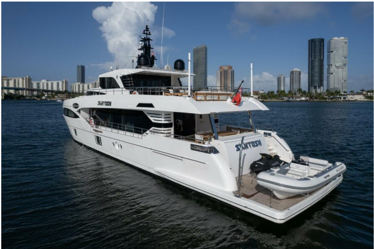
Port Stern Profile