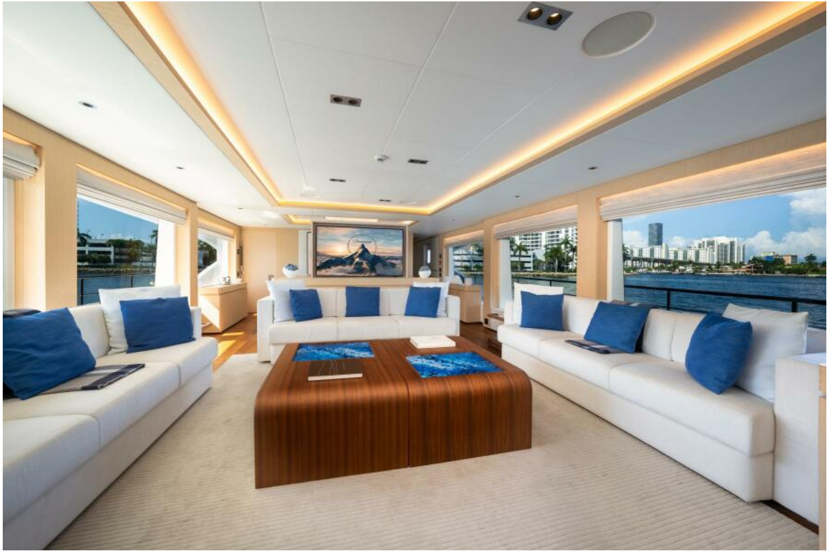
Salon w/ Pop Up TV