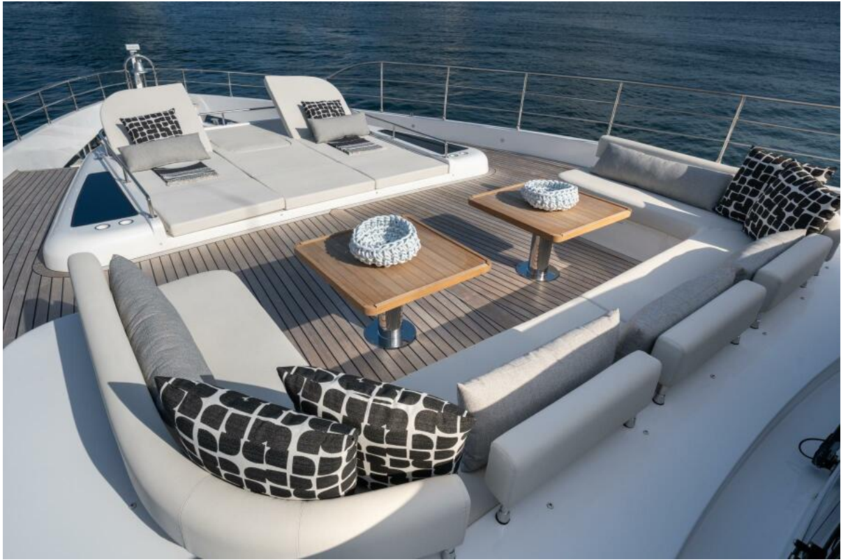
Foredeck Sun Pad