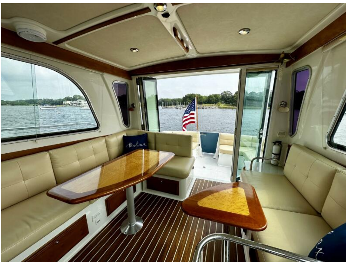
Salon 2010 Back Cove 37 Salon. For Sale Central Agent Northstar Yacht Sales