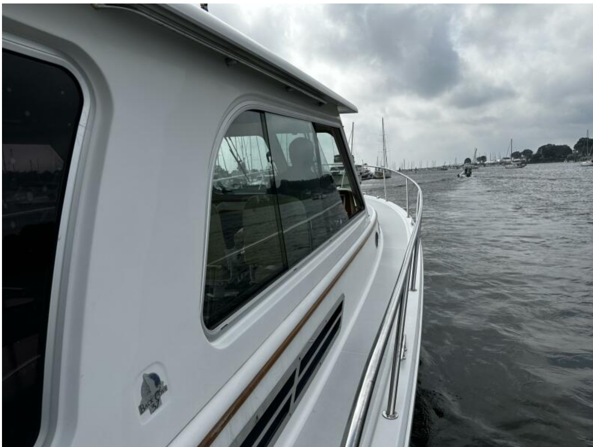
Side Deck 2010 Back Cove 37 Side Deck. For Sale Central Agent Northstar Yacht Sales