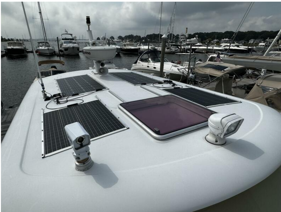
Hardtop Equipment 2010 Back Cove 37 Hardtop with solar panels. For Sale Central Agent Northstar Yacht Sales