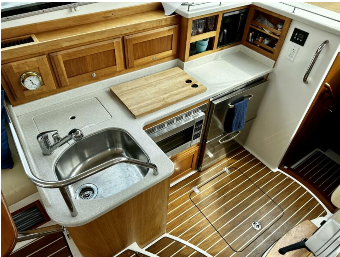
Galley Top View 2010 Back Cove 37 Galley Top View. For Sale Central Agent Northstar Yacht Sales