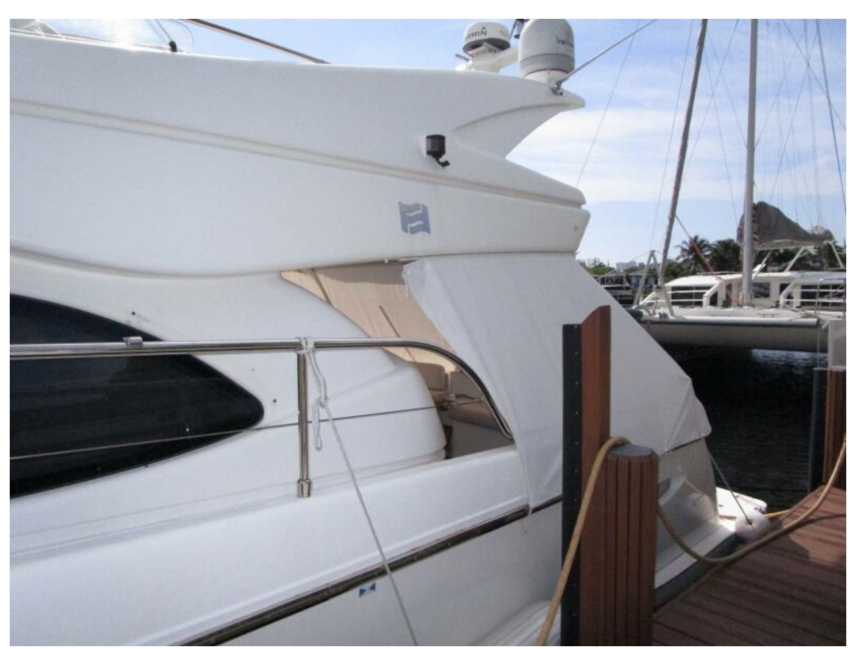
Aft Deck Curtains