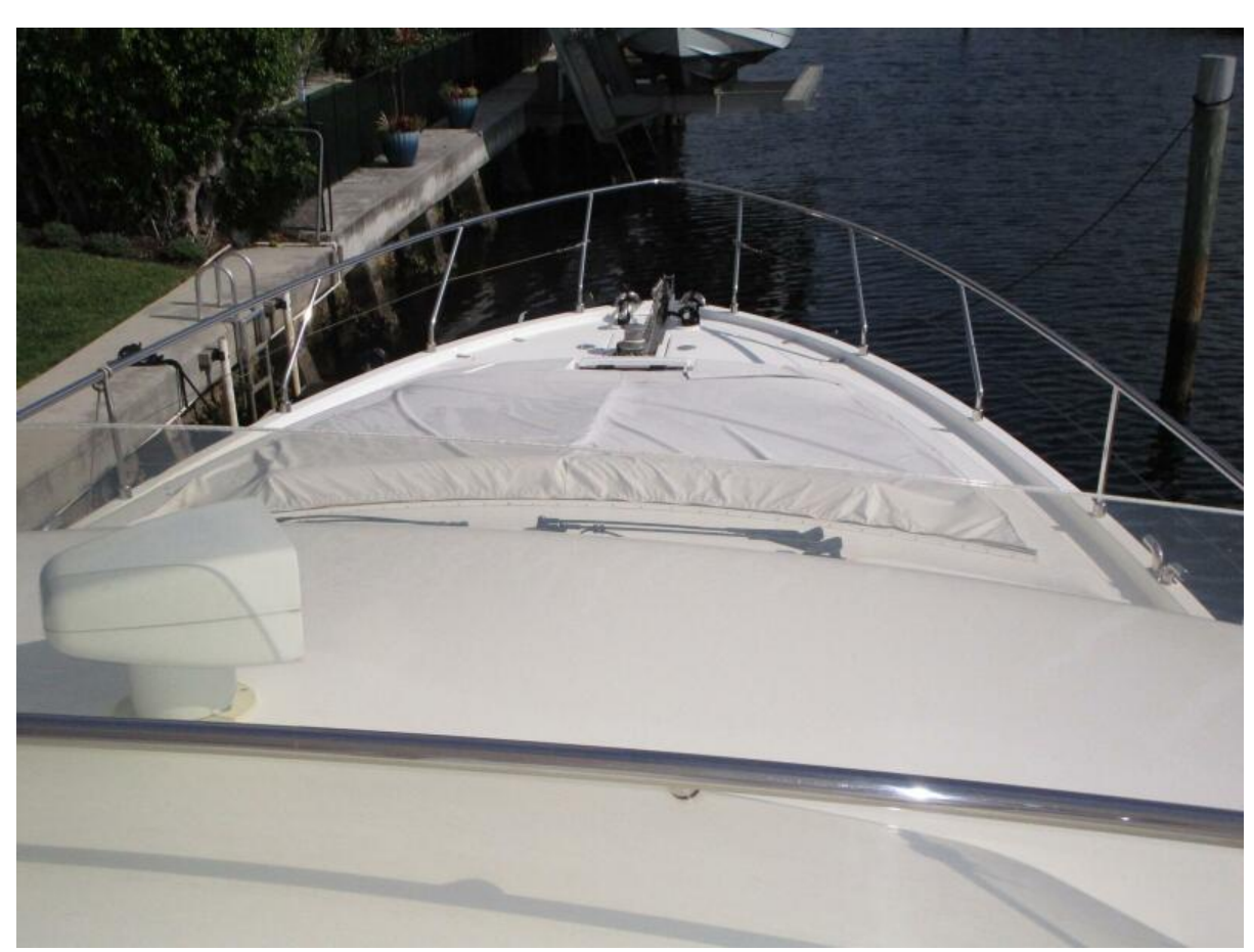
View from Helm