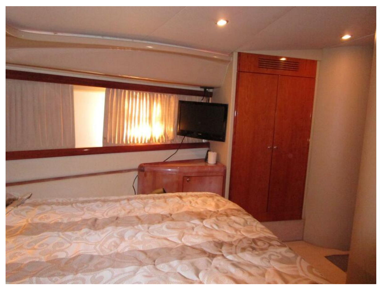
VIP Looking to Stbd.