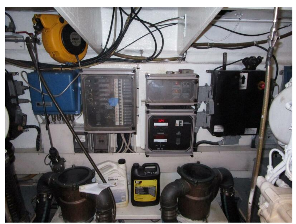
Engine Room Aft