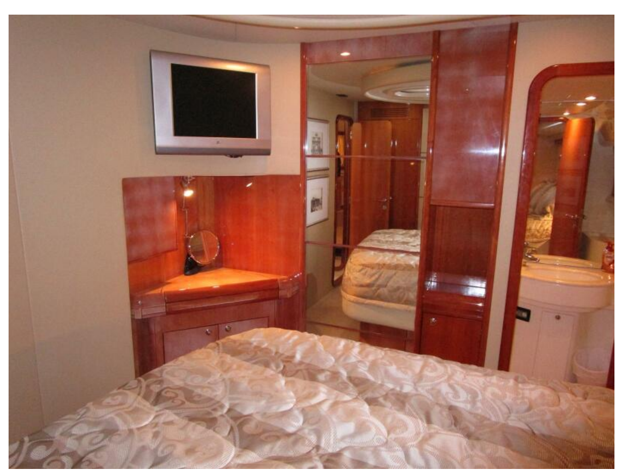
Master Looking Inboard