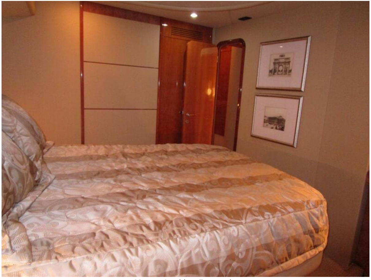
Master Looking Forward