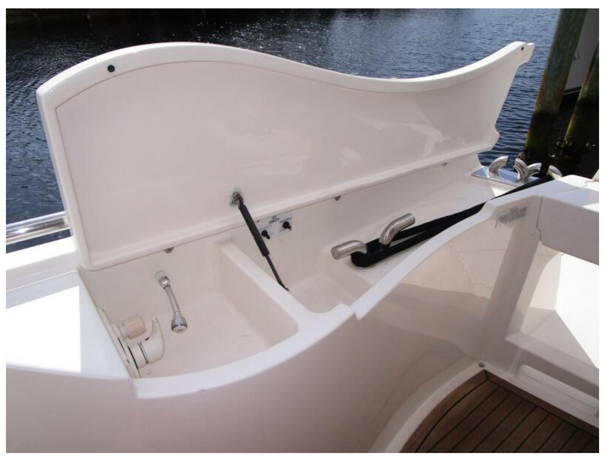
Sink and Cleats