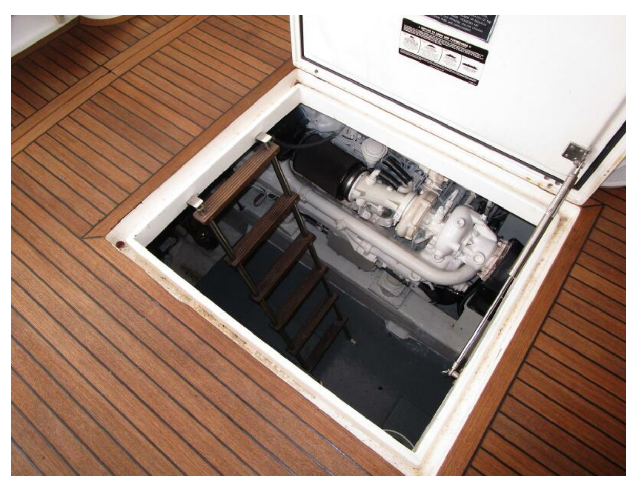
Engine Room Access