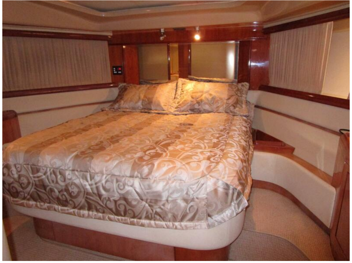
VIP Looking Fwd.