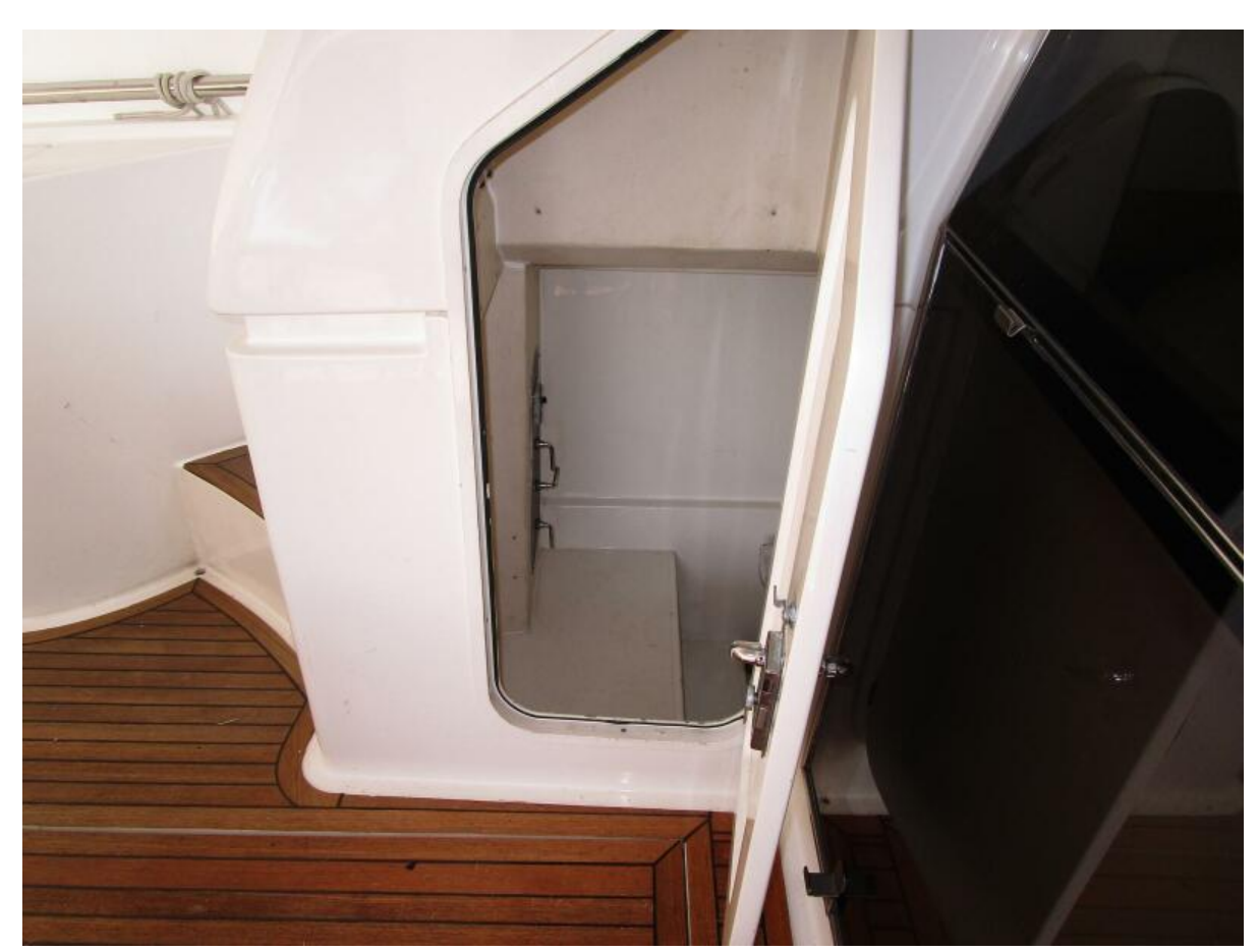
Crew Cabin Entry