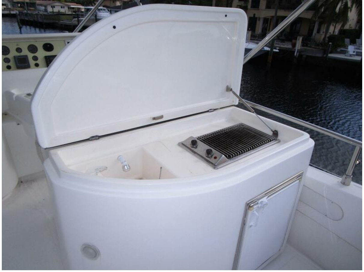
Flybridge Wet Bar