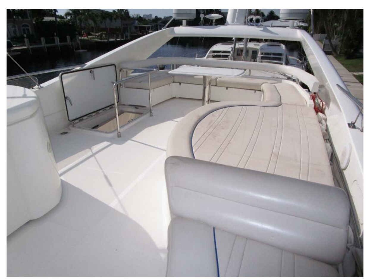
Flybridge Looking Aft