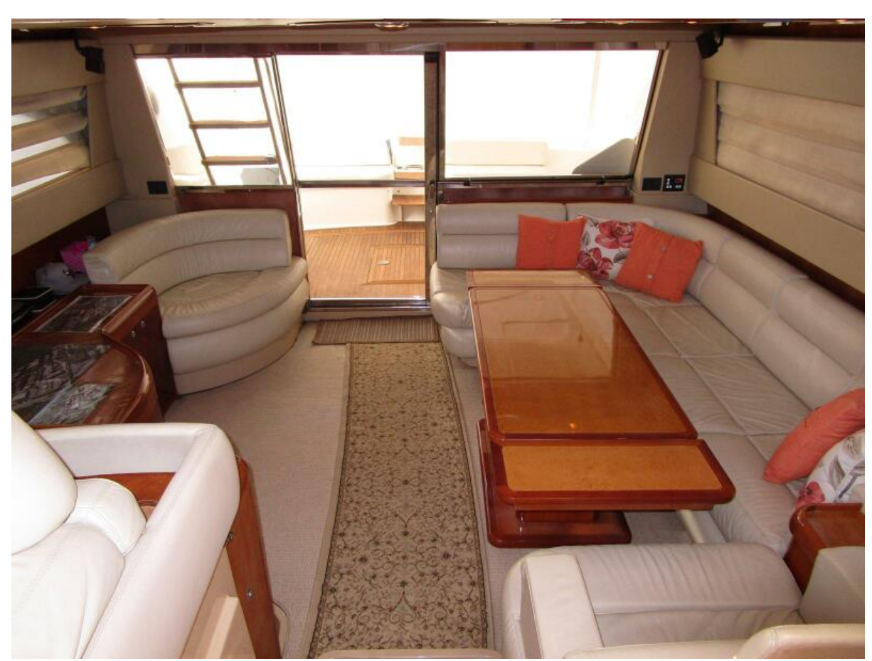
Salon Looking Out