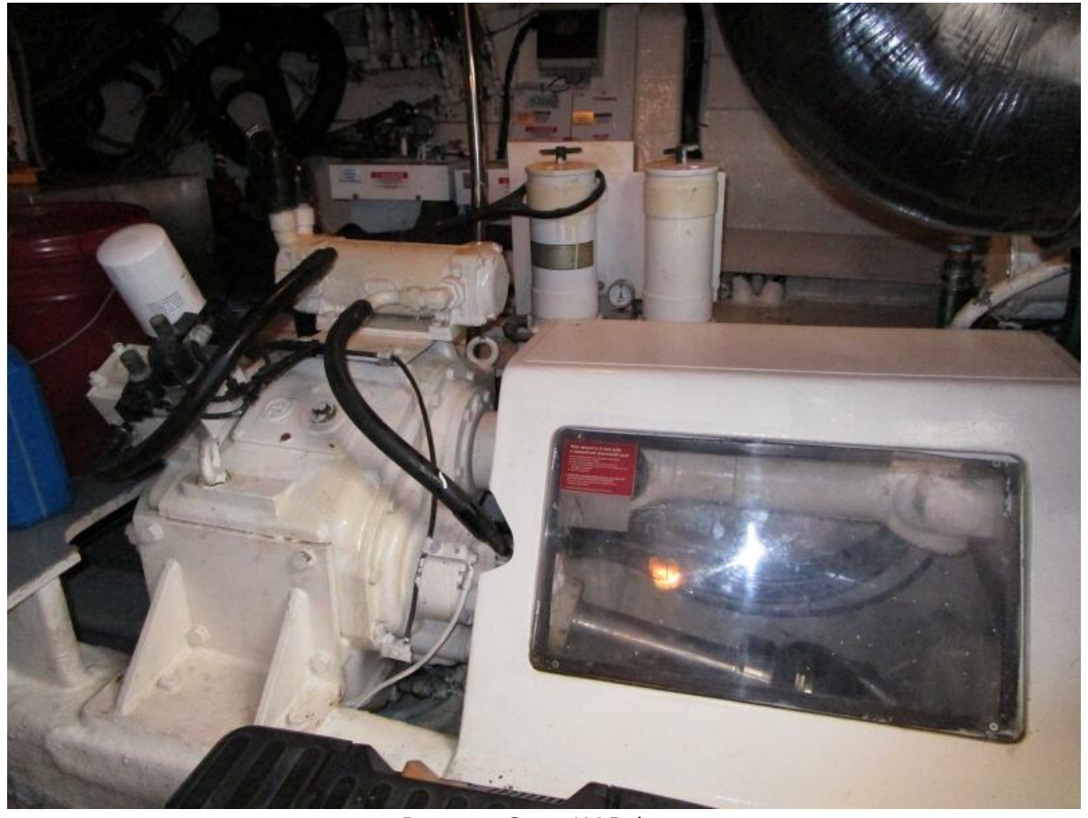
Reverse Gear / V Drive