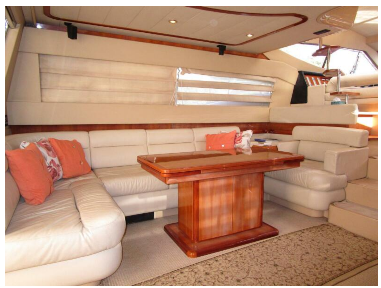
Salon Looking to Port