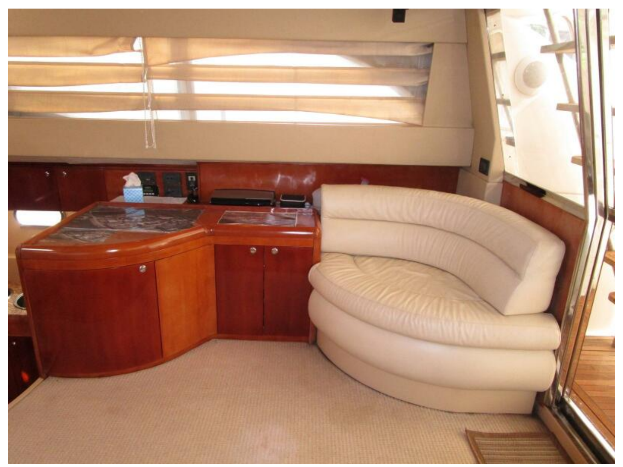
Salon Looking to Stbd.