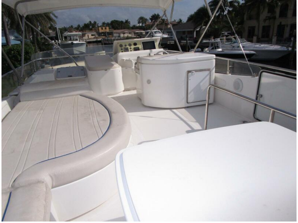
Flybridge Looking Fwd.