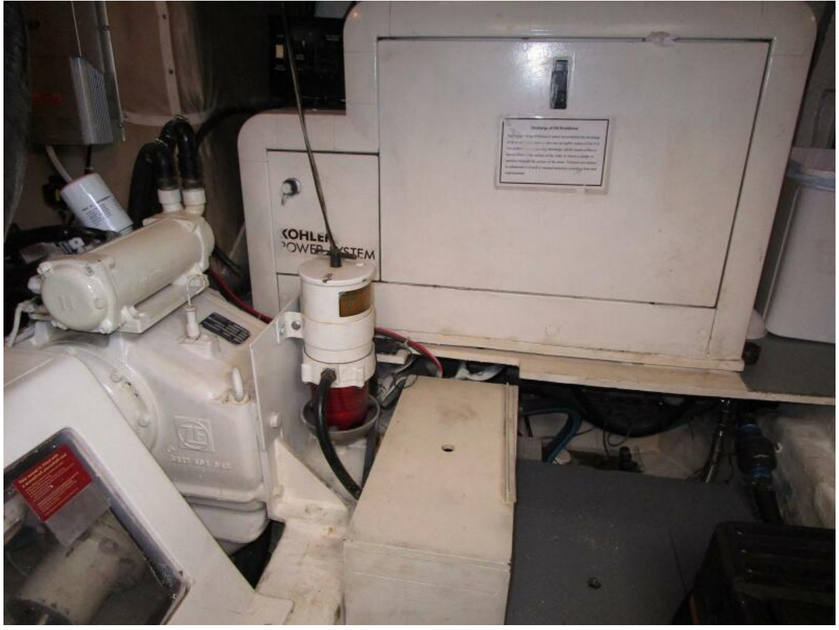
Engine Room Forward