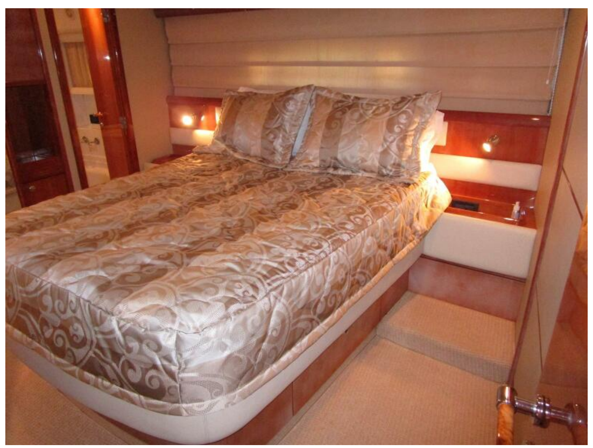
Master Looking Outboard