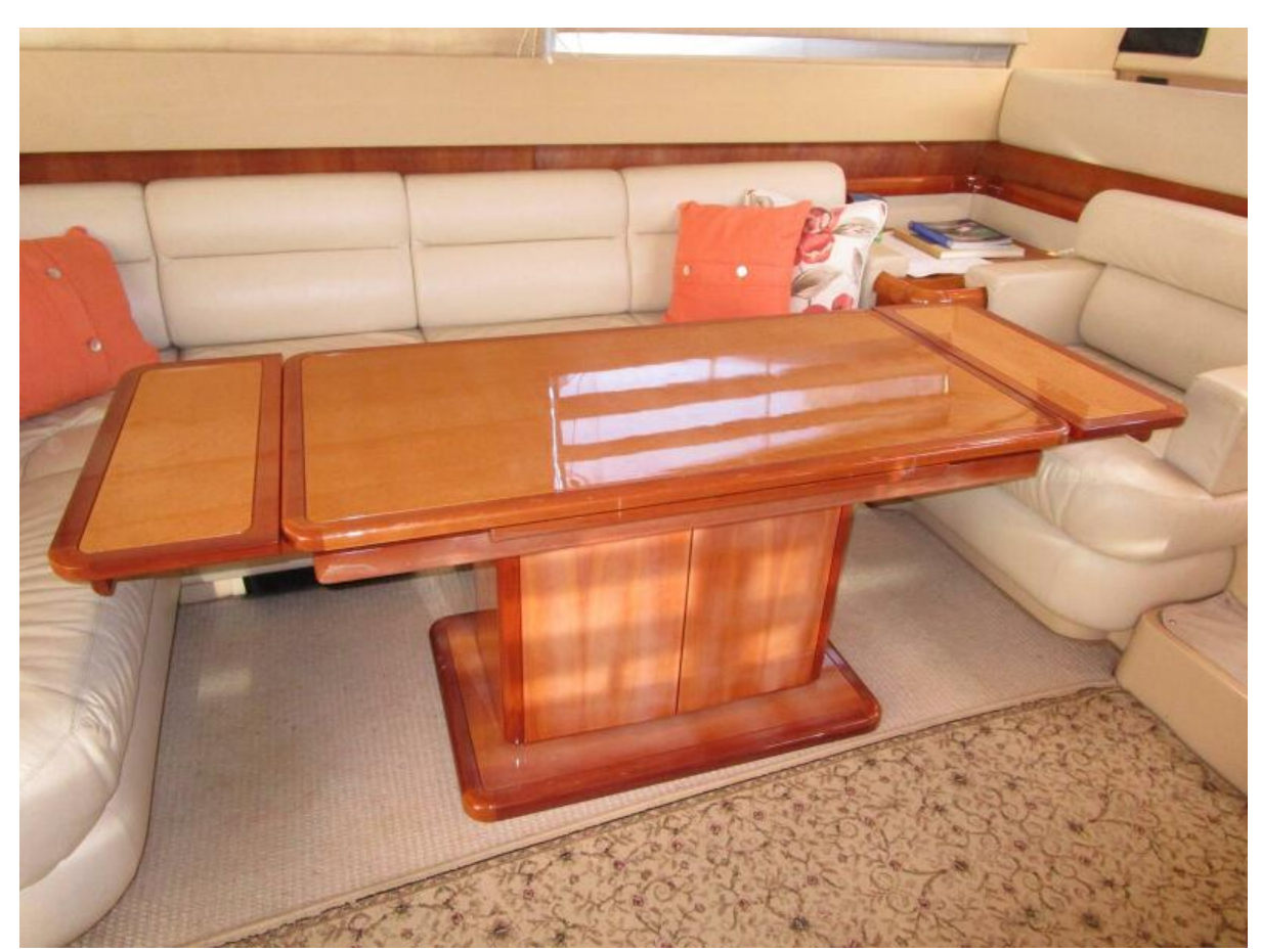
Salon Table Extended