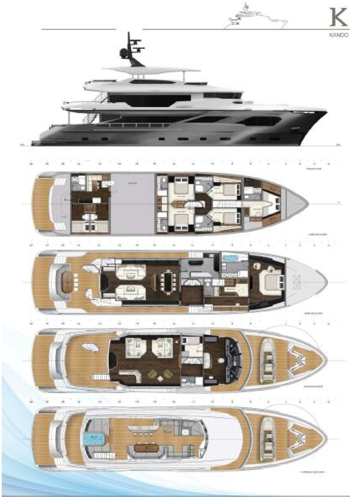
Kando 110 GA