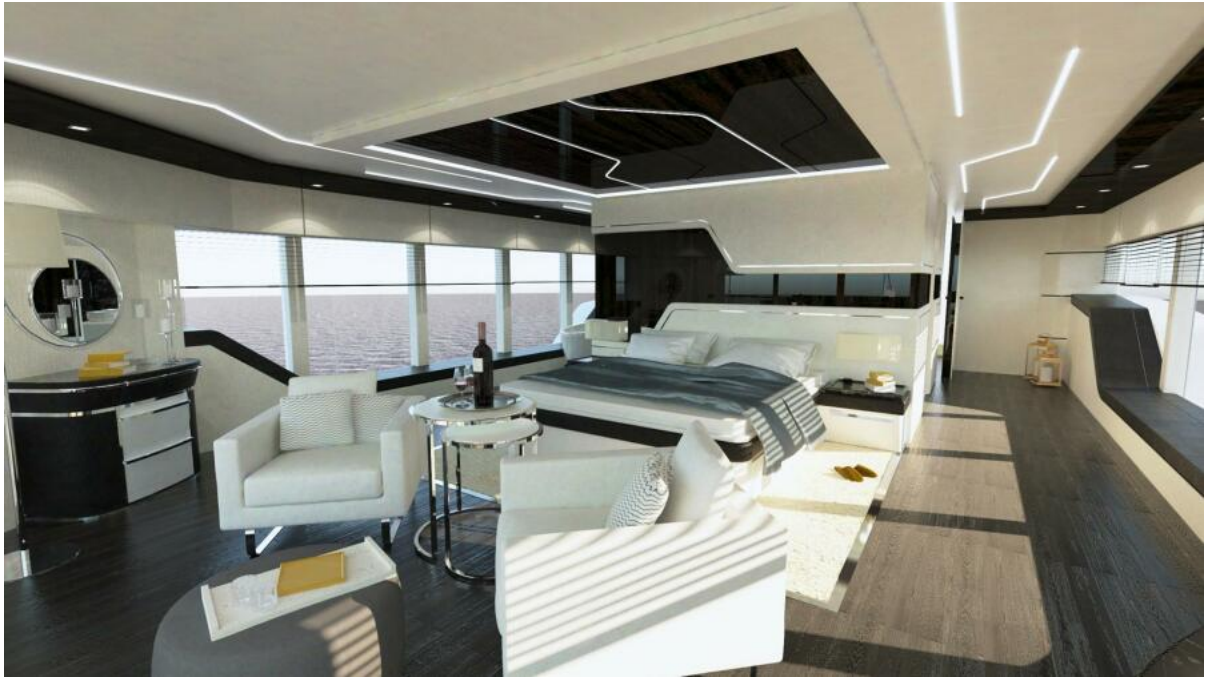
TP Upper Deck Master Cabin 62