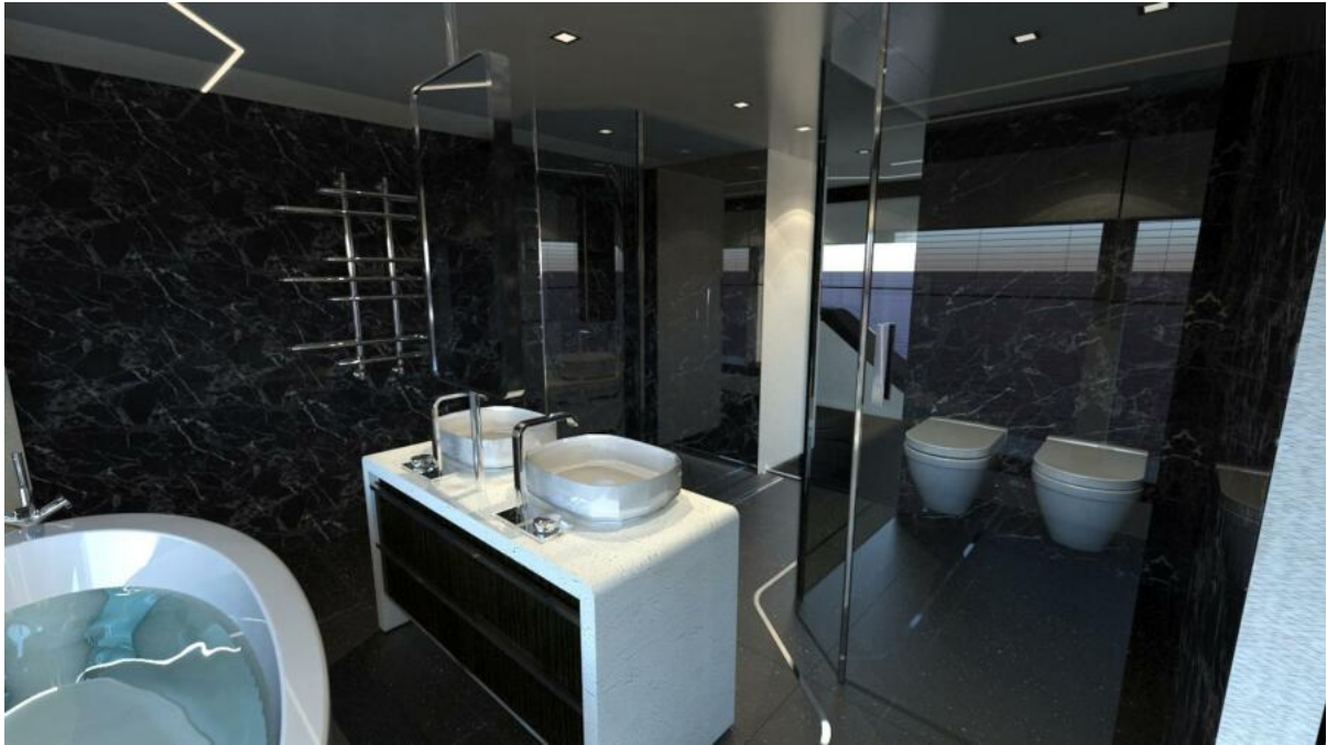
TP Upper Deck Master Cabin 37