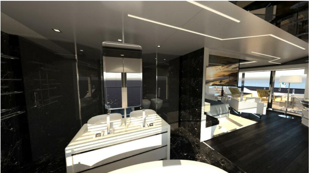
TP Upper Deck Master Cabin 30