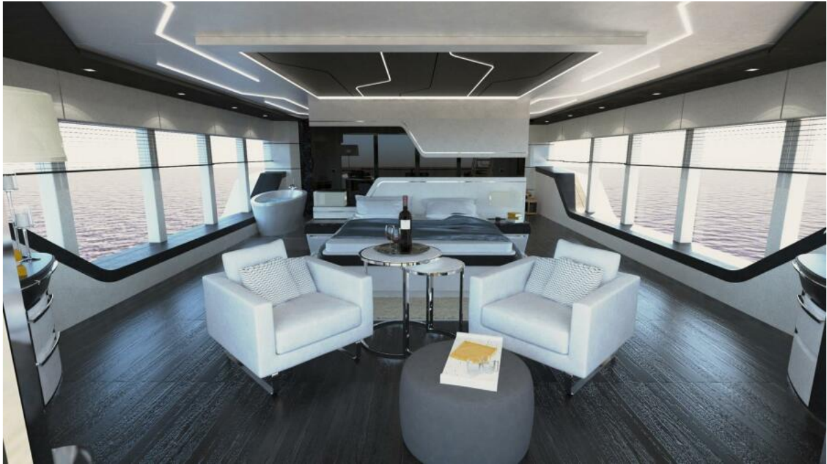
TP Upper Deck Master Cabin 56_1