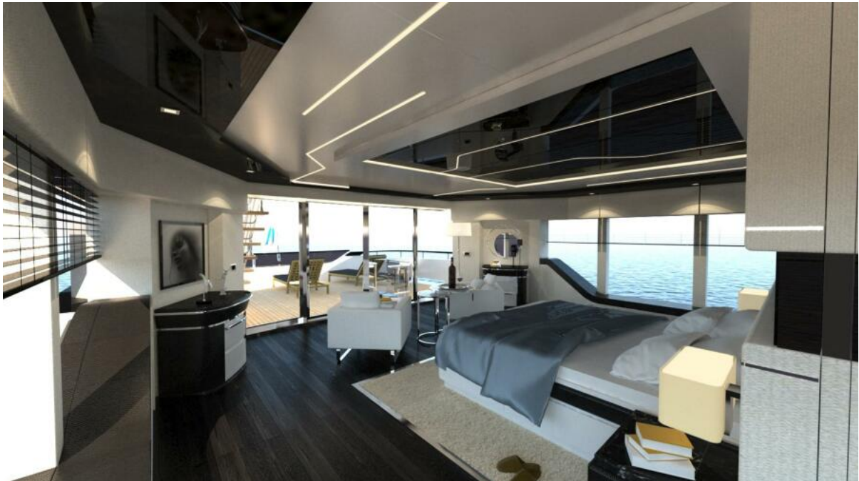
TP Upper Deck Master Cabin 32