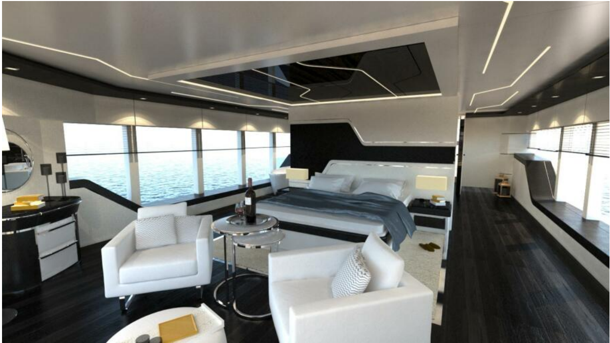
TP Upper Deck Master Cabin 31