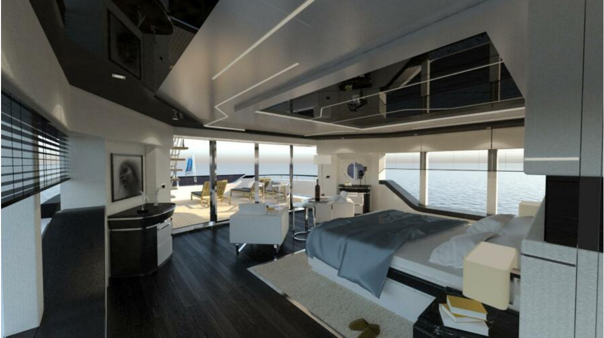
TP Upper Deck Master Cabin 29