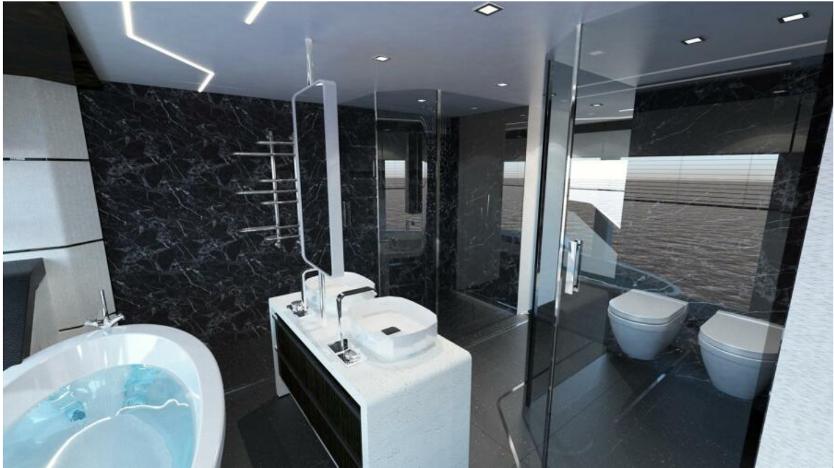
TP Upper Deck Master Cabin 58