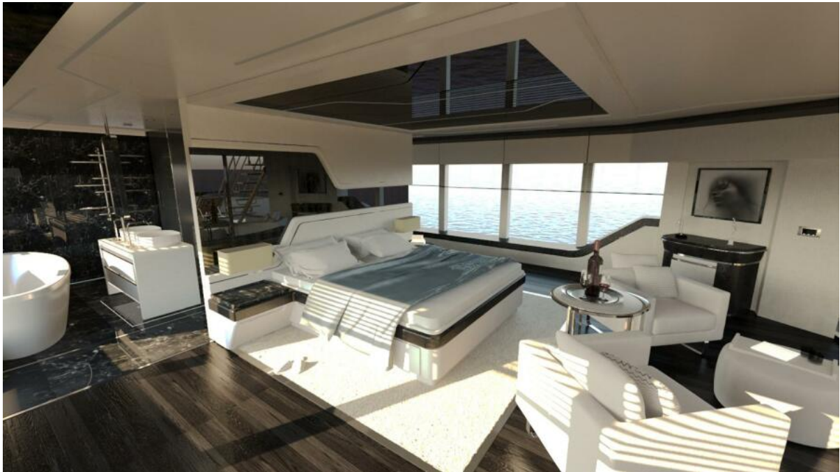
TP Upper Deck Master Cabin 17