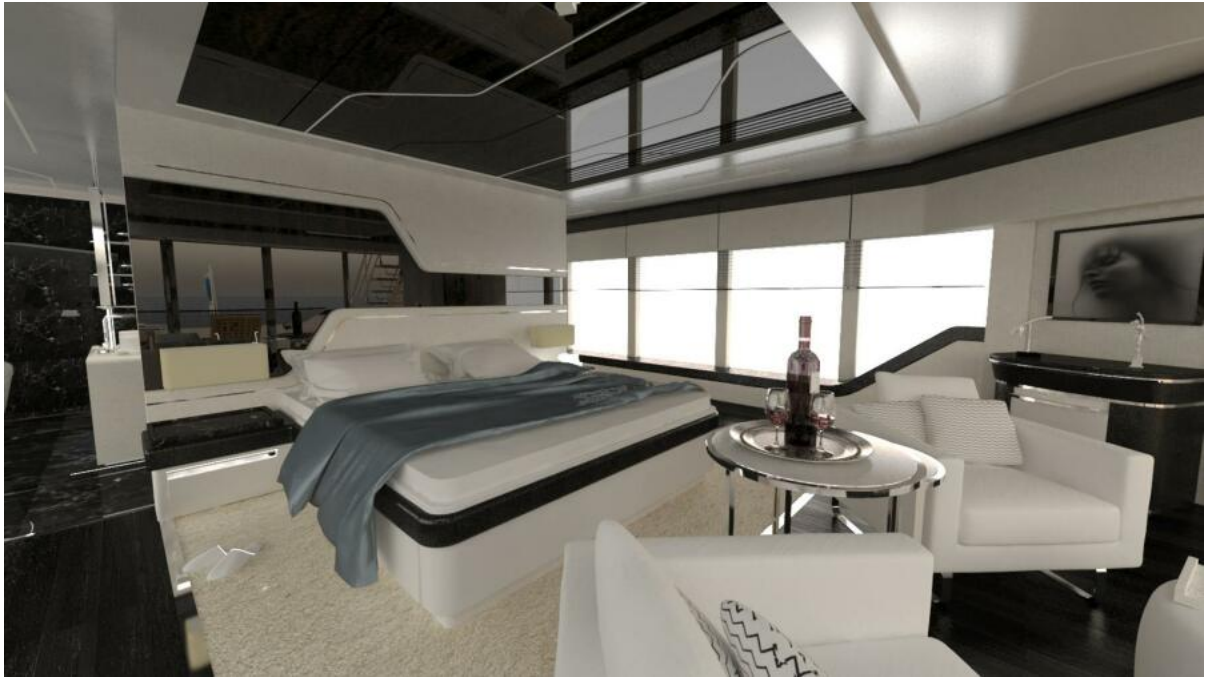
TP Upper Deck Master Cabin 14