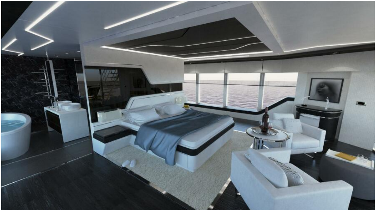
TP Upper Deck Master Cabin 57