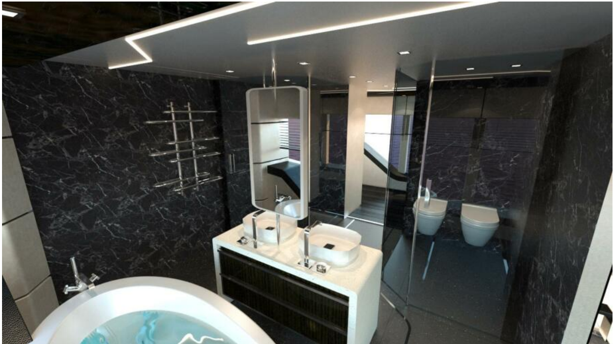
TP Upper Deck Master Cabin 39