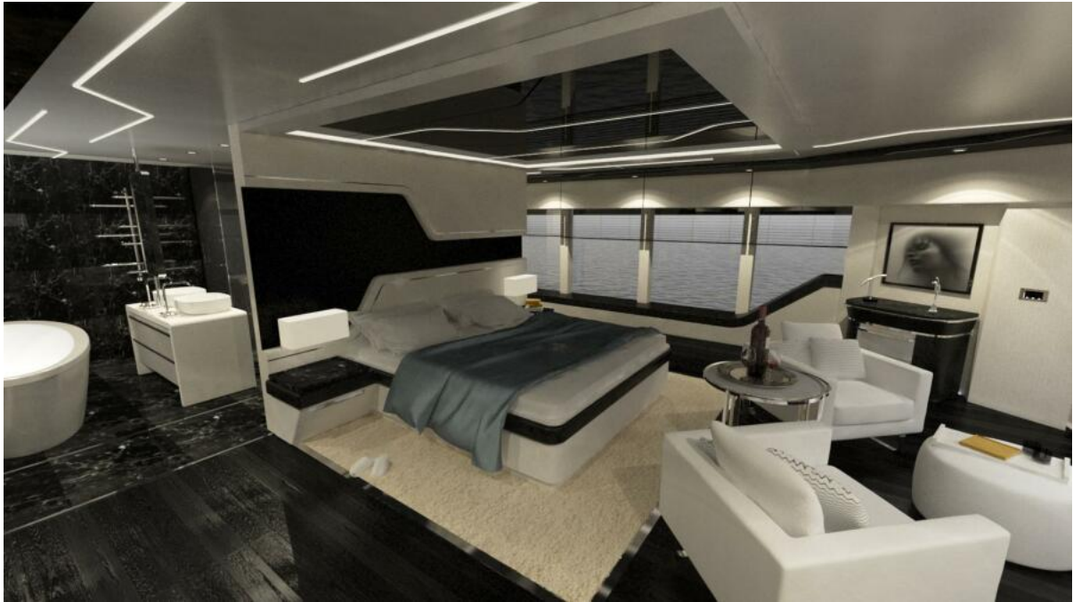
TP Upper Deck Master Cabin 25