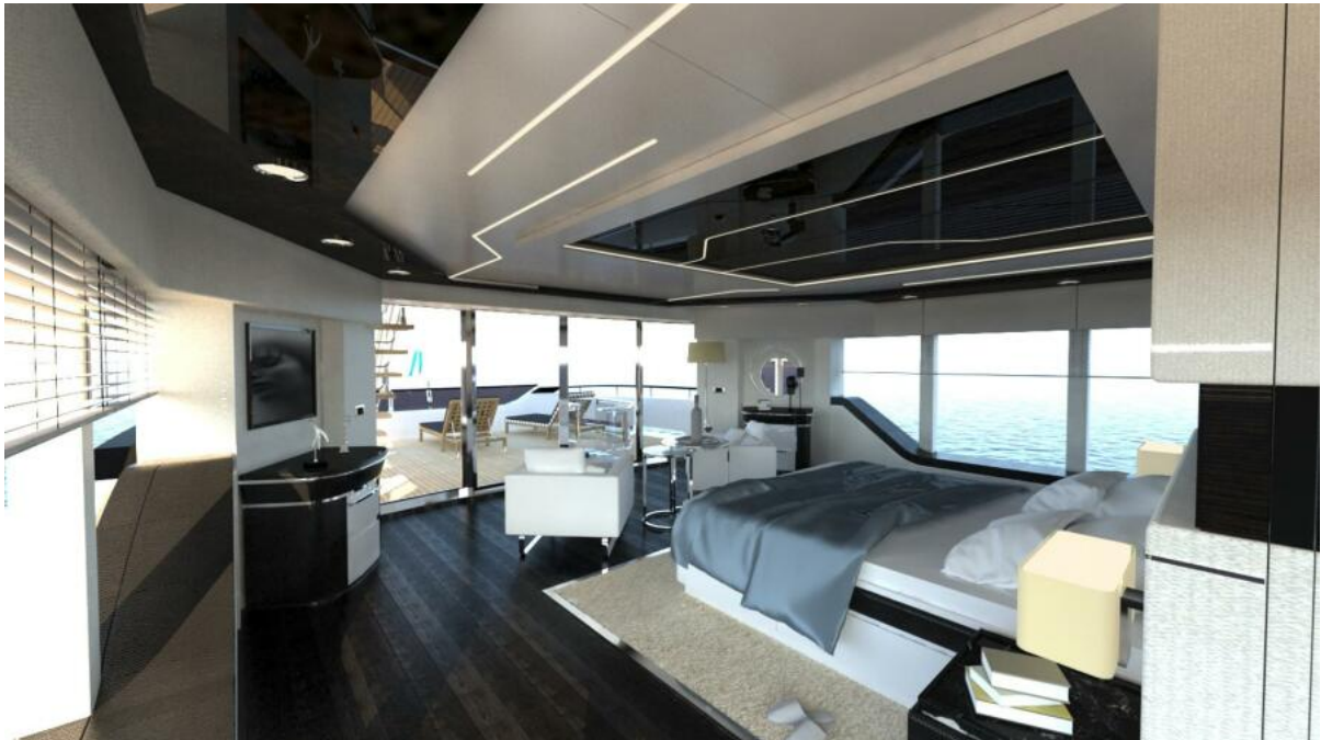
TP Upper Deck Master Cabin 07