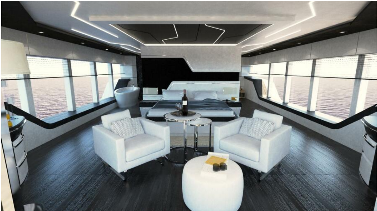
TP Upper Deck Master Cabin 54