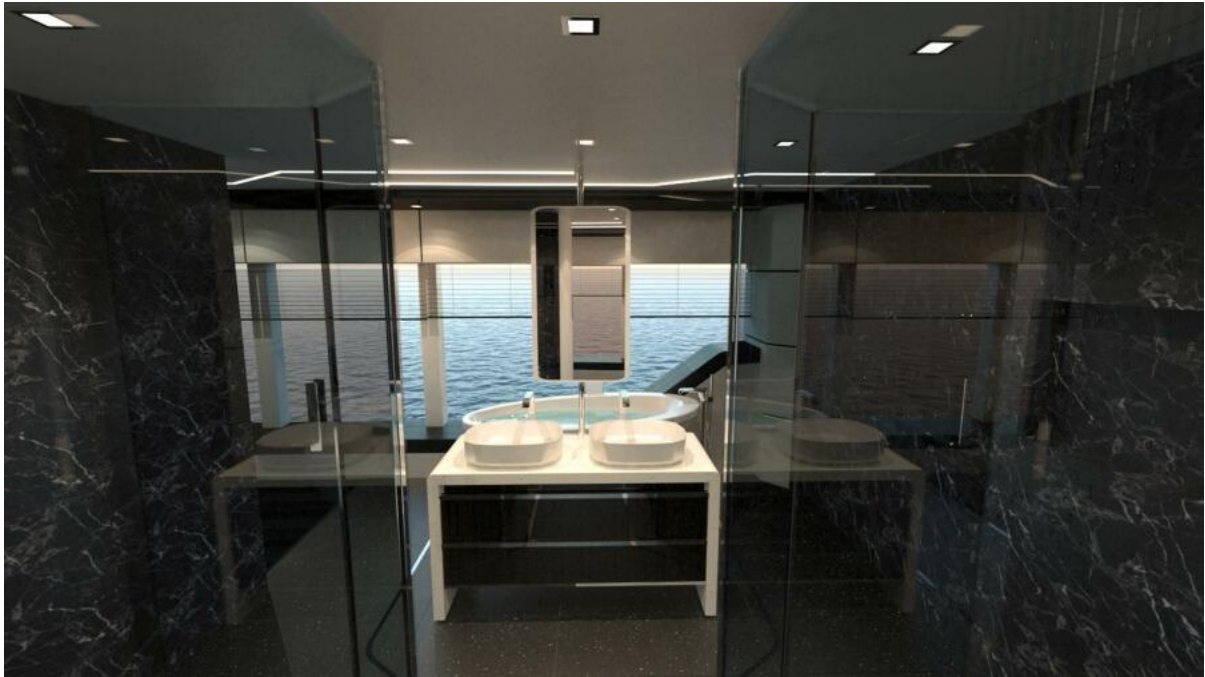
TP Upper Deck Master Cabin 41