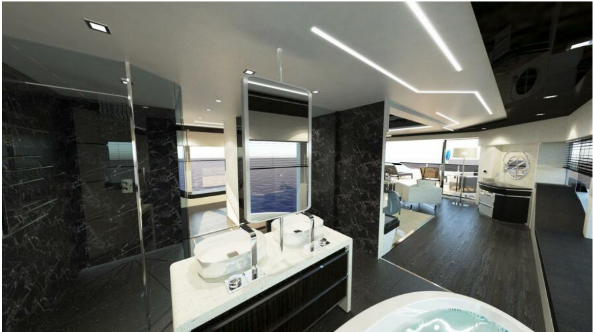
TP Upper Deck Master Cabin 63