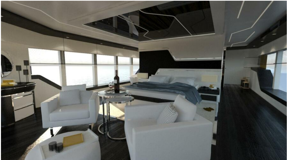
TP Upper Deck Master Cabin 28