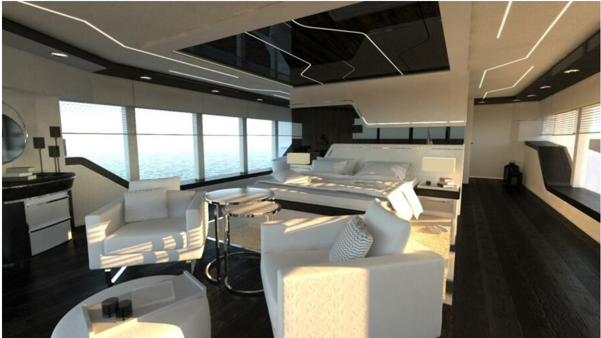
TP Upper Deck Master Cabin 02