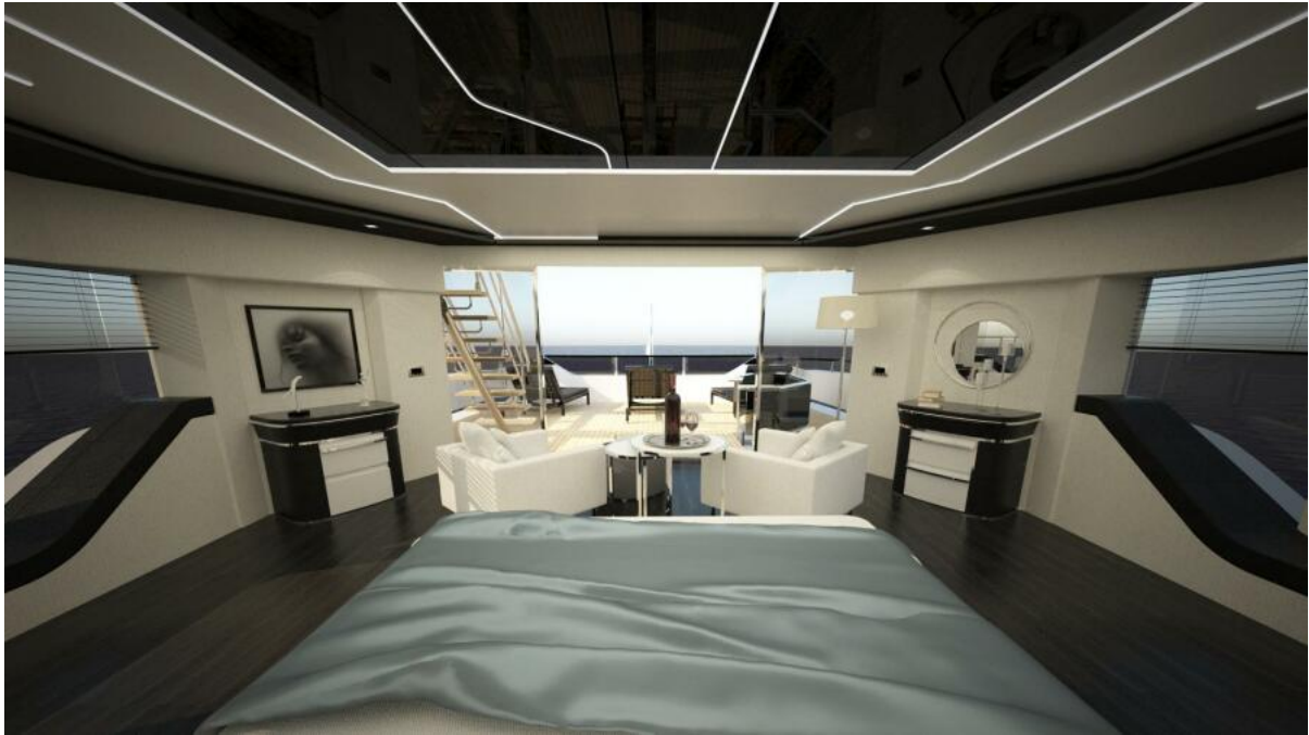
TP Upper Deck Master Cabin 64_1