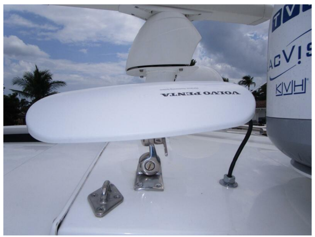
Volvo Dynamic Positioning