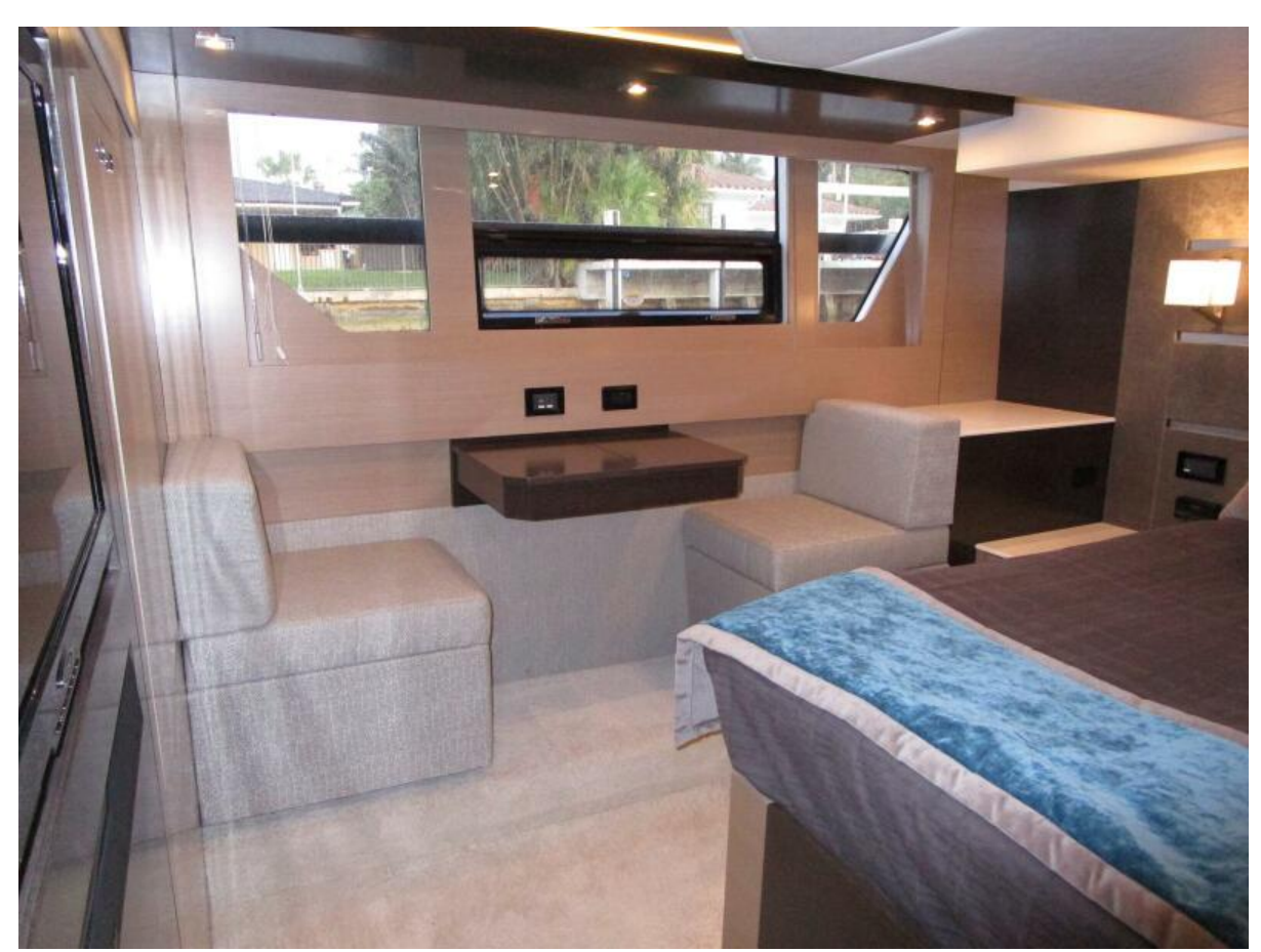
Stbd. Side Seating