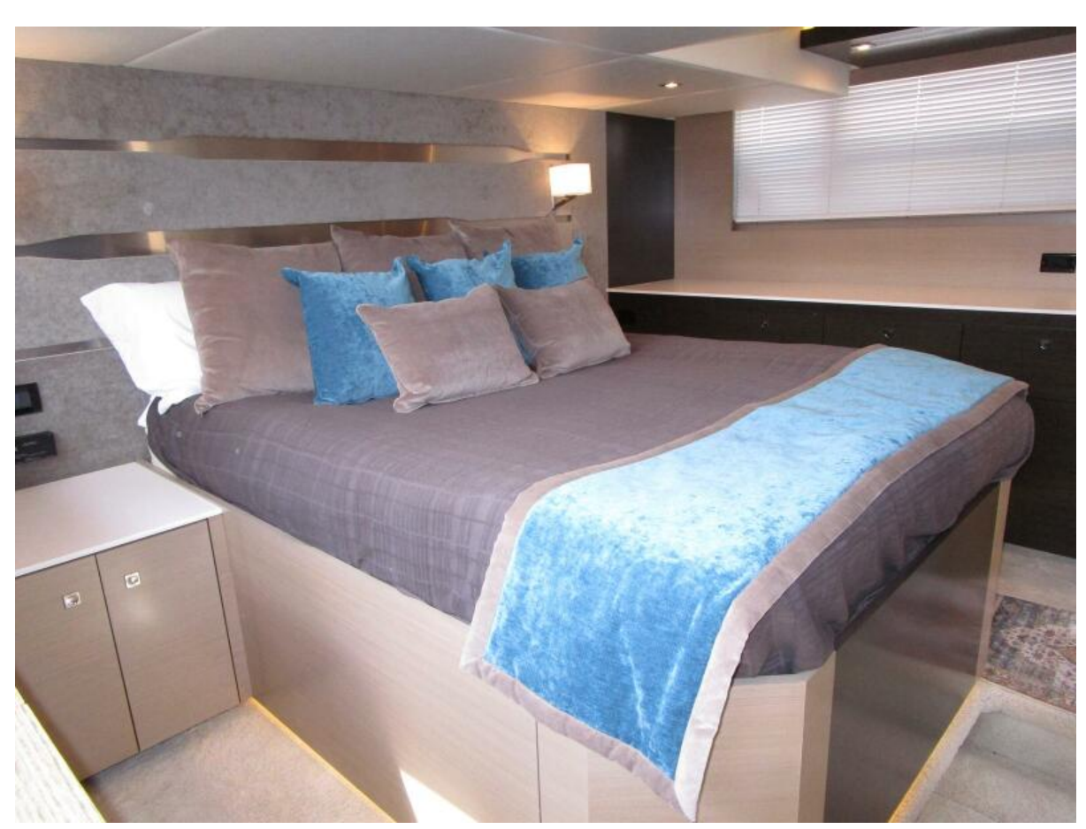
Master Cabin Looking to Port