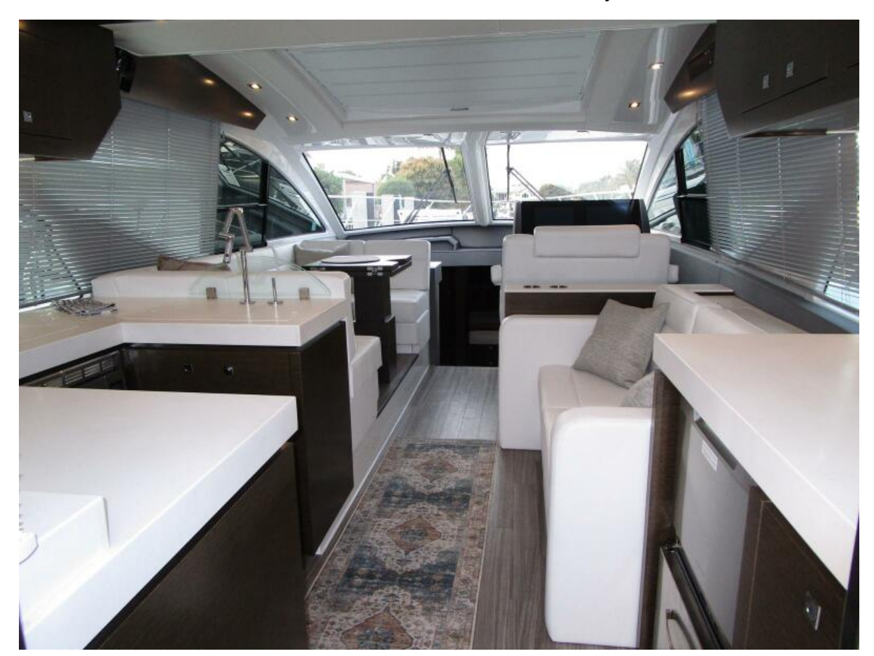
Salon Galley Looking Forward