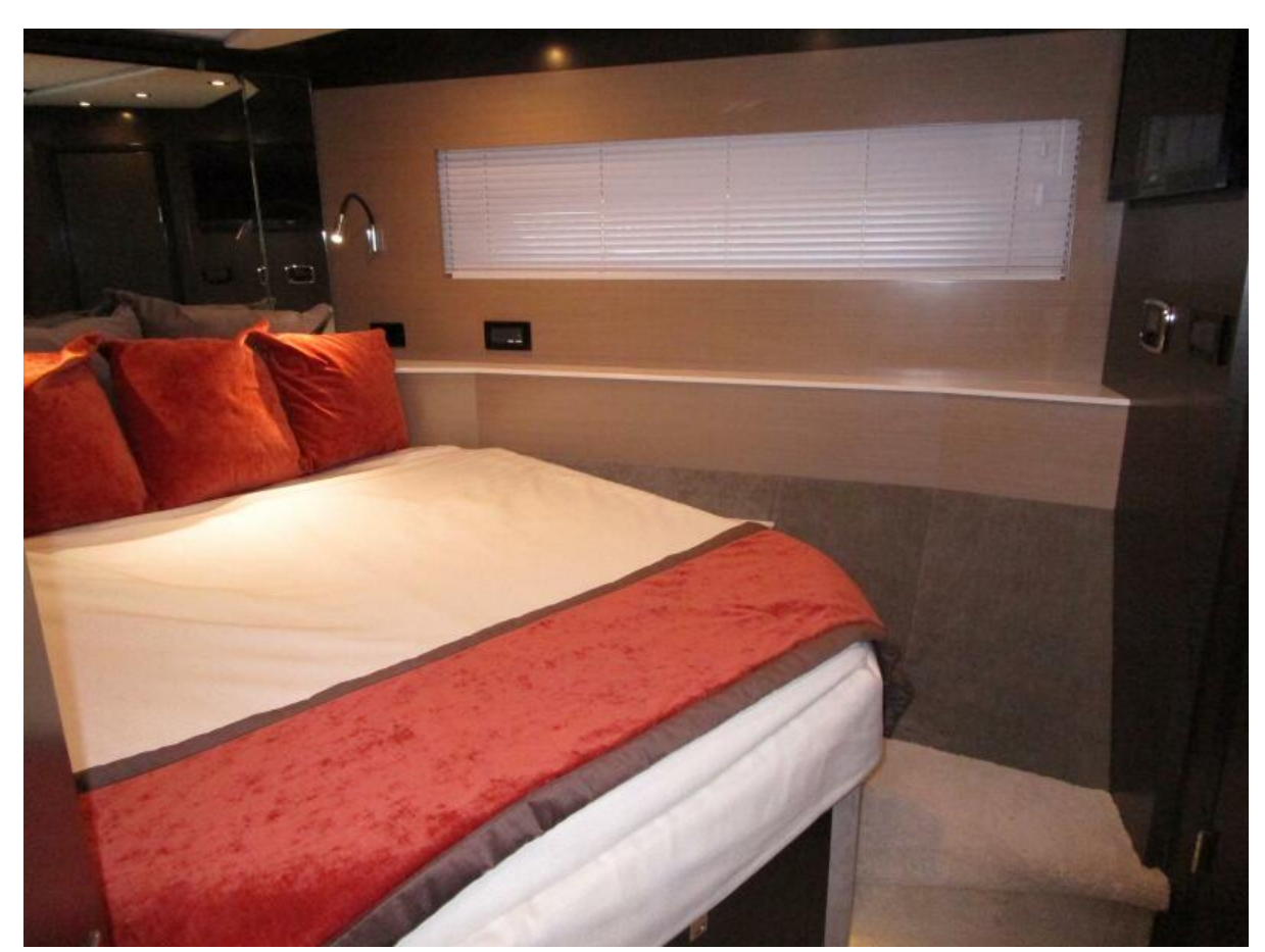
VIP to Stbd.