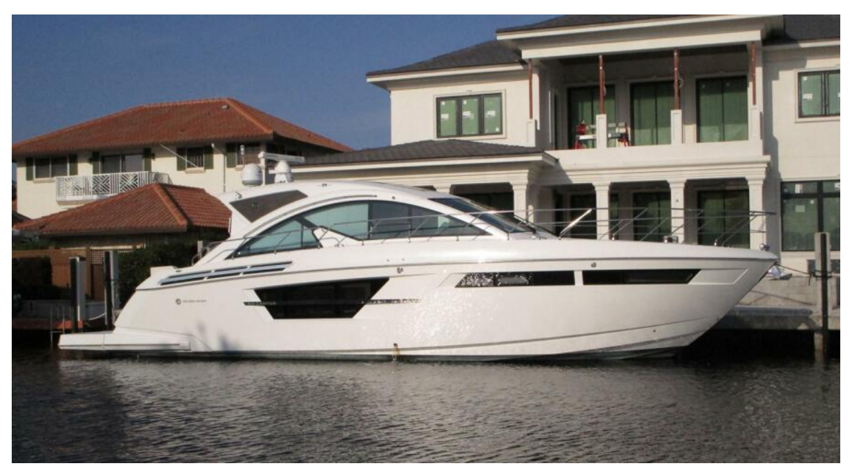
Profile 54' Cruisers Yachts 2017 ADDI J