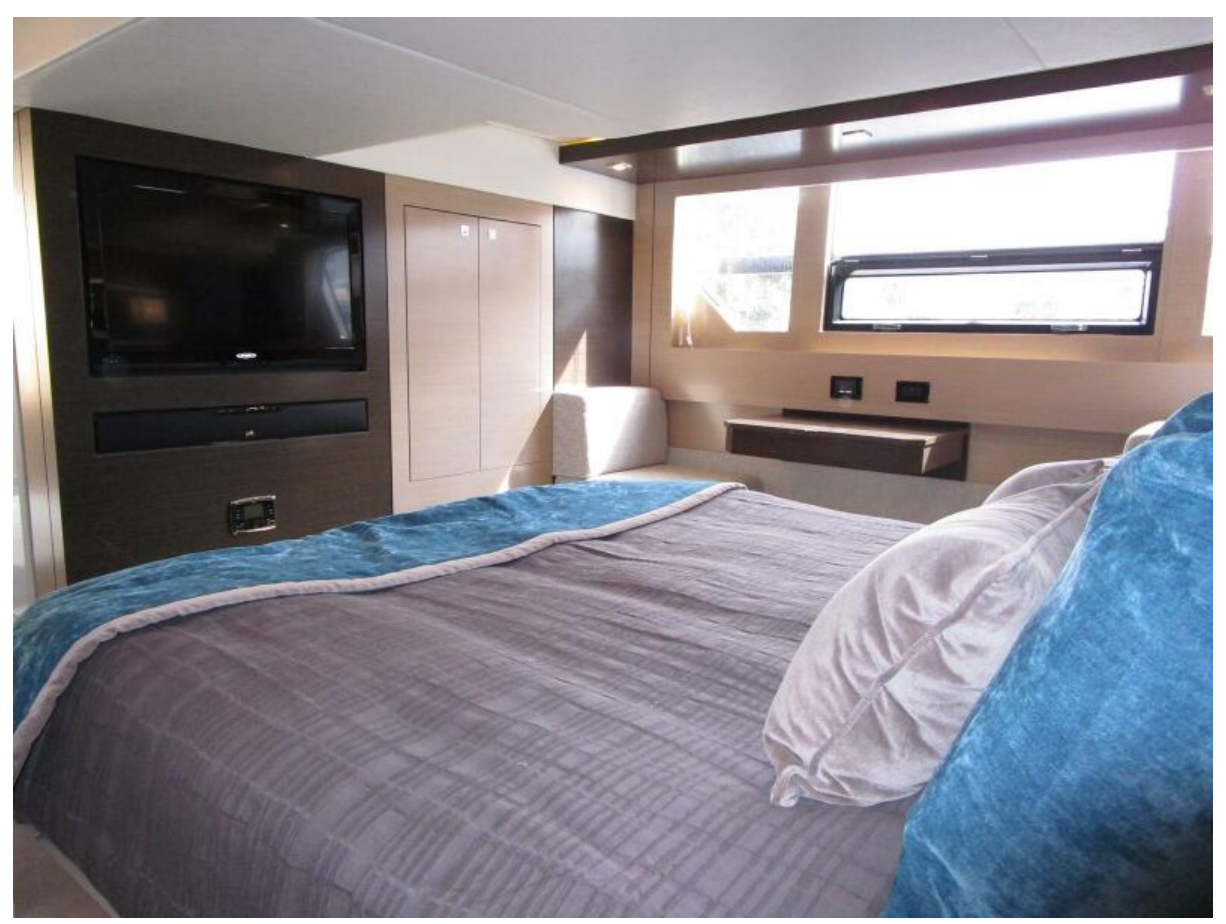
Master Cabin Looking to Starboard