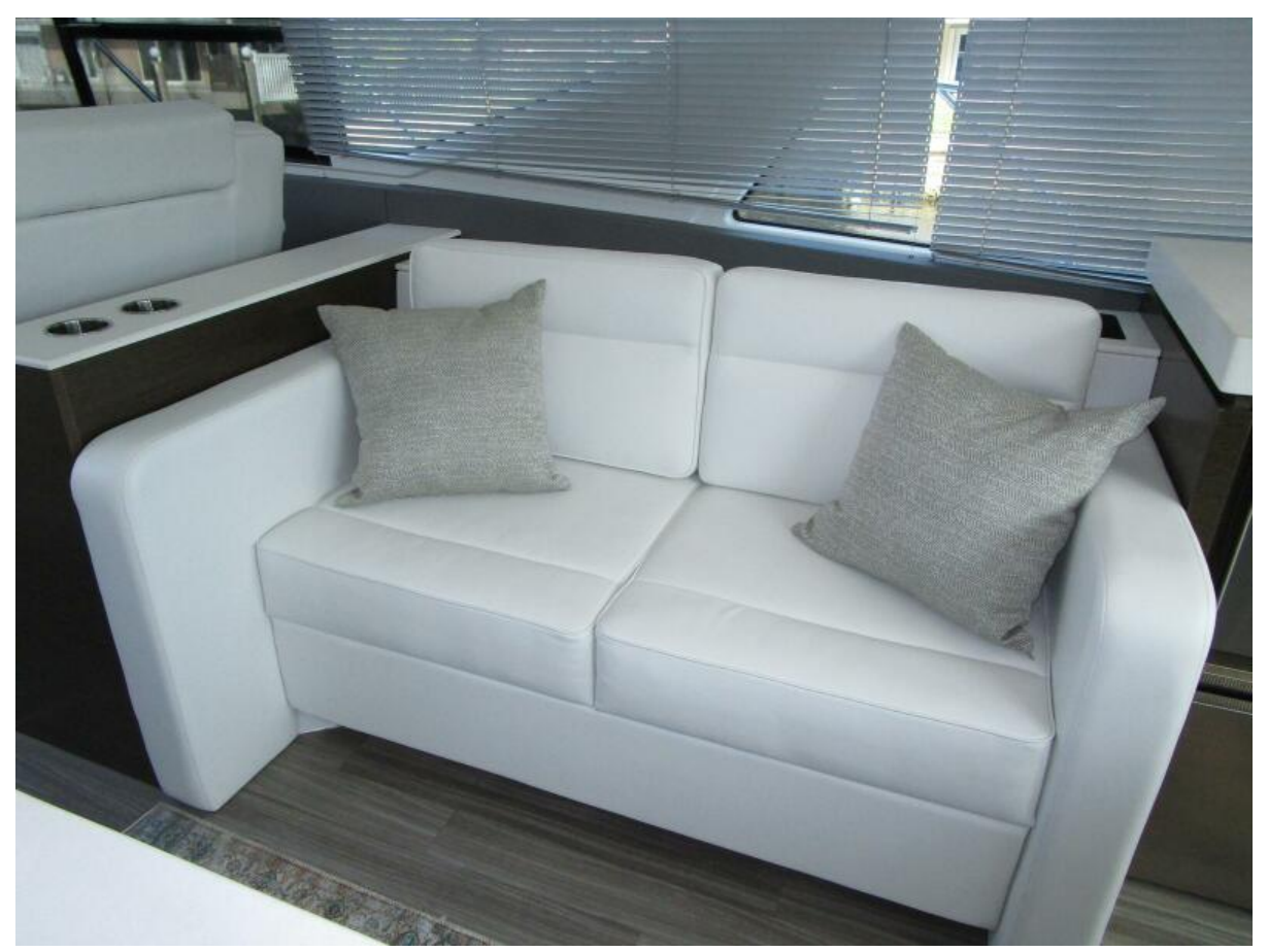
Stbd. Side Loveseat