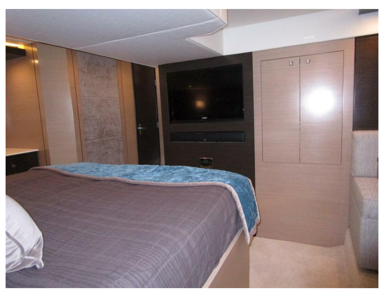
Master Cabin Looking Forward