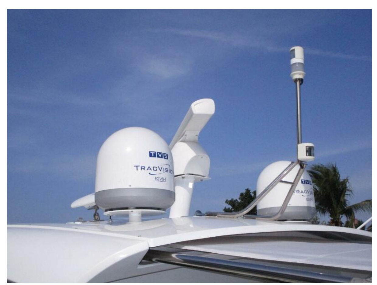
Hard Top Equipment