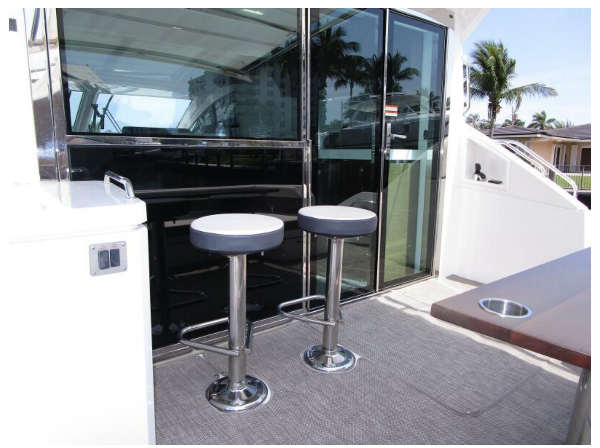
Optional Bar Stools