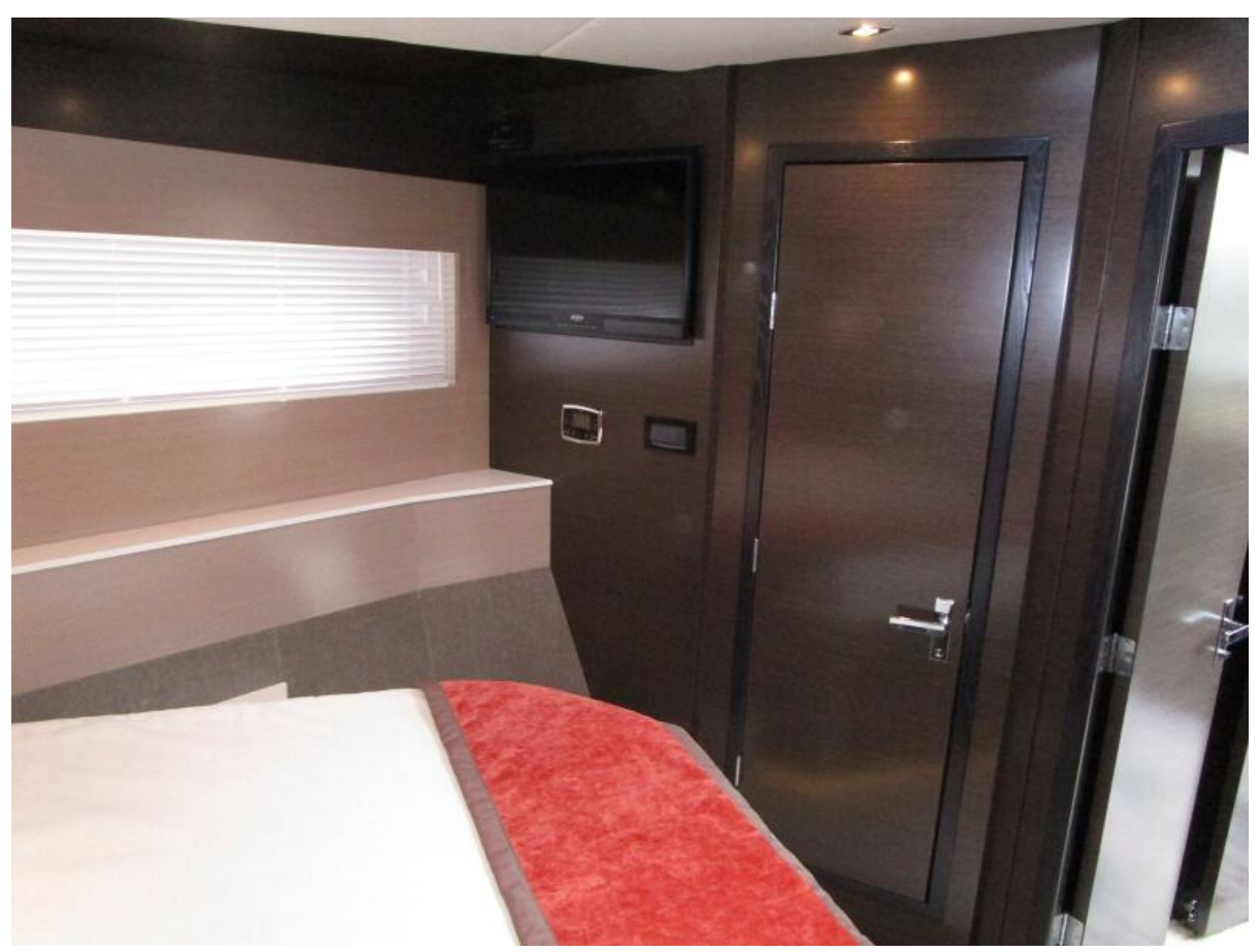
VIP Starboard Aft