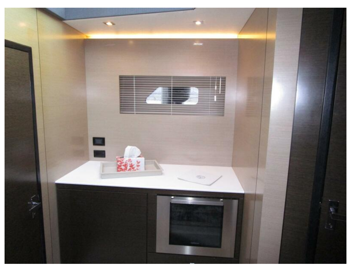
Wine Cooler in Atrium