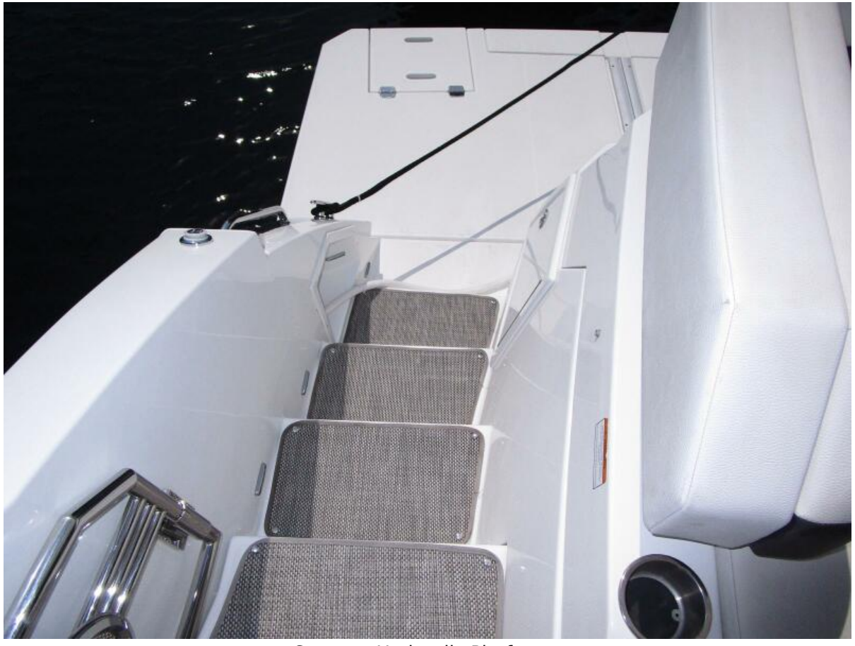
Steps to Hydraulic Platform