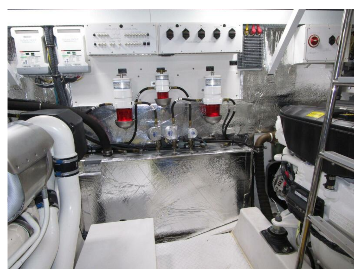
Engine Room Looking Forward