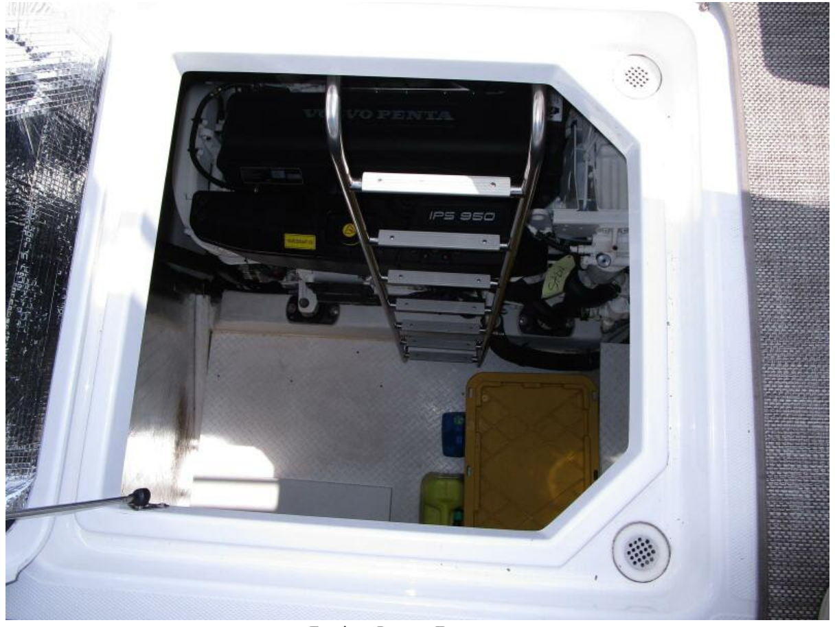
Engine Room Entrance