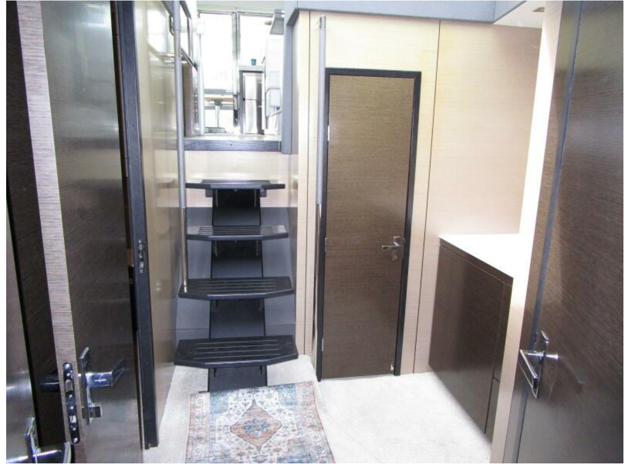
Steps to Below