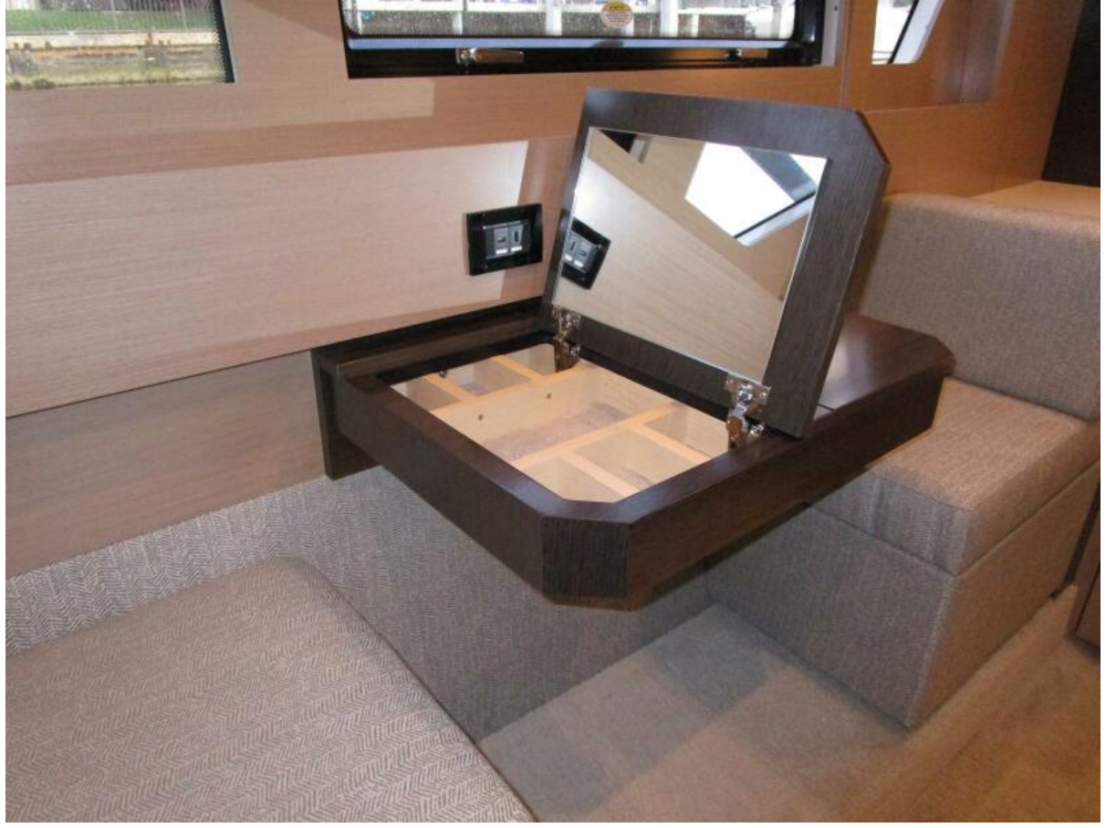
Stbd. Side Vanity