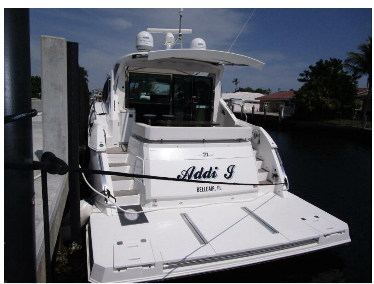
Wide Hydraulic Platform