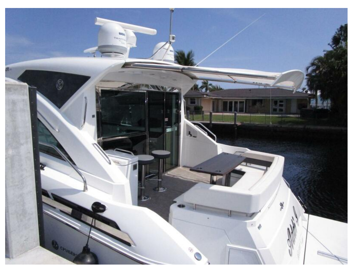
Aft Deck Profile