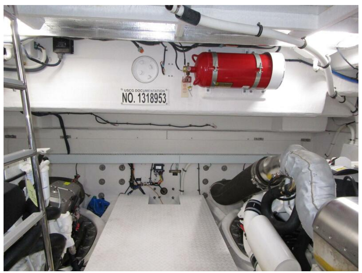
Engine Room Looking Aft