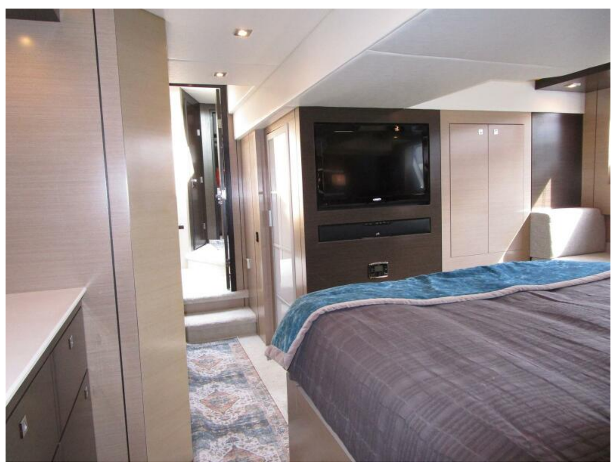
Master Cabin Entry