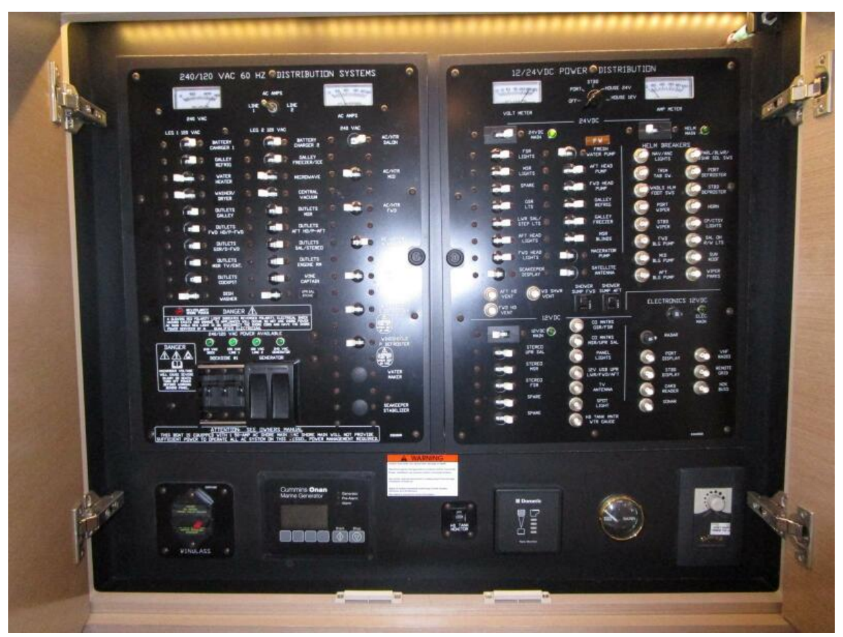
Bunk Room Electrical Panel