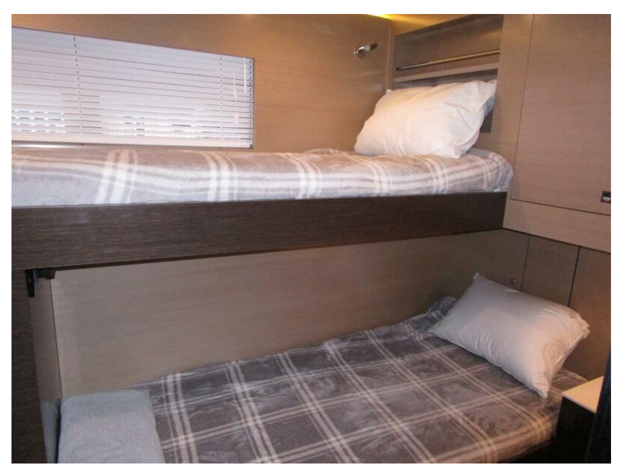
Stbd. Side Bunk Room