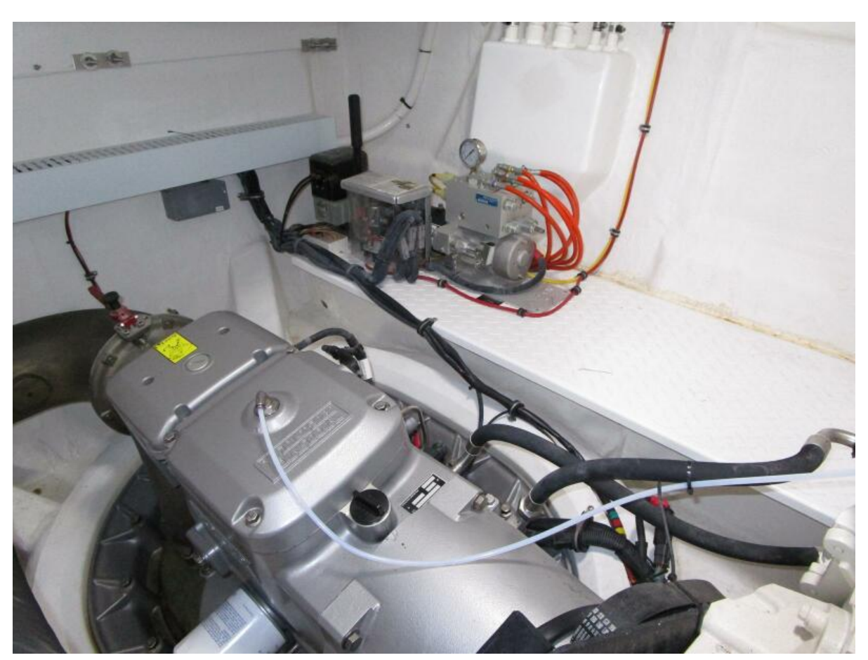
Swim Platform GHC Mechanism