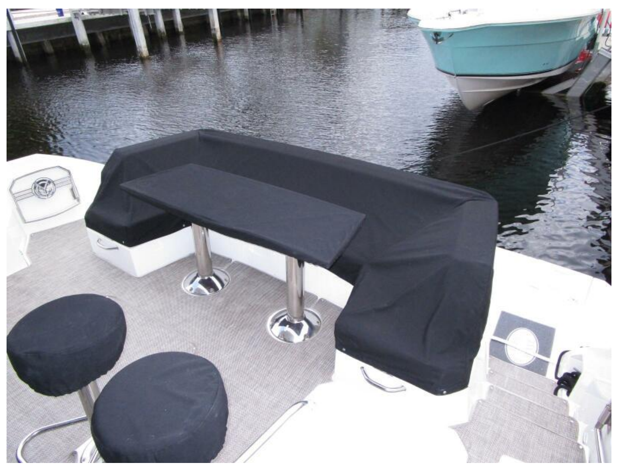
Covers for All