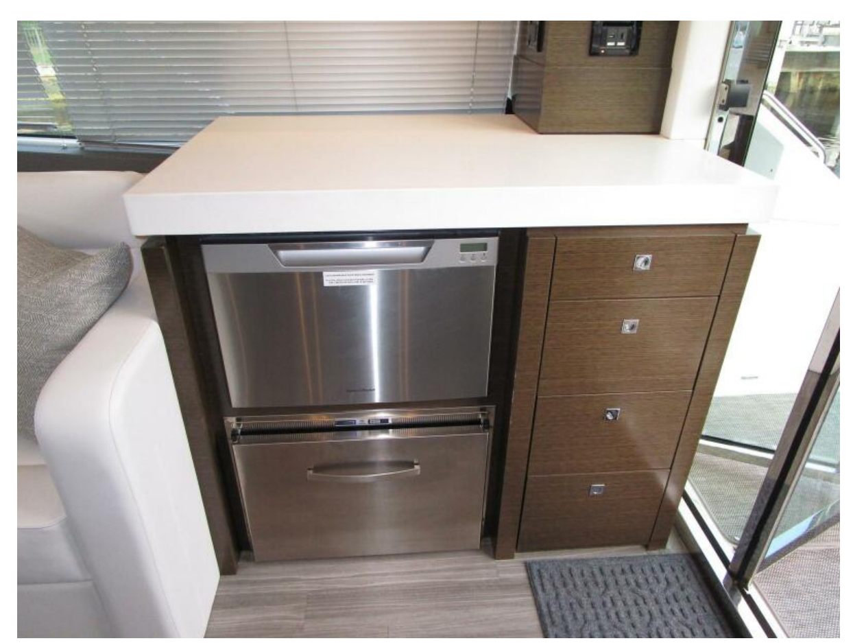
Galley to Stbd.