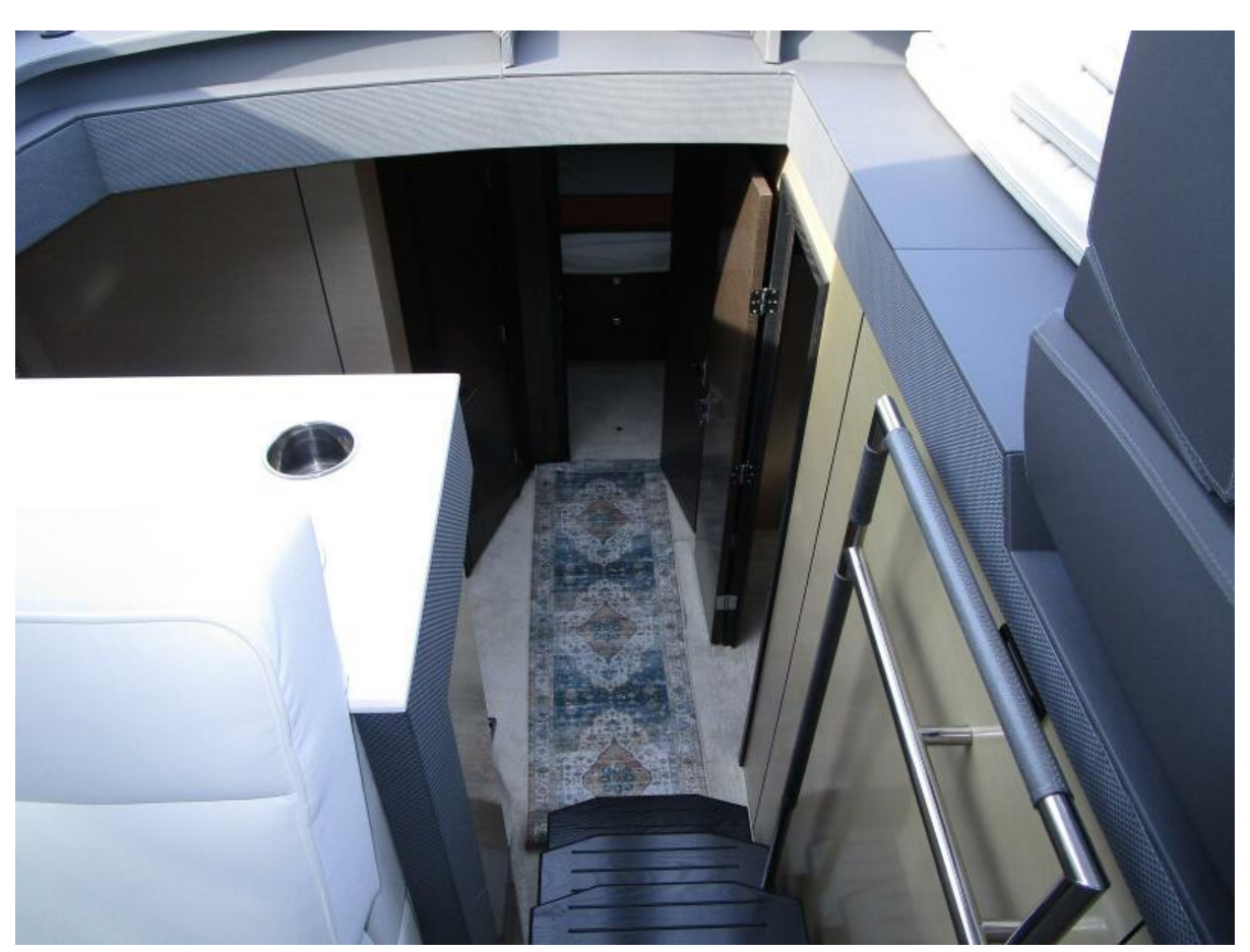
Atrium Area Looking Forward