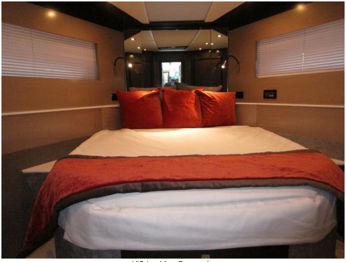
VIP Looking Forward