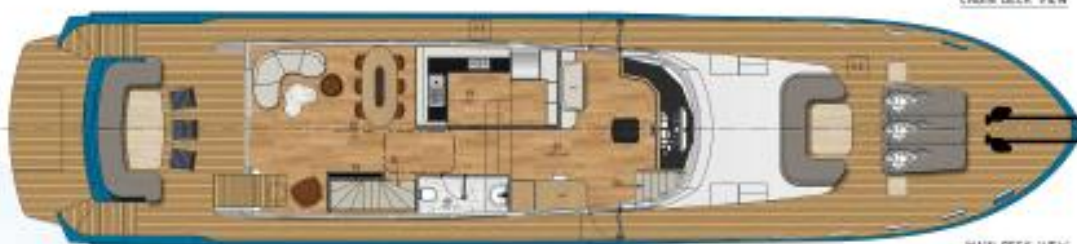
MAIN DECK VIEW