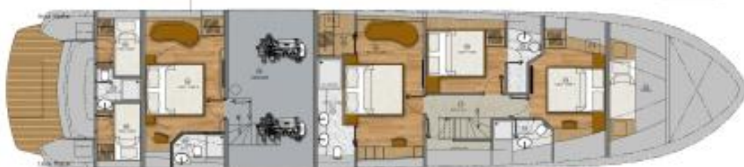
CABIN DECK VIEW