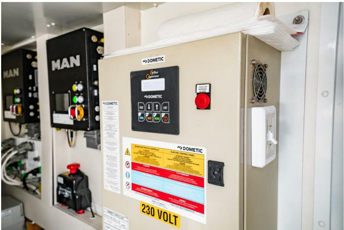
Ahead of Stbd. Engine