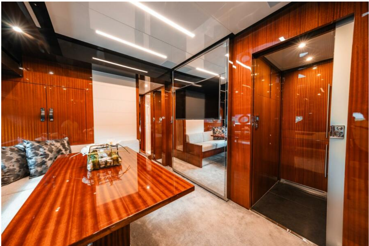
Salon Looking Inboard