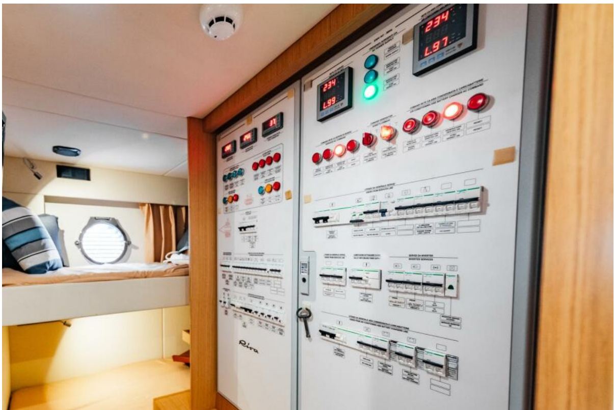
Crew Electrical Panel