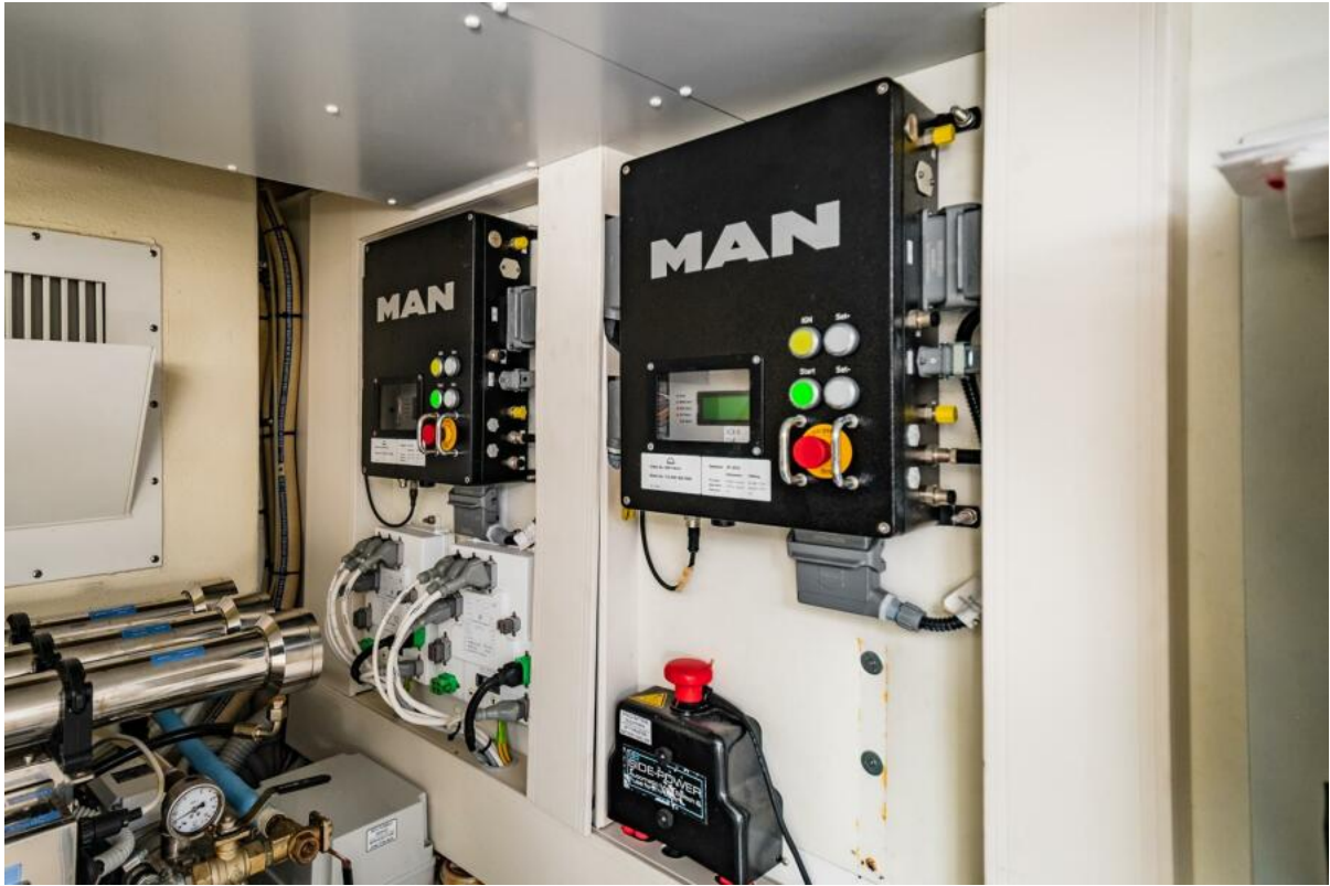
Ahead of Port Engine