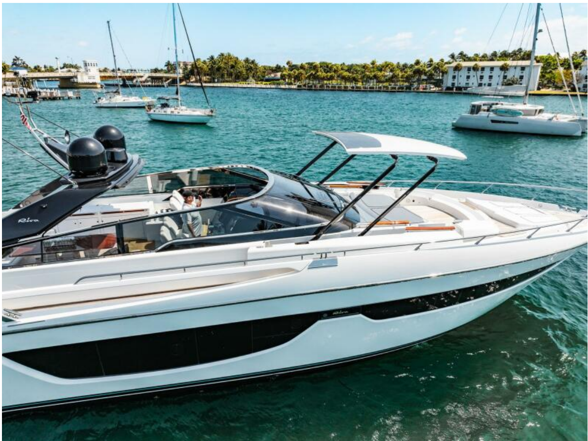
C-Top in Operation