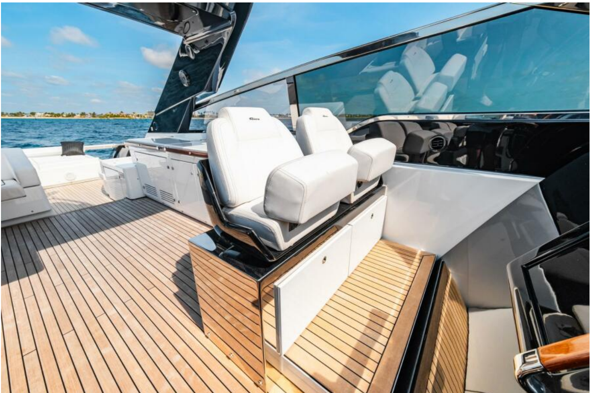
Helm Area to Port