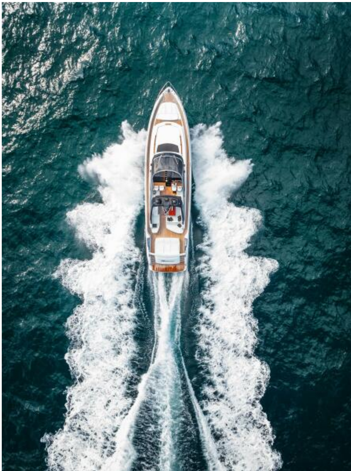
Overhead at Speed