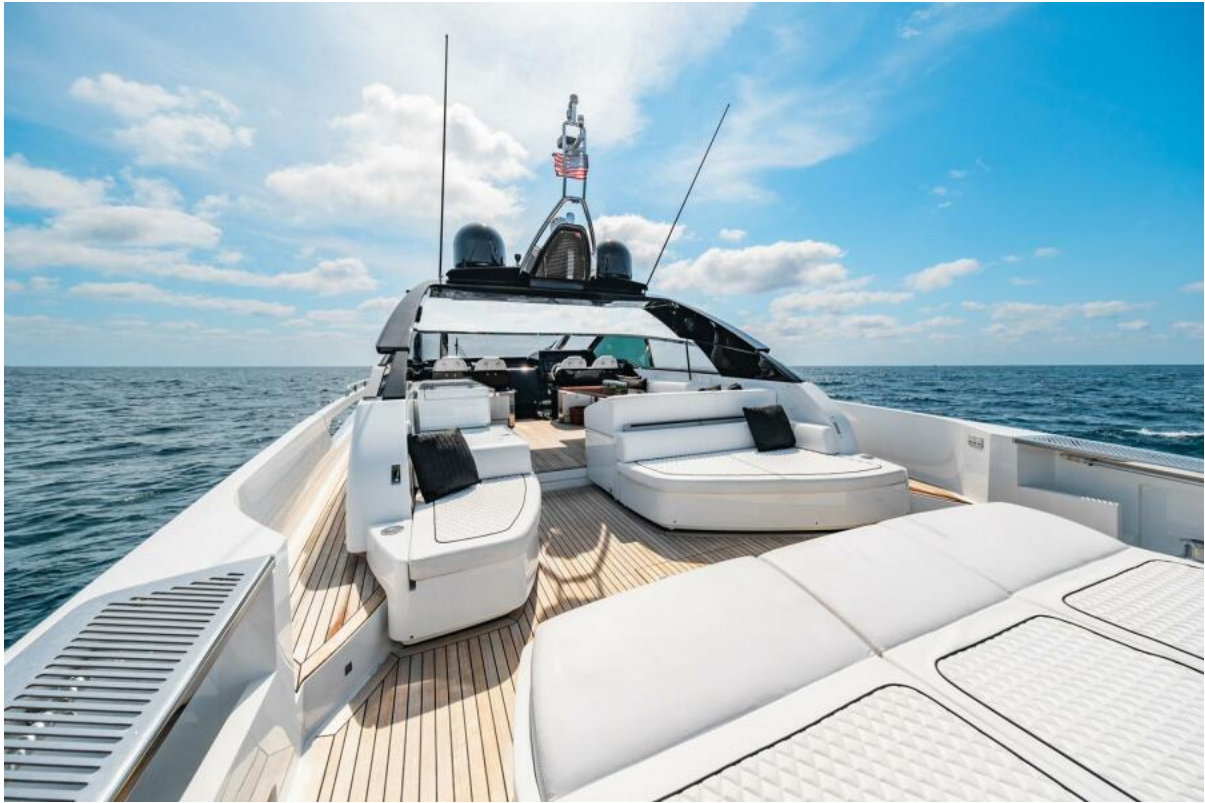
Ample Aft Sun Area