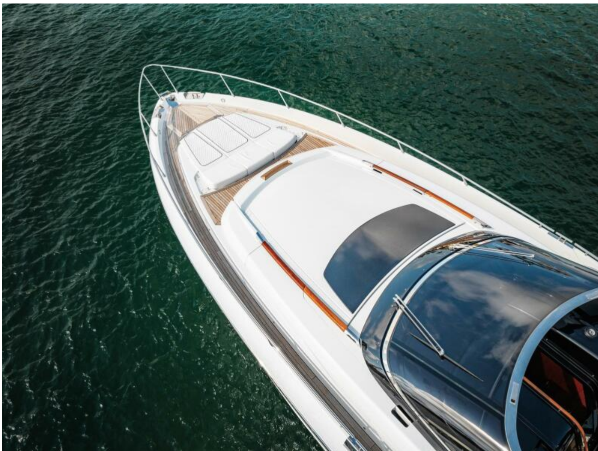
Bow Seating with C-Top Down