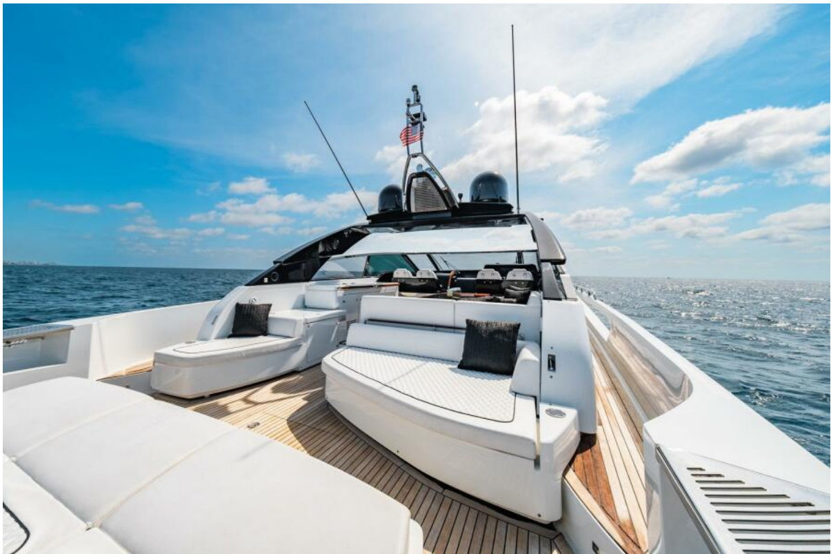
Aft Sun Lounges