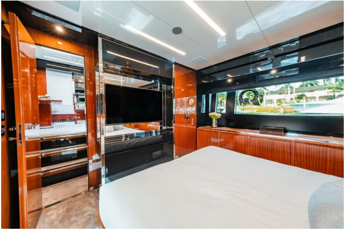
Master Looking Forward