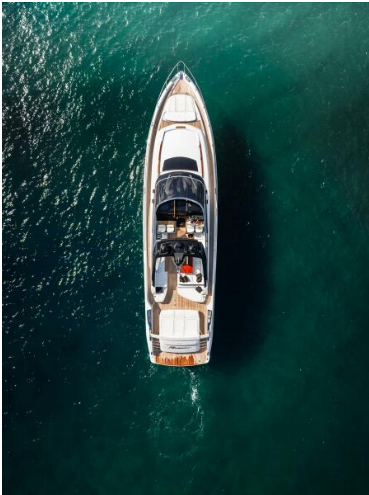
Overhead at Rest