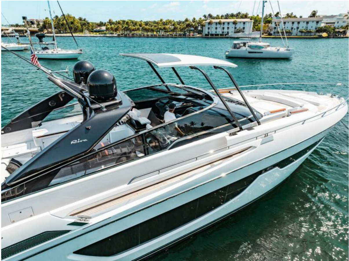
C-Top in Operation