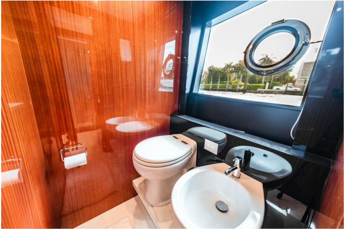
Master Head Looking Aft