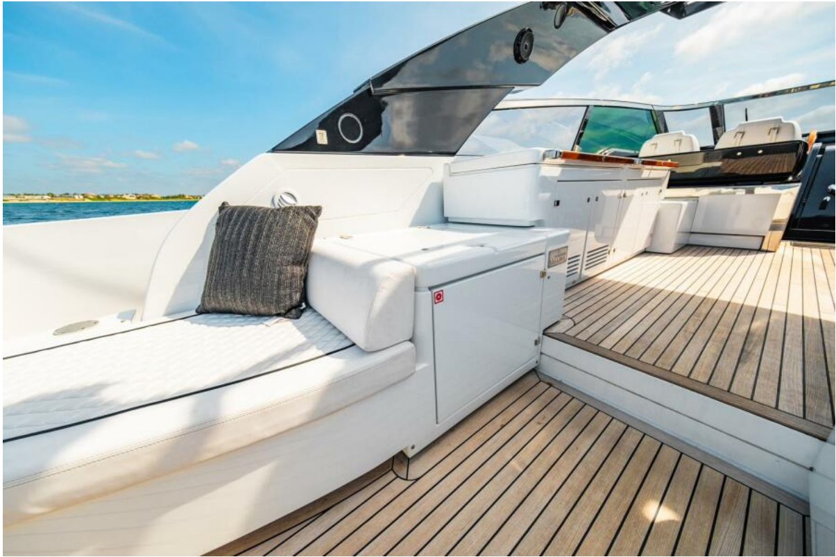
Stbd. Side Seating