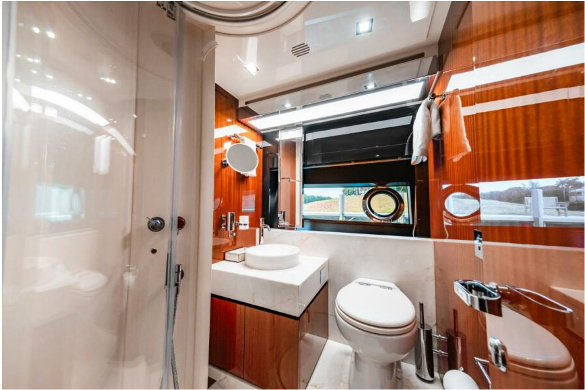
Mid Guest/Day Head