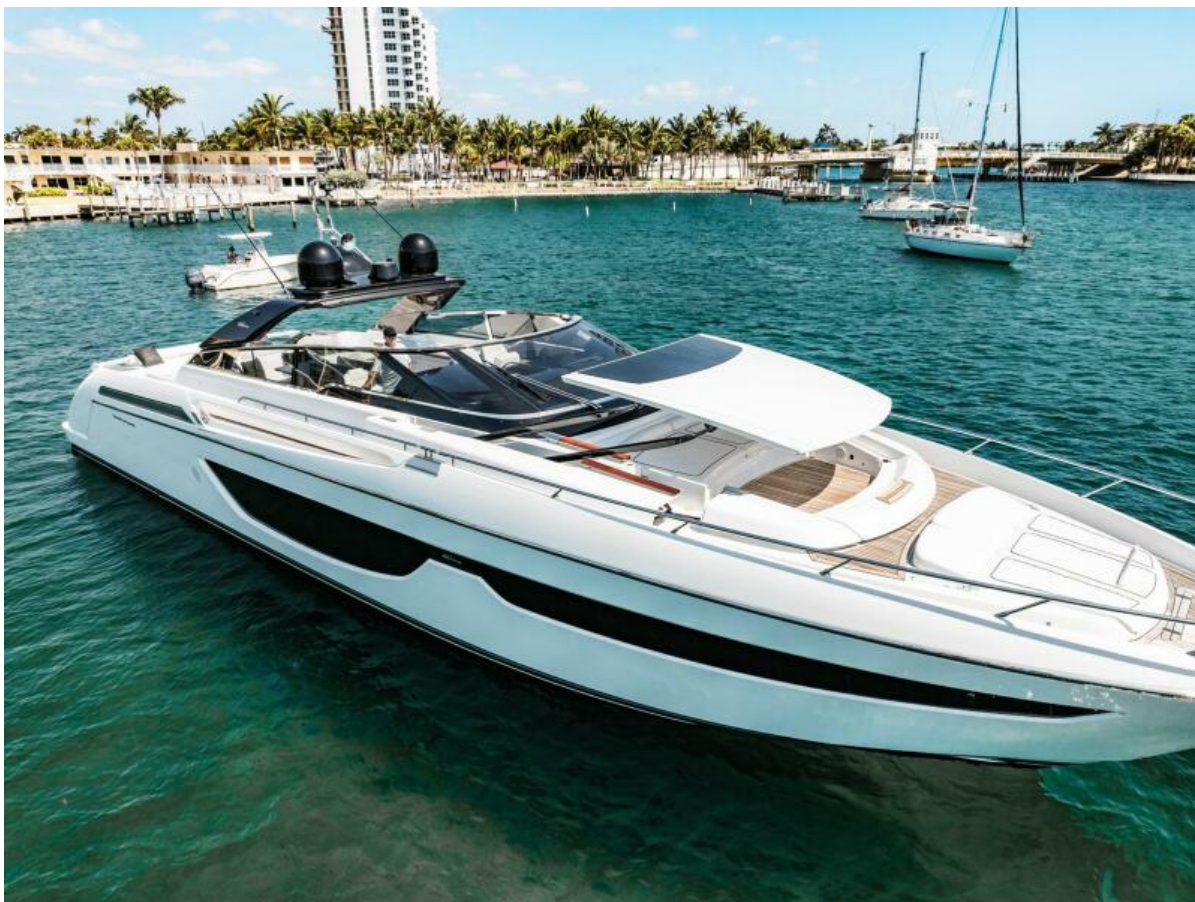
C-Top in Operation