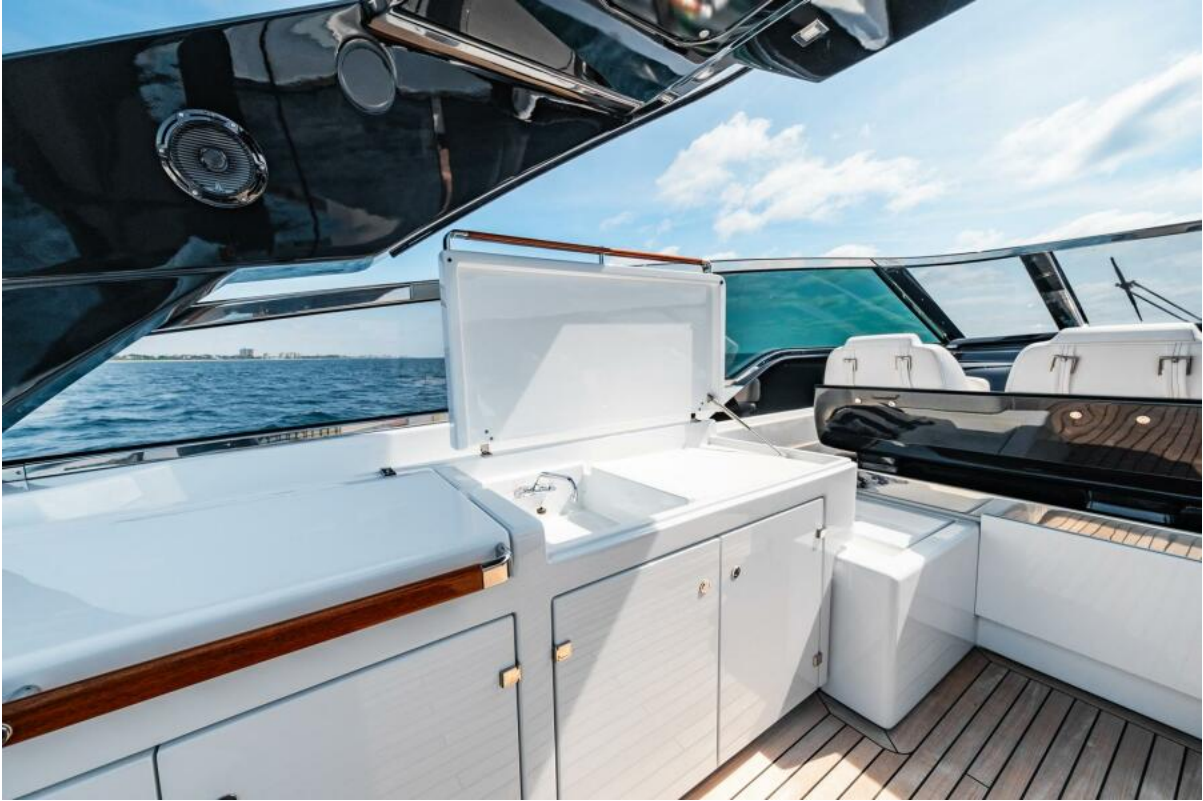
Cockpit Bar Area