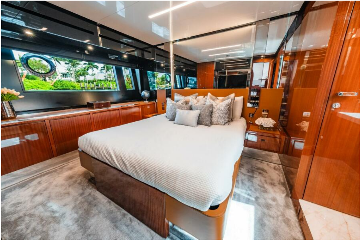
Master Looking Aft to Starboard