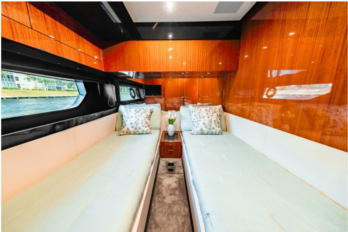
Mid Guest Cabin