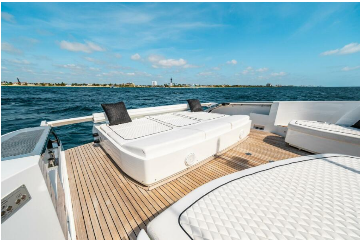
Aft Sun Lounge