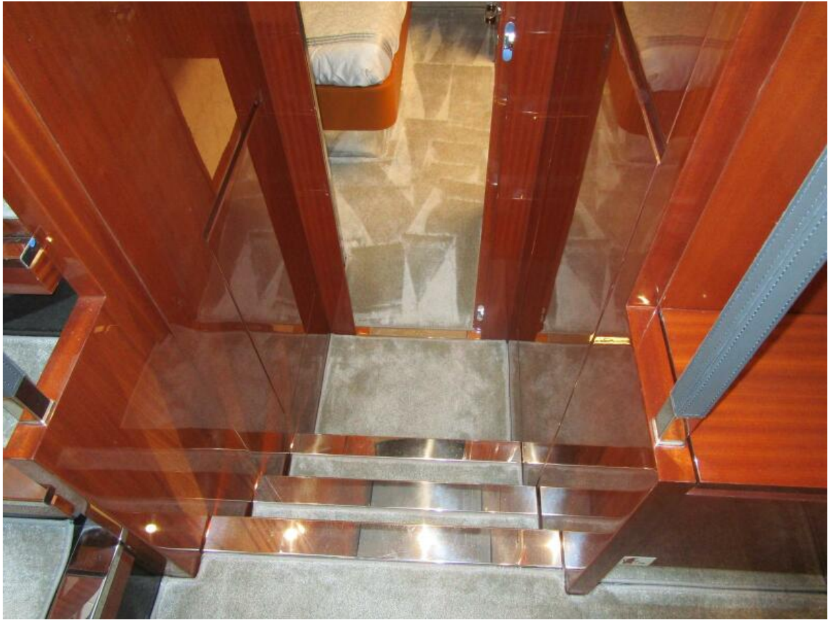
Entrance to Master