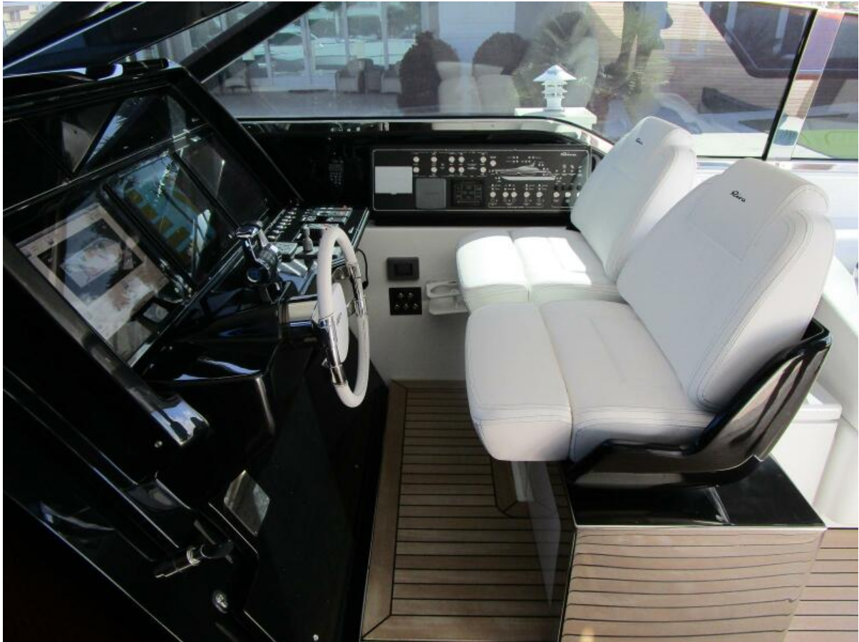
Helm Area to Stbd.