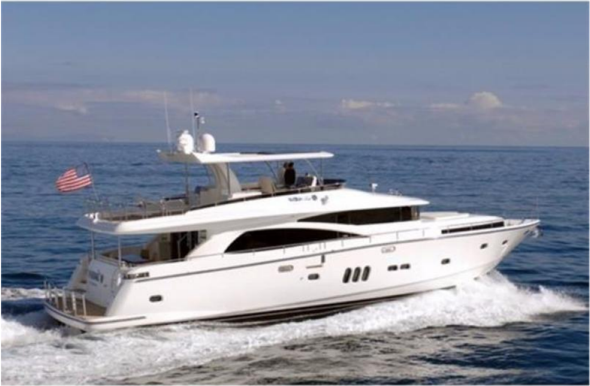
Flybridge w/Hydraulic Platform