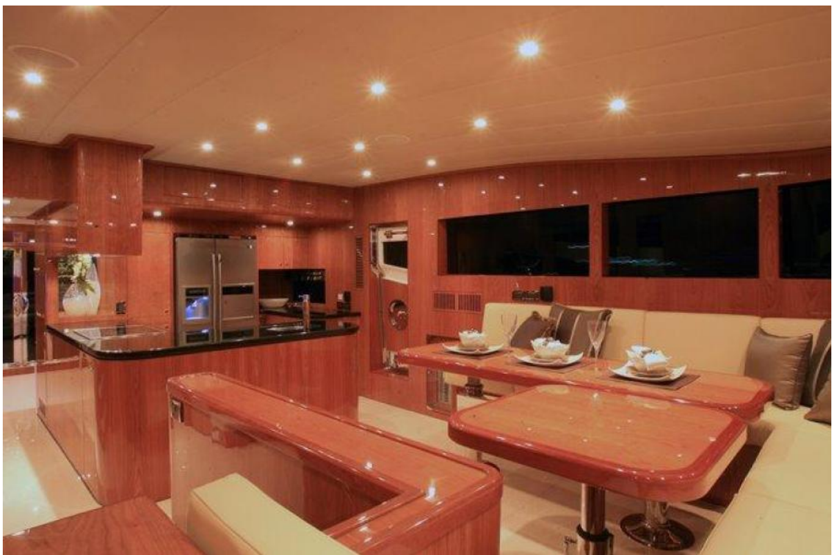
Forward Dining Option