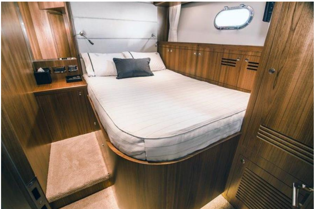
Starboard Midship Cabin