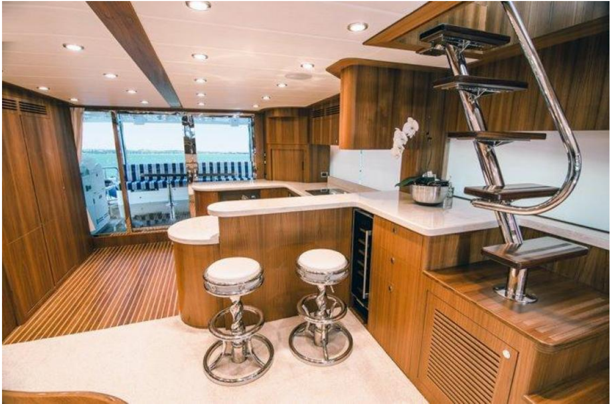
Aft Galley Option