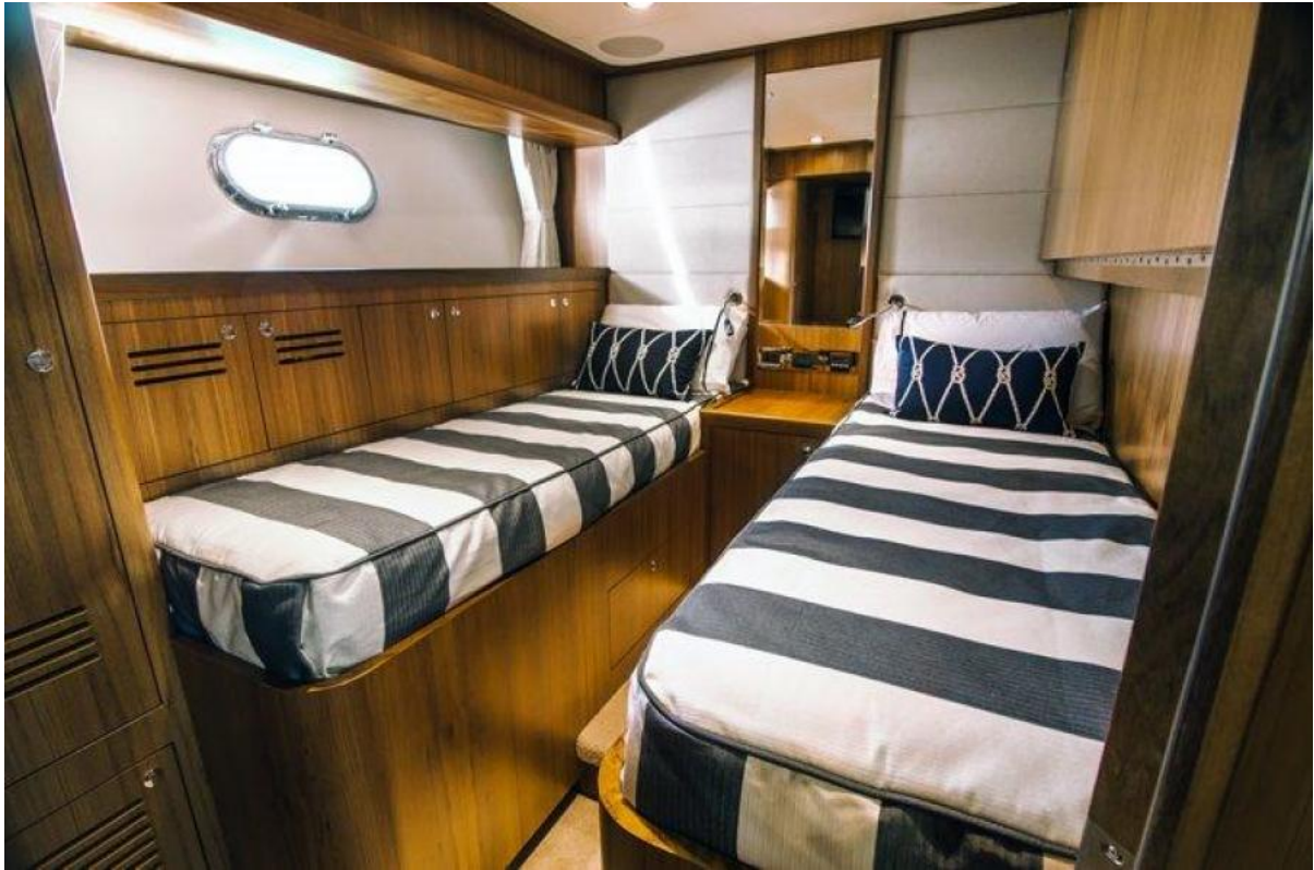
Port Side Midship Cabin