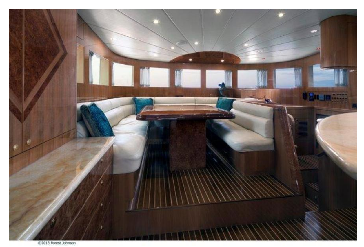
Forward dining area