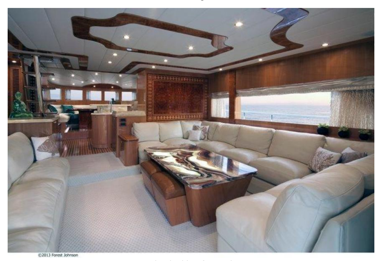
Salon looking forward