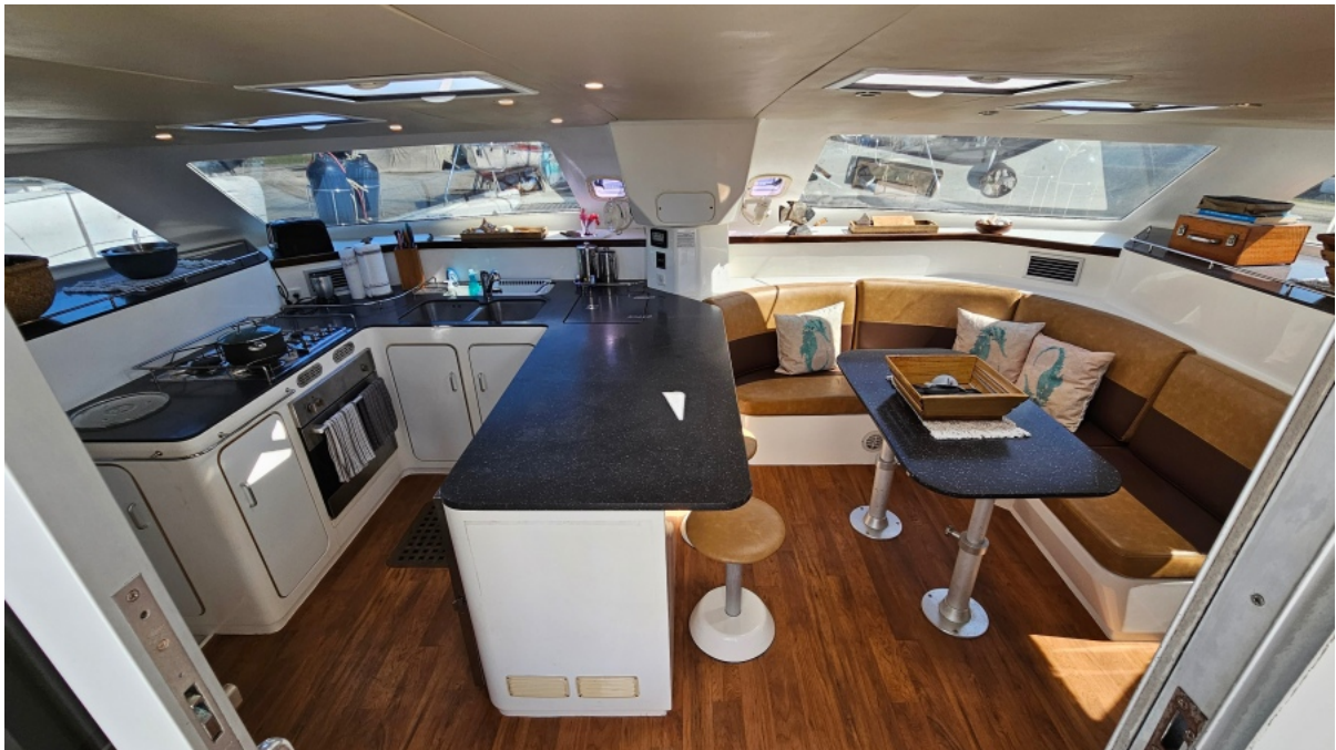
Used Sail Catamaran for sale 2016 VOYAGE YACHTS Voyage 480 - VIENTO AZUL