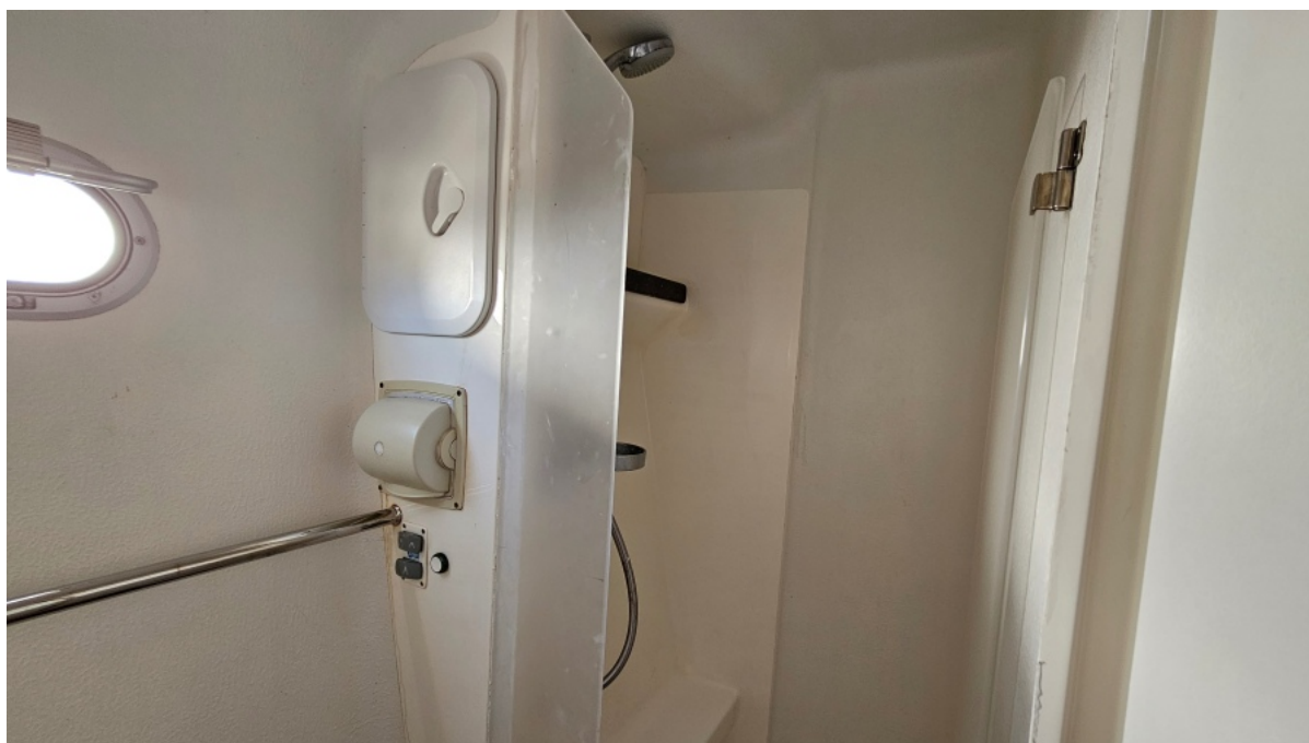
Used Sail Catamaran for sale 2016 VOYAGE YACHTS Voyage 480 - VIENTO AZUL