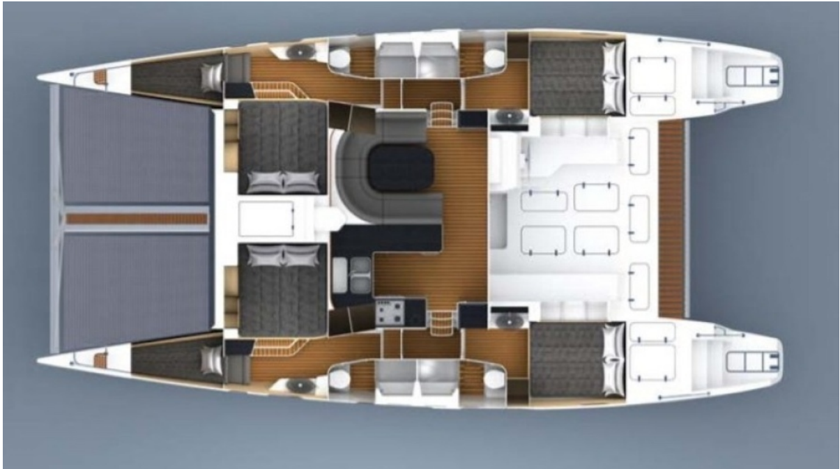
Used Sail Catamaran for sale 2016 VOYAGE YACHTS Voyage 480 - VIENTO AZUL