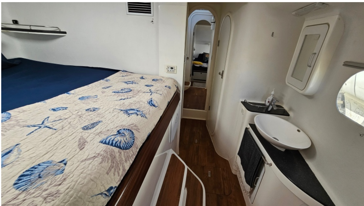
Used Sail Catamaran for sale 2016 VOYAGE YACHTS Voyage 480 - VIENTO AZUL