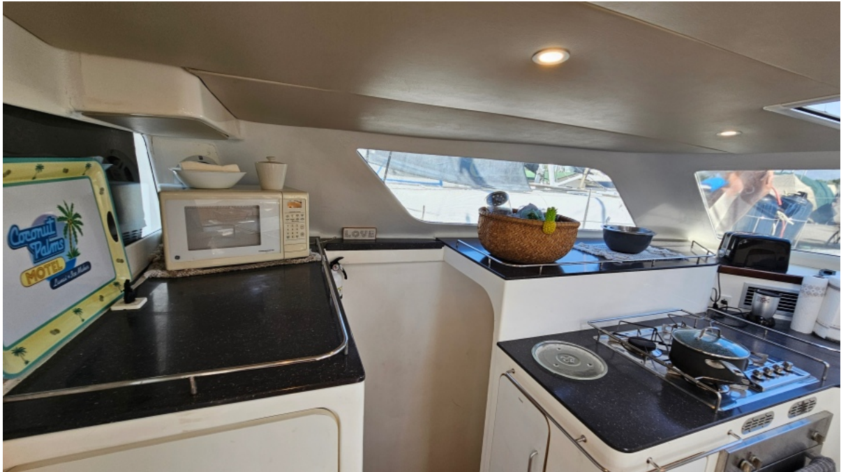
Used Sail Catamaran for sale 2016 VOYAGE YACHTS Voyage 480 - VIENTO AZUL