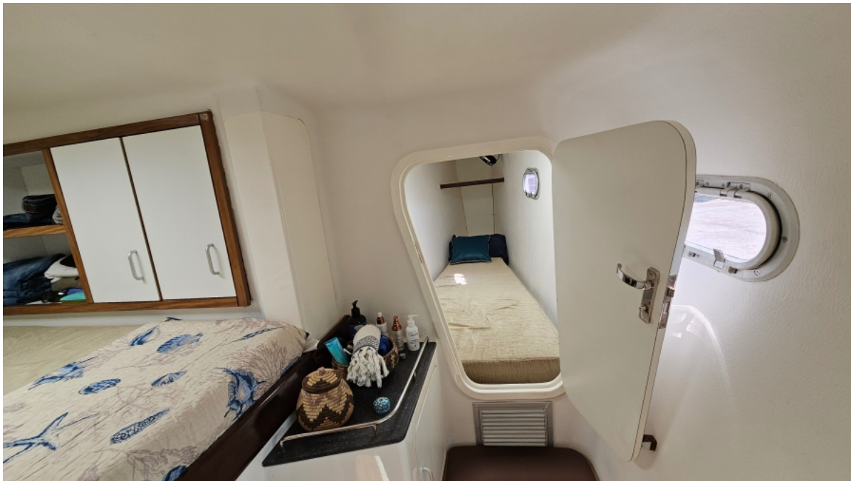
Used Sail Catamaran for sale 2016 VOYAGE YACHTS Voyage 480 - VIENTO AZUL