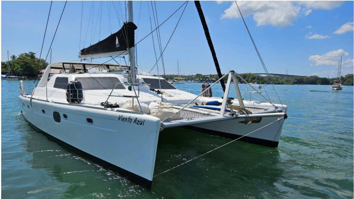
Used Sail Catamaran for sale 2016 VOYAGE YACHTS Voyage 480 - VIENTO AZUL