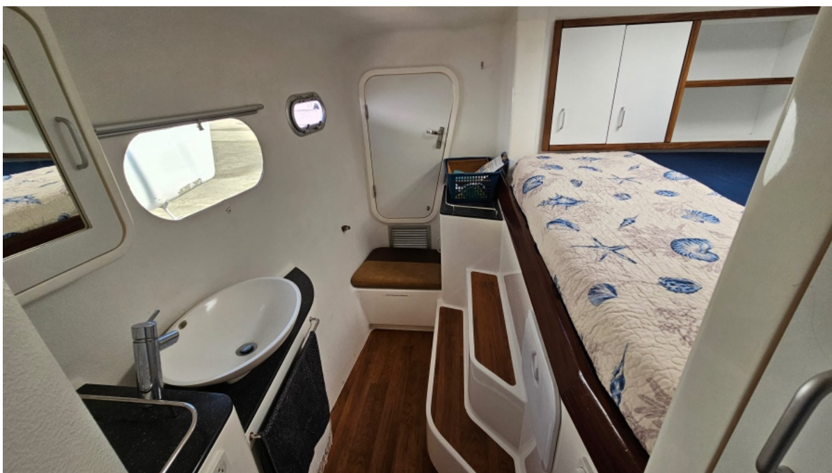
Used Sail Catamaran for sale 2016 VOYAGE YACHTS Voyage 480 - VIENTO AZUL