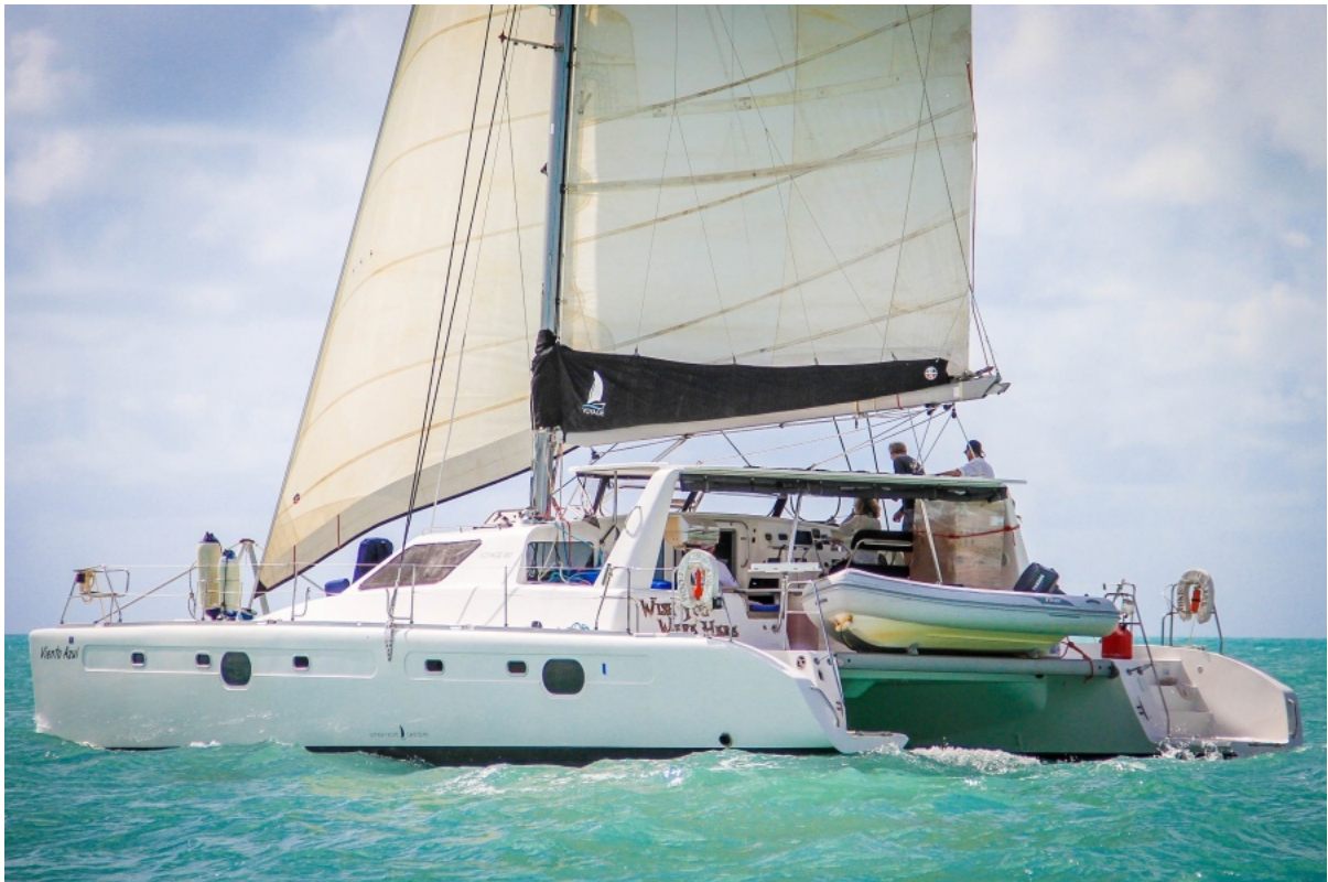
Used Sail Catamaran for sale 2016 VOYAGE YACHTS Voyage 480 - VIENTO AZUL