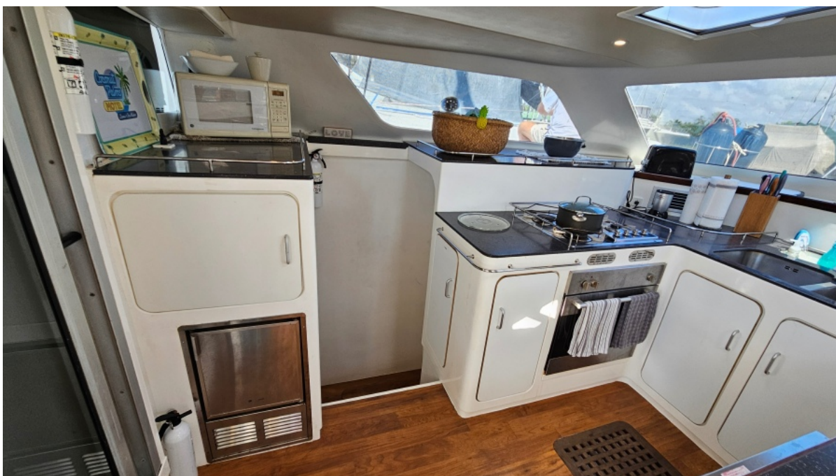
Used Sail Catamaran for sale 2016 VOYAGE YACHTS Voyage 480 - VIENTO AZUL