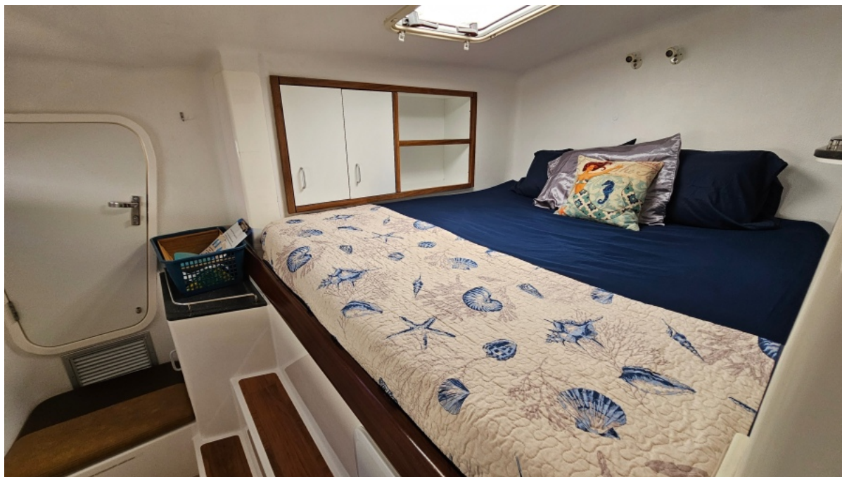
Used Sail Catamaran for sale 2016 VOYAGE YACHTS Voyage 480 - VIENTO AZUL