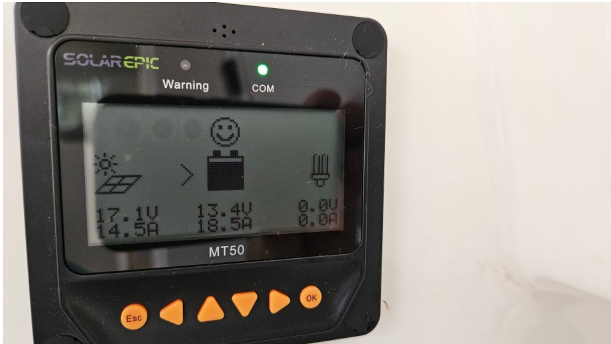
Used Sail Catamaran for sale 2016 VOYAGE YACHTS Voyage 480 - VIENTO AZUL