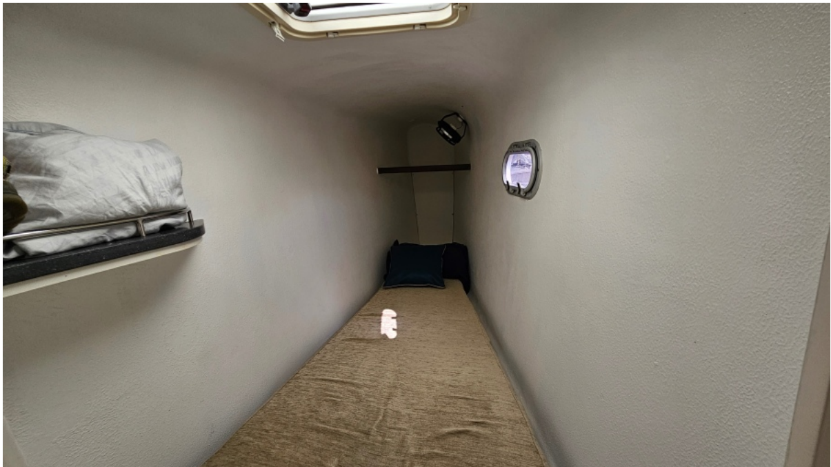
Used Sail Catamaran for sale 2016 VOYAGE YACHTS Voyage 480 - VIENTO AZUL