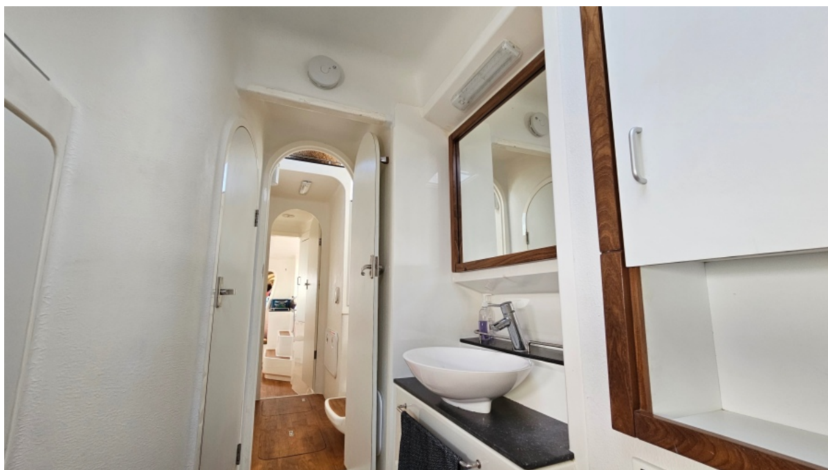
Used Sail Catamaran for sale 2016 VOYAGE YACHTS Voyage 480 - VIENTO AZUL