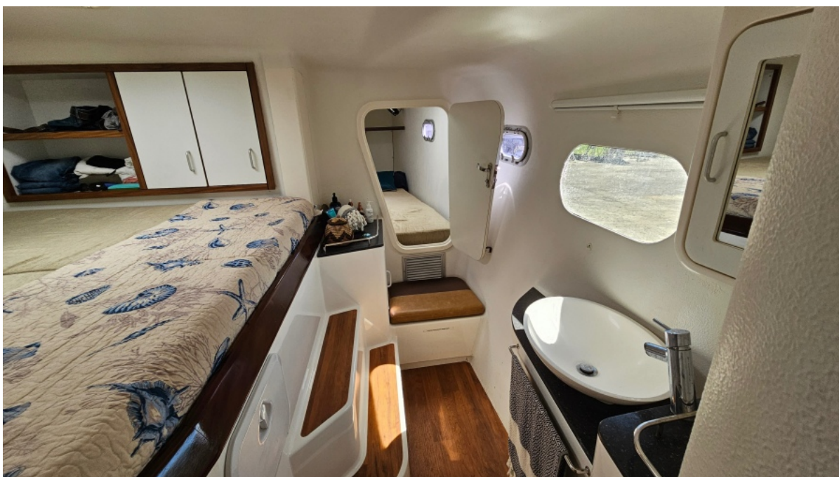
Used Sail Catamaran for sale 2016 VOYAGE YACHTS Voyage 480 - VIENTO AZUL