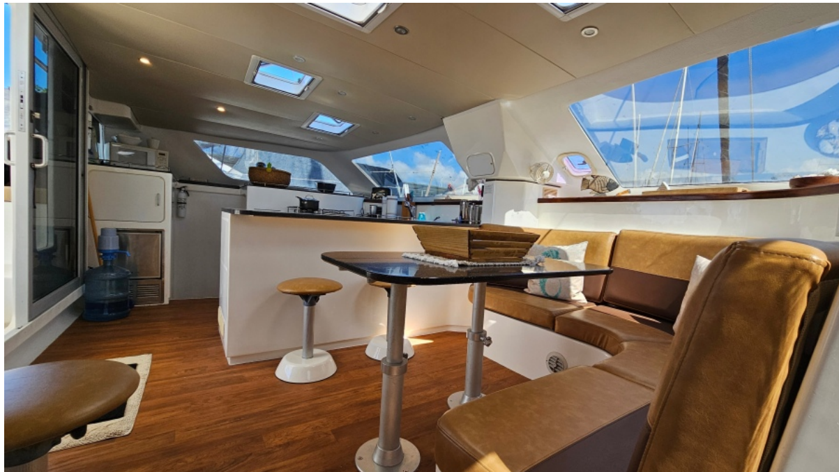
Used Sail Catamaran for sale 2016 VOYAGE YACHTS Voyage 480 - VIENTO AZUL