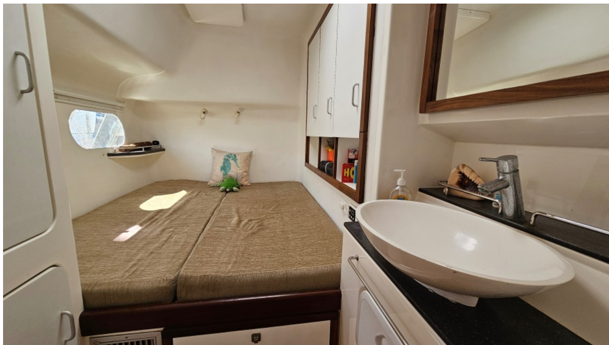
Used Sail Catamaran for sale 2016 VOYAGE YACHTS Voyage 480 - VIENTO AZUL