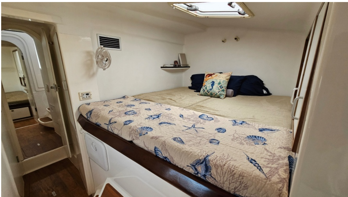
Used Sail Catamaran for sale 2016 VOYAGE YACHTS Voyage 480 - VIENTO AZUL