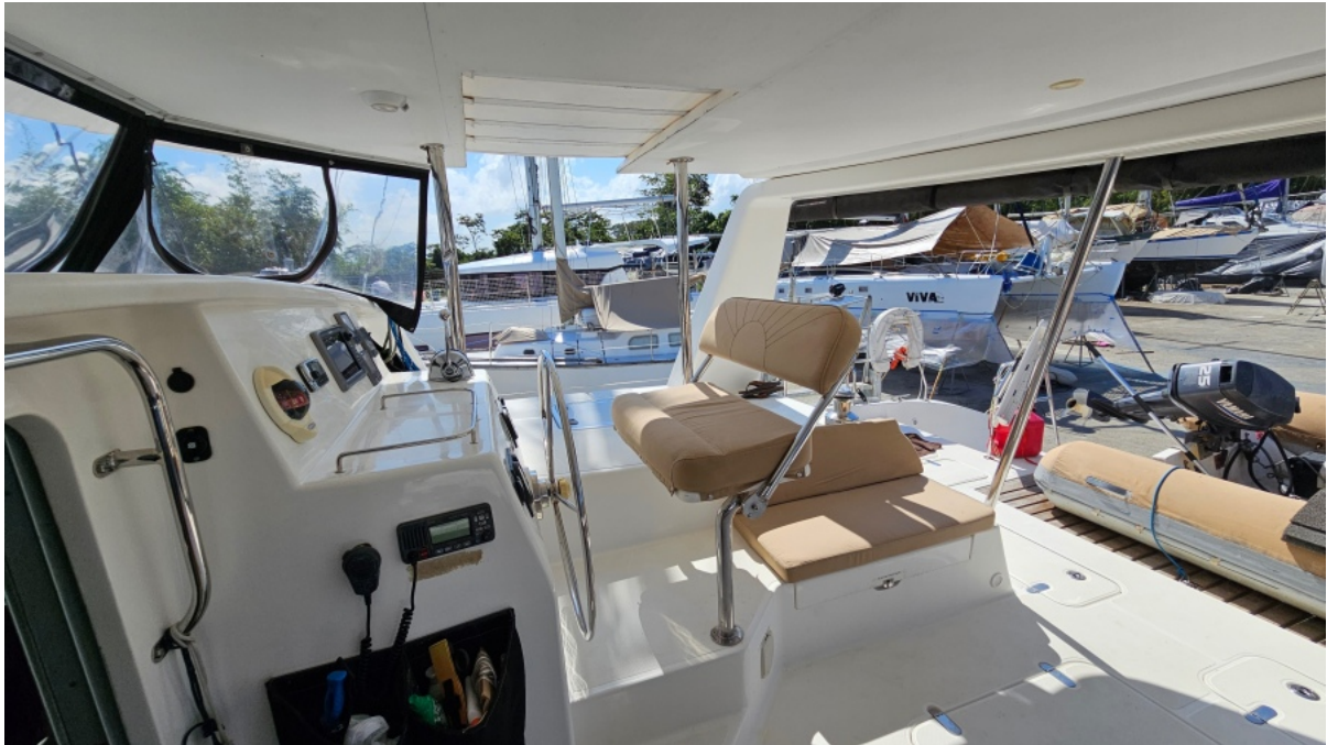
Used Sail Catamaran for sale 2016 VOYAGE YACHTS Voyage 480 - VIENTO AZUL