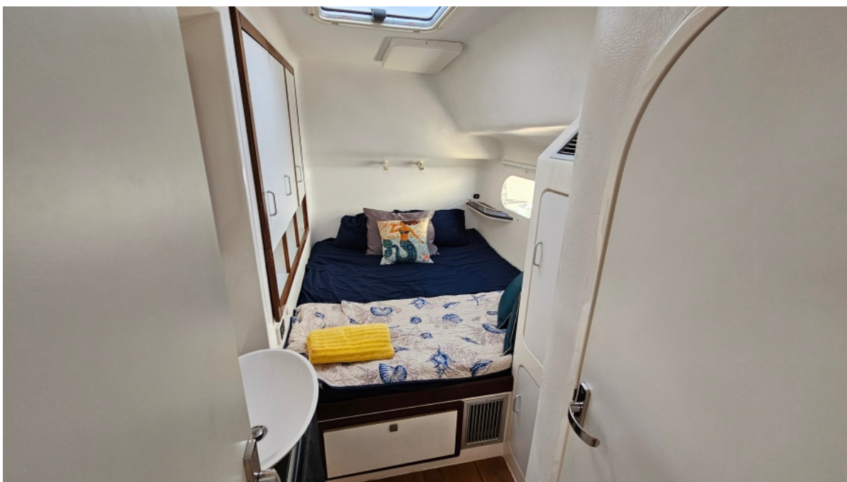
Used Sail Catamaran for sale 2016 VOYAGE YACHTS Voyage 480 - VIENTO AZUL