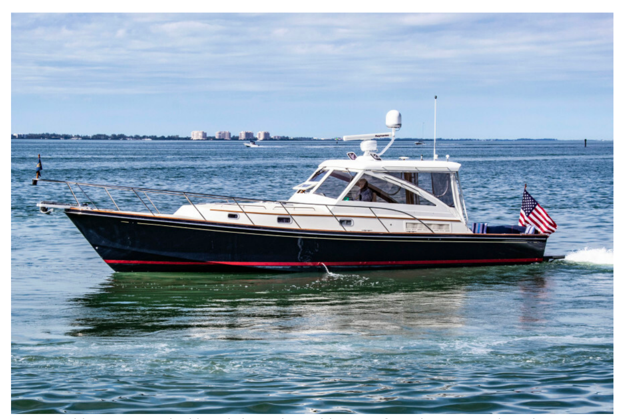
This 2003 40' Hinckley Little Harbor WhisperJet for sale - SYS Yacht Sales