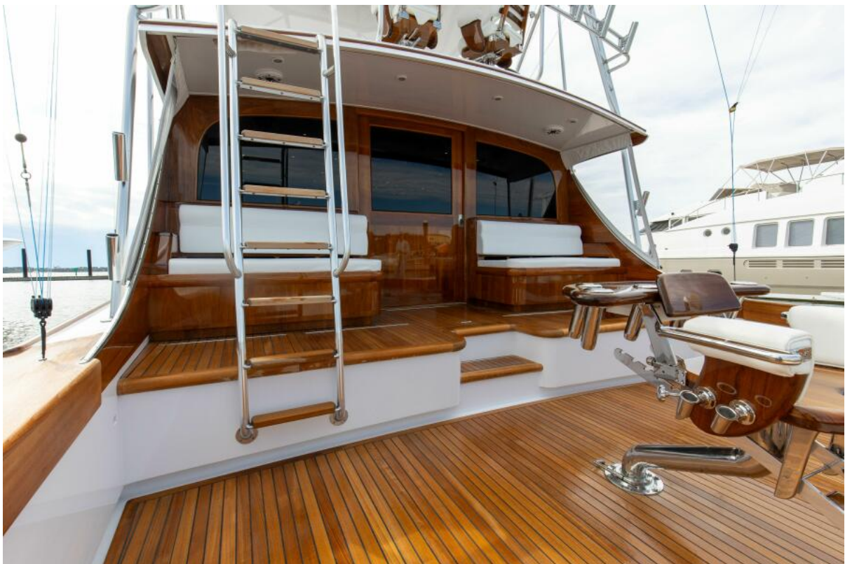
1988 Merritt 62- LAY DAYS- Cockpit