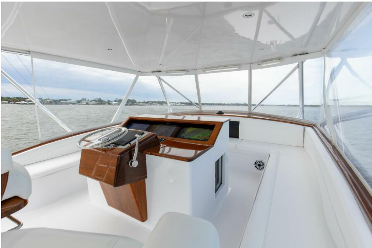
1988 Merritt 62- LAY DAYS- Helm