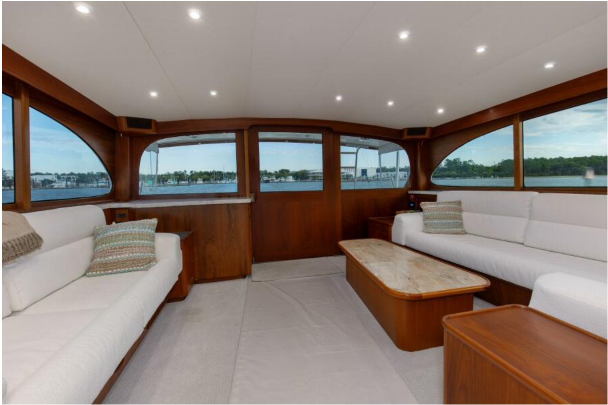
1988 Merritt 62- LAY DAYS- Salon