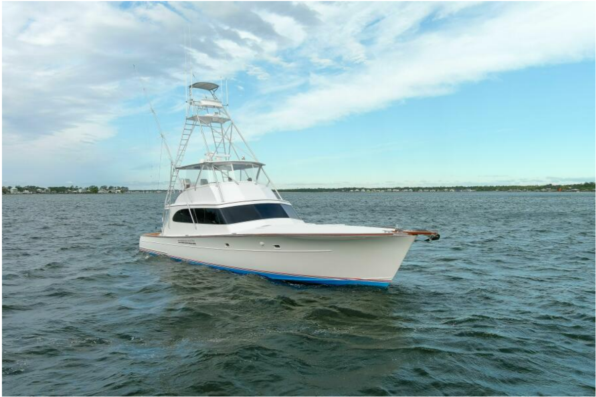
1988 Merritt 62- LAY DAYS- STBD Profile